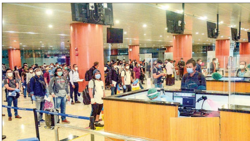
Myanmar returnees queue for immigration service at the Yangon International Airport on 30 October 2020.

THE relief flight of Myanmar National Airway organized by the Myanmar Embassy in Cairo landed at the Yangon International Airport bringing back a total of 140 Myanmar seamen after they were stranded in Egypt due to the suspension of international flights, yesterday morning.