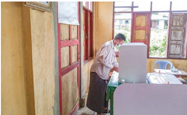
Voters aged 60 years and above cast their advance ballots in Khamaukkyi Township of Kawthoung district in Taninthayi Region beginning from 29 October.