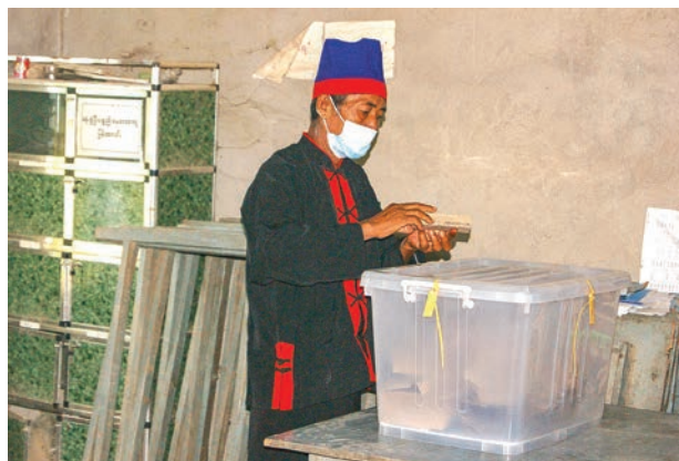
Advance voters in Hopan Township in Wa Self-Administered Division begin casting their ballots on 29 October.