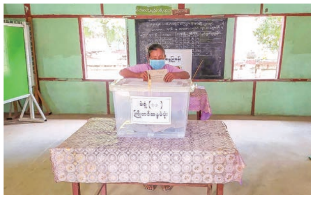
Over 19,000 voters are registered for advance voting of 2020 General Election in Budalin Township, Sagaing Region.