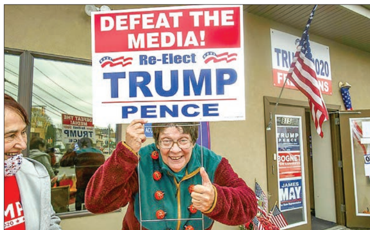
Punters piling on Donald Trump to win the presidential election prefer to glean their information from a social media bubble rather than the mainstream media.