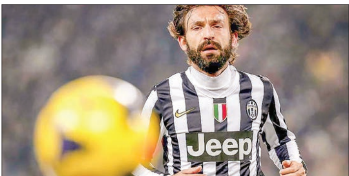
Andrea Pirlo's Juventus have nine points from five games, three of which were awarded after Napoli refused to travel to Turin over coronavirus cases.

MILAN—Andrea Pirlo's Juventus head to promoted Spezia on Sunday hoping to have coronavirus-hit Cristiano Ronaldo back to boost their campaign days after their Champions League flop against Barcelona. But rivals Inter Milan will be without star striker Romelu Lukaku against Parma after the Belgian picked up a thigh strain which also puts him at risk for next week's Champions League game at Real Madrid.