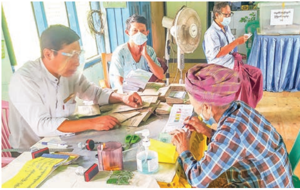
Advance voting for 2020 General Election begins in Kangyidaunt Township in Ayeyawady Region on 29 October.