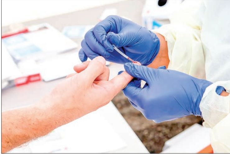
A health worker takes a drop of blood for the COVID-19 antibody test after at the Diagnostic and Wellness Centre on May 5, 2020, in Torrance, California.

"Today's analysis, involving more than 500 additional patients, prospectively confirms that REGN-COV2 can indeed significantly reduce viral load and further shows that these