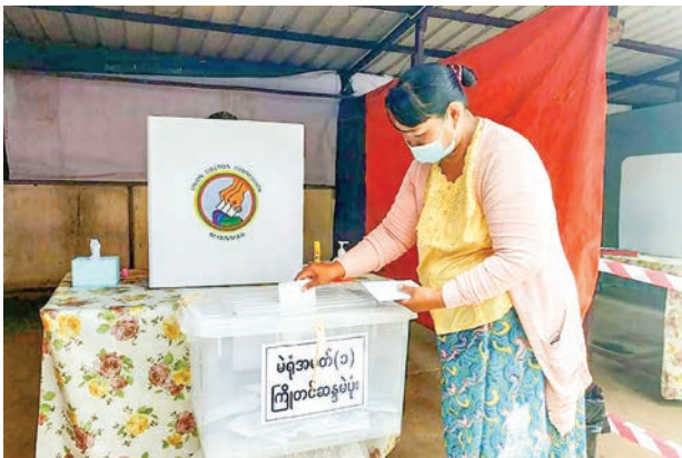
Polling stations in Taunggyi Township start to run from 29 October for advance voters of elderly persons and electoral officials.