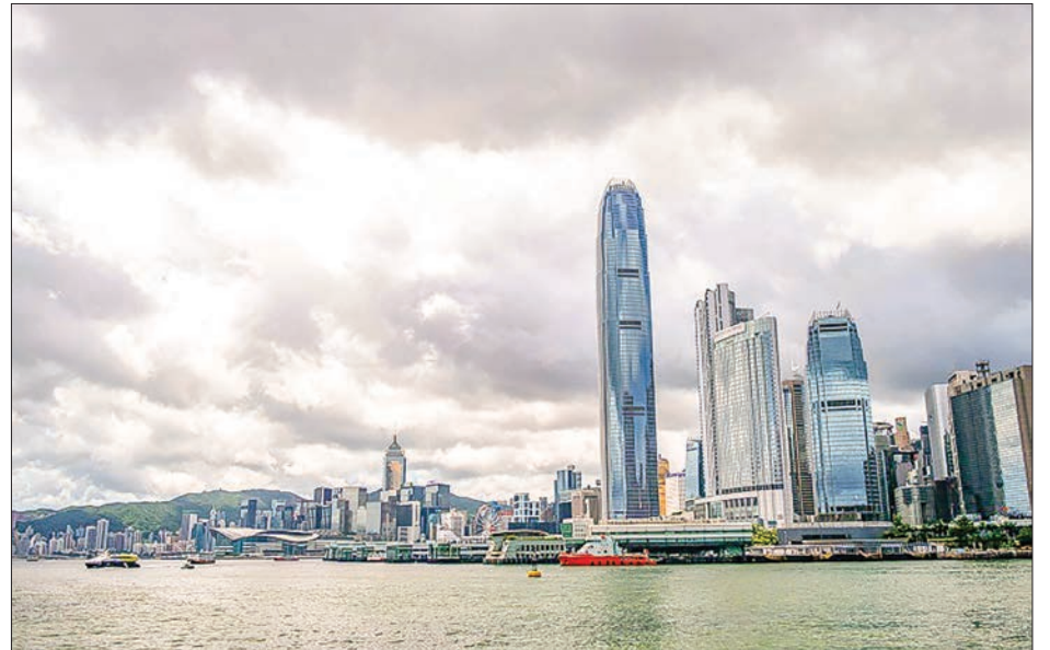
The United States no longer deems Hong Kong sufficiently autonomous from China to grant it special trading status.

The decision, which came as China imposed a sweeping new security law on the business centre, reflected Washington's belief that Hong Kong is now "just another Chinese city" and does not deserve special trade privileges.