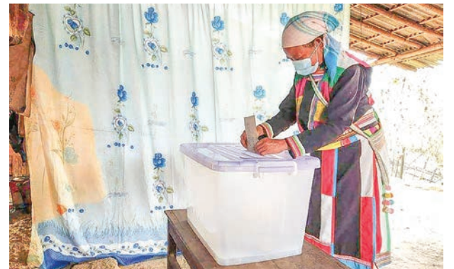
An elderly person casts advance vote in Hsadone Township in Kachin State starting from 29 October.