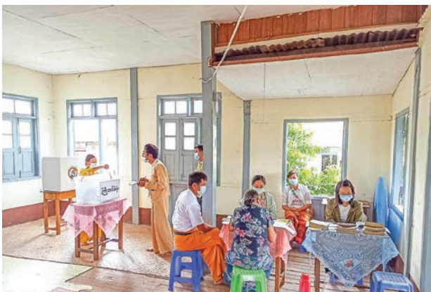
Voters aged 60 years and above in Langkho Township begin their advance voting on 29 October.