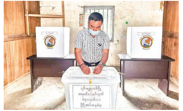
Early voting in Chinshwehaw Township, Shan State, for 8 November General Election.