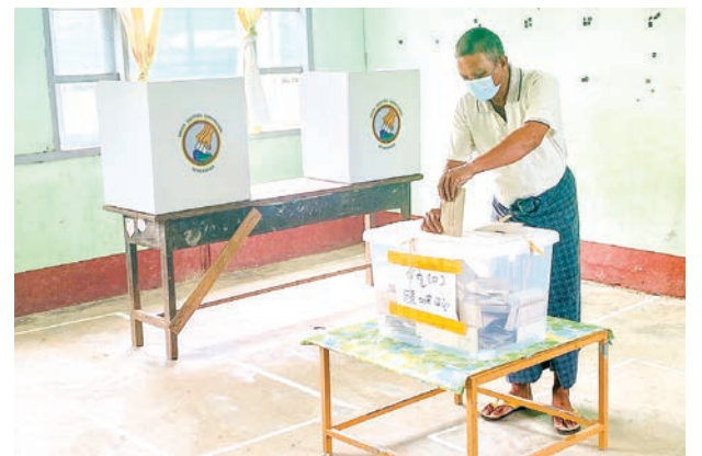
Advance voting started in Yedashe Township, Bago Region, on 29 October.