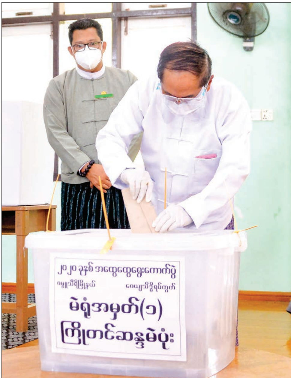
Vice President U Myint Swe casts advance votes in Nay Pyi Taw on 30 October 2020.