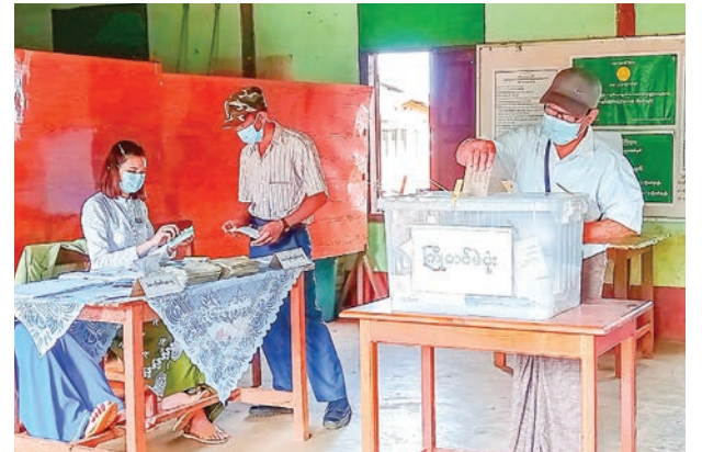
Early voting begins in Mongnai Township in Shan State on 29 October.