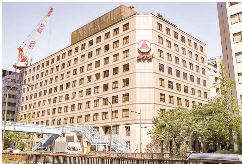
Takeda Pharmaceutical Co.'s headquarters in Tokyo.

TAKEDA Pharmaceutical Co. said Thursday it plans to supply 50 million doses of a coronavirus vaccine, developed by U.S. drug-maker Moderna Inc., in