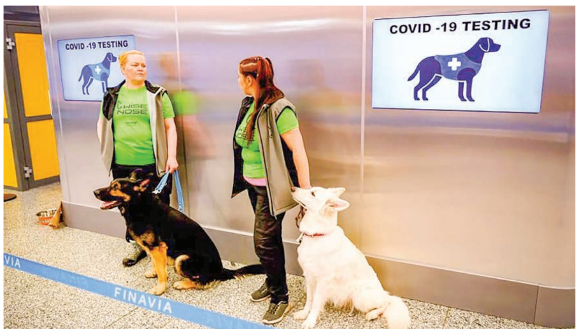
The coronavirus sniffer dogs Valo (L) and E.T. sit near their trainers at the Helsinki airport in Vantaa, Finland, to detect the COVID-19 from the arriving passengers, on September 22, 2020.