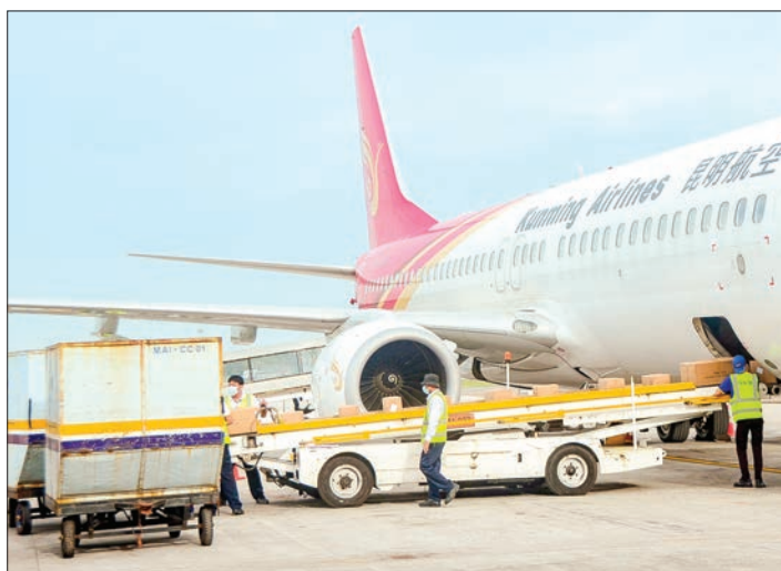
Workers unload COVID-19 protective gears imported from China at the Yangon International Airport on 30 October.

The KN95 masks, protective face masks and PPE medical protective clothing will be distributed to voters, polling station staff and volunteers, in order to prevent the spread of COVID-19 disease, in the Multiparty General Election on November 2020. —MNA (Translated by Ei Phyu Phyu Aung)