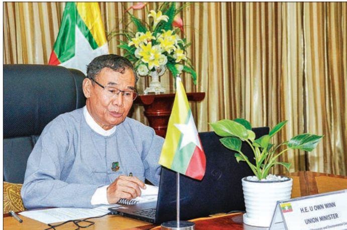
Union Minister U Ohn Win participates in the virtual meeting on Maintaining a Low Carbon Development Path towards the 2030 Agenda in the era of COVID-19 on 29 October 2020.

Then, Union Minister U Ohn Win discussed strict frameworks