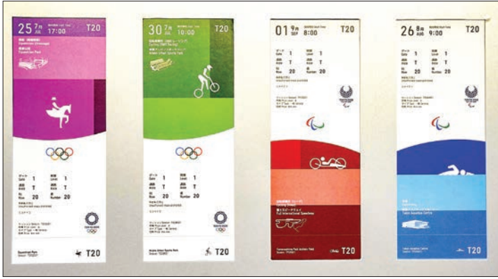
Photo taken in Tokyo on Jan. 15, 2020, shows the ticket designs for the 2020 Tokyo Olympics (2 on L) and Paralympics unveiled the same day.