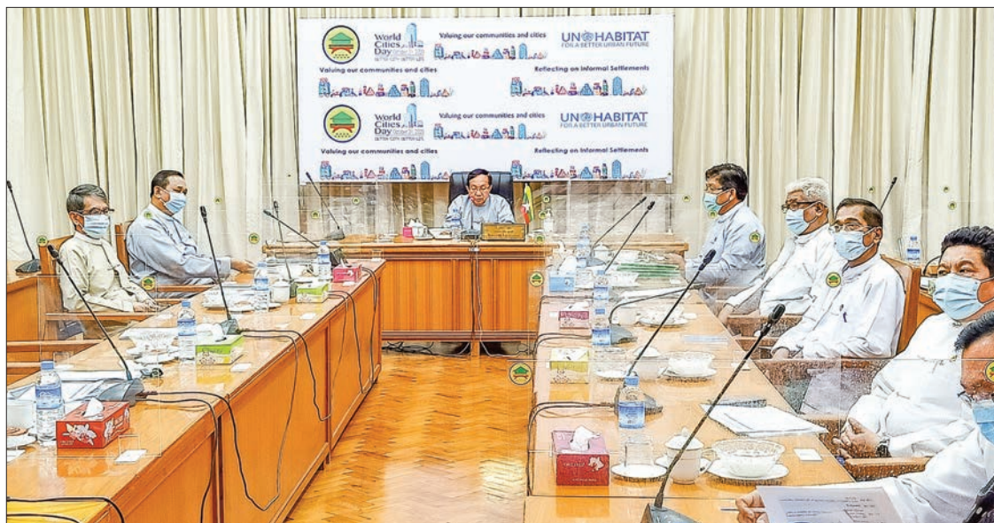
Union Minister U Han Zaw participates in the virtual event welcoming World Cities Day 2020 on 30 October 2020.

He also discussed the concerted efforts to be made by cooperating with the civil society organizations and international organizations for the establishment of cities and villages while Myanmar people are struggling to fight the COVID-19 pandemic and the importance of cities for the development of urban areas as well as for democracy system, innovation, economy and culture.