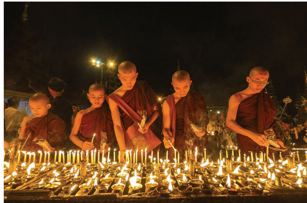
Monks and novices light candles on the night of the Thadingyut Full Moon at the Shwedagon Pagoda on 13 October, 2019.

Thadingyut Light Festival is also known as Tavimsa Pwe or Semi Myint Mo Pwe. Lord Buddha who went up to Tavatimsa the kingdom of devas on the summit