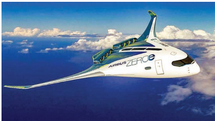
This computer-generated image released by the European multinational aeronautics company Airbus shows a prototype of zero-emission hydrogen-powered aircraft.

EUROPEAN aircraft maker Airbus said Thursday that one-off charges related to the deep job cuts announced earlier this year pushed it deep into the red in the third quarter.