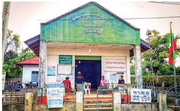
Election commission officials help early voting of elderly persons and eligible voters in their advance voting in Mongyawng in Shan State.