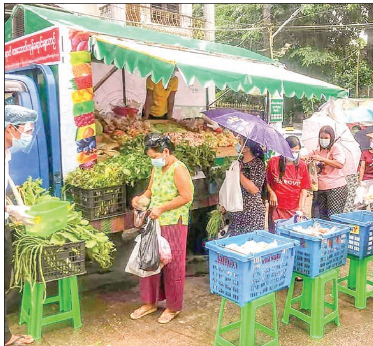
Women wearing face masks buy vegetables and fruits at a mobile market in Yangon on 30 October 2020.

"MFVP is also arranging for those who contact them to