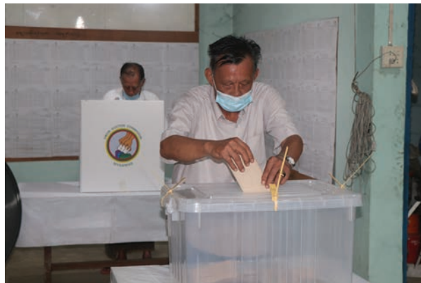
Polling booths begin running in Mongphyat Township in Shan State on 29 October.