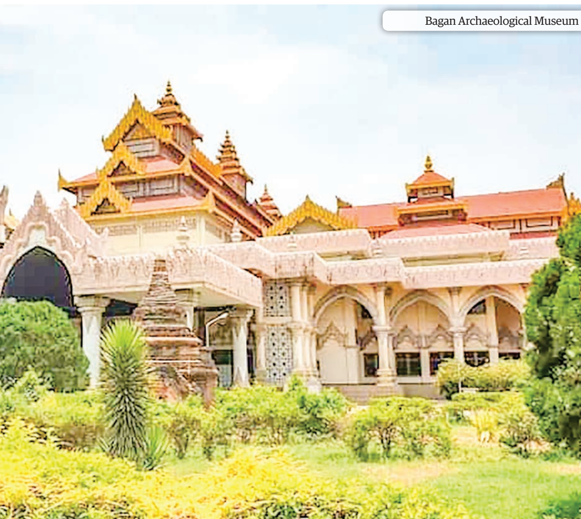
Bagan Archaeological Museum

attack Bagan. But, the king forecast they would surely attack Bagan at a time. So, King Narathihapatae decided to negotiate with Mongol King and sent Counsellor Ananta Pisi and Maha Po to Tagaung in November and December 1285. They sent a diplomatic letter to Mongol for suspending sending of Mongol troops to lower part of Myanmar from Tagaung before negotiating them.