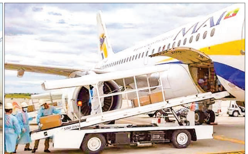
Workers unload COVID-19 protective gears imported from China at the Mandalay International Airport on 30 October.