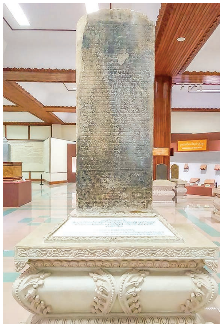
Shin Dispramuk Stone Inscriptions