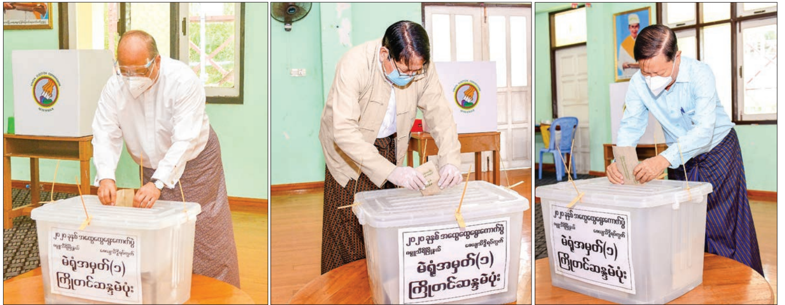
(From left to right) Union ministers U Thaug Tun, Dr Pe Myint and Thura U Aung Ko cast their advance votes in Nay Pyi Taw on 30 October 2020.