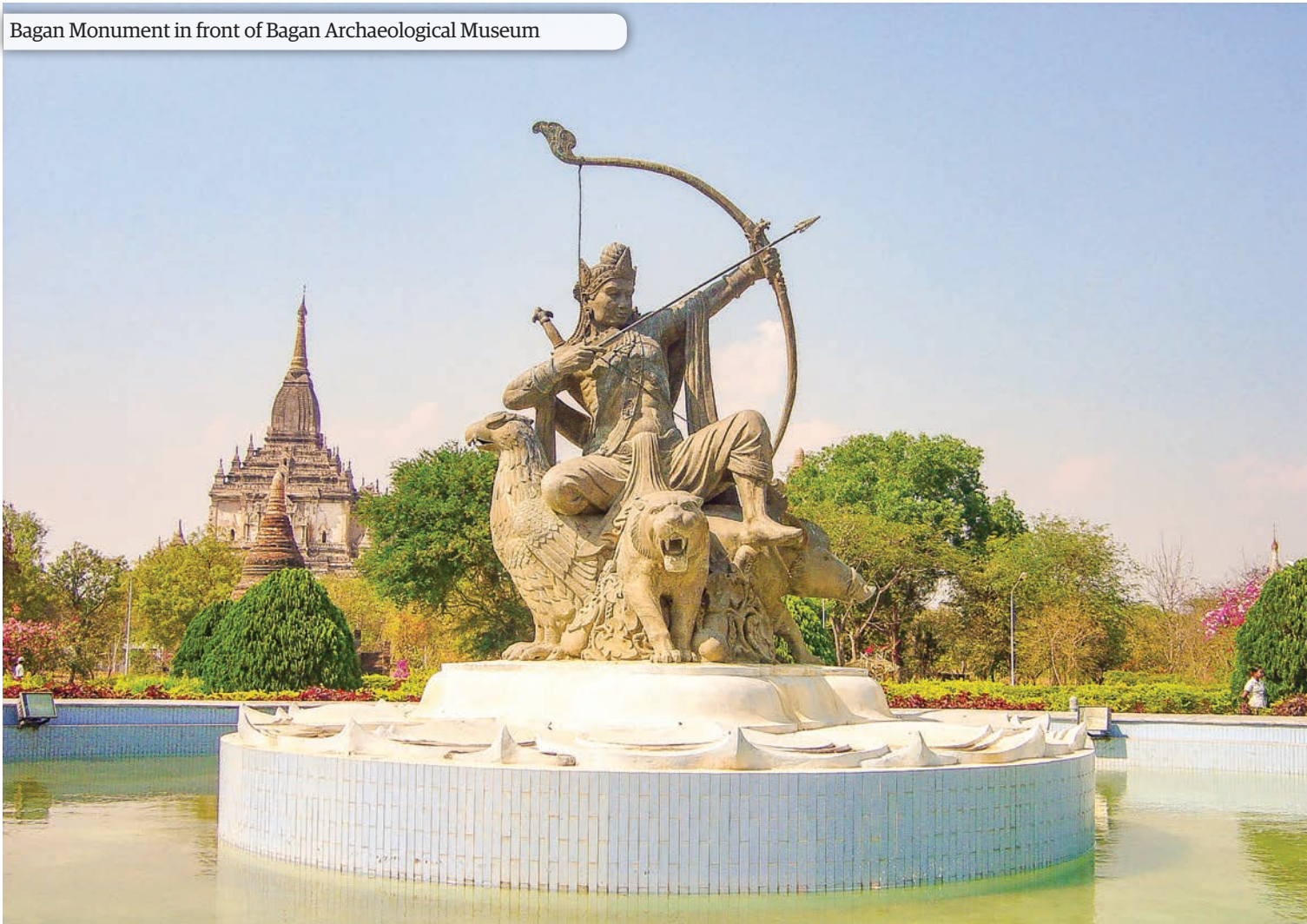
Bagan Monument in front of Bagan Archaeological Museum