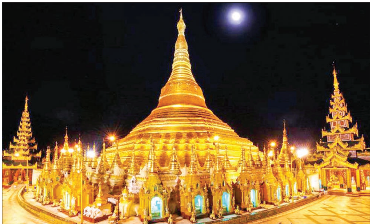
Colour light seen on Shwedagon Pagoda on the eve of the Full Moon Day of Thadingyut.