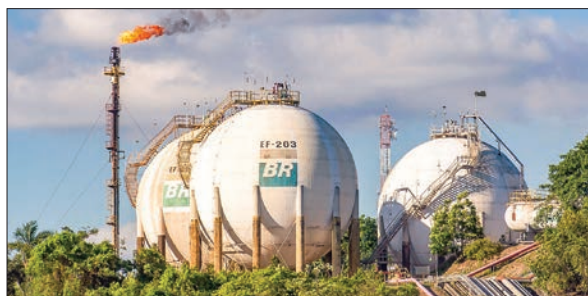
Gas tanks of Brazilian state-owned oil giant Petrobras are seen along the Negro river in Manaus, state of Amazonas, Brazil, on November 23, 2013.

According to the Rio de Janeiro-based company, it sold more oil and oil by-products in the third quarter amid higher market prices, and its loss in the period was due to financial expenses. The company also said that the domestic demand for oil derivatives recovered in the third quarter of this year, and its sales of the products grew by 18 per cent compared with the previous quarter. SOURCE: Kyodo