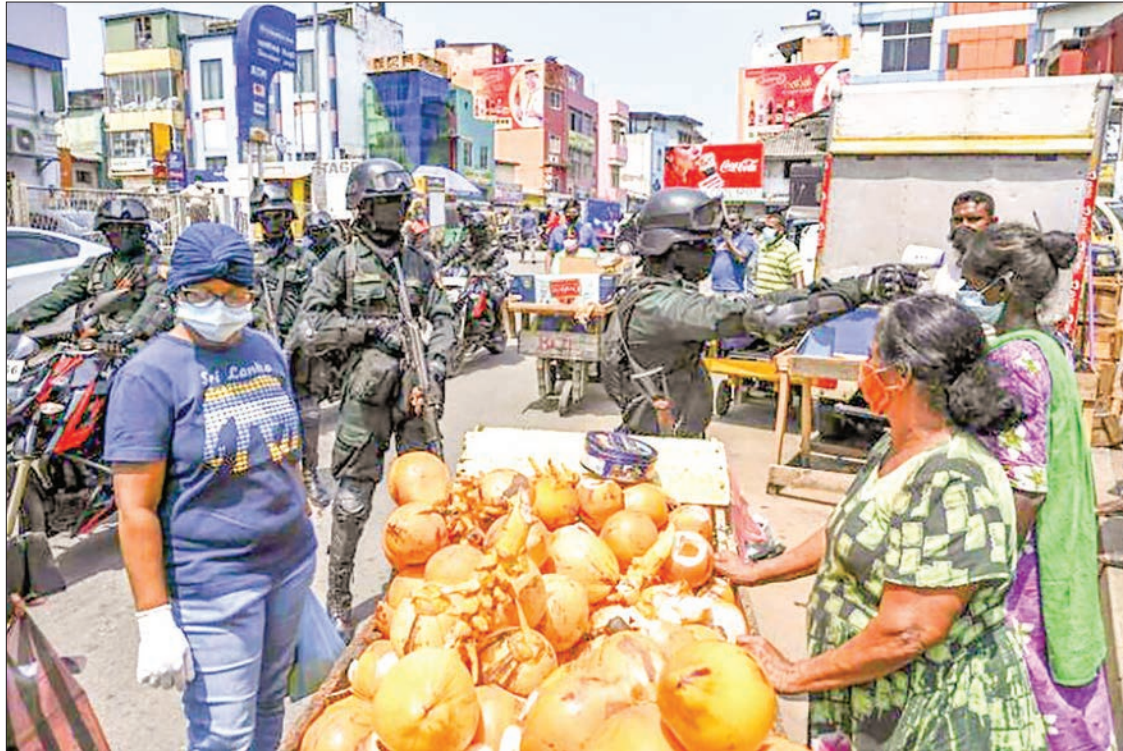
The lockdown for three days could be extended depending on the pace of infections.

"The curfew comes into effect from midnight, but we are trying to discourage any non-essential travel across