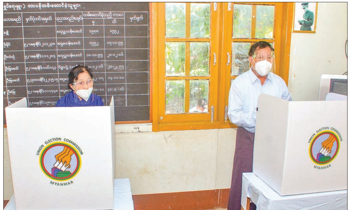
Chief Justice of the Union U Tun Tun Oo and wife Daw Aye Aye Thein cast advance votes in Nay Pyi Taw on 29 October 2020.