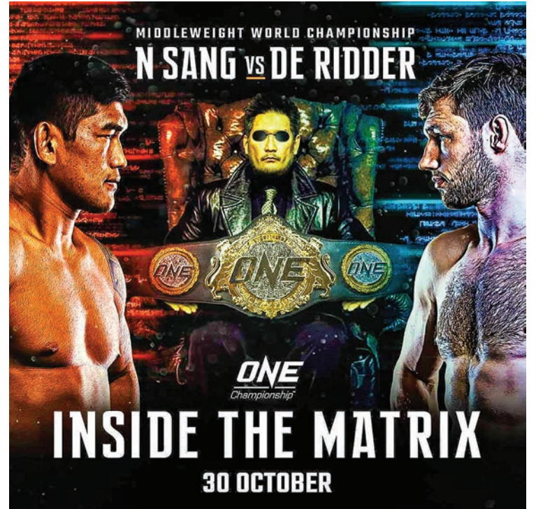
Aung La N Sang (left) is ready to defend his ONE Championship middleweight title against De Ridder (right) in the ONE: Inside The Matrix event in Singapore on 30 October.