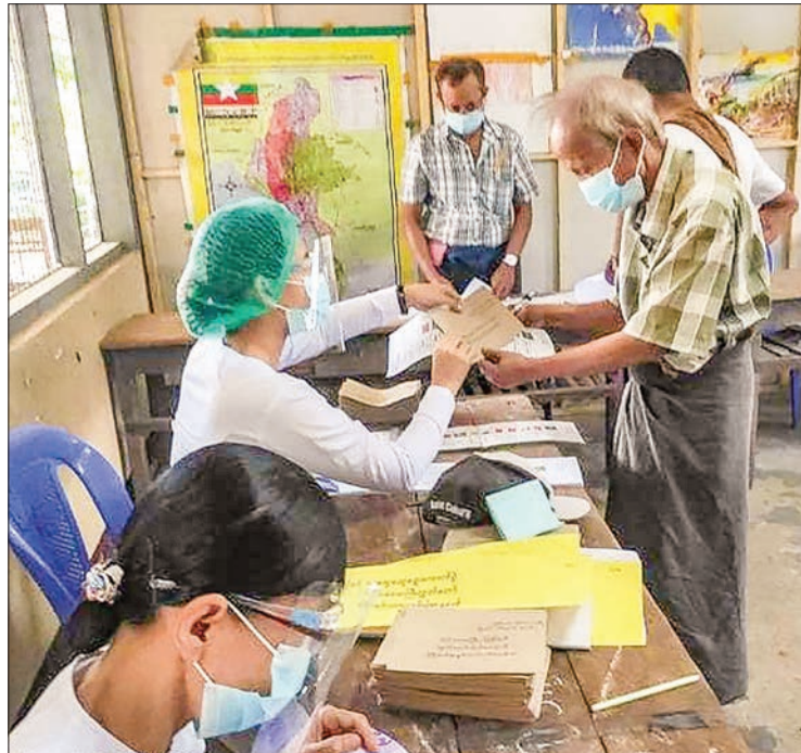
Elderly persons in Thanlyin Township cast advance ballots for 2020 General Election on 29 October 2020.

toung Yeikmon Housing of Dagon Myothit Seikan Township, Yangon Region, said, "I cast ballots at the designated polling station this evening. I took my voting number and ID card when I went to the polling station. The voting process is transparent. Face masks and gloves were worn to prevent from COVID-19."