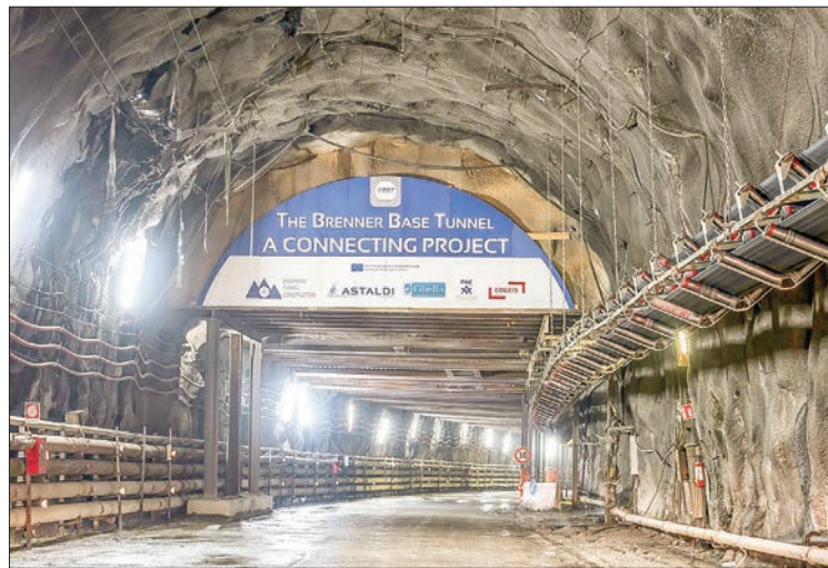
In May, Austria’s public auditor said it expected work to take until 2030 due to disputes between the companies involved.