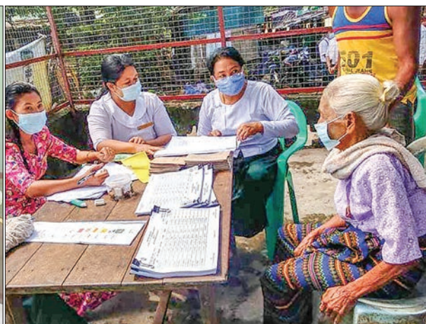
An elderly woman casts advance vote in Pynmana on 29 October 2020.