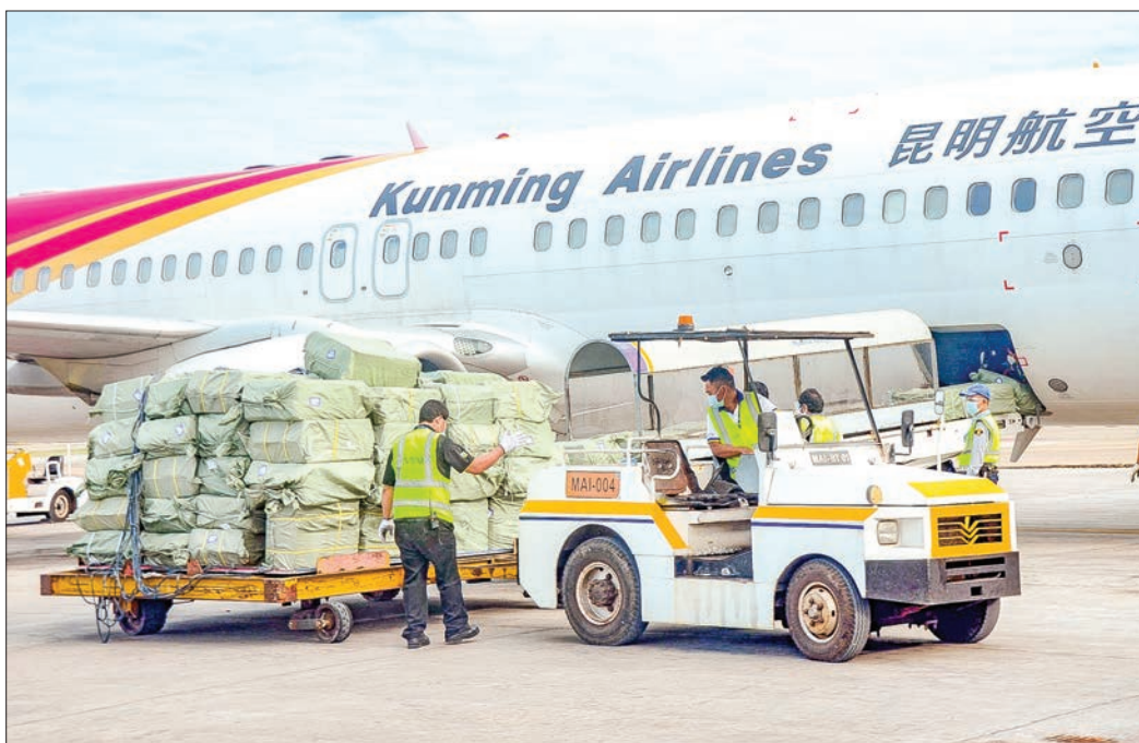
COVID-19 medical devices imported from China arrive at the Yangon International Airport on 29 October 2020.