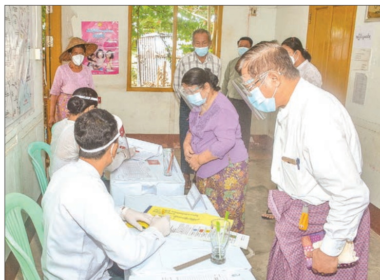
Elderly persons cast advance votes in Ottarathiri on 29 October 2020.

Pobbathiri, Dekkhinathiri, Ottarathiri, Zeyathiri, Tatkon, Pynmana and Lewe.