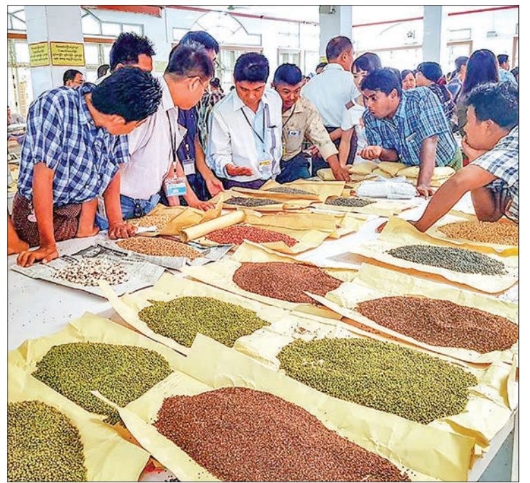
Merchants evaluating the quality of beans and pulses.