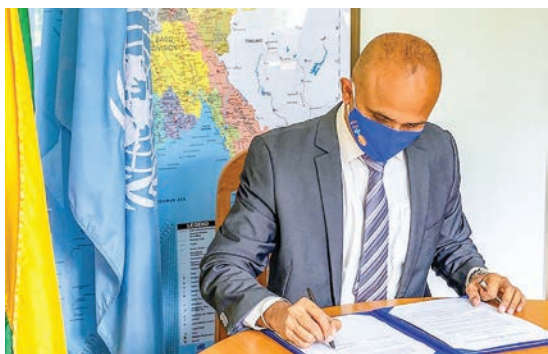
UNFPA Representative for Myanmar Mr Ramanathan Balakrishnan.

Italy provided Euro800,000 Euro to Women and Girls First Programme Phase I during 2016-2019. The Women and Girls First Programme is supported by Australia, the EU, Finland, Germany, Italy and Sweden. —GNLM