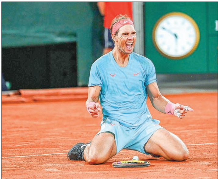
Paris return? Rafael Nadal celebrates winning the French Open at Roland Garros earlier this month.