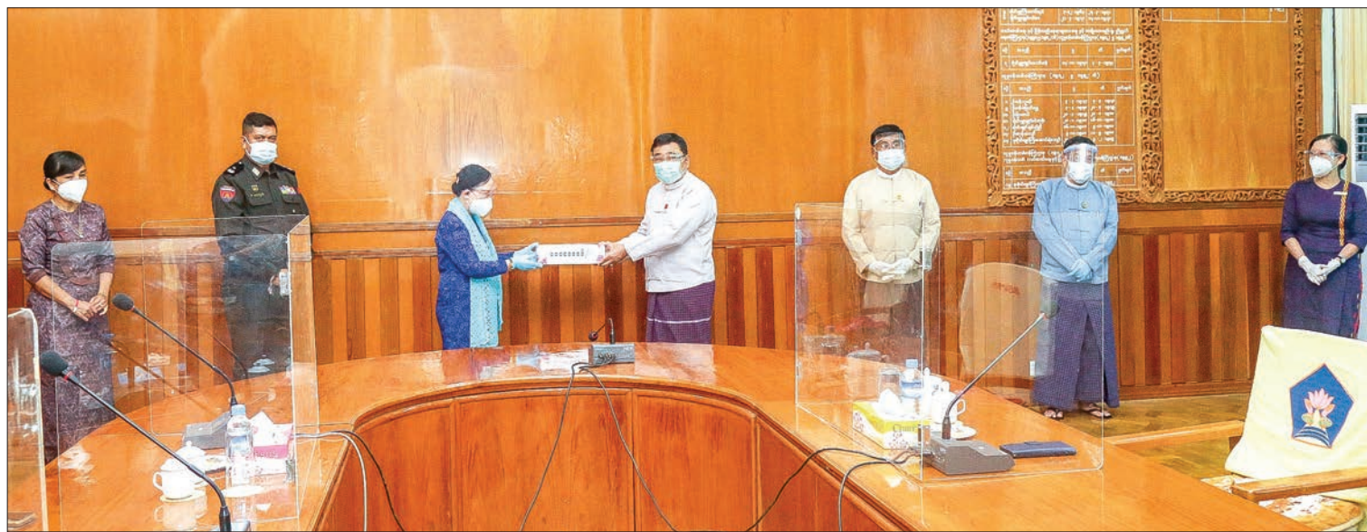
Union Minister Dr Win Myat Aye accepts the cash donated by Ministry of Labour, Immigration and Population in Nay Pyi Taw on 29 October 2020.

Union Minister Dr Win Myat Aye expressed thanks for the donation that will be used for early childhood care and development services of the Social Welfare Department including protections for single