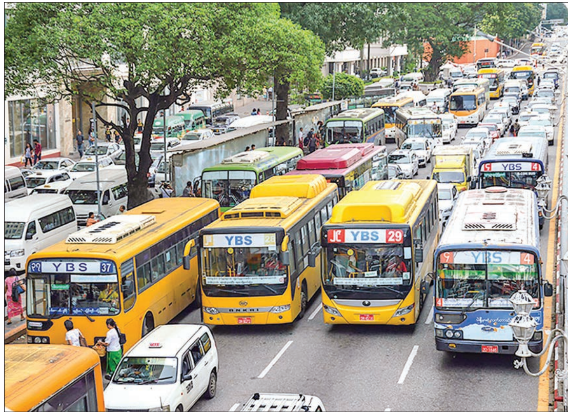
YBS buses in downtown Yangon before the outbreak of COVID-19.