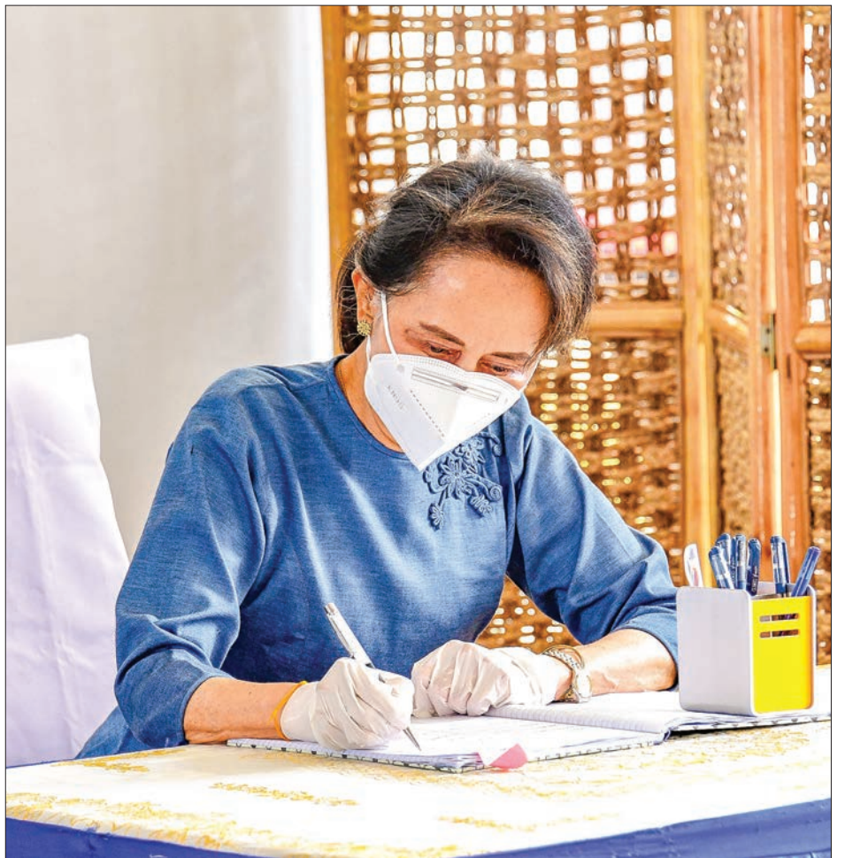
State Counsellor Daw Aung San Suu Kyi signs Form 15 for voters outside constituencies and voting record register in Nay Pyi Taw on 29 October 2020.

STATE Counsellor Daw Aung San Suu Kyi cast her advance votes for the 8 November General Election at the election sub-commission office of Zabuthiri Township in Nay Pyi Taw yesterday morning.