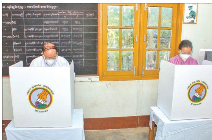
Chairman of the Constitutional Tribunal of the Union U Myo Nyunt and wife Daw Htay Yi cast advance votes in Nay Pyi Taw on 29 October 2020.