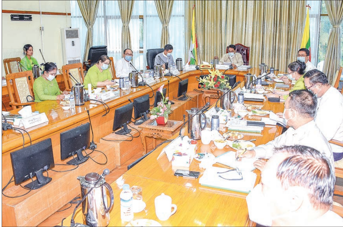
Union Minister Dr Than Myint participates in the virtual meeting on promotion of trade for broader market on 29 October 2020.

The Union Minister also discussed preparations and arrangements to increase the trade volume as it might face some impacts of COVID-19 in 2020-2021 even though it can suppose that sector has less COVID-19 impact, CERP, fully online system for import/export licences, the reduced licence fees and Myanmar TradeNet