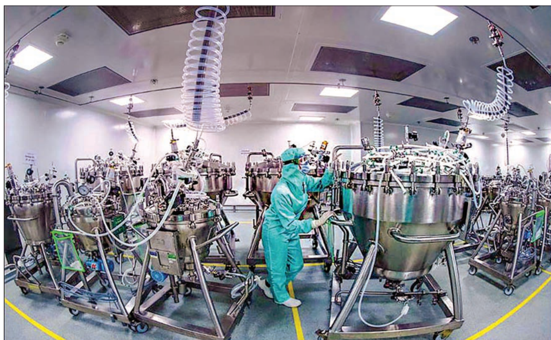
Lab technicians prepare stainless steel tanks for manufacturing vaccines at French pharmaceutical company Sanofi's world distribution centre in Val-de-Reuil on July 10.