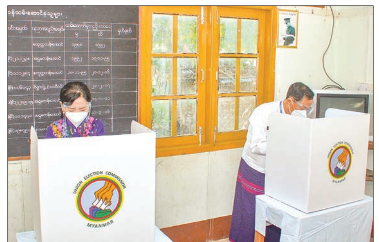
UEC Chairman U Hla Thein and wife Daw Aye Thidar cast advance votes in Nay Pyi Taw on 29 October 2020.