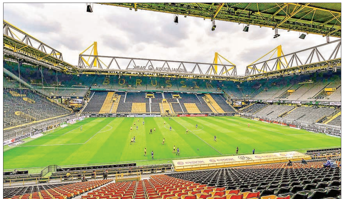
All Bundesliga football and professional sport in Germany will be played behind closed doors from Monday, under new measures announced Wednesday.

The health authority in North Rhine-Westphalia rejected an application to allow 300 fans into the 81,000-capacity stadium for the European game.—AFP ■