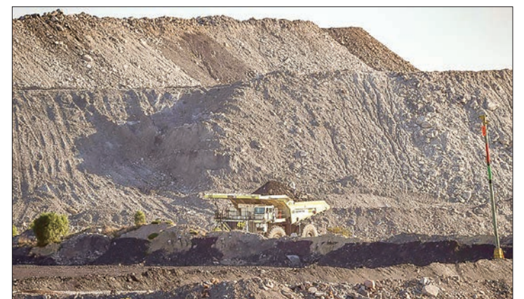
Coal has long been a mainstay of Australia's resource-dependent economy, but the industry's foundations appear increasingly wobbly.