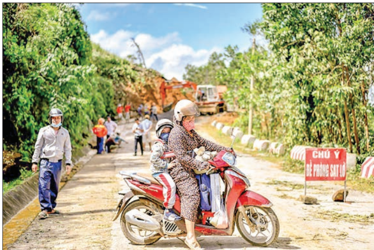
Hundreds of rescuers were desperately trying to reach survivors after several landslides but were blocked by thick mud and fallen trees.