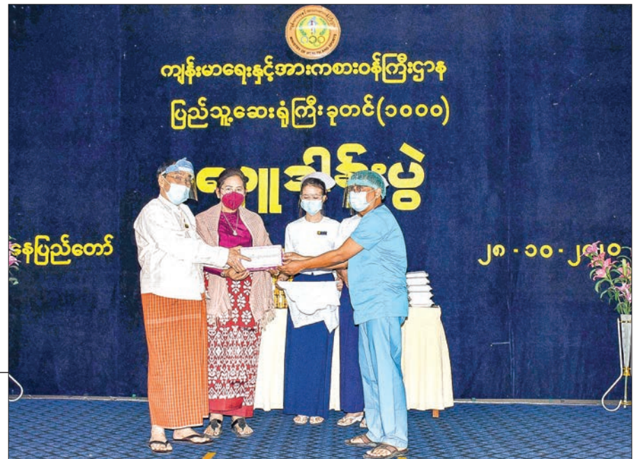
Ministry of Ethnic Affairs donates refrigerator and air conditioners for 1000-bedded General Hospital in Nay Pyi Taw on 29 October 2020.