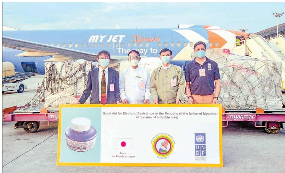
People of Japan provide Myanmar with indelible ink bottles under the 'Electoral Assistance Programme'.