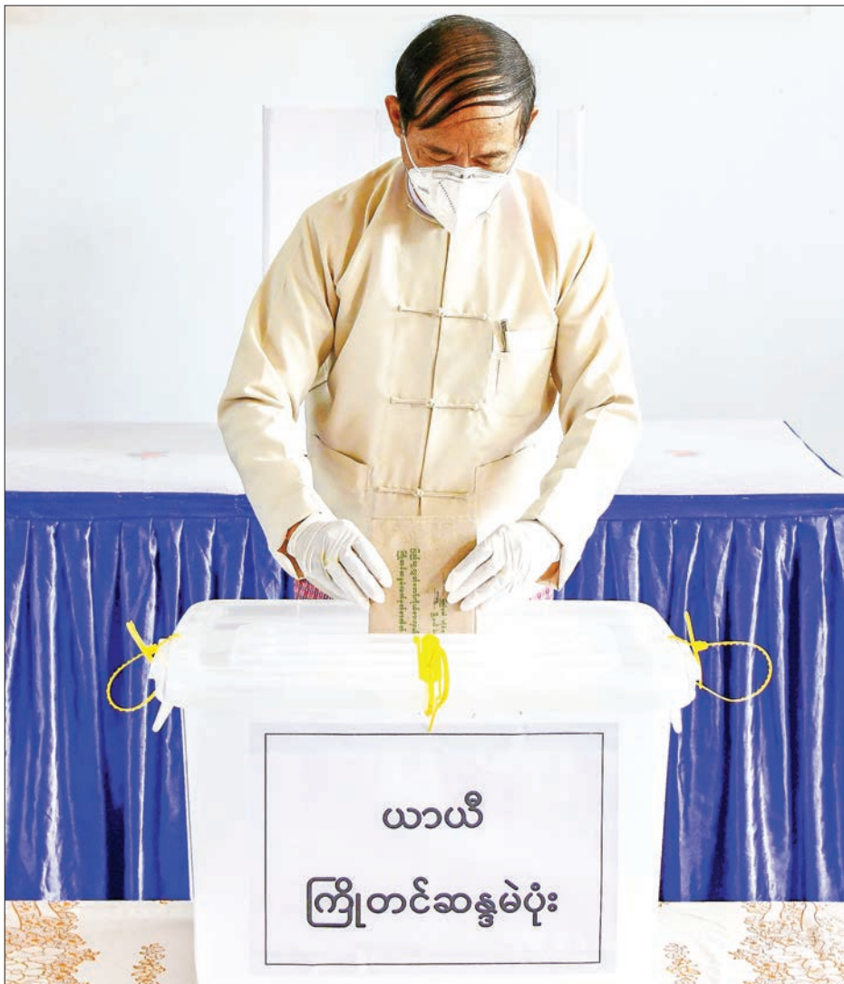
President U Win Myint casts advance vote in Nay Pyi Taw on 29 October 2020.

PRESIDENT U Win Myint cast his advance votes for the 8 November General Election at the election sub-commission office of Zabuthiri Township in Nay Pyi Taw yesterday morning.