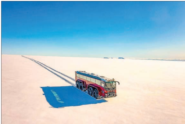
The glacier mega bus is named Sleipnir after the mythical eight-legged horse ridden by the Norse god Odin.

INSTEAD of a slow slog on snowshoes, a giant bus sweeps passengers at up to 60 kilometres an hour across Iceland's second largest glacier, which scientists predict will likely be nearly gone by the end of the century.