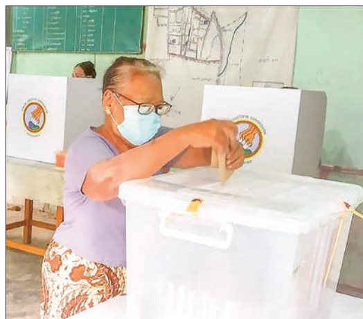
An older woman casts advance ballot in Lewe on 29 October 2020.

They voted at the respective ward/village-tract election sub-commissions in the townships of Zabuthiri,