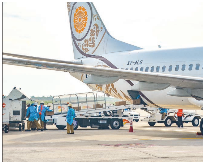
COVID-19 medical devices imported from China arrive at the Mandalay International Airport on 29 October 2020.

MYANMAR is importing medical devices from China for COVID-19 prevention in the 2020 General Election.