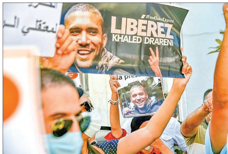
Algerian activists and journalists have been rallying to demand the release of their colleague Khaled Drareni, who was handed a three-year jail term over his coverage of the mass protest movement that toppled Abdelaziz Bouteflika.

“The referendum will have no impact in terms of offering a political alternative or a change in how the country is governed,”