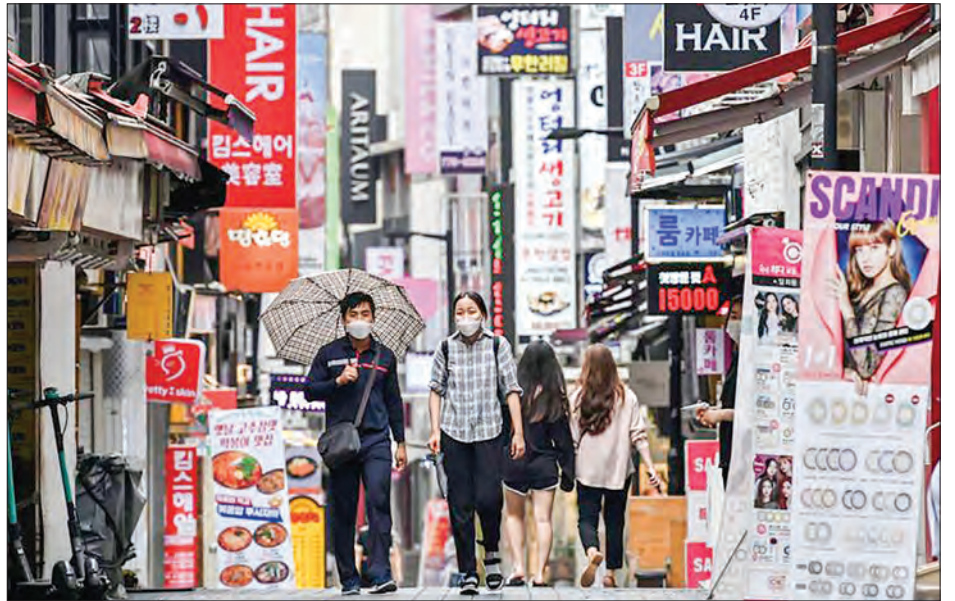
From a year earlier, the economy shrank by 1.3 per cent in the third quarter.