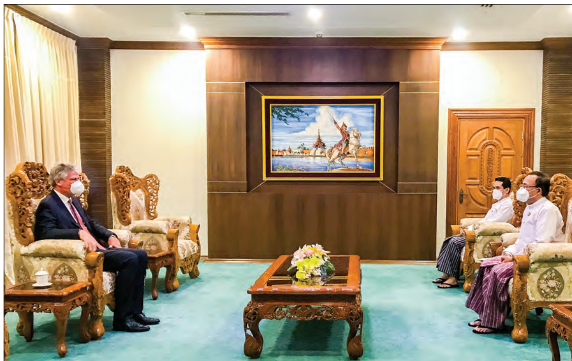
Union Minister U Kyaw Tin receives a courtesy call of new EU Ambassador Mr Ranieri Sabatucci on 27 October.

U Kyaw Tin, Union Minister for International Cooperation received Mr Ranieri Sabatucci, Ambassador Extraordinary and Plenipotentiary of the European Union to the Republic of the Union of Myanmar at 4:00 pm on 27 October 2020 at the Ministry of Foreign Affairs in Nay Pyi Taw.