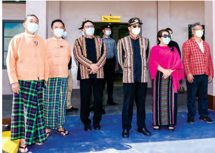
Vice President U Henry Van Thio and officials look into trial flight landing at new Surbung Airport in Falam Township, Chin State, on 27 October.

The Vice President also expressed thanks to all stakeholders, including local engineers and experts, involved in the airport construction project, saying that it was challenging to build the air-