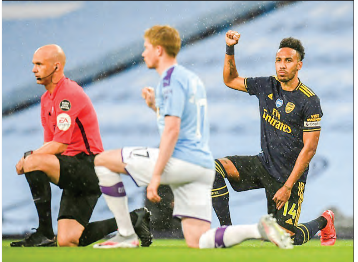
The issue of racism has been in the spotlight since the Premier League resumed.

If applicants meeting the job specifications apply, interview shortlists will need to have at least one male and one female black, Asian or of mixed-heritage candidate.—AFP ■