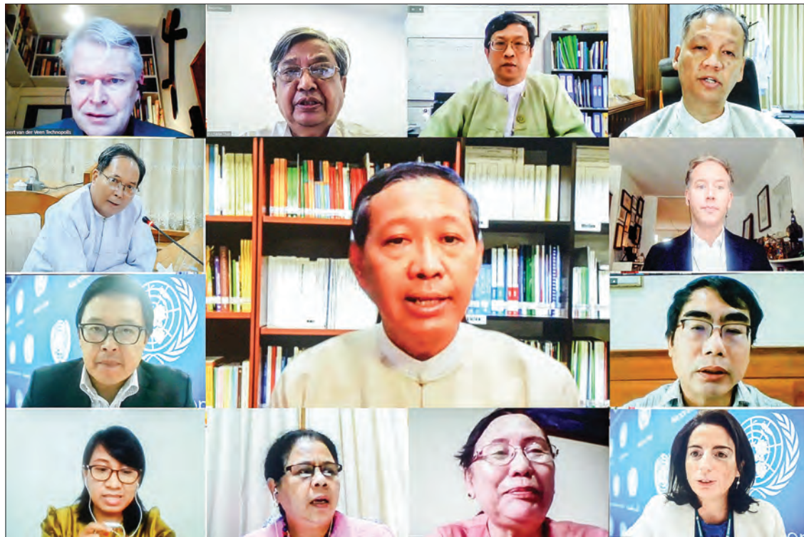
Union Minister Dr Myo Thein Gyi holds an online meeting on drafting Science, Technology and Innovation Policy on 27 October.

A final consultation meeting on the Science, Technology and Innovation Policy (Draft) was held through videoconferencing yesterday afternoon.