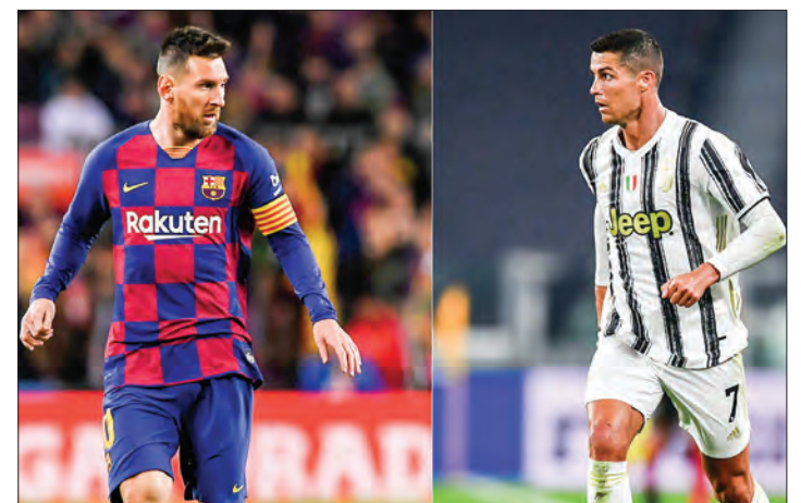
Barcelona's Lionel Messi (L) and Juventus' Ronaldo are the top two scorers in Champions League history

The 35-year-old will need to test negative 24 hours before being allowed to feature in Turin. The return at the Camp Nou is on December 8.—AFP ■