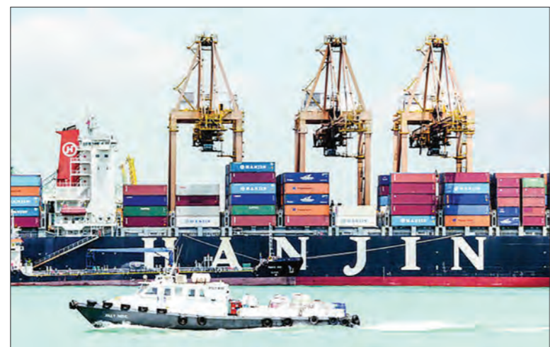
Flows were 28 per cent lower in Africa, 25 per cent down in Latin America and the Caribbean, but just 12 per cent lower in Asia, mainly due to resilient investment in China. A Hanjin shipping vessel enters the port in Singapore.

"The decline was quite drastic," James Zhan, UNCTAD's investment and enterprise chief, told a virtual press conference. The rate of decline is expected to slow in the second half of