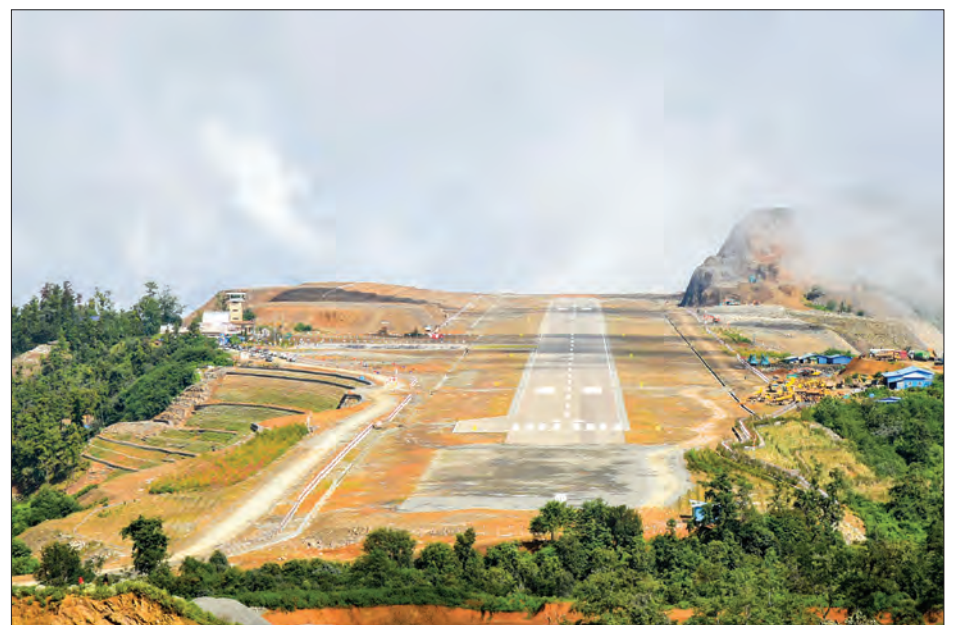
Surbung Airport is located on Surbung mountain range 8.5 miles northwest of Falam Town, Chin State.