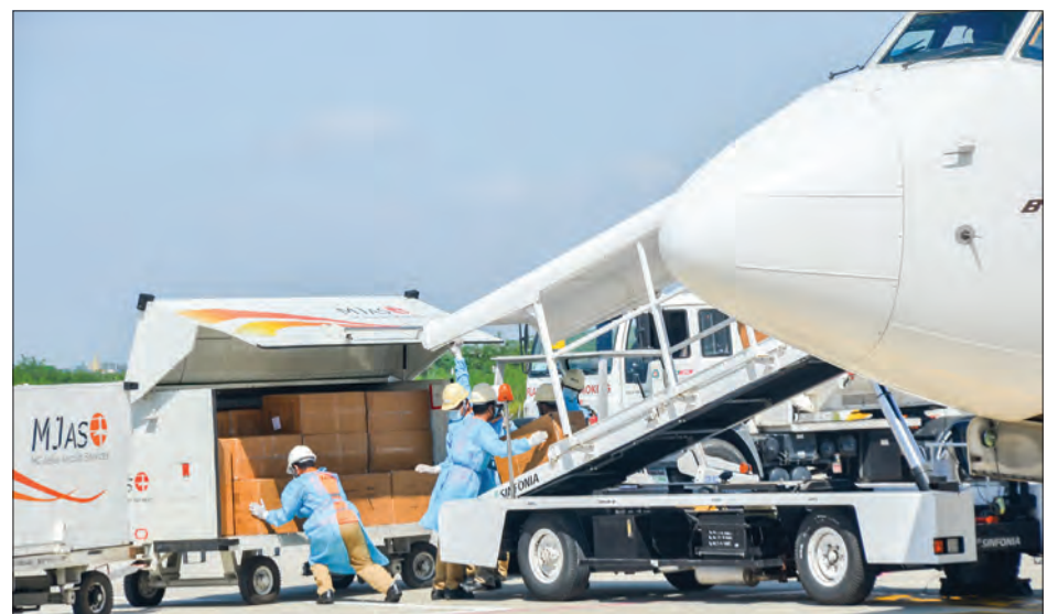
COVID-19 medical devices for 2020 General Election are being unloaded at TadaU airport in Mandalay on 27 October.