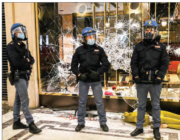
Italian police officers stand in front of a shattered Gucci store window during a protest of far-right activists against government coronavirus measures, in downtown Turin.

THOUSANDS of Italian protesters angry over new restrictions announced to control the spread of coronavirus clashed with police in cities on Monday as European governments toughened their responses to the contagion.