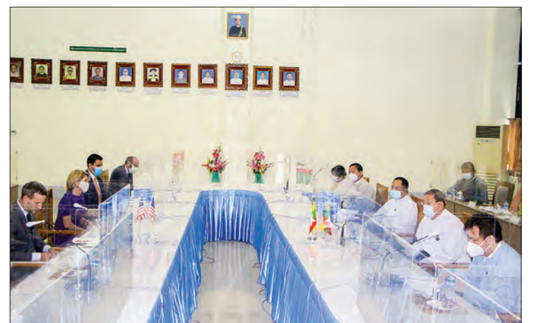
Union Minister U Soe Win holds meeting with delegation of US government Development Finance Corporation on 27 Oct.

conomic zones and further cooperation works for US businesses in Myanmar. —MNA (Translated by Khine Thazin Han)