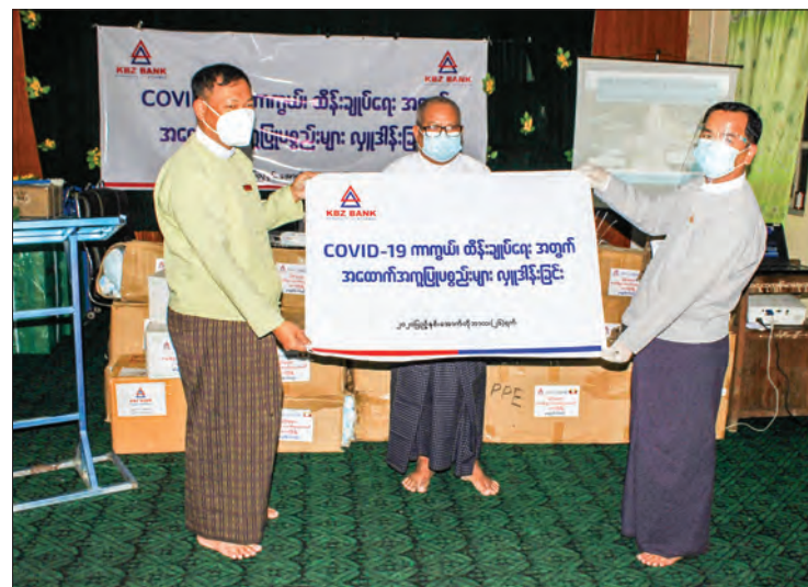
KBZ Bank contributes cash and medical devices for COVID-19 control measures in Dala Township on 26 October.

TO contribute toward Myanmar's effort to fight COVID-19, Myanmar's largest private bank called Kanbawza (KBZ) bank on 26 October provided monetary assistance as well as the emergency medical equipment to 25-bed Dala People's Hospital for use in the fight against COVID-19.