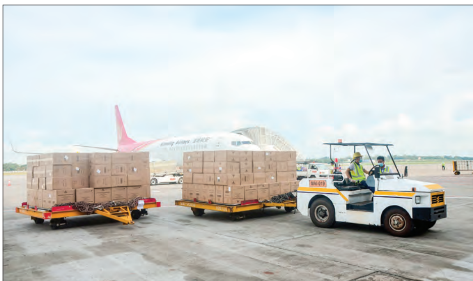
COVID-19 medical devices for 2020 General Election arrive in Yangon from China on 27 October.

28 October to 3 November.—MNA (Translated by Aung Khin)