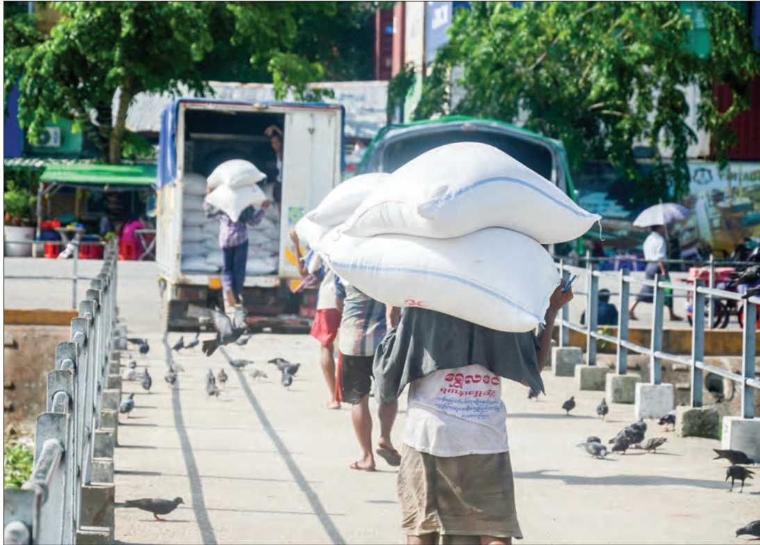
Rice bags are being loaded onto a truck for the markets in Yangon.

move to sell the rice at K1,000 per pyi (2.13 kg) which is much fairer price than the prevailing market price. MRF is supporting the government's plan with non-profit, the federation reported.