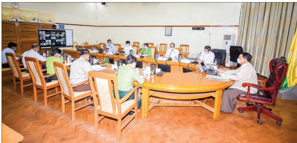
Union Minister Dr Than Myint chairs 1 st coordination meeting of Myanmar Consumer Protection Commission on 27 October.