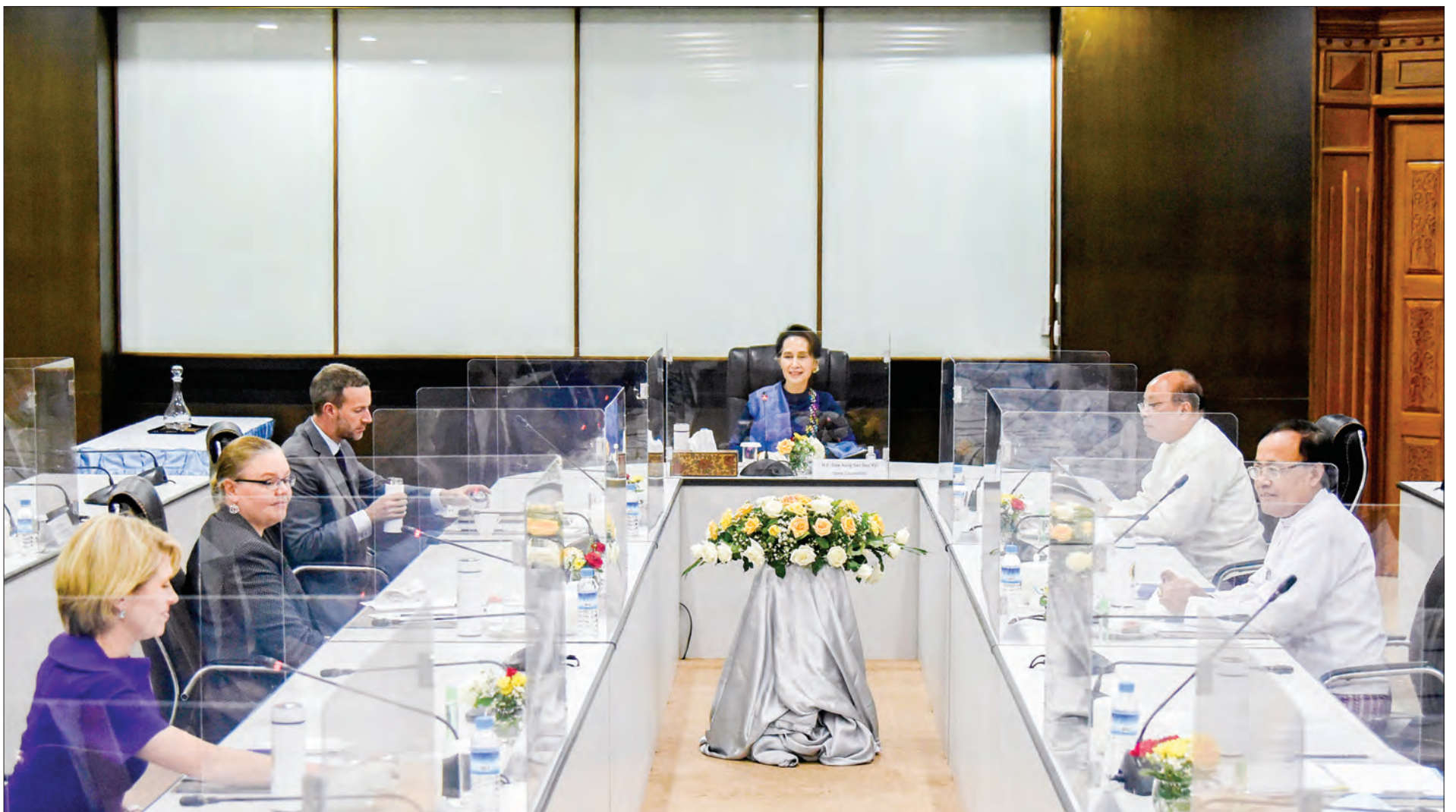
State Counsellor Daw Aung San Suu Kyi makes discussions with delegation members of Development Finance Corporation of the US government on 27 October.