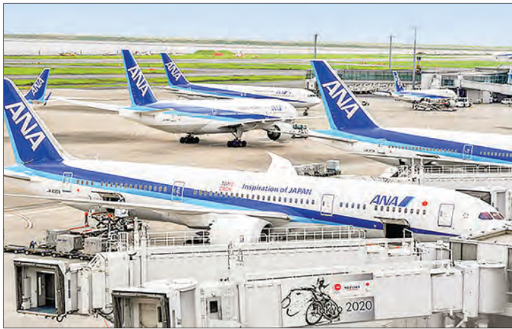
Planes of All Nippon Airways at Haneda International Airport in Tokyo.

ANA Holdings Inc. said Tuesday it is expecting a record net loss of 510 billion yen ($4.9 billion) in the current business year through March due to