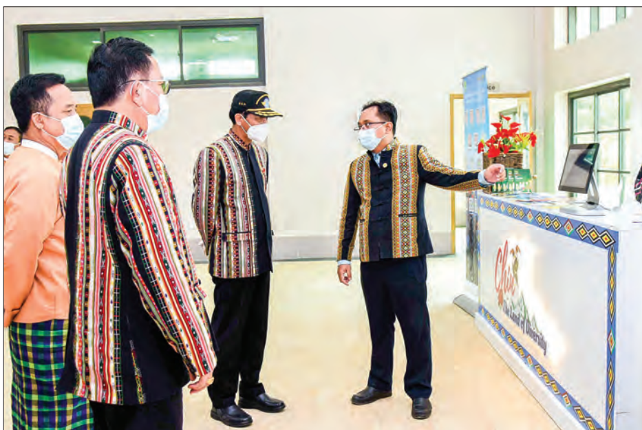
Vice President U Henry Van Thio and party hear report on new Surbung Airport on 27 October.