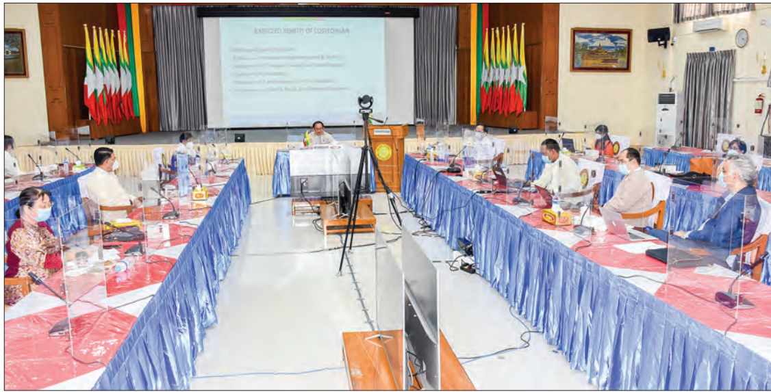
Union Minister Dr Myint Htwe joins virtual meeting on Access to Sustainable NCDs (non-communicable diseases) Treatment and Care of the World Health Summit 2020 on 27 October.

Union Minister for Health and Sports Dr Myint Htwe, on 26 October, participated in the virtual meeting on Access to Sustainable NCDs (non-communicable diseases) Treatment and Care of the World Health Summit 2020 via videoconferencing.