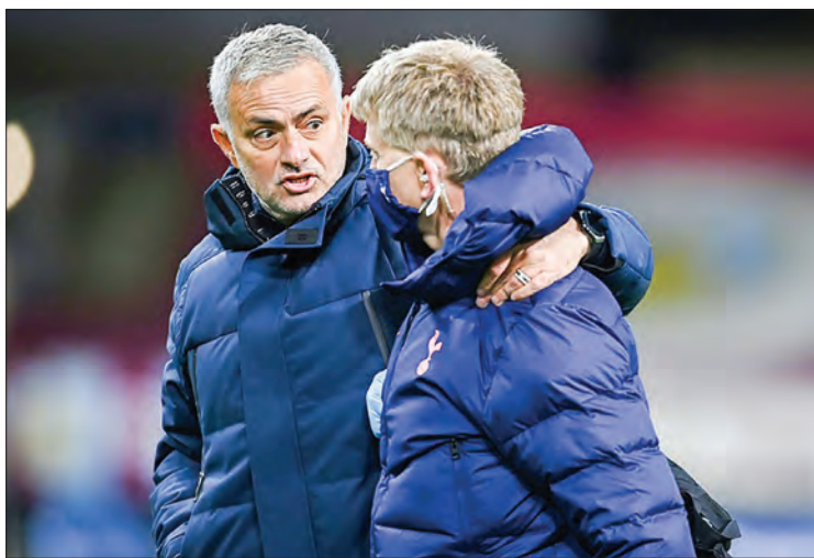
Tottenham have only lost once this season, to Premier League leaders Everton.

LONDON — Tottenham coach Jose Mourinho will not countenance them ever "being considered title contenders" despite being two points off Premier League leaders Everton after Monday's win at Burnley.