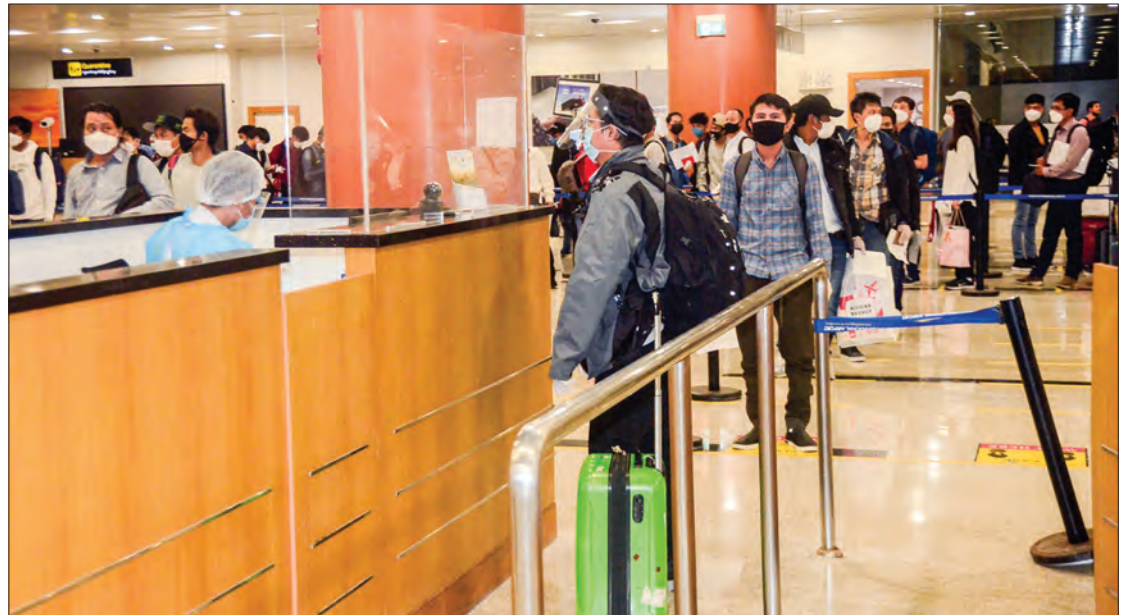
Myanmar returnees queuing for immigration process at Yangon International Airport on 27 October.

Moreover, a charter flight organized by Myanmar embassy in Seoul and Myanmar Seafarers Federation arrived in Yangon in the same afternoon, in bringing back 145 Myanmar seamen whose employment contracts