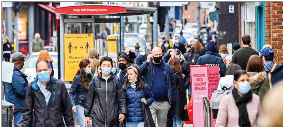
With virus infections spiking across Europe and the US, there are fresh fears of a return to tough containment measures that battered the world economy earlier this year. Pedestrians and shoppers, some wearing face masks as a precaution against the transmission of the novel coronavirus, walk in the high street in west London on 11 October, 2020.