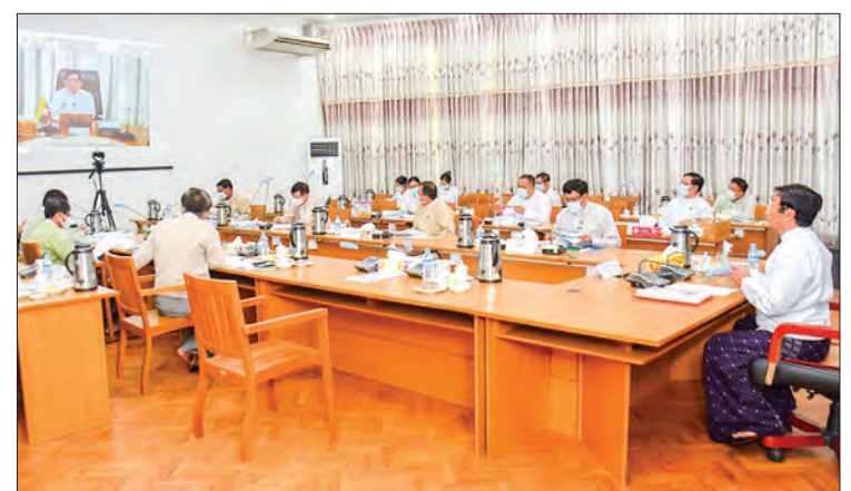
MoALI organizes first policy online meeting on Nutrition Sector Reform Contract on 27 October.

the Department of Planning presented the implementation of the NSRC programme linking the Myanmar Agricultural Development Strategy (ADS) with the Multi-Sectoral National Nutrition Plan (MS-NPAN), the Deputy Director for the Department of Planning briefed on the conditions for meeting the requirements in implementing the NSRC's programmes in 2020-2021 financial year and the attendees suggested the best ways to implement the NSRC.—MNA (Translated by Ei Phyu Phyu Aung)