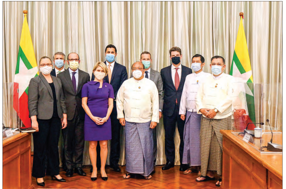
Union Minister U Thaung Tun and officials pose for a documentary photo with US delegation of Development Finance Corporation on 27 October.