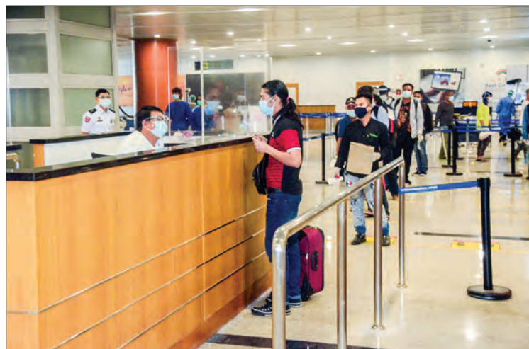
Myanmar returnees queue for immigration service at the Yangon International Airport on 19 October 2020.