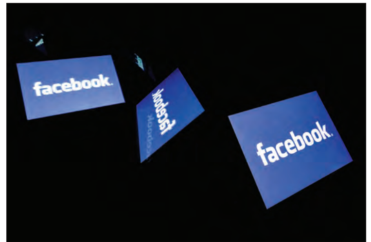
(FILES) In this file photo illustration taken on February 17, 2019, the US social media Facebook logo displayed on a tablet in Paris. Facebook announced October 12, 2020 that it will ban content that denies or distorts the Holocaust, describing the move as its latest effort to free the platform of hate.

A day earlier Facebook announced a ban on ads that discourage people from get-