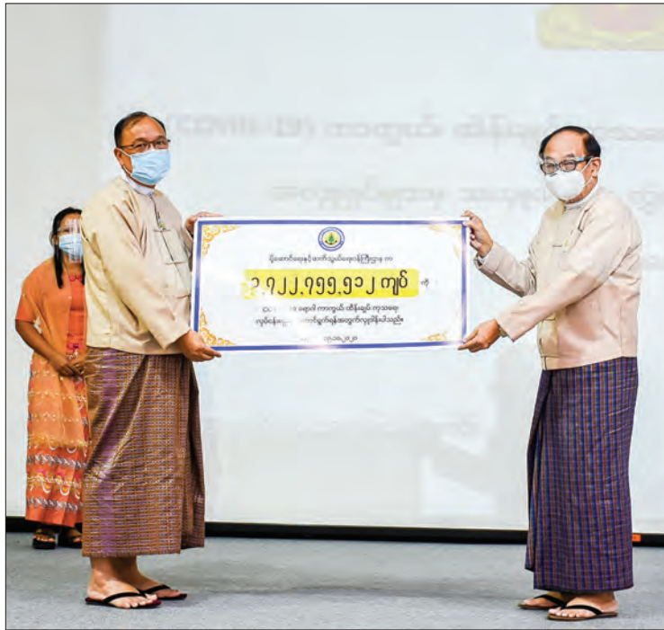
Union Minister Dr Myint Htwe (R) receives cash donation at the Ministry of Health and Sports on 19 October 2020.

Under this directive, more than 34.49 million SIM cards that were not re-registered by 30 June, 2020 and un-registered SIM cards with accurate the