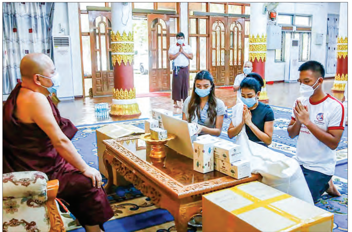
Ayeyarwady Foundation donates cash, rice bags and masks to 11 monasteries and nunneries in Yangon.

The plant has a daily production capacity of 50,000 masks (with 5,000 units per hour). The foundation will also distribute 5 million masks for free to vulnerable people with