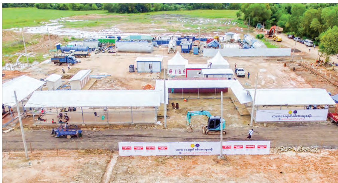
Construction of COVID-19 Test Centre of Ayeyarwady Foundation is underway in Taikkyi Township, Yangon Region.