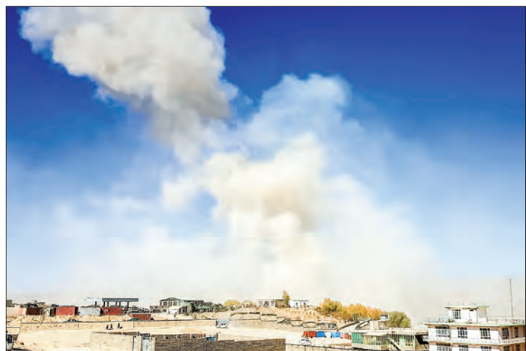
Smoke rises from the site of a car bomb attack that targeted an Afghan police headquarters in Feroz Koh, the capital of Ghor Province on 18 October 2020.

US influence over Afghanistan's battlegrounds is on the wane, with the Pentagon looking to withdraw all its remaining troops by next May. —AFP ■