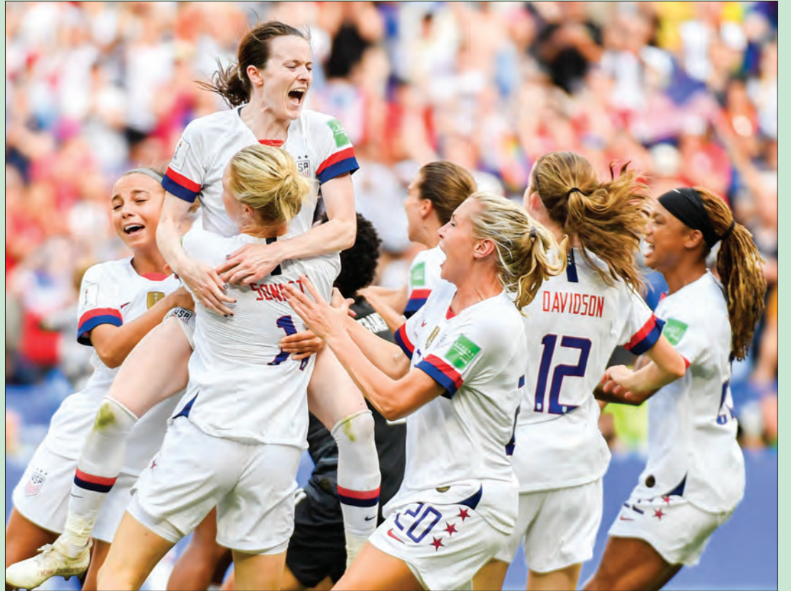
USA players celebrate after the final whistle during the France 2019 Women's World Cup football final match between USA and the Netherlands, on July 7, 2019, at the Lyon Stadium in Lyon, central-eastern France.

Germany hosted the 2006 men's World Cup, the women's finals in 2011 and will hold the men's European Championship in 2024. The Netherlands hosted, and won, the women's Euros in 2017, but Belgium has never hosted a major women's tournament. The three partners have already presented their plans to FIFA, as well as European football's governing body UEFA, the DFB added.—AFP