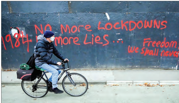
A cyclist rides past graffiti against further coronavirus restrictions in Manchester, northwest England on 19 October 2020.

BRUSSELS (Belgium) — A raft of European nations including Italy and Belgium took desperate new measures on Monday to try to combat a second wave