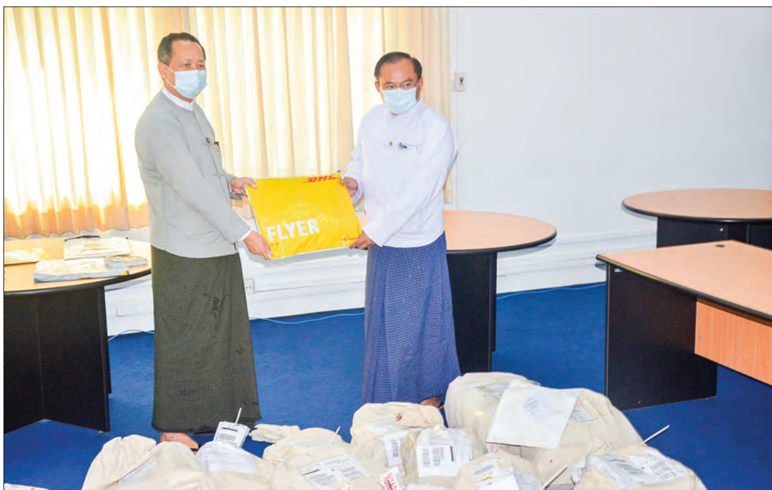
Ministry of Foreign Affairs hands over sealed advance ballot papers to the Union Election Commission on 19 October 2020.

THE Ministry of Foreign Affairs handed over the sealed ballot papers for advance votes sent by 28 Myanmar embassies, missions and consulates in foreign countries to the Union Election Commission yesterday.