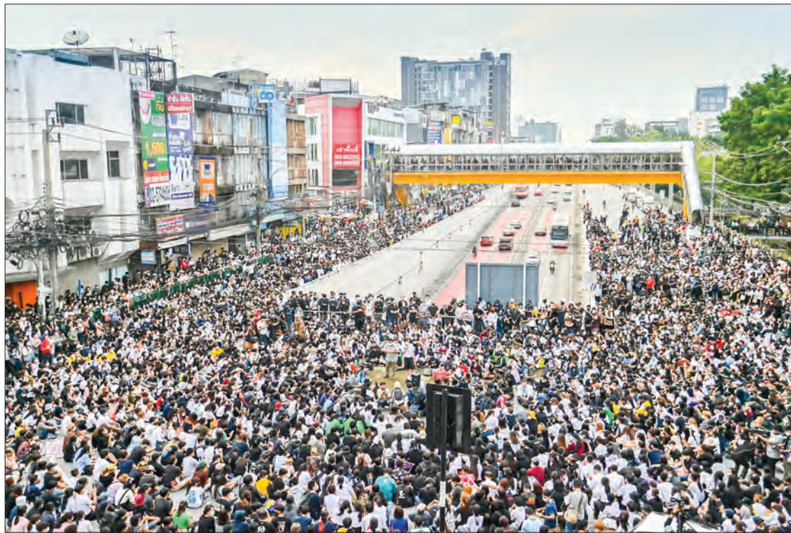
Pro-democracy protesters take part in an anti-government rally at Kaset intersection in Bangkok on 19 October 2020, as they continue to defy an emergency decree banning gatherings.

The largely leaderless movement is calling for the resignation of Prayut -- a former army chief and mastermind of a 2014 coup -- as well as the re-writing of the military-drafted constitution they say rigged last year's election in his favour.