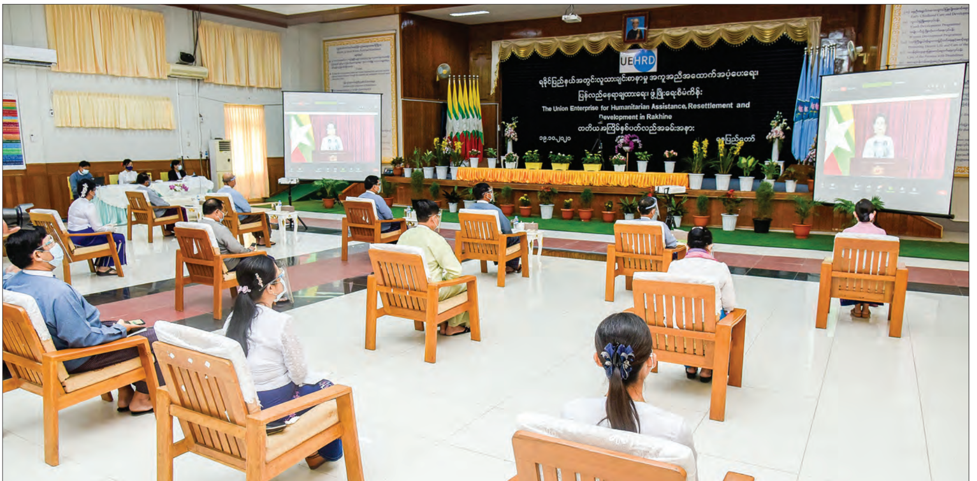
The video message sent by State Counsellor Daw Aung San Suu Kyi to the Anniversary of UEHRD is being played on 19 October 2020.

THE 3 rd anniversary of the Union Enterprise for Humanitarian Assistance, Resettlement and Development in Rakhine State (UEHRD) was held via zoom video webinar at the Ministry of Social Welfare, Relief and