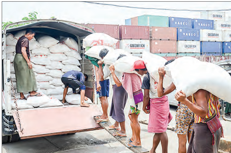
Workers carrying sacks of rice at the Botahtaung Jetty in Yangon.

Myanmar's maritime trade, which constituted 84 per cent of