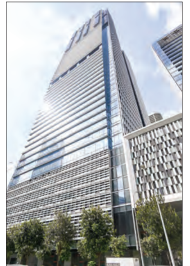
A view of Guoco Tower, where a luxury penthouse at Wallich Residence is located, is seen in Singapore on 10 July 2019.

The firm -- famous for its bagless vacuum cleaners -- abandoned plans to produce electric cars last year, saying the project was not commercially viable. Its first vehicle plant was to be located in Singapore. —AFP ■