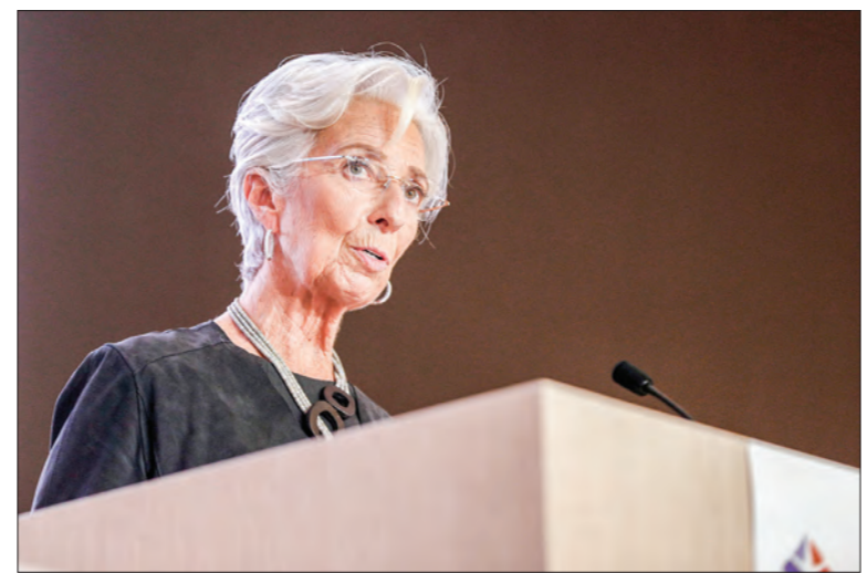
European Central Bank (ECB) President Christine Lagarde speaks during the 16th Congress of Regions (Congres des Regions) in Saint-Ouen, north of Paris on October 19, 2020.

"It is now up to the member states, who have to submit their recovery plans — some