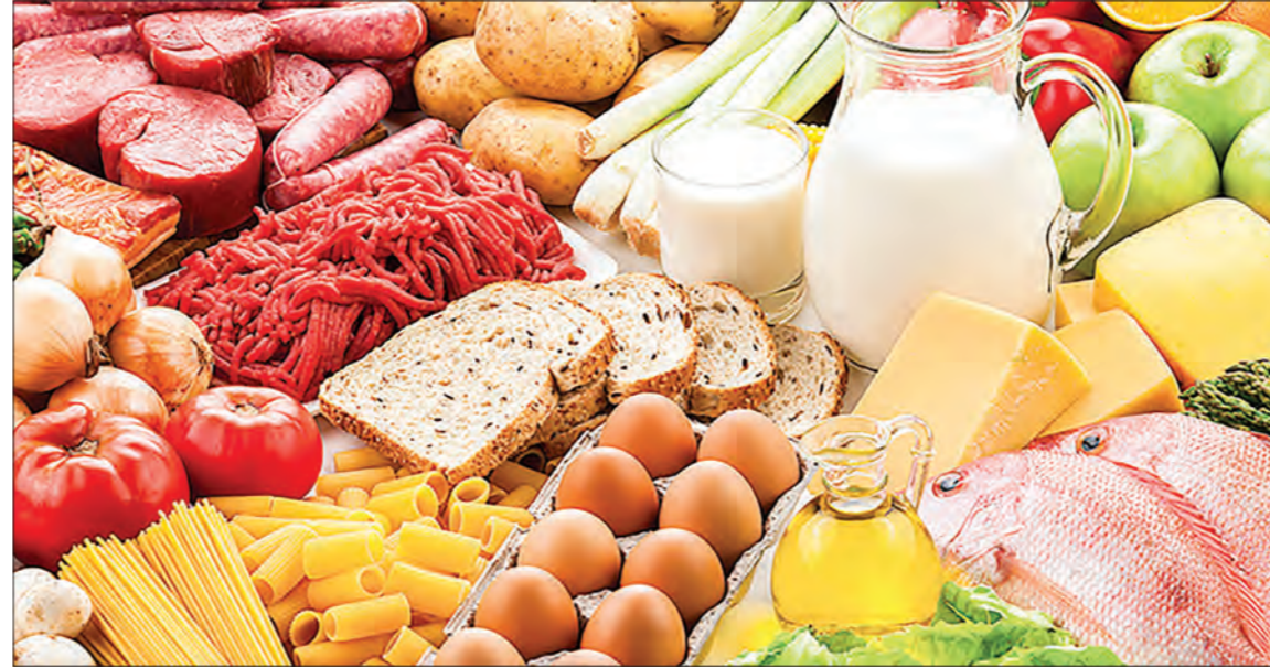
Generally speaking, buying and consuming "safe food", depends entirely on the "choice" of the consumer.

The editorial also comments that some regional countries emphasize safety and hygiene of their "street foods" to attract tourists. In Myanmar, particularly in the large cities including Yangon, there are many fine and hygienic restaurants and cafes that the tourists may patronize. For tourists