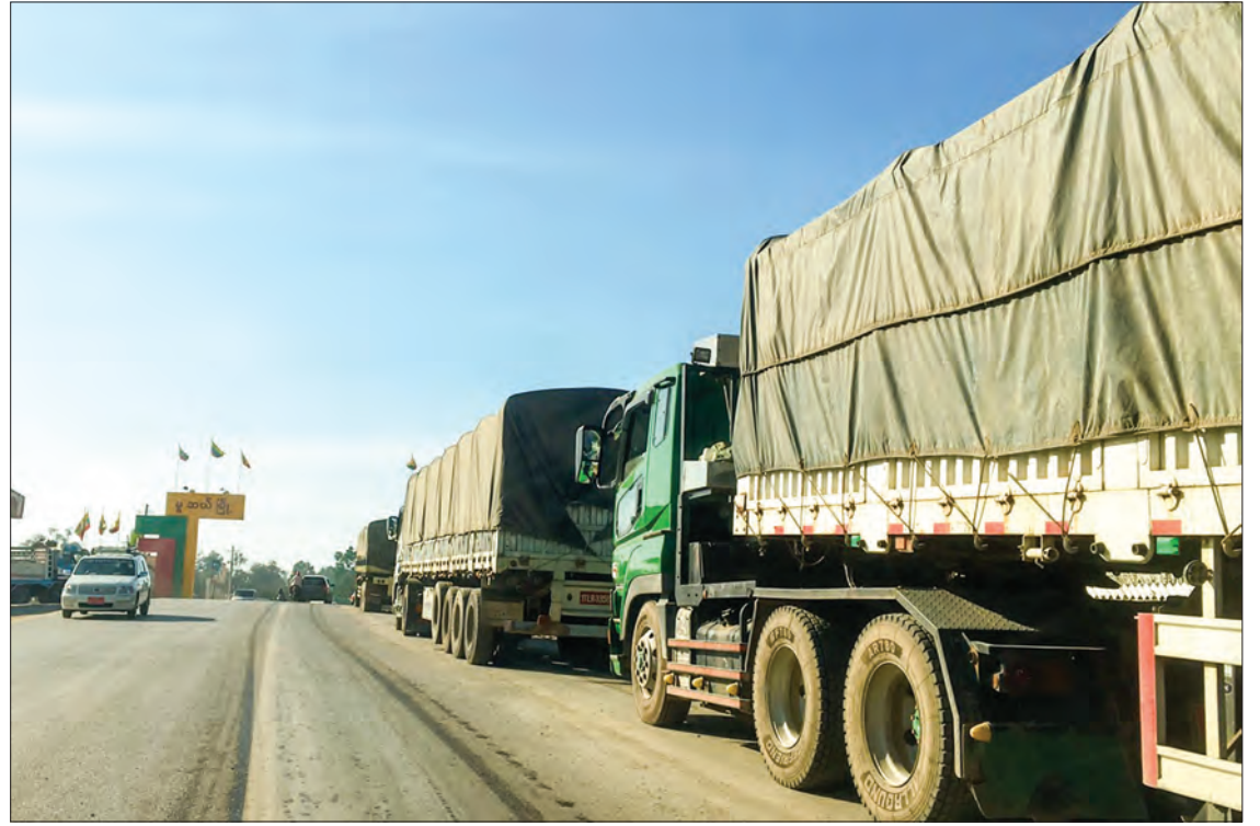
Truck owners have raised transport charges between Yangon and Shan State.

"The truck operators raised the fares. Consequently, it directly hurts consumers. Nevertheless, the farmers do not even get handsome profit and benefit from that. The consumer price is unexpectedly ten times higher than the low introductory rate of farmers. Transport problem must be resolved to control the commodity rate. If not that, the price will continue rising," he shared his opinions.