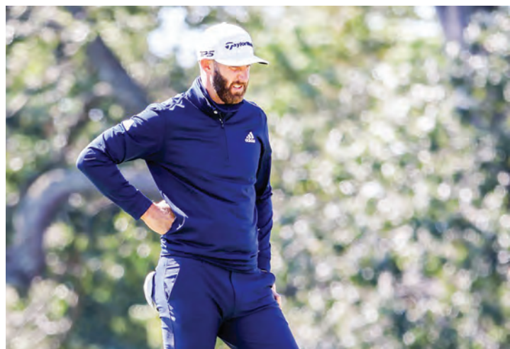
In this file photo Dustin Johnson of the United States looks on from the first green during the final round of the 120th US Open Championship on September 19, 2020 at Winged Foot Golf Club in Mamaroneck, New York.

Johnson's withdrawal comes after a stellar season which has seen him win the FedEx Cup for the first time as well as PGA Tour Player of the Year honors.—AFP