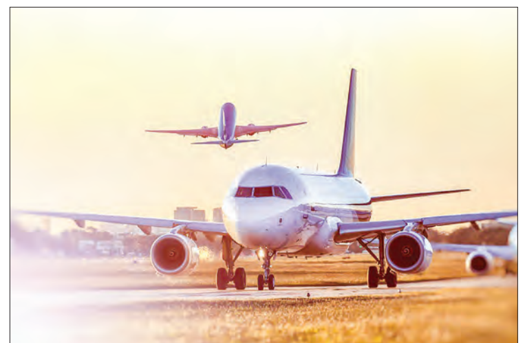
Representative image.

The criteria used to define the coloured zones - green, or-