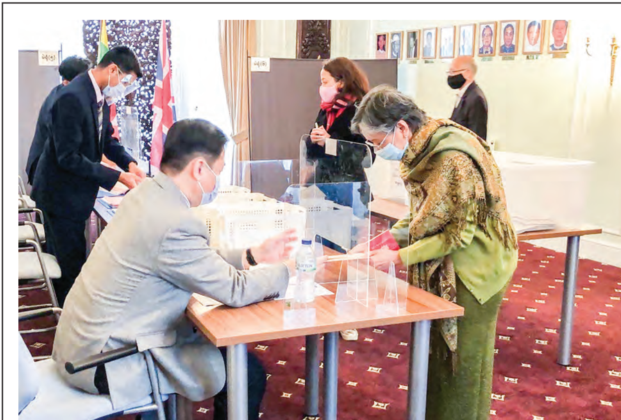
Advance voting in London. (NEWS ON PAGE-1)

The meeting also discussed the need to carry out an assessment regarding the impact of the loans disbursed so as to decide on a future course of action.—MNA