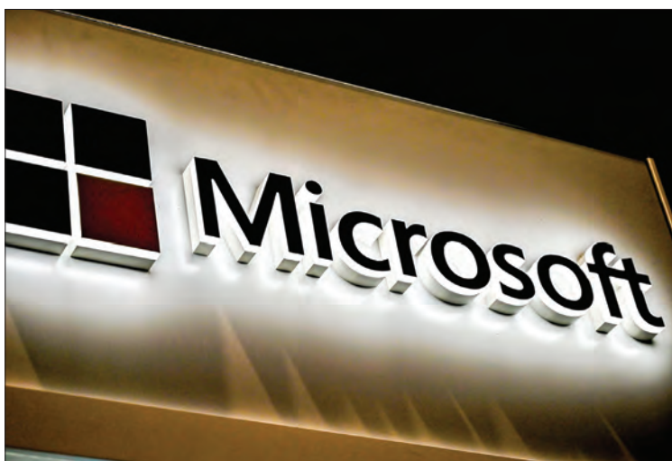
The Microsoft logo at the International Cybersecurity Forum (FIC) in Lille, Jan. 28, 2020.

MICROSOFT said Monday it had taken down malware vendor Trickbot in an effort to thwart attempts to meddle with the upcoming US presidential election.