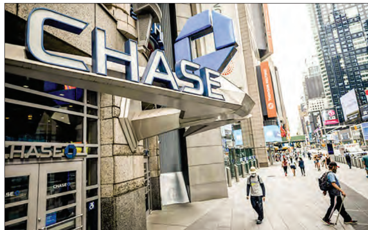
Shares of JPMorgan Chase rose after it reported better-than-expected results and avoided hefty reserves for bad loans.

LARGE US banks reported better-than-expected results Tuesday on an improving economy, but cautioned that the recovery could falter if Washington fails to