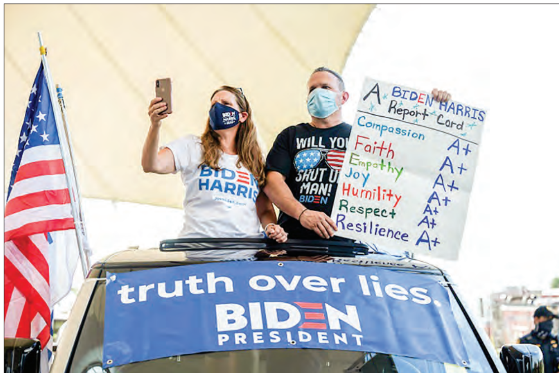
Supporters look on as Democratic Presidential Candidate Joe Biden speaks during a drive-in rally in Miramar, Florida.

In Johnstown, Trump reprised the outsider image that he developed for his surprise 2016 victory, telling the crowd that he was combatting a "selfish and corrupt political class" back