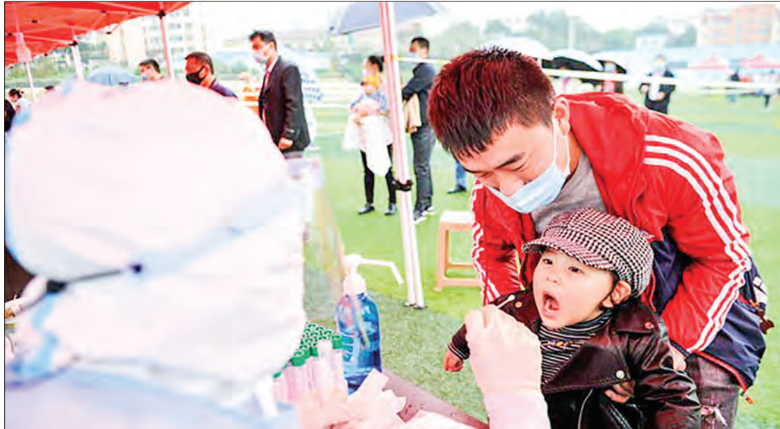
A health worker (L) takes a swab from a resident to be tested for the COVID-19 coronavirus as part of a mass testing programme following a new outbreak in Qingdao in China's eastern Shandong province.

In Europe, the Netherlands imposed a "partial lockdown" to