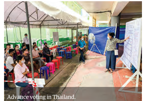
Advance voting in Thailand.