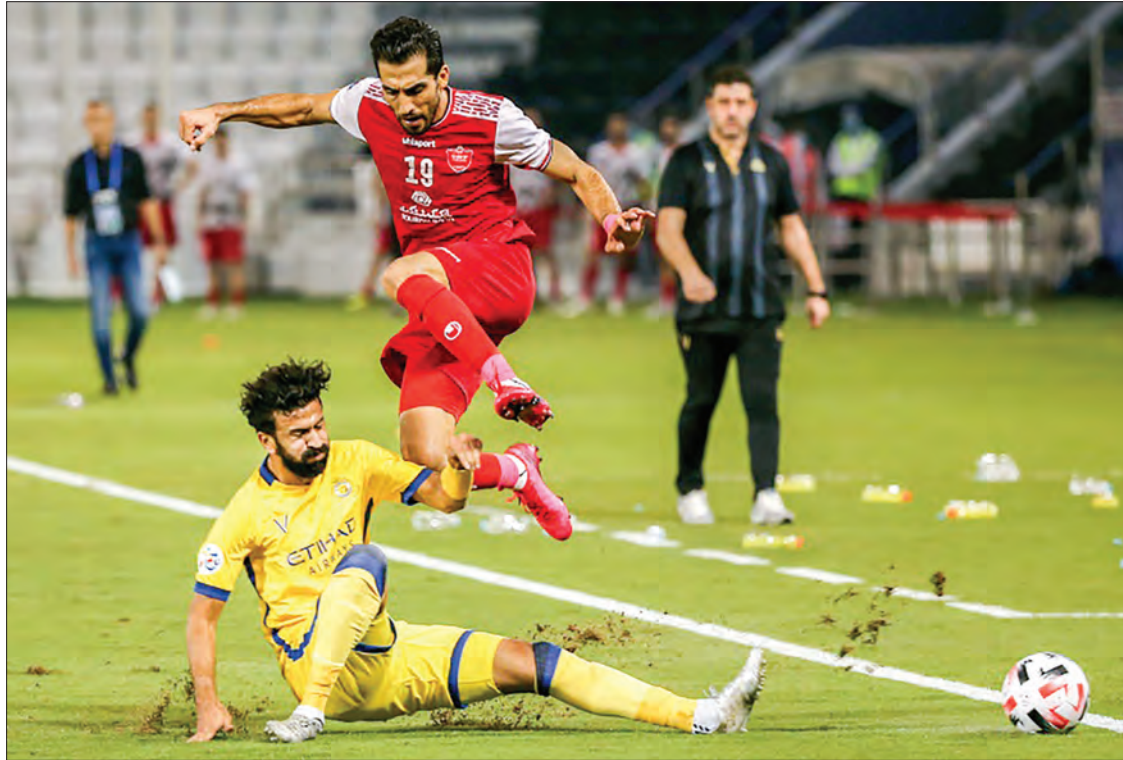
The AFC Champions League resumed in a bio-secure 'bubble' in Qatar.

The AFC "provided support for clubs and leagues through the member associations and