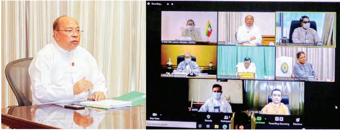
Union Minister U Thaung Tun presides over the Working Committee to address the impact of COVID-19 on the country's economy where K21.122 bln are approved to disburse to 1,200 enterprises.

THE tenth meeting of the Working Committee to address the impact of COVID-19 on the country's economy was held via videoconference yesterday afternoon.