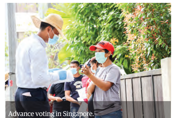
Advance voting in Singapore.