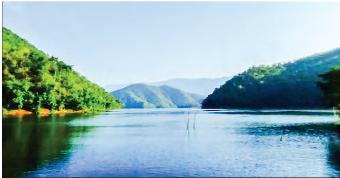
A section of Dotthawadi River.