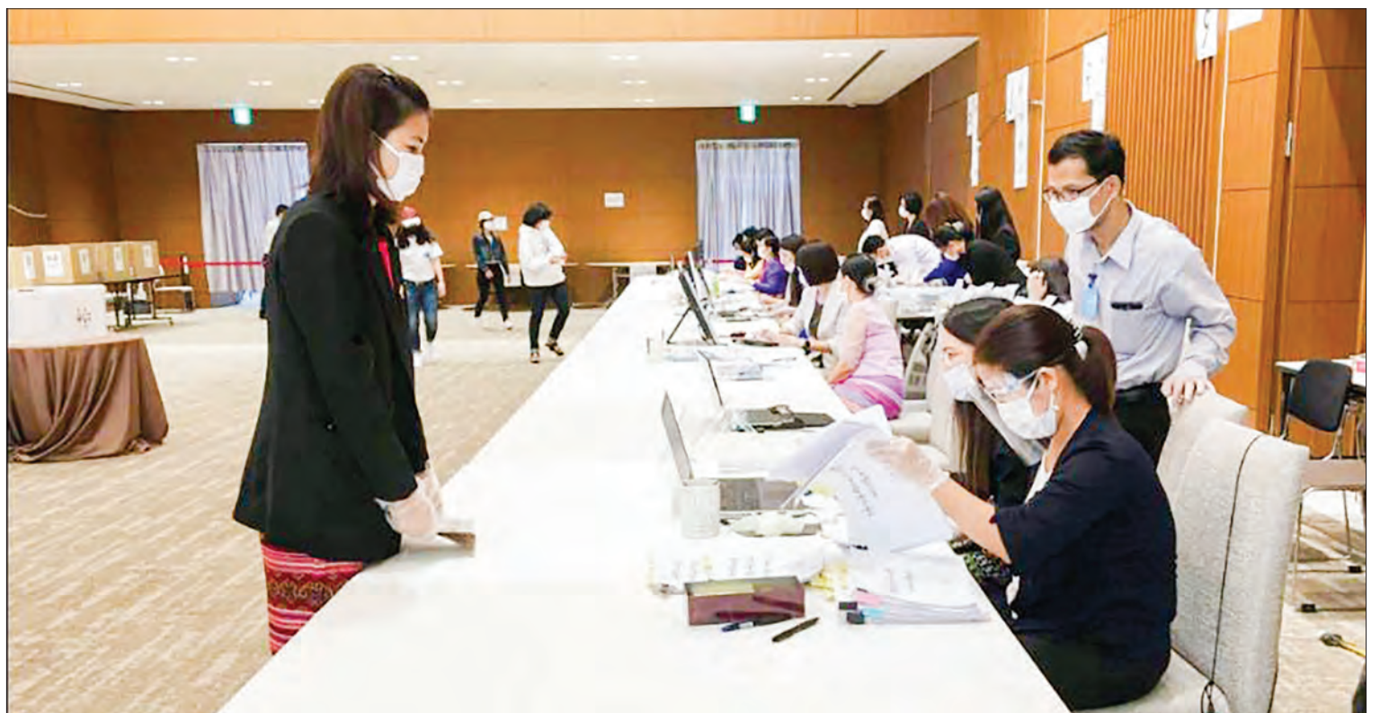
Myanmar citizens casting advance votes in Tokyo, Japan, on 14 October.