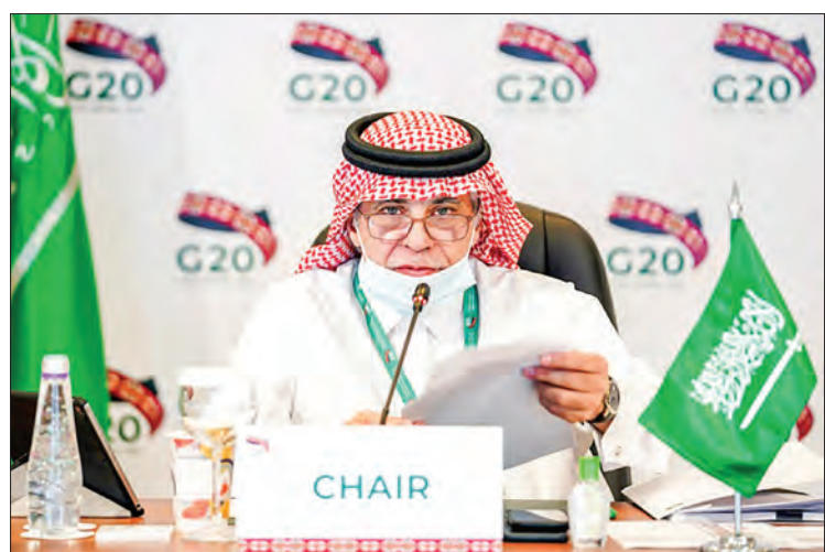
Saudi Minister of Commerce Majid al-Qasabi chairs a virtual G20 finance ministers' meeting in September.

G20 finance ministers and central bankers are set to hold talks Wednesday aimed at spurring global recovery from a coronavirus-triggered recession while considering a proposal to extend debt relief for crisis-hit poor countries.