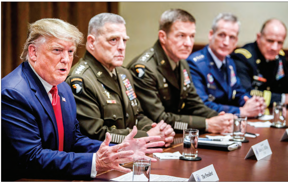
Army Gen. Mark Milley (second from left), chairman of the Joint Chiefs of Staff, and others listen as President Trump speaks during a meeting with senior military leaders in October.