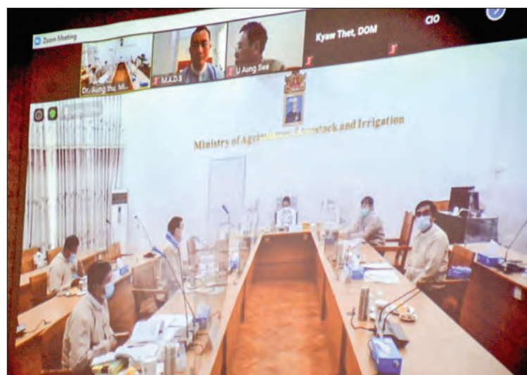
MoALI Union Minister Dr Aung Thu attends the Central Farmland Management Committee 33 rd meeting via videoconference on 14 October 2020.