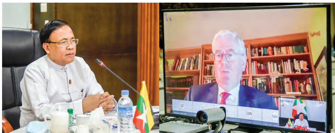
Union Minister U Kyaw Tin co-chairs the sixth Myanmar-EU Human Rights Dialogue via videoconferencing on 14 October 2020.

UNION Minister for International Cooperation U Kyaw Tin attended the Sixth Myanmar-EU Human Rights Dialogue which was held via videoconference at 1:00 pm on 14