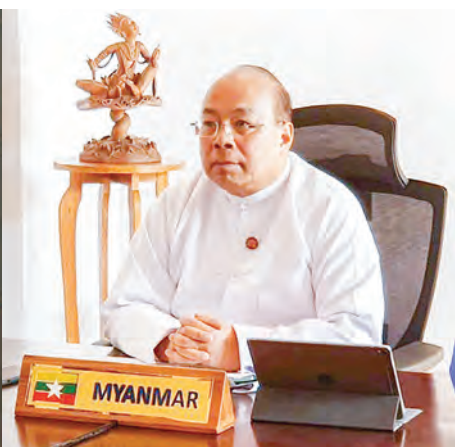
Union Minister U Thaung Tun attends virtual 11 th Intersessional Regional Comprehensive Economic Partnership (RCEP) Ministerial Meeting via videoconference on 14 October 2020.

Group on Legal and Institutional Issues for completion of legal scrubbing to ensure timely completion of the agreement. The Ministers also agreed that the RCEP would keep the door open