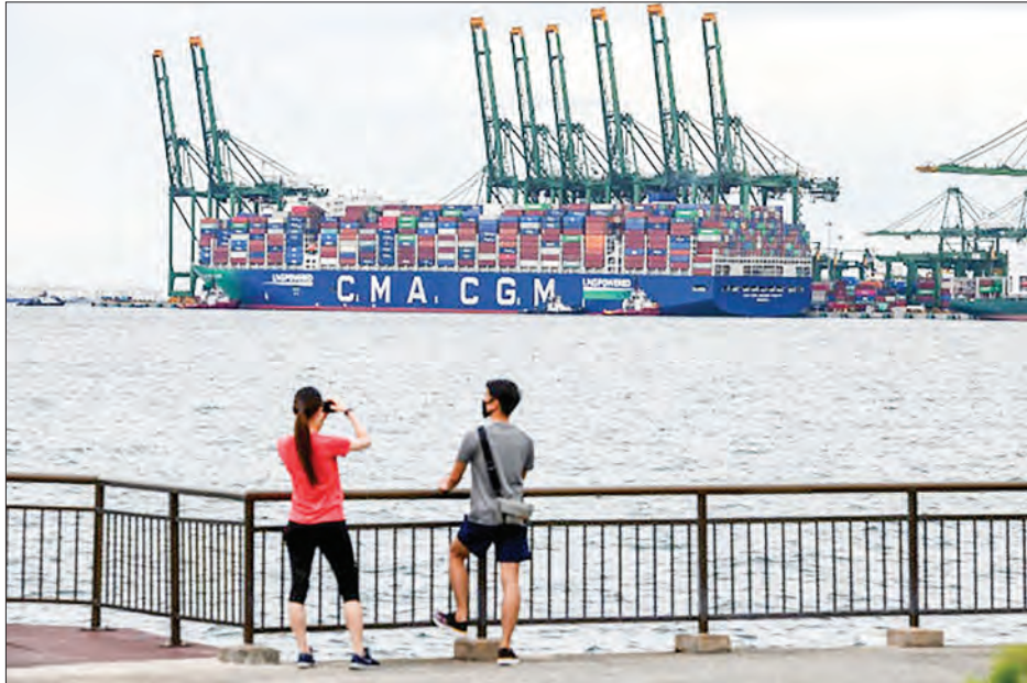
People look on next to the CMA CGM Jacques Saade, the world's largest container ship to be fully-powered by liquefied natural gas (LNG), is seen docked at the CMA CGM-PSA Lion Terminal in Singapore on October 11, 2020.

SINGAPORE'S coronavirus-hit economy shrank at a slower pace in the third quarter as restrictions were eased, official data showed Wednesday, but the trade-reliant city-state still faces a long road to recovery.