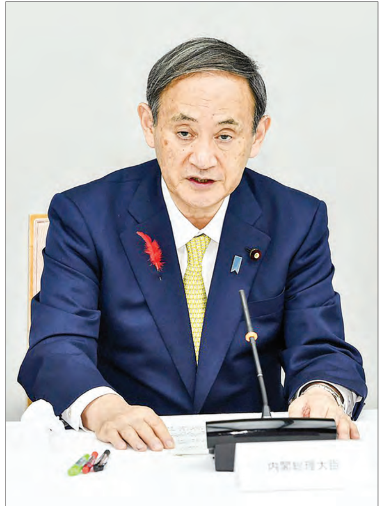
Japanese Prime Minister Yoshihide Suga speaks in Tokyo on Oct. 9, 2020