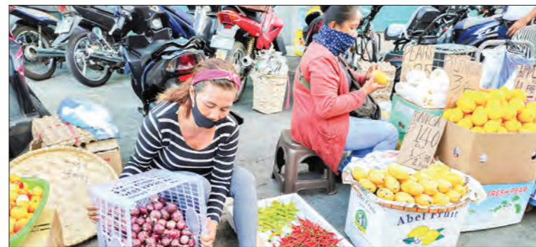
Women sell fruit and vegetables on a sidewalk in the Philippines, where workers in the informal economy are in danger of having their livelihoods destroyed by the impacts of COVID-19.

ing lockdowns and without sufficient social protections or health care, informal economy workers are particularly vulnerable - many powerless to feed themselves and their families.