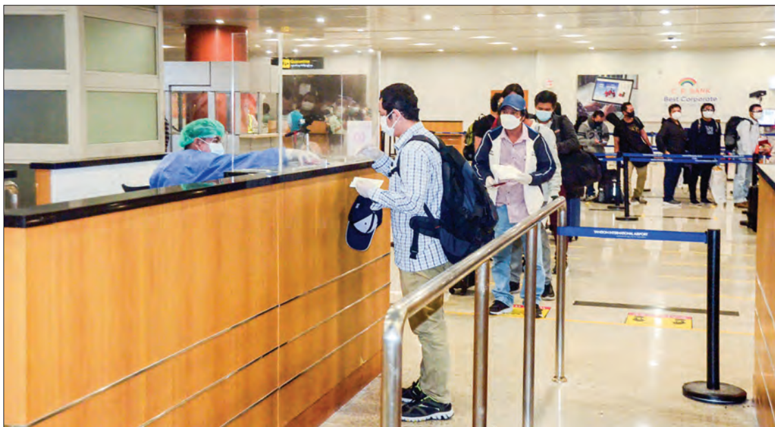
Returnees are queuing at the Immigration counter of Yangon International Airport on 14 October 2020.