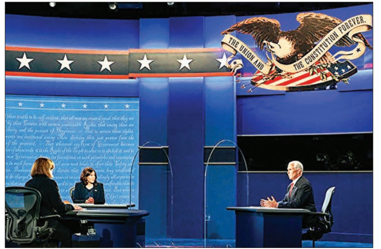
Vice President Mike Pence and Sen. Kamala Harris squared off in the first and only vice presidential debate of the campaign.

Saying Trump treated frontline health personnel as "sacrificial workers," Harris -- pointing to Trump's own statements to journalist Bob Woodward -- accused the White House of not moving quickly despite knowing the risks of Covid-19. "The president said it was a hoax. They minimized the seriousness of it," Harris said. — AFP ■