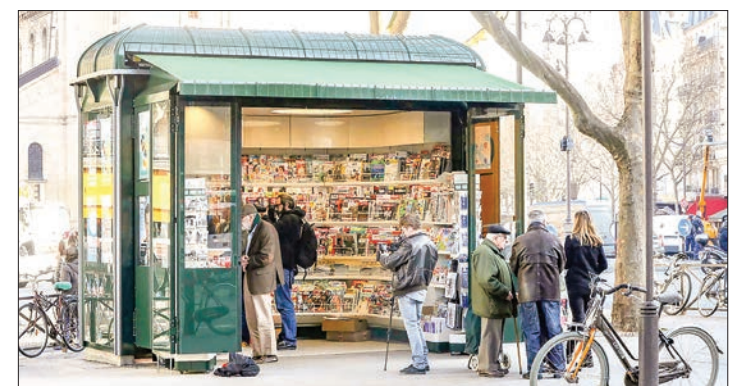
A newspaper kiosk in Paris.

France was the first European country to ratify the law in 2019 and in April this year the French competition authority ordered Google to open talks about compensating news publishers. — AFP ■