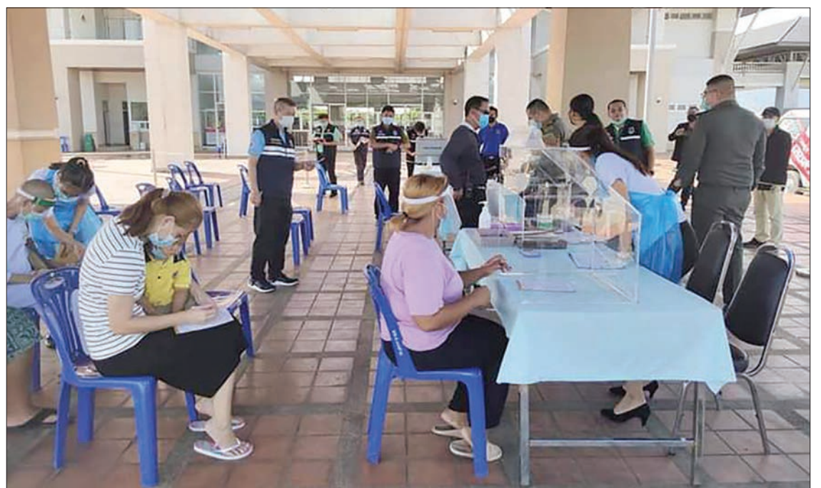
Thai workers return to their country via Tachilek border on 8 October.