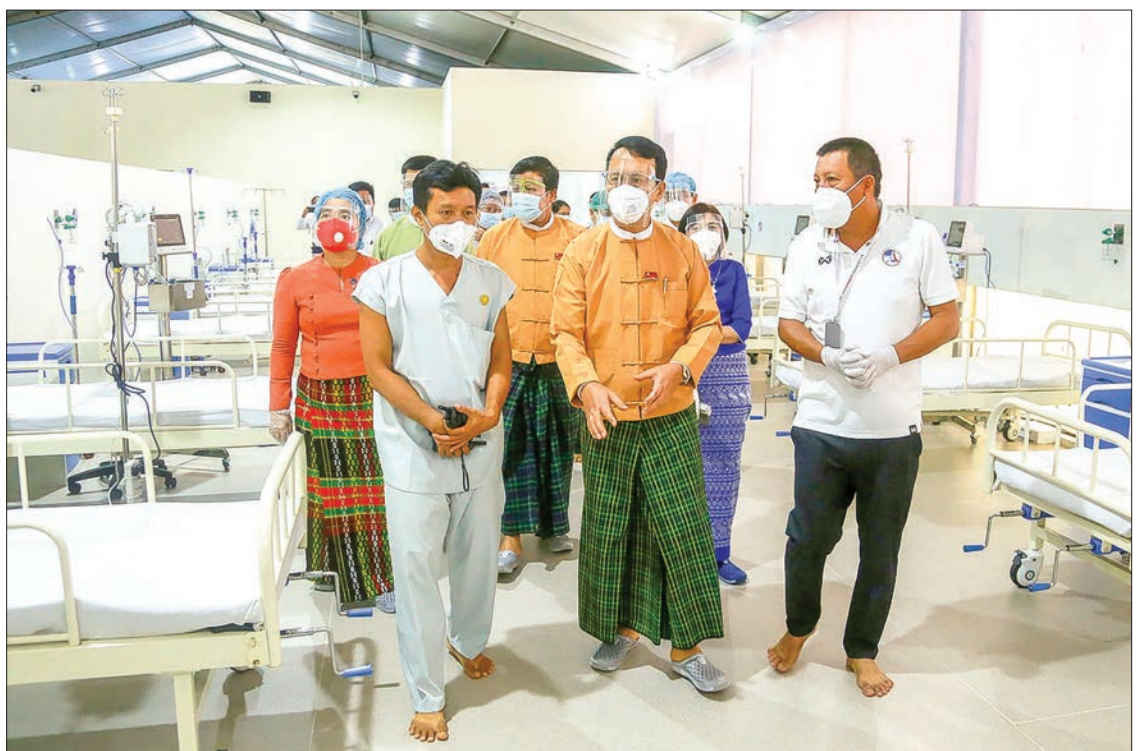
Yangon Region Chief Minister U Phyo Min Thein looks around the new facility of ICU/HDU at Ayeyarwady Centre on 7 October evening.