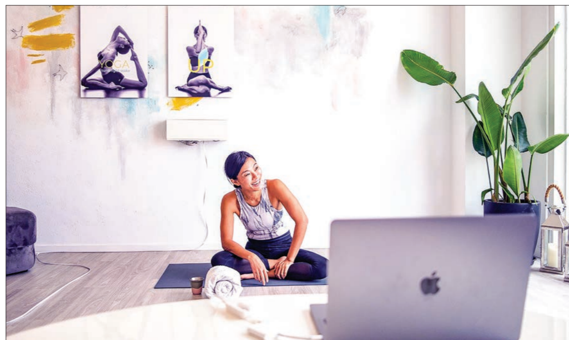
A yoga instructor concludes a live streamed yoga class via the Zoom online video conferencing platform in the midst of coronavirus. Introverted personality types and those used to home-working might actually welcome the opportunities this provides to live a healthier lifestyle, in terms of being able to prepare healthier food at home and take exercise during the day.

to mental health services for vulnerable people, including children and adolescents (72%), older adults (70%), and women requiring antenatal or postnatal services (61%).