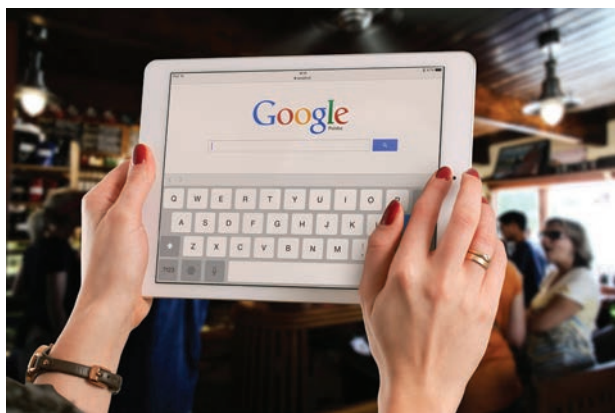
South Korea has launched an antitrust probe into Google over its plan to enforce its 30-per cent Play Store commission by disallowing any apps circumventing its payment system.