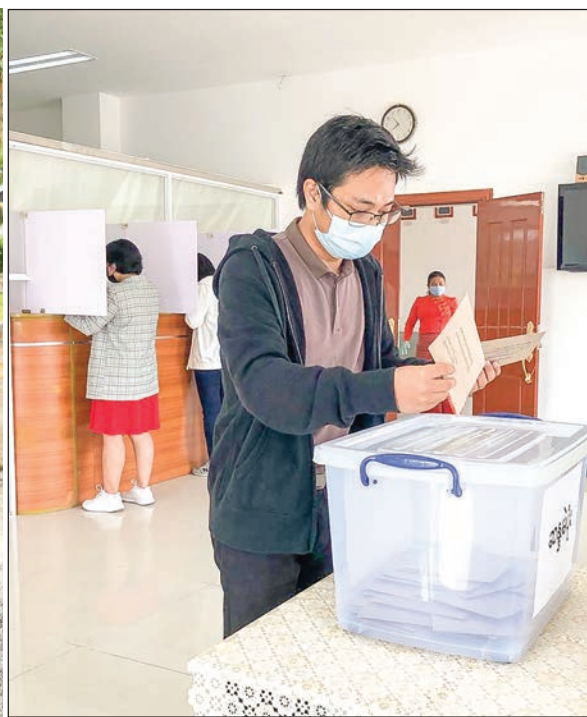
Myanmar eligible voters cast advance votes in Kunming city of China on 8 October.

mar Embassy in Manila arranged the voters in the Philippines to cast votes in Baguio and Los Banos as the voters faced difficulties to go to Manila due to COVID-19 restrictions.