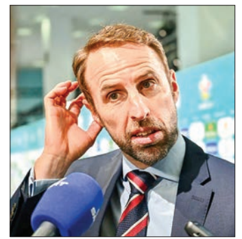
The head coach of England Gareth Southgate is pictured during the UEFA Euro 2020 football competition final draw in Bucharest on November 30, 2019.

"We do have an issue in terms of the Covid guidelines and making sure that any player