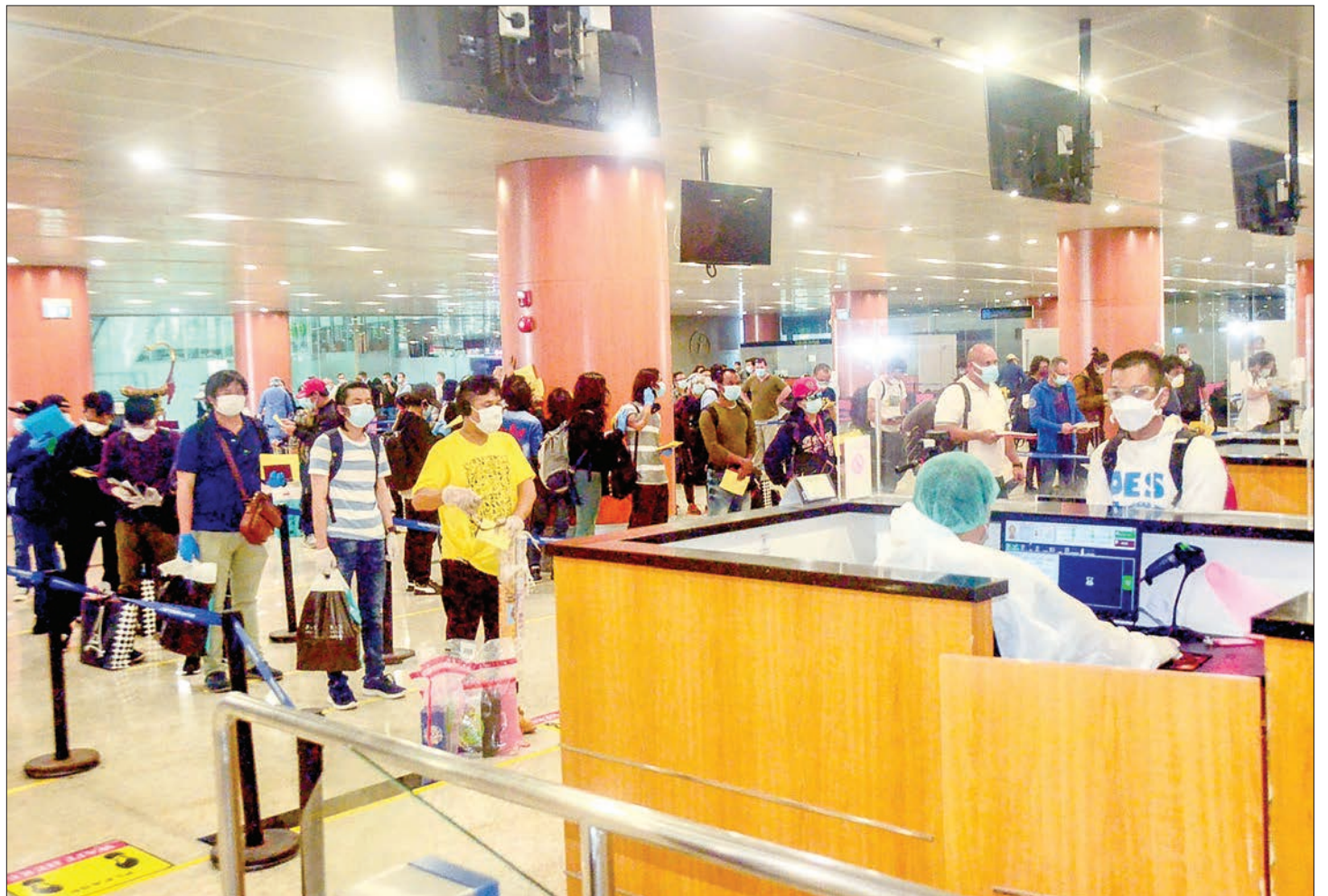
Myanmar returnees from abroad are queuing at immigration counters at Yangon International Airport on 8 October.