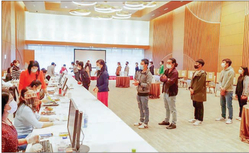
Myanmar citizens casting advance votes in Tokyo, Japan on 8 October.