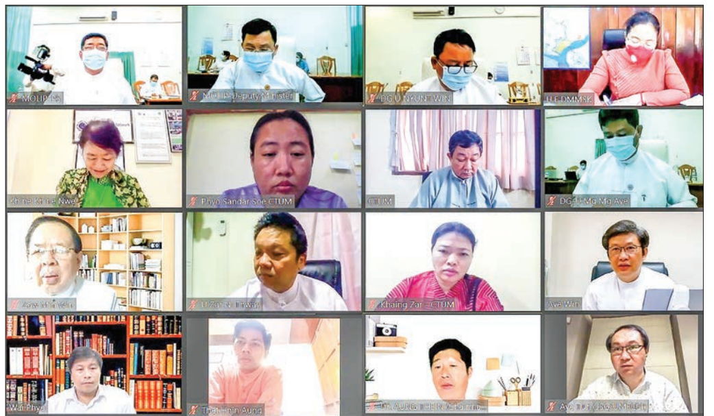
Union Minister U Thein Swe holds virtual meeting with representatives from labour organizations and UMFCCI officials on provision of social security benefits for insured workers on 8 October 2020.

A total of 1,832 factories and workplaces applied for the social security benefits between 24 September and 7 October via online web portal.