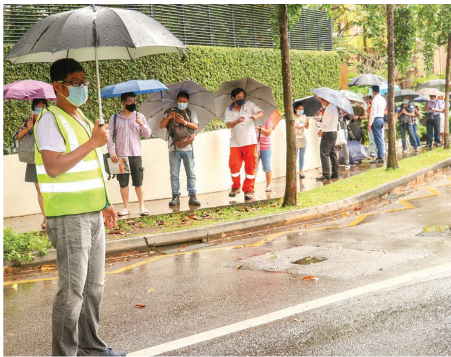
Myanmar people continue advance voting in Singapore on 8 October.