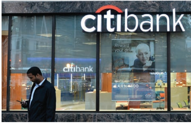
Citi will pay a $400 million civil penalty to settle US charges its risk management practices fell short of requirements.

The US Treasury's Office of the Comptroller of the Currency issued the fine, in parallel with a related action from the Federal Reserve citing