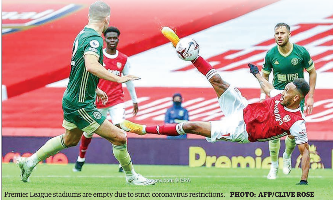
Premier League stadiums are empty due to strict coronavirus restrictions.

Masters said Premier League clubs were facing a number of tough challenges including the scrapping of the October return date for fans, expectations to help clubs lower down the pyramid and the frustration of seeing entertainment arenas close to football grounds reopen with no "roadmap" for the return of supporters. —AFP ■