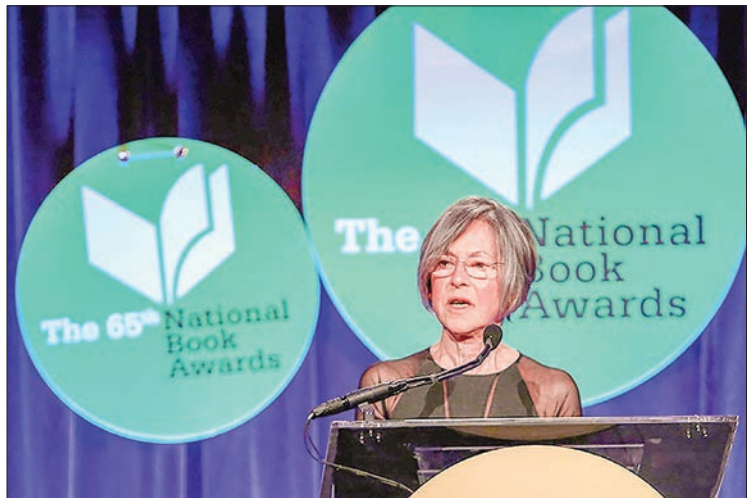
Louise Gluck gives a speech at the 2014 National Book Awards in New York City.

STOCKHOLM — The Nobel Literature Prize went Thursday to American poet Louise Gluck, known for themes of childhood and family life that draw inspiration from myths and classical motifs.