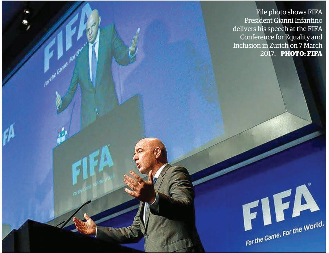
File photo shows FIFA President Gianni Infantino delivers his speech at the FIFA Conference for Equality and Inclusion in Zurich on 7 March 2017.