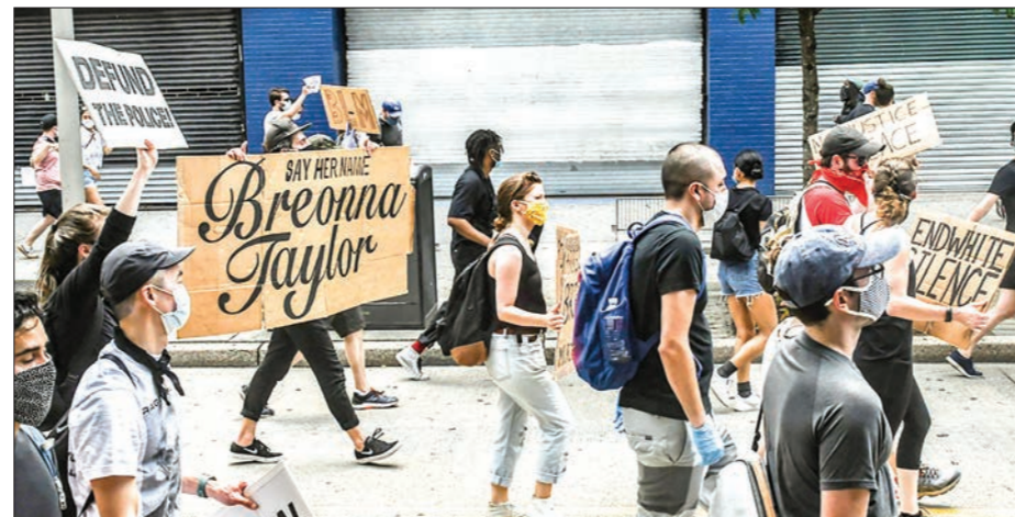
Demonstrators march down Fulton St. in front of closed businesses on June 6 in the Brooklyn borough of New York City, the US.

tries that lift lockdowns prematurely, when infections are still relatively high," the