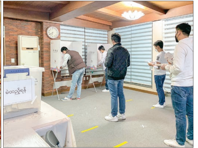
Myanmar voters queue for advance voting at Myanmar Embassy in Seoul, South Korea on 8 October.