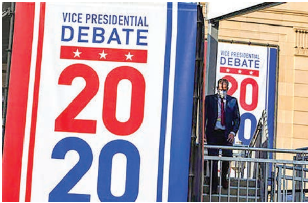
Preparations take place for the vice presidential debate in Kingsbury Hall at the University of Utah.

Facebook and other social networks have been tightening rules as they gear up for post-election