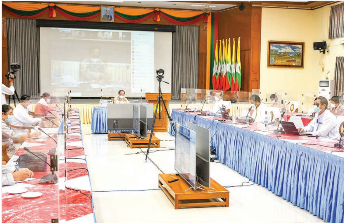
Union Minister Dr Myint Htwe presides over online meeting with health officials from Yangon Region.

Deputy Director-General Dr Tun Myint from the Public Health and Medical Services Department in Yangon Region discussed the importance of self-reporting by the persons with suspected symptoms in containment measures, the use of Rapid Antigen Diagnostic Test Kits, and quarantine