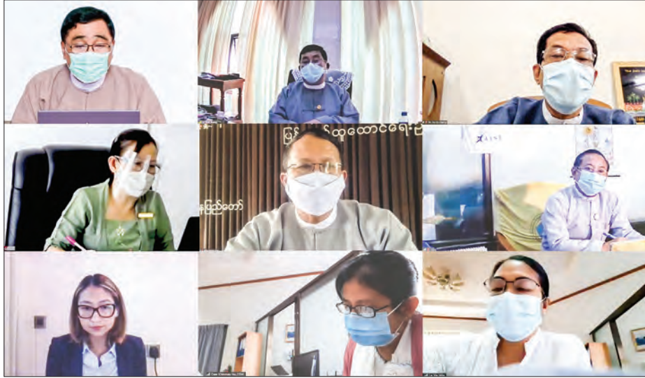
MSWRR Union Minister Dr Win Myat Aye joins the online discussion on promotion of 'civics and decent citizens' work plan yesterday.

THE Ministry of Social Welfare, Relief and Resettlement organized a videoconference yesterday to adopt a work plan for promoting 'civics and decent citizens' which is a priority of the National Strategic Plan for Youth Policy (2020-2024).