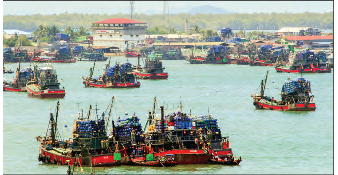
Ninety-five per cent of fish caught in the Taninthayi coast are delivered to Ranong market.