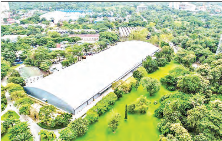
Yangon Convention Centre-YCC.