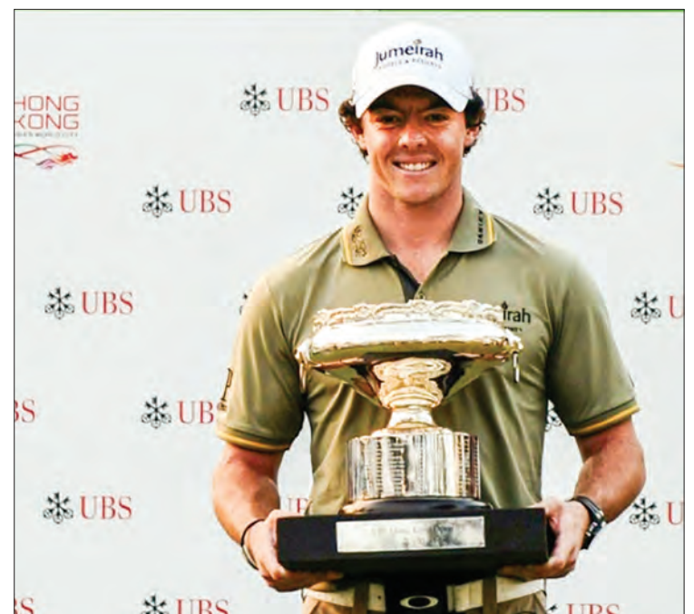
Illustrious winner: Rory McIlroy celebrates his 2011 Hong Kong Open victory. This year's 62nd edition has been postponed because of the coronavirus pandemic.

Originally pencilled in for November 26-29, no new dates were given, but organisers said they were "reviewing suitable options" and remained "fully committed to staging the 62nd edition of Hong Kong's longest running professional