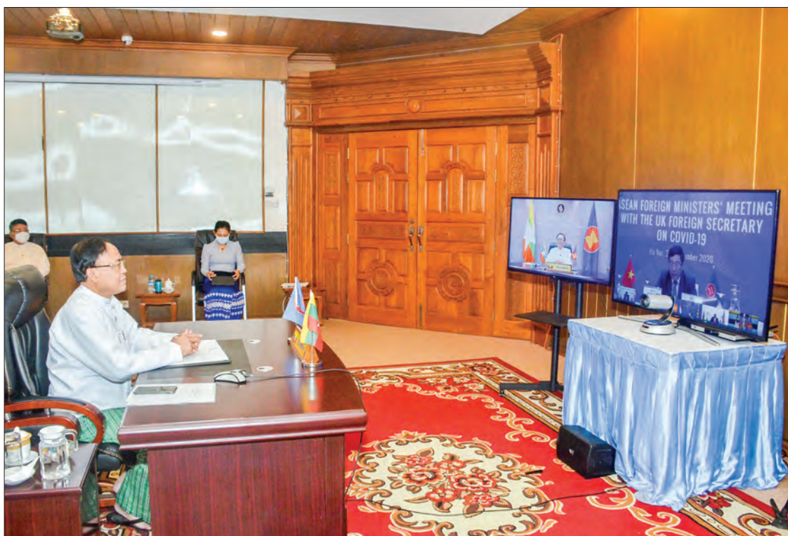
Union Minister U Kyaw Tin joins virtual meeting between ASEAN FMs and UK Foreign Secretary yesterday.

At the Meeting, the Ministers underlined the need for closer collaboration and coordinated efforts to ensure a strong global response to the COVID-19 pandemic. The Ministers committed to strengthening cooperation between ASEAN Member States and the UK in research, development, manufacture and distribution of the COVID-19 vaccines and treatments adhering to the objectives of efficiency, safety,