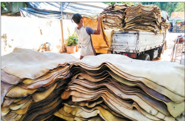
Myanmar's rubber price hit the highest record in 2011 with K1,800 per pound and $6,000 per tonne.

About 150,000 tonnes of rubber worth $186 million was exported in the FY2017-2018. Myanmar shipped over 200,000 tonnes of rubber, with an estimated value of $250 million, to external markets in the FY2018-2019, an increase of 50,000 tonnes which helped boost earnings by over $60 million compared to the year-ago period, according to data released by the Ministry of Commerce.—Ko Htet (Translated by Ei Myat Mon)