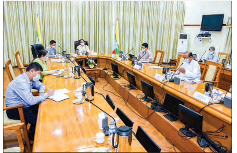
Union Minister Dr Than Myint stresses the importance of cooperation among stakeholders in rubber industry at the Zoom meeting yesterday.