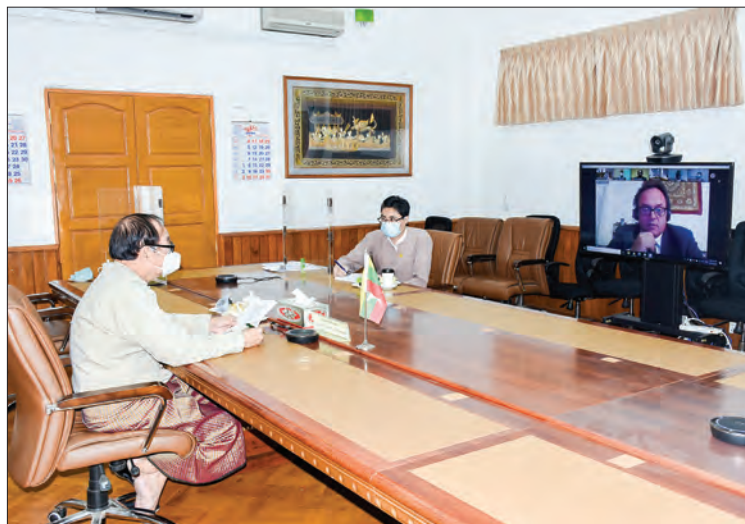
Union Minister Dr Myint Htwe takes part in the online Myanmar healthcare discussion with UNOPS.