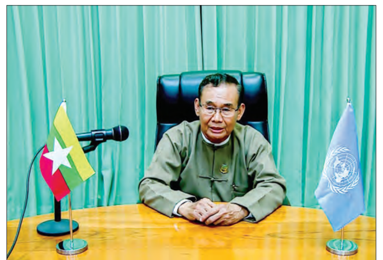
Union Minister U Ohn Win makes a video-recorded statement to UN Summit on Biodiversity.