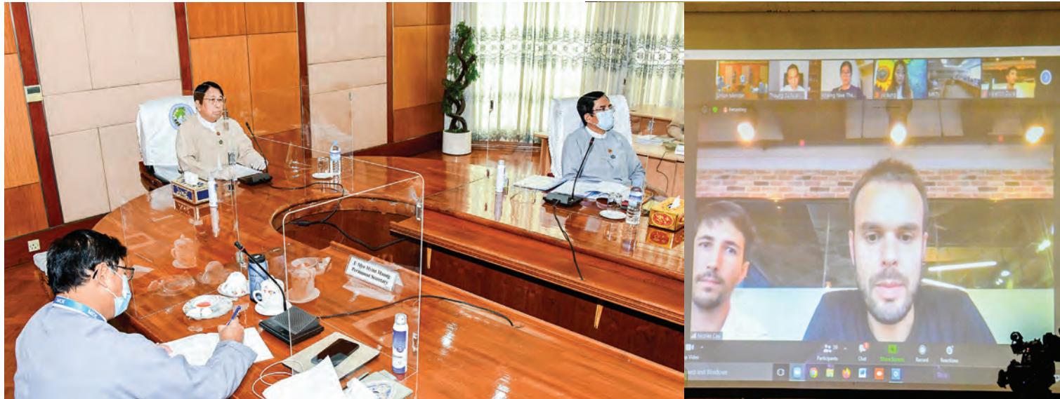
Modern public communication workshop in progress.

INFORMATION Matrix and New York-based Sprinklr jointly organized a virtual demonstration workshop on modern mass communication technology yesterday afternoon via videoconferencing.