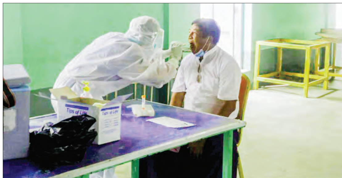
The Health Department is taking a nasopharyngeal swab and oropharyngeal swab from the drivers and conductors to issue the health certificates.

TO enable convenient running of the trucks in Meiktila Township, the Public Health Department is detecting COVID-19 tests to truck drivers and conductors beginning from 30 September in Aung Mingalar Hall, Meiktila.