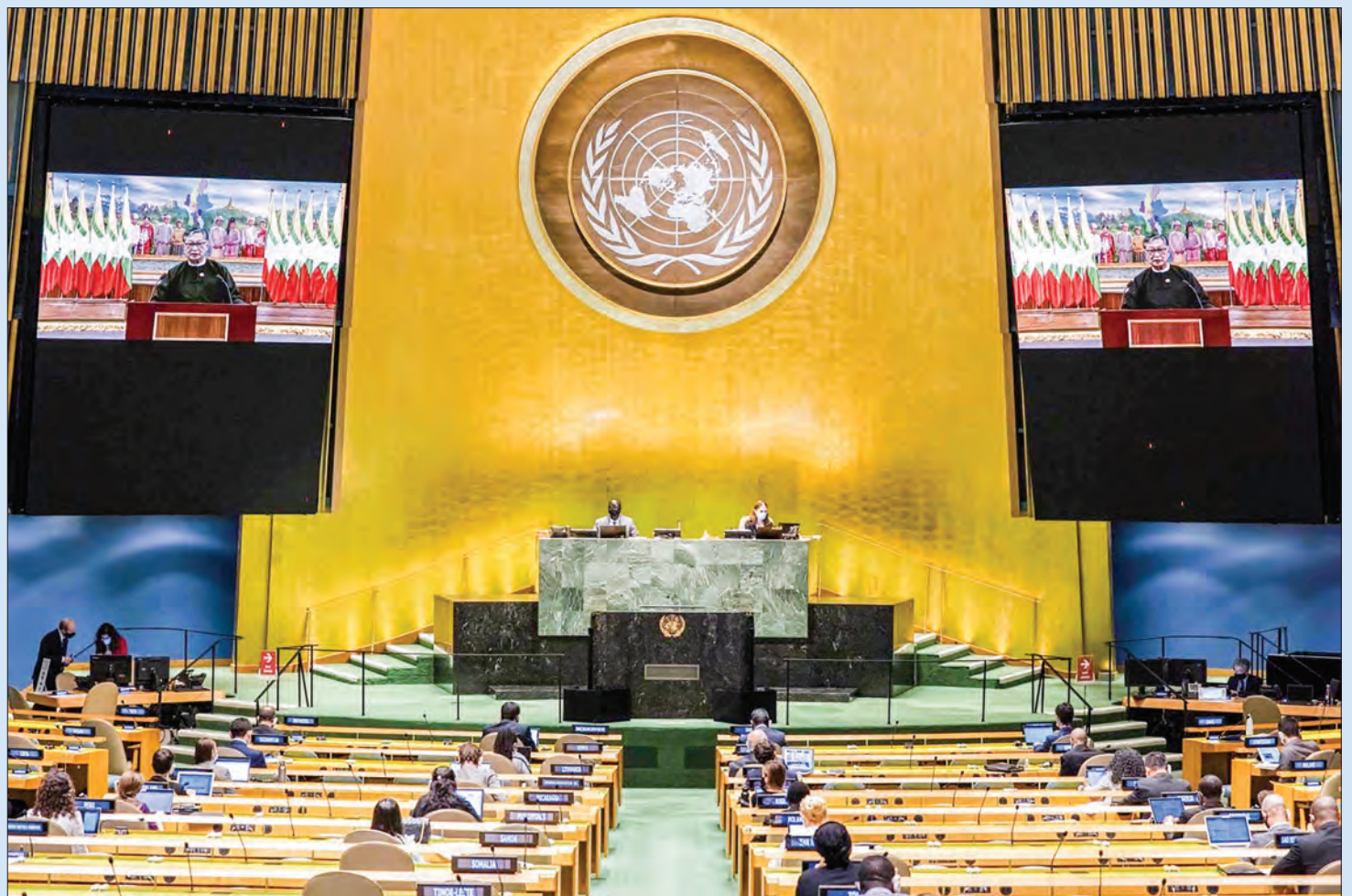
Union Minister U Kyaw Tint Swe delivers the statement at high-level General Debate of the 75 th Session of the United Nations General Assembly held on 29 September 2020.

He apprised the Assembly of the Myanmar Government's efforts in fighting against the pandemic adhering to the principle of "leaving no one behind", bringing sustainable peace and national reconciliation, genuine democracy, and inclusive development for all peoples in Myanmar and addressing the complex situation in Rakhine State including the issue of accountability in line with do-