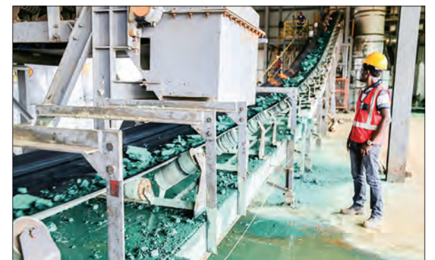
Backers of the 'supply chain law' want to make sure items like cobalt for electric car batteries respect human rights and environmental standards.

BERLIN — When German carmakers seek cobalt from Congolese mines or when a chocolatier sources cocoa beans from Ghana, they may soon no longer be able to hide behind their suppliers if it turns out that the producers are using child labour or flouting environmental standards.