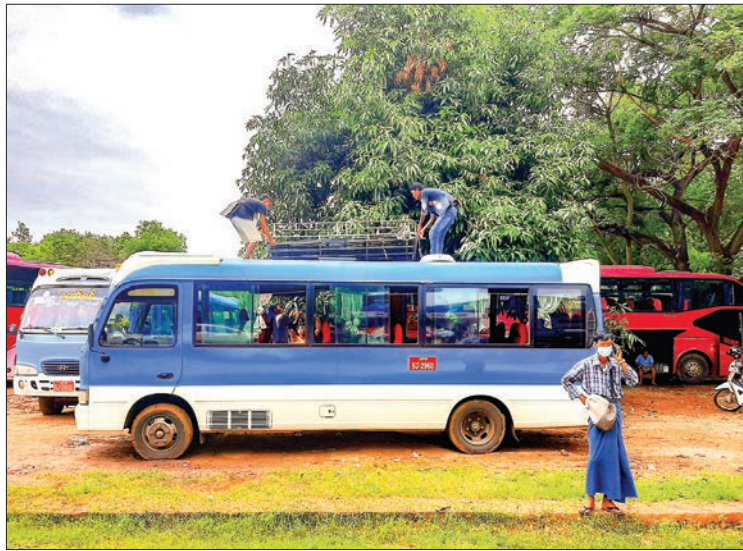
A man talks on his mobile phone with empty express buses in the background.

"Although the express buses are operating between Yangon and Magway as usual, Magway-Yangon trip is operating with only three or four passengers on board. Last week, the number of passengers onboard the express had declined. There are only a few passengers who are travelling only in cases of emergency. When the bus lines were closed in the first wave of COVID-19, the passengers