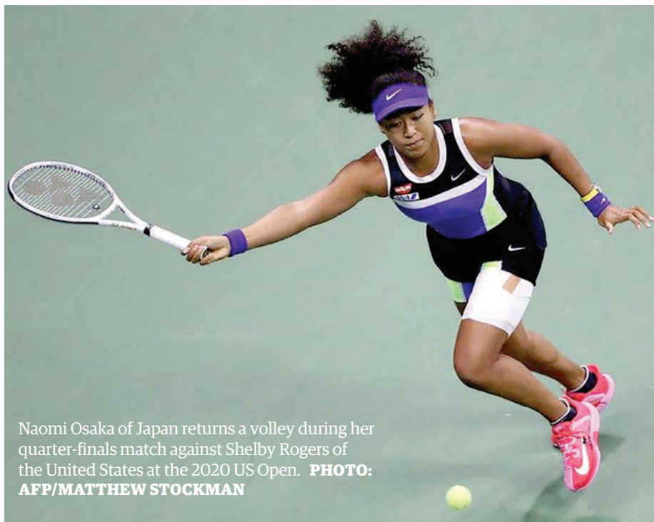
Naomi Osaka of Japan returns a volley during her quarter-finals match against Shelby Rogers of the United States at the 2020 US Open.

Osaka said a defeat to Rogers in 2017 on clay in Charleston had left "a really bad aftertaste in my mouth." ■