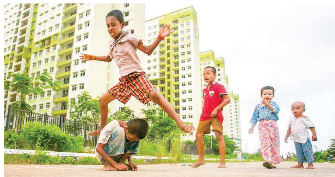
This file photo shows children playing near apartments on the outskirts of Yangon.

Neo-natal care in developing nations is relatively inexpensive and can profoundly affect child survival rates.