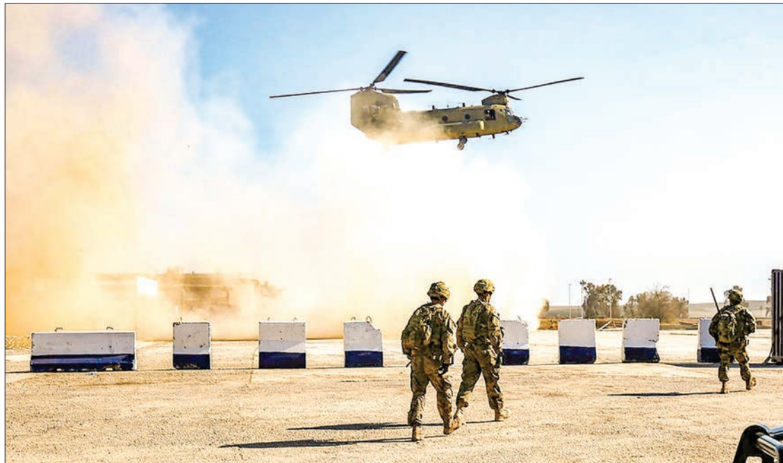
In this file photo taken on Feb 22, 2017 US troops walk as a US Army C-47 Chinook helicopter flies over the village of Oreij, south of Mosul. US president Donald Trump will announce further troop withdrawals from Iraq and Afghanistan in the next few days, a senior administration official said.

By late 2018, there were an estimated 5,200 American troops