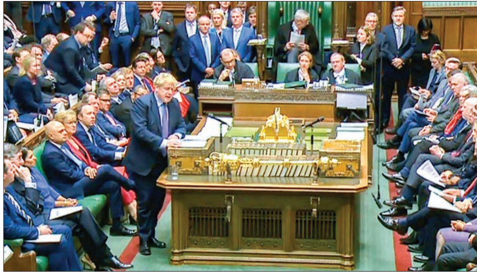
Critics accuse the British government of engaging in bad-faith diversionary tactics as it battles Brussels on key issues.

LONDON—Britain readied on Wednesday to intentionally breach its EU divorce treaty with new legislation that critics warned would undermine its global standing and any hopes for an orderly exit out of the world's biggest single market.