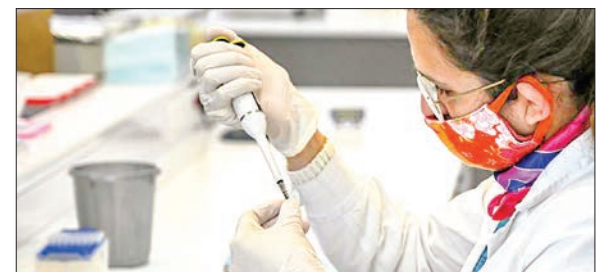
Indian pharmaceutical giant Serum Institute of India (SII) on Wednesday clarified that testing of the possible vaccine candidate in India is ongoing and has not faced any issue so far. A scientist works over an experimental coronavirus vaccine in a laboratory.

On Tuesday (local time), UK-based biopharma giant AstraZeneca has said that the phase 3 testing of its COVID-19 vaccine being developed with Oxford University has been put on hold, due to a suspected serious adverse reaction in a participant in the United Kingdom.—ANI ■