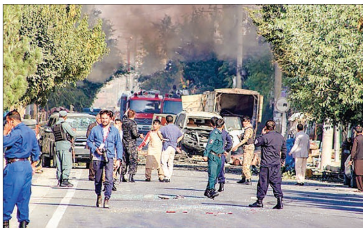
Damaged vehicles are seen as smoke rises following a bomb attack targeting Afghan Vice President Amrullah Saleh's convoy in Kabul, Afghanistan on September 09, 2020.

The vice president sustained light injuries to his face and hand but survived the attack. No group immediately claimed responsibility for the incident, with the Taliban in a statement denying their involvement.