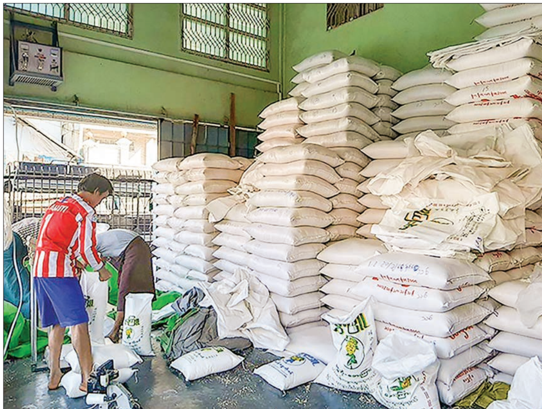
Workers refill reserved rice into smaller packaging for sale.