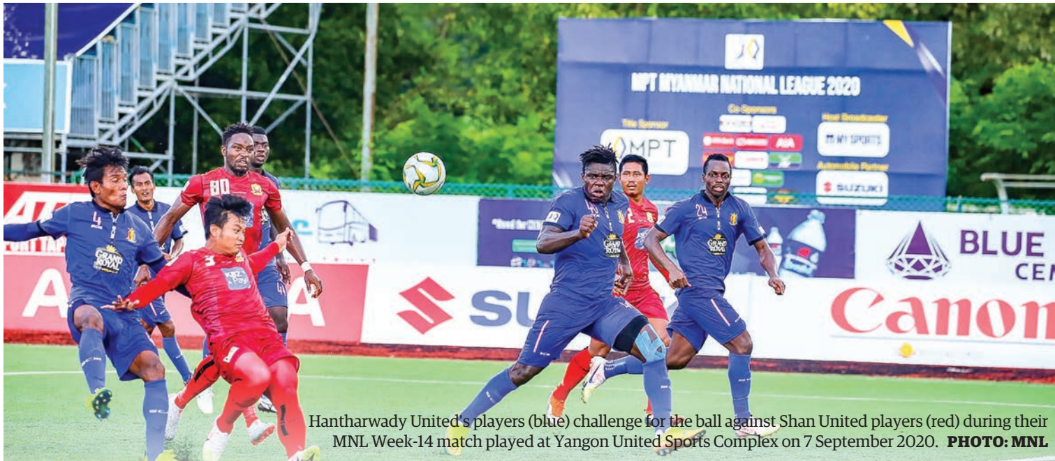
Hantharwady United's players (blue) challenge for the ball against Shan United players (red) during their MNL Week-14 match played at Yangon United Sports Complex on 7 September 2020.