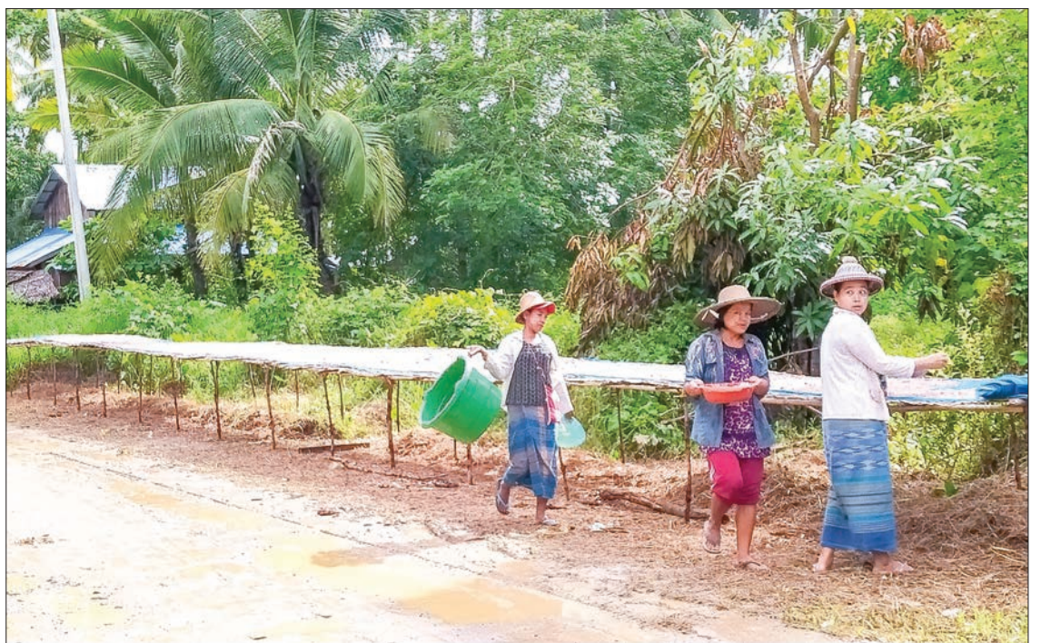
Local residents lay out fish to dry under the sun in Shwe Taung Yan beach.

Fish paste and dried fish are essential foodstuffs in Myanmar. They are manufactured in the whole of Myanmar. The fish paste and dried fish are distributed to all parts of the country. Last year, the fish paste and dried fish shops from Chaungtha beach demanded the fish paste at a high price from the fish past making makers. This year, the shops from Chaungtha beach were closed temporarily because of COVID-19, and so they are