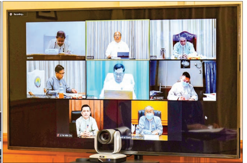
Union Minister U Thaung Tun addresses a videoconference on COVID-19's economic impact on Myanmar.

K100 billion will be provided by the State to affected enterprises in the agriculture, livestock, and fisheries and food processing sectors, agencies dealing with labour recruitment, vocational