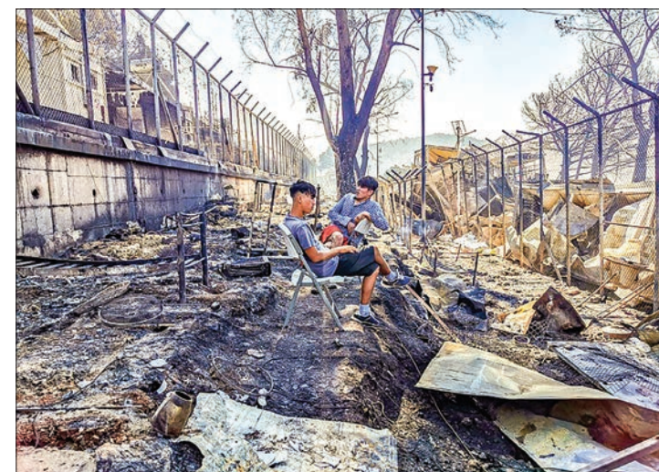
By morning, dozens of people were milling around among charred containers, some carrying away belongings, others snapping cellphone pictures.

EU home affairs commissioner Ylva Johansson said the bloc would finance “the immediate transfer and accommodation on the mainland of the camp’s remaining 400 unaccompanied children and teenagers.”—AFP ■