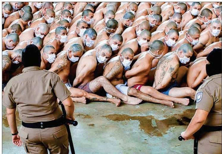
Members of the “Mara 18” and “MS-13” gangs at El Salvador’s Izalco maximum security prison in September 2020.

SAN SALVADOR—Prosecutors in El Salvador are investigating alleged secret negotiations between government officials and a prominent organized crime gang that has long terrorized the Central American nation.