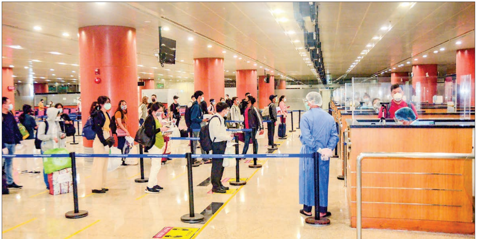
Myanmar citizens line up under COVID-19 regulations to pass immigration control at Yangon International Airport.

anmar citizens who were stranded in foreign countries by relief flights and chartered flights in accordance with the instructions from National-Level Central Committee on Coronavirus Disease 2019 (COVID-19), the Ministry of Foreign Affairs cooperated with the relevant ministries and Myanmar embassies from respective countries. —MNA (Translated by Maung Maung Swe)