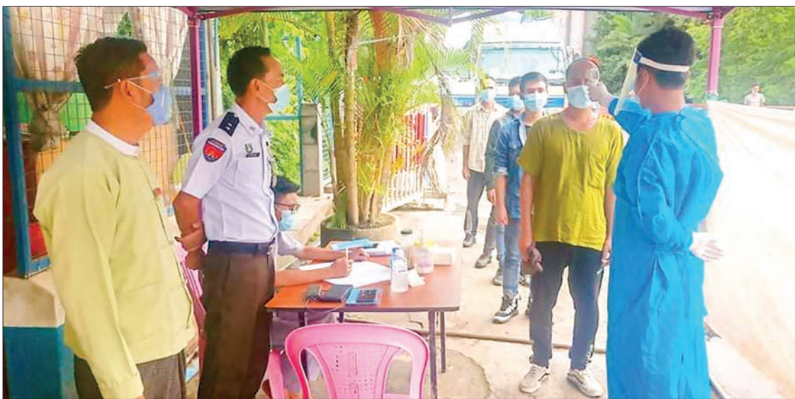
Officials are conducting medical tests to Myanmar returnees from China in Chinshwehaw border town.