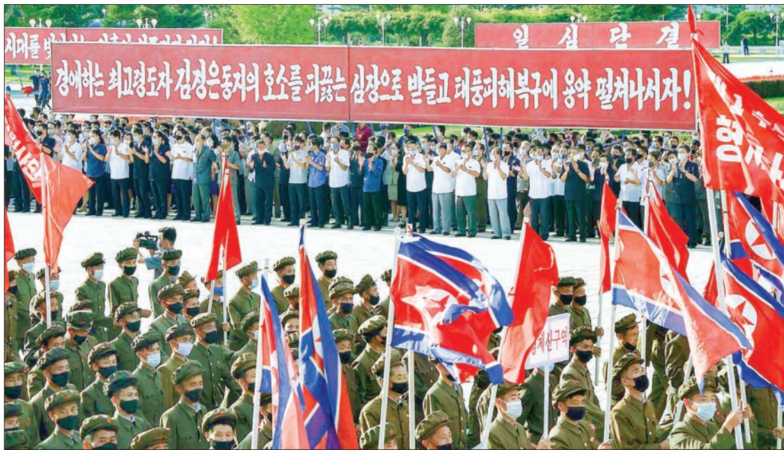
Political party members rally in Pyongyang on Sept. 8, 2020, in support of the recovery efforts from typhoon damage in North Korea.

BEIJING—North Korea on Wednesday marked the 72nd anniversary of its founding, at a time when the nation's economy has been apparently languishing against a backdrop of the aftermath of the new coronavirus pandemic and natural disasters.