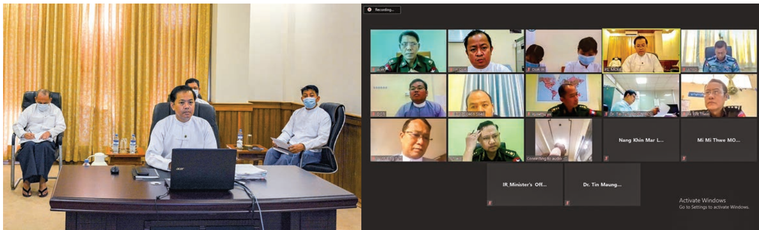
Committee on Preventing Grave Violence against Children in Armed Conflicts holds an videoconference on 9 September.

THE Committee on Preventing Grave Violence against Children in Armed Conflicts held its 7 th coordination meeting via videoconferencing yesterday morning.