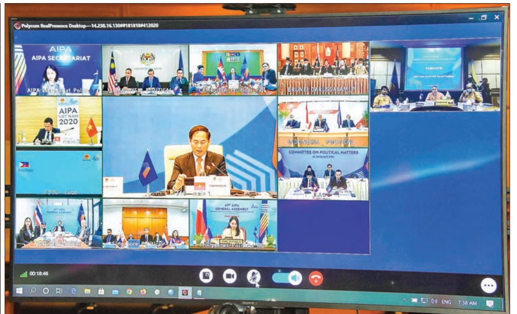
Parliamentary delegates from Myanmar attend meeting of 41 st General Assembly of the ASEAN Inter-Parliamentary Assembly through videoconferencing from Nay Pyi Taw.

THE 41 st General Assembly of the ASEAN Inter-Parliamentary Assembly (AIPA 41) discussed a series of important issues during its second working day yesterday.