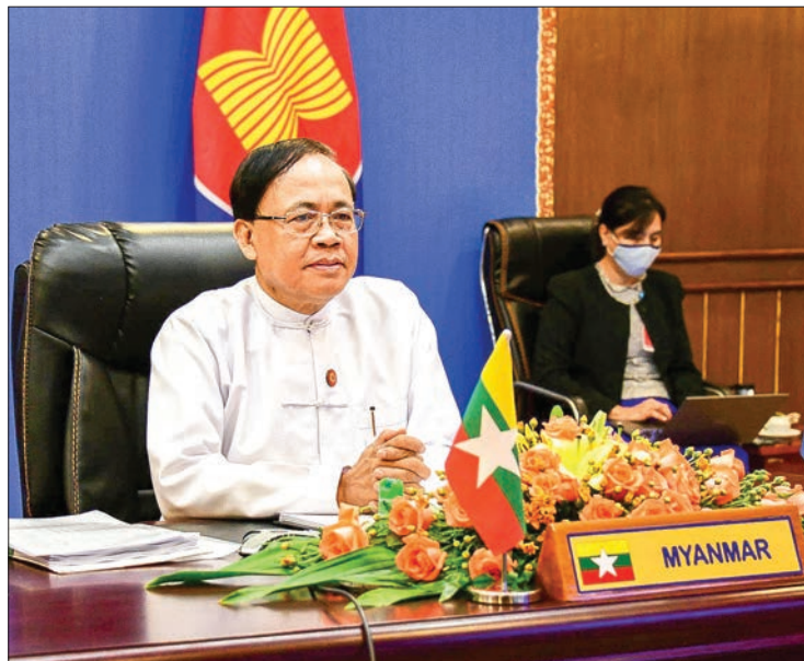
Union Minister U Kyaw Tin participates in the 53 rd ASEAN Foreign Ministers' Meeting via videoconferencing from Nay Pyi Taw.

The 53 rd ASEAN Foreign Ministers' Meeting was chaired by Mr Pham Binh Minh, Deputy Prime Minister and Minister for Foreign Affairs and attended by ASEAN Ministers and the Secretary-General of ASEAN. At the Meeting, the Ministers discussed and exchanged views on ASEAN community building, follow up to the 36 th ASEAN Summit and ASEAN 2020's priorities, applications of external partners to accede to the Trea-