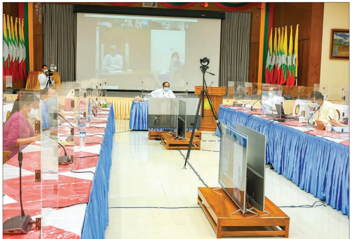
Union Minister Dr Myint Htwe presides over meeting for controlling spread of COVID-19 on 9 September.

The supplies must reach their destinations on time and there must be communication to confirm whether they have arrived or not. Videoconferences between medical profession-