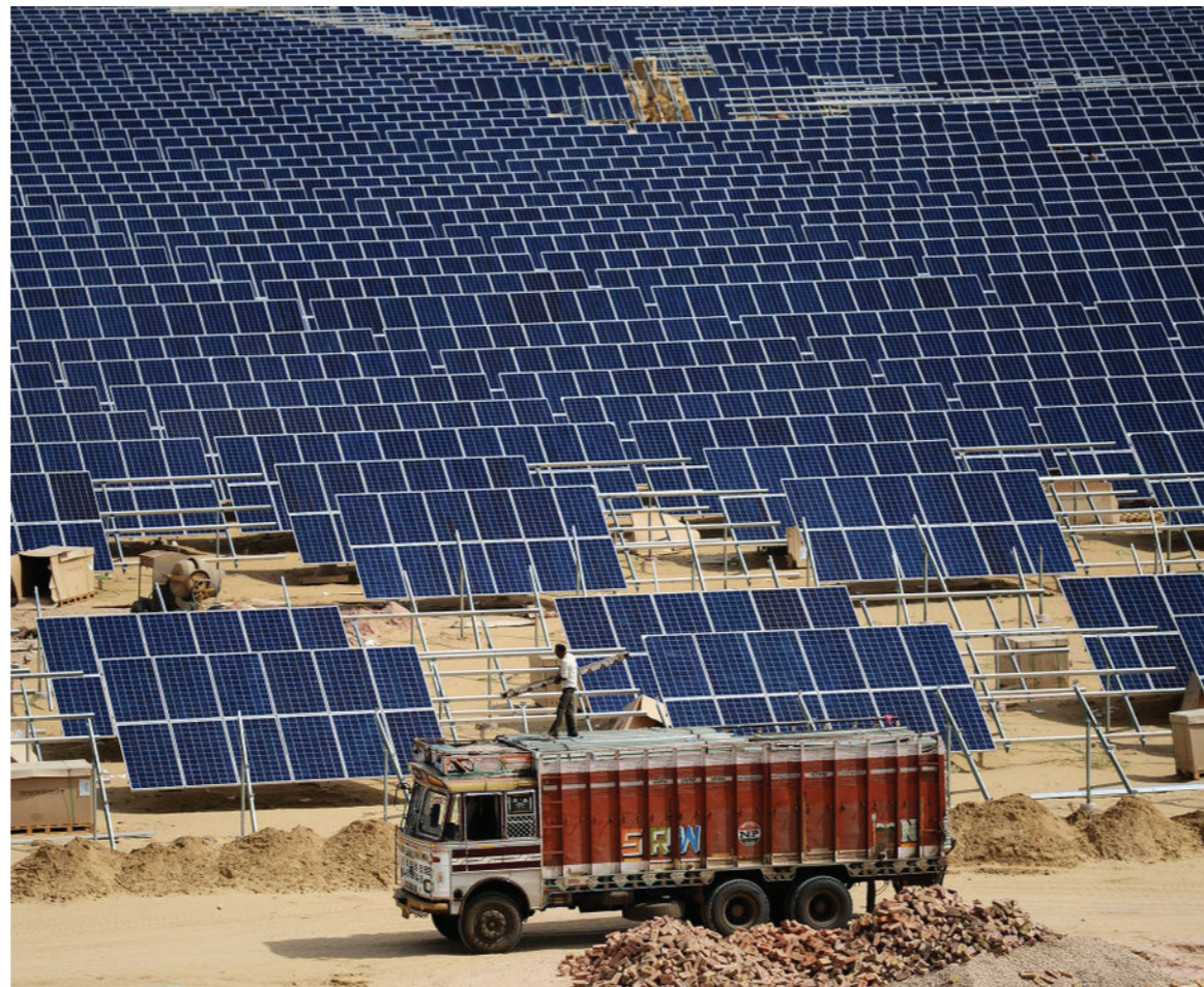
Bhadla Solar Park is the world's largest solar park located in India which is spread over a total area of 14,000 acres in Bhadla, Phalodi tehsil, Jodhpur district, Rajasthan, India. The park has total capacity of 2,245 MW.