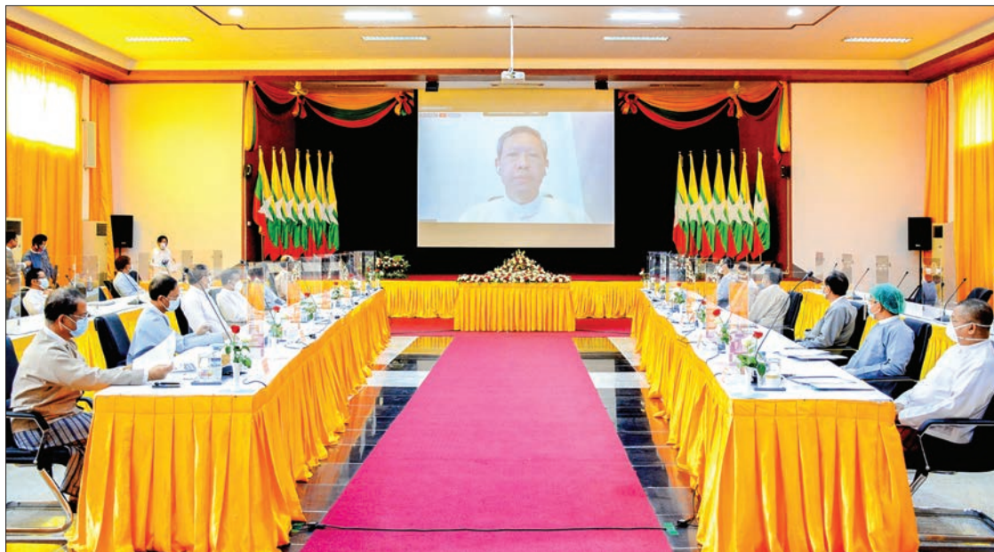
Ministry of Education observes International Literacy Day 2020 online from Nay Pyi Taw on 8 September 2020.

The reviews of UN educational organizations stated that most of the schools all over the world and other educational facilities were closed and it affected about 1.6 billion of students and about 63 million of teachers from more than 190 countries. So, it is the largest loss of learning op-