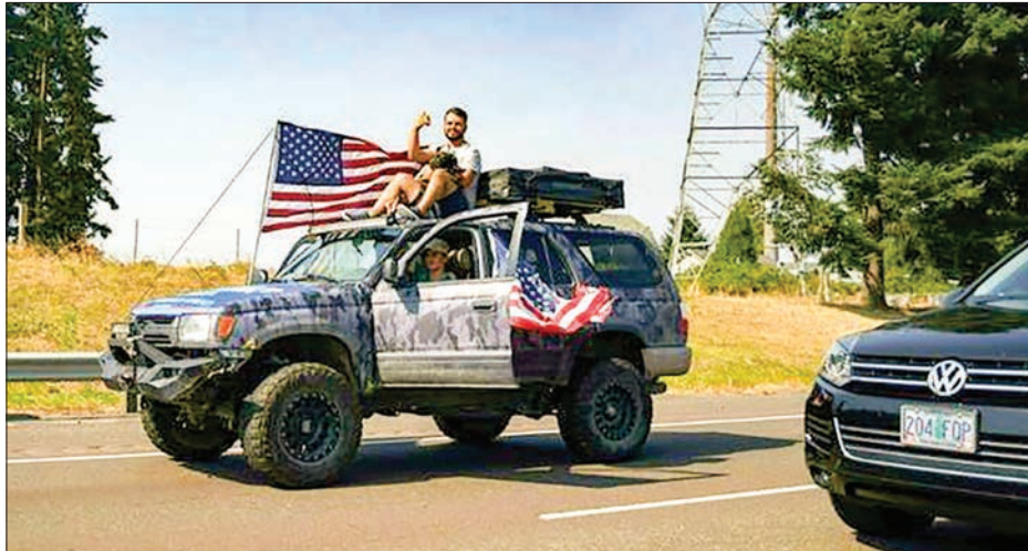
About 300 cars, including many massive pickup trucks, then took to the roads surrounding Oregon City, some 30 miles (50 kilometres) from Portland, before dispersing.

About 300 cars, including many massive pickup trucks, then took to the roads surrounding Oregon City, some 30 miles (50 kilometres) from Portland, before dispersing. But 150 to 200 people, led by members of the far-right Proud Boys militia, which advocates white supremacy, decided