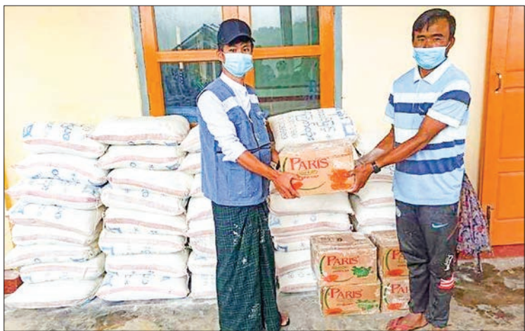
An MoSWRR official (L) provides relief items to a local in Kachin State on 8 September 2020.

THE Ministry of Social Welfare, Relief and Resettlement is providing medical and relief items to the IDP camps in Kachin and Rakhine states for prevention of COVID-19 transmission.