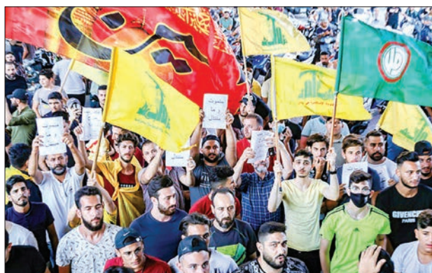
Lebanese movement Hezbollah is a major political actor with a broad support base in the country's Shiite community

The 44-year-old anti-corruption campaigner and one of President Vladimir Putin's fiercest critics, fell ill on a domestic flight last month and was treated in a Siberian hospital before being evacuated to Berlin.—AFP ■