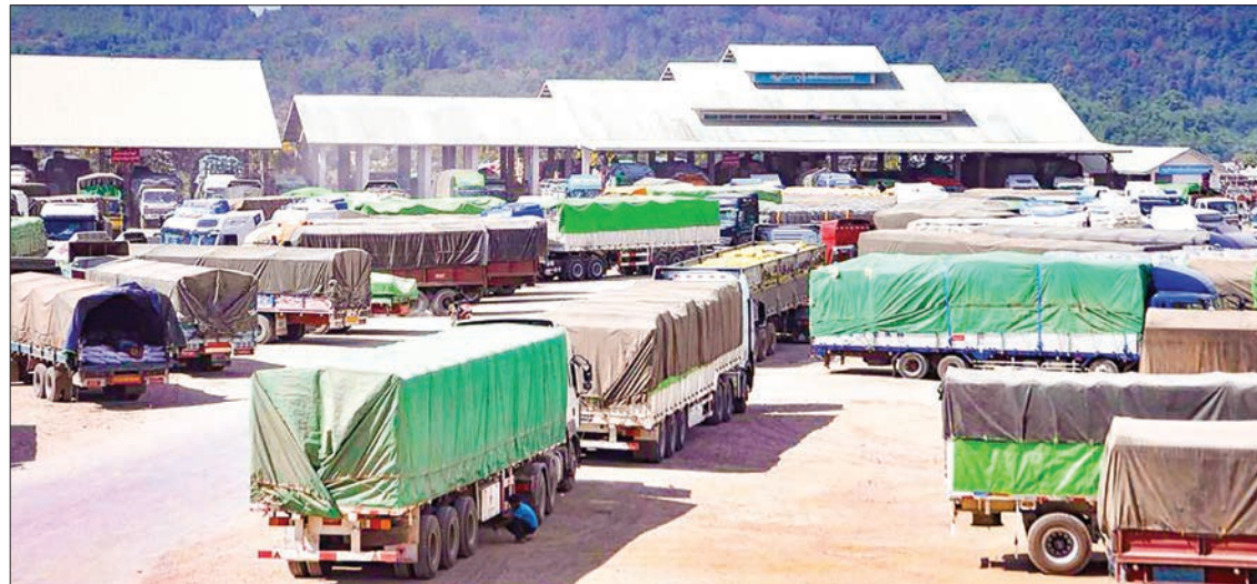
Lorries are seen at Muse 105th Mile Trade Zone.

The two countries are making efforts to set up more border economic cooperation zones and promote border trade. Myanmar’s MOC is trying to boost exports of rice, broken rice, agro-products, fruits and fisheries to China through diplomatic negotiations. After a series of negotiation between Myanmar and China, the General Administration of Customs of the People’s Republic of China (GACC) granted licences to 43 Myanmar companies on 10 July 2020 to export the rice to China through a legitimate trade channel. Myanmar exports rice, sugar, pulses, sesame seeds, corn, dried tea leaves, fishery products, minerals, and animal products to China. At the same time, it imports agricultural machinery, electrical appliances, iron and steel-related materials, raw industrial goods, and consumer goods from the neighbouring country. —GNLM (Translated by Ei Myat Mon) ■