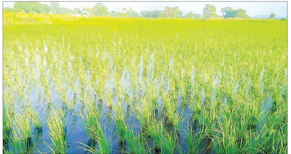
Monsoon paddy field in Mandalay is seen on 27 August 2020.

Mandalay region grows Ayeyarmin, Pawsanyin, Manaw-