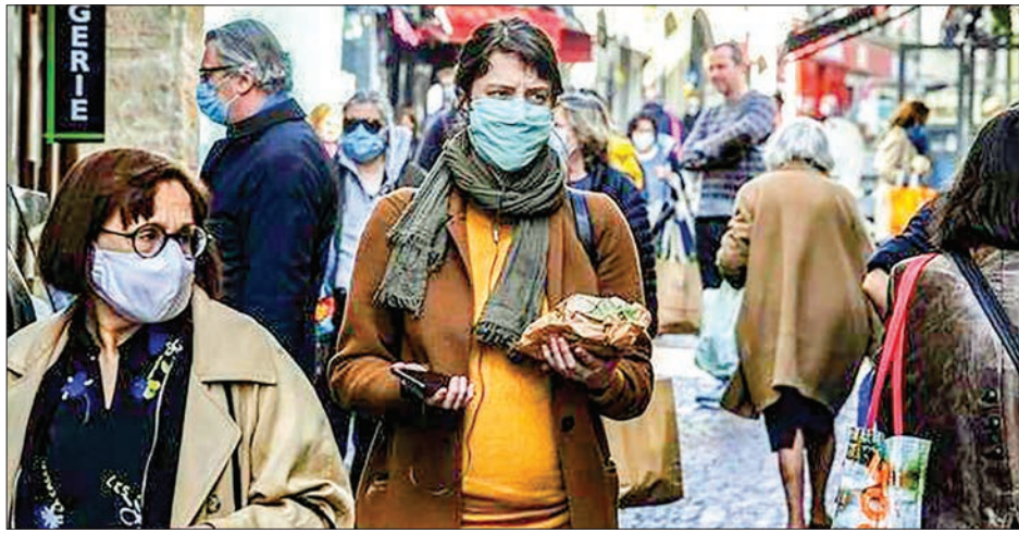
What if consumer spending fails to recover?

PARIS—France's economy, pushed into a bruising recession by the coronavirus crisis, is poised to bounce back now that lockdown measures are lifted but will still contract over the year as a whole, official data showed Tuesday. France's gross domestic product, which shrunk by a record 13.8 per cent in the second quarter, is forecast to grow 17 per cent in the