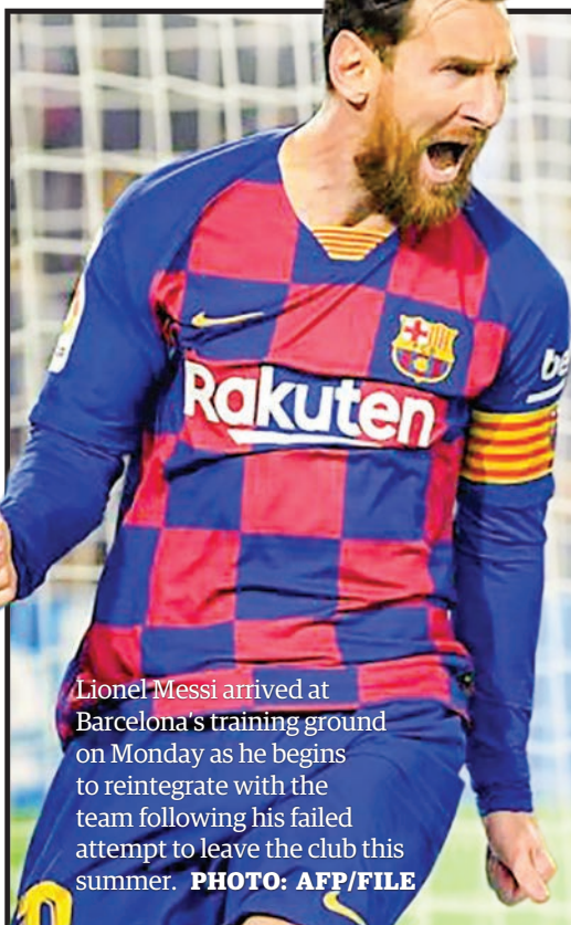
Lionel Messi arrived at Barcelona’s training ground on Monday as he begins to reintegrate with the team following his failed attempt to leave the club this summer.

Luis Suarez, Messi’s best friend and neighbour, as well as Arturo Vidal, are expected to join Juventus and Inter Milan respectively.—AFP ■