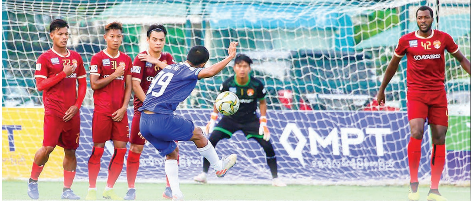
A Yadanarbon FC player (blue) makes a free-kick during the soccer match against Ayeyawady United at the Yangon United Sports Complex on 8 September 2020.

“He made that putt, which I didn’t,” said Schauffele, who bogeyed the 13th. “That was a pinnacle moment, I think.”—AFP ■