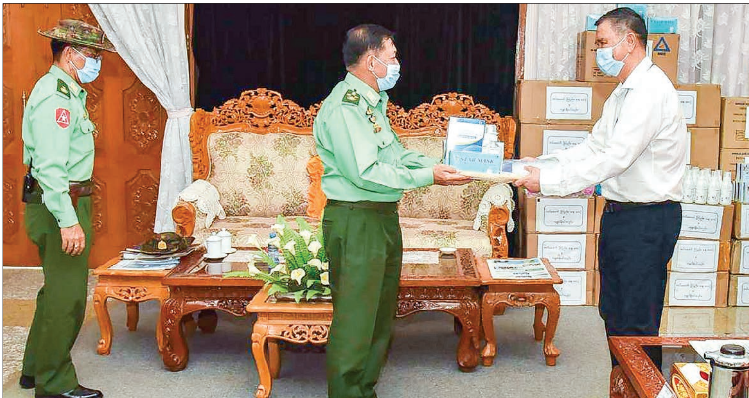
Senior General Min Aung Hlaing presents medical supplies for the Mongla hospital at the Golden Triangle meeting hall of Triangle Region Command on 7 September 2020.

At the meetings, the Senior General gave cash awards to