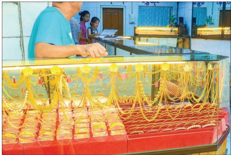
(FILES) Gold jewellery are displayed at a shop in Yangon on 11 April 2017.