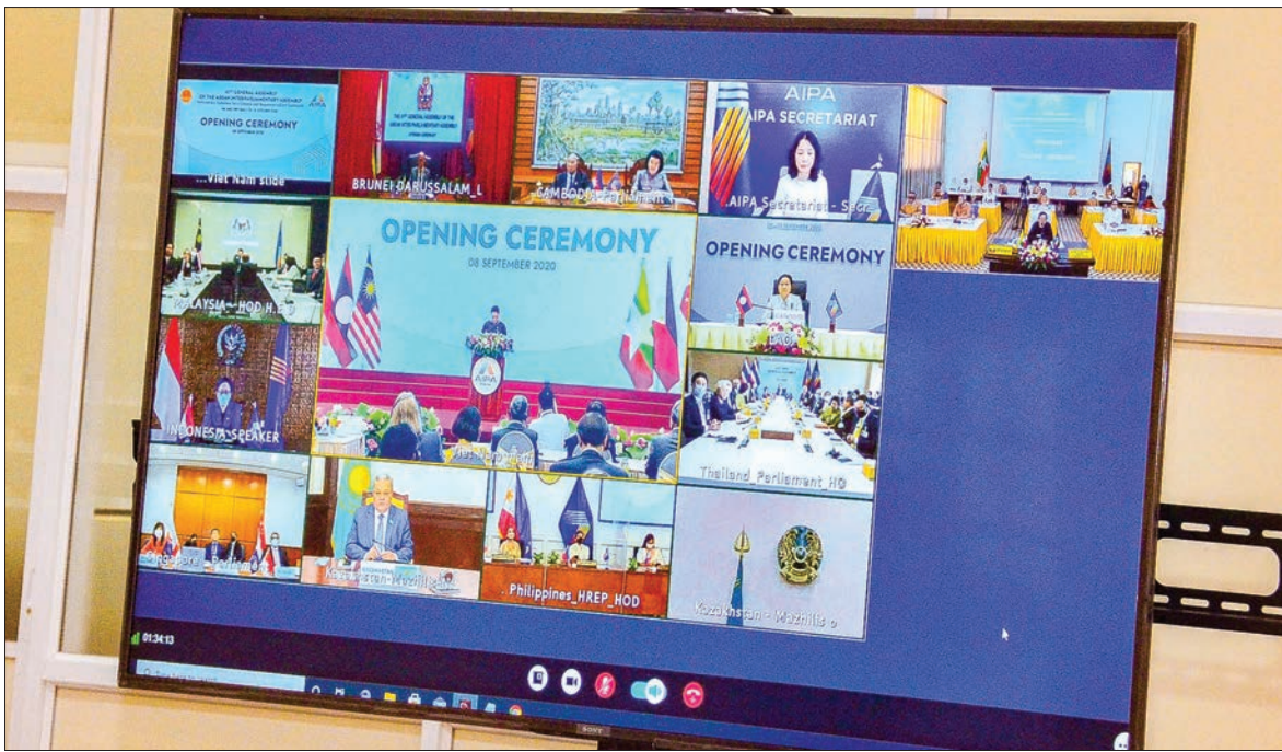
Pyidaungsu Hluttaw Speaker U T Khun Myat participates in 41st General Assembly of the ASEAN Inter-Parliamentary Assembly via videoconference on 8 September 2020.

P yidaungsu Hluttaw and Pyithu Hluttaw Speaker U T Khun Myat led Myanmar parliamentary representatives in joining the virtual opening ceremony of 41st Gen-