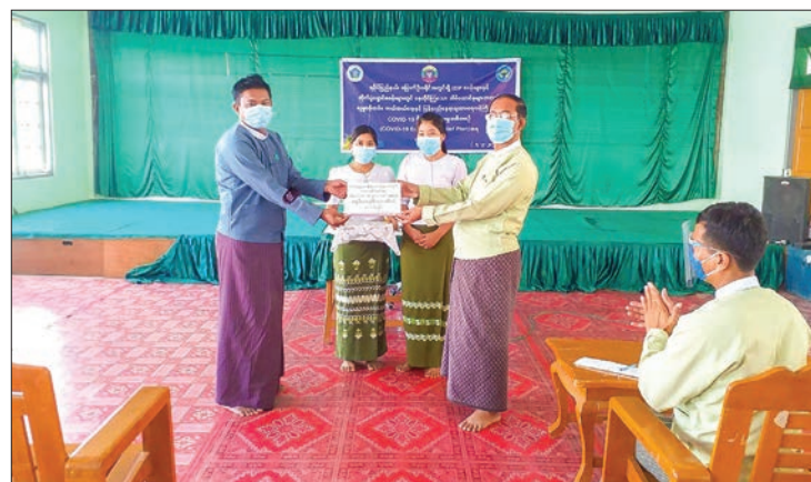
An MoSWRR official (L) provides CERP cash assistance for IDPs in MraukU, Rakhine State on 7 September 2020.

Under this plan, each family received K40,000 to be able to purchase five basic foodstuffs. MraukU district authorities handed over K184,600,000 for 4,615 families in temporary IDP camps at the township office of General Administration Department on 7 September.