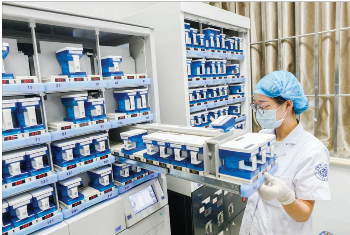
A pharmacist of the inpatient department of Zhuji People's Hospital adds medicine into an automatic medicine packing machine in Zhuji, east China's Zhejiang Province, Aug. 8, 2018.