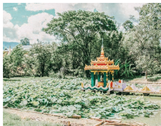
There is a lotus pond before reaching Little Bagan. Maha Nanda Kantha Monastery near the lotus pond is glorious.