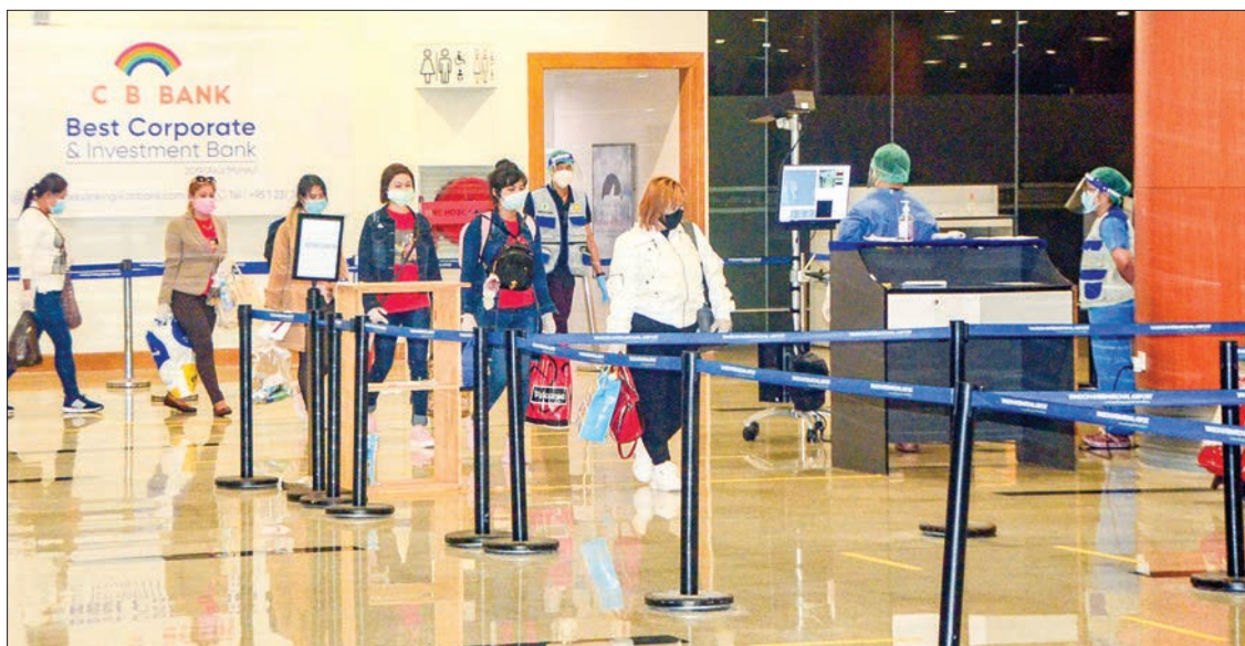
Myanmar nationals queuing for their immigration processes at Yangon International Airport on 6 September, 2020.

Elections are the foundation of democracy.