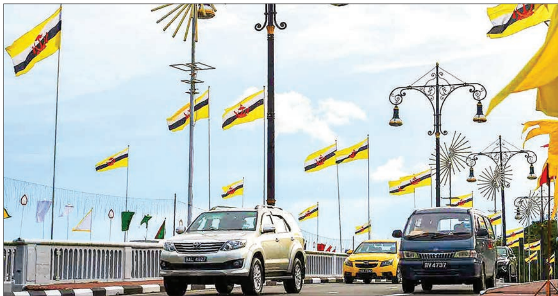
This file photo shows Brunei's national flags flown along a street in Bandar Seri Begawan.

The report said the study was made out of 250 nations and territories in a survey that looked into quarantine efficiency, monitoring and detection as well