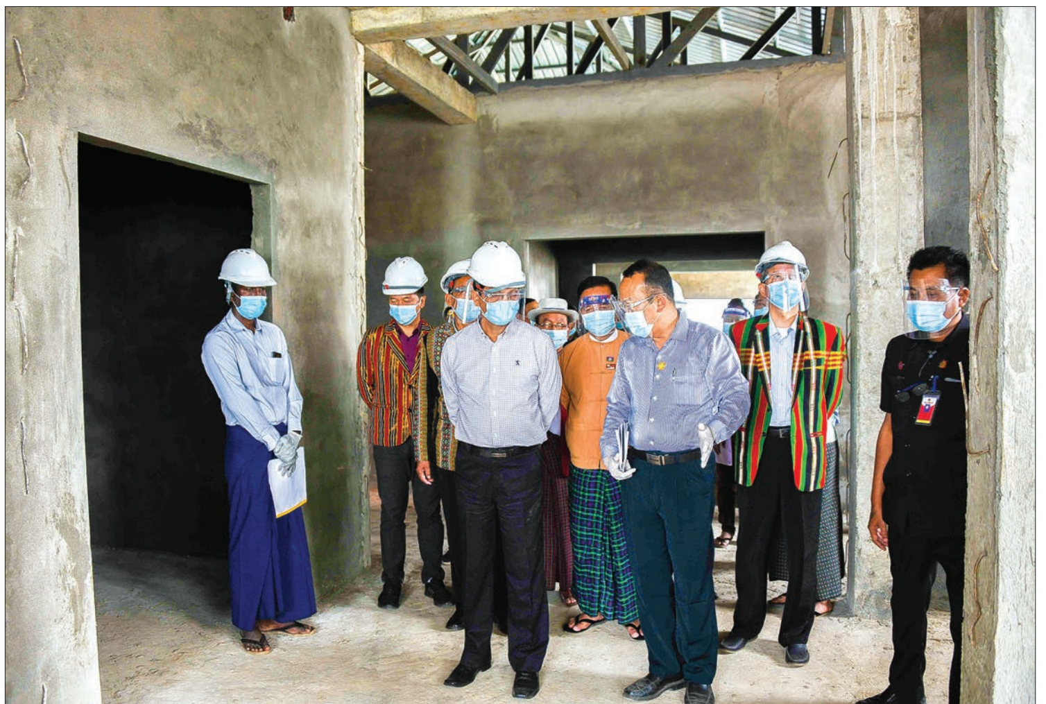
Vice President U Henry Van Thio inspects construction of extended building for the Rezwa Station Hospital on 5 September.