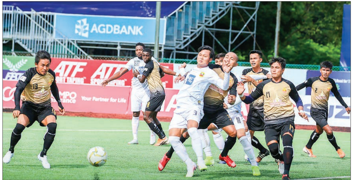
Shan United players (white) counter the ball with Rakhine United's players (brown) during the Week-13 MNL match played at Yangon United Sports Complex on 4 September 2020.

On 8 September, everyone will see another derby match: Yadanarbon FC vs Ayeyawady United scheduled to play at Thu-