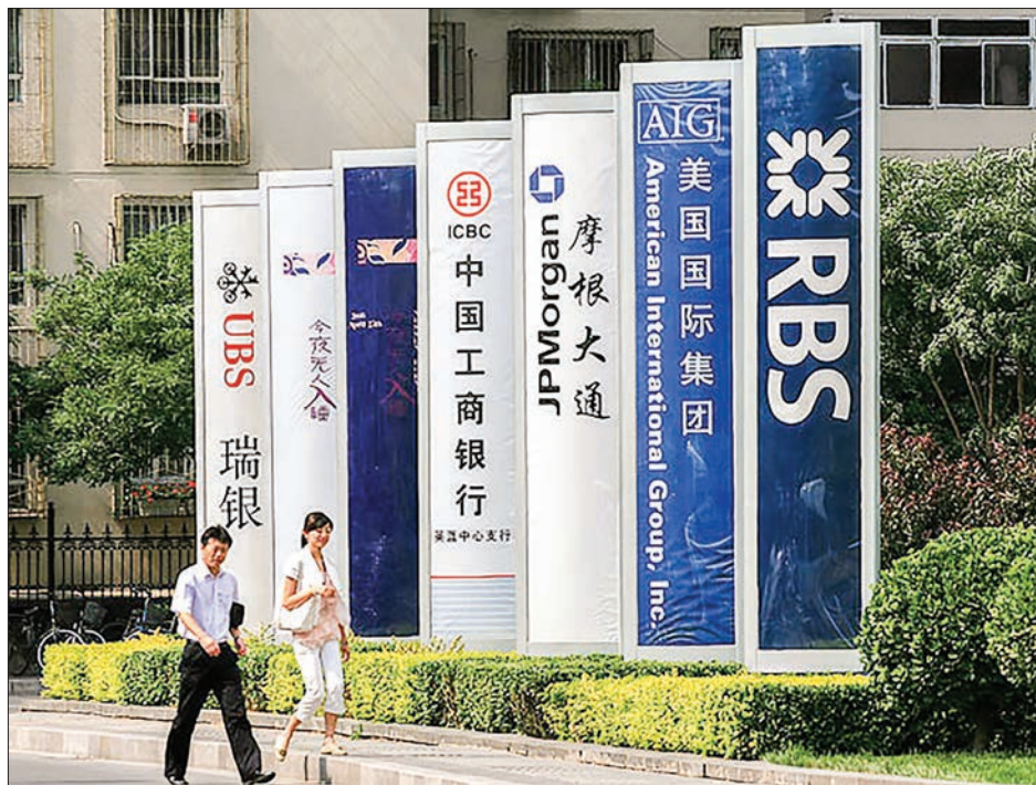
Chinese authorities have given approval to foreign banks and insurers to set up nearly 100 institutions in China since 2018.

BEIJING — Chinese authorities have given approval to foreign banks and insurers to set up nearly 100 institutions in China since 2018, an official said Sunday.