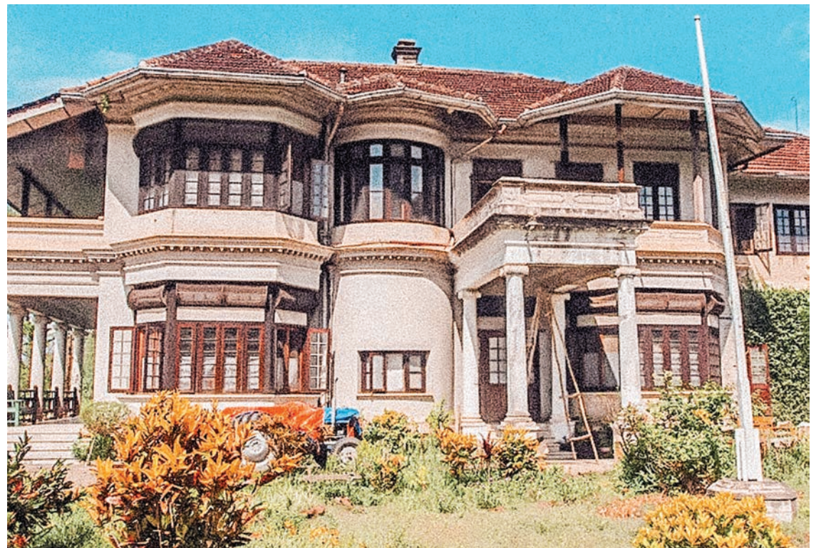
Hsipaw Haw Nan. A place that you should not miss. The visitors must pay a visit there during the fixed time. It is none other than the palaces of Sawbwa. The original Haw Nan and Sa Khan Tha Haw Nan were destroyed, and only Hsipaw Haw Nan left in its original style. It is now about 95 years old.