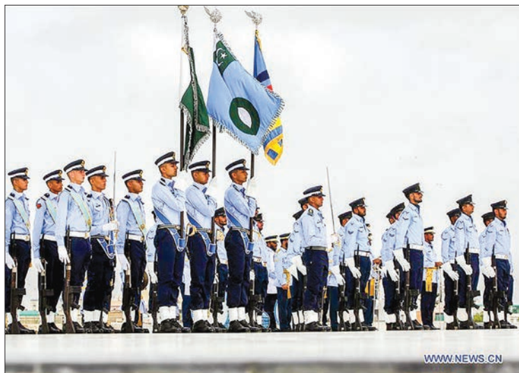
Pakistan Air Force cadets take part in a ceremony at the mausoleum of the country's founder Muhammad Ali Jinnah to mark the country's Defense Day in southern Pakistani port city of Karachi on Sept. 6, 2020..

The main ceremony in connection with the Defence Day was held at the General Headquarters in the garrison city of Rawalpindi.—Xinhua ■