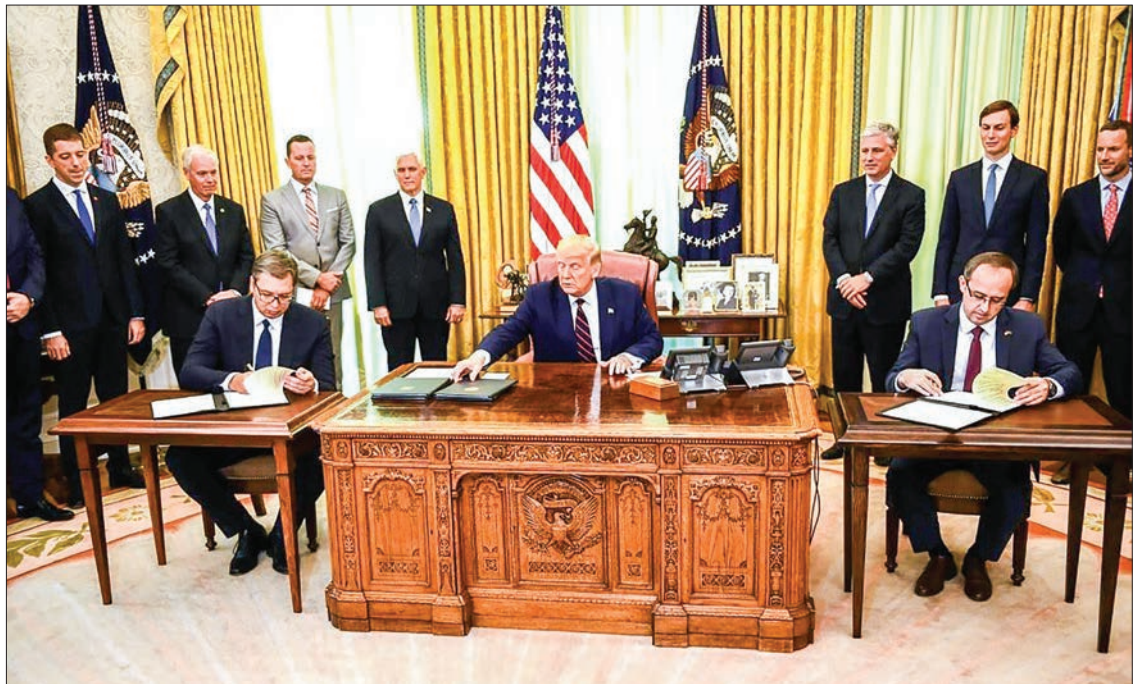
U.S. President Donald Trump watches as Kosovo Prime Minister Avdullah Hoti (R) and Serbian President Aleksandar Vucic (L) sign an agreement on opening economic relations, in the Oval Office of the White House in Washington, D.C., Sept. 4, 2020.

Israel seized control of East Jerusalem in 1967 and later annexed it in moves never recognised by the international community.—AFP ■