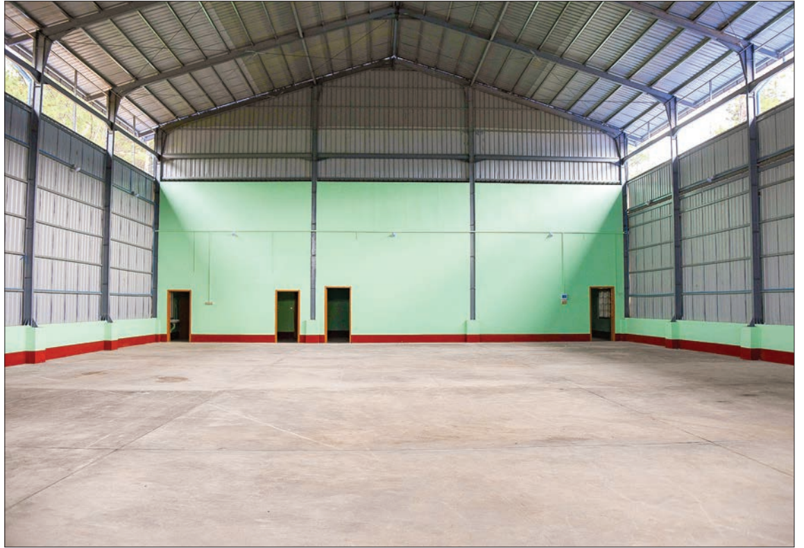
Vice President U Henry Van Thio inspecting the stadium of Sports and Physical Education Institute in Haka, Chin State on 6 September 2020.