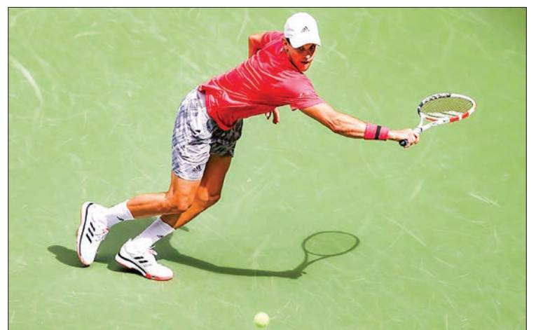
Dominic Thiem is through to the last 16 of the 2020 US Open.

the first player born in the 2000s to reach a Grand Slam fourth round. "Dominic has been getting stronger and stronger year after year," said Auger-Aliassime. —AFP ■