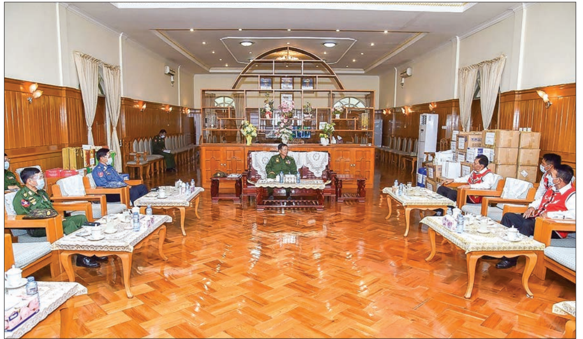
Senior General Min Aung Hlaing receives a delegation from United Wa State Army (UWSA) at Aung Pyi Hein Avenue in Tachilek Station of Triangle Region Command on 5 September.

At the ceremony, the Senior General donated 20,000 surgical masks, 300 sets of personal protective equipment (PPE), 1,000 N-95 masks, 250 face shields, six containers of sodium hypochloride with each container contain-