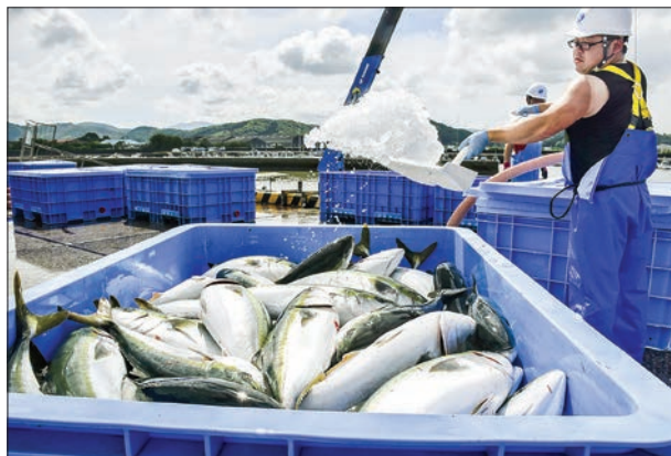
Photo taken July 2, 2020, shows yellowtail landed from open sea cages of a fish farm in Kushima in Miyazaki Prefecture, southwestern Japan.

Kurose Suisan, other fishing companies and cooperatives have been making every effort to boost yellowtail exports.—Kyodo ■