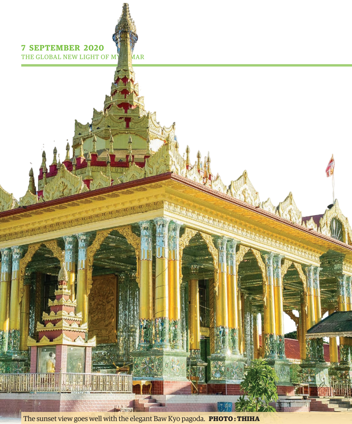
The sunset view goes well with the elegant Baw Kyo pagoda.