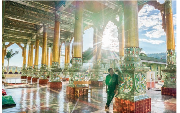
Stairways with glass mosaic embedded in gliding.