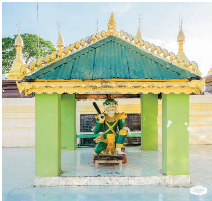
There are ogres' sculptures at every corner of the pagoda. The history of the pagoda is related with the ogres.