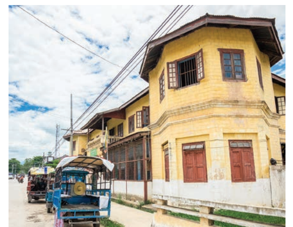
Bank opened at an ancient building near Hsipaw market in the downtown area.