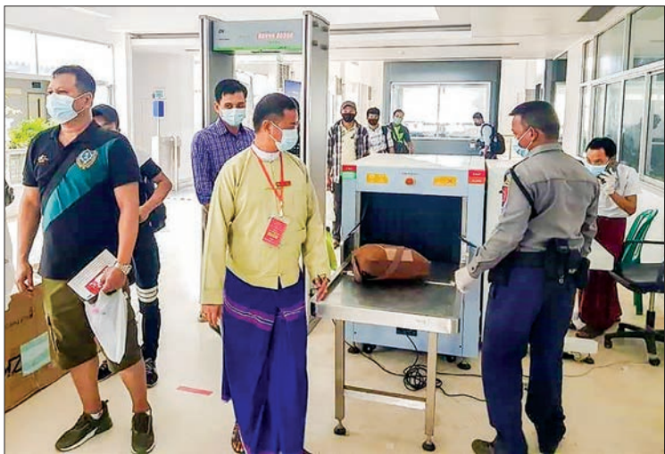
Local authorities checking the personal security of the Myanmar migrant workers in Myawady on 6 September, 2020.

457 Myanmar migrant workers in Thailand — 306 men and 151 women — returned home through the Myanmar-Thai Friendship Bridge No 2 in Myawady Border yesterday amid COVID-19 crisis.