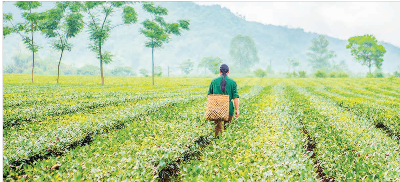
A tea grower walks through a tea garden in Viet Nam where sustainable farming techniques are used to prevent land degradation.

"Leveraging data, innovation and technology has shown that, here in Asia and the Pacific, we have brilliant minds, scientists and an entrepreneurial spirit that will lead us through the challenges presented by COVID-19 and help