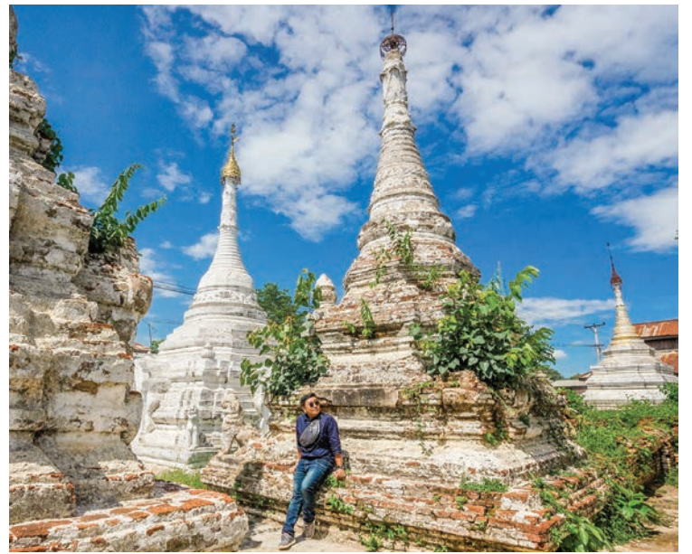
Will a few renovations be its attraction?