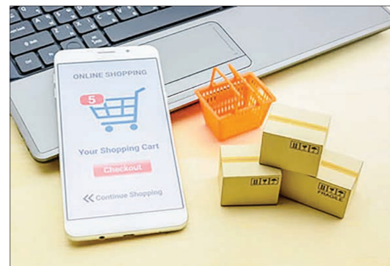
Nobel Prize-winning economist Joseph Stiglitz on Saturday urged the avoidance of zero-sum thinking and nationalistic mentalities so that all countries can reap the benefits of digital trade.

He said to achieve successful international cooperation, it is necessary to increase trans-