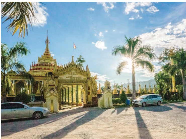
Baw Kyo pagoda. I arrived at Baw Kyo pagoda at 5pm.