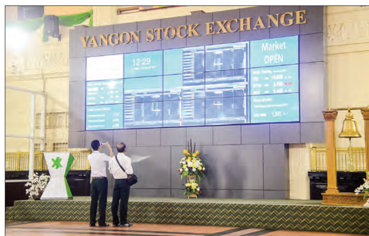
Shares traded on the Yangon Stock Exchange in August sank to the lowest level of K747 million this year.

The YSX was launched three years ago to improve the private business sector. It disseminates rules and regulations regarding