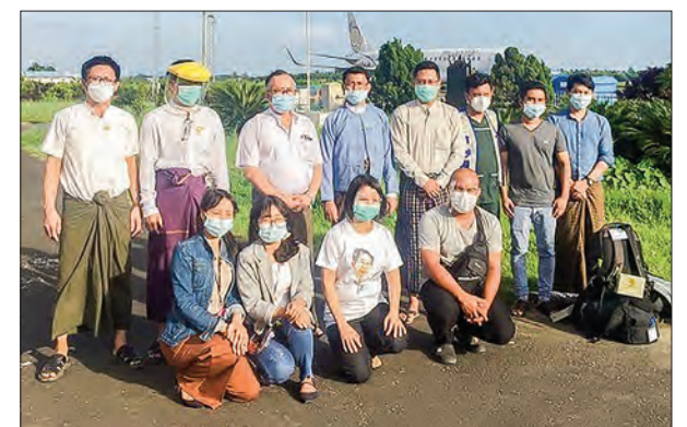
Volunteer medical team arrives in Sittway on 3 September.

A volunteer medical team including doctors and nurses to combat COVID-19 disease in Sittway, Pauktaw and Manaung townships.