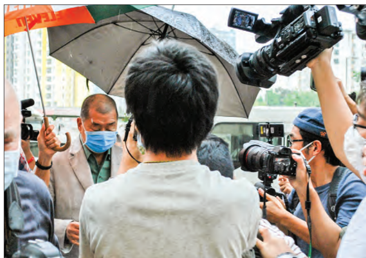
Hong Kong media mogul Jimmy Lai walked free from a criminal intimidation trial on Sept. 3, 2020 as the West Kowloon Magistracy ruled in his favour against a reporter of a rival newspaper.

Eleven cases were reported Thursday in China, where the coronavirus first emerged late last year. Health officials said they were all imported.—AFP ■