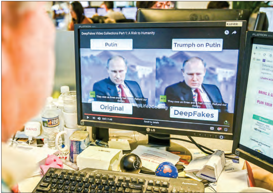
The Video Authenticator software analyzes an image or each frame of a video, looking for evidence of manipulation that could even be invisible to the naked eye.

"They could appear to make people say things they didn't or to be places they weren't," said a company blog post on Tuesday.