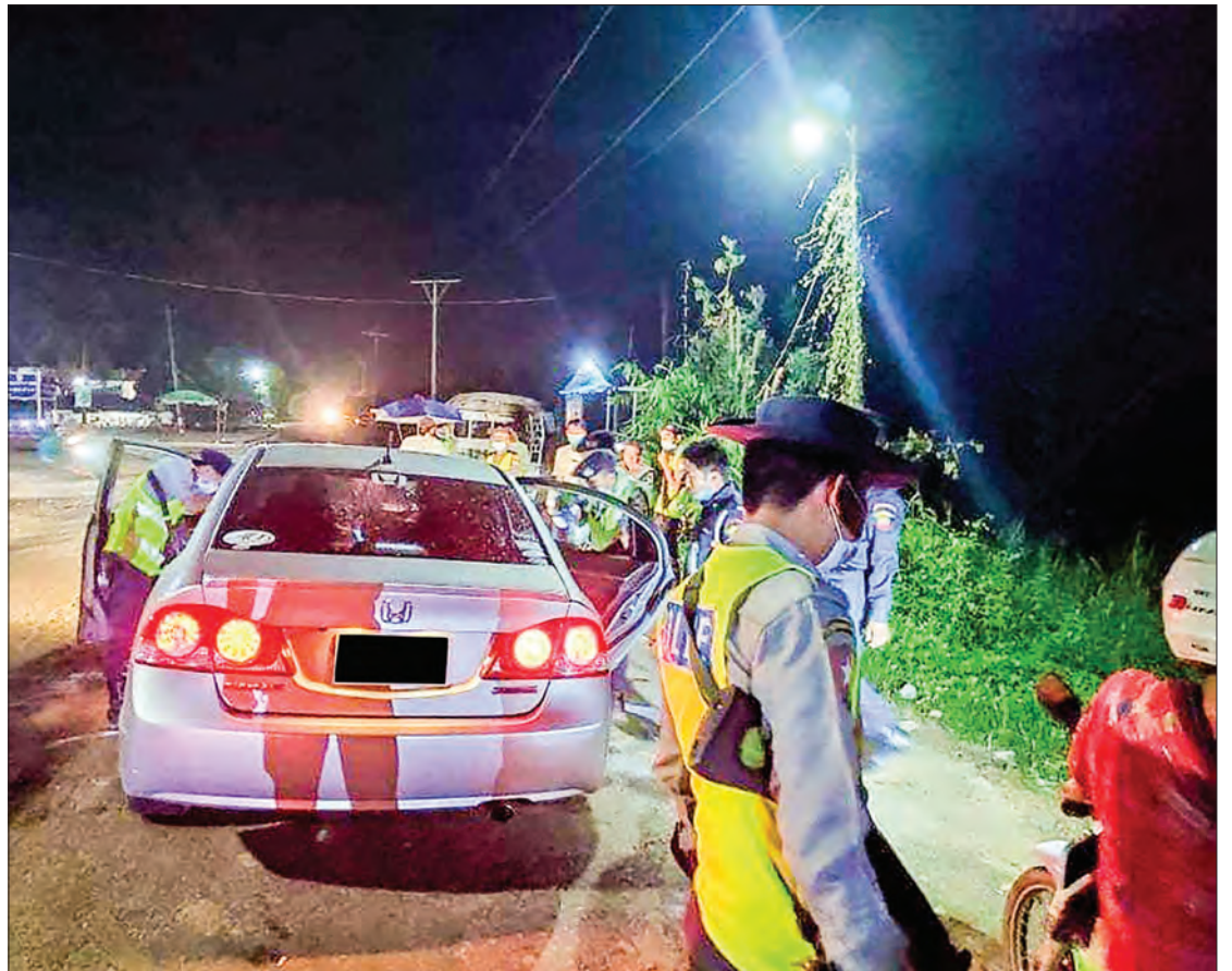
Police officers inspecting the vehicle in Yangon on 2 September, 2020.

ed news said that 647 people (618 men and 29 women) in Yangon Region were arrested