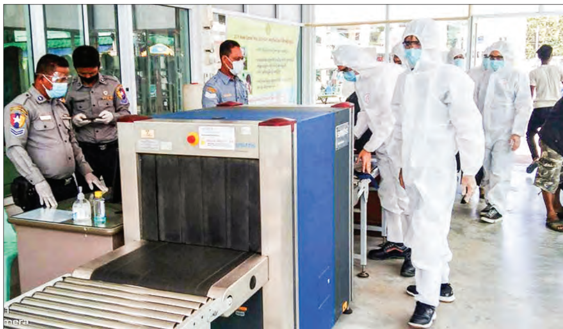
Myanmar seamen are queuing for immigration services in Kawthoung on 2 September.

The local officials of jetty and health departments helped them with medical tests and other supplies and put under 21-day hotel quarantine, while their swabs will be sent to the National Health Laboratory of Yangon.—Kyaw Soe (Kawthoung) (Translated by Khine Thazin Han)