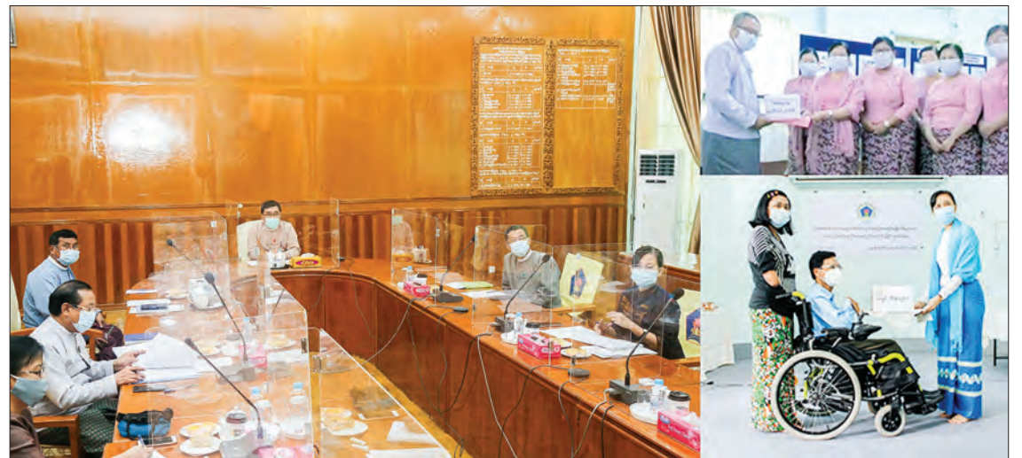
Union Minister Dr Win Myat Aye joins cash donation ceremony online on 3 September.

The Union Minister said that the MWCDF has been providing vocational training to vulnerable women and creating jobs for them. He said that the ministry is also working for the welfare of the disabled, and the Emergency Response Joint Committee on COVID-19 compiled the list of disabled women who need financial support. He said that the budget