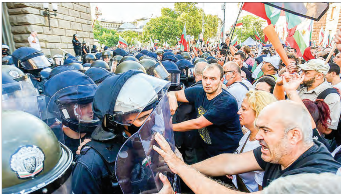
Hospital officials said 45 people, including at least 27 policemen and several journalists, were injured during clashes.

Police say 126 people were arrested, among them more than 60 football "ultras" who