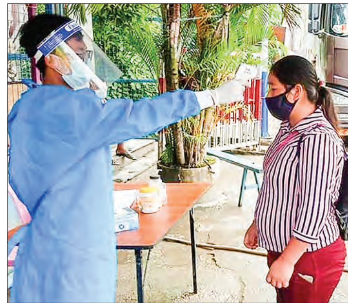
An official takes body temperature of Myanmar returnee at Chinshwehaw border crossing.

LOCAL authorities in Chinshwehaw border town of northern Shan State received 26 Myanmar returnees from China on 2 September.