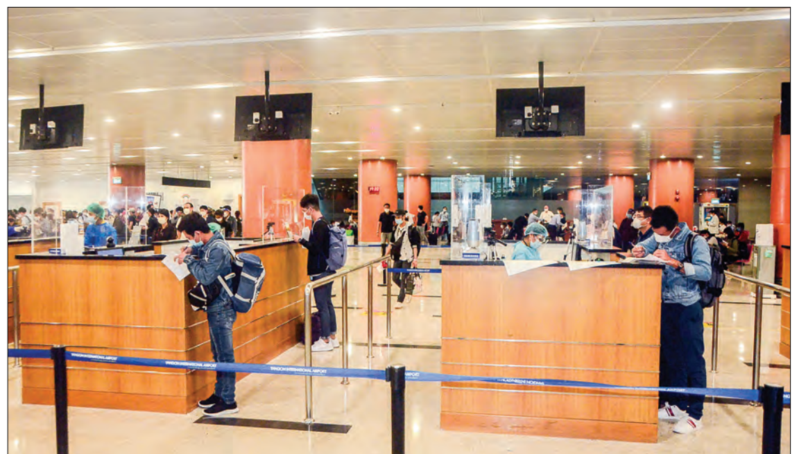
Myanmar nationals conducting their immigration processes at Yangon International Airport on 3 September, 2020.