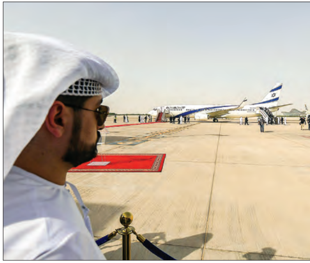
El Al's airliner, carrying a U.S.-Israeli delegation, lands on the tarmac at the Abu Dhabi International Airport, Abu Dhabi, United Arab Emirates, Aug. 31, 2020.