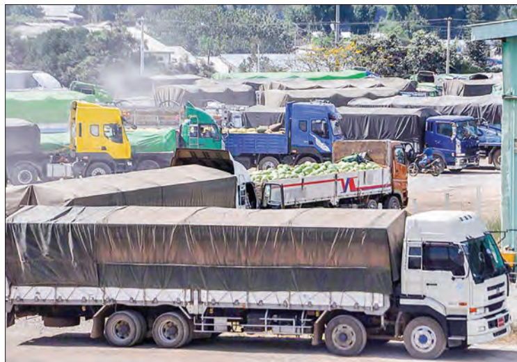
There are over 100 depots that belong to Myanmar traders in Kyal Gaung, border checkpoint of China.

send China’s goods to Myanmar on our own. Now, the goods will be stopped in Kyal Gaung and then, transported to the Myanmar side with China’s trucks. This is the problem we are currently facing,” he stressed.