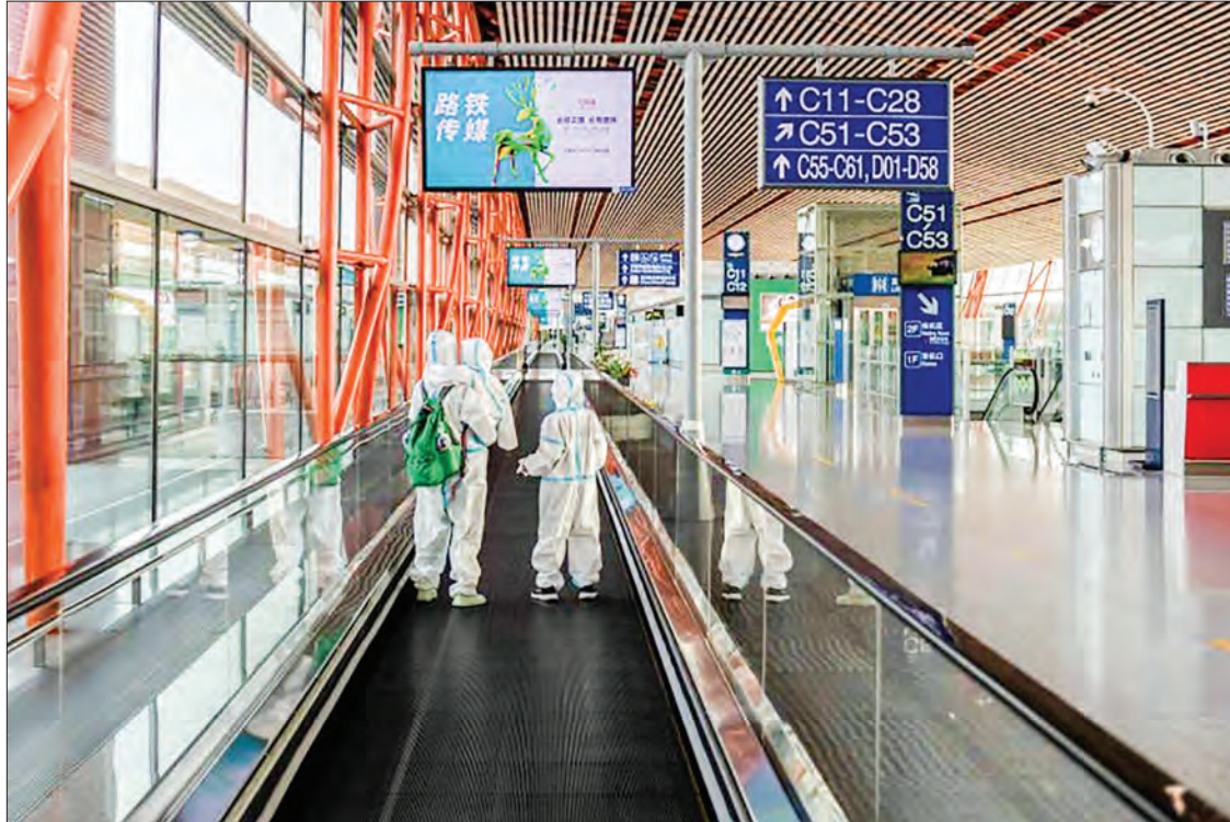
Passengers in full protective suits make their way to a boarding gate in Beijing's Capital International Airport.

Passengers disembarked wearing masks and dragging luggage — some appeared to be in full protective suits — before going past customs officials and police wearing visors and protective gear. Travellers arriving in China need to show a negative coronavirus test before boarding, and are subject to centralized