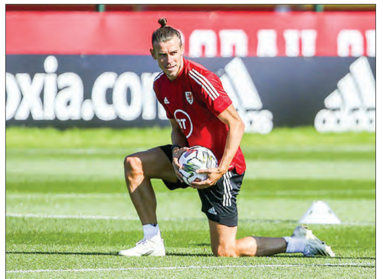
Real Madrid and Wales forward Gareth Bale.

"So it's on the club, I can't really do anything. I have a contract. All I can do is carry on what I'm doing and hopefully something comes up.—AFP ■