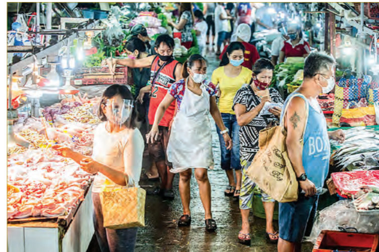
People wearing masks shop for fresh food at a market in Manila on Aug. 6, 2020.

land's 100th day free from local infection.