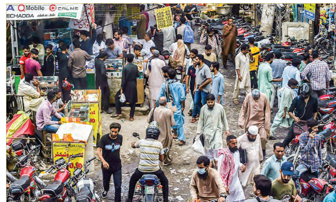
Health experts feared Pakistan's crowded cities would provide fertile breeding ground for the coronavirus.

Pakistanis have proposed numerous hypotheses for their