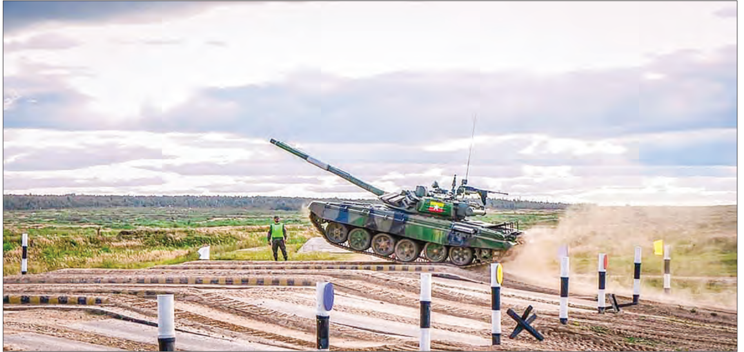
A tank from the Myanmar team rushes along in a relay race at the International Army Games 2020 in Russia.

PHOTO: OFFICE OF THE COMMANDER-IN-CHIEF OF DEFENCE SERVICES