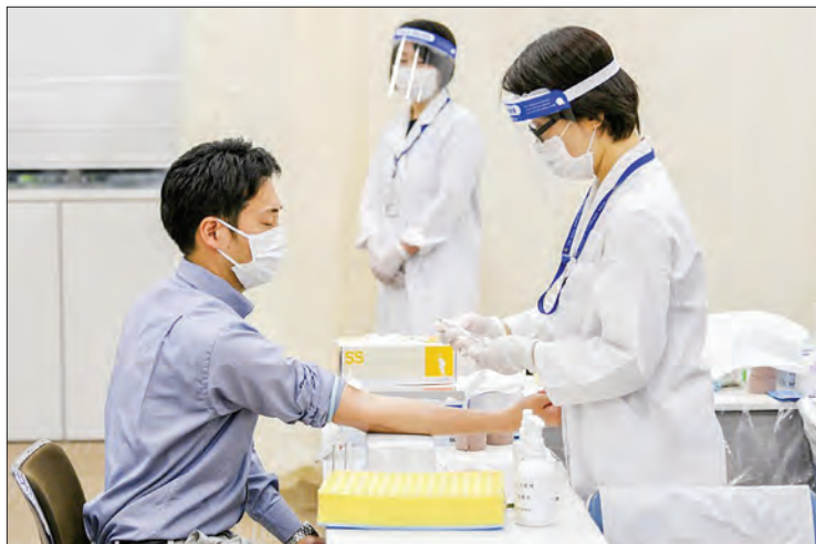
An antibody test for the new coronavirus is demonstrated in Tokyo on June 1, 2020. Japan started a program to test 10,000 people for new coronavirus antibodies to better understand its spread.

ID-19 here. The vaccines will be purchased from reserve funds from the budget of the current fiscal year to March 2021, the government said.—Kyodo ■