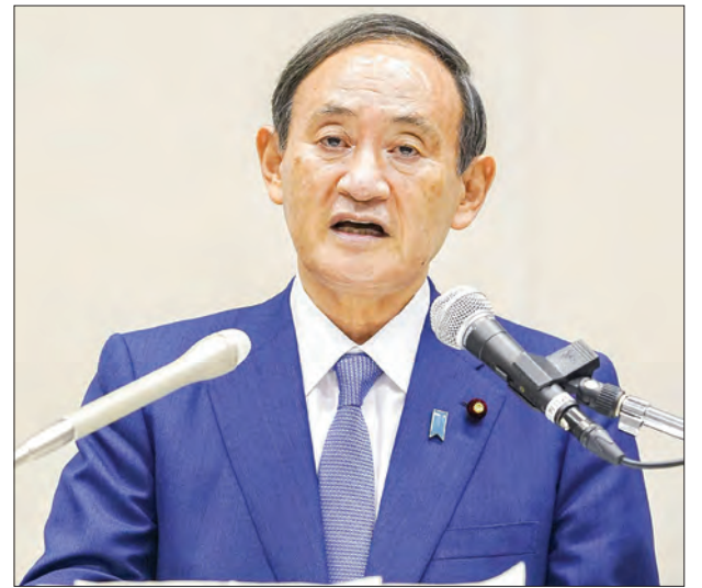
Yoshihide Suga formally announces candidacy for race to succeed Prime Minister Shinzo Abe at a press conference in Tokyo on Sept. 2, 2020.

Liberal Democratic Party. Suga, 71, who has steered policy for nearly eight years as Abe's right-hand man, has emerged as the front-runner in the Sept. 14 election having secured wide support among the factions of LDP lawmakers.—Kyodo ■