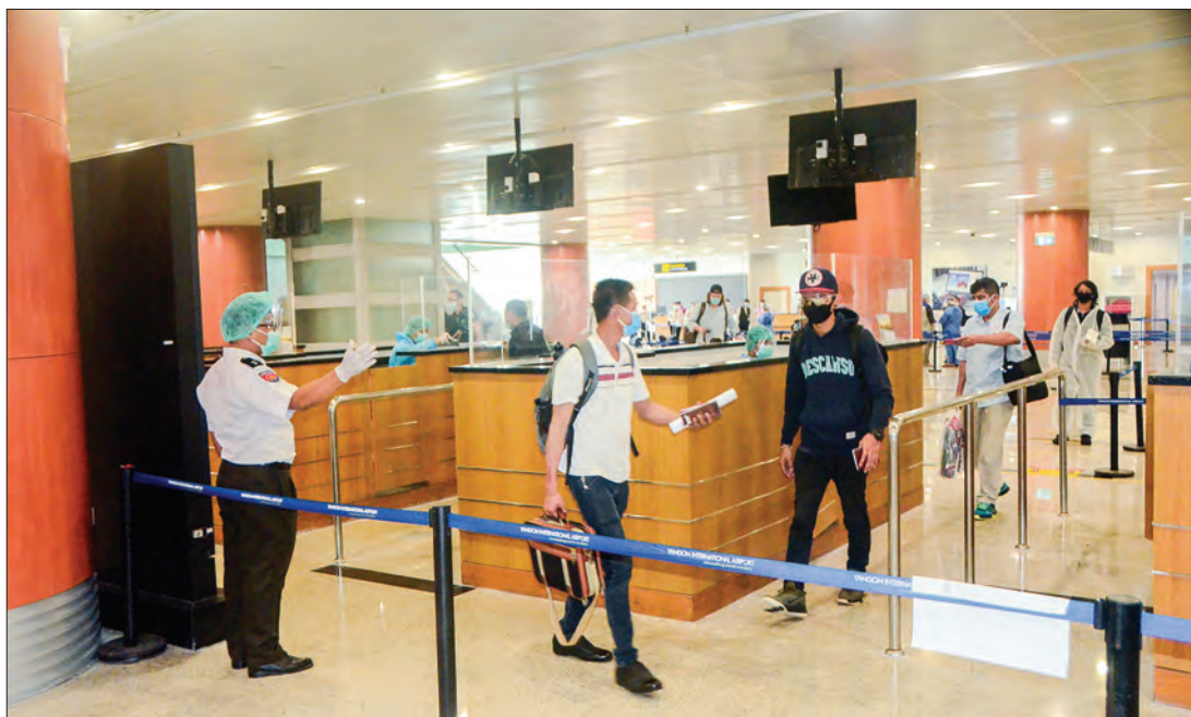
Myanmar nationals returning from abroad check in immigration at Yangon International Airport.