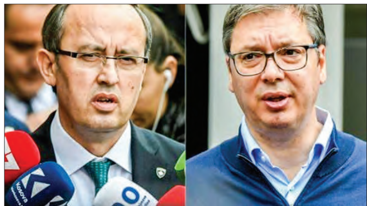
Kosovo Prime Minister Avdullah Hoti (L) and Serbian President Aleksandar Vucic (R) will meet at the White House in Washington to discuss economic cooperation.

While Brussels has been leading negotiations between the two sides for nearly a decade, the US has recently sought a role under Richard Grenell, a special envoy appointed by Trump. —AFP ■