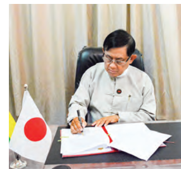
Deputy Minister U Maung Maung Win signs Exchange of Notes on 1 Sept.