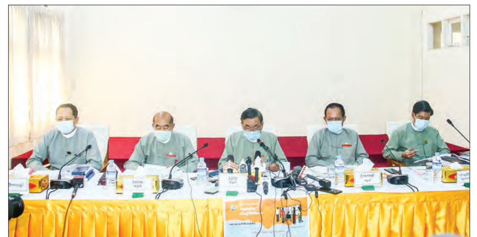
Members of the Union Election Commission's news and information team answer to questions from journalists.