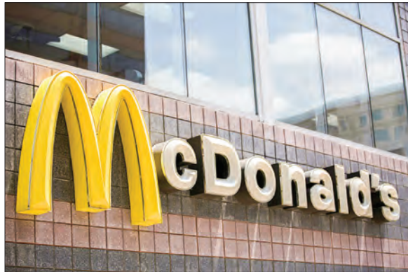
McDonald's rejected charges it limited opportunities for Black franchise owners.

CHICAGO—More than 50 Black former McDonald's franchisees have sued the fast food chain claiming a "systematic" pattern of racial discrimination that hindered their success and forced some out of business -- claims the company strenuously denies.