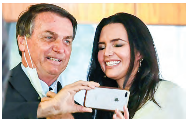
Analysts say the downturn has been mitigated by a stimulus package decided on by the government of Brazilian President Jair Bolsonaro, shown here posing with a doctor before the event "Brazil beating COVID-19" at Planalto Palace on August 24, 2020.