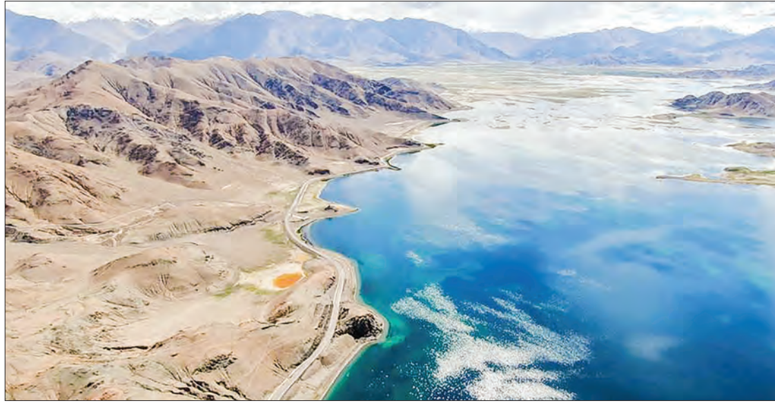
Aerial photo taken on Aug. 3, 2019 shows a road along the Pangong Tso lake in Ngari, southwest China's Tibet Autonomous Region.

“On Aug. 31, Indian troops violated the consensus reached in previous multi-level engagements and negotiations between China and India, illegally trespassed the Line of Actual Control again at the southern bank of the Pangong Tso Lake and near the Requin Pass in the western sector of China-India border, and