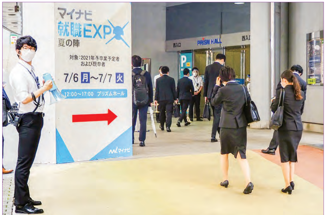
Job seekers head to a career fair hosted by Mynavi Corp. in Tokyo on July 7, 2020.

TOKYO — Japan's job availability fell to a six-year low and employment conditions worsened in July, government data showed Tuesday, highlighting the severe blow dealt to workers by the coronavirus pandemic.