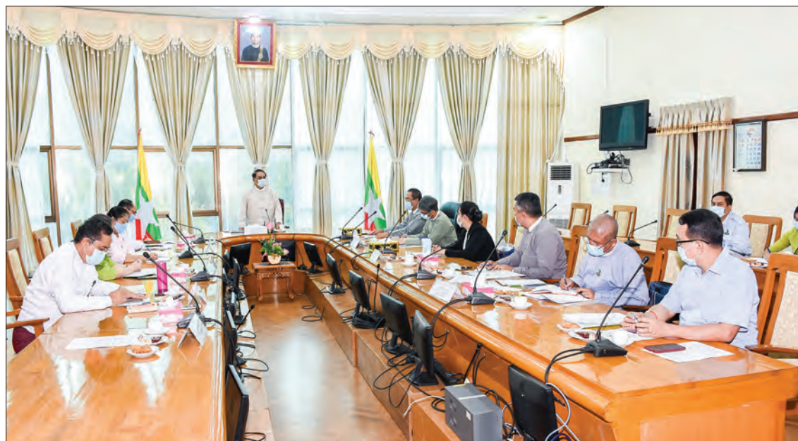
Union Minister Dr Than Myint addresses a coordination meeting for constructing a highway between Dawei SEZ and Hteekhee on the Myanmar-Thai border.

The Deputy Minister for Construction, the Permanent Secretary for the Ministry of Commerce, Directors-General and other officials participated in the meeting. —MNA