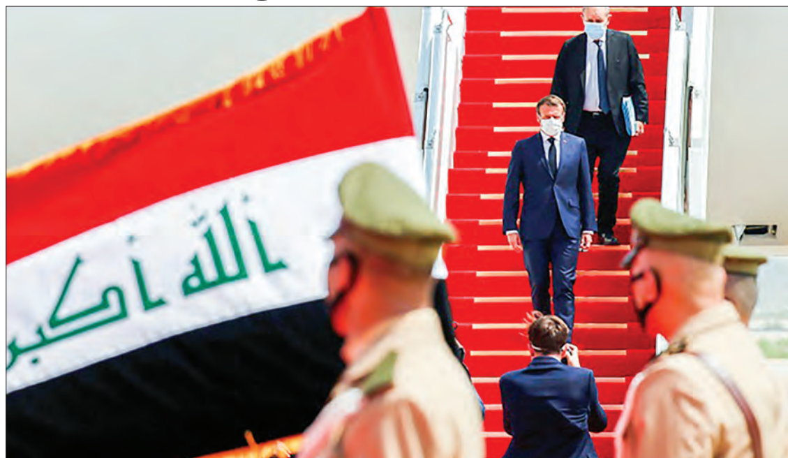
French President Emmanuel Macron says he wants Iraqis to be given alternatives to domination by Islamist extremists or regional powers.

BAGHDAD—French President Emmanuel Macron met his Iraqi counterpart Wednesday on his first official visit to Baghdad, where he insisted the war-scarred country should reassert its “sovereignty” despite simmering US-Iran tensions.