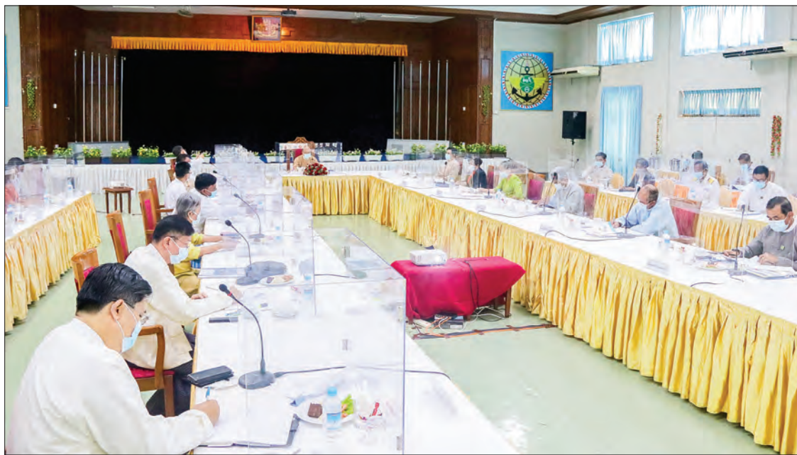
Union Minister U Thant Sin Maung addresses a meeting to develop the logistics sector in Myanmar.

At the meeting, Union Minister U Thant Sin Maung said that the Ministry of Transport and Communications is making concerted efforts for the development of logistics sector and the National Logistics Master Plan has been drawn up with support from the Japan International Cooperation Agency (JICA) with the aim of developing national-level supporting activities.