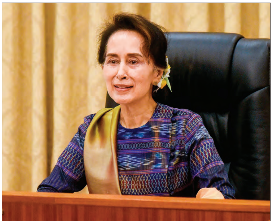
State Counsellor Daw Aung San Suu Kyi holds videoconference with officials who are taking part in contact tracing for COVID-19, and in carrying out prevention and control measures of this disease.

STATE COUNSELLOR Daw Aung San Suu Kyi held a videoconference with officials who are working for contact tracing for COVID-19, and carrying out prevention and control measures of this disease.