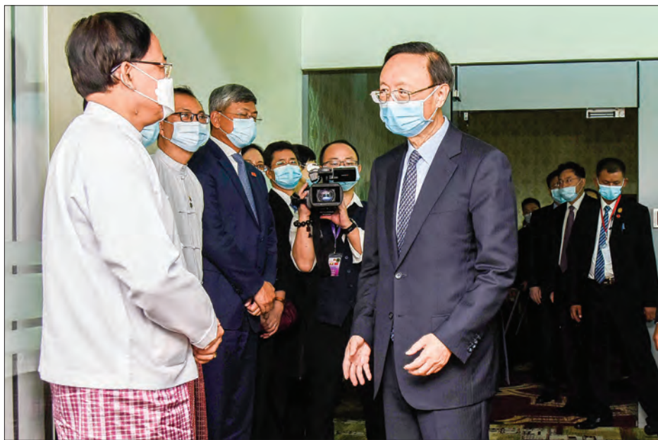
Mr Yang Jiechi and delegation at Nay Pyi Taw International Airport to depart for China.

CHINESE delegation led by Mr Yang Jiechi, the member of the Political Bureau of the Communist Party of China (CPC) Central Committee and party, concluded their visit in Myanmar yesterday afternoon.