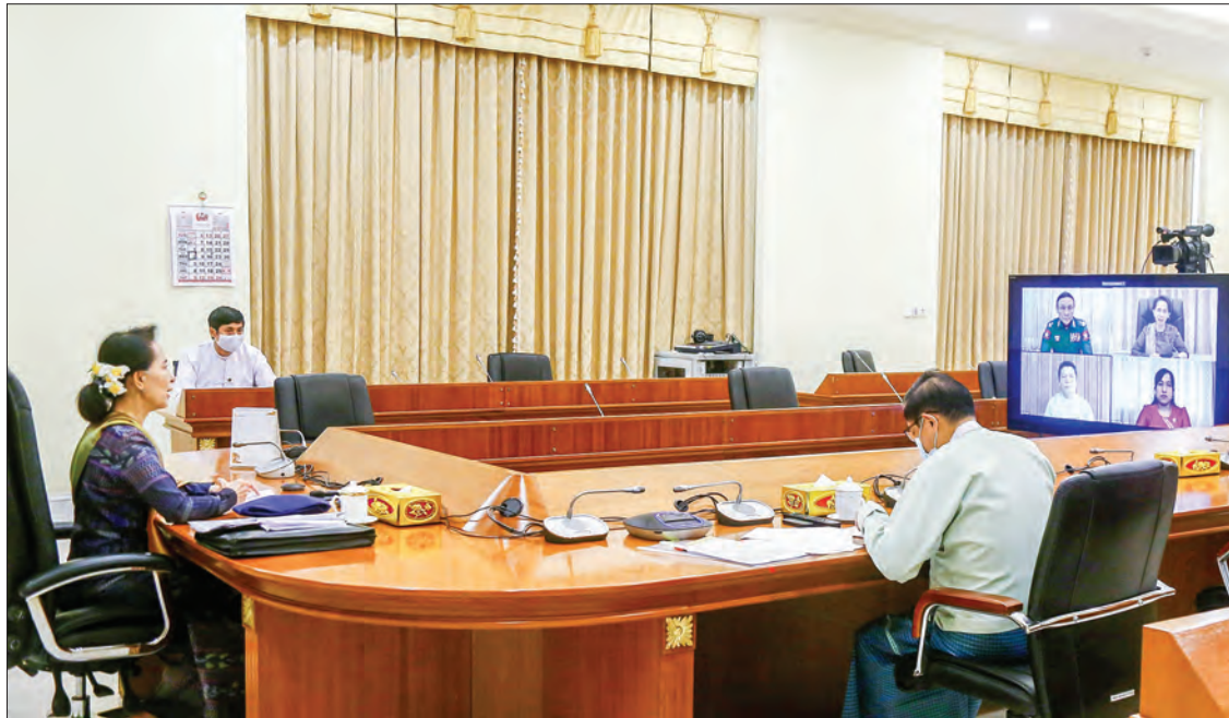
The State Counsellor discusses contact tracing and measures against COVID-19 with officials taking part in these activities on 2 September.

People need to abide by the directives and rules of the central