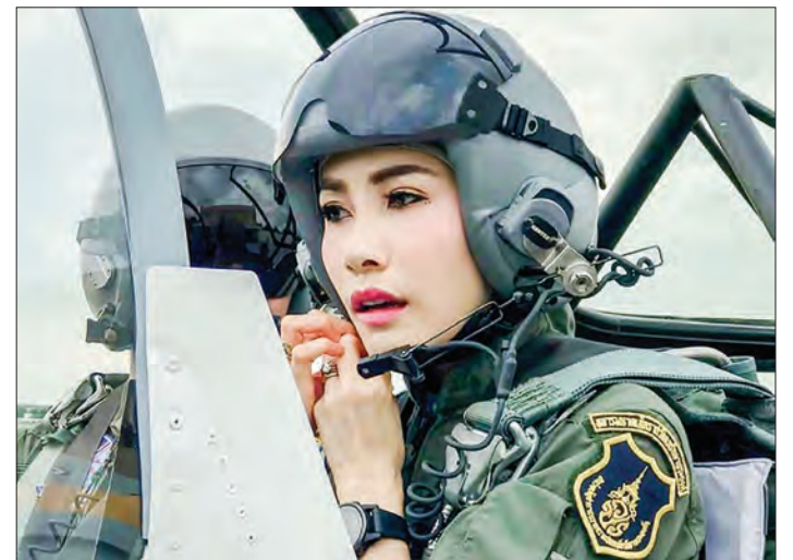
Thailand’s king has reinstated his former consort Sineenat Wongvajirapakdi.