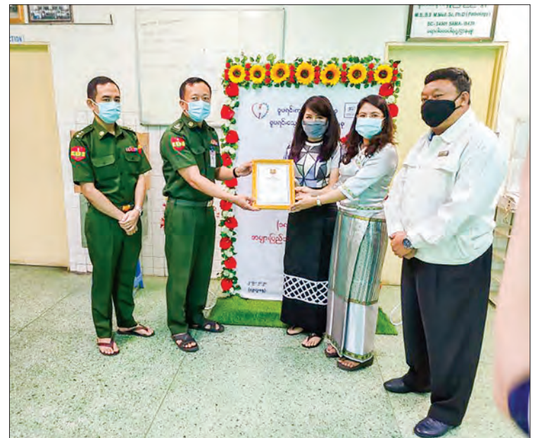
Officials from Defence Services Hospital No.2 in Yangon hand over a certificate of honour to blood donors from Supreme Group of Companies.

TO assist pregnant mothers and patients with cancer or awaiting emergency operations during COVID-19, a hundred people from Supreme Group of Companies donated their blood to the Defence Services Hospital No.2 and the National Blood Bank in Yangon yesterday morning.