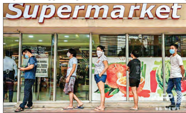
Many Filipinos are now unable to afford to buy food in supermarkets.

His hours have been slashed because of the pandemic and he now only earns about 9,000 pesos ($185) a month, half of which is used to pay the rent for the family's apartment.—AFP ■