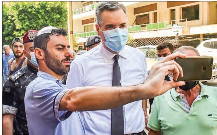
Lebanon’s newly appointed prime minister designate Mustapha Adib and the leaders of the country’s various factions have pledged to form a crisis cabinet within two weeks.

The last government resigned in the face of public anger over the August 4 explosion that killed at least 188, wounded thousands and laid waste to entire