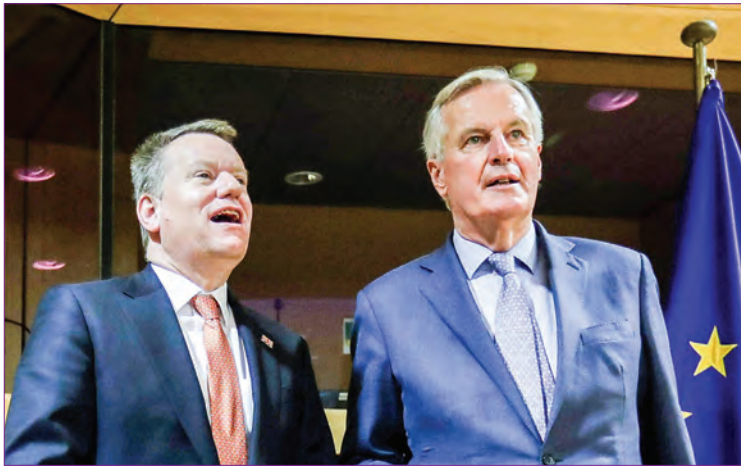
European Union chief Brexit negotiator Michel Barnier (R) and the British Prime Minister's Europe adviser David Frost speak at start of the first round of post-Brexit trade deal talks between the EU and the United Kingdom, in Brussels on March 2, 2020.