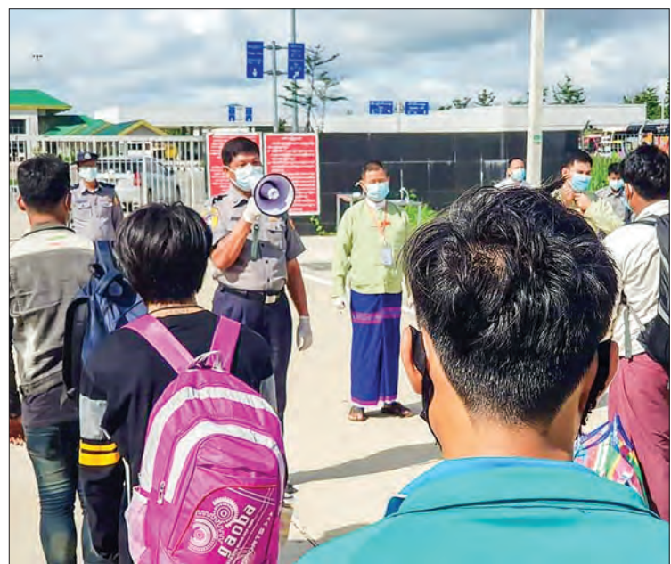
Myanmar returnees are seen at the Myawady border crossing with Thailand on 2 September.