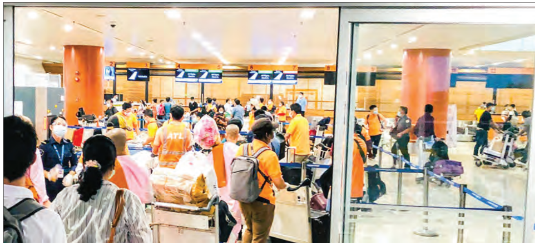
Myanmar seamen are seen at Yangon International Airport before leaving for Kawthoung on 2 September.

A total of 60 Myanmar seamen were brought to Kawthoung from Yangon by chartered flight yesterday morning.