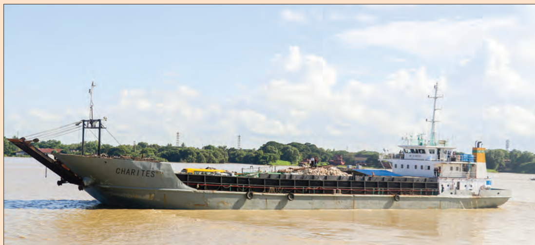
MV Charites is the first to offer ferry service between Yangon and Cocogyun township.

THE ferry service between Yangon and Cocogyun Township was launched on 2 September, and the first ferry, MV Charites owned by Thuriya Sandar Win Company, departed Bo Aung Kyaw Port, Yangon at 3:30 pm on that day.