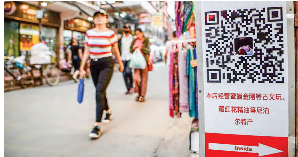
This file photo shows Chinese tourists walking past a QR code for Chinese digital wallets displayed on a street in Kathmandu.

The Boston Consulting Group (BCG) noted that 49 per cent of urban consumers in the region who are commercial bank customers already use e-wallets. The consulting firm in its 2020 report titled, 'Southeast Asian Consumers Are Driving a Digital Payment Revolution' projects that the proportion will reach 84 per cent by 2025. In fact, adoption could accelerate in the wake of the COVID-19 pandemic, which "has triggered a sharp rise in digital payments and home delivery," said the BCG. "The COVID-19 outbreak and its aftermath will prompt many more Southeast