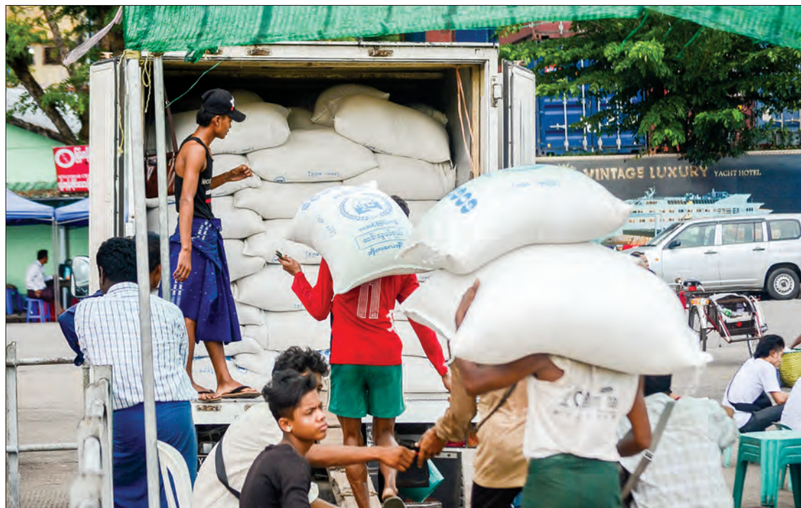
Labourers load rice bags onto a truck at a jetty.

The prices of rice last month for Pawsan varieties moved in