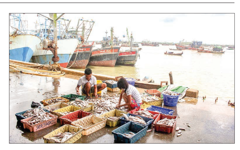
Fisher men processing fish near the fishing boats in Taninthayi.

The Taninthayi coast is situated in southern Myanmar and it is the longest coast in Myanmar,