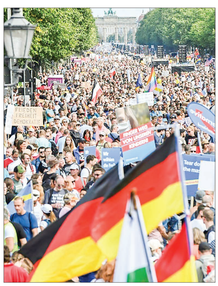
Police said some 38,000 people, double the number expected, took part in the protest. PHOTO: AFP

"We cannot be present everywhere and it is precisely these weaknesses in the deployment that were exploited, in this case to cross the security barriers in order to reach the steps of the Reichstag," said local police spokesman Thilo Cablitz.—AFP