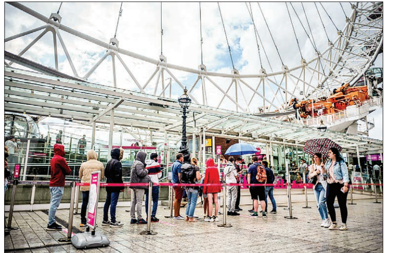
Around three million British jobs in the tourist sector could be at risk, like those at the London Eye ferris wheel in central London.

The new Premier League season starts behind closed doors on September 12.—AFP