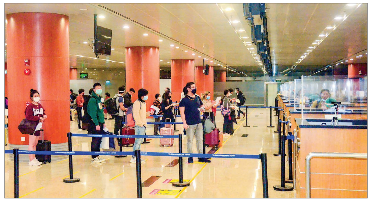
Myanmar citizens returning from Australia and New Zealand line up for immigration process at Yangon International Airport.

The Ministry of Foreign Affairs is working in line with the directives from the National-Level Central Committee