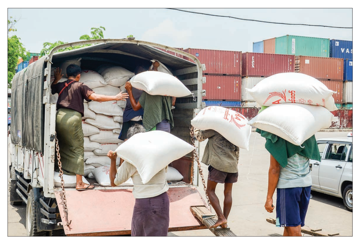
Workers loading the truck with rice sacks at the Botahtaung Jetty in Yangon.

The volume of rice and broken rice, which was exported between 1 October and 14 August in the 2019-2020FY, has registered at over 2.39 million metric tons, worth over $726 million, stated MRF announcement.