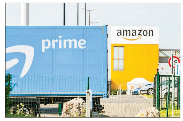
In the Covid economy, there are winners and losers -- e-commerce giants such as Amazon, show rising profits and sales but traditional retail outlets have been shedding jobs by the thousand.

shift to shopping online -- according to Kantar consulting group, international e-commerce grew 41 percent in only three months compared with 22 percent growth for 2020 as a whole to date, as the pandemic "transformed" retail habits.