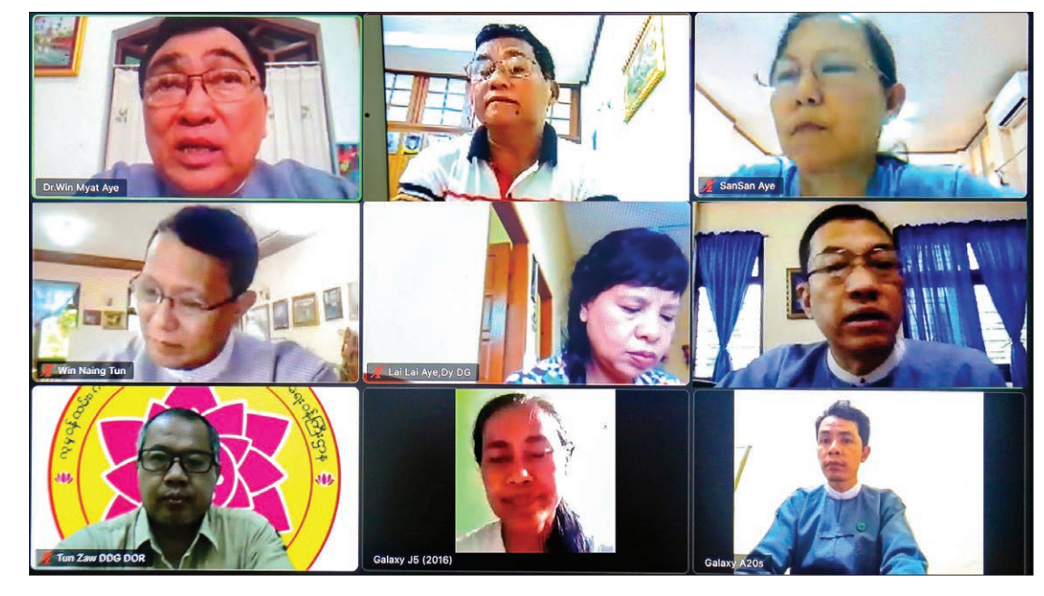
Union Minister Dr Win Myat Aye, officials and representatives from COVID-19 stakeholders participate in the virtual meeting on implementation of CERP in Rakhine State.

He said the National Volunteers Steering Committee Secretary Office to keep on investigating the ground condition requirements in making arrangements for volunteers.