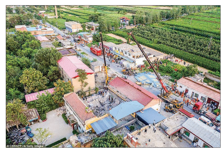
This aerial view taken on August 29, 2020, shows rescuers searching through the rubble of a collapsed restaurant in Linfen, in China's northern Shanxi province. - At least 29 people died on August 29 when a restaurant in northern China collapsed, state media said, with rescuers pulling dozens of survivors from the rubble and searching for others believed to be trapped.

BEIJING — The number of people killed when a restaurant in northern China collapsed has climbed to 29, state media said on Sunday, with efforts to find survivors brought to a close.