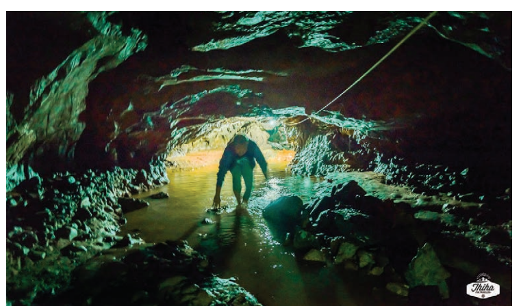
Inside Kaungdaw Cave.