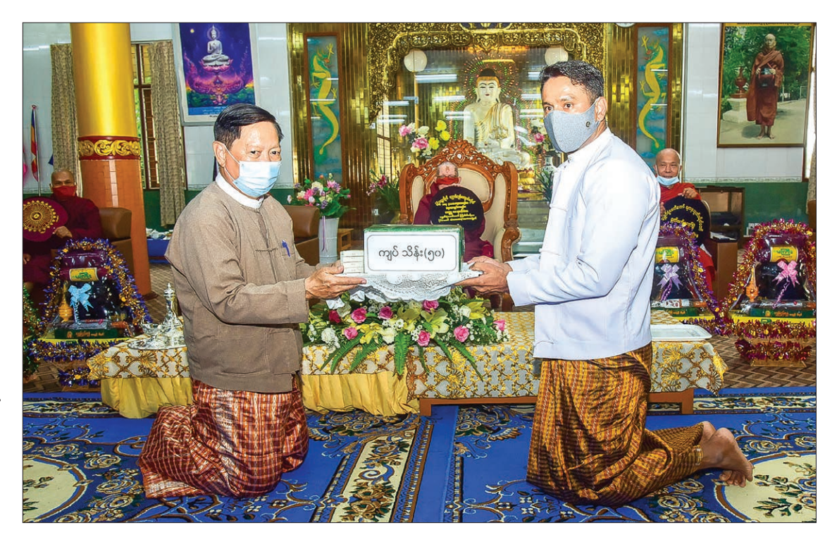
Union Minister Thura U Aung Ko presents K5 million cash donation for Nyaungdon Pariyatti Monastery in Yangon on 30 August 2020.

The Government of the Republic of the Union of Myanmar's National-Level Central Committee on Prevention, Control and Treatment of Coronavirus Disease 2019 (COVID – 19) is also trying to contain the spread of COVID-19 in the country with