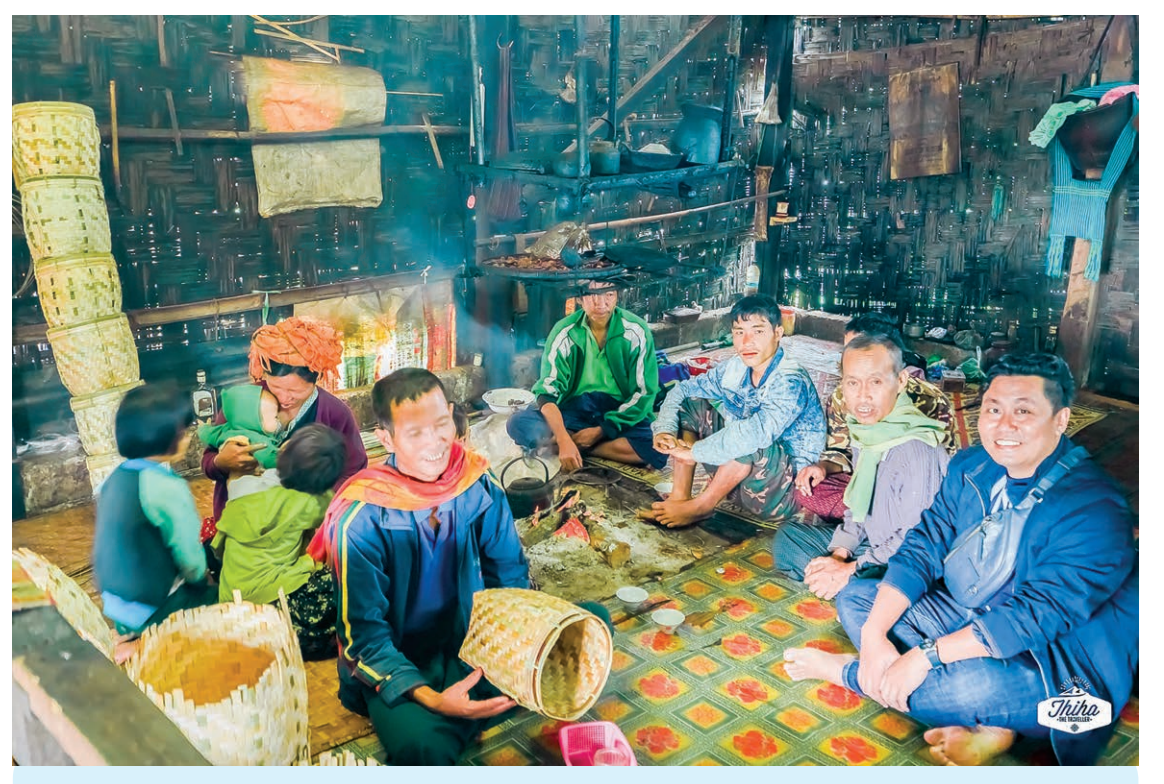
People sitting around the fire.

Villages producing Pa-O traditional wicker ware are must-visit places for any visitors, local or foreigner. Buying one as