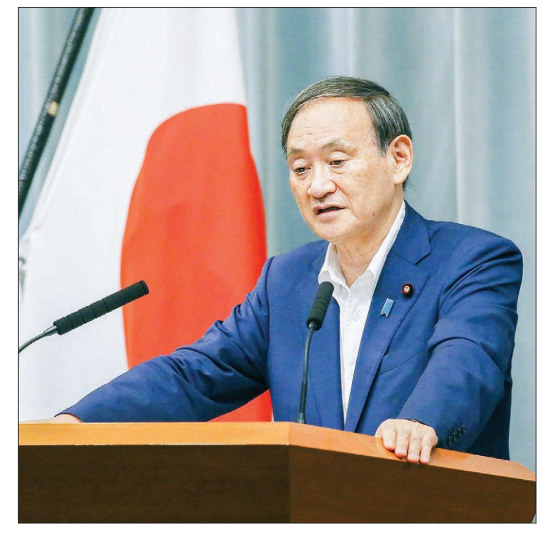
Japanese Chief Cabinet Secretary Yoshihide Suga attends a press conference in Tokyo on Aug. 28, 2020.