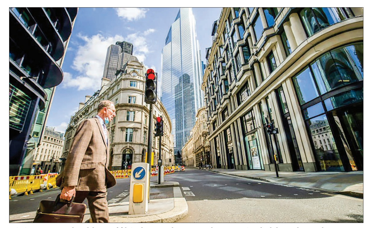
Britain's economy shrank by one fifth in the second quarter as the coronavirus lockdown slammed businesses.

LONDON — Britain's Conservative government was on Sunday level with the Labour party in the polls for the first time in over a year amid a series of embarrassing U-turns and economic devas-