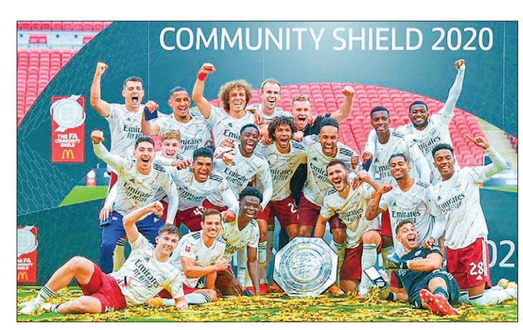
Arsenal beat Liverpool 5-4 on penalties on Saturday (Aug 29) to lift the Community Shield.

As if Arteta needed any reminding, it was another sign