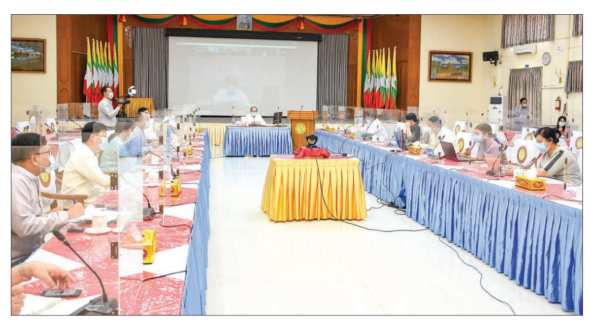
Union Minister Dr Myint Htwe attends the videoconference on prevention and control of COVID-19 in Rakhine State on 30 August 2020.

DURING a videoconference on prevention and control of COVID-19 in the Rakhine State held yesterday morning, Union Minister for Health and Sports Dr Myint Htwe called for public cooperation in prevention and control of COVID-19 and urged officials to prevent illegal entry to the Rakhine State via illegal border crossing.