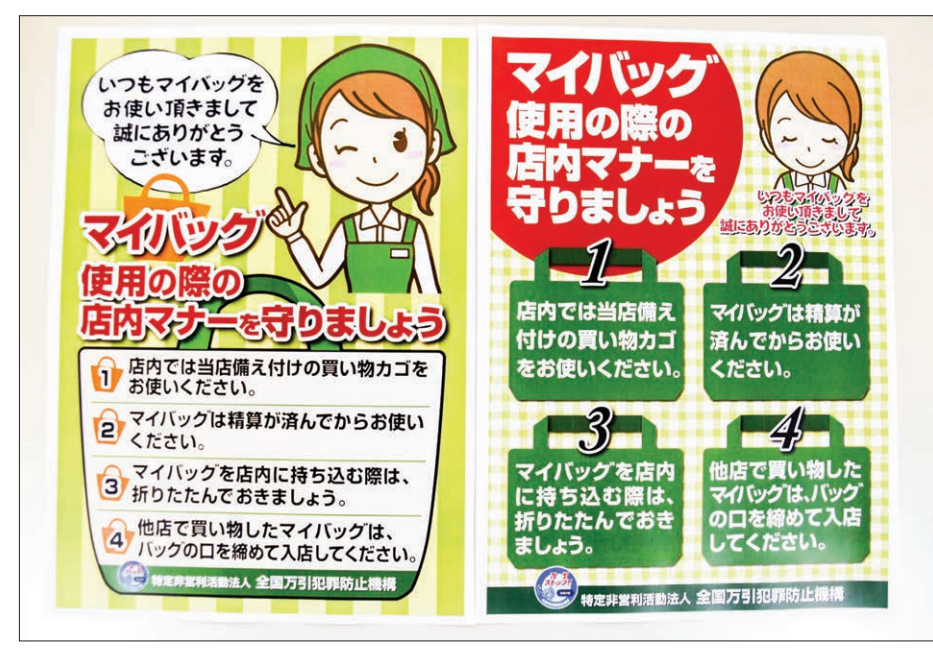
Photo shows posters created by an anti-shoplifting nonprofit organization which urge customers to use shopping baskets provided by stores and to keep personal bags folded until after purchases are made.

The move followed an alleged shoplifting case on Aug. 10, in which a man was arrested at a supermarket in the city of Tambasasayama in western Japan's Hyogo Prefecture on suspicion of stealing in-