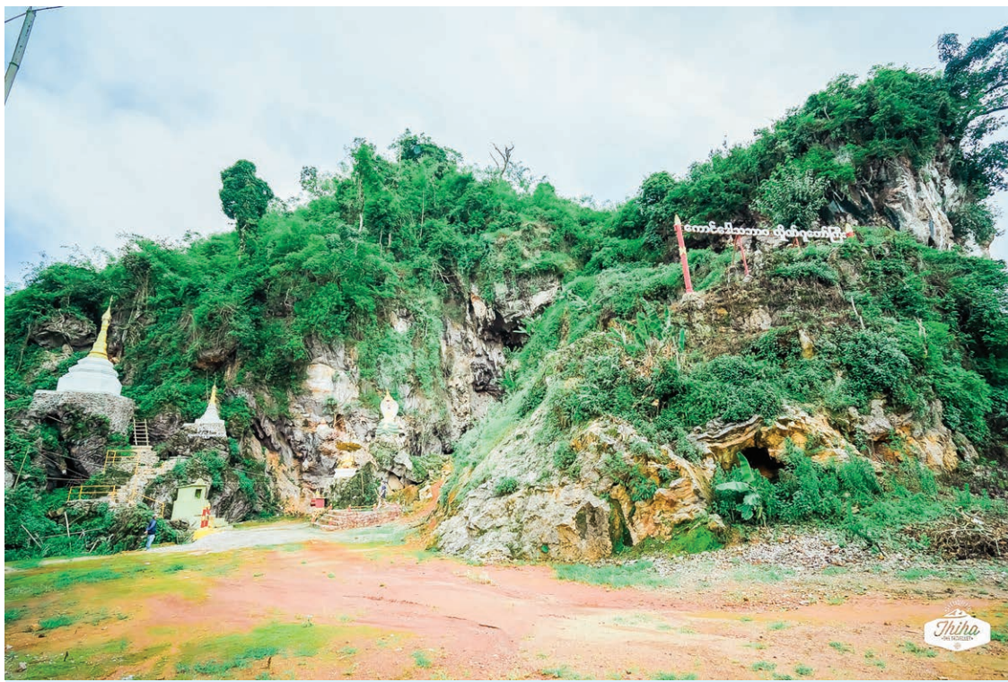
Kaungdaw Cave.