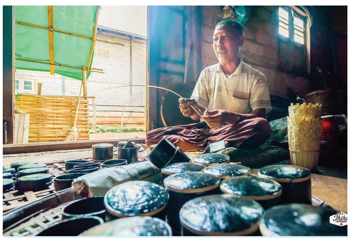
A man shows a split bamboo using in making lacquer wares.