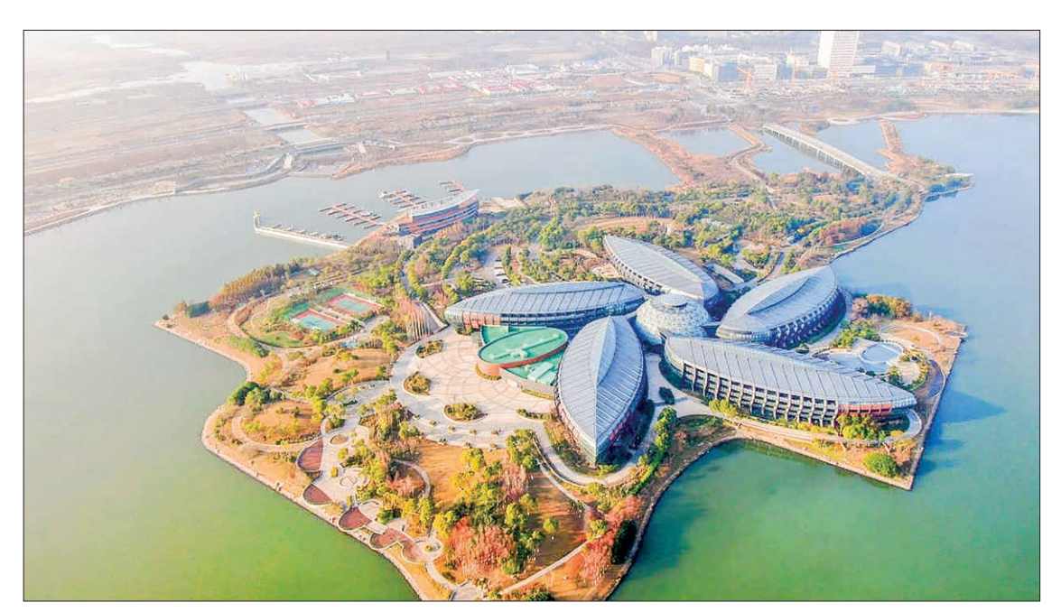
The Lin-gang Special Area of China (Shanghai) Pilot Free Trade Zone (hereinafter referred to as Lin-gang Special Area) has just celebrated its one-year anniversary.

Over half of the 78 policies and institutional innovations in line with the overall plan for the development of Lin-gang Special Area have been implemented. Forty-five have been completed, and 22 have finished plan making. The area has so far attracted investment of more than 270 billion yuan ($39.3 billion). Lin-gang Special Area is dedicated to making invest environment more efficient, equitable and expectable. For instance, the qualifications for monitoring water and soil conservation in construction projects used to take at least one in-per-