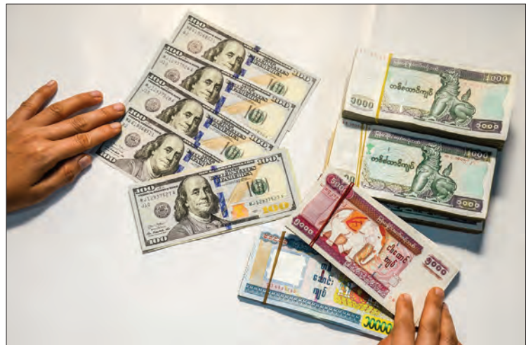
US and Myanmar banknotes on display.