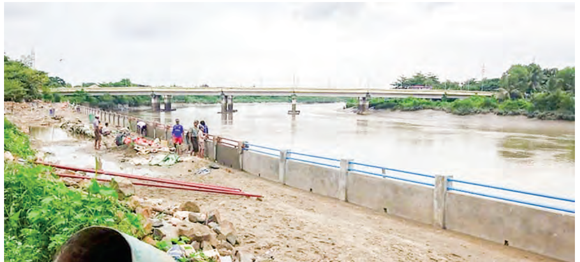
Nga Moe Yeik embankment construction nearing completion in South Okkalapa Township, Yangon.