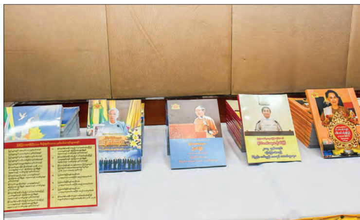
Books to honour the reform activities of government are displayed at the Ministry of Information on 27 August.

Moreover, State Counsellor Daw Aung San Suu Kyi made her trip to 14 Regions and States. She