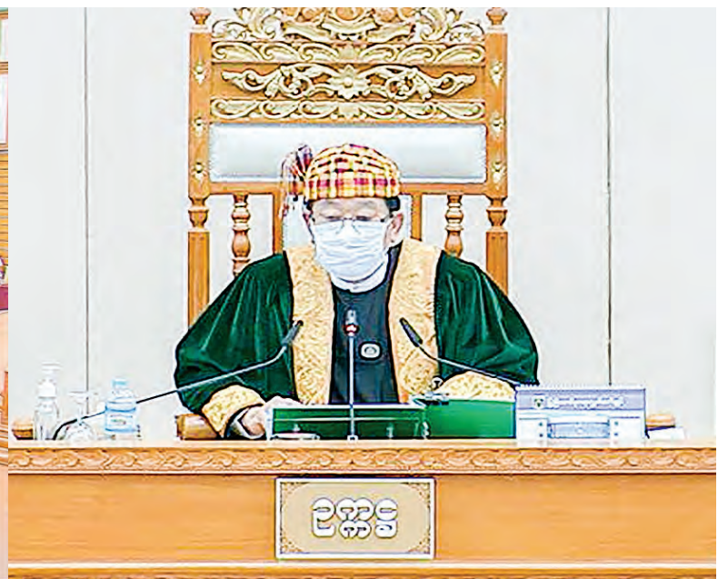
Pyithu Hluttaw Speaker U T Khun Myat presides over the 12 th or final day of 17 th regular session on 27 August.

P YITHU Hluttaw concluded its 17 th regular session yesterday after the 12 th day meeting with asterisk questions and discussions about a motion.