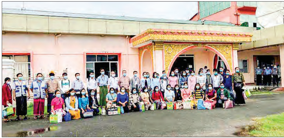
Third group of medical workers land Sittway for their volunteering works to control COVID-19 on 27 August.

THE third batch of volunteers, including doctors and nurses, travelling to Rakhine State of their own will to assist in the preventing, containment and treatment measures of COVID-19 arrived in Sittway by an MAI flight