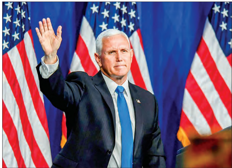
US Vice President Mike Pence delivered the main speech on day three of the Republican convention.

BALTIMORE — Donald Trump's vice president Mike Pence took centre stage at the Republican convention Wednesday to warn voters they "won't be safe in Joe Biden's America" – and cast Trump as their protector against the "radical left"