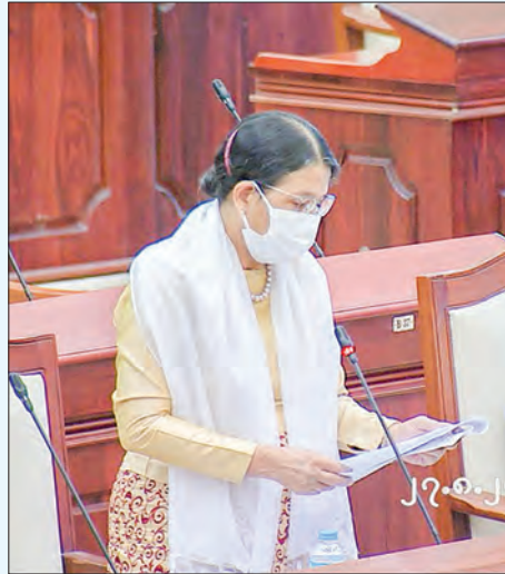
Deputy Minister Dr Mya Lay Sein.