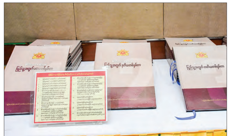
Books on the 2nd-year performance of government are on display at the Ministry of Information on 27 August.