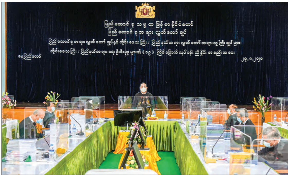
Chief Justice of the Union U Htun Htun Oo organizes a meeting with senior legal officers from high courts of states and regions on 27 August.

The meeting was held at the office of Supreme Court of the Union in Nay Pyi Taw, and the Chief Justice discussed matters related to following guidelines for prevention of COVID-19 in court proceedings, helping clients, lawyers and visitors as much as possible without stopping court proceedings in order to provide rule of law, access to justice, and judicial remedy, conducting court trials in accordance with laws and regulations to prevent visitors, judges, and court staff from being infected with the disease, making adaptation to situations of relevant areas in trying to control the spread of the disease, using social media for raising public awareness