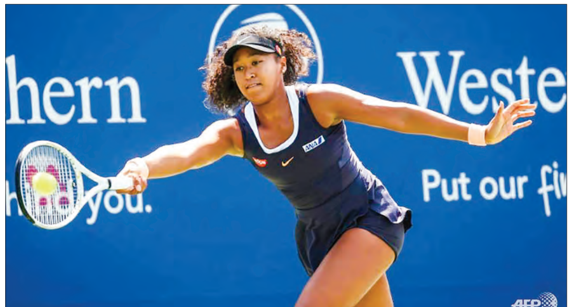
Japan's Naomi Osaka withdrew Wednesday from her scheduled WTA semi-final on Thursday against Elise Mertens of Belgium to protest the police shooting of an unarmed black man in Wisconsin on Sunday.

All NBA playoff games Wednesday were eventually postponed and Major League Baseball and Women's NBA clubs followed suit before Osaka became the trailblazer in tennis.—AFP ■