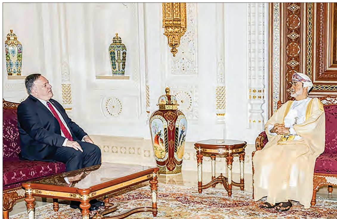
US Secretary of State Mike Pompeo meets Sultan Haitham of Oman on the final leg of a Middle East tour that failed to produce any public commitments to follow the UAE in normalizing relations with Israel.

The US chief diplomat had said he was hopeful other nations would follow the UAE, which became only the third Arab country to establish relations with Israel, after Egypt and Jordan.—AFP ■