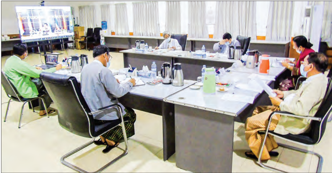
Chairman of MNHRC U Hla Myint joins videoconference on Southeast Asia National Human Rights Institutions Forum.

THE Southeast Asia National Human Rights Institutions Forum (SEANF) convened its second meeting from 25 August to 27 August through video conferencing.