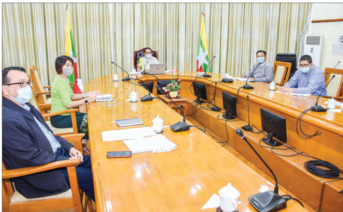
Union Minister Dr Than Myint discusses unity and effective works at 2020 ASEAN Leadership & Partnership Forum on 27 August.

UNION Minister for Commerce Dr Than Myint participated in the 2020 ASEAN Leadership &