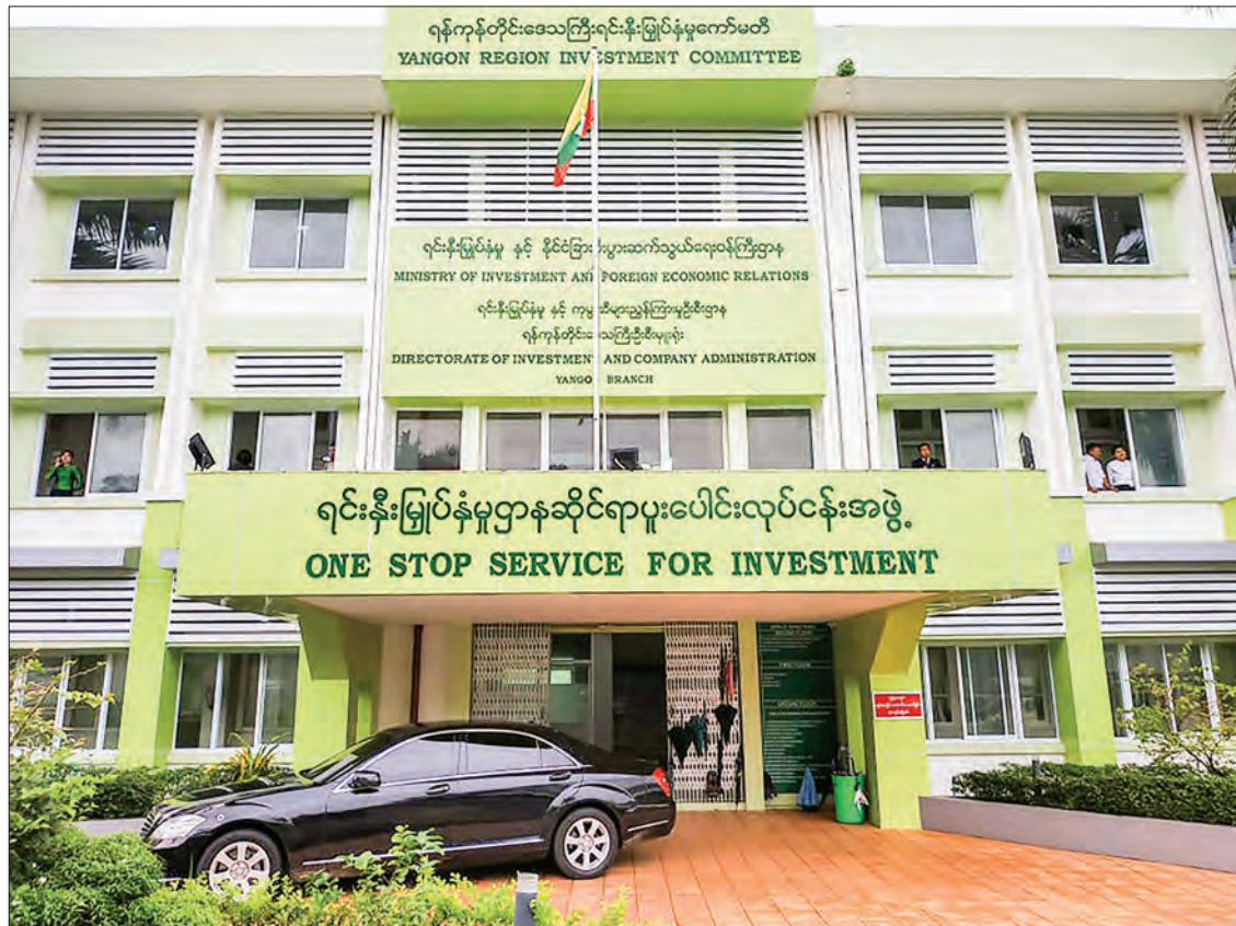
Front of the Yangon Region Investment Committee office building.

of investment projects, the Myanmar Investment Law allows the region and state Investment