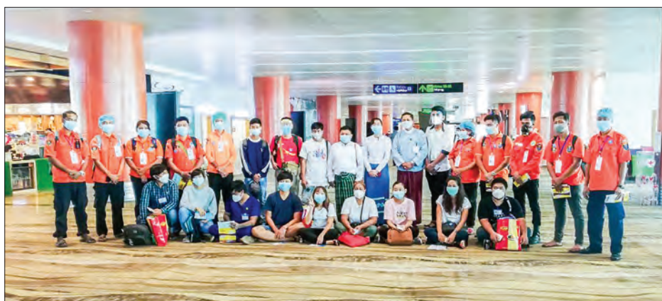
Volunteers to join measures against COVID-19 depart Yangon for Sittway on 27 August.

also received medical examinations from the Ministry of Health and Sports and are reportedly in good health.—MNA (Translated by Zaw Htet Oo)