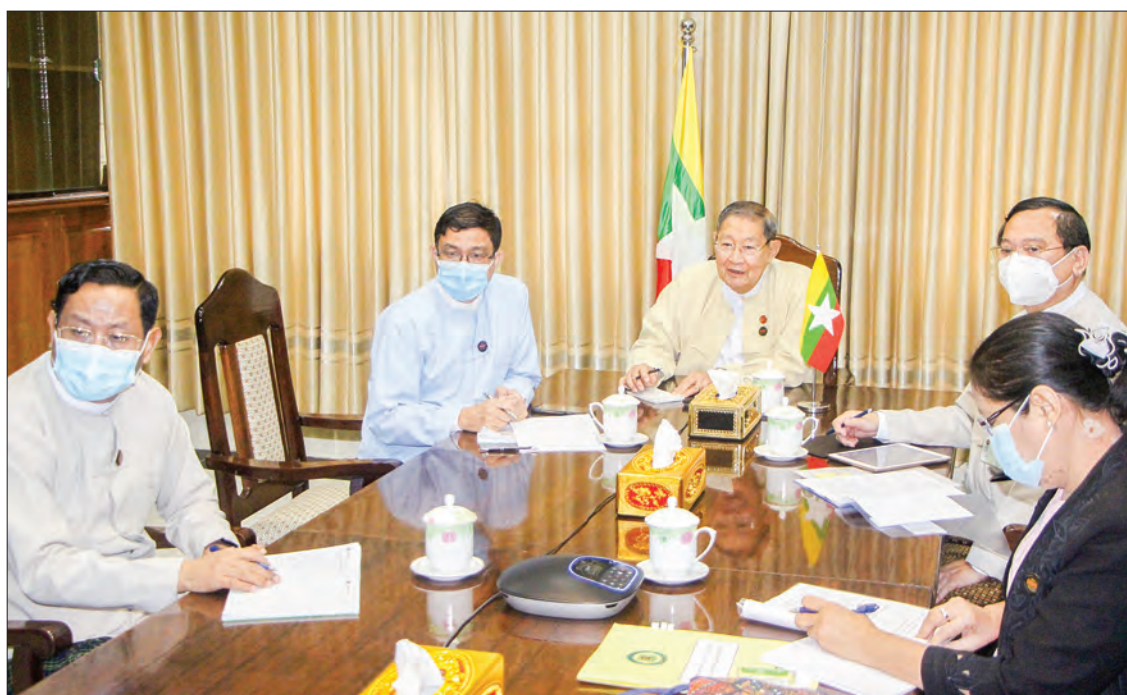
Union Minister U Soe Win joins virtual meeting with Asia Development Bank on establishment of Credit Guarantee Corporation on 27 August.