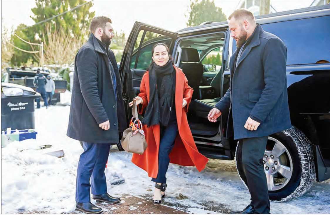
Huawei Technologies Chief Financial Officer Meng Wanzhou exits her vehicle at her home after her court appearance on 17 January, 2020, in Vancouver.

OTTAWA—Canada's foreign minister has called the release of two citizens detained in China a "top priority" for his country during a meeting with his Chinese counterpart in Italy.