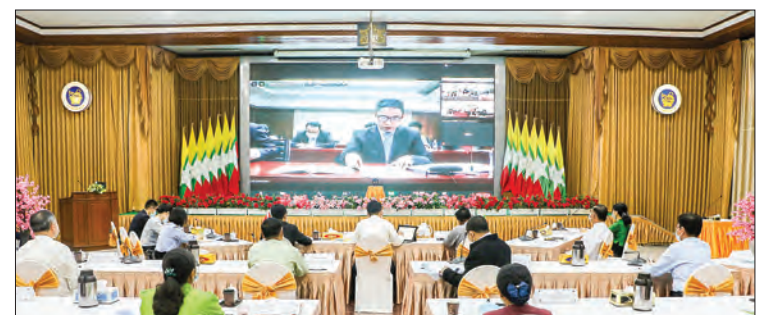
The ministries of commerce of Myanmar and China hold an online meeting on trade promotion.

They also discussed organizing the 3 rd CIIE, 17 th CAEXPO