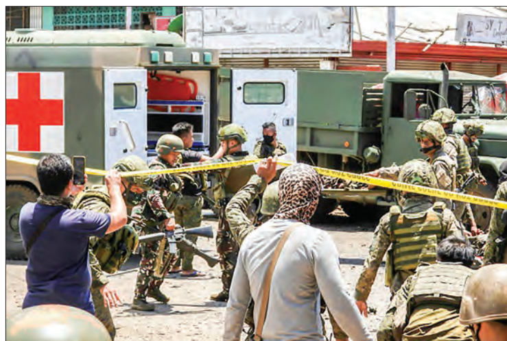
Suicide attacks were once very rare in the Philippines, but since July 2018 there have been five.

MANILA—Two female suicide attackers who carried out a double bombing in the southern Philippines were the widows of militants who had worked for the Islamic State-linked Abu Sayyaf group, the army chief said Wednesday.