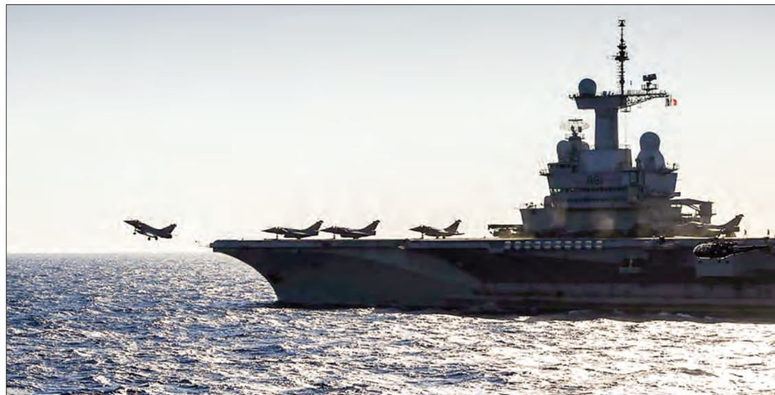
A rafale fighter jet takes off from the French aircraft carrier Charles de Gaulle sailing in the Mediterranean sea on September 29, 2016 as part of the Operation Arromanches III.