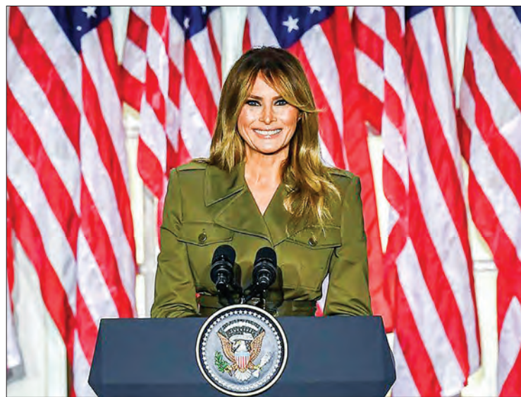
US First Lady Melania Trump addresses the Republican Convention during its second day from the Rose Garden of the White House August 25, 2020, in Washington, DC.

WASHINGTON—Melania Trump put a kinder, gentler sheen on Donald Trump's reelection campaign with a star turn at the Republican convention Tuesday where she broke ranks to speak compassionately about coronavirus victims and recalled her own immigrant story in an appeal for racial harmony.