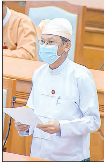
Union Attorney-General U Tun Tun Oo