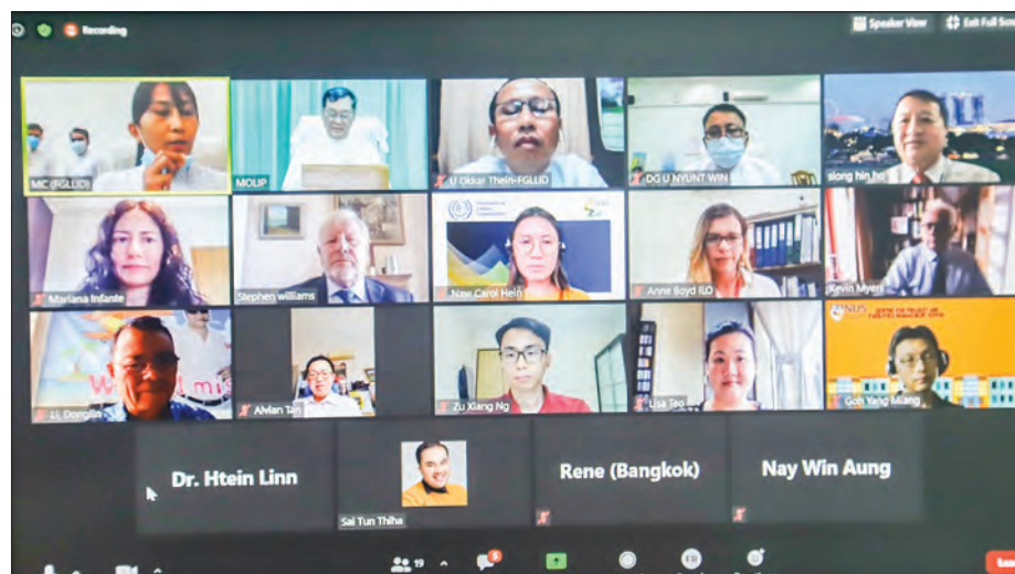
Union Minister U Thein Swe engages in a virtual meeting to support the drafting of the Occupational Safety and Health Law from his office in Nay Pyi Taw.

At the meeting, the Union Minister said he welcomed the participation of ILO members and international experts in enacting the rules to protect the workers with safe and secure working environment and to promote scoping safe workplaces and health issues.