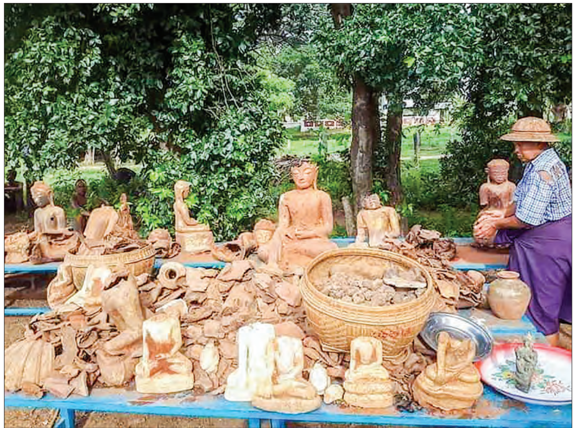
Buried ancient objects accidentally discovered near pagoda in Wayar Village, Kani Township.

The discovered antiques are ancient Buddha statues, stone stupas, pots and palm-leaf manuscripts. The villagers are still discussing how to manage those found old objects.