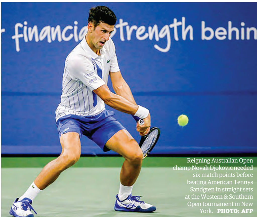
Reigning Australian Open champ Novak Djokovic needed six match points before beating American Tennys Sandgren in straight sets at the Western & Southern Open tournament in New York.

NEW YORK—An out-of-gas Serena Williams crashed out of the Western & Southern Open on Tuesday, losing in three sets to 13th seeded Maria Sakkari 5-7, 7-6 (7/5), 6-1 in New York.