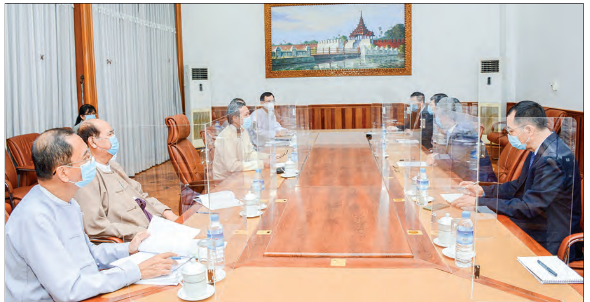
Union Minister Dr Myo Thein Gyi holds talks with Chinese Ambassador Mr Chen Hai on launching joint research projects between Myanmar and China.

The Union Minister also expressed words of thanks for annual scholarships to Myanmar students and said that China and Myanmar began the diplomatic relations in 1950 and it had been 70 years in 2020; that cooperation on research and technology