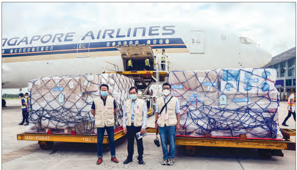
A special cargo flight of COVID-19 supplies from UNICEF arrives in Yangon International Airport yesterday.