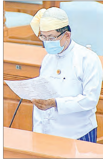
Deputy Minister for Planning, Finance and Industry U Maung Maung Win