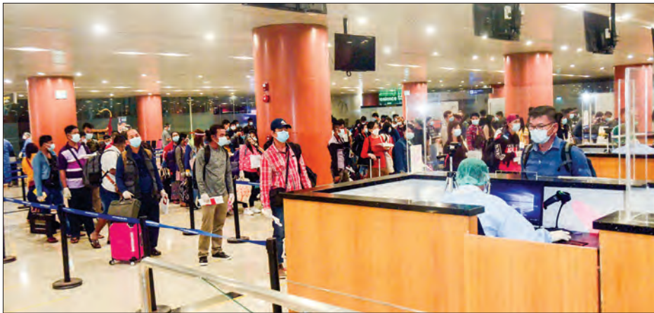
Myanmar citizens returning from Malaysia line up for immigration process at Yangon International Airport.

A relief flight of Myanmar Airways International (MAI) brought back 162 Myanmar nationals from Malaysia, and it landed at Yangon International Airport yesterday evening.