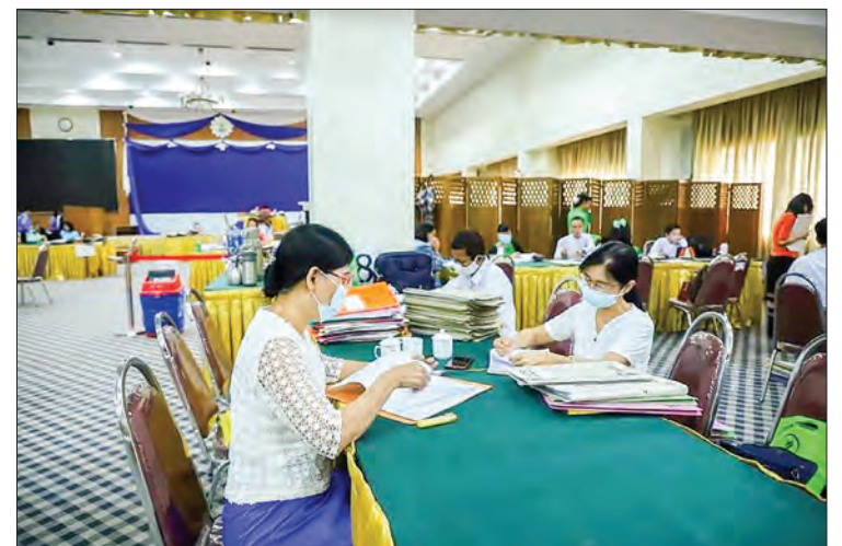
UMFCCI staff review 2 nd COVID loan applications for SMEs.

The committee received more than 10,000 loan applications including over 76,000 applications through the entrepreneurs from states and regions, over 1,500 in person at UMFCCI