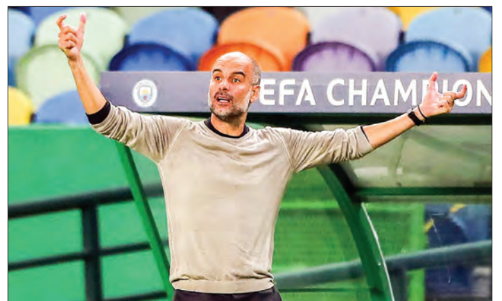
Manchester City manager Pep Guardiola.

Al Mubarak insists there is no rush to resolve the future of the former Barcelona and Bayern Munich manager, but he is not panicking about a potential exit. “This conversation with Pep is a natural conversation. Pep and I have a very clear understanding about what is right for the club and what is not,” Al Mubarak told City’s website on Tuesday. “We have a clear alignment in terms of where we see the future and what we want in terms of success for the club. “I think, again, it will be a comfortable conversation and it will work out in the best way for Pep, for me and for the club. I’m very comfortable about that.” Guardiola took charge at City on an initial three-year deal in 2016 and extended that by a further two seasons in 2018.