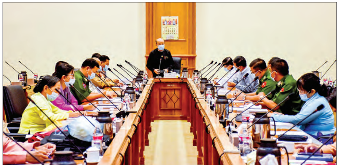
Deputy Pyidaungsu Hluttaw Speaker U Tun Tun Hein addresses a meeting of the Pyidaungsu Hluttaw Joint Bill Committee focussing on the 2020 Union Tax Bill.