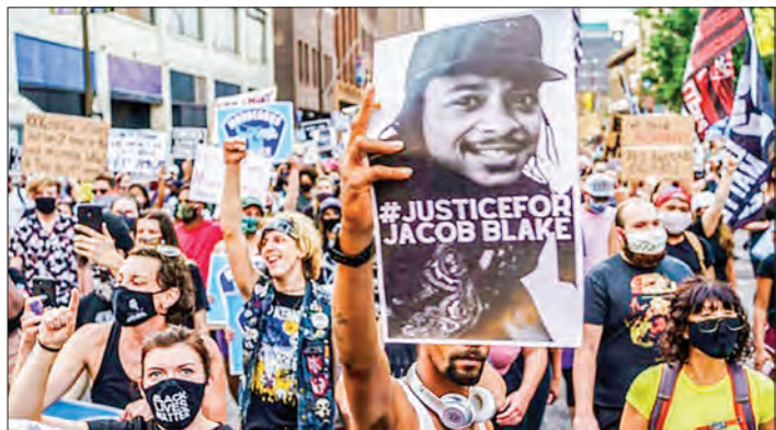
The most recent police shooting of an African American has sparked renewed outrage and protests in US cities, including New York and Minneapolis, as part of the Black Lives Matter movement.

The police statement said: “Investigators are aware of the social media videos being circulated regarding this incident.” The majority of protests have passed off peacefully, though some demonstrators also burned cars and buildings on Sunday and Monday nights in Kenosha.—AFP ■