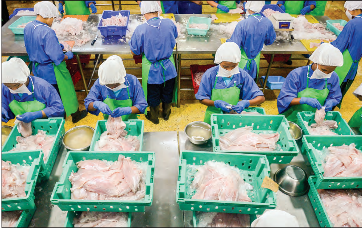
Workers work at a fish processing factory in Yangon.

“There are currently 124 aquatic processing industries and 27 of them have permission to export to EU. As per the export countries’ requirements of food safety, the relevant country’s department has to issue necessary health certifications and quality assurance. As every country asks for the food safety system now, the Department of Fisheries is focusing on serving in accordance with the foreign markets. This year’s marine export volume is