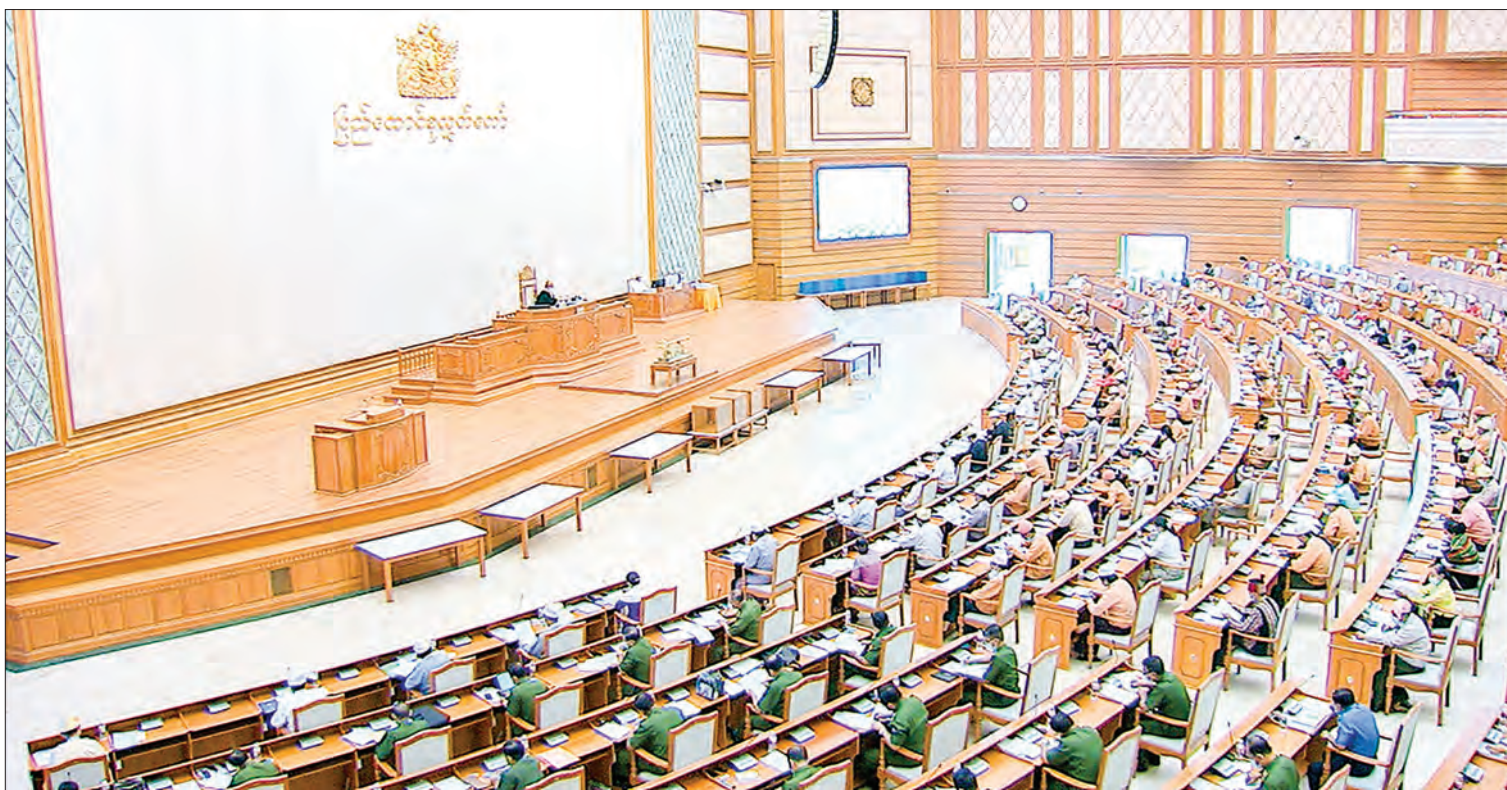
The 13 th -day meeting of the 17 th regular session of the Second Pyidaungsu Hluttaw in progress yesterday.

Pyidaungsu Hluttaw held its 13 th -day meeting of 17 th regular session yesterday, approving the Union Accord Part III,