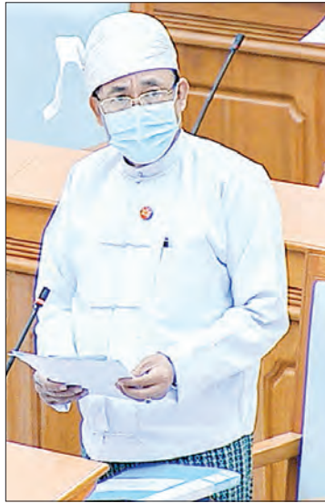
Union Minister for International Cooperation U Kyaw Tin

MP Daw Shwe Shwe Sein Latt from Bago Region constituency 3 supported the agreement, saying as it stipulates