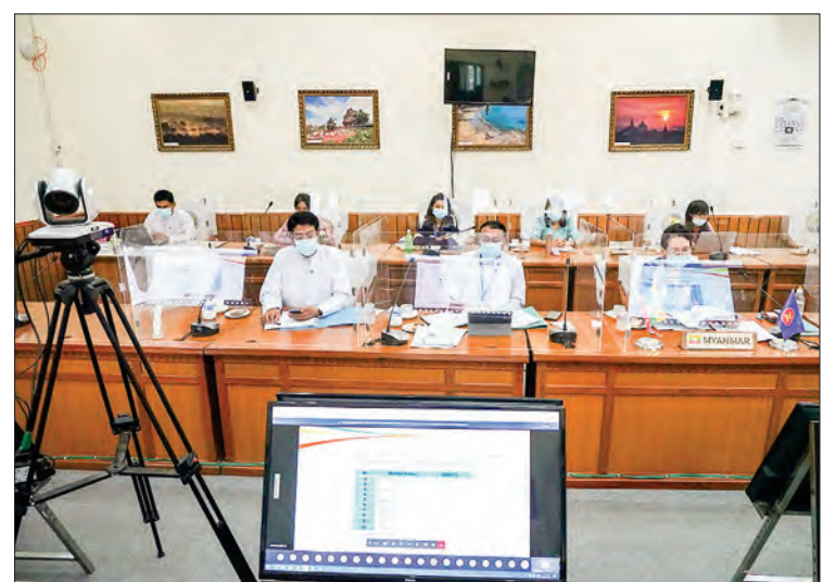
Members of the Directorate of Hotels and Tourism participate in the 2 nd special videoconference meeting on COVID-19 organized by the ASEAN Tourism Crisis Communication Team.