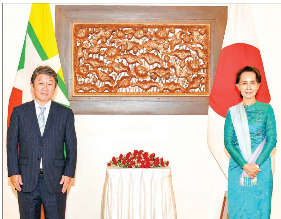
State Counsellor Daw Aung San Suu Kyi (R) and Japanese Foreign Minister Mr Toshimitsu Motegi (L) meet in Nay Pyi Taw on 24 August 2020.

D AW Aung San Suu Kyi, State Counsellor and Union Minister for Foreign Affairs received and held a bilateral meeting with Mr Toshimitsu Motegi, Minister for Foreign Affairs of Japan who is on an official visit to Myanmar at 2:00 pm on 24 August at the Ministry of Foreign Affairs.