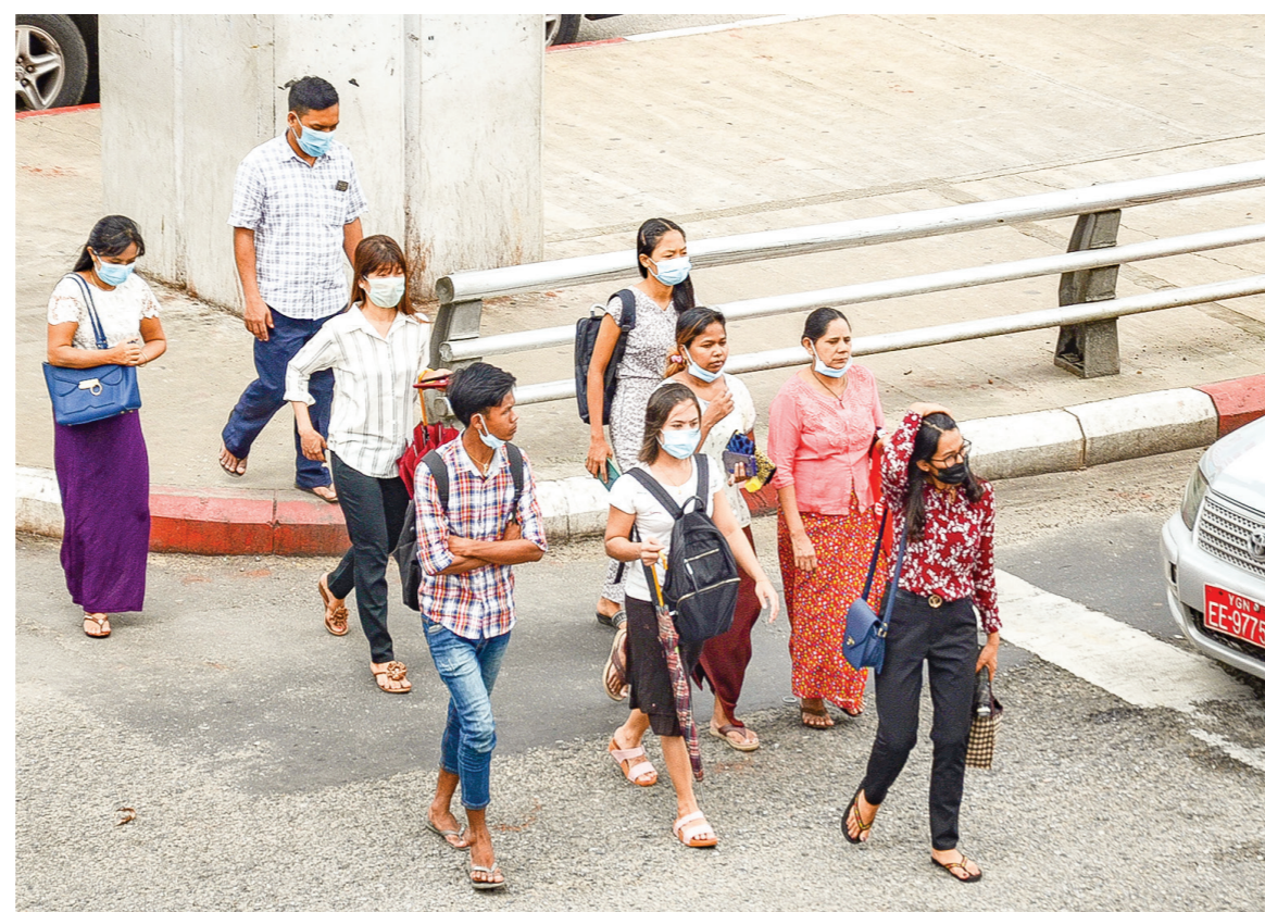
People are seen wearing face masks in Yangon.

Increase in "home delivery" system of buying food, medicines and other goods has seen a rise in the number of "courier service workers" who undertake the "delivery" to the customer's door. Increasing number of young persons are using bicycles to deliver the goods. It's good in the sense that a