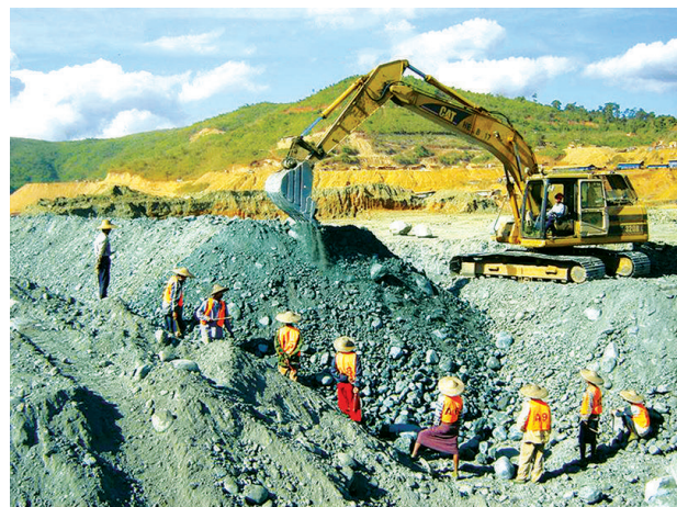
Miners search for jade stones at a dump site in Lonkhin, Kachin State.

The deposit will be refunded if they are not allowed for operation. If mining operators abide by the prescribed rules and regulations, they can extend the licence. —Tar Ling Maung (IPRD)