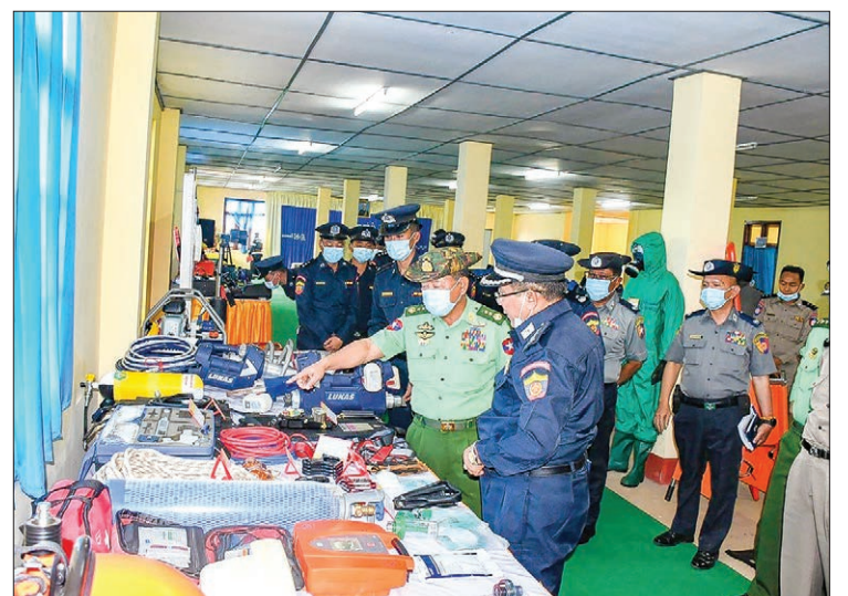
Union Minister Lt-Gen Soe Htut views the displays of firefighting equipment at Taunggyi District Fire Station in Shan State on 24 August 2020.

Director of the Shan State Fire Services Department U Tin Min explained the operation of activities of the fire department. Lt-Gen Soe Htut then looked around the displays of firefighting and rescue equipment.—MNA(Translated by Maung Maung Swe)