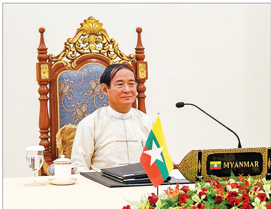
President U Win Myint participates in the Video Conference of the 3 rd Mekong-Lancang Cooperation Leaders' Meeting from his office in Nay Pyi Taw on 24 August 2020.

U WIN Myint, President of the Republic of the Union of Myanmar participated in the Video Conference of the 3 rd Mekong-Lancang Cooperation Leaders' Meeting at 8:00 am yesterday from the President Office in Nay Pyi Taw.