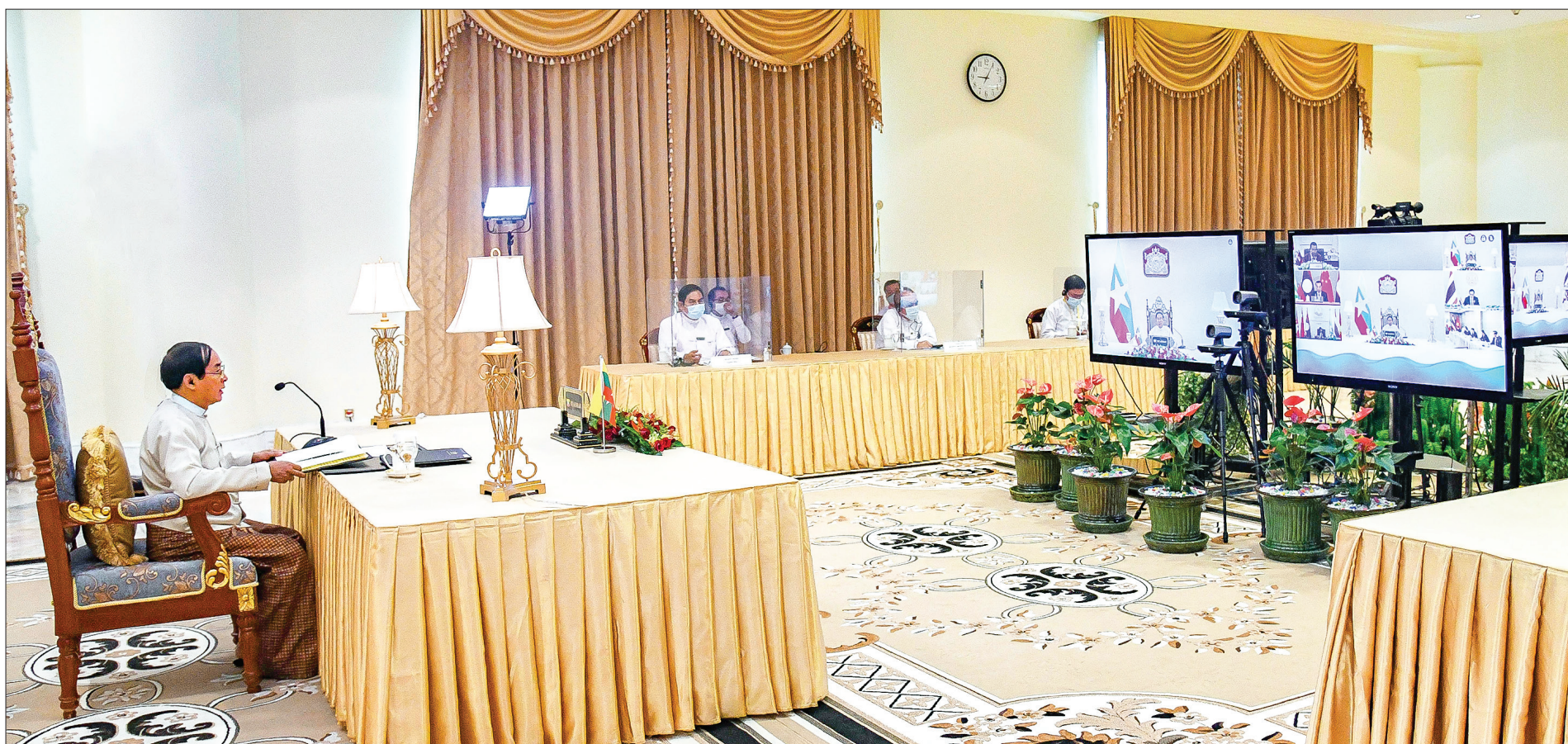
President U Win Myint (L) participates in the Video Conference of the 3 rd Mekong-Lancang Cooperation Leaders' Meeting from his office in Nay Pyi Taw on 24 August 2020.