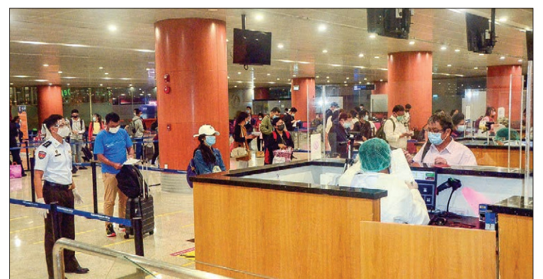
Myanmar citizens returned from Singapore queue for immigration service at the Yangon International Airport on 24 August 2020.

As per the directives of National-Level Central Committee on Prevention, Control and Treatment of Coronavirus Disease 2019 (COVID-19) and in coordination with other relevant ministries in Myanmar and the Myanmar embassies in respective countries, the Ministry of Foreign Affairs arranged 15 relief flights and chartered planes to bring back Myanmar people from Singapore.—MNA