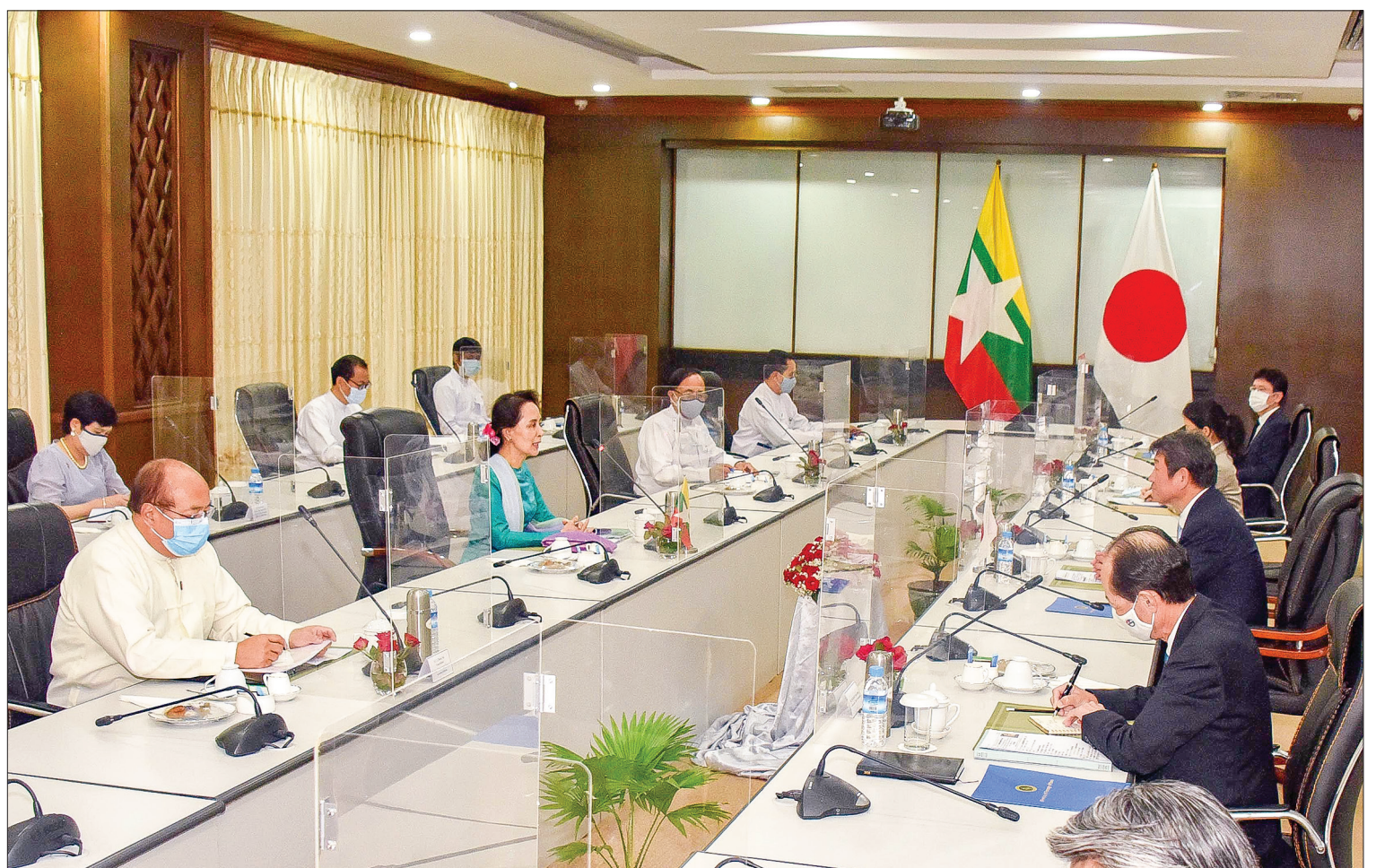
State Counsellor Daw Aung San Suu Kyi and party (L) hold meeting with Japanese Foreign Minister Mr Toshimitsu Motegi and party (R) at the Ministry of Foreign Affairs in Nay Pyi Taw on 24 August 2020.

During the visit, the two sides reached agreement to continue discussion in mid September to reciprocally allow the resident track pro-