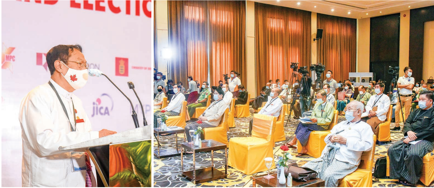
Union Election Commission Chair U Hla Thein (L) speaks at the eighth Media Development Conference at Parkroyal Hotel in Nay Pyi Taw on 24 August 2020.

THE 8th Media Development Conference was held at Parkroyal Hotel in Nay Pyi Taw under COVID-19 prevention guidelines from the Ministry of Health and Sports.