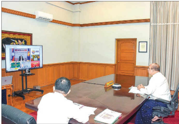
Union Minister for Investment and Foreign Economic Relations U Thaug Tun joins the 12 th CLMV Economic Ministers' Meeting (CLMV EMM) online on 24 August.

12 th CLMV Economic Ministers' Meeting was attended by the CLMV Economic Ministers and the Secretary-General of ASEAN Secretariat. The Ministers discussed the CLMV SEOM Chair's Report and the progress in the implementation of the CLMV Action Plan (2019-2020) and endorsed the CLMV Action Plan (2021-2022). The Minis-