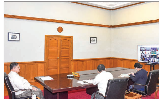
ASEAN Economic Ministers hold meeting online with ASEAN Business Advisory Council (ASEAN-BAC) on 24 August.