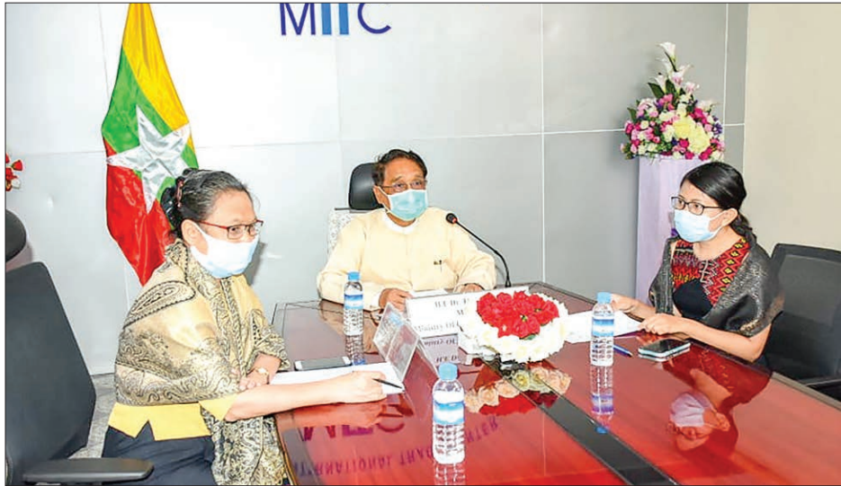
Union Minister Dr Than Myint joins the opening ceremony of Myanmar International Expo of Organic and Natural Products on 24 August.

UNION Minister for Commerce Dr Than Myint attended the opening ceremony of an online expo named Myanmar International Expo of Organic and Natural Products organized by Myanmar Trade Promotion Organization yesterday morning.