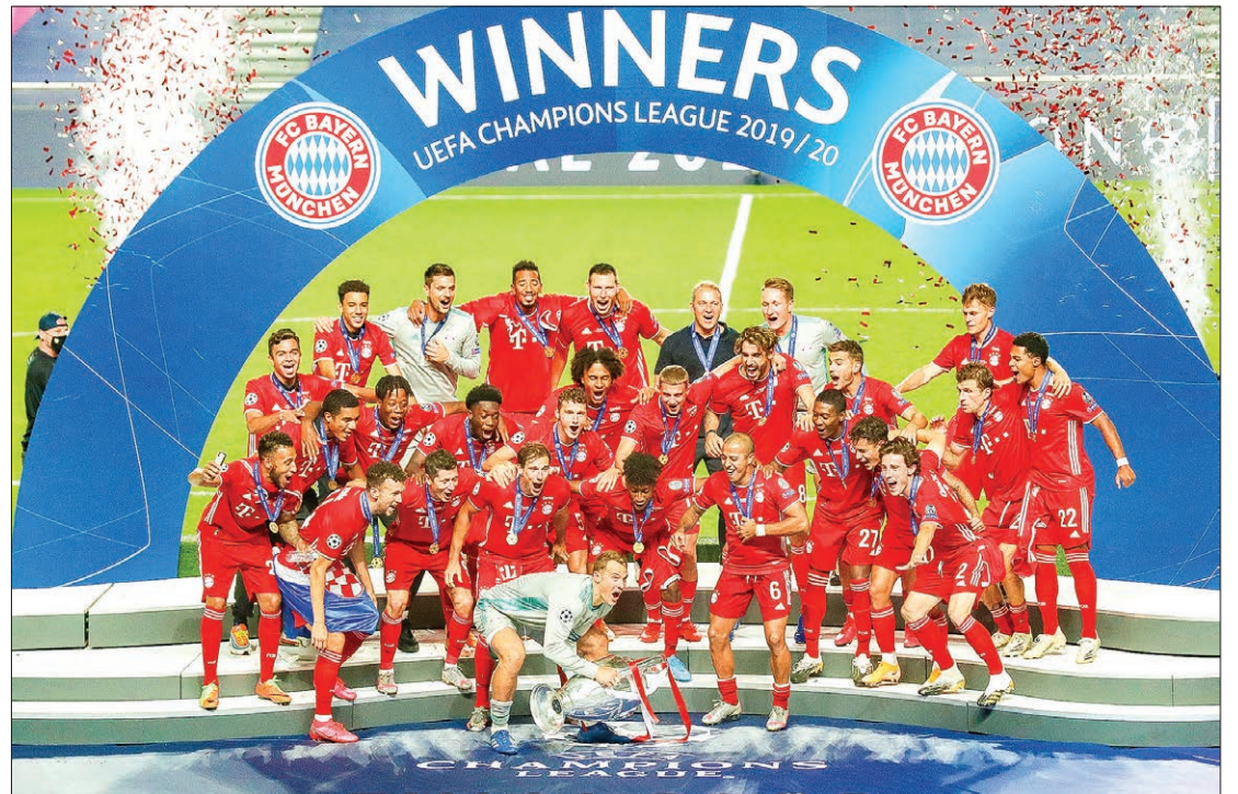
Bayern Munich players celebrate with the trophy after the UEFA Champions League final football match between Paris Saint-Germain and Bayern Munich at the Luz stadium in Lisbon on 23 August 2020.

One Bayern star has already left with Brazil playmaker Philippe Coutinho heading back to Barcelona after a year-long loan deal.—AFP ■