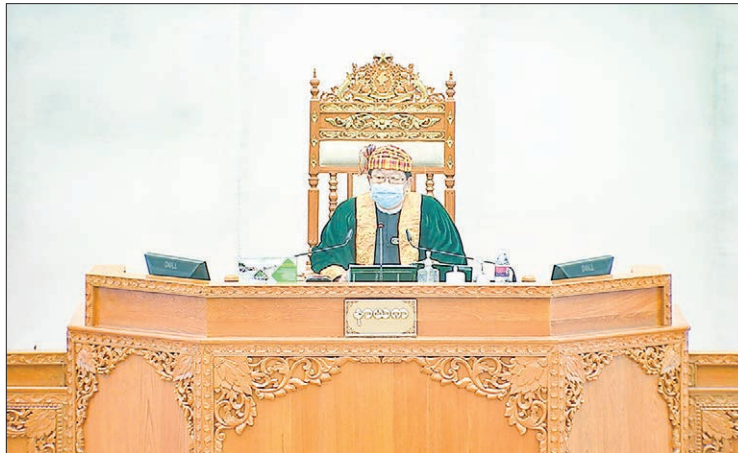
Pyidaungsu Hluttaw Speaker U T Khun Myat.

Union Minister for Construction U Han Zaw and Deputy Minister for Planning, Finance and Industry U Maung Maung Win brought a proposal before the parliament for getting 8.4 million euro loan that