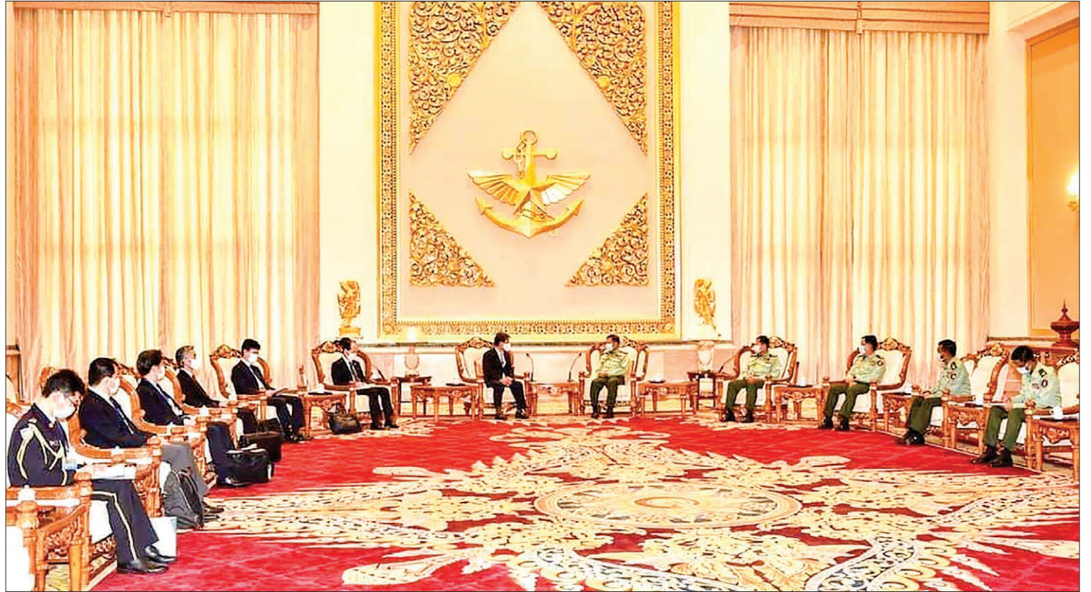
Commander-in-Chief of Defence Services Senior General Min Aung Hlaing receives Japanese Minister for Foreign Affairs Mr Toshimitsu Motegi at Zeyathiri Beikman in Nay Pyi Taw on 24 August 2020.

The meeting also focused on military operations of the Tatmadaw on the conflicts in Rakhine State in line with the existing laws while protecting the defending spirit of security forces in this area, and extending