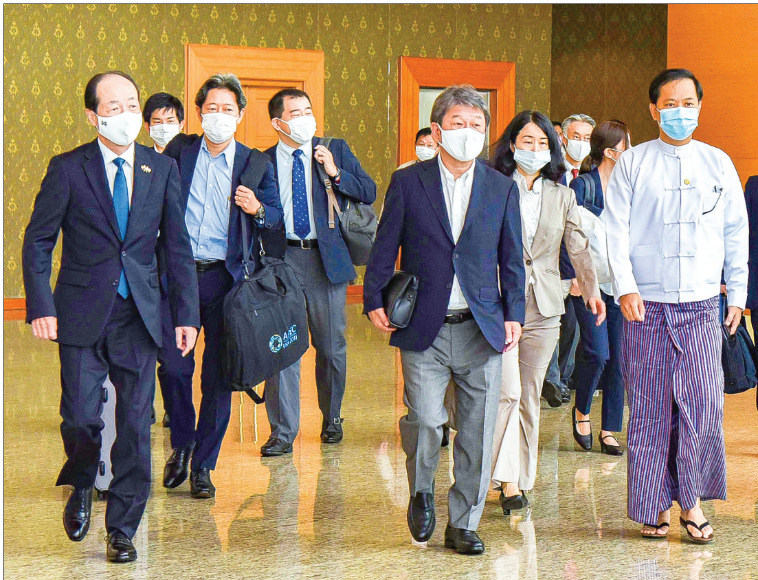
Japanese Foreign Minister Mr Toshimitsu Motegi arrives at the Nay Pyi Taw International Airport on 24 August 2020.

FOREIGN Minister of Japanese Government Mr Toshimitsu Motegi made an official visit to Myanmar yesterday after he left Lao People's Democratic Re-