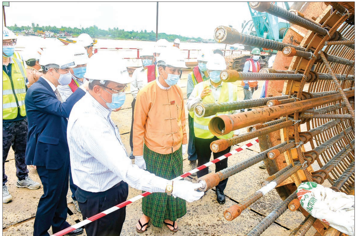
Yangon Region Chief Minister U Phyo Min Thein inspects construction of Myanmar-Korea Friendship Bridge (Dala) in downtown Yangon.

ter highlighted the safety and project quality and inspected the construction site from downtown Yangon.