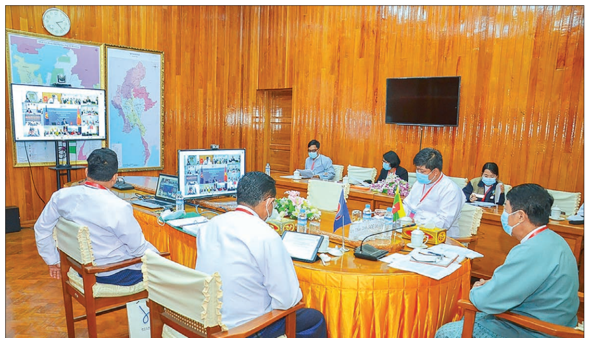
Senior officials from Myanmar join the 38 th Senior Officials Meeting on Energy (SOME) and Associated Meetings via videoconference on 24 August 2020.

The associated meetings were held with the affiliated nations USA, Russia, Countries of