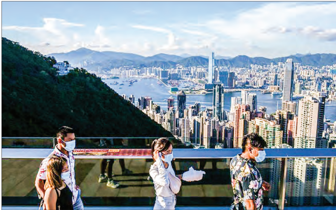
The Chinese government imposed a strict new national security law on Hong Kong, criminalizing secession, subversion, terrorism and foreign interference.

BEIJING — China has decided to suspend legal cooperation between its territory Hong Kong and the United States in retaliation for the latest move by the administration of President Donald Trump, the Foreign Ministry said Thursday.