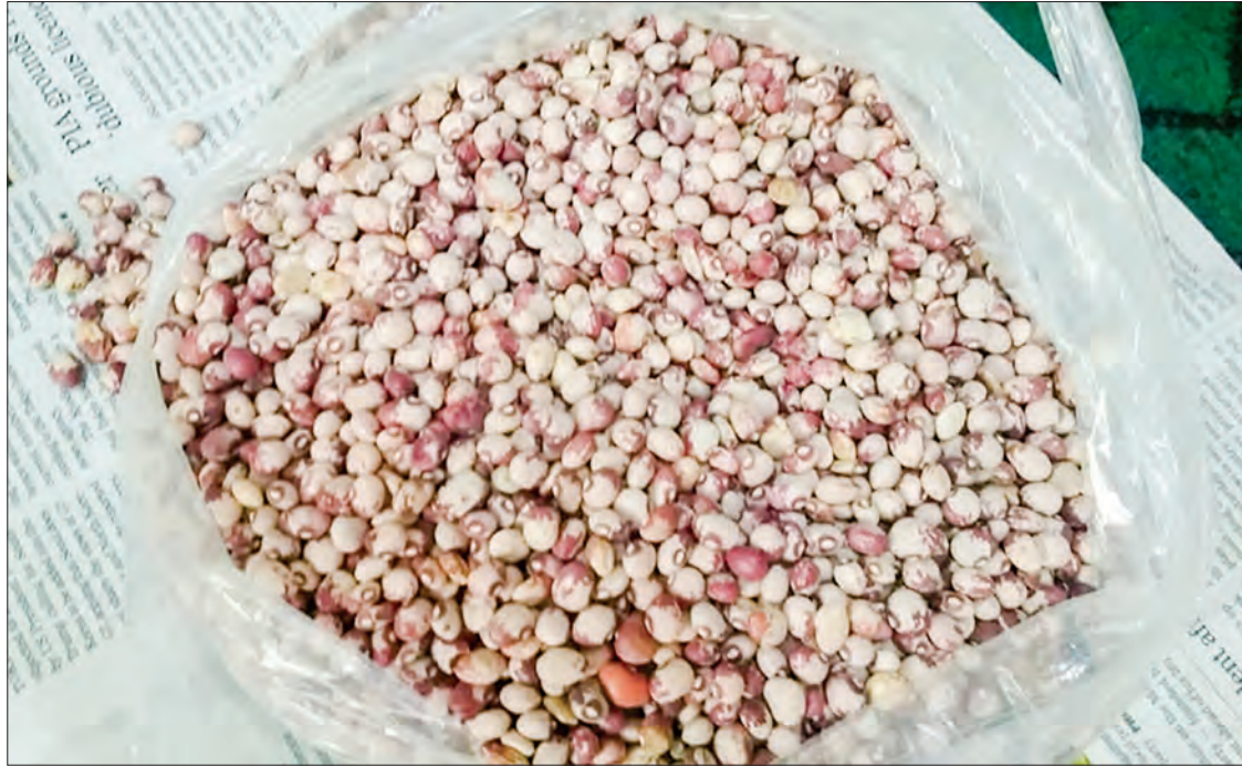
Myanmar exports about 75 per cent of butter bean production to foreign markets.

The heirloom bean currently fetches K57,000 per three-basket bag. The price is up by K500 as against July's rate. Meanwhile, the cost of butter beans has remained unchanged at K54,000 per pack, and they are selling well, said U Soe Win Myint, depot owner from Mandalay. "We are happy for market recovery. But, the price should have risen higher than that. Chinese traders cannot pay higher when the Yuan