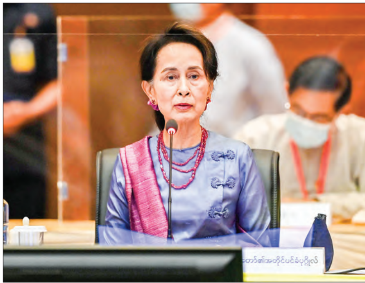
State Counsellor Daw Aung San Suu Kyi makes a speech at 20 th meeting of Union Peace Dialogue Joint Committee on 20 August.

We have already been able to obtain 51 basic principles from the various parts of the Union Accord, which we have already signed at the aforesaid two conferences. What are we going to do with these basic principles? Aren't we going to use them? Such kinds of questions exist. I want to say, don't worry about them. In Part II of the Union Accord which deals with the step by step programme and step by step implementations in the post-2020 period which will be signed at the present conference, we have achieved agreement only on (8) main headings. These (8) main headings are included in the five main sectors such as political, economy, social, security, land resources and environment which are part of the framework for political discussions formulated and adopted by our UPDJC. As we conduct the step by step discussions, the (5) main basic principles which we have achieved