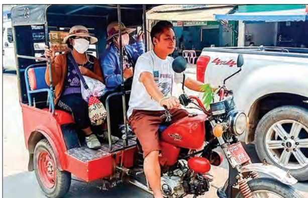
Myanmar has seen significant plunge of tourist arrival due to global coronavirus outbreak.