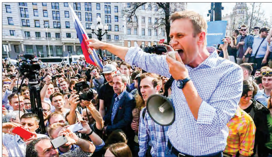
Russian opposition leader Alexei Navalny was flying from Siberia to Moscow and his plane made an emergency landing after he fell ill.

State news agency TASS reported that Nav-