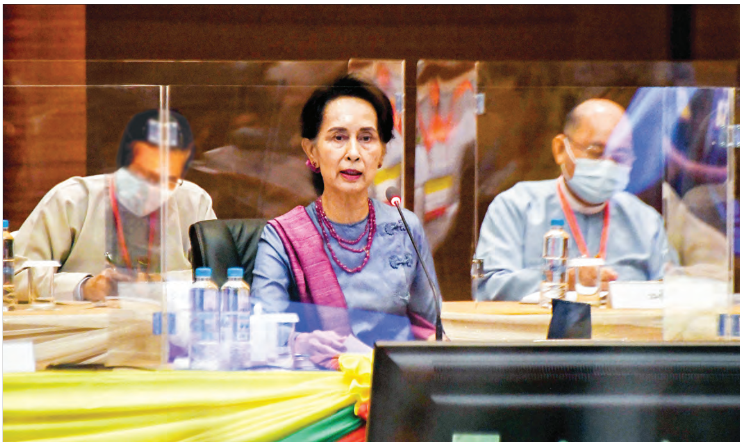
State Counsellor Daw Aung San Suu Kyi makes the opening remark at the 20 th meeting of UPDJC in Nay Pyi Taw on 20 August.

T HE Union Peace Dialogue Joint Committee organized the 20 th meeting yesterday at the Ruby Hall of Myanmar International Convention Centre I (MICC-I) in Nay Pyi Taw yesterday afternoon.