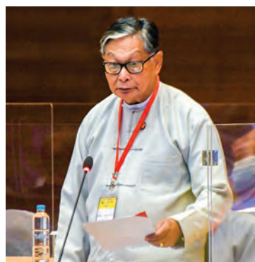
Union Minister U Kyaw Tint Swe.