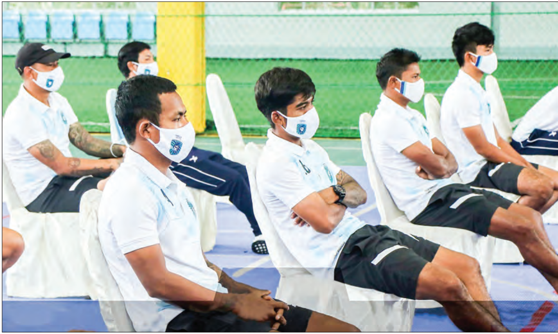
Yangon United players attend the updated FIFA Laws of the Games Course conducted by MFF on 20 August 2020.

COACHES, footballers and officials from Yangon United attended updated Laws of the Games Course, which was conducted yesterday at the indoor