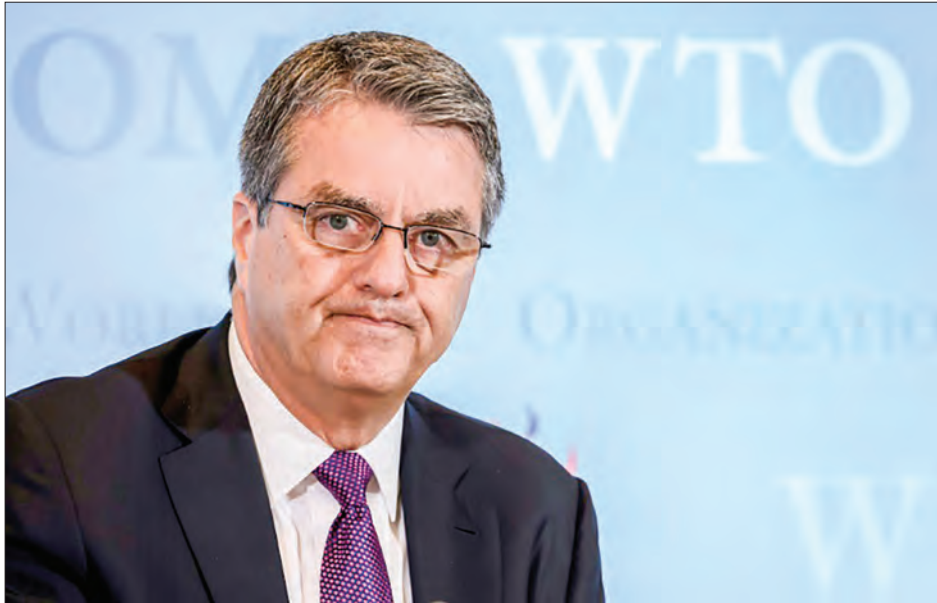
Outgoing World Trade Organization (WTO) chief Roberto Azevedo will move to a top job at US snacks and drinks giant PepsiCo.

GENEVA — The World Trade Organization's exiting chief, who is leaving the crisis-stricken institution a year ahead of schedule, will move to the private sector as a top executive at PepsiCo, the company said Thursday.