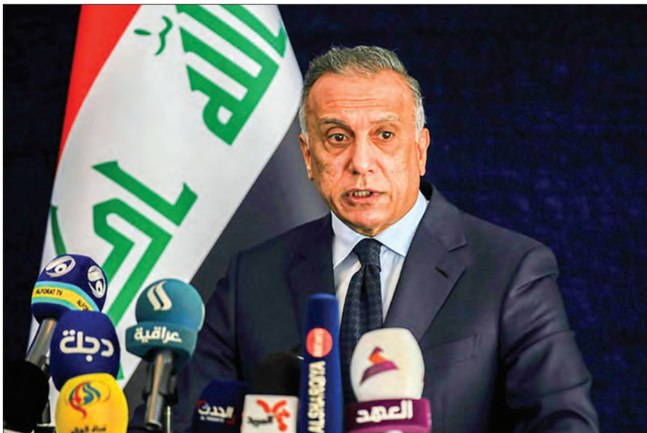
Iraqi Prime Minister Mustafa al-Kadhemi will meet US President Donald Trump on Thursday for the first time.

US Secretary of State Mike Pompeo said Wednesday that "armed groups not under the full control of the prime minister have impeded our progress," calling for them