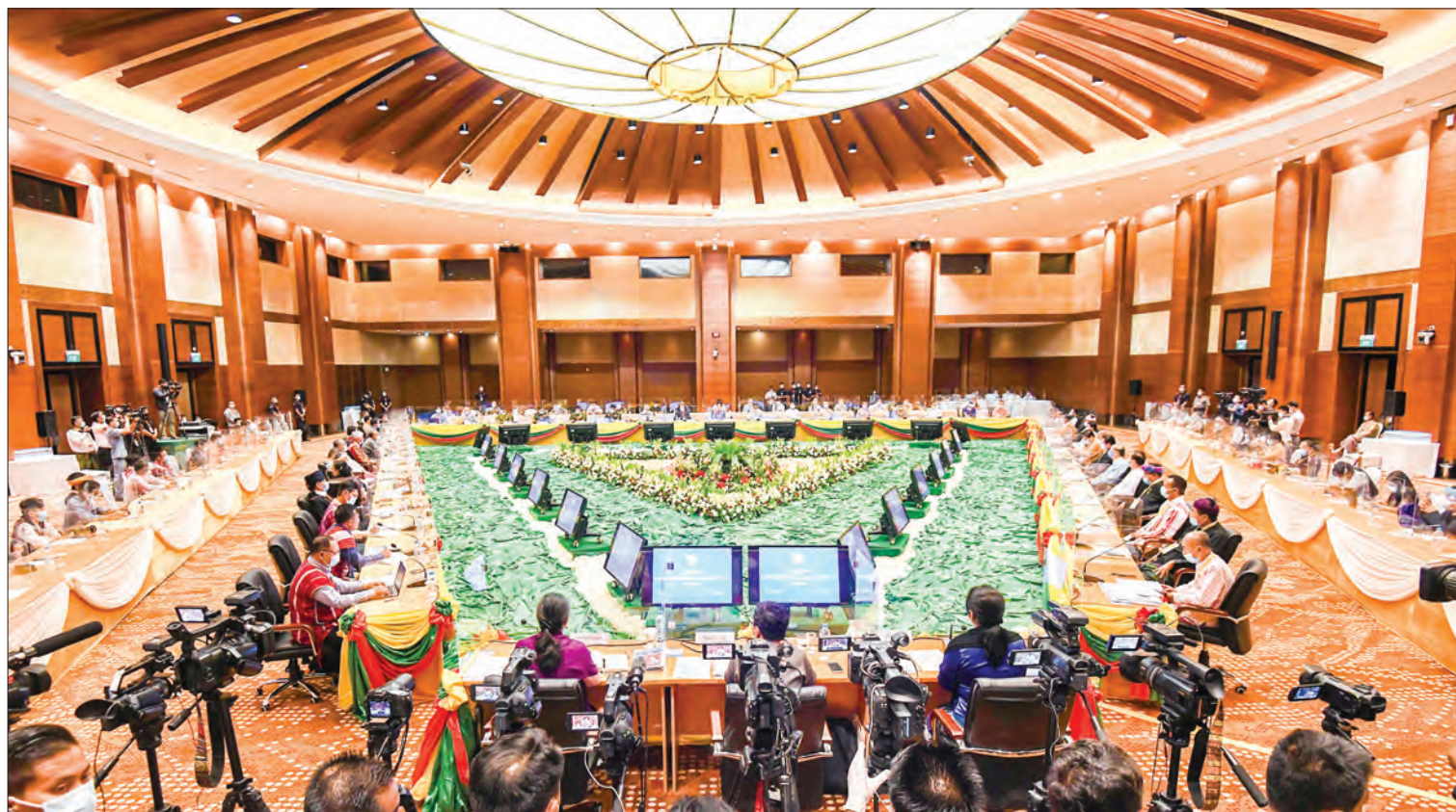
The 20 th meeting of UPDJC is in progress at the Ruby Hall of MICC-I in Nay Pyi Taw on 20 August.

was working both day and night in 2019 despite some worries about the delay of peace dialogues after the 10 Plus 10 Meeting in 2018.