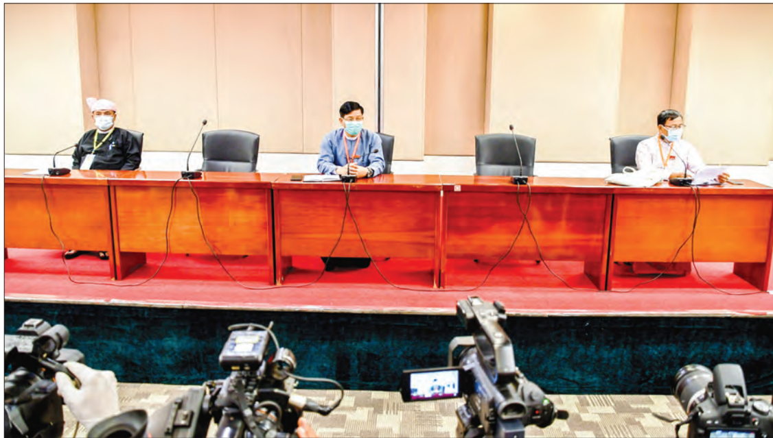
Press briefing is held after the 20 th meeting of UPDJC on 20 August.

He added that there are negotiations on MoUs as the EAOs seem to be observing the upcoming election and the situation