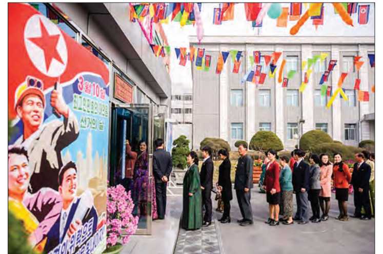
Voters queue to cast their ballots at the '3.26 Pyongyang Cable Factory' during voting for the Supreme People's Assembly elections, in Pyongyang on March 10.

The timing of the meeting in January, close to the inauguration of the winner of November's US presidential election, was intended as a signal, he added. Nuclear talks between Pyongyang and Washington have been stalled since the collapse of a Hanoi summit between Kim and US President Donald Trump last year.—AFP ■