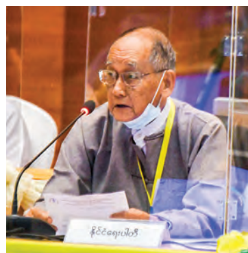
Vice-Chairperson U Thu Wai.