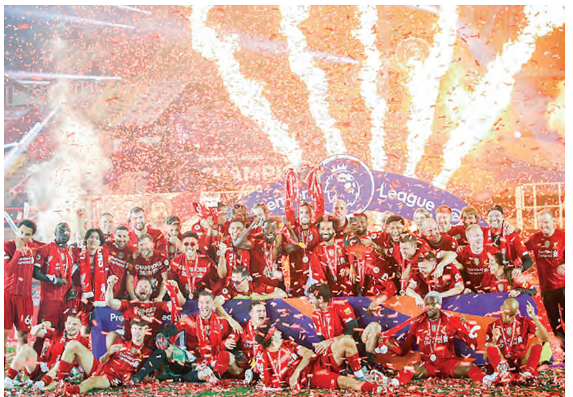
Liverpool begin their Premier League title defence against newly-promoted Leeds United.

Leeds are back in the top-flight for the first time since 2003/04, but could not have asked for a tougher start, on September 12 against the champions who have not lost a league game at Anfield in more than three years.—AFP ■