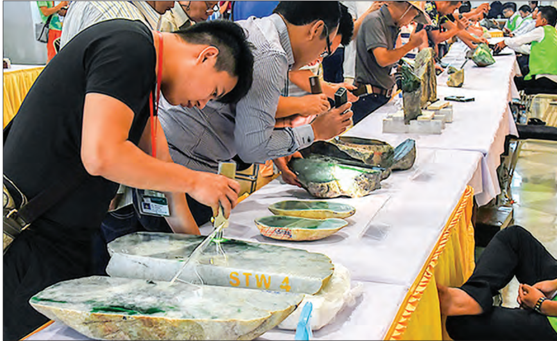
Merchants evaluate the quality of jade stones at the 55th Myanmar Gems Emporium in Nay Pyi Taw.

Export values have registered at $3.35 billion for agro products, $69.56 million for livestock, $757.35 million for fishery products, $1.59 billion for minerals, $128 million for forest products, $8.07 billion for manufactured goods, and $871.256 million for other commodities.