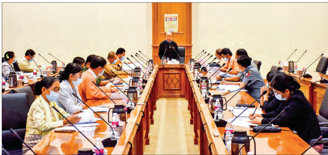
Joint Bill Committee discusses bill for amending the Law Protecting the Privacy and Security of Citizens and the 2020-2021 National Planning Bill on 20 August.

PYIDAUNGSU Hluttaw Joint Bill Committee held a meeting on the controversial bill for amending the Law Protecting the Privacy and Security of Citizens, and 2020-2021 National Planning Bill in Nay Pyi Taw yesterday.