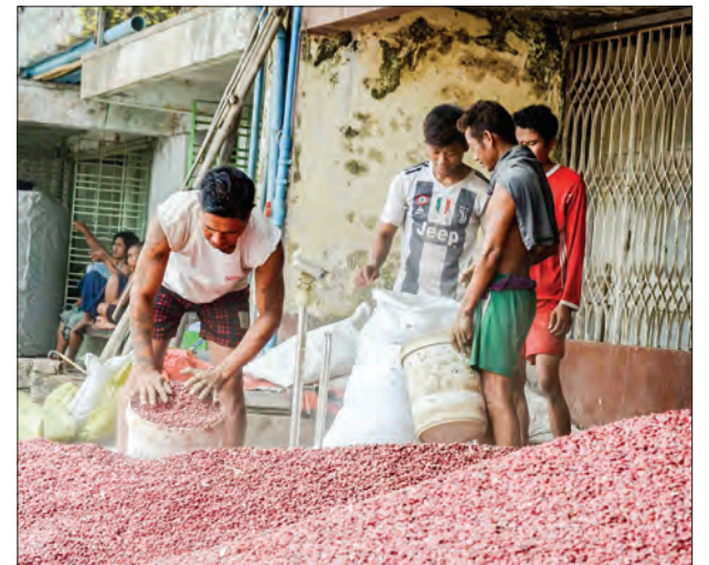
India narrowed down import deadline of beans and pulses, affecting Myanmar market.

With the changes in Indian policy on bean importation, Myanmar still falls short of the target, and it is not possible to