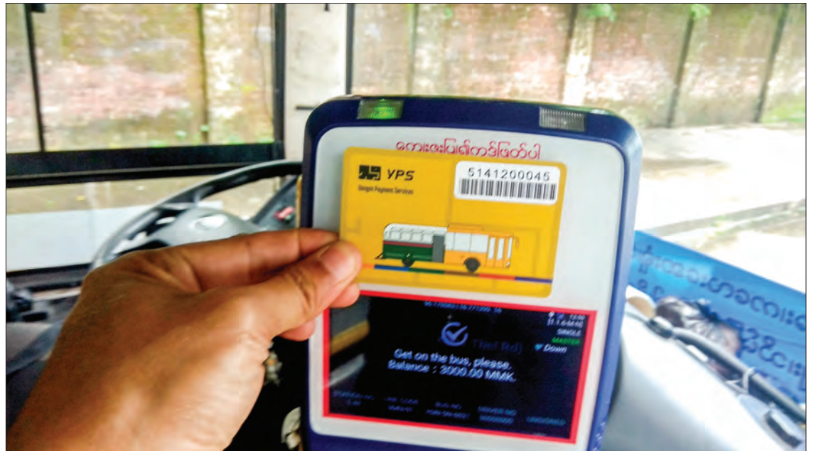
A staff of YBS demonstrates how to use a smart card with the card payment system.

Moreover, the passengers are urged to report to YRTA inspection teams whenever they find undisciplined vehicles calling Viber numbers 09448147149, 09448147153 and 09448147154 and also sending the videos or photos as evidence, according to YRTA.