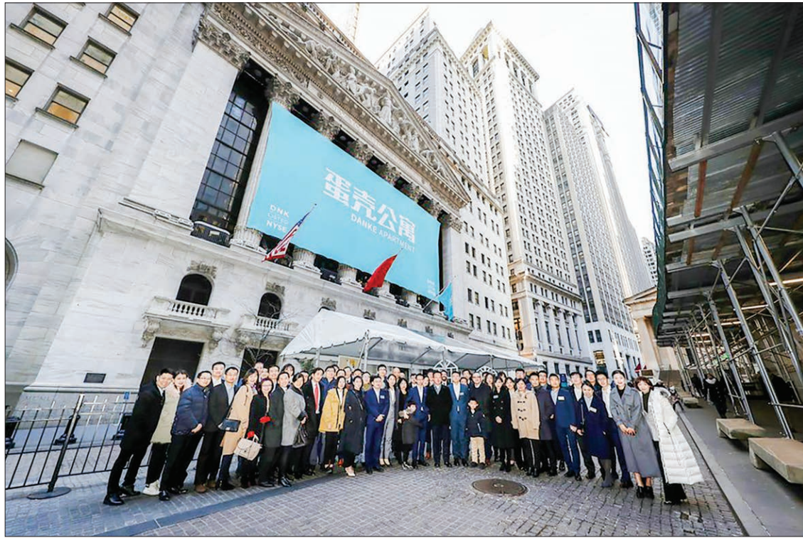
Invited guests of Phoenix Tree Holdings, a leading Chinese apartment rental service provider, pose for a group photo outside the New York Stock Exchange in New York, the United States, on Jan. 17, 2020.

There is no doubt that people have an eye open to the risks