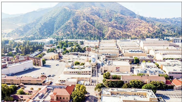
Warner Bros Studios in Burbank, California -- the industry is slowly getting back to work.