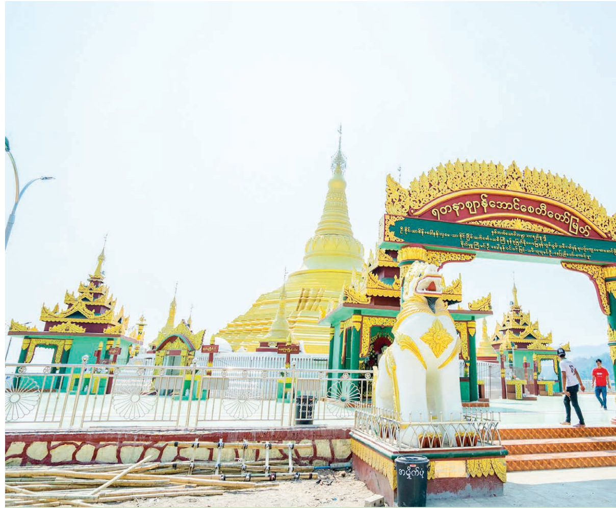
Entrance to Yadana Zanaung Pagoda.

There are lesser number of visiting sites in town and its environs. But, if you go far away, you