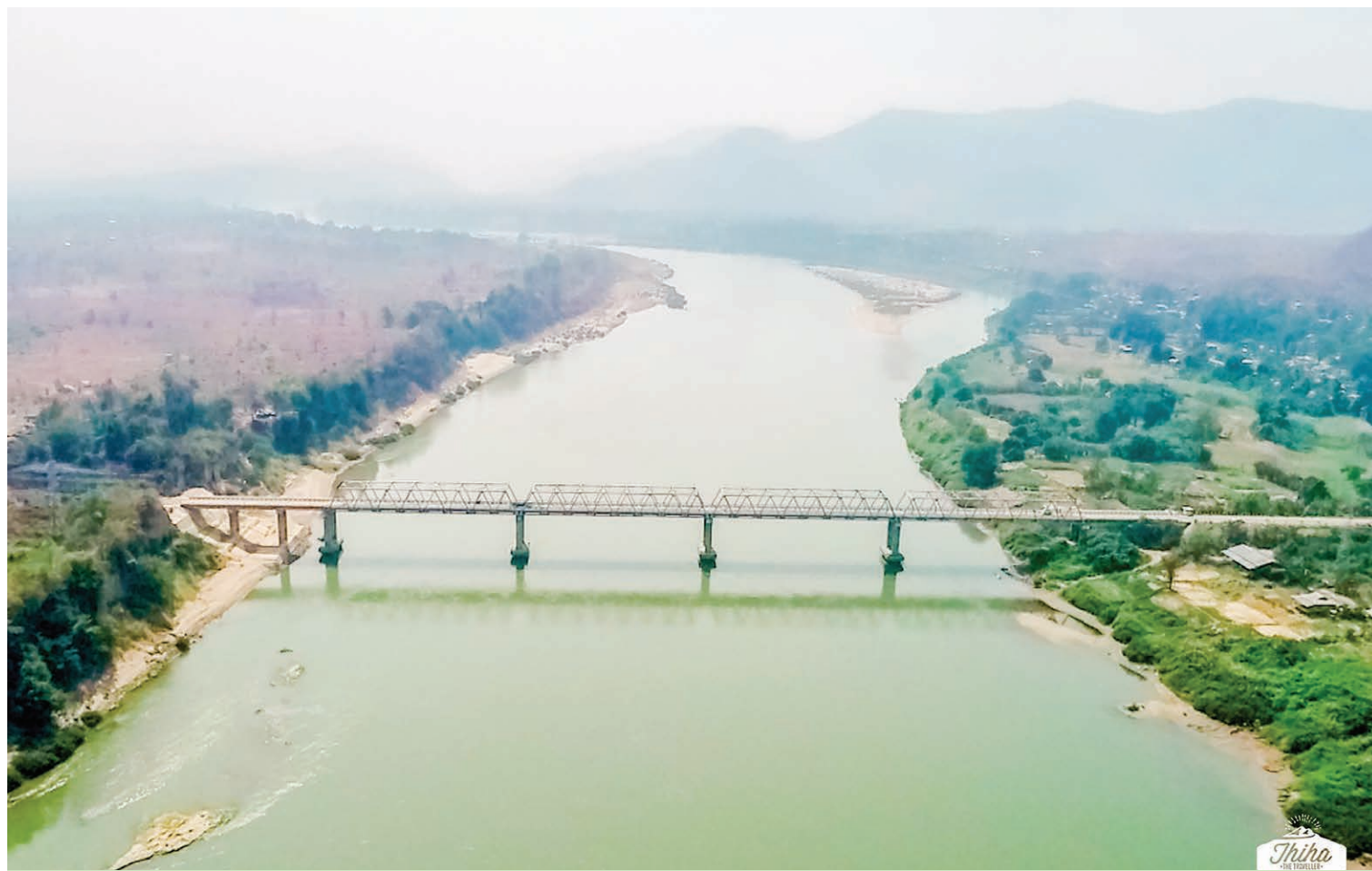
Thanlwin Bridge (Pasawng).