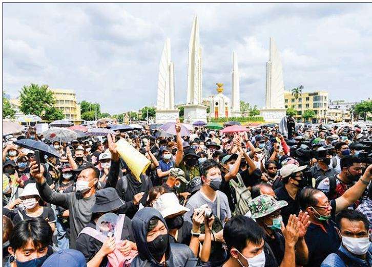
Thousands gathered in Bangkok in a protest against Thailand's government.

The protesters are demanding an overhaul of the government and a rewriting of the 2017 military-scripted constitution, which they believe skewed last year's election in favour of Prayut's military-aligned party.—AFP ■