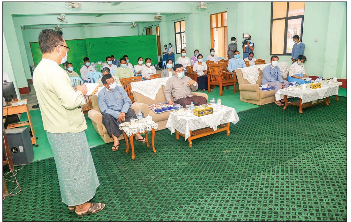
Union Minister Dr Win Myat Aye hears report on rehabilitation of young offenders at the youth training school in Thanlyin on 14 August 2020.

The Union Minister said that a manual for the youth training schools should be written, and the manual should include detailed instructions and the roles and responsibilities of the teachers and other staff. He pointed out that the majority of the juvenile crimes are drug offences, theft and robbery. The main reasons for them committing those crimes are being an orphan, poor guidance, family problems, poverty and drug misuses, said the Union Minister. He also emphasized the importance of sports, music and reading for rehabilitation of