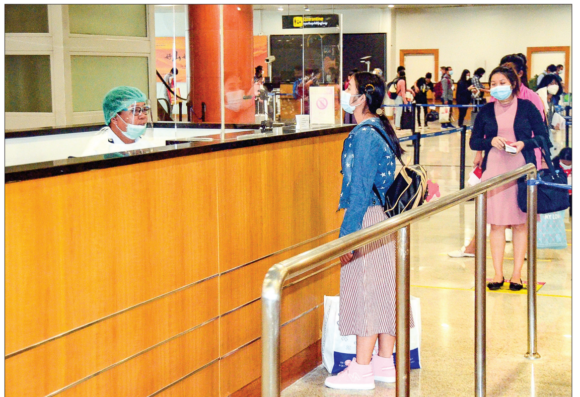
Myanmar citizens returned from Singapore queue for immigration process at the Yangon International Airport on 16 August 2020.

Until now a total of 14 batches of Myanmar citizens were repatriated from Singapore by relief flight. —MNA (Translated by Kyaw Zin Tun)