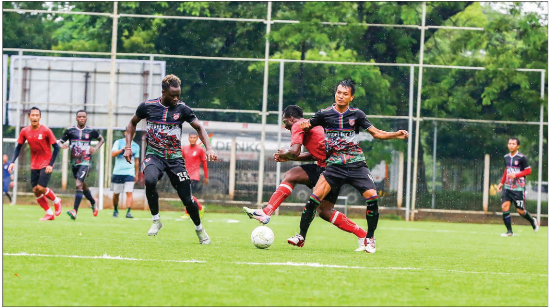
Chinland FC players (black) vying for the ball with Hanthawady United player (red) during their friendly match played at M3 stadium in Yangon on 16 August 2020.