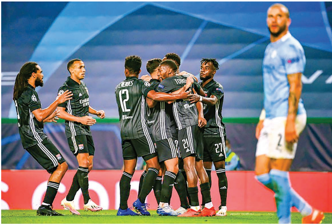
Lyon players celebrate after Moussa Dembele's second goal which sealed their 3-1 win over Manchester City in the Champions League quarter-finals in Lisbon on Saturday.

LISBON — Moussa Dembele came off the bench to score two late goals as Lyon caused another Champions League sensation on Saturday, dumping out Pep Guardiola's Manchester City with a 3-1 quarter-final win in Lisbon.