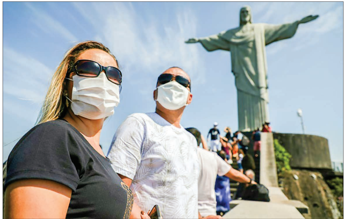
Tourists wearing face masks against the coronavirus enjoy the view from the base of Rio de Janeiro’s iconic Christ the Redeemer statue on August 15, 2020 as the city reopened some tourist attractions closed months ago.

Brazil’s National Confederation of Goods, Services and Tourism (CNC) estimates that the country’s tourism sector has lost 154 billion reales ($28.4 billion) over the last five months, operating at only 14 percent of its capacity.