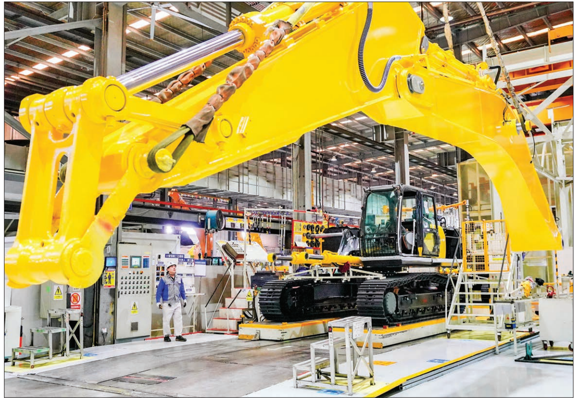
A staff member works at an engineering machinery company in Kaiping District of Tangshan, north China's Hebei Province, Nov. 17, 2019.

As far as China's more than 30 million small- and medium-sized enterprises and 80 million individual businesses are concerned, he admitted that they are still troubled with challenges