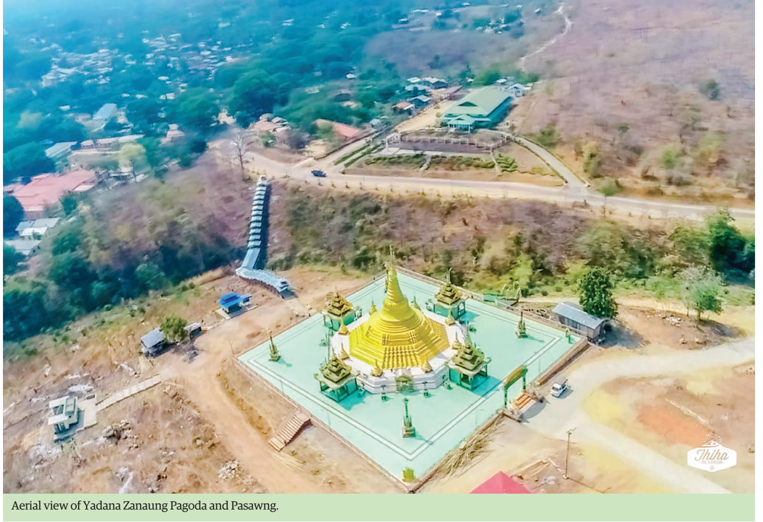
Aerial view of Yadana Zanaung Pagoda and Pasawng.