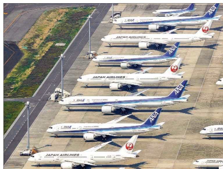
File photo taken April 2020 shows passenger planes at Haneda airport in Tokyo.

PLUNGING DEMAND WILL LEAD THE AIRLINE INDUSTRY TO LOSE $84.3 BILLION IN 2020