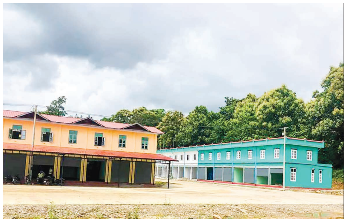
The construction of Tamu Highway Bus Terminal is 90 per cent complete.

"There are ten operators running highway air-conditioned bus for Tamu-Monywa,