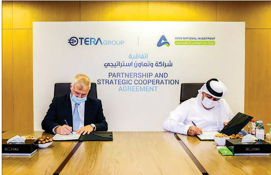
Representatives from the Emirati company APEX National Investment (R) and the Israeli TeraGroup sign an agreement to develop research on the novel coronavirus.

"We are delighted with this cooperation with Ter-