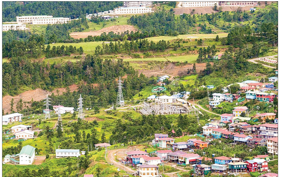
Vice President U Henry Van Thio inspecting the development of Haka from its viewpoint on 16 August 2020.