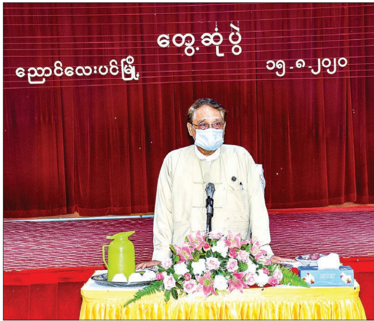
Union Minister Dr Than Myint delivers the speech at the public meeting in Nyaunglebin on 15 August 2020.

The Union Minister Dr Than Myint met Elephant Foot Yam farmers in Nantaw Village, Mone Khone Village-Tract in Bago on Saturday. The meeting was also attended by Bago Region Minister for Planning and Finance U Nyunt Shwe, a regional MP, the Department of Consumer Affairs Director General U Myint Lwin and other relevant officials. During the meeting, the Union Minister called on the farmers to grow more the export crop because it can generate large foreign income.