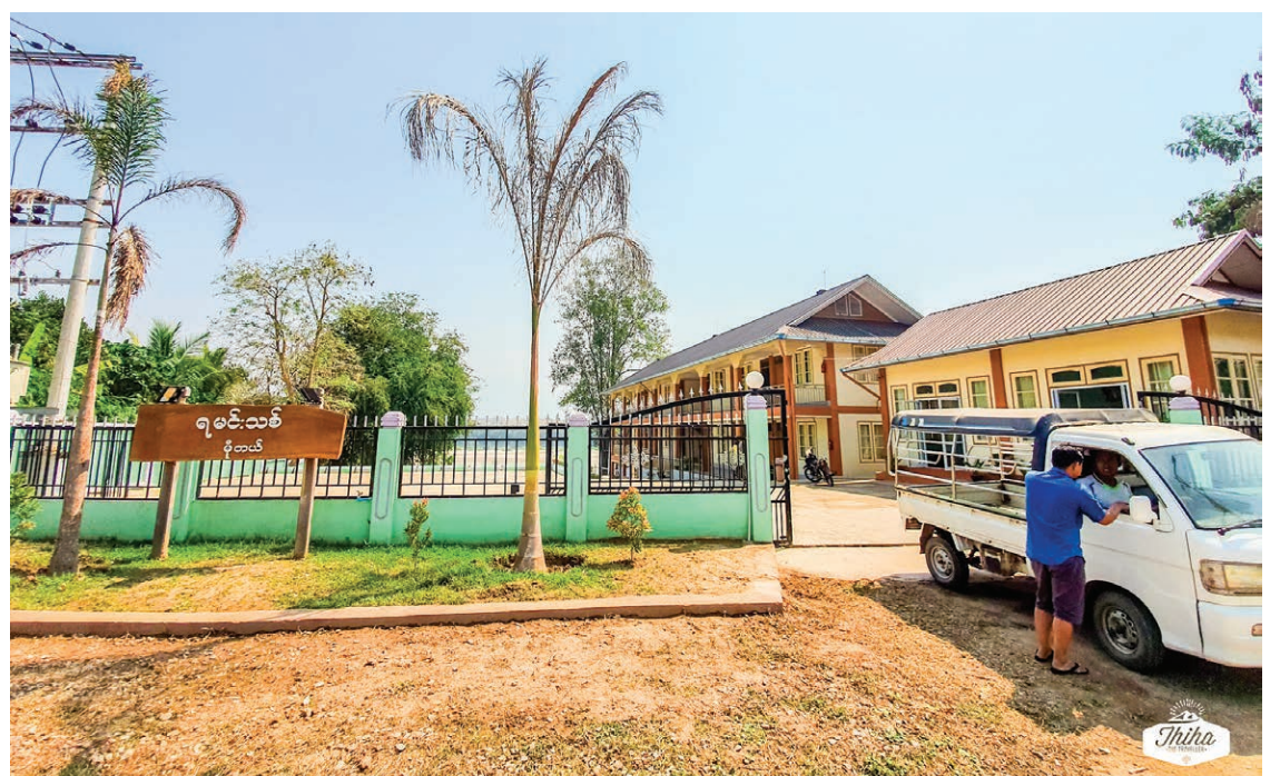
Yamin Thit Motel where I stayed.