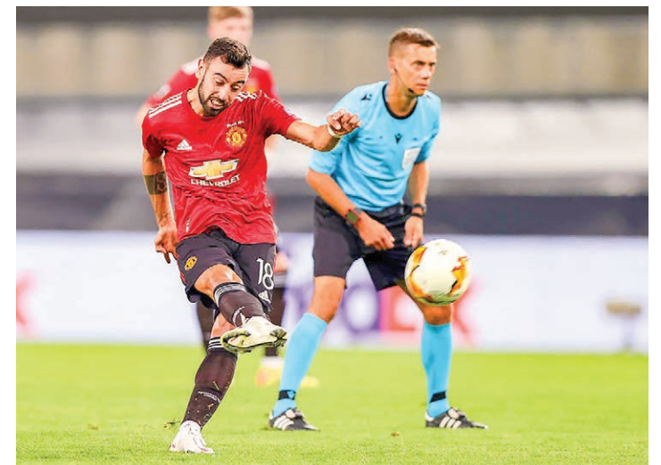
The signing of Bruno Fernandes has had a huge impact on Manchester United's season.

Fernandes has flourished where other big-money signings have floundered as United have failed to win a league title since Alex Ferguson's retirement in 2013 despite spending nearly £1 billion ($1.3 billion) in transfer fees.—AFP ■