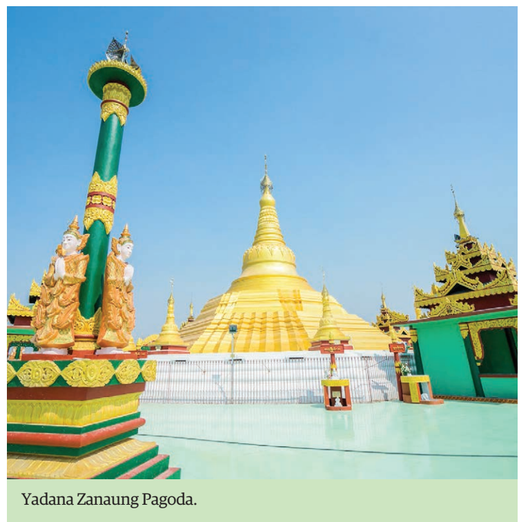
Yadana Zanaung Pagoda.