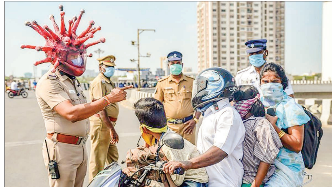
Police officer wearing coronavirus-themed helmet stops family at a checkpoint in Chennai during lockdown.

The repatriation of Indian nationals stranded abroad and the evacuation of foreigners from India to their home countries have been among the most successful aspects of our response. In the initial days, the ministry of external affairs had promptly set up a Covid cell and a 24x7 control room to assist Indian citizens abroad. The PM had also personally di-