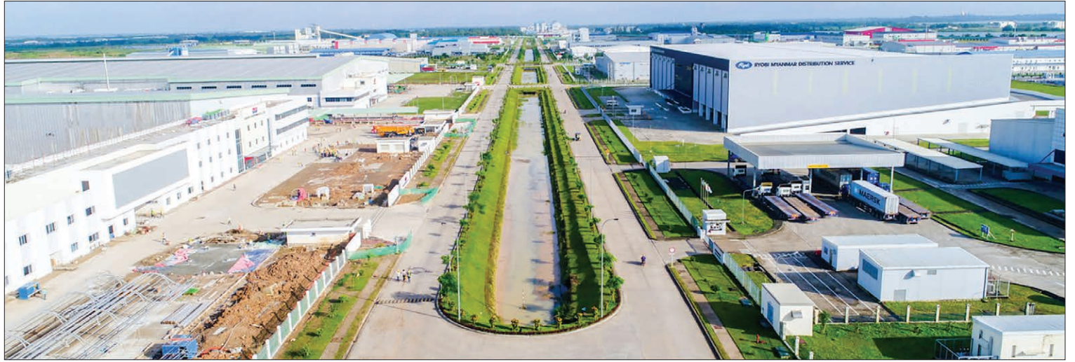
Over 60 per cent of businesses in the Thilawa Special Economic Zone are domestic-oriented manufacturing enterprises.

While the manufacturing sector has absorbed the largest share of foreign investments, FDI has also flowed into the trading, other services, transport and logistics, real estate, and hotel sectors. Japan has topped the list of foreign investors so far, accounting for over 34 per cent of the overall investment, followed by Singapore and Thailand. FDI has also flowed into the SEZs from the Republic of Korea, Hong Kong, the UK, Australia, the UAE, Malaysia, Austria, China (Taipei), Panama, China, Brunei, Viet