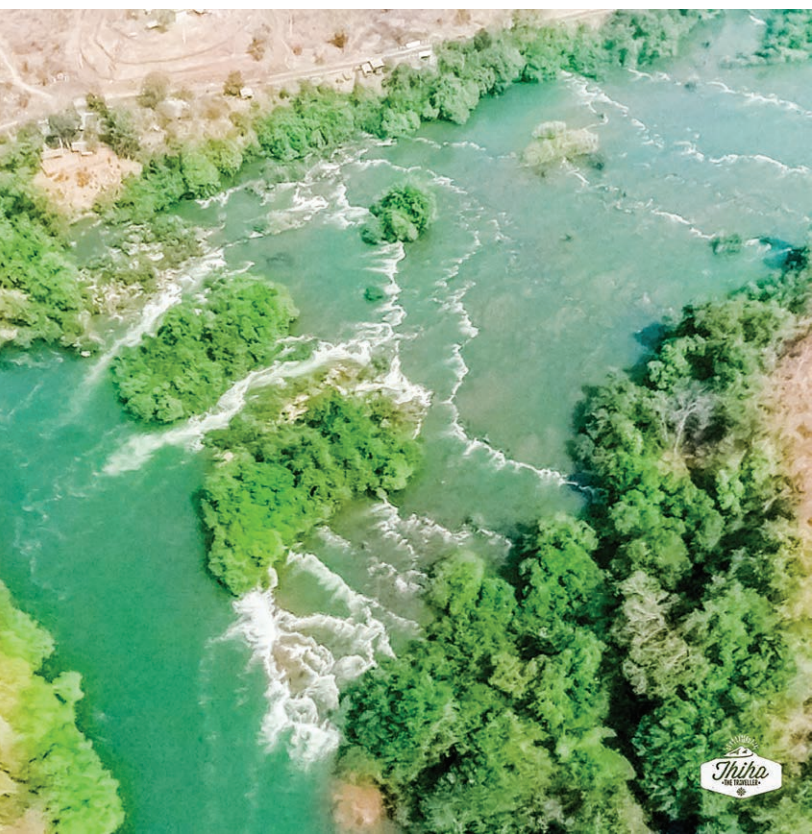
The street stretching along the creek and meets with the river.

may go to other visiting sites such as Mawchi mine (by driving an hour passing Khemaphyu Village), Ayaungpyaung Hill, Tananlok Cave, Meisei (sharing border with Thailand), Natt Hill, Bawlakhe and surrounding areas.