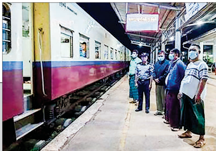
Officials from Lashio see off the returnees at the Lashio Railway Station in Lashio on 16 August 2020.