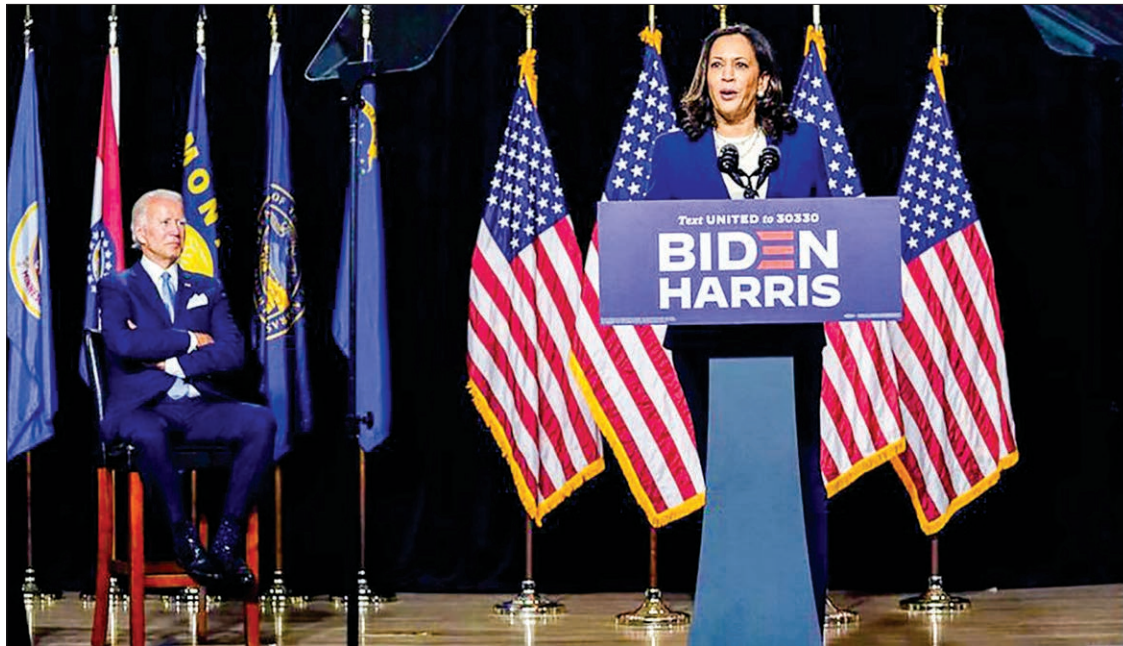
Democratic presidential candidate Joe Biden with his running mate, California Senator Kamala Harris.

And if the polls are any indication, the Democratic candidate's low-key style is paying off.