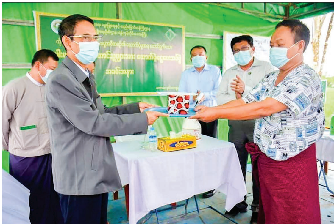
Union Minister Dr Aung Thu (L) presents CERP cash assistance to a farmer in Taw Kyaung Village, Kungyangon Township in Yangon Region on 15 August 2020.

They could stabilize the market by promoting cooperation among their offices in different