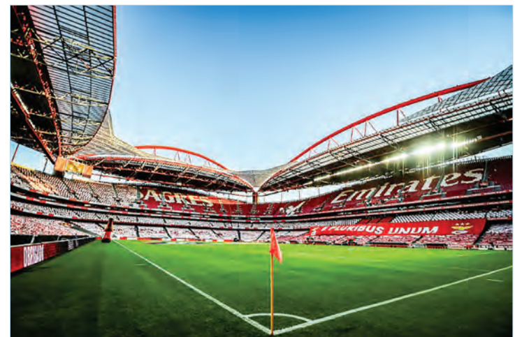
The Estadio da Luz, where PSG will play Atalanta behind closed doors on Wednesday, and where the Champions League final will be played on August 23.

Before that match, PSG will look to reach the semi-finals for the first time since the Qatari takeover almost a decade ago and they were given a boost on the eve of their match against Atalanta as Kylian Mbappe was declared fit enough to play a part by coach Thomas Tuchel.—AFP ■