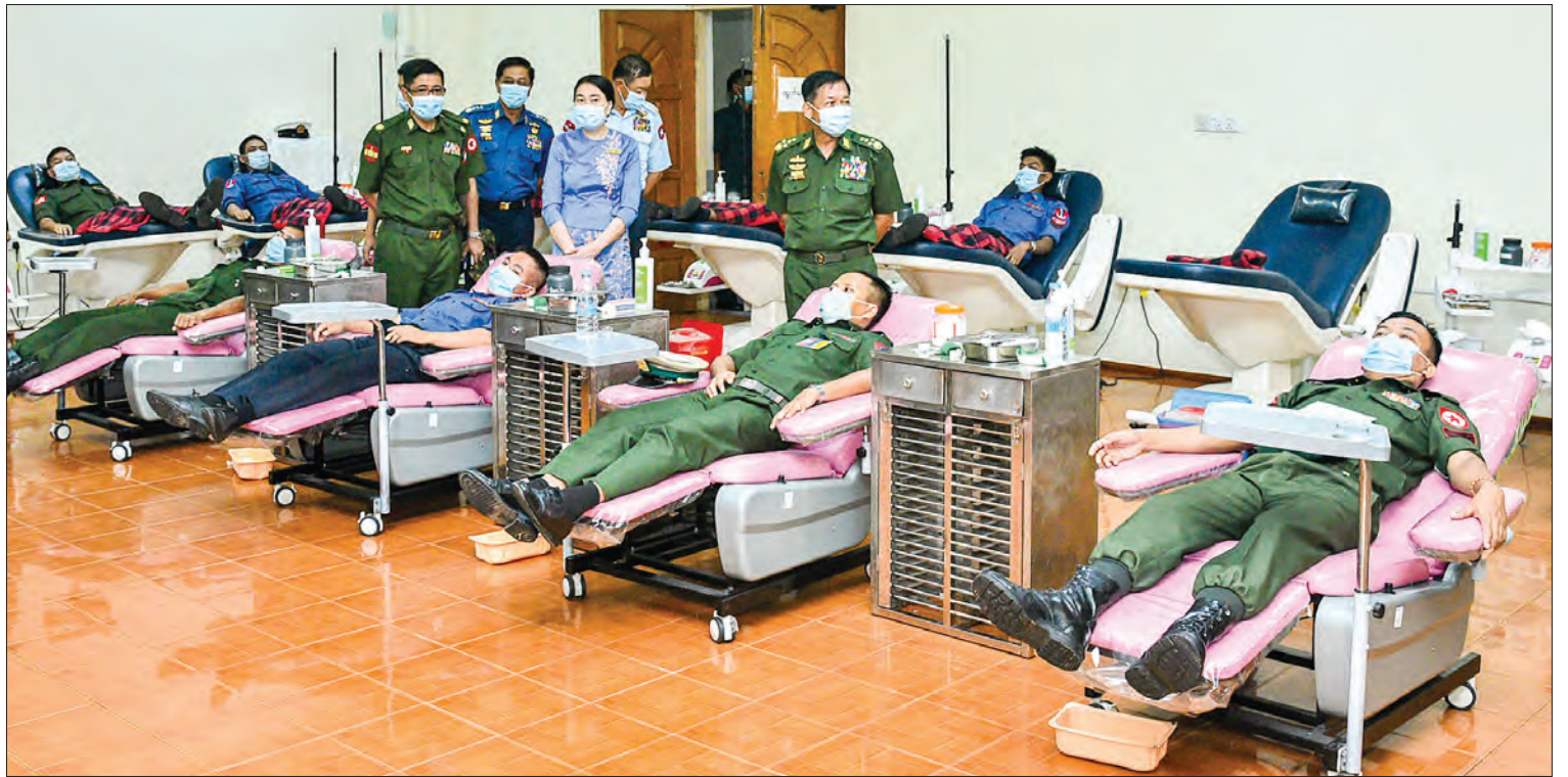
Tatmadaw (Army, Navy, Air) officers from Yangon Command donate blood at National Blood Bank in Latha Township on 12 August.

eral received food supplements of honour. for nine times to the same blood Defence Services.—MNA donated by the Tatmadaw families, and returned certificates Tatmadaw (Army, Navy, bank, according to the Office (Translated by Air) officers have donated blood of the Commander-in-Chief of Ei Phyu Phyu Aung)