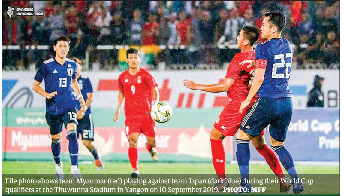
File photo shows team Myanmar (red) playing against team Japan (dark blue) during their World Cup qualifiers at the Thuwunna Stadium in Yangon on 10 September 2019.

"With the aim of protecting the health and safety of all participants, FIFA and the AFC will continue to work together to closely monitor the situation in the region and to identify new dates for respective qualifying matches. Further details on the new dates for next round of qualifying matches of World Cup 2022 and AFC Asian Cup 2023 will be announced in due course," a joint FIFA and AFC statement said. —Lynn Thit (Tgi)