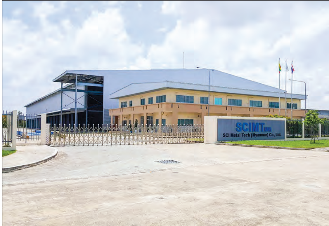
Thailand-Myanmar SCI Metal Tech Co., Ltd., Steel Structure Manufacturing Industry, being seen at Thilawa Special Economic Zone on 22 September, 2019.

Due to the limited extraction of natural resources, exports of forest products and minerals had dropped significantly in the previous years. Permits for mining blocks were suspended