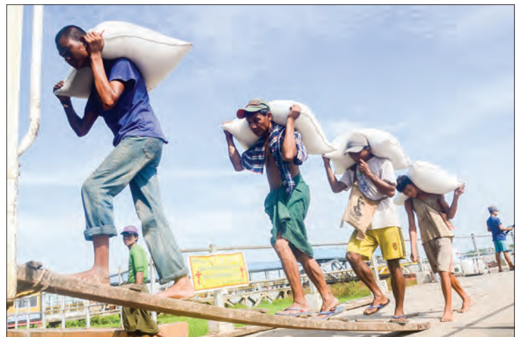
Workers loading the truck with sacks of rice at Botahtaung Jetty in Yangon.