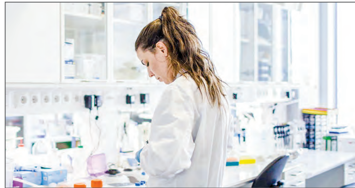
A researcher works on a vaccine against the new COVID-19 virus at the Copenhagen University research lab in Copenhagen, Denmark, on 23 March, 2020.

Oxford University, working with the Swedish-British pharmaceutical group AstraZeneca,