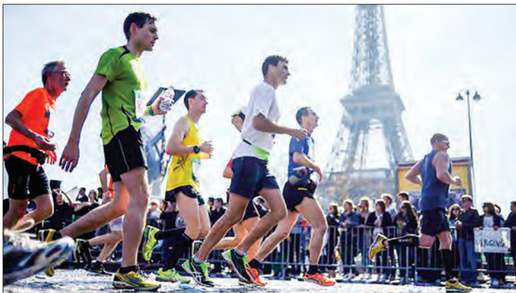
This year's Paris marathon has been cancelled because it is impossible to hold the race during the coronavirus pandemic, organisers said on Wednesday.

PARIS—This year's Paris marathon has been cancelled because it is impossible to hold the race during the coronavirus pandemic, organisers said on Wednesday. The race through the French capital, moved from its original date of April 5 to November 15, joins a long list of elite marathons across the world to be cancelled this year.