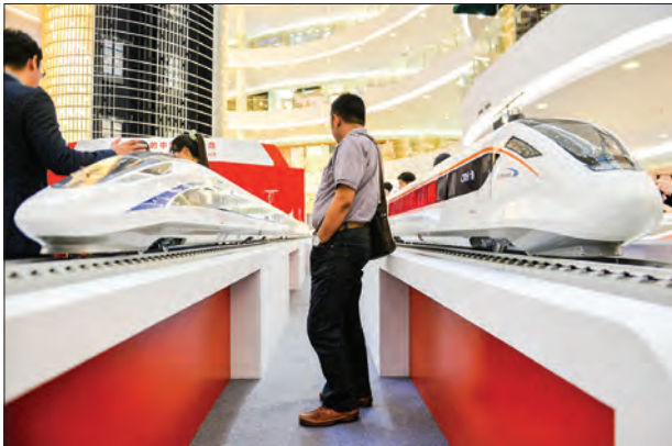
A man looks at scale models of Chinese-made bullet trains on exhibition at a shopping mall in Jakarta.

Sumadi pointed out that among the areas where the construction of the 10,524 km long railways would be carried out are those in the main islands of Sumatra and Java, which are home to