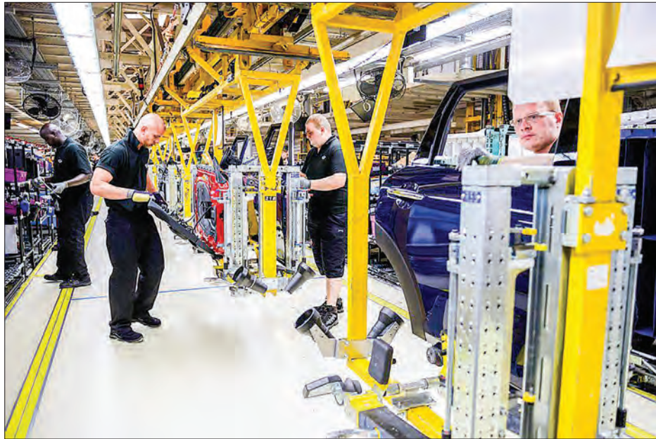
Experts said that hopes of a swift V-shaped recovery look dashed, with the Bank of England warning last week the UK could take longer to rebound than previously predicted.

The Office for National Statistics (ONS) said Britain's dire second