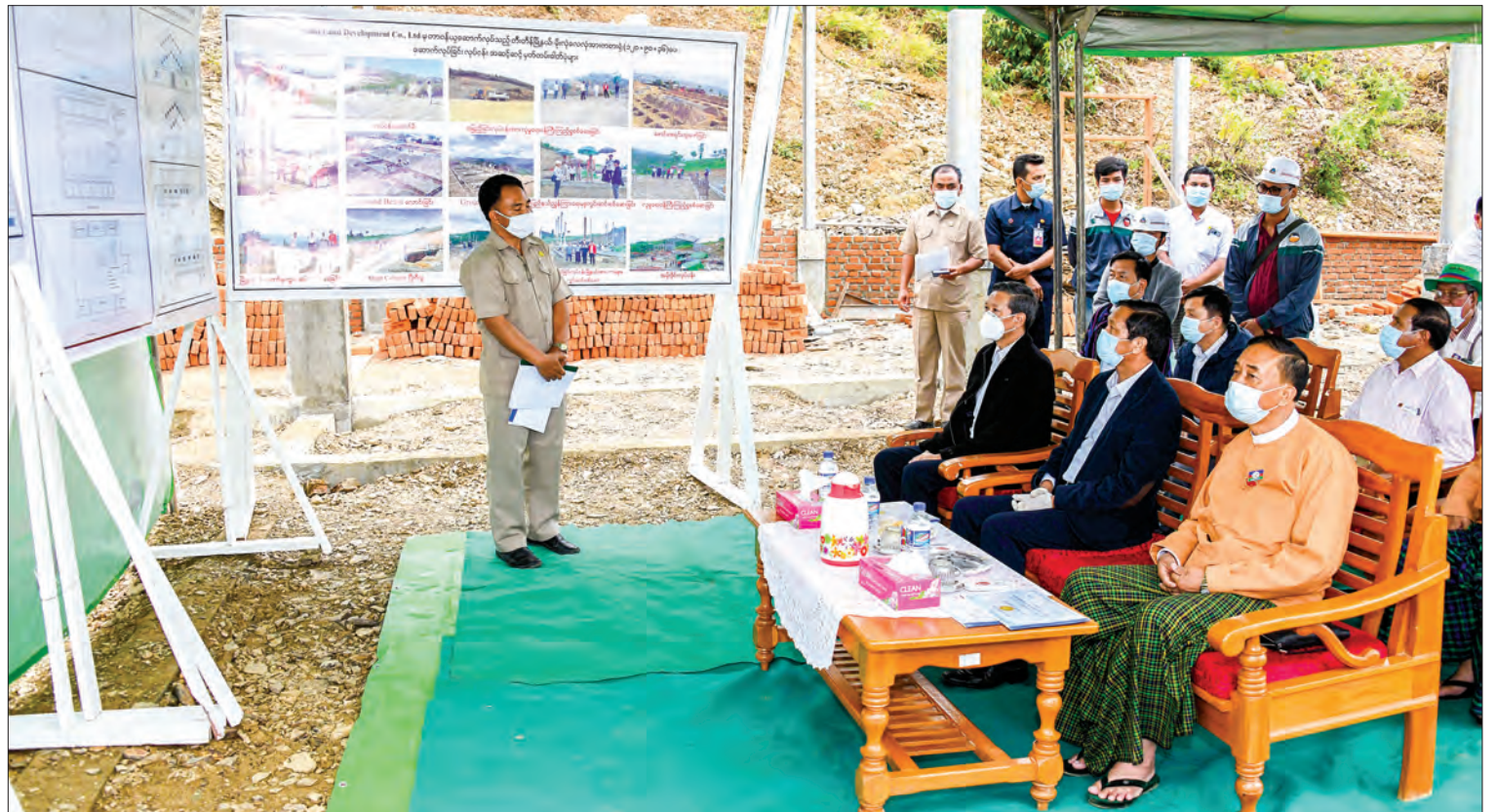
Vice President U Henry Van Thio hears reports on construction of a new indoor sports stadium in Tiddim Township on 12 August.