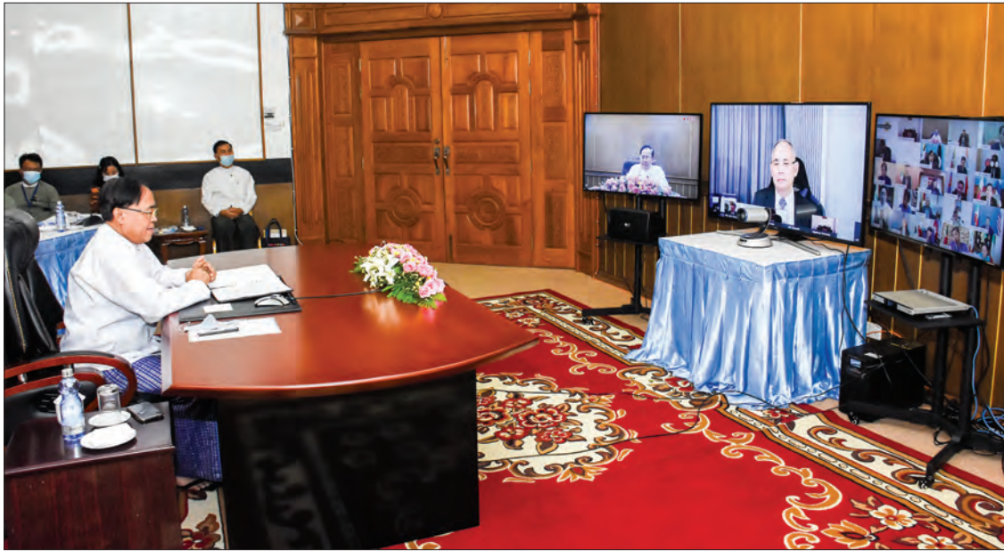
Union Minister U Kyaw Tin discusses on voting processes of nationals abroad with heads of Myanmar missions in foreign country on 11 August.

UNION Minister for International Cooperation U Kyaw Tin discussed with heads of Myanmar missions in foreign countries about advance voting of nationals