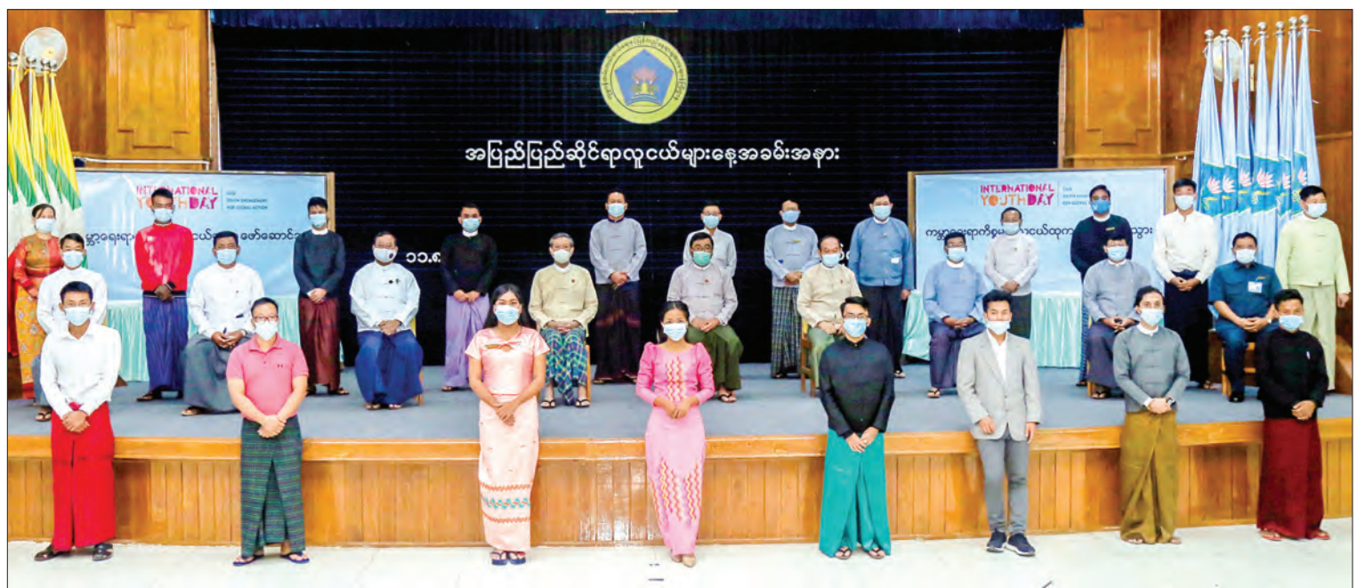
Union Minister Dr Win Myat Aye takes part in the discussions at the second coordination meeting of Myanmar Youth Affairs Committee in Nay Pyi Taw on 11 August.