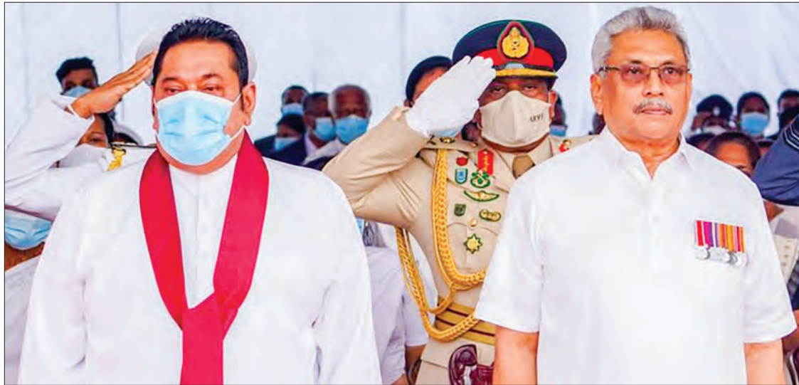
Sri Lanka's Mahinda Rajapaksa (left) was appointed prime minister a second time by his brother President Gotabaya Rajapaksa in November 2019.