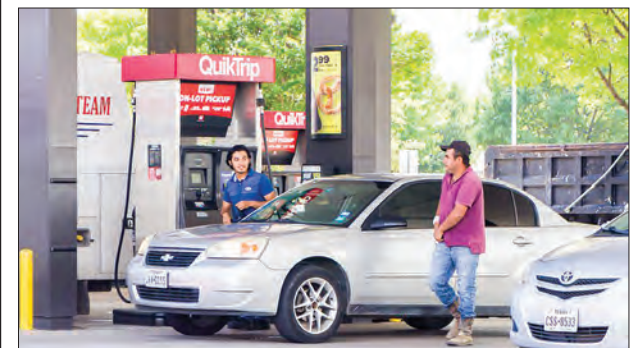
People are seen at a gas station in Plano, Texas, the United States, on April 20, 2020.

executive arm, said in a statement. The move affects such typical export products of Cambodia as garments, footwear and travel goods, which will now be subject to general tariffs applicable to any other member of the World Trade Organization. “It was taken “due to serious and systematic concerns related to human rights ascertained in the country,” the commission said.—Kyodo ■