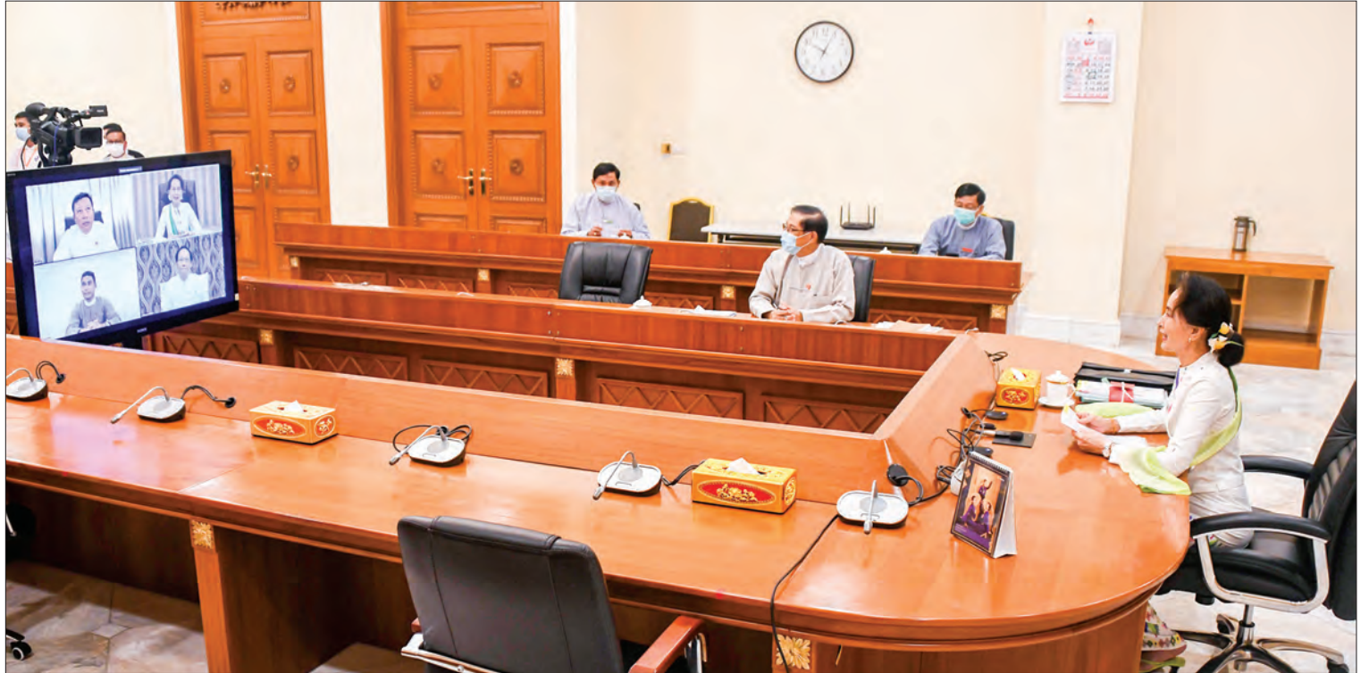
State Counsellor holds a videoconference on the resumption of football events and support of government on 12 August.

Basically, it was important for the people's health to be good; the fact that Myanmar footballers could play the first part well and during the second part their performance declined was due to the fact that these players had not received adequate nutrition during their youth; it was difficult to repair their health as they became older; the stamina of players who had received adequate nutrition from the time of their birth and players who had not received adequate nutrition during the same period was not the same; we have to make a lot of effort to reach up to international standard; just as efforts are made in the health sector, efforts need to be made in the sports sector also; cooperation was the key and also important;