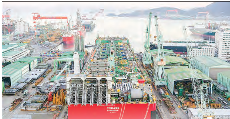
This Samsung Heavy Industries handout picture taken on November 30, 2013 and released on December 5, 2013 shows South Korean shipbuilder Samsung Heavy Industries' tanker-shaped vessel tagged as the world's largest "floating facility", with a length greater than the height of the Empire State Building in New York, at a southern shipyard in Geoje.

It has a capacity of 23,820 TEU (twenty-foot equivalent units, the standard measure of a shipping container), which owner Hyundai Merchant Marine (HMM) describes as enough to carry seven billion choco-pies, a popular Korean snack — one for every human being on the planet.—AFP ■