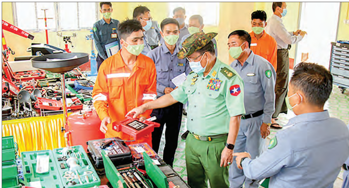
Union Minister Lt-Gen Ye Aung looks into teaching aid materials at Technical School for Nationalities Youths from Border Areas in Aungban on 10 August.

The Union Minister said the new Technical School for Nationalities Youths from Border Areas will be opened soon and the modern kinds of training for vehicle maintenance, mason/carpenter, electricity and aircon maintenance, welding and mobile phone repair will be available at the school for the local youths and the qualified teachers will teach by