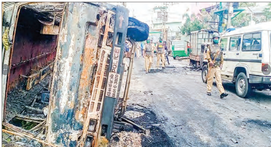
Bengaluru Police patrol an area where violence broke out over a derogatory message posted by a politician's relative on social media.

BENGALURU—A mob in Bengaluru rampaged through Pulakeshi Nagar on Tuesday night and vandalized a police station and Congress MLA Akhanda Srinivasa Murthy's residence over a derogatory Facebook post shared by the politician's relative.