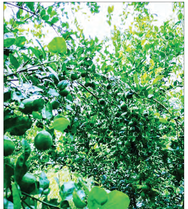
Lemon price drops in the local market despite high yield this year.

People in the capital reportedly prefer lemons thanks to their health benefits. The fruits are traditionally used for treating throat infections, dental problems and high blood pressure. They also benefit hair and skincare. Lemons also help to strengthen the immune sys-