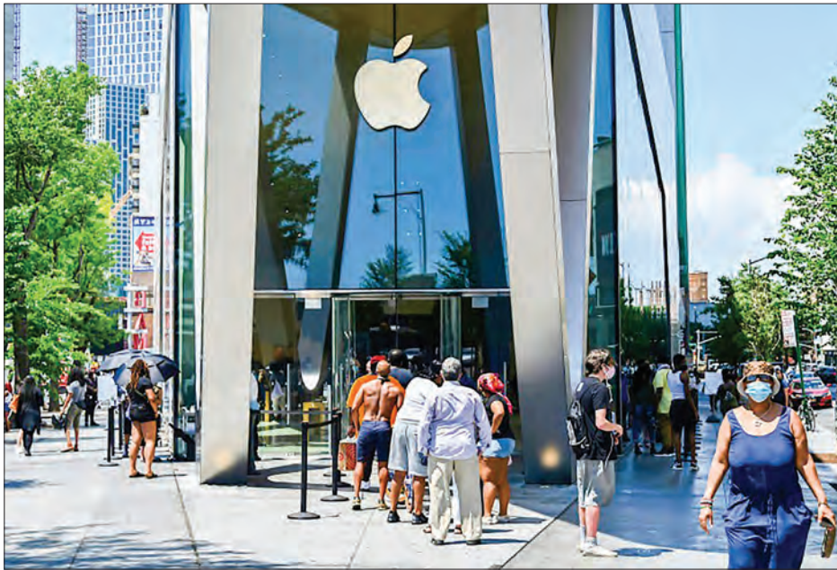
Apple says it will appeal the court decision that it violated tech patents.

PanOptis, which specializes in licencing patents, took Apple to court in February last year, claiming it refused to pay for the use of 4G LTE technologies in its smartphones, tablets and watches. “The plaintiffs have repeatedly negotiated with Apple to reach an agreement for a FRAND licence to the Plaintiff’s patent portfolios which Apple is infringing,” the court filing read. FRAND refers