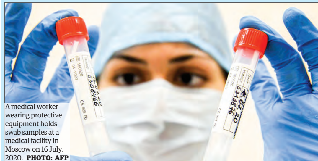
A medical worker wearing protective equipment holds swab samples at a medical facility in Moscow on 16 July, 2020.

RUSSIA claimed Tuesday it has developed the world's first vaccine offering "sustainable immunity" against the coronavirus, as the pandemic marked another bleak milestone with 20 million infections globally.