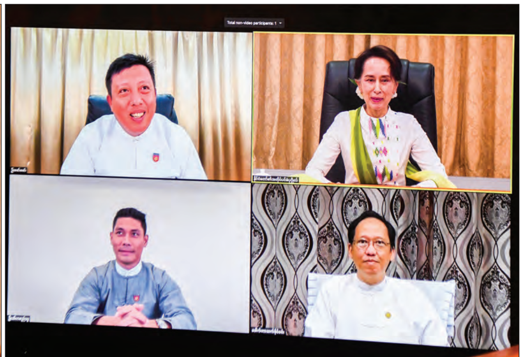
State Counsellor Daw Aung San Suu Kyi holds a videoconference on possible resumption of football events and government's assistance to sports sector on 12 August.

S tate Counsellor Daw Aung San Suu Kyi held a videoconference on the possible resumption of football events under control measures against the COVID-19.