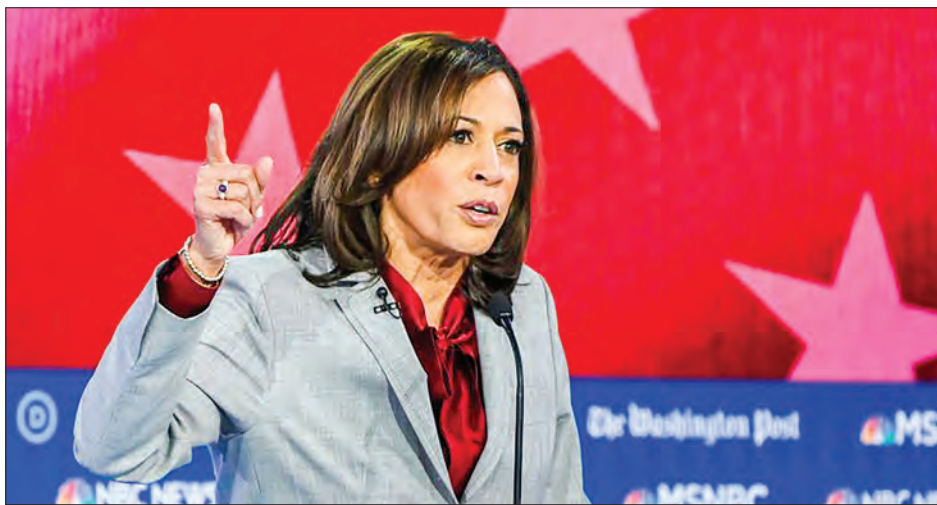
Kamala Devi Harris is serving as the junior United States Senator from California since 2017. A member of the Democratic Party, Harris is the second African American woman and the first Indian American to serve in the United States Senate. Democratic presidential candidate California Sen. Kamala Harris speaks during the fifth Democratic primary debate of the 2020 presidential campaign season, co-hosted by MSNBC and The Washington Post at Tyler Perry Studios in Atlanta, on Nov. 20, 2019. CREDIT: AFP / FILE

WASHINGTON—Presidential hopeful Joe Biden named Senator Ka-