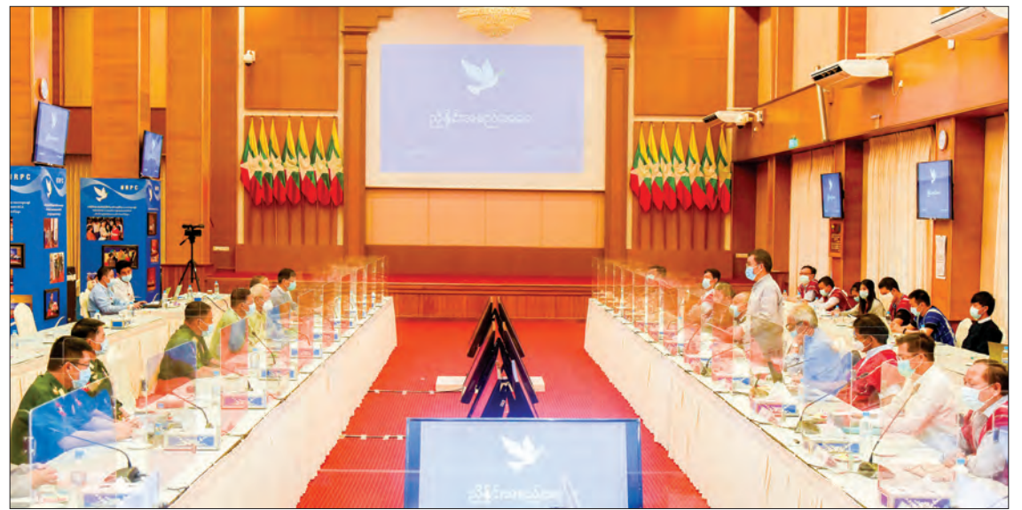
The final-day session of JICM preliminary meeting is in progress on 12 August.

He said that both sides aimed to get a win-win solution for the sake of the whole Union, and the preliminary meeting achieved good results. Then, he expressed thanks to the