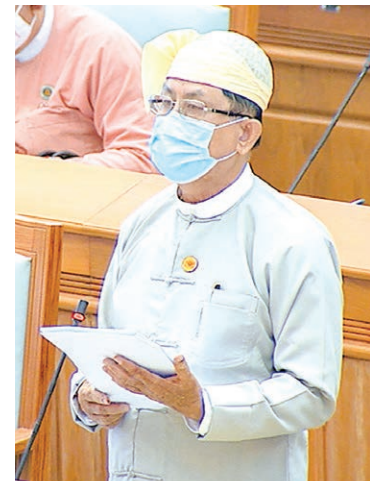
Deputy Minister U Maung Maung Win.