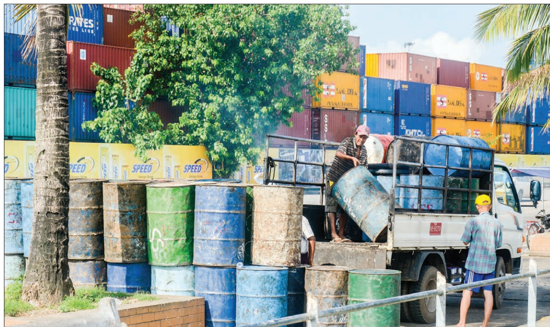
Local investments mostly go into industrial sector in ten months of current FY.