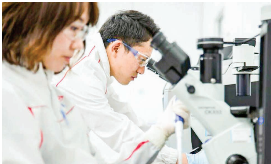
Researchers work at a Takeda Pharmaceutical lab in Fujisawa, near Tokyo.

TOKYO — Takeda Pharmaceutical Co. said Friday it will produce and sell in Japan a COVID-19 vaccine being developed by U.S. biotechnology firm Novavax Inc.