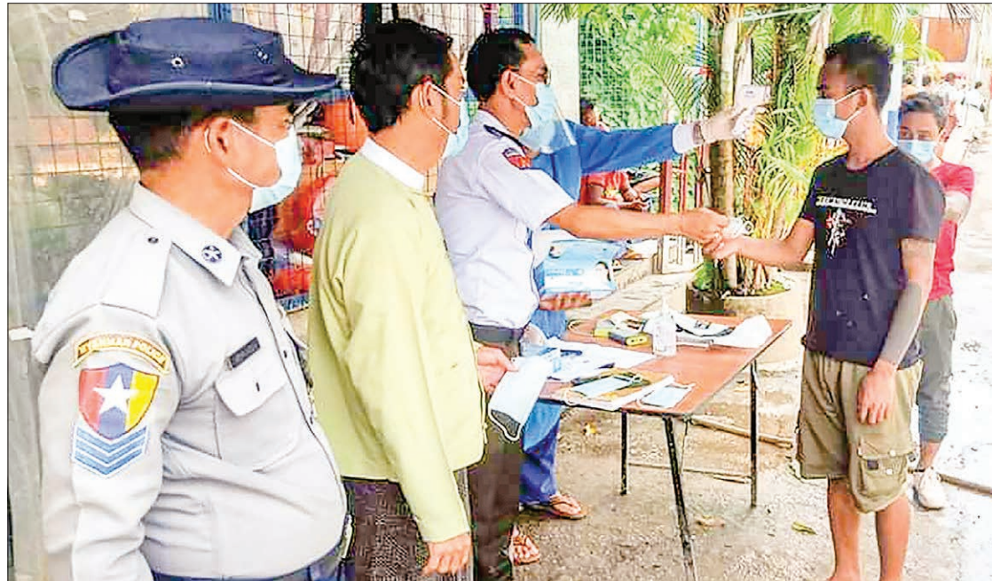
Local authorities are helping Myanmar returnees from China at Chinshwehaw border crossing on their way back home.

A total of 48 Myanmar nationals who returned from China came back home through Myanmar-China border in Chinshwehaw on 7 August.