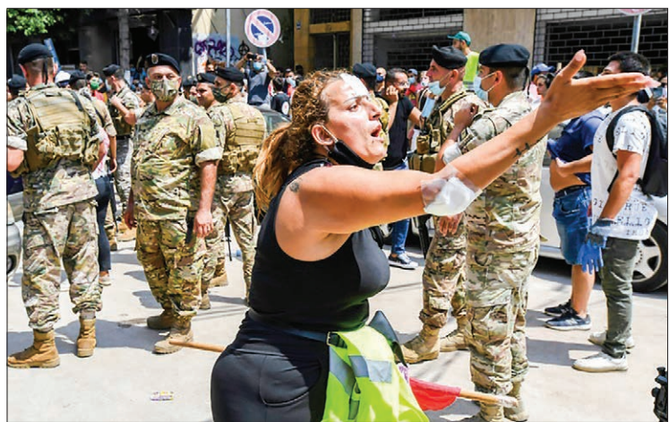
An injured Lebanese anti-government protester in the Gemayzeh neighbourhood during the visit of French President Emmanuel Macron.

Earlier, visiting French President Emmanuel Macron pledged to lead international emergency relief efforts and organize an aid conference in the coming days, promising that "Lebanon is not alone". But he also warned that the country -- already in desperate need of a multi-billion-dollar bailout and hit by political turmoil since October -- would "continue to sink" unless it implements urgent reforms. — AFP ■