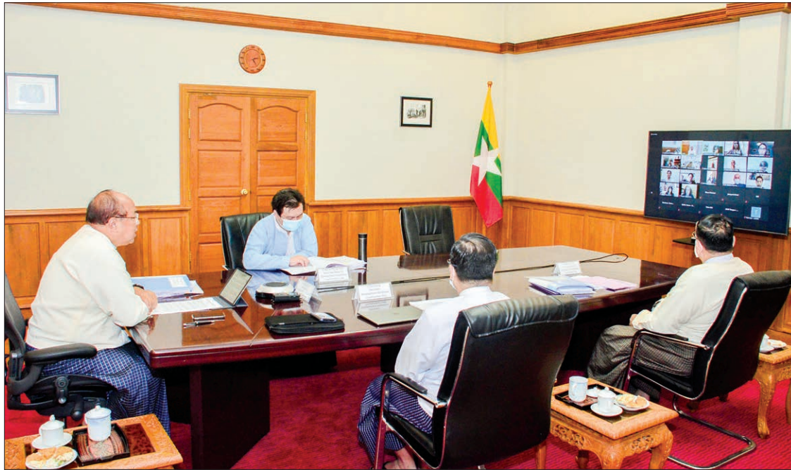
Development Assistance Coordination Unit (DACU), Cooperation Partners Group (CPG) and domestic and international civil society hold meeting on 7 August 2020.

The Union Minister also cited further examples of progress including the government's recent announcement of a new 100 billion MMK loan fund focused on the country's agriculture and livestock sector, and the Myanmar Investment Commission