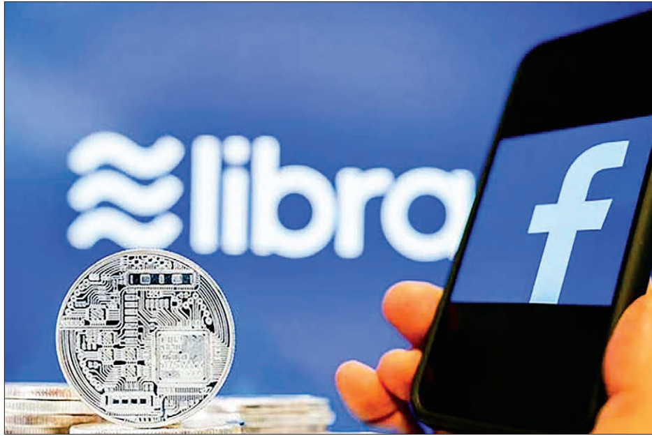
Noting security concerns posed by Facebook's digital currency Libra, the Federal Reserve on Thursday revealed details of its own instant payments system.

WASHINGTON — Noting security concerns posed by Facebook's digital currency Libra, the Federal Reserve on Thursday revealed details of its own instant payments system.