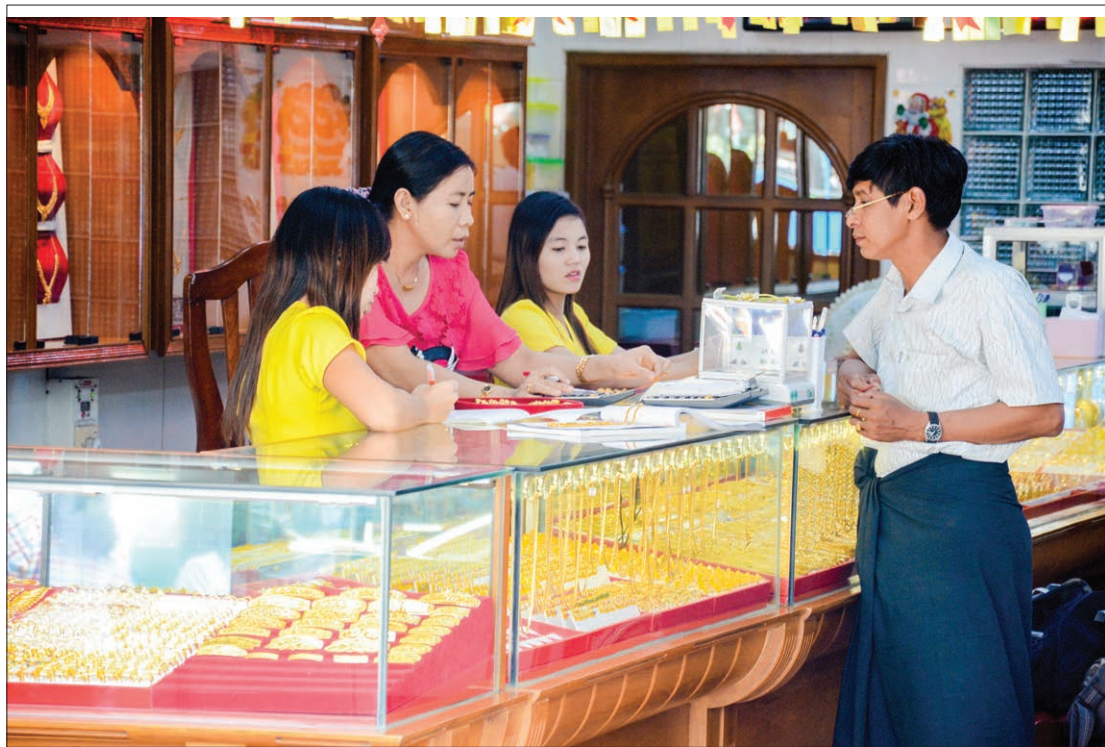
(FILES) Saleswomen are selling gold jewellery at a shop in Yangon on 25 February 2015.