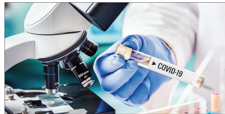
The United Nations health agency said that multiple different types of vaccines would likely be needed to combat COVID-19.

cines are in various stages of being tested on humans, with six having reached Phase 3 wider levels of testing.