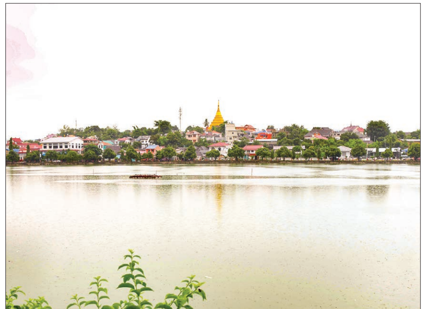
President U Win Myint and party view Naung Tung Lake in Kengtung Township, eastern Shan State on 7 August 2020.