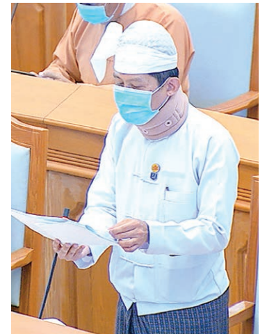
Deputy Minister Dr Tun Naing.

in the 2008 Constitution. He said they are constantly working to raise awareness on proper tax payments and to create a positive taxpayer culture among the public.