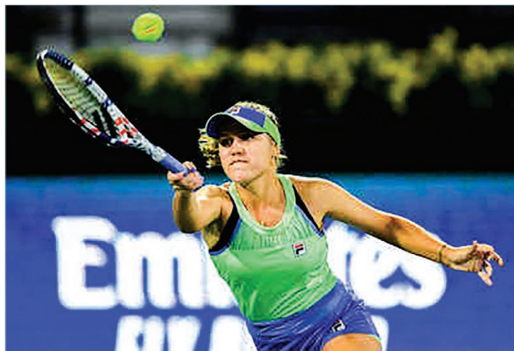
America's Sofia Kenin won the women's Australian Open title in January.

SYDNEY — New South Wales offered to host the Australian Open tennis Grand Slam and other major sports events in Sydney Friday as Melbourne battles a surge in coronavirus cases.