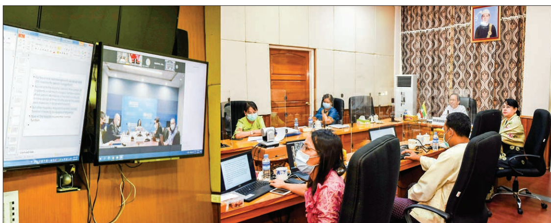
Myanmar health delegates join the virtual meeting over sustainable basic healthcare services on 6 August 2020.