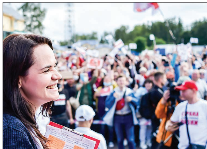
Tikhanovskaya stepped into the race at great personal risk after the detention of her husband, who had hoped to stand himself.

She also says that if she wins she will call fresh elections that will include the entire opposition. — AFP ■