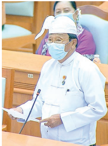
Deputy Minister U Hla Kyaw.