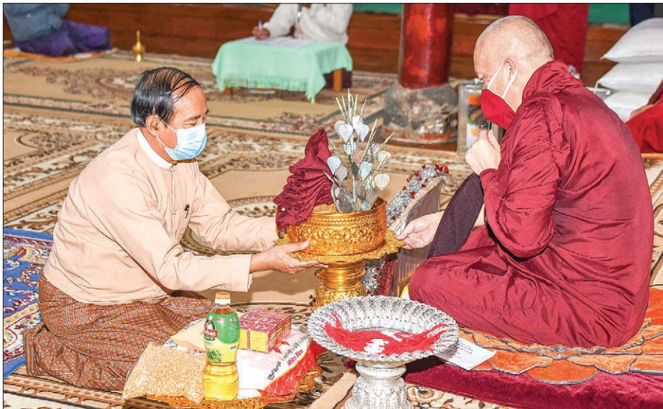
President U Win Myint offers robes and requisites to a monk at the Dhamodaya Paritta Monastery in Kengtung Township on 7 August 2020.

P RESIDENT U Win Myint visited Kengtung Township in eastern Shan State by a special flight of the Tatmadaw yesterday.