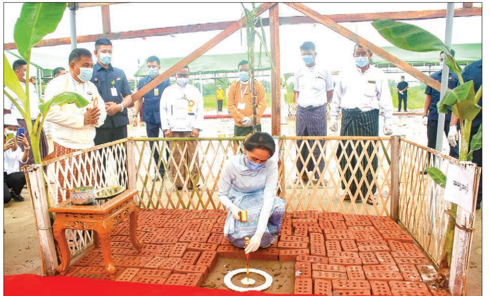
State Counsellor Daw Aung San Suu Kyi drives a stake to launch public rental housing project in Dagon Myothit (South) on 7 August 2020.

S TATE Counsellor Daw Aung San Suu Kyi attended the stake-driving ceremony of a public rental housing project in Dagon Myothit (South) Township, Yangon, yesterday.