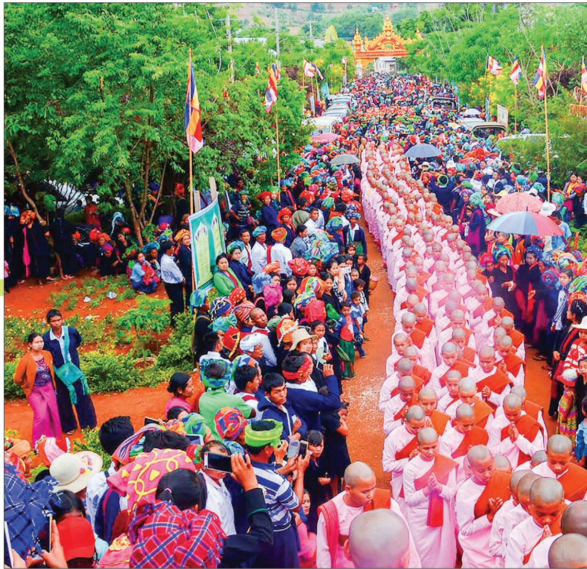
Buddhist nuns line up as they receive donation from the local people in Hopong.

The safeguarding of cultural heritage is being carried out being led by the Ministry of Religious Affairs and Culture together with cultural practitioners, civil societies, NGOs and local communities in Myanmar. The Myanmar Intangible Cultural