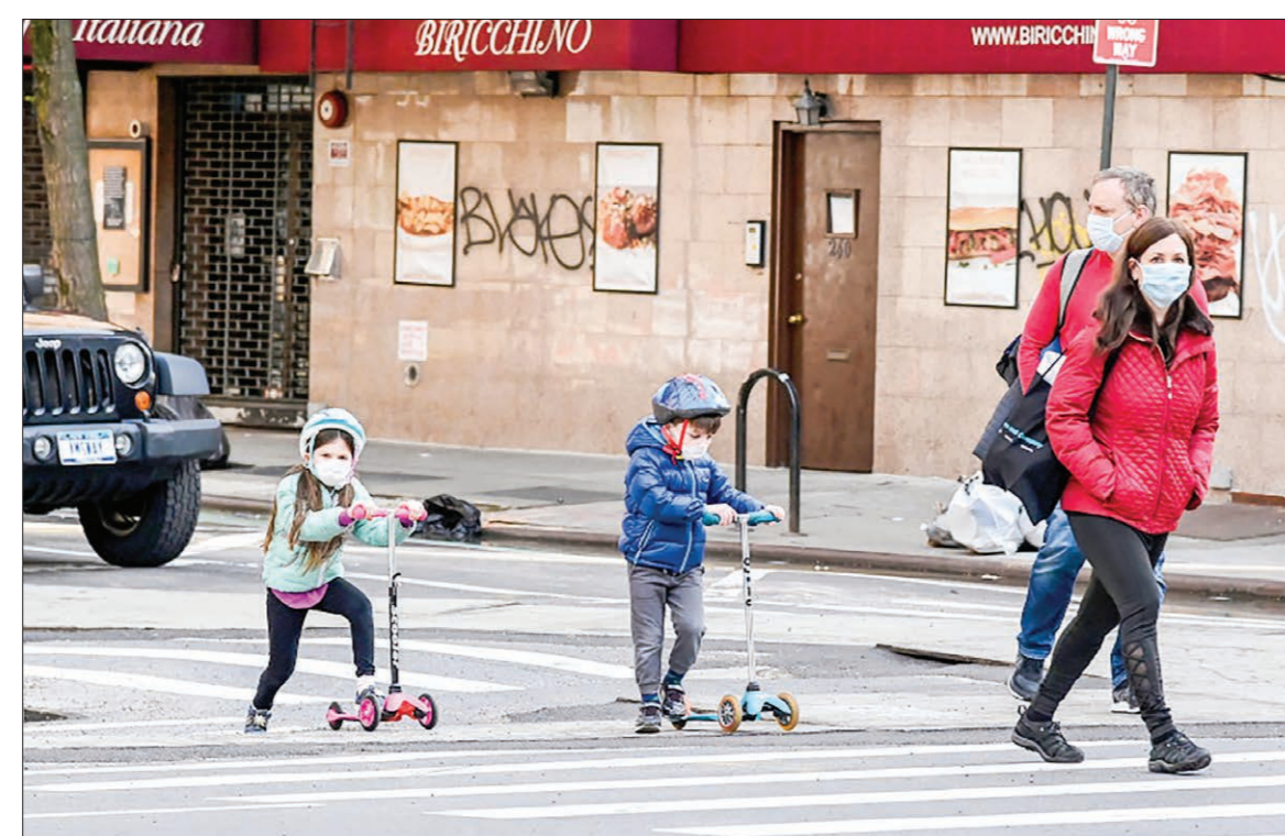
Children wearing face masks play on their scooters while their parents watch during the coronavirus pandemic on April 25, 2020 in New York City.

It is especially advertised to the people who settle near the river banks and low lying areas in Ngathaingchaung and Thabaung to take precaution measure.