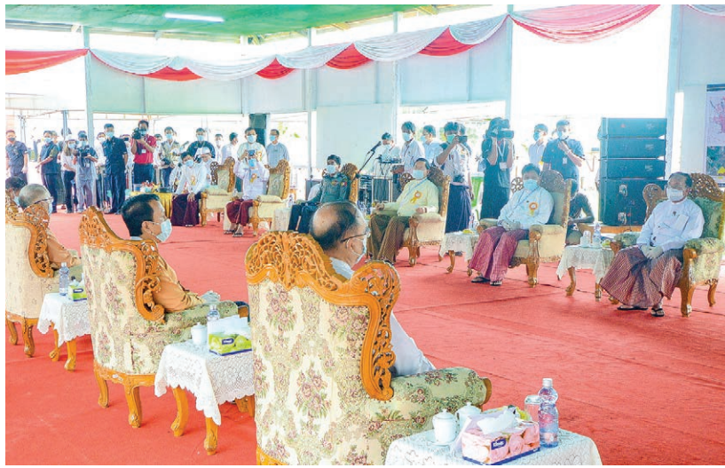
State Counsellor is making a speech at the launching ceremony of public rental housing project in Dagon Myothit (South) Township, Yangon, on 7 August.