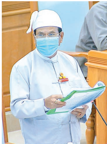
Deputy Minister U Tin Myint.