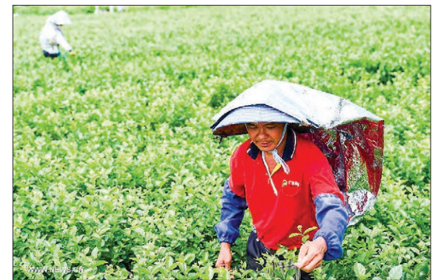
Farmers harvest jasmine flowers in a field in Liufeng village of Hengxian county, south China's Guangxi Zhuang autonomous region, Aug 23, 2014. Hengxian is one of the main producing areas of jasmine flowers in China, yielding some 80,000 tonnes of fresh jasmine flowers per year and producing 60,000 tonnes of jasmine tea annually.

According to the China Chamber of Commerce to the EU, Chinese GIs have the right to use the official certification mark of the EU, which will help them gain recognition among local consumers, facilitating the export of Chinese products to the EU, and promoting bilateral trade of agricultural products and food. —Xinhua ■