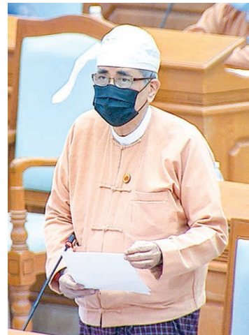
Deputy Minister U Kyaw Myo.