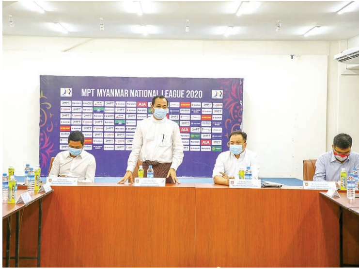
Football authorities focus on Myanmar National League's preparations at the coordination meeting in Yangon on 6 August.