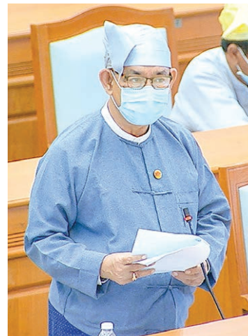
Deputy Minister Dr Ye Myint Swe.