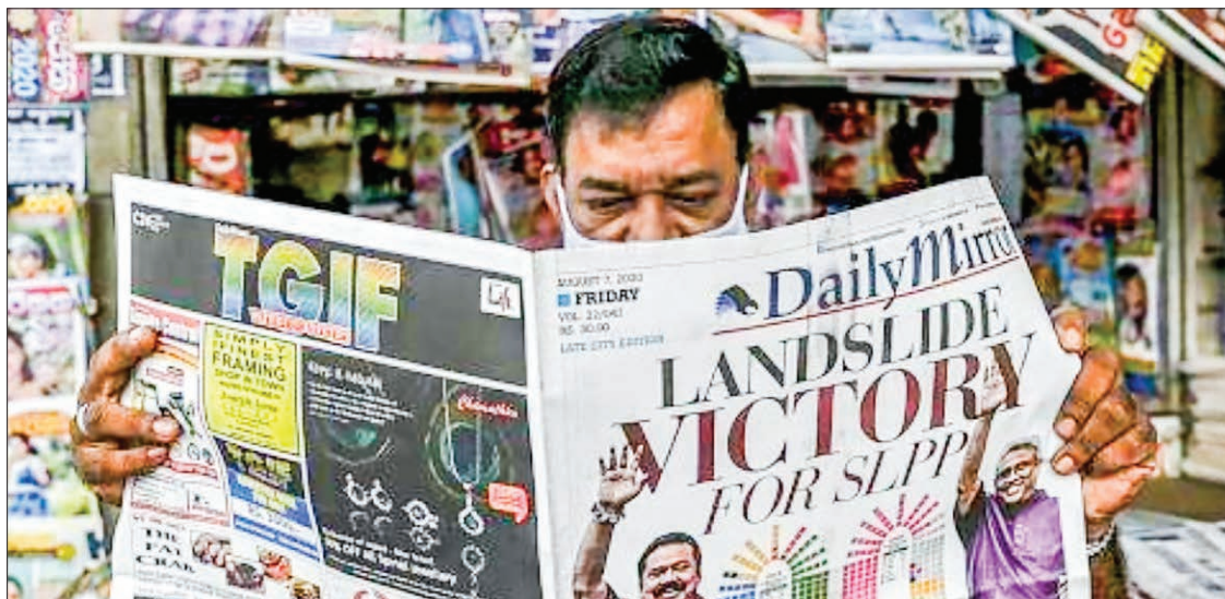
Major British media brands could boast of 6.6 million new online readers in the first quarter in what their industry association said was a new record. REPRESENTATIVE IMAGE.

Major dailies in Brazil and Mexico have already switched to online-only or dropped some days' editions, while in the Phil-