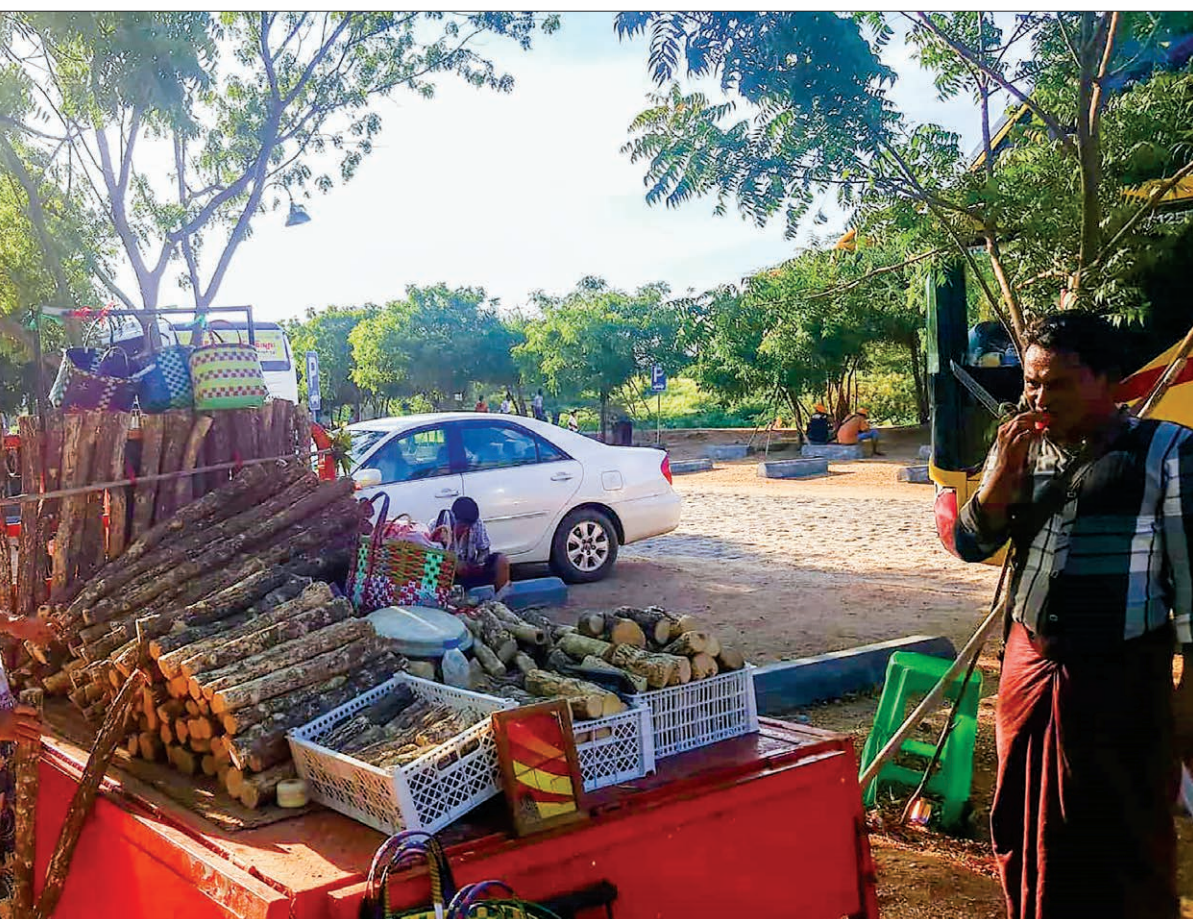
A vendor sells Thanaka in Bagan.

It is recommended in UNESCO meetings that the integration of safeguarding intangible cultural heritage into cultural policies and training sessions on policy development in the context of broader capacity-building projects as well as in emergencies and post-disaster contexts. The activities of ICH awareness and promotion call for the involvement of stakeholders (government, civil society, communities) in the process of developing policies and initiatives related to Sustainable Development Goals (SDGs) and Post Covid 19 New Normal activities. The national level focal ministry like Ministry of Religious Affairs and Culture has to strengthen tools for effective plan of action to improve effectiveness of its policy support. This will include the revision guidance note for facilitators and related ministries who get involved.