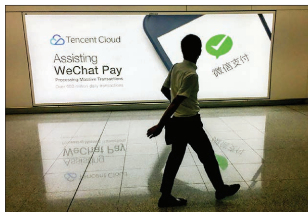
WeChat is a messaging, social media and online payment platform all in one app.

"I think the biggest impact... would be basically losing contact with people in China.—AFP ■