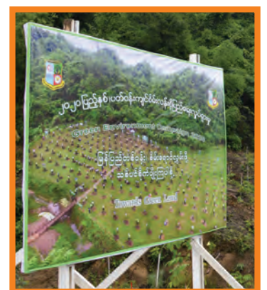
President U Win Myint and party look around Phoe Zaung Taung Reserved Forest in Nay Pyi Taw on 6 August.