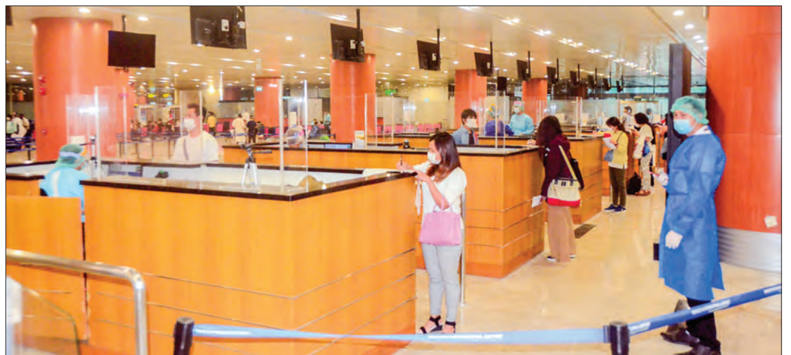
Myanmar citizens arrive at Yangon International Airport by relief flights from India and Japan on 6 August.