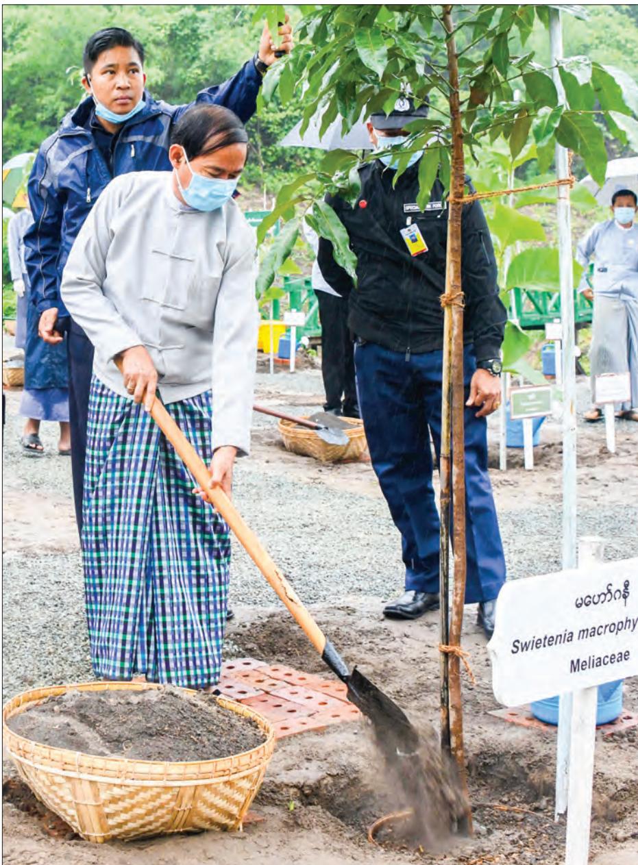
President U Win Myint is cultivating a Mahogany plant at monsoon plantation ceremony in Nay Pyi Taw on 6 August.

P RESIDENT U Win Myint took part in the monsoon plantation ceremony for conducting 2020 greening campaign, organized in Phoe Zaung Taung Reserved Forest beside Nay Pyi Taw-Tatkon No.1 road in Ottarathiri Township in Nay Pyi Taw yesterday morning.