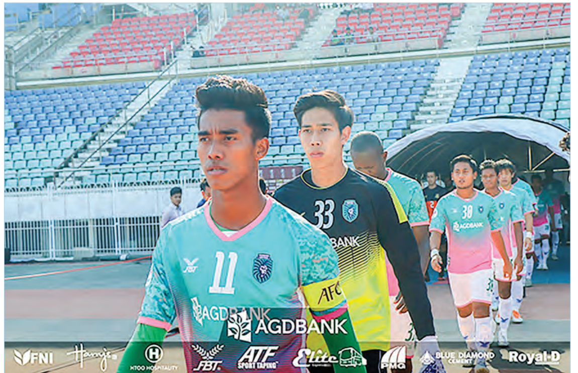
File photo shows Yangon United players seen entering the Thuwunna Stadium before the previous AFC Cup group match against Hougang FC on 10 March 2020.

YANGON United FC, one of the Myanmar National League clubs in AFC Cup competition is currently in good shape to reach the ASEAN Zone semifinal of the AFC Cup after saving their points and victories in the first round of the tourney.