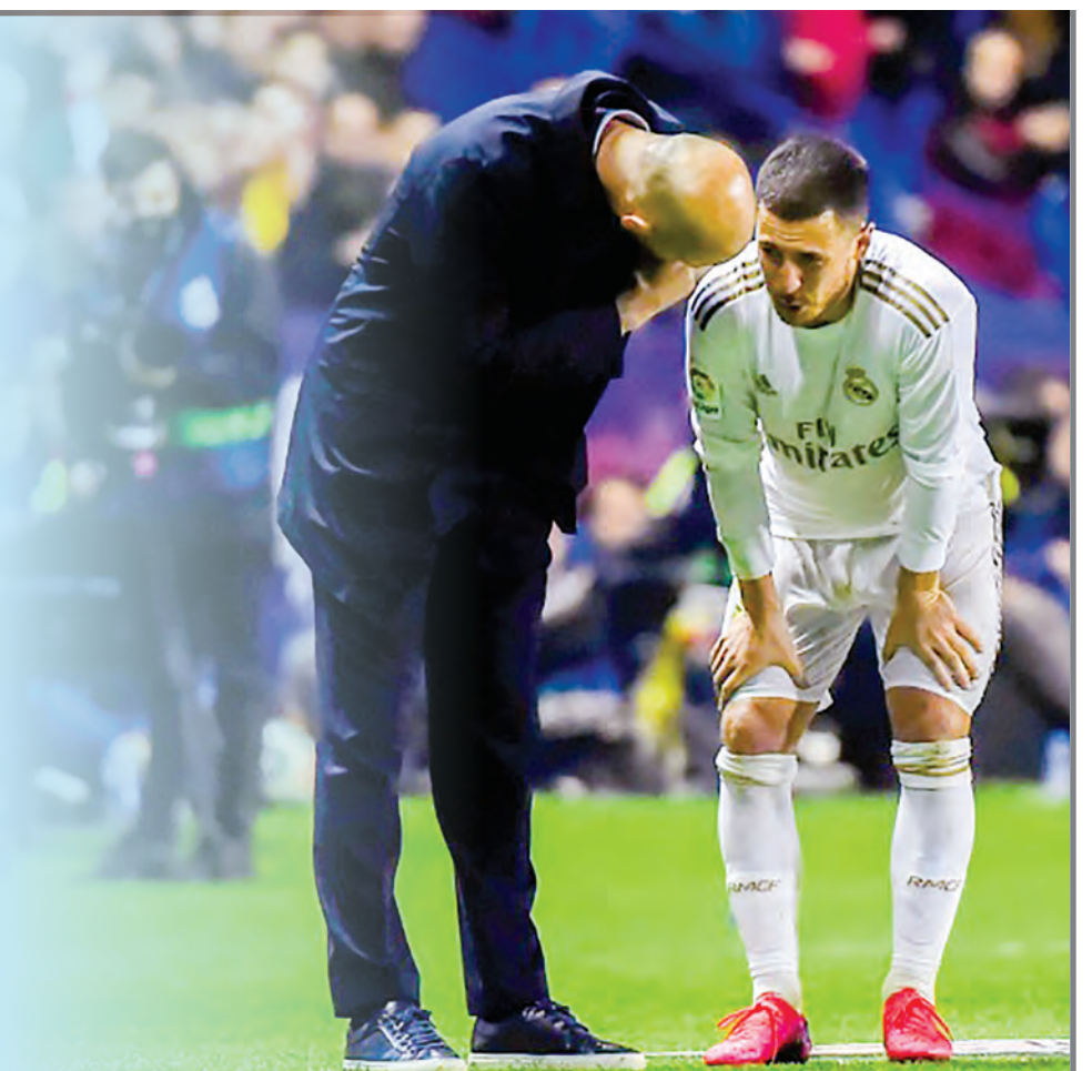
Real Madrid have shown they can live without Eden Hazard ahead of their Champions League second leg against Manchester City on Friday.

But the team have won without him too. The reality is Madrid have learned not to miss the player they signed for 100 million euros last year and who said at his unveiling at the Santiago Bernabeu he wanted to become the club's next Galactico.—AFP ■