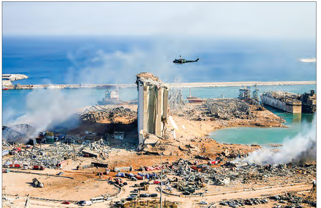
Much of Beirut’s port district was obliterated by the force of Tuesday’s monster explosion of 2,750 tonnes of ammonium nitrate fertilizer.

PARIS — French President Emmanuel Macron was expected in Lebanon Thursday, two days after a monster blast sowed unfathomable destruction in Beirut and brought Paris’s Middle East protege to its knees.