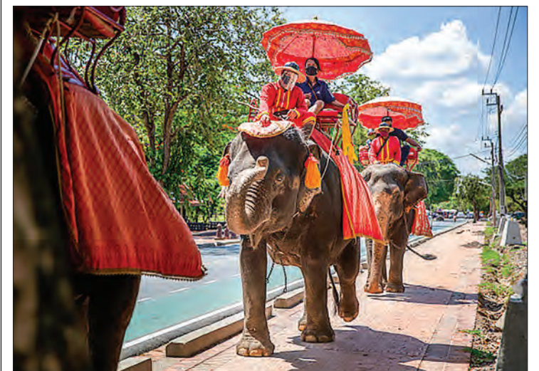
Thai tourists and elephant trainers wear face masks and shields as they ride elephants at the Ayutthaya Elephant Palace and Royal Kraal on June 6, 2020, in Ayutthaya, Thailand.

Incumbent Foreign Minister Don Pramudwinai has also been appointed as a deputy prime minister. —Kyodo ■