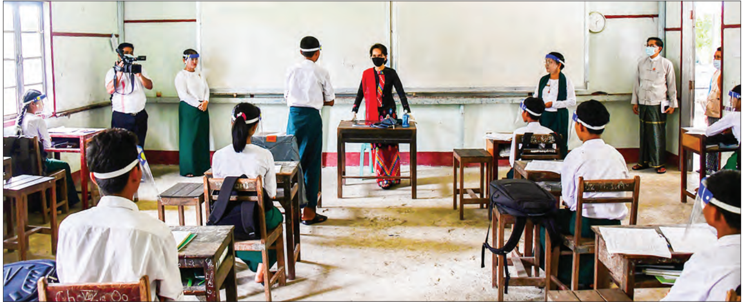
State Counsellor talks to a student at the high school in Cocogyun Township on 6 August.

sions the State Counsellor said, in looking at the main strength of the nation, one could not look at the largest areas and say that there was great strength; we can say that the nation was strong and sturdy only when the smallest areas were strong; she was happy to come to a place like Cocogyun to visit and study the situation. One could say that Cocogyun situated on the outer perimeter of the Union territory is providing the security of the nation.