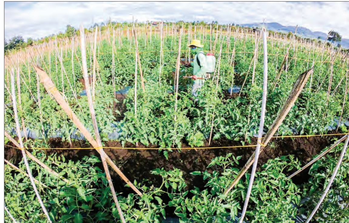
Intensive farming makes future pandemics such as COVID-19 more likely as wild animals carrying diseases known to infect humans are forced into increasingly close contact with us, research showed Wednesday.

"The way humans change landscapes across the world, from natural forest to farmland, has consistent impacts on many wild animal species, causing some to decline while others persist or increase," said Rory