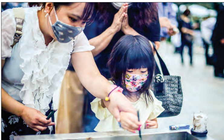
Visitors burn incense at the Hiroshima Peace Memorial Park to mark 75 years since the world's first atomic bomb attack.

And UN Secretary-General Antonio Guterres, who addressed the gathering by video message because of the pandemic, warned that "the only way to totally eliminate nuclear risk is to totally eliminate nuclear weapons". —AFP ■