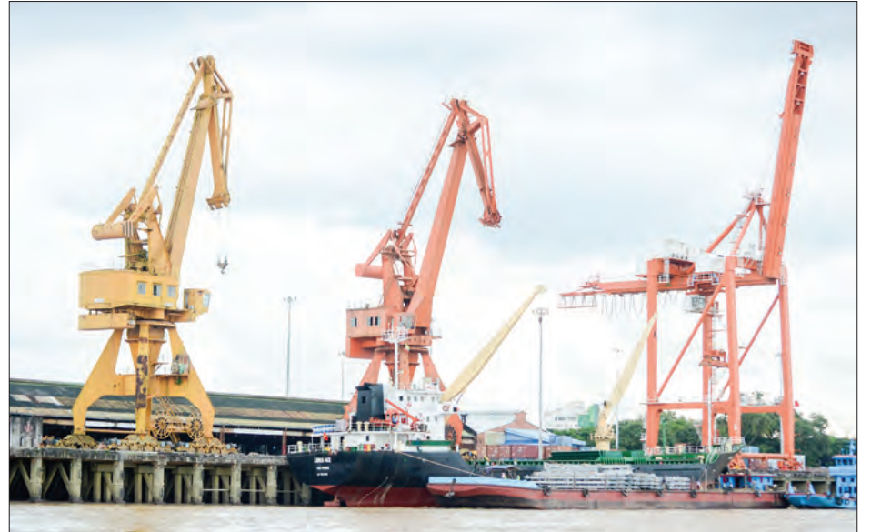
Myanmar shipped 3.6 million tonnes of rice in the 2017-2018FY, which was an all-time record in rice exports.

According to the work coordination meeting held on 26 June, 150,000 tonnes of rice will be exported each in July and