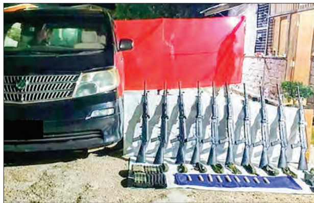
Seized motor vehicle and weapons.