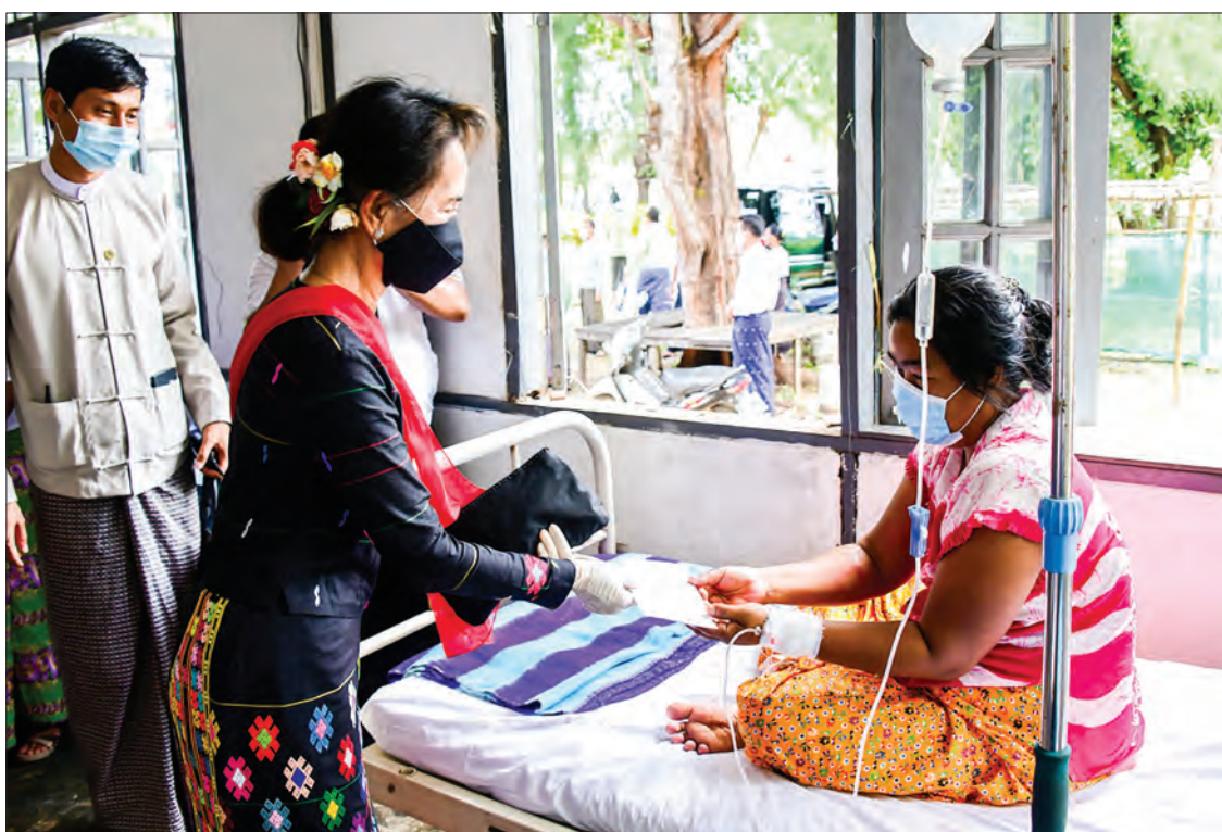
State Counsellor provides cash assistance to a patient at people's hospital in Cocogyun Township on 6 August.

She wanted to transform Cocogyun into a model township, a remote outpost providing and protecting national security; in a way to designate Cocogyun as an indispensable place and work for the development and progress of this island as a priority; to look at this in another way, when we study the progress of our country, we can look at the image of Cocogyun and gauge how far our country has progressed.