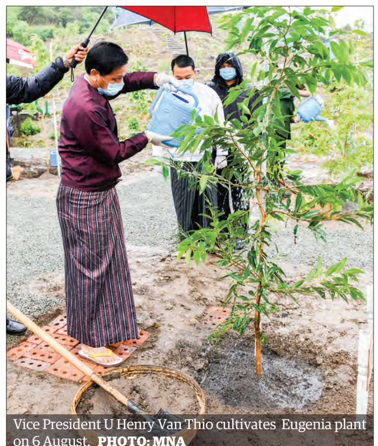
Vice President U Henry Van Thio cultivates Eugenia plant on 6 August.