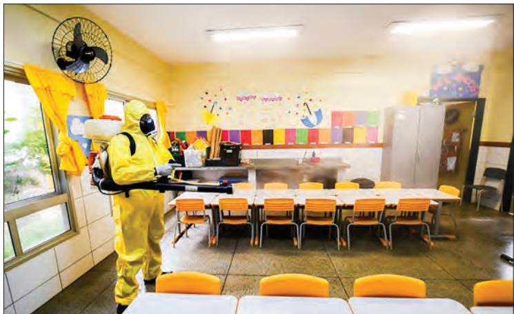
A school is disinfected against the spread of the new coronavirus in Brasilia.

Announcing the re-introduction of restrictions in Greece, government spokesman Stelios Petsas told Mega TV: “We are trying to awaken people with messages and daily announcements on additional measures,” citing travel, social gatherings and public transport as major spreading concerns.—AFP ■