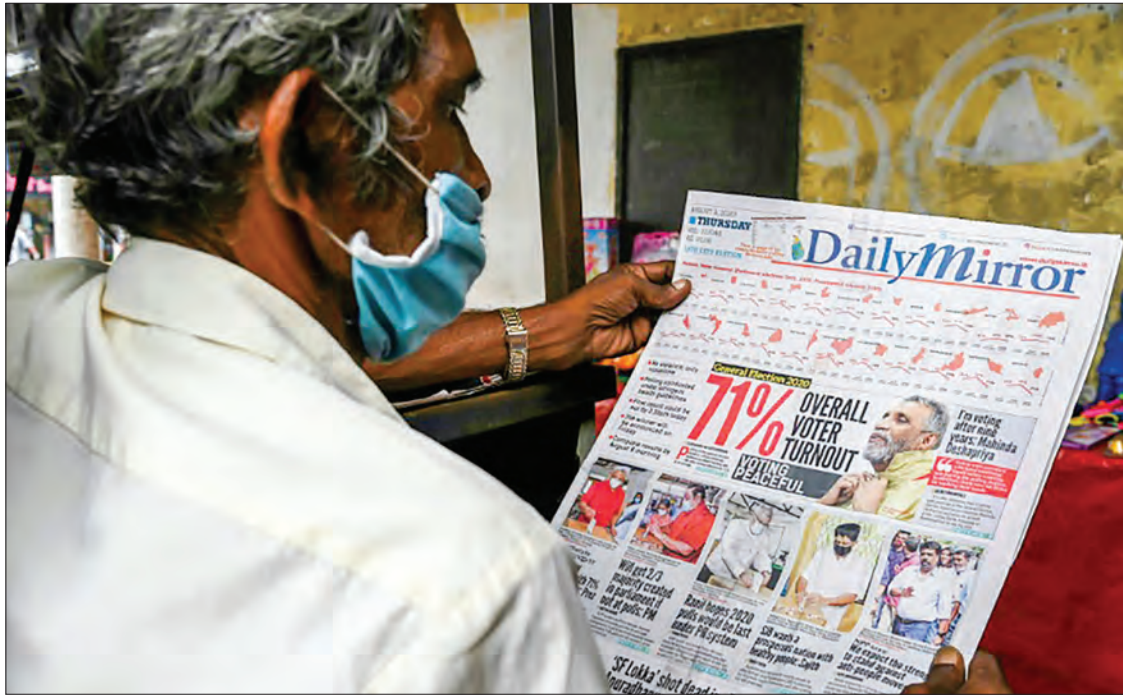
A man reads a newspaper in Colombo a day after Sri Lanka's parliamentary polls saw a turnout of over 70 per cent.

The brothers are viewed as heroes by the country's Sinhalese majority for orchestrating a ruthless military campaign to