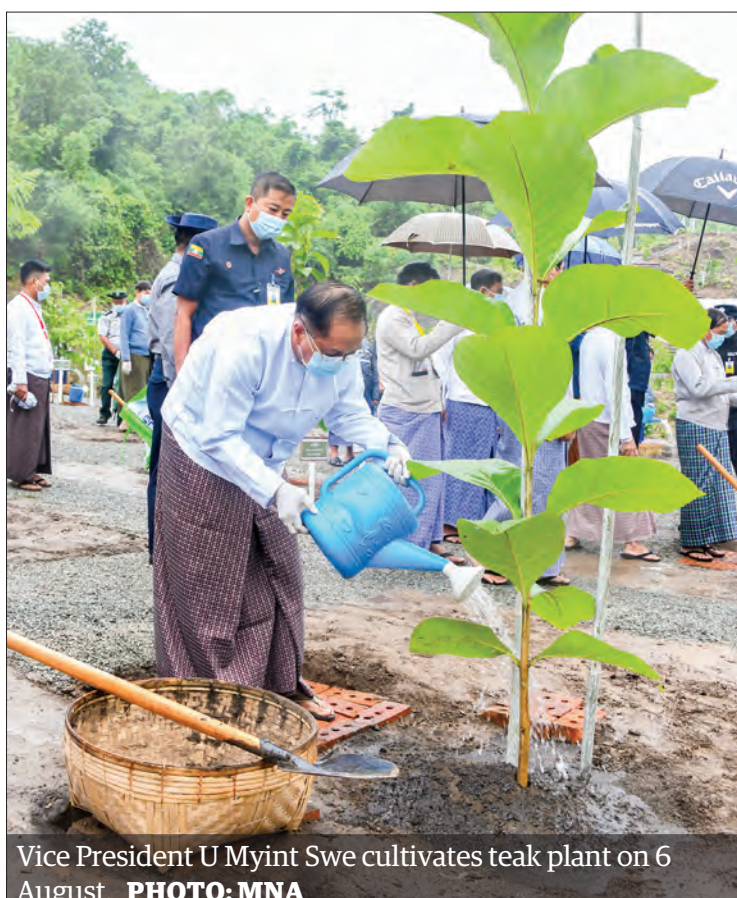
Vice President U Myint Swe cultivates teak plant on 6 August.