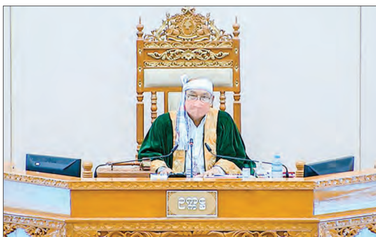
Amyotha Hluttaw Speaker Mahn Win Khaing Than.

Deputy Minister for Defence Rear-Admiral Myint Nwe replied that the local military command has instructed leaders and officials of these militia forces for the removal of their gates on Waingmaw-Mungwein-Chipwe motorway. MP U J Yaw Wu from