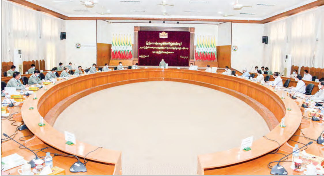
Union Election Commission holds meeting with ministries for successfully holding of the 2020 General Election.

UNION Election Commission, Ministry of the Office of Union Government, Ministry of International Cooperation, Ministry of