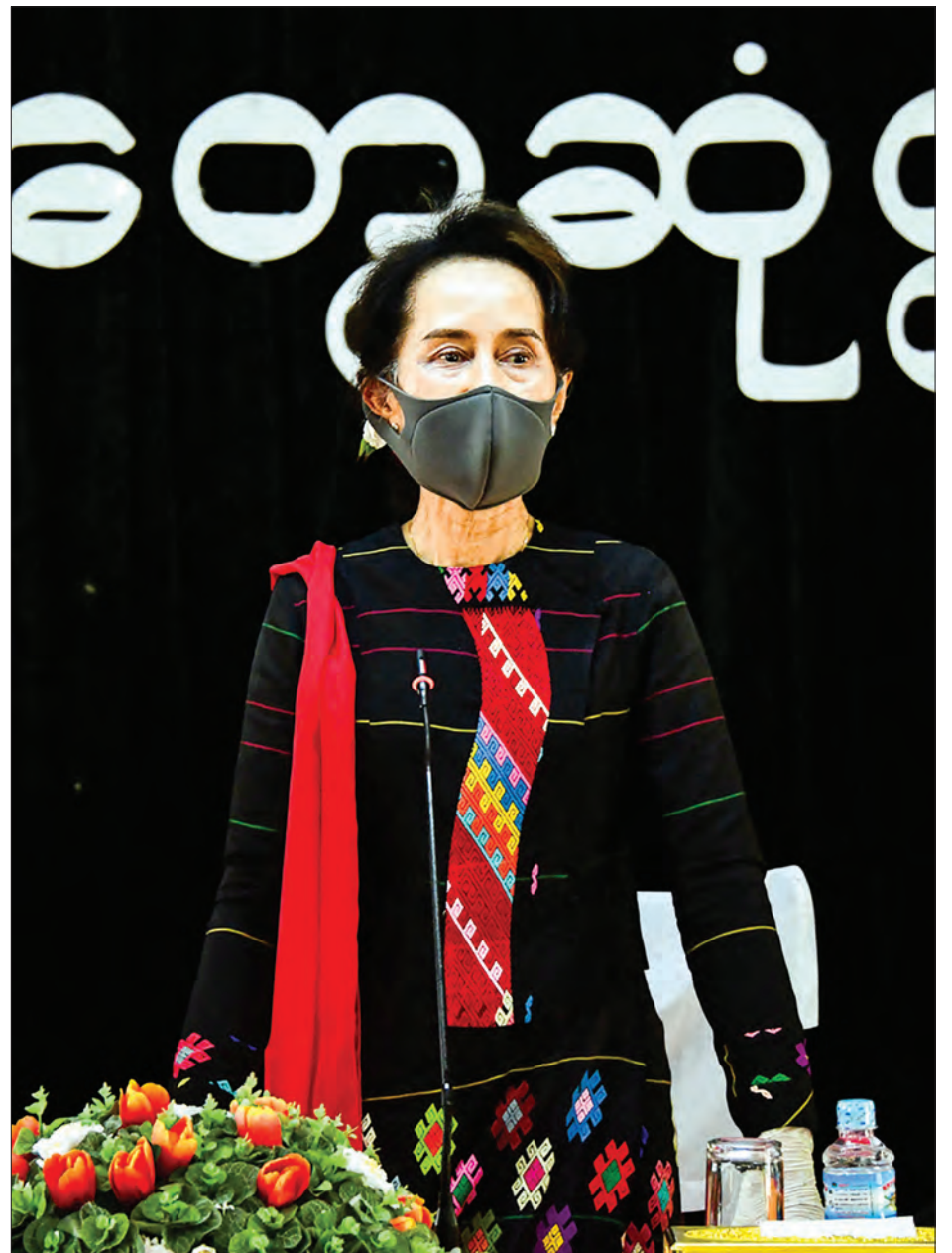
State Counsellor holds meeting with local officials in Cocogyun Township on 6 August.

S TATE Counsellor Daw Aung San Suu Kyi, in her capacity as Chairperson of the Central Committee for Development of Border Areas and National Races, visited Cocogyun Township yesterday. She held talks on development programmes of the township with departmental officials and viewed the high school and the people's hospital. SEE PAGE-4