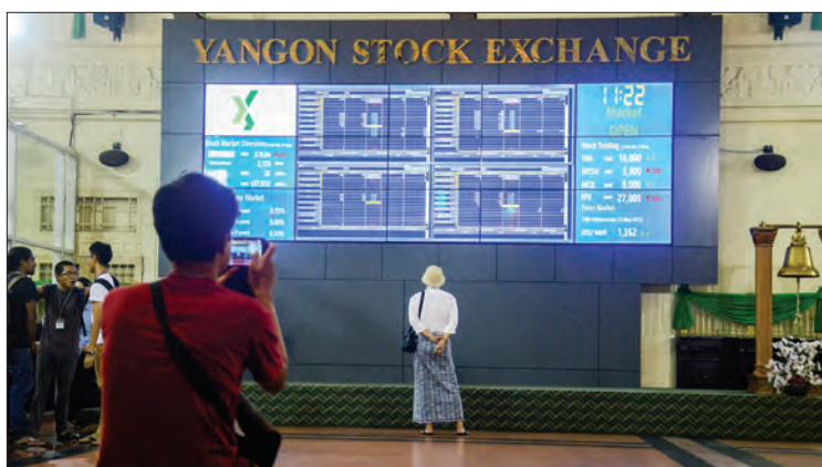
Shares of six listed companies are being traded on Yangon Stock Exchange.