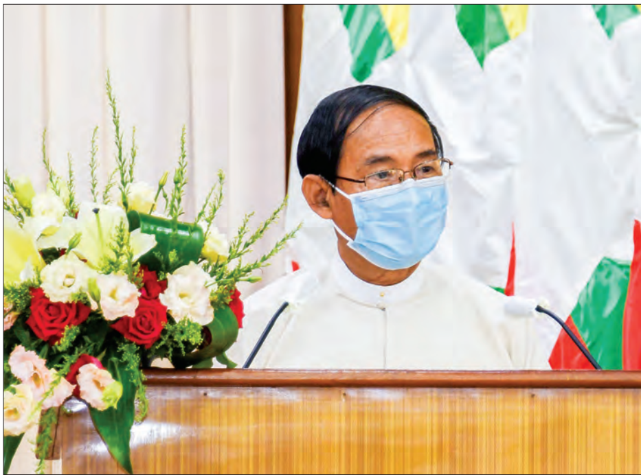
President U Win Myint attends inauguration ceremony of Anti-Corruption Commission's new office in Nay Pyi Taw on 5 August.

P resident U Win Myint opened the new office building of Anti-Corruption Commission in Nay Pyi Taw yesterday morning.