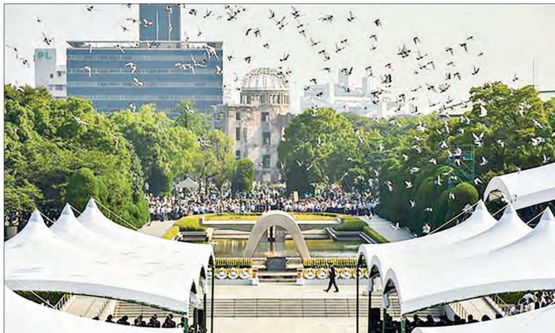
Doves fly over the Hiroshima Peace Memorial Park in western Japan on August 6, 2015 during a memorial ceremony to mark the 70 th anniversary of the atomic bombing of Hiroshima.

"We set up a group called No More Hibakusha Project, which works on preserving records as archives, including what we've written... so that (the next generation) can use them in their campaigns."—AFP ■