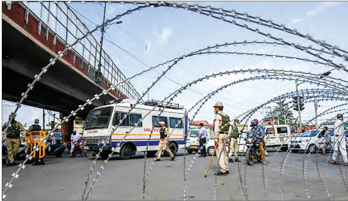
Indian-administered Kashmir was placed under lockdown for the anniversary.

"Modi has certainly been India's most transformative