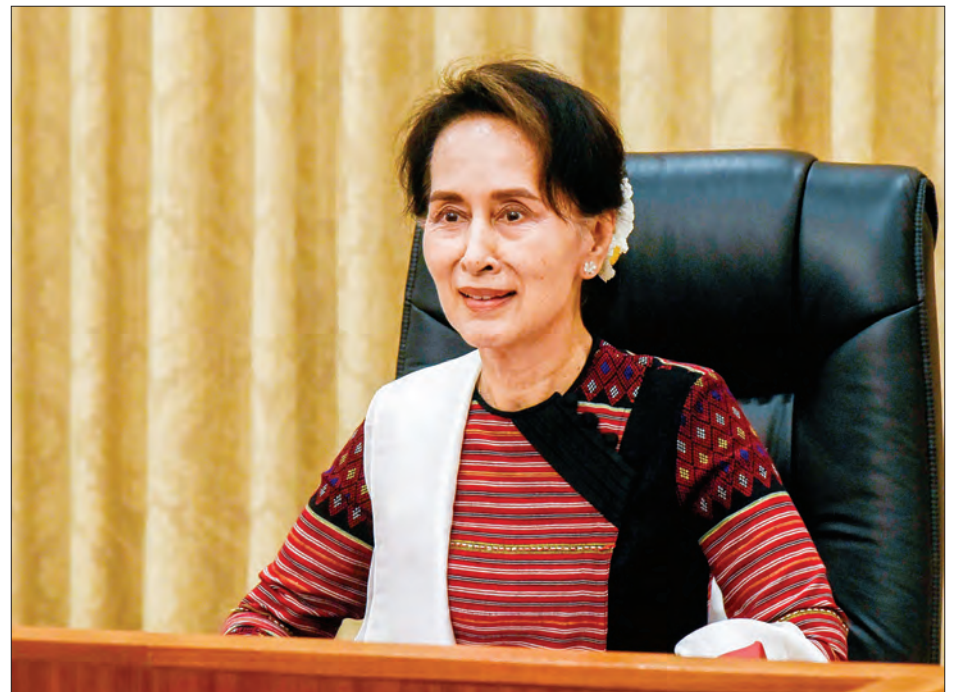
State Counsellor Daw Aung San Suu Kyi holds a videoconference on preparations for 2020 General Election, on 5 August.

D aw Aung San Suu Kyi, Chairperson of the National-Level Central Committee on Prevention, Control and Treatment of Coronavirus Disease 2019 (COVID-19) held a videoconference yesterday at 10 am with senior officials from the conference room of the Presidential Palace in Nay Pyi Taw regarding preparations being made to conduct elections.