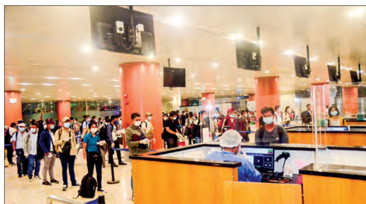
Myanmar returnees from abroad are queuing for immigration process at Yangon International Airport on 5 August.