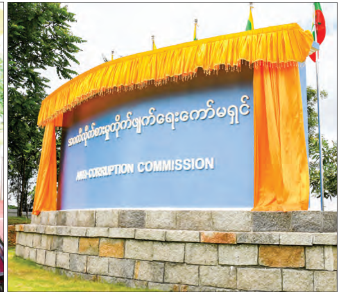
President U Win Myint formally opening new office building of the Anti-Corruption Commission on 5 August 2020.

structed the private business firms to adopt and follow codes of conduct for eliminating corruptions.