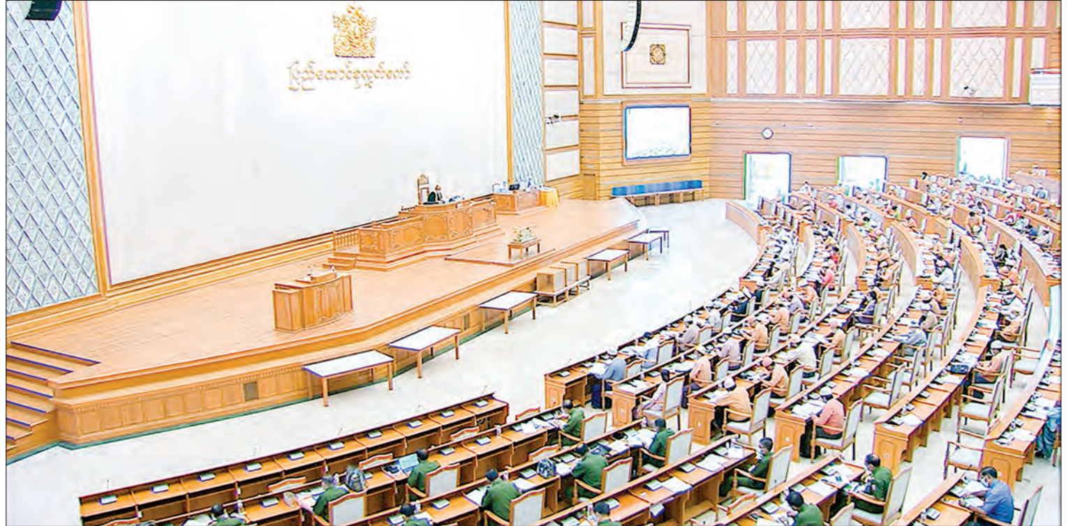
Bills and budget reports were discussed during the 8 th -day meeting of 17 th regular session of the Pyidaungsu Hluttaw on 5 August 2020.

The Hluttaw also approved for signing of Myanmar in the ASEAN Framework Agreement on Mutual Recognition Arrangements, proposed by the President.