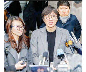
Lawyers for South Koreans who won a wartime forced labour case against Nippon Steel Corp. speak to reporters on Feb. 15, 2019 in front of the company's head office in Tokyo.

TOKYO—Tensions between Japan and South Korea could flare up in the coming months amid an ongoing feud over an issue of compensation for Koreans made to work in factories during Japanese colonial rule.