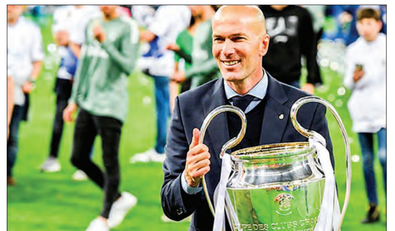
Zinedine Zidane won three consecutive Champions League titles during his first spell as Real Madrid boss between 2016 and 2018. Zidane with the Champions League trophy after Real Madrid's win against Liverpool at the NSC Olimpiyskiy Stadium in Kiev, Ukraine on 26 May 2018.

when they - in this decade - have dominated this competition like no other club, it shows his ability," Guardiola told DAZN. "Although people may not believe me because he is from Real Madrid, I am very happy that things are going well because it is very good for football that things go well for people like him."—AFP ■