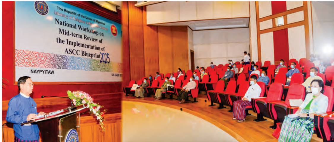
Union Minister Thura U Aung Ko makes the opening remark at workshop on reviewing ASCC Blueprint 2025 implementation on 5 August.

THE opening ceremony of the national workshop on submitting mid-term review of ASEAN Socio-Cultural Community (ASCC) Blueprint 2025 was held yesterday morning in Nay Pyi Taw.