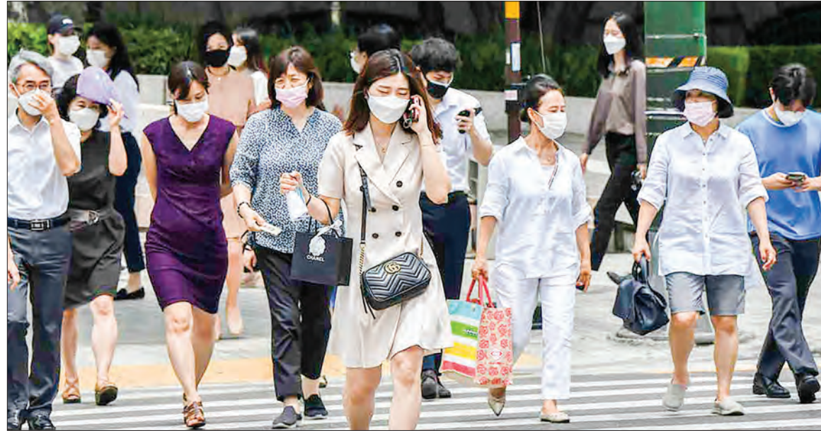
Pedestrians wearing face masks cross the road in central Seoul on 23 June, 2020.

This was no accident. South Korea's government began investing in healthcare—especially