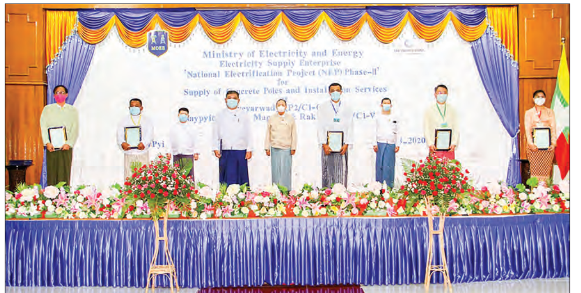
Ministry of Electricity and Energy exchanges agreements with tender-winning companies for supplying concrete poles and installation services on 5 August.