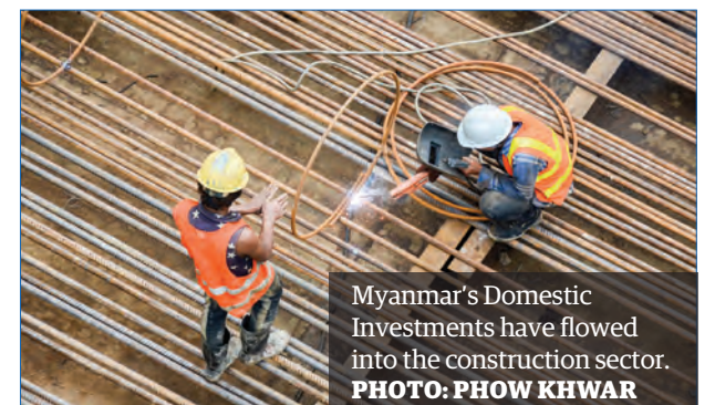
Myanmar's Domestic Investments have flowed into the construction sector.