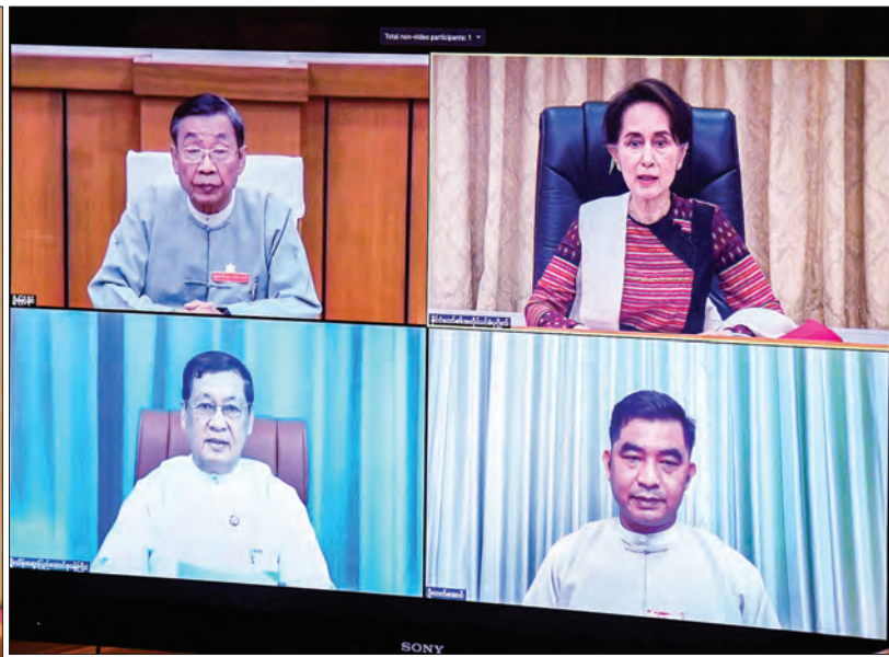
State Counsellor discusses preparations for 2020 General Election with Union Minister U Thein Swe and officials concerned on 5 August.