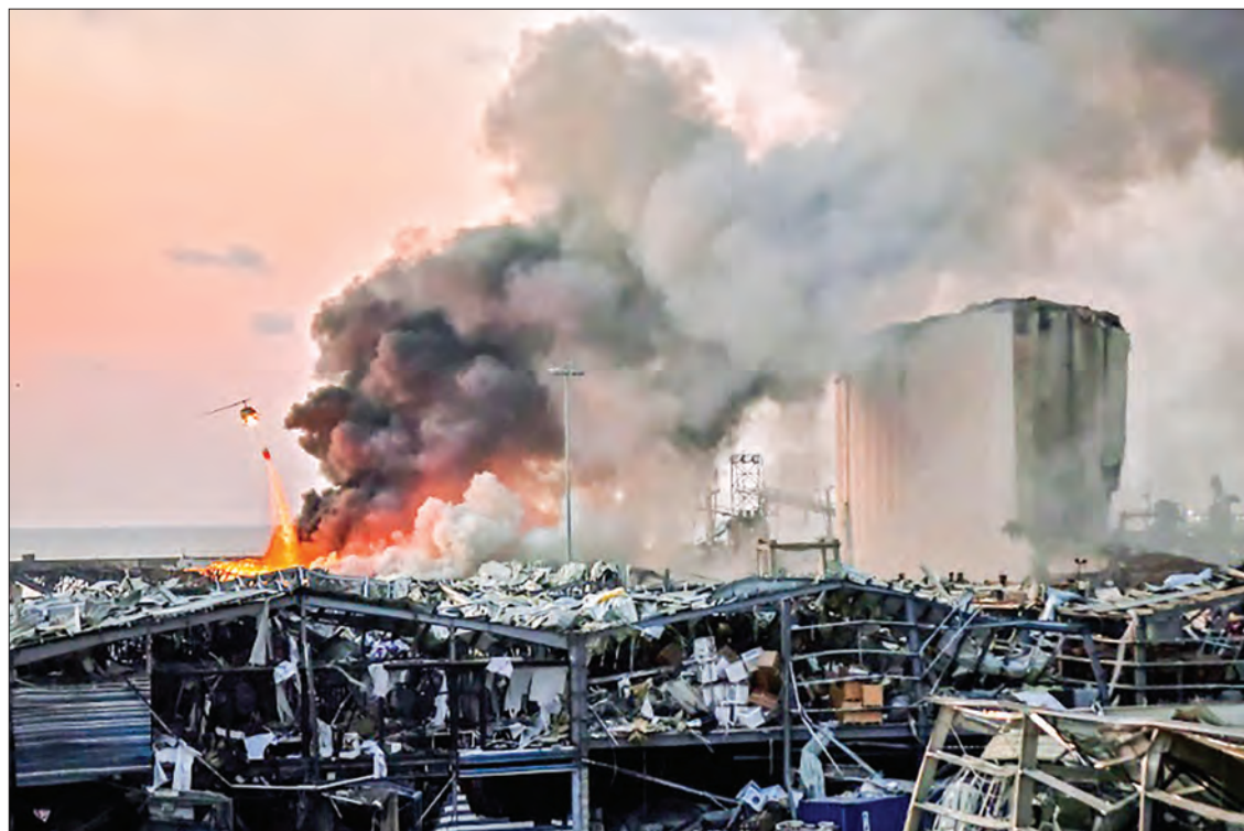
A helicopter pours water onto the fire at the port of Lebanon's capital Beirut.