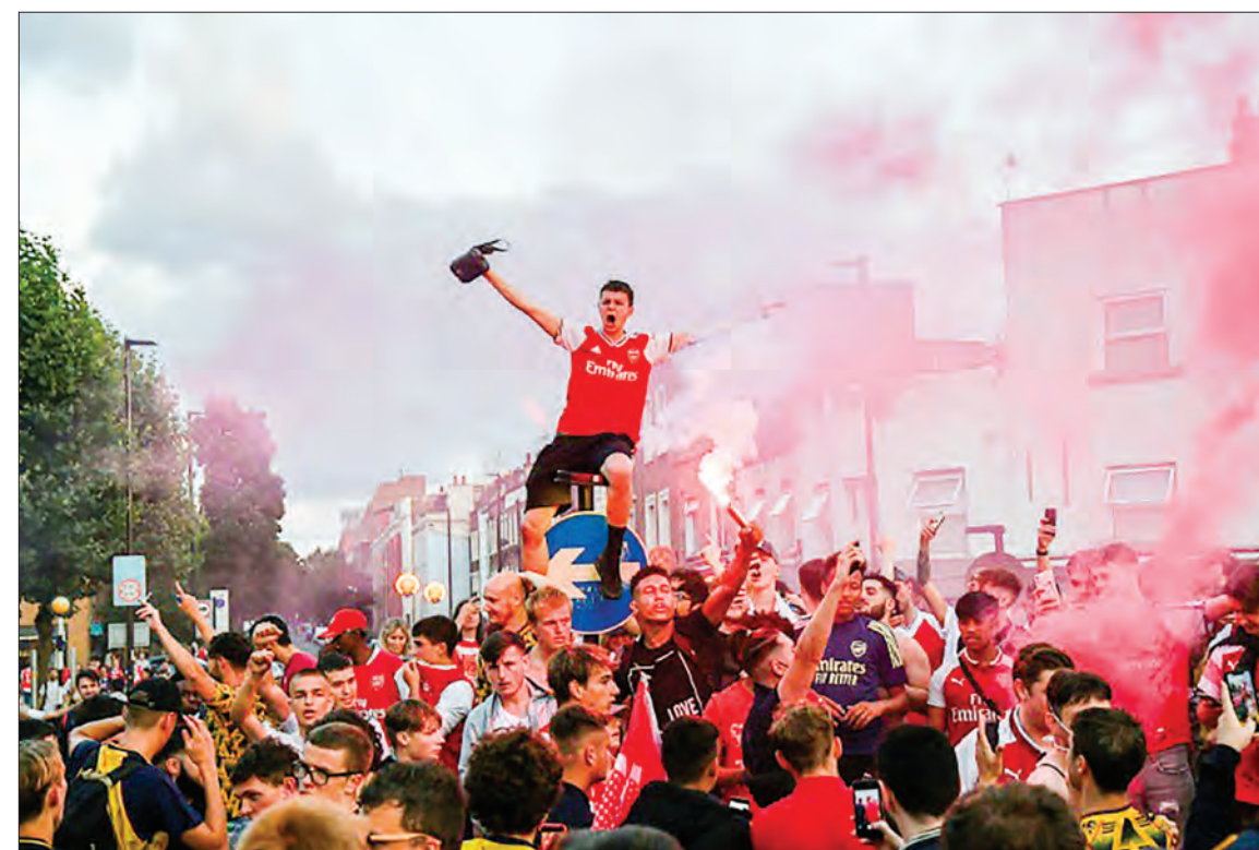
Even with the stadium closed, Arsenal fans celebrated outside the Emirates stadium in north London when their team won the English FA Cup earlier this month.