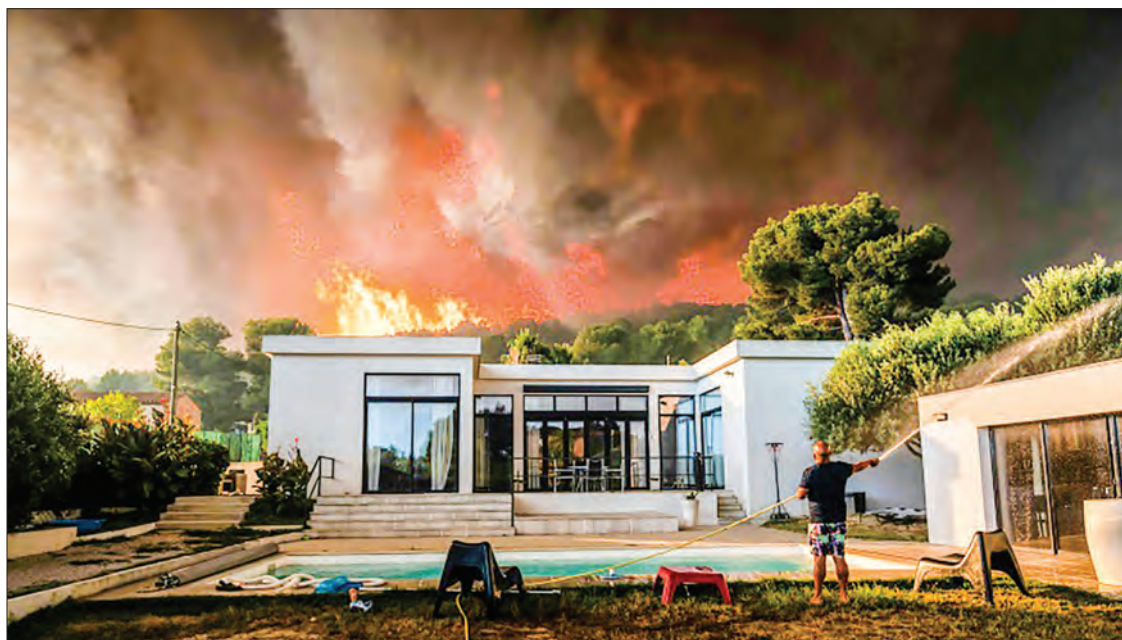
Some 1,800 firefighters are battling the blaze.

No casualties have been reported, “but material damage has still to be evaluated,” it said.