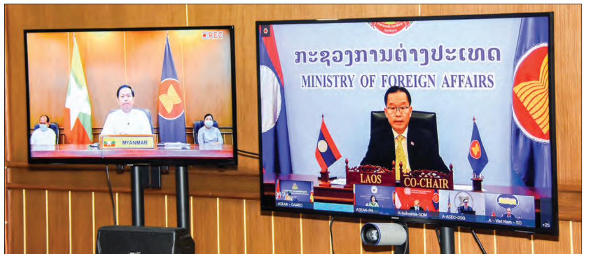
Permanent Secretary of Ministry of Foreign Affairs U Soe Han joins the 33 rd ASEAN-US Dialogue via videoconference on 5 August.

ASEAN and the United States' responses to COVID-19, and exchanged views on strengthening cooperation of the ASEAN-US Strategic Partnership. Furthermore, the Meeting shared views on regional and international issues. Permanent Secretary U Soe Han highlighted that the principles of strengthening ASEAN Centrality, mutual respect, mutual trust, equality, inclusivity and complementarity within the existing cooperation framework contained in the ASEAN Outlook on the Indo-Pacific are vital for enhancing strategic stability and win-win cooperation in the region. He also stressed the importance of strengthening ASEAN-US maritime cooperation particu-