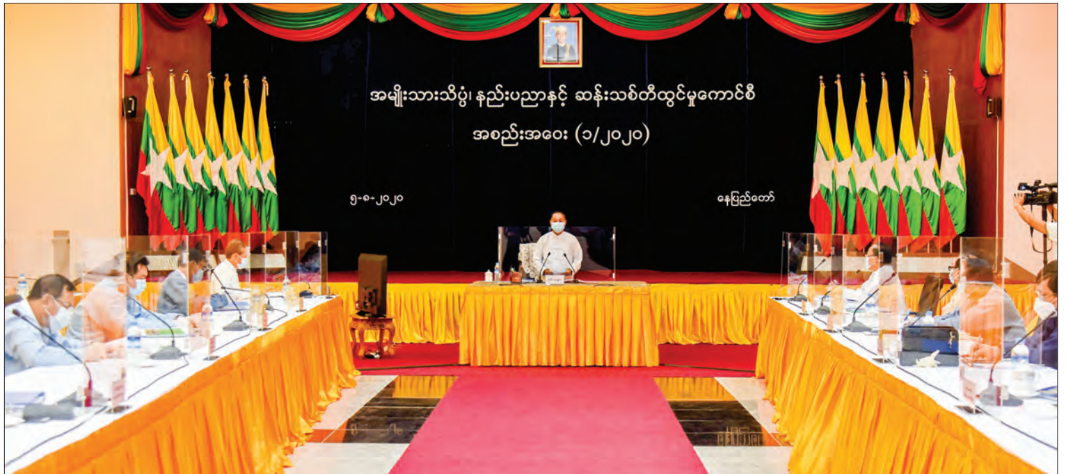
Vice President U Myint Swe emphasizes enforcement of Science, Technology and Innovation Law on 5 August.

He also suggested encouraging greater creativity and innovation which will contribute to the development of the modern economy in line with Strategy 7 in