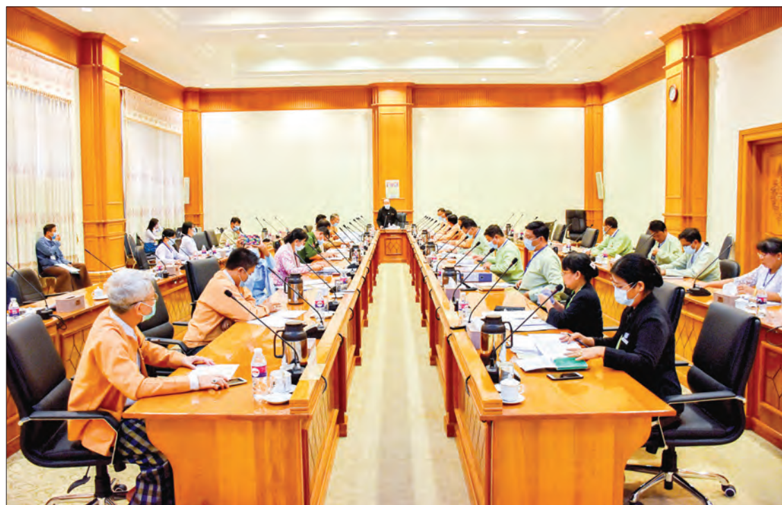
Pyidaungsu Hluttaw Joint Bill Committee discusses National Library Bill and Animal Health and Breeding Development Bill on 5 August 2020.