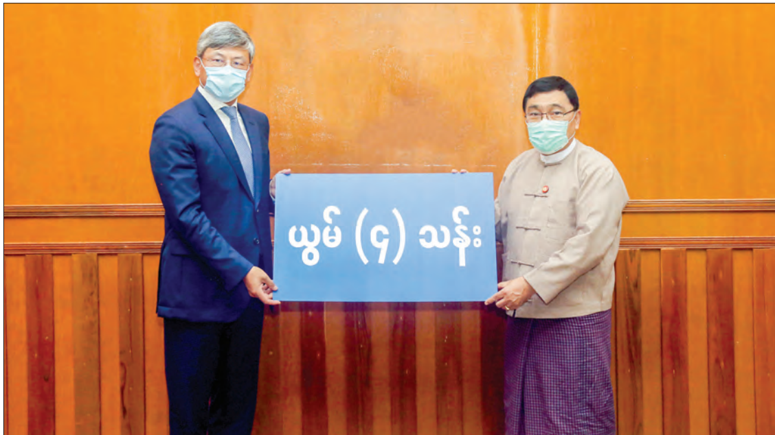
Union Minister Dr Win Myat Aye receives 4 million yuan from China for resettlement of IDPs in Kachin State on 5 August.

People's Republic of China contributed 4 million yuan, out of 200 million yuan pledged for resettlement of the displaced