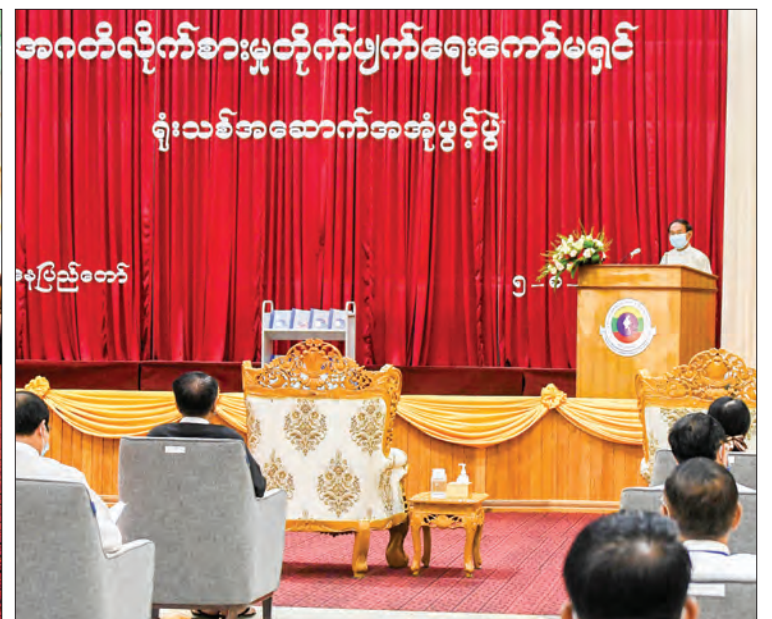
President U Win Myint delivers the speech at the opening ceremony of the new office building of Anti-Corruption Commission on 5 August 2020.