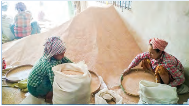
Myanmar exports 90 per cent of sesame production to foreign markets.

THE prices of black and white sesame seeds are significantly rising in Mandalay market on the back of strong demand from China, Mandalay traders said.