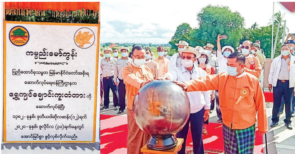
Union Minister U Han Zaw (C), Bago Region Chief Minister U Win Thein (R) and Hluttaw Speaker U Khin Maung Yin (L) unveil the Shwekyin Creek-Crossing Bridge Plaque on 31 July 2020.

UNION Minister for Construction U Han Zaw officially opened Sittoung River-Crossing Bridge (Myo Soe) in Ottwin Township and Shwekyin Creek-Crossing Bridge in Shwekyin Township, Bago Region yesterday.