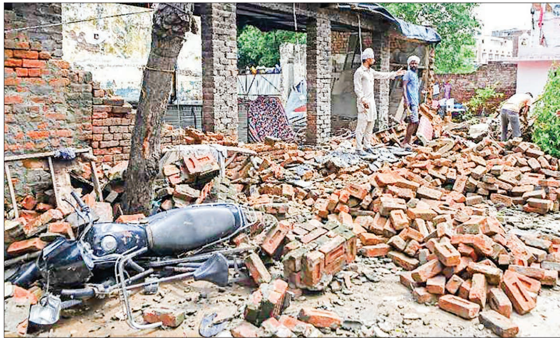
The torrential downpours across the densely populated region cause widespread death and destruction.