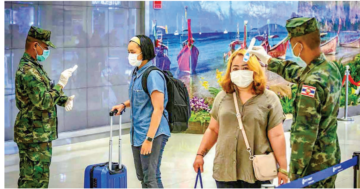
Thai soldiers take the temperatures of arriving passengers at Phuket International Airport, to check for symptoms of the COVID-19 coronavirus on 19 March, 2020.

WHO chief Tedros Adhanom Ghebreyesus has stressed that