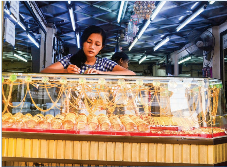
(FILES) Salewomen wait for customers at a gold shop in Yangon on 11 April 2017.