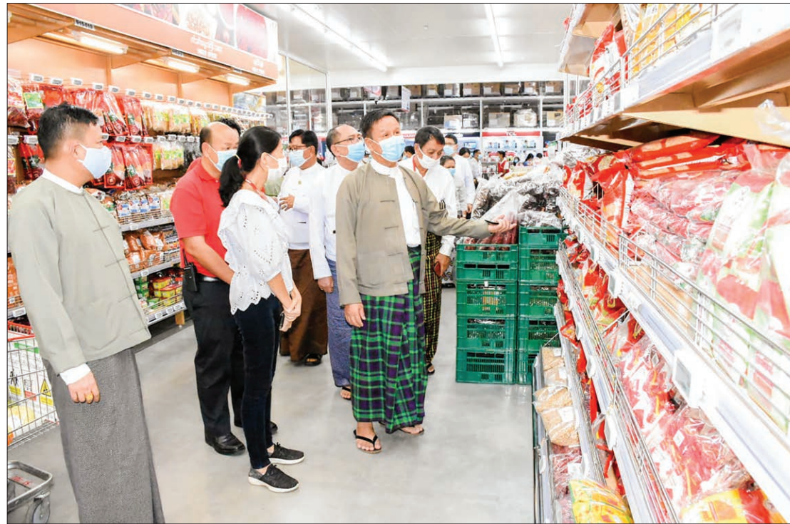
Officials are looking around the sales of foods at a shop on 31 July 2020.

DEPUTY Minister for Commerce U Aung Htoo discussed with officials in Yangon about promotion of export sector.