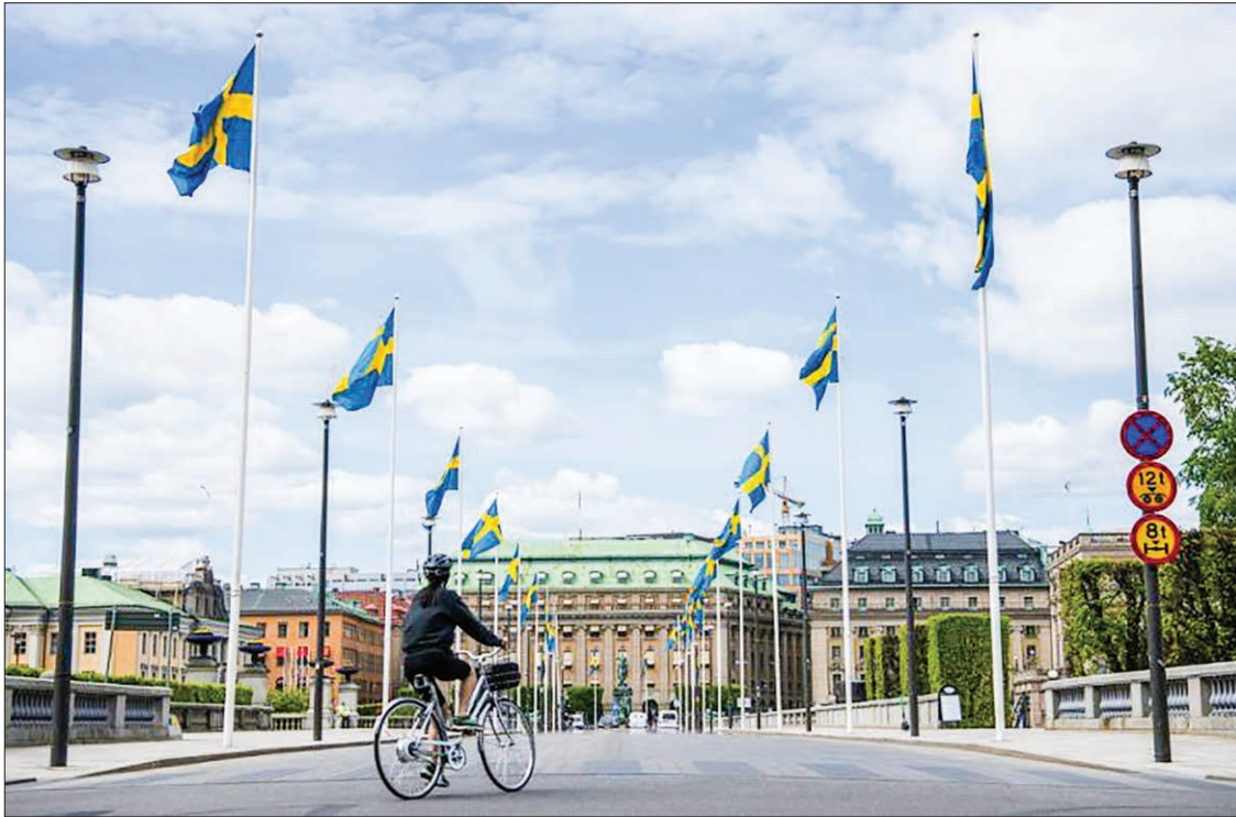
The recommendation will remain in place until the New Year.

SWEDEN, whose controversial softer approach to curbing COVID-19 has received worldwide attention, said Thursday it would