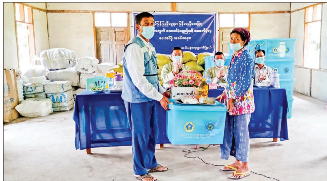
An MoSWRR official (L) provides relief items to a local woman (R) in Makhawyan Village in Mansi Township on 31 July 2020.

LOCAL authorities from the Disaster Management Department provided relief and cash assistance to the returnees in Makhawyan village of Mondeinpart village-tract in Bamaw district, Kachin State, yesterday.