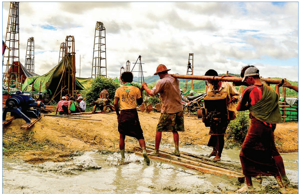
Workers carry an engine on their shoulder at a construction site in Kawthoung, Taninthayi Region on 31 July 2020.