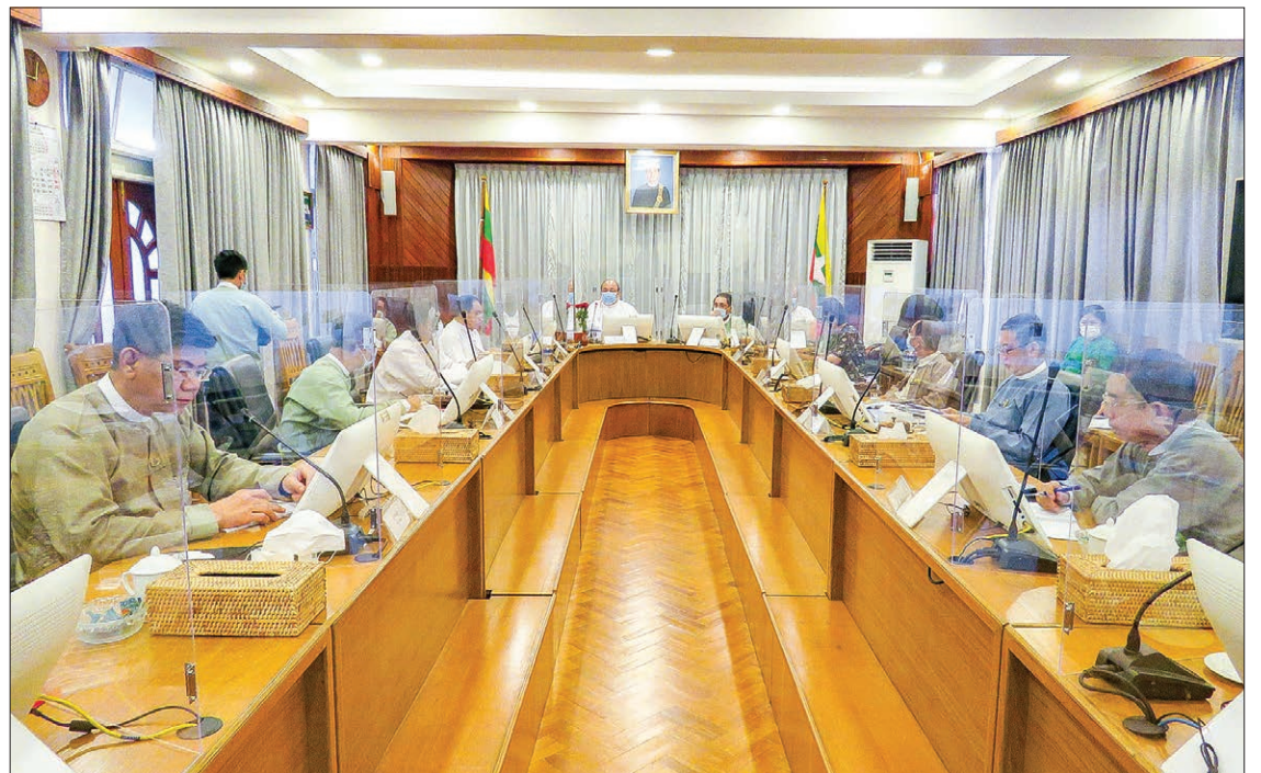
Union Minister U Thaung Tun presides over the Myanmar Investment Commission (MIC)'s regular meeting in Nay Pyi Taw on 31 July 2020.

Singapore, People's Republic of China and Thailand head the list of countries that have invested in Myanmar in the current financial year. Investment in the power sector accounted for (26.52%). This was followed by the oil & gas sector (26.44%) and manufacturing sector (14.28%) of the total permitted amount of foreign investment.—MNA ■