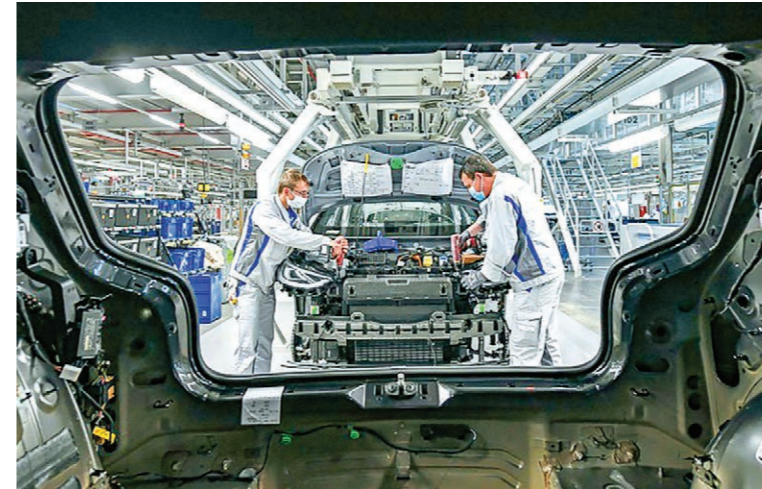
VW was one of the global companies reporting the impact of the pandemic on its results.

Hong Kong, which was also initially lauded for its coronavirus response, is struggling to balance fears of a third wave among its 7.5 million residents, which authorities fear could cripple the healthcare system, against anger