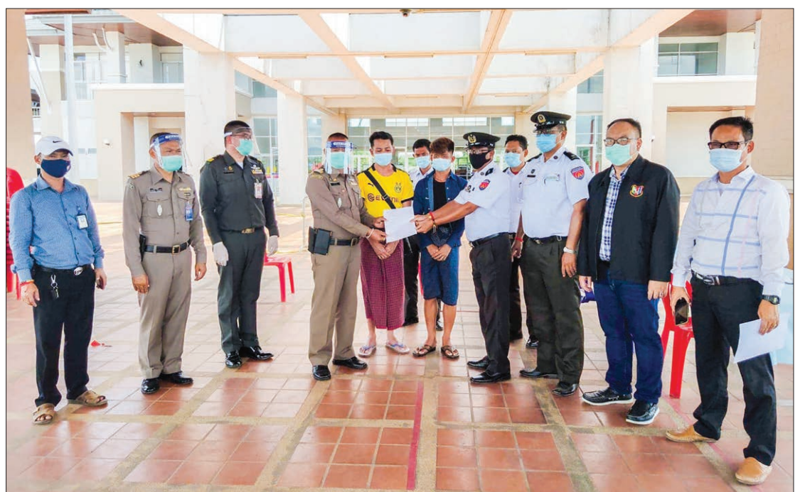
Myanmar and Thai officials exchange documents on transferring two Thai nationals in Tachilek on 31 July 2020.