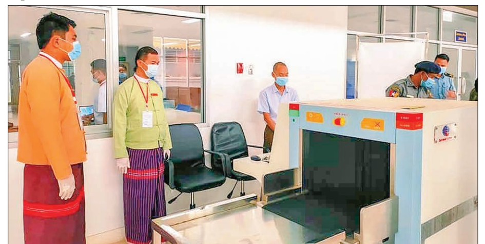
Officials are seen checking returnees at Myawady border's security control on 31 July 2020.