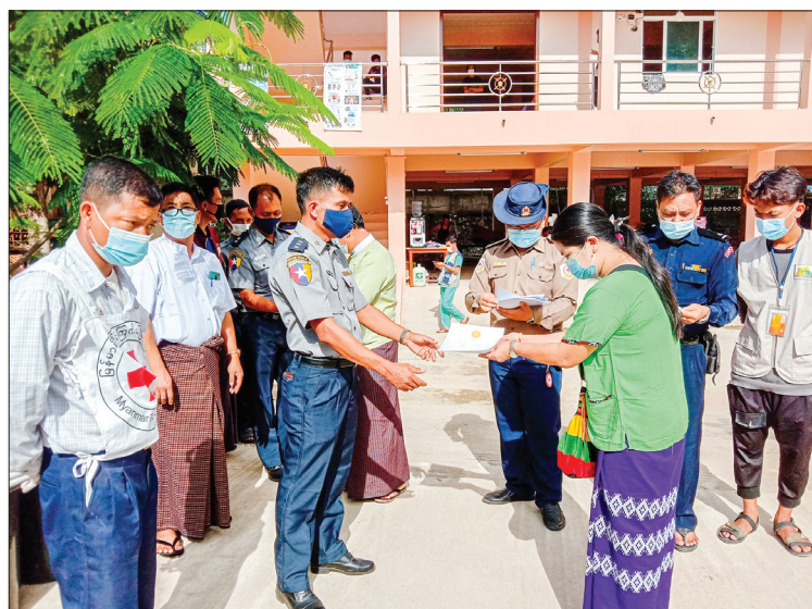
Fifty-eight Myanmar nationals who tested negative for COVID-19 are allowed to return home on 31 July 2020.