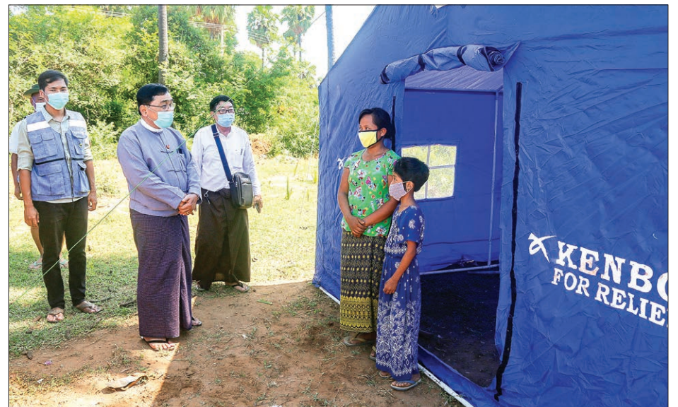
Union Minister Dr Win Myat Aye meets flood victims on 31 July 2020.