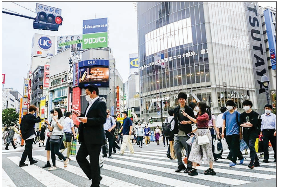
The projections were made under a scenario assuming the world's third-largest economy will achieve real growth of over 2 per cent and nominal growth of 3 per cent annually for five years from fiscal 2021, which begins next April.

Prime Minister Shinzo Abe said at a government meeting, where the estimates were presented, that the projections this time showed that the country's "mid- to long-term economic and fiscal conditions are severe," and vowed to "continue steadily promoting integrated economic and fiscal reforms."—Kyodo ■