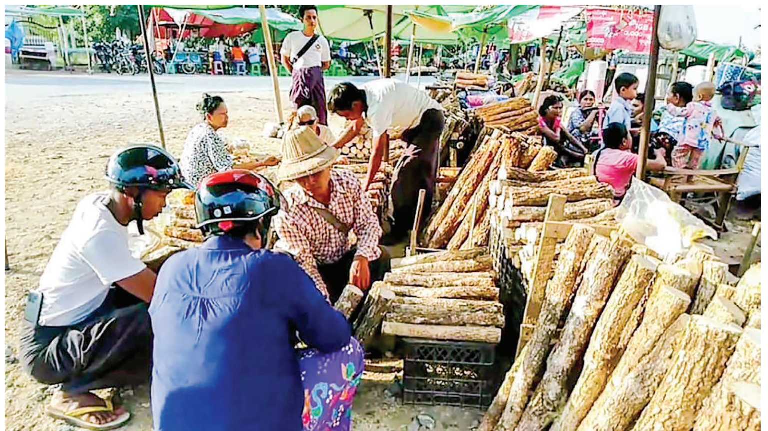
Myanmar Thanaka bark being sold in the market.