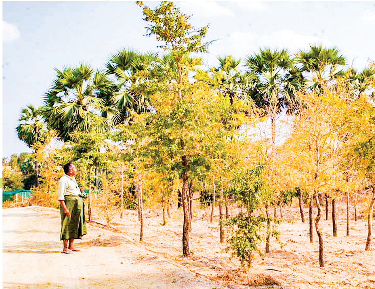
Thanaka plantations in Sagaing Region. Thanaka cultivators has increased as domestic and international demand has increased.

Since Myanmar is one of the largest repositories of tangible heritage in the world, a major part of this heritage has been preserved through ancient monuments, sites and antiquities of varied nature. The range of