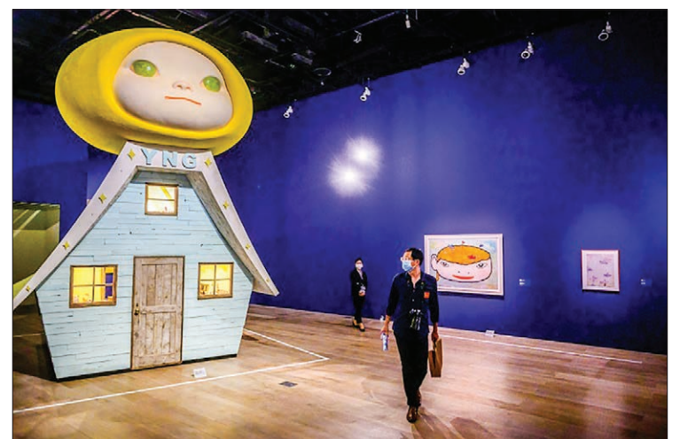
Pieces by artist Yoshitomo Nara are among the works on display at a major exhibition of contemporary Japanese artists opening in Tokyo as coronavirus infections spike.