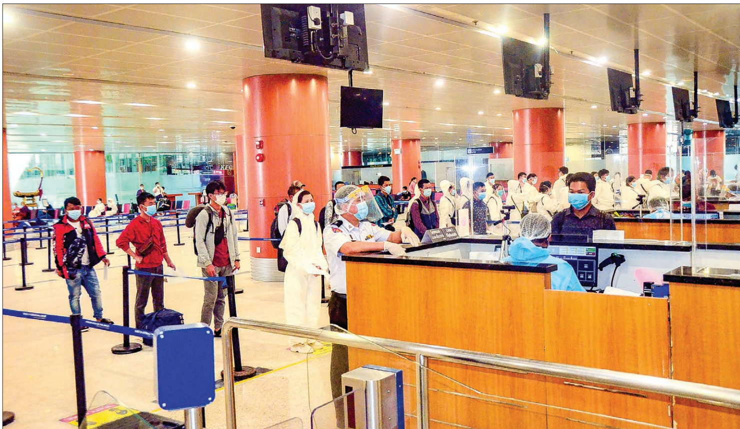
Myanmar nationals returned from foreign countries queue for immigration services at the Yangon International Airport on 31 July 2020.

A RELIEF flight of Myanmar Airways International brought back 121 Myanmar nationals stranded in Jordan with the help of Myanmar embassy in Tel Aviv, and it landed at Yangon International Airport yesterday morning.