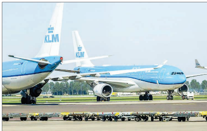
Airlines like KLM are cutting jobs as air traffic is set to remain below pre-coronavirus levels for at least a couple of years.