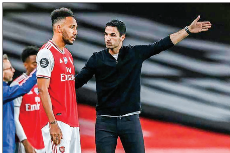
Mikel Arteta, the head coach of Premier League club Arsenal.

LONDON — Mikel Arteta insists even winning the FA Cup final against Chelsea on Saturday will not salvage Arsenal's season, but a trophy just eight months into his first managerial role will strengthen the impression the Gunners now have the right man in charge to right the ship.