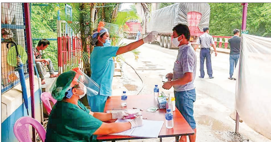
A man who returned from China (R) has temperature checked at the Chinshwehaw border on 31 July 2020.