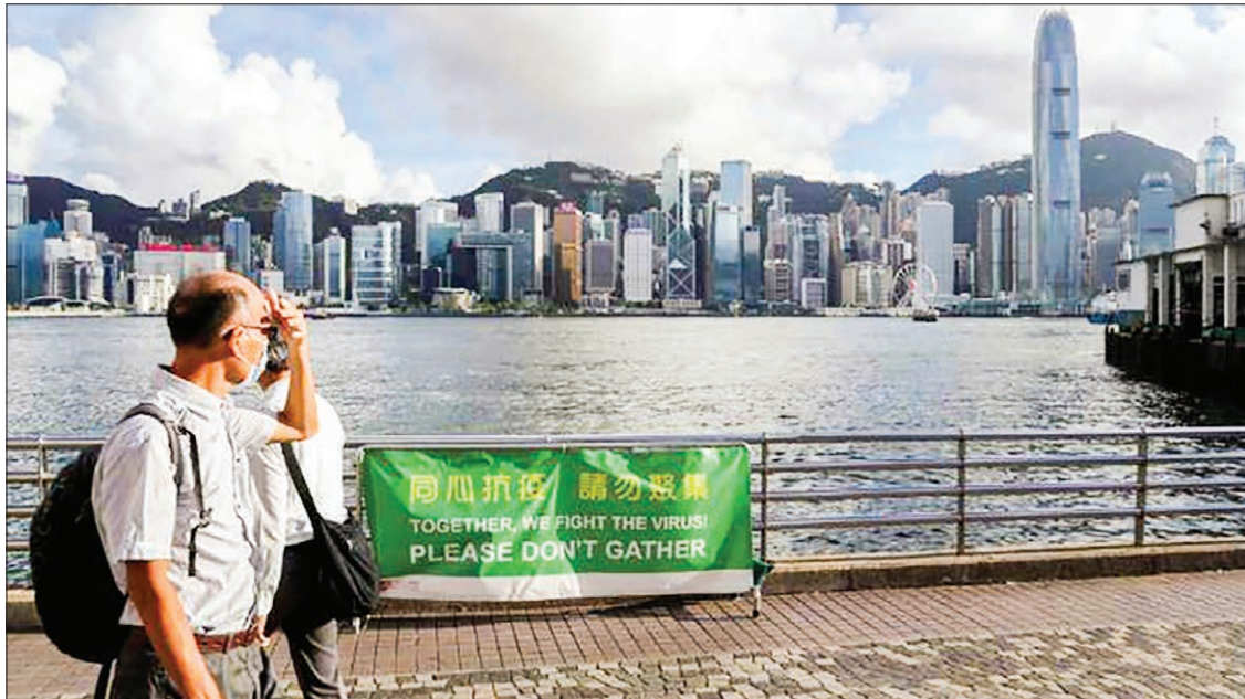
The Legislative Council election, which was set for Sept. 6, is now scheduled to be held on Sept. 5, 2021, to curb the epidemic, protect the health and safety of people and ensure a fair and open election.

HONG KONG — Hong Kong's September legislative election will be postponed for a year due to health concerns amid the coronavirus pandemic and China's parliamentary advice will be sought for setting a legal basis to extend incumbent lawmakers' term of office, government leader Carrie Lam announced Friday.