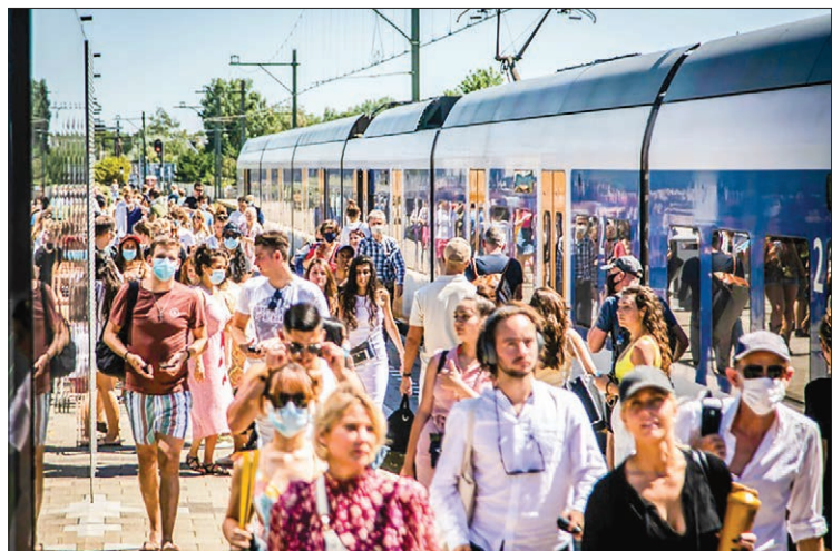
Dutch authorities warned that the beach in Zandvoort was getting dangerously crowded.