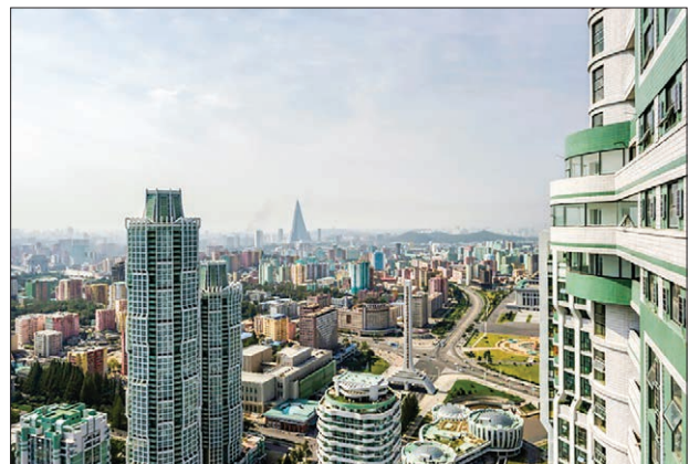
Construction in North Korea turned positive last year, Seoul said, as did the agriculture, forestry and fishing sector.

It remains deeply impoverished, with around 40 per cent of the population in need of food aid according to UN estimates.—AFP ■