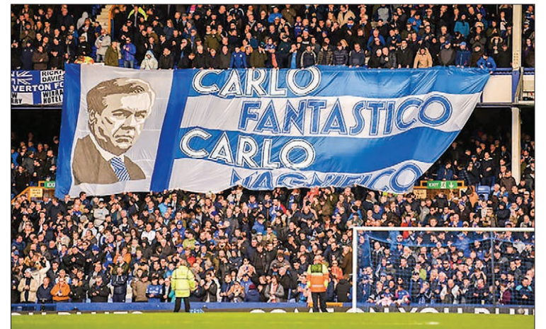
Fans unfurl a huge flag of Everton's Italian head coach Carlo Ancelotti in the crowd ahead of the English Premier League football match between Everton and Crystal Palace at Goodison Park in Liverpool, north west England on February 8, 2020.