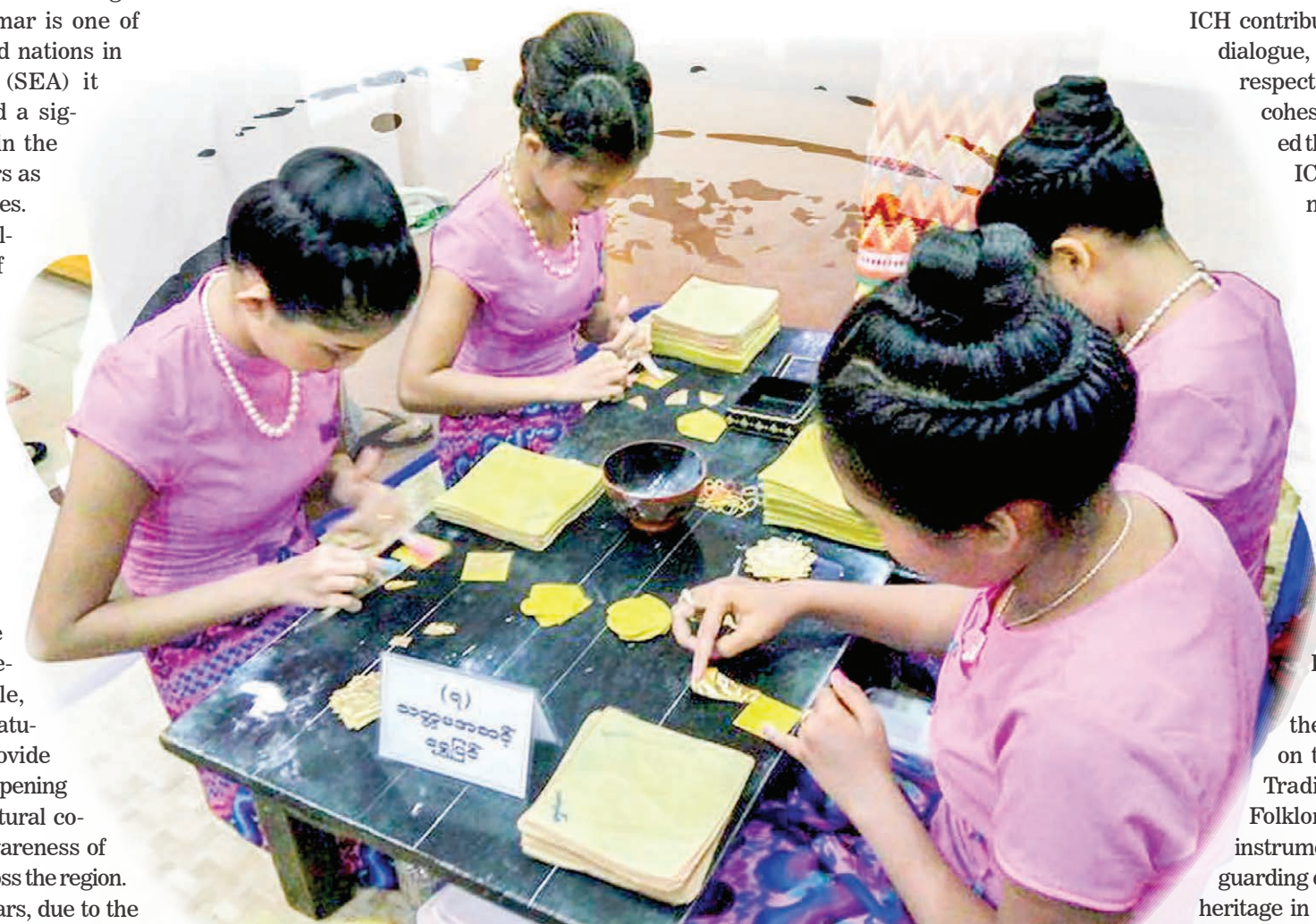
Traditional Gold Leaf Industry.

ideas of the earlier Conference in Mexico City, UNESCO conducted some promotional programmes for raising awareness of this Recommendation. In the late 1990s, there was a conference held for the assessment of this Recommendation, which pointed out some problems to be considered in