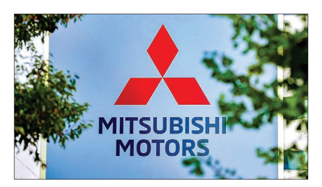
The logo of Mitsubishi Motors Corp.

TOKYO—Mitsubishi Motors Corp. said Monday it is expecting a group net loss of 360 billion yen ($3.4 billion) for the current business year through March, its biggest loss in 16 years, due to slowing global sales following the novel coronavirus pandemic. The Japanese carmaker, an alliance partner of Nissan Motor Co. and Renault SA of France, also said it will close its subsidiary's plant producing Pajero and Outlander sport utility vehicles in central Japan in the first half of 2021 as part of restructuring efforts.