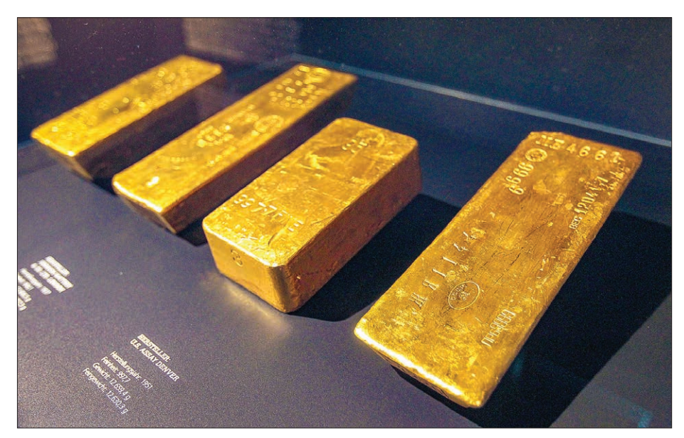
Gold bars are displayed at the Exhibition "Gold, Treasures at the Deutsche Bundesbank" at the German Money Museum of the Deutsche Bundesbank in Frankfurt am Main, Germany, on 10 April 2018.

LONDON (United Kingdom) — Gold soared to a record high on Monday as investors rushed into the safe-haven commodity on concerns about heightened China-US tensions, spiking virus infections and a lack of progress on a new stimulus bill in