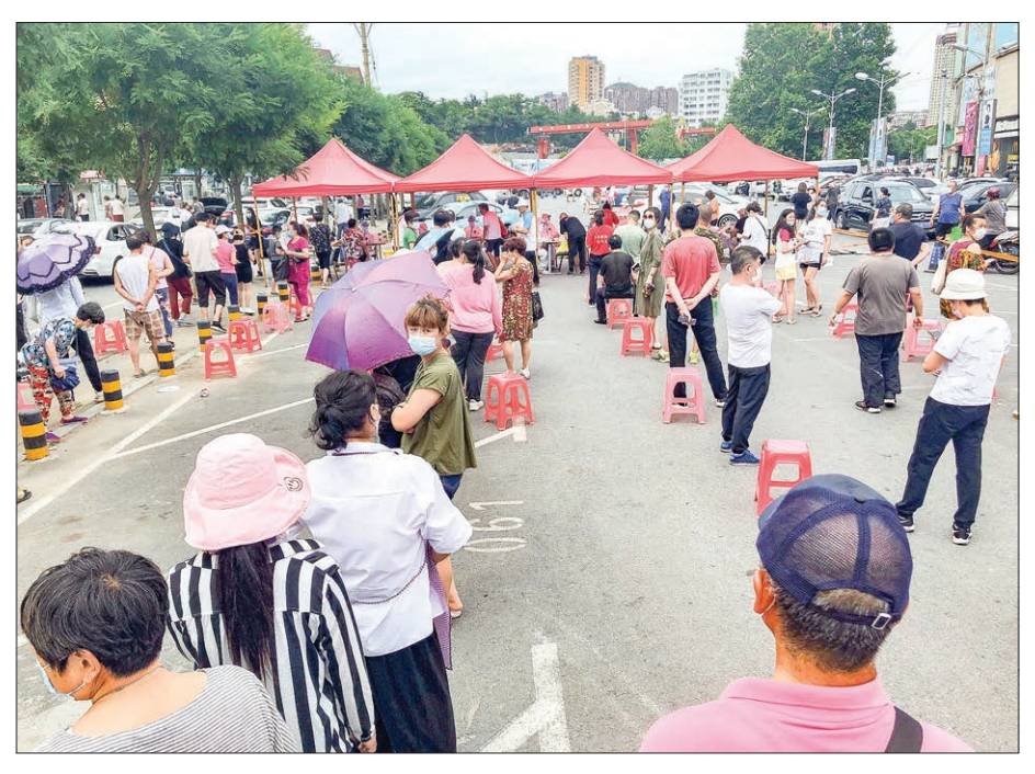
This photo taken on July 25, 2020 shows people lining up to undergo COVID-19 coronavirus tests at a makeshift testing centre in a car park in Dalian, in China's northeast Liaoning province. China recorded 61 new coronavirus cases on 27 July-- the highest daily figure since April -- propelled by clusters in three separate regions that have sparked fears of a fresh wave.

Chinese authorities have rolled out mass testing for hundreds of thousands of people in the port city of Dalian.