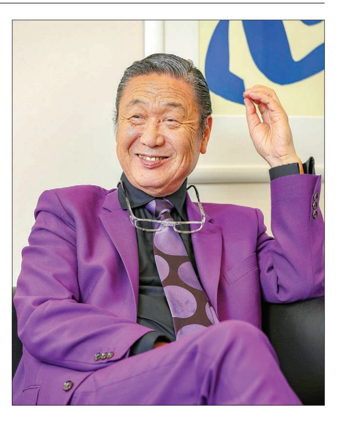
File photo shows fashion designer Kansai Yamamoto during an interview in Tokyo in May 2017.

Also an event producer, Yamamoto oversaw the "Kansai Super Show Hello! Russia" in Moscow's Red Square in 1993, drawing an audience of some 120,000. He also held the Kansai super shows in Vietnam in 1995, in India in 1997 and in Gifu, central Japan, in 2000, according to the company, while he produced an event at the opening of the world expo in Aichi Prefecture, central Japan, in 2005. —Kyodo News ■