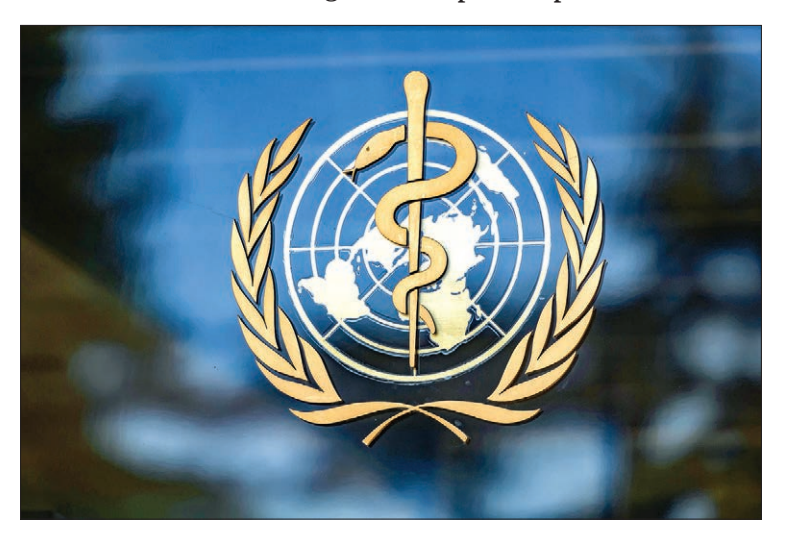
This picture taken on April 15, 2020 shows a sign of the World Health Organization (WHO) at the entrance of their headquarters in Geneva amid the COVID-19 outbreak, caused by the novel coronavirus.

"Release pressure on the virus and the numbers can creep back up." —AFP ■