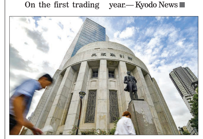
Osaka Exchange.

day of the merged exchange, gold futures briefly hit an all-time high of 6,594 yen ($62) per gram on the intraday basis, reflecting some investors' appetite for a safe-haven asset amid the novel coronavirus pandemic and growing U.S.-China tensions. The Osaka Exchange had handled financial derivatives such as stock and government bond futures. It took over futures trading operations for precious metals, rubber and farm goods from the Tokyo Commodity Exchange, known as Tocom, after Japan Exchange Group, which also runs the Tokyo bourse, merged the commodity exchange last