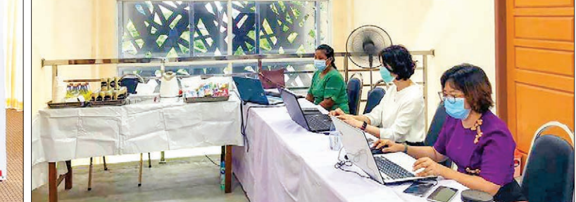
The 2020 Myanmar- Korea Technology Exchange Online B2B Meeting is in progress at the SME Centre of Directorate of Industrial Supervision and Inspection in Yangon on 27 July 2020.

port the translators, interpreters, law consultants and things needed in order to facilitate the coordination of the businesses.