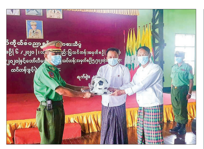
A Tatmadaw personnel (L) receives the football presented by MFF's officials on 27 July 2020.