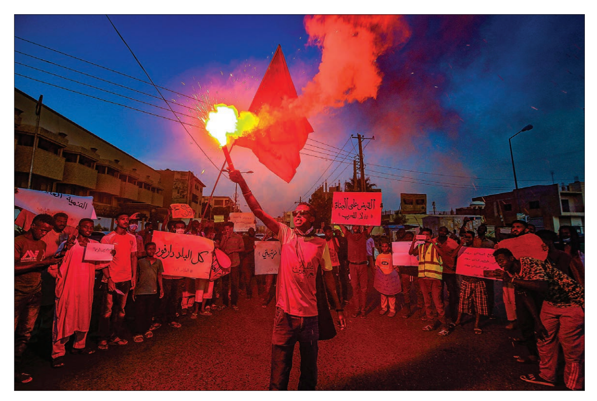
A demonstrator lights a flare while chanting slogans during a protest outside the Sudanese Professionals Association in the Garden City district of Sudan's capital Khartoum on 4 July 2020.

The force will include army and police forces, it said.