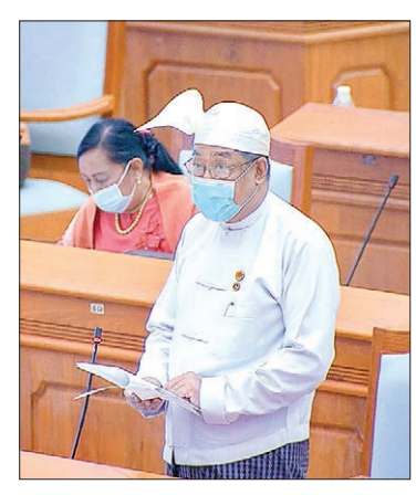
Deputy Governor of the Central Bank of Myanmar U Soe Min.