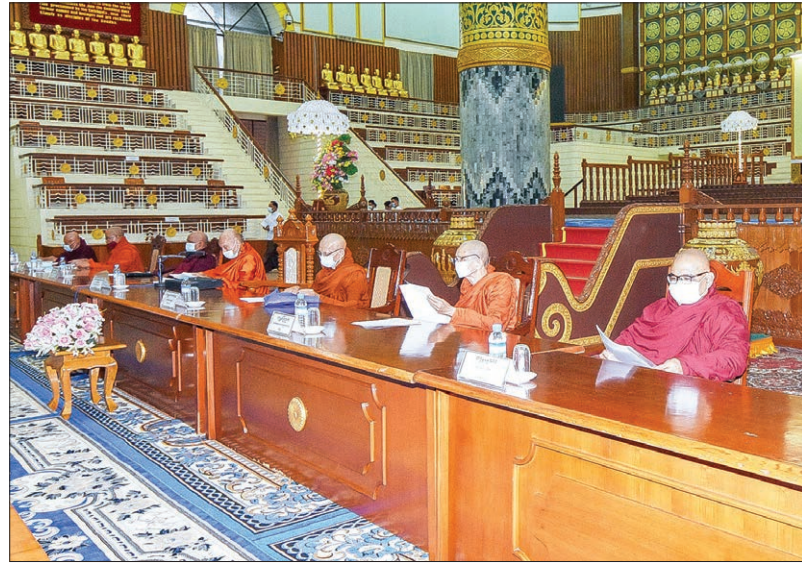
The 47-member leading committee of the 8th State Sangha Maha Nayaka Committee concludes the fifth meeting at the Maha Pathana Cave in Thiri Mingalar Kaba Aye Hill in Yangon on 27 July 2020.

THE fifth meeting of the 47-member leading committee of the 8th State Sangha Maha Nayaka Committee was successfully concluded at the Maha Pathana Cave in Thiri Mingalar Kaba Aye Hill in Yangon yesterday.