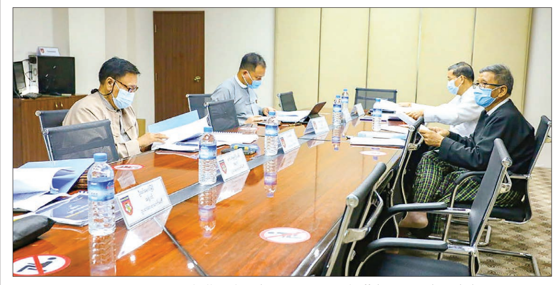
The meeting of the Myanmar Football Federation (MFF) Legal Affairs Committee is in progress at the MFF's meeting hall in Yangon on 27 July 2020.