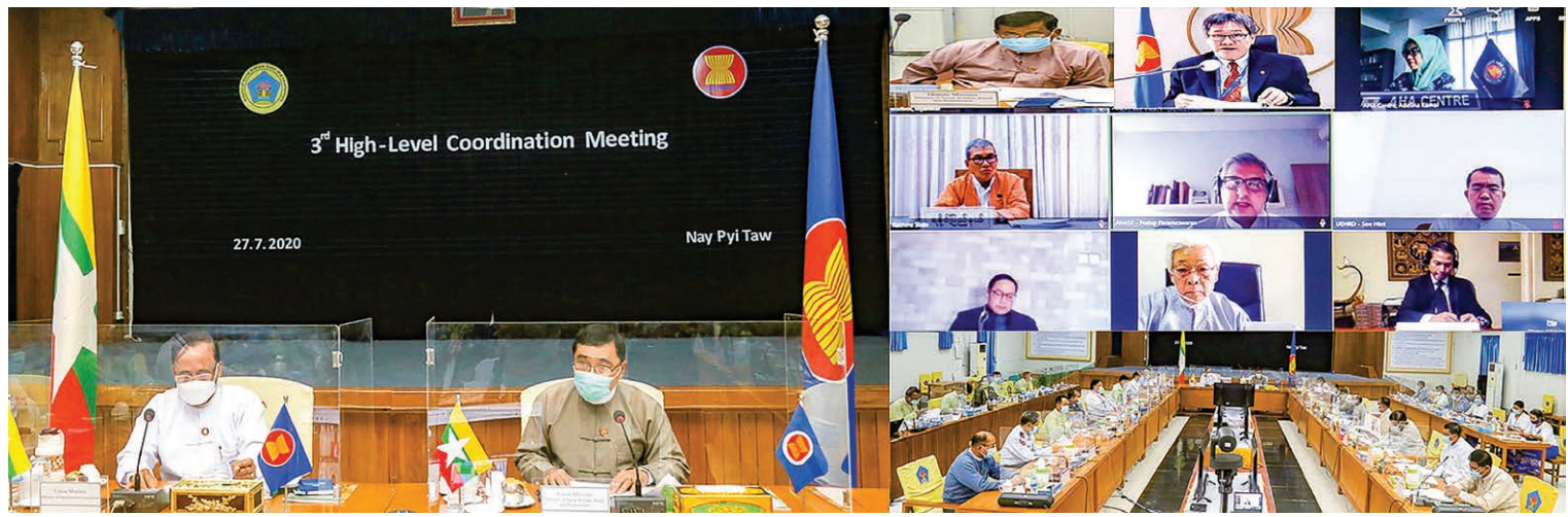
The 3<sup>rd</sup> High-Level Coordination Meeting is in progress in Nay Pyi Taw on 27 July 2020.

MYANMAR and ASEAN discussed measures and progresses on repatriation programme for the displaced persons from Rakhine State during the 3rd High-Level Coordination Meeting yesterday.