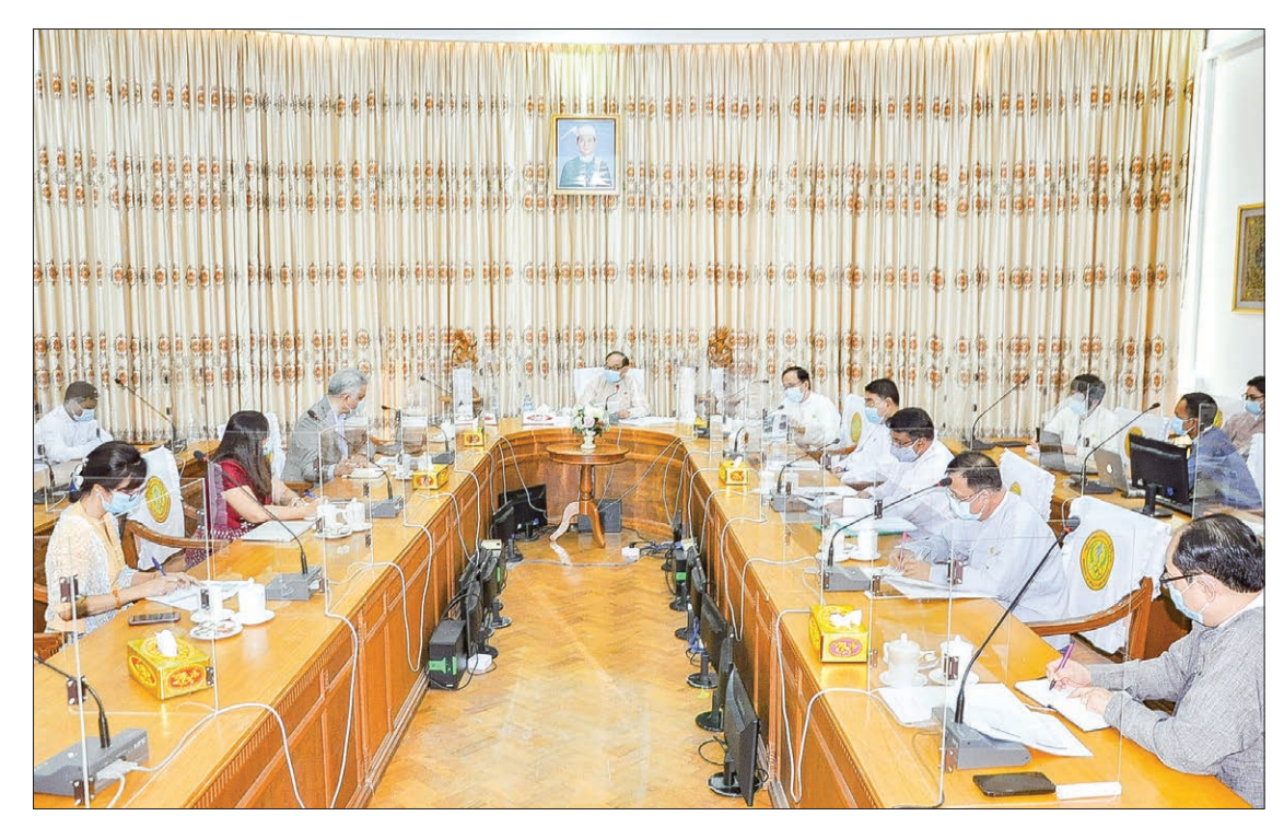
Union Minister for Health and Sports Dr Myint Htwe holds talks with delegates from The Defeat-NCD Partnership at his office in Nay Pyi Taw on 27 July 2020.

Unhealthy lifestyle factors are at the root of the non-communicable disease crisis, so the Ministry is providing health education services, said the Union Minister. He also highlighted that the joint project of the