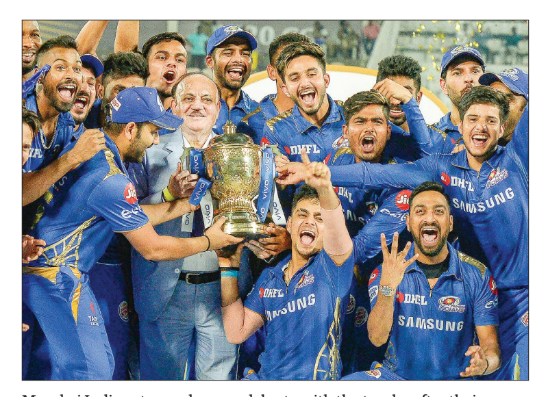
Mumbai Indians team players celebrate with the trophy after their victory against Chennai Super Kings in the 2019 Indian Premier League (IPL) Twenty20 final cricket match at the Rajiv Gandhi International Cricket Stadium in Hyderabad on 13 May 2019.

NEW DELHI (India)— A new one-day international Super League to determine qualification for the 50-over World Cup in 2023 will launch this week, the International Cricket Council announced Monday.