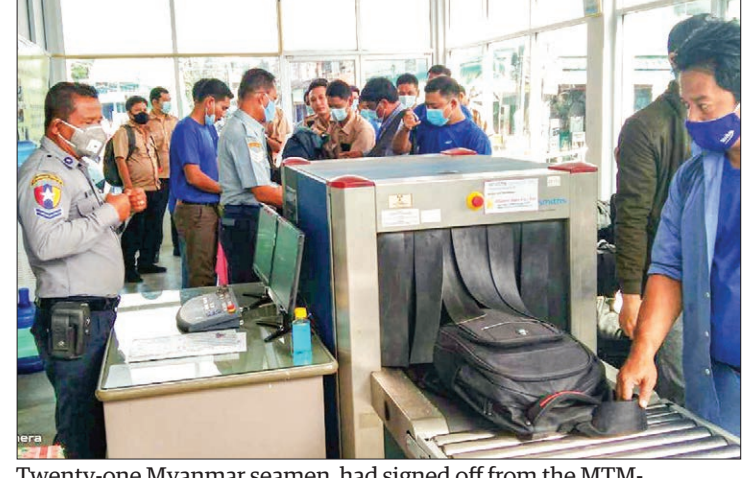
Twenty-one Myanmar seamen had signed off from the MTM-Vancouver ship and arrived in Kawthoung on 26 July 2020.

TWENTY-ONE Myanmar seamen who signed off from the MTM-Vancouver ship anchored in the Andaman Sea arrived in Kawthoung on 26 July evening and are currently held under hotel quarantine.