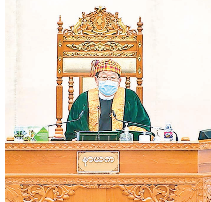
Pyidaungsu Hluttaw Speaker U T Khun Myat (right) speaks during the sixth-day meeting of 17th regular session of Pyidaungsu Hluttaw in Nay Pyi Taw on 27 July 2020.

PYIDAUNGSU Hluttaw continued its 17<sup>th</sup> regular session with 6<sup>th</sup> meeting yesterday.