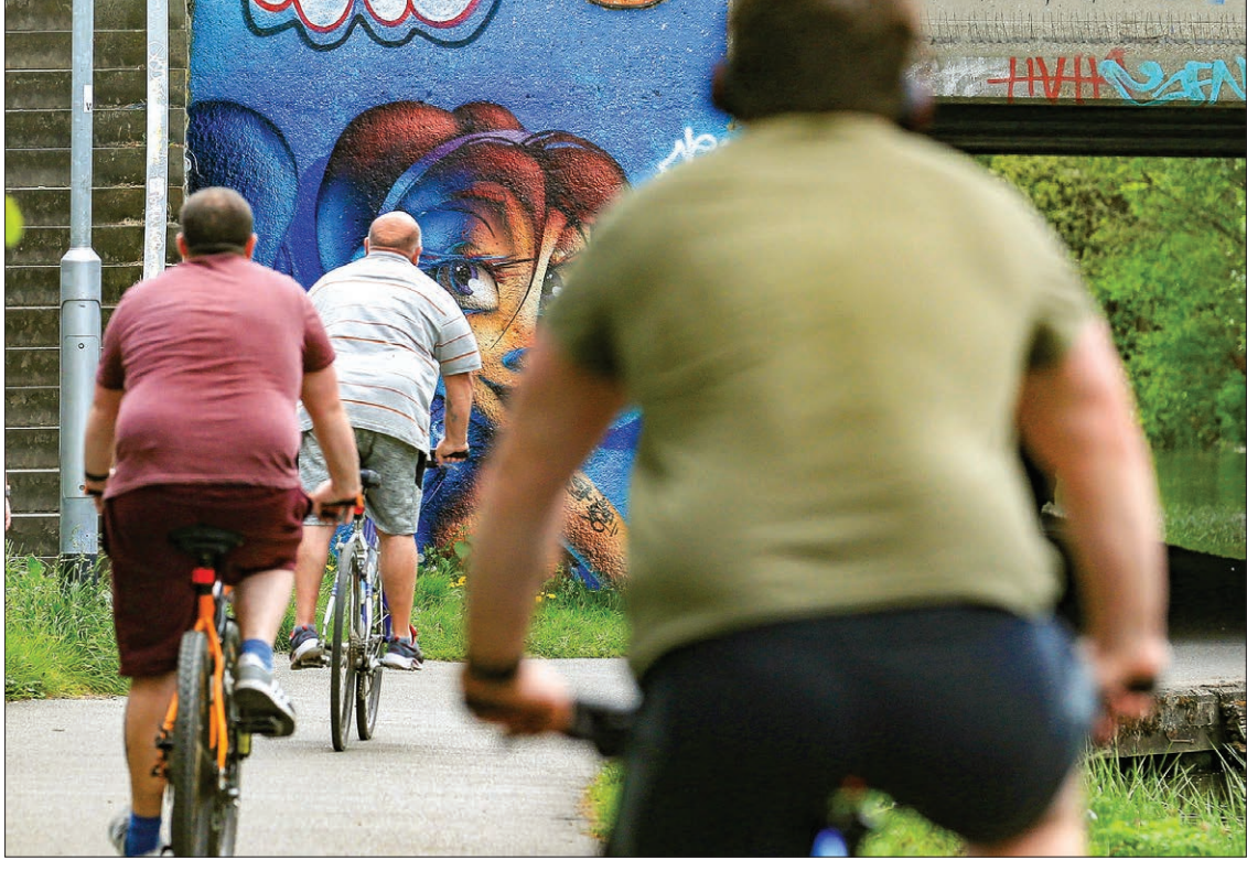
People take their daily exercise along the Leeds to Liverpool canal in Leeds, northern England on 2 May 2020, during the nationwide lockdown to curb the novel coronavirus COVID-19 pandemic.

Two-thirds of UK adults are above a healthy weight, with 36 per cent overweight and 28 per