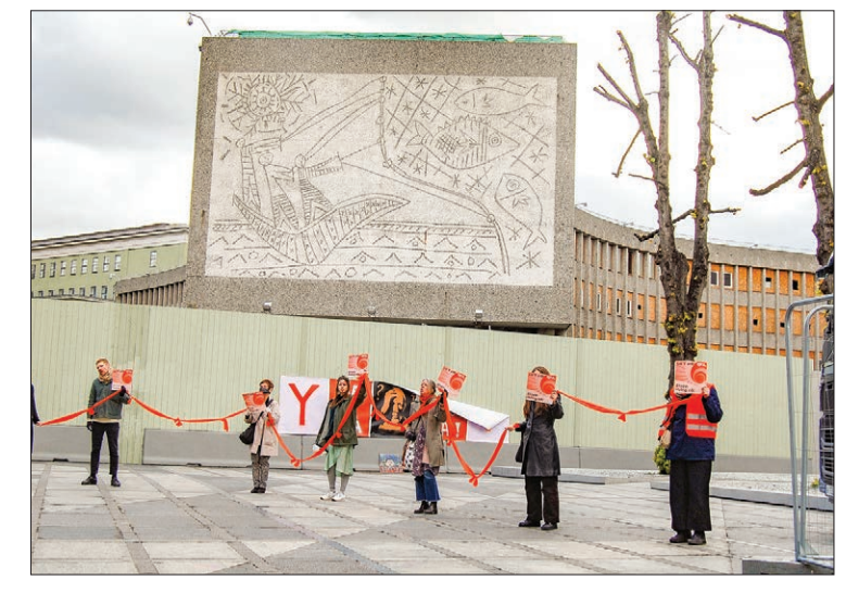
Activists form a human chain during a demonstration in a last-ditch effort to try to save a government-building adorned with Picasso murals on 12 May 2020 in Oslo.

In addition to hoping to preserve an architectural work typical of the 1960s, opponents of the destruction invoke a symbolic argument: that the government buildings should remain standing even though the right-wing extremist tried to tear them down. —AFP ■