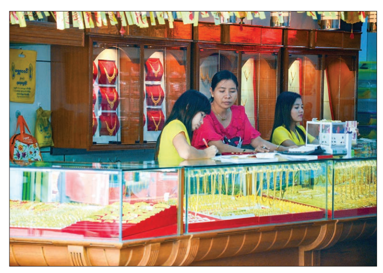
(FILES) Saleswomen wait for customers at a gold jewellery shop in Yangon on 25 February 2015.

On 1 July, a yellow metal was priced around K1,220,000 per tical. It gradually went higher and reached a high of K1,300,000 per tical on 22 July.