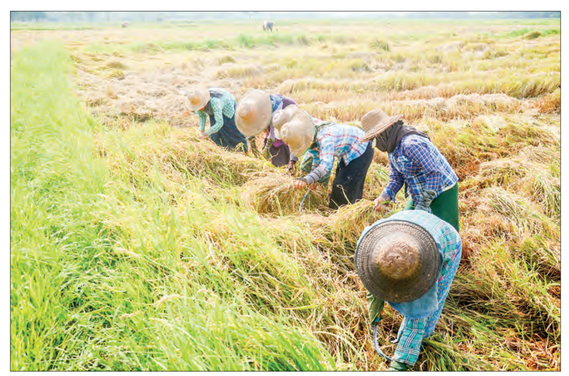
Farmers harvesting rice in their paddies in Kangyidaunk, Ayeyawady Region.

With the growing demand from the foreign countries, the