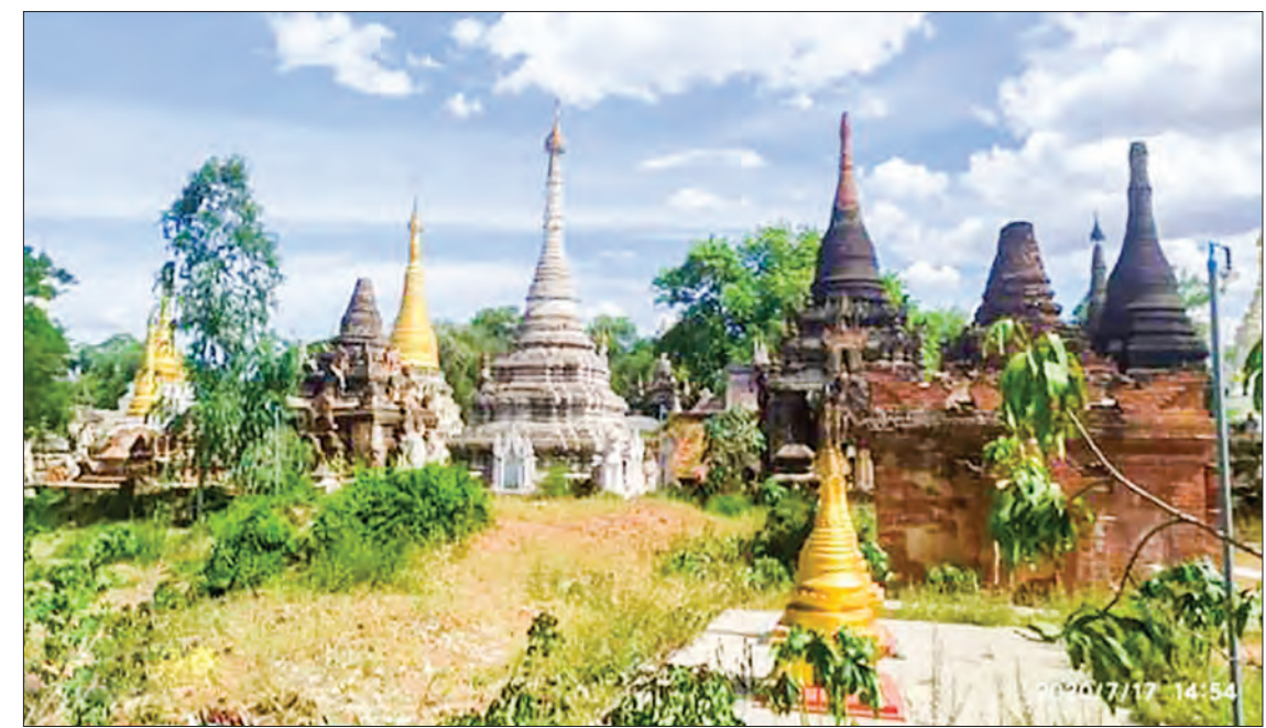
Renovation work is planned for religious edifices bearing late Konbaung-era architecture in Yesagyo Township.

THE Department of Archaeology and National Museum in Magway Region has listed a total of 284 religious edifices in Yesagyo Township of Pakokku district for renovation.