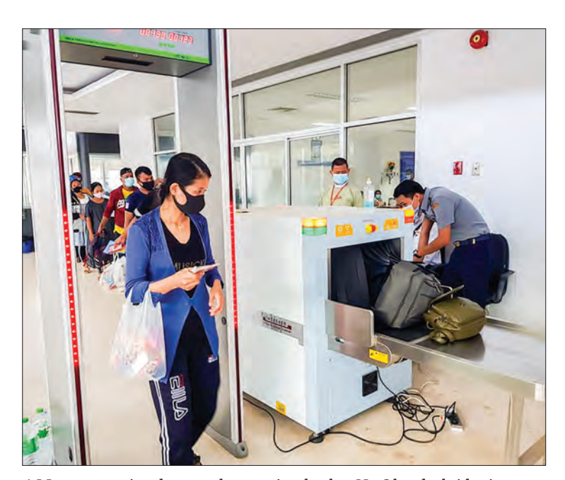
A Myanmar national passes the security check at No. 2 border bridge in Myawady, Kayin State.

A total of 737 Myanmar nationals returned home from Thailand through No. 2 border bridge in Myawady Town, Kayin State, on