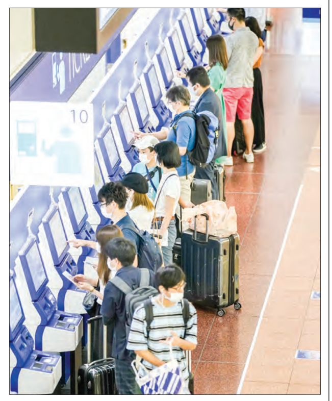
Passengers wearing face masks are pictured at a departure lobby of Tokyo's Haneda airport on July 22, 2020.

TOKYO—Japan's travel subsidy campaign kicked off Wednesday to help revive a domestic tourism industry stricken by the novel coronavirus, but with Tokyo excluded amid concerns about a resurgence in infections in urban areas. The "Go To Travel" campaign, under which the government covers part of the cost of tourist trips, was launched despite worries the initiative could worsen the virus outbreak. Osaka Prefecture reported 121 new infections, a record daily increase, while Tokyo confirmed 238 cases with its cumulative total eclipsing 10,000. Tokyo Governor Yuriko Koike urged residents to "take thorough anti-infection measures and avoid going outside as much as possible," while warning against a "second wave" of infections ahead of the four-day weekend