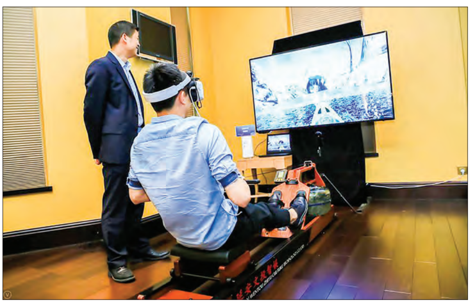
A man experiences a 5G Cloud VR rowing machine developed by Huawei in Shenzhen, south China's Guangdong Province, April 16, 2019.

In the first half of the year, the province completed the construction of 41,401 stations with the number of 5G users exceeding 14.34 million, said Dong Jin with the Department of Industry and Information Technology of Guangdong Province. The province will continue to beef up the construction of 5G infrastructure, and more efforts will be made to improve indoor 5G net-