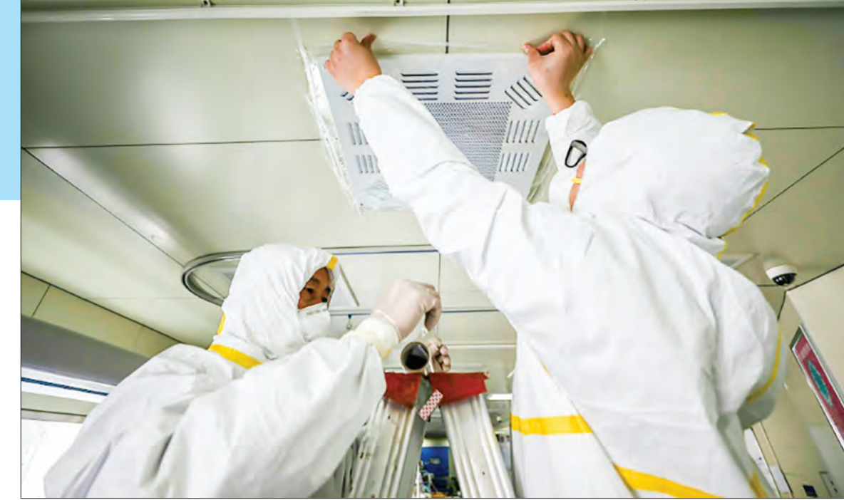
Hospital employees in Wuhan, to prevent possible airborne transmission of the new coronavirus.