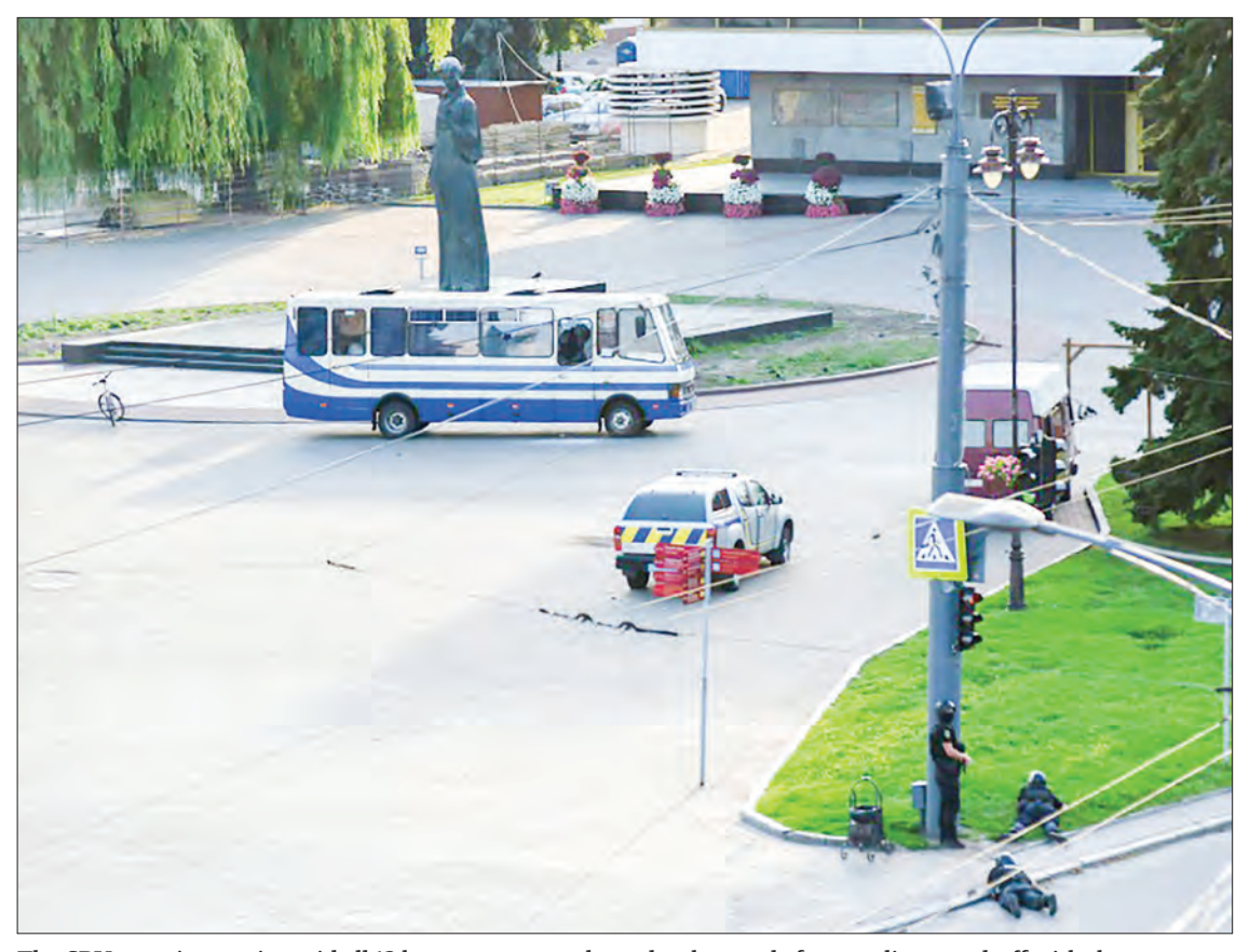
The SBU security service said all 13 hostages were released unharmed after a police stand-off with the man.

The tense hostage situation ended after the president agreed to post a recommendation of a 2005 US documentary narrated by actor Joaquin Phoenix called "Earthlings," which condemns humans' mistreatment of animals. Zelen-