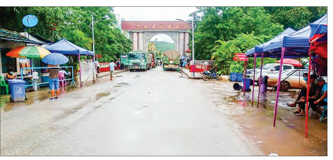
Myanmar nationals are also returning through the Myanmar-China border in Chinshwehaw.