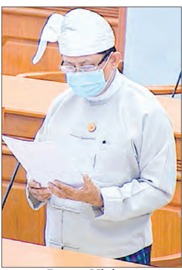
Deputy Minister U Maung Maung Win

The matter was further discussed by Union Minister for Transport and Communications U Thant Sin Maung, Union Minister for Construction U Han Zaw, Deputy Minister for Agriculture, Livestock and Irrigation U Hla Kyaw, Deputy Minister for Education U Win Maw Tun, Deputy Minister for Health and Sports Dr Mya Lay