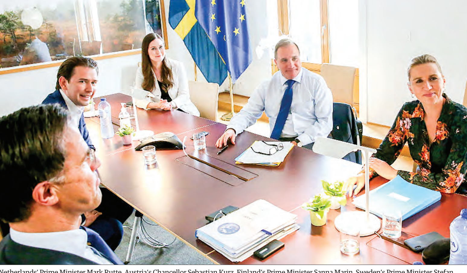
Netherlands' Prime Minister Mark Rutte, Austria's Chancellor Sebastian Kurz, Finland's Prime Minister Sanna Marin, Sweden's Prime Minister Stefan Lofven and Denmark's Prime Minister Mette Frederiksen during a bilateral meeting at the EU summit on a coronavirus recovery package at the European Council building in Brussels on July 19, 2020.

"At base what we are building is a common solidarity, and