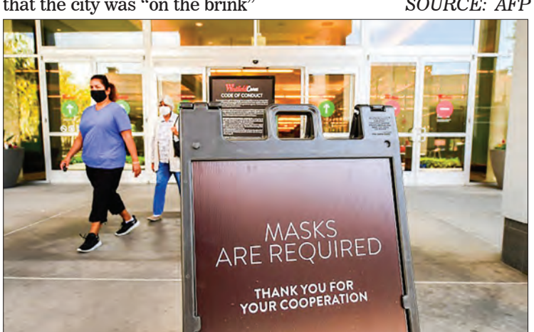
Women wearing facemasks exit the Westfield Santa Anita shopping mall where a sign is posted at an entrance reminding people of the mask requirement on June 12, 2020.