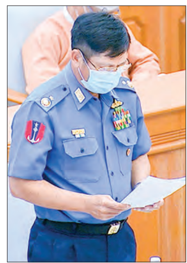
Deputy Minister for Defence Rear Admiral Myint Nwe

Deputy Minister U Maung Maung Win explained the proposal to acquire JPY15 billion from Japan International Cooperation Agency (JICA) to implement phase 3 of the Micro, Small and Medium Enterprises (MSMEs) development project. He explained that MoPFI will act