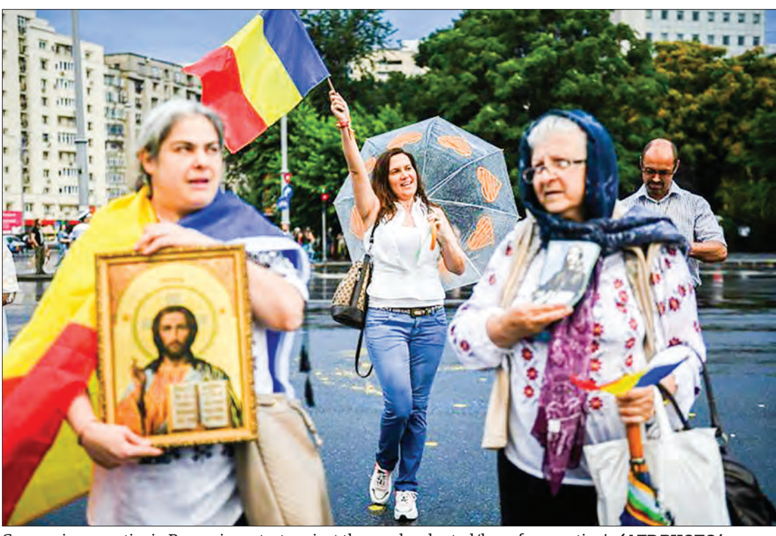
Coronavirus sceptics in Romania protest against the newly adopted 'law of quarantine'.

Romania, with a population of almost 20 million, has to date reported more than 38,000 coro-