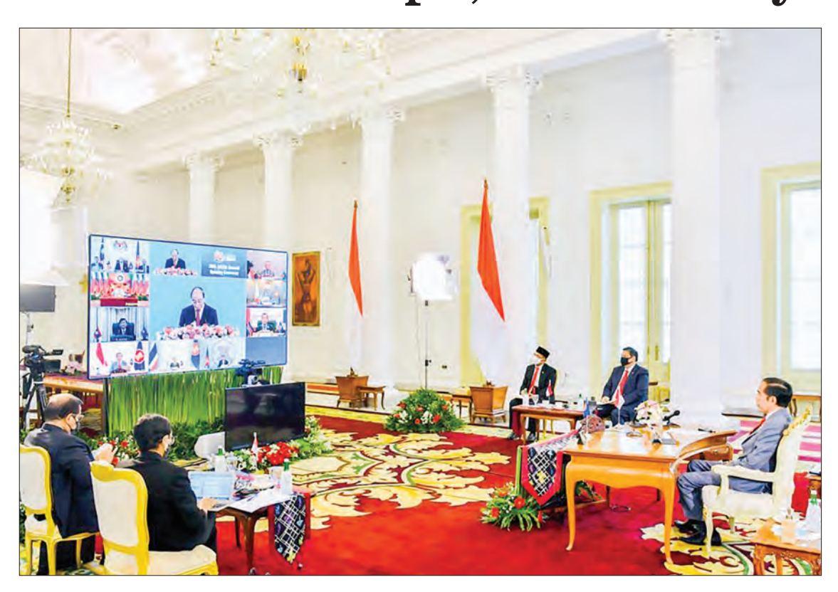
Leaders of the 10-member Association of Southeast Asian Nations "attend" their annual summit held virtually at Indonesia's Merdeka (Freedom) Presidential Palacedue to the novel coronavirus pandemic.

HANOI—The Association of Southeast Asian Nations is considering to hold the ASEAN Regional Forum in September, bringing its foreign ministers together with their counterparts from countries such as Japan, the United States, China, the two Koreas, Russia and India, diplomatic sources revealed on Tuesday.