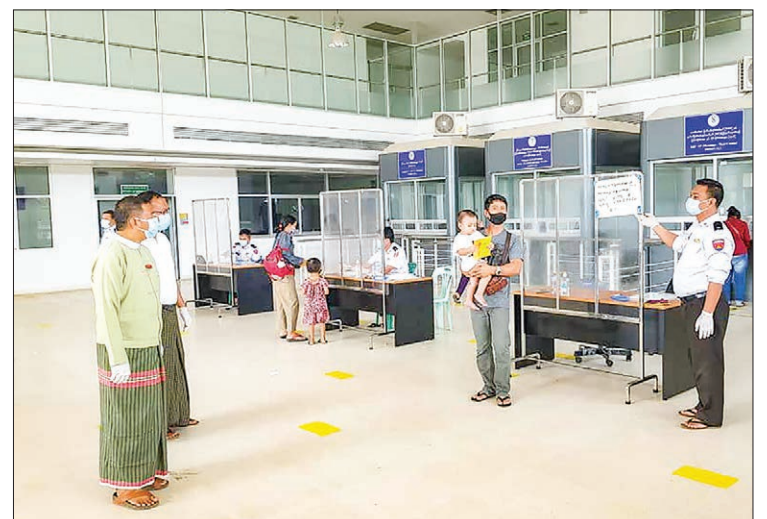
Myanmar returnees are seen at immigration counters of Myawady bridge 2 on 20 July 2020.