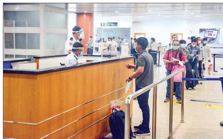
Myanmar nationals returned from Singapore queue for immigration process at the Yangon International Airport on 20 July 2020.