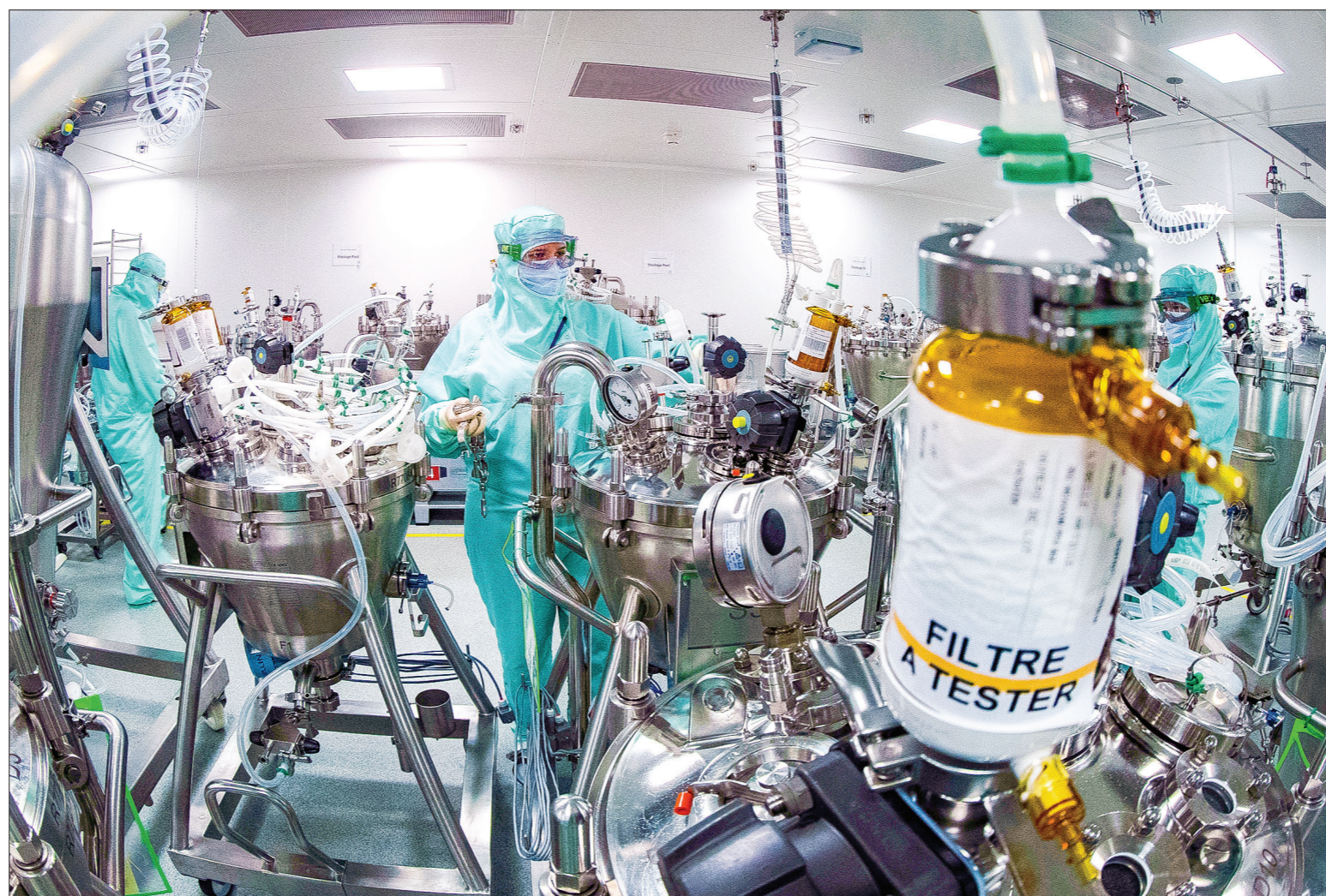
Lab technicians dedicated to the vaccines formulation, wearing Personal Protective Equipment (PPE), prepare stainless steel tanks for manufacturing vaccines preparations before the syringe filling phase, at a French pharmaceutical company Sanofi’s world distribution centre in Val-de-Reuil on 10 July 2020.

Beyond the tests already underway the WHO is monitoring