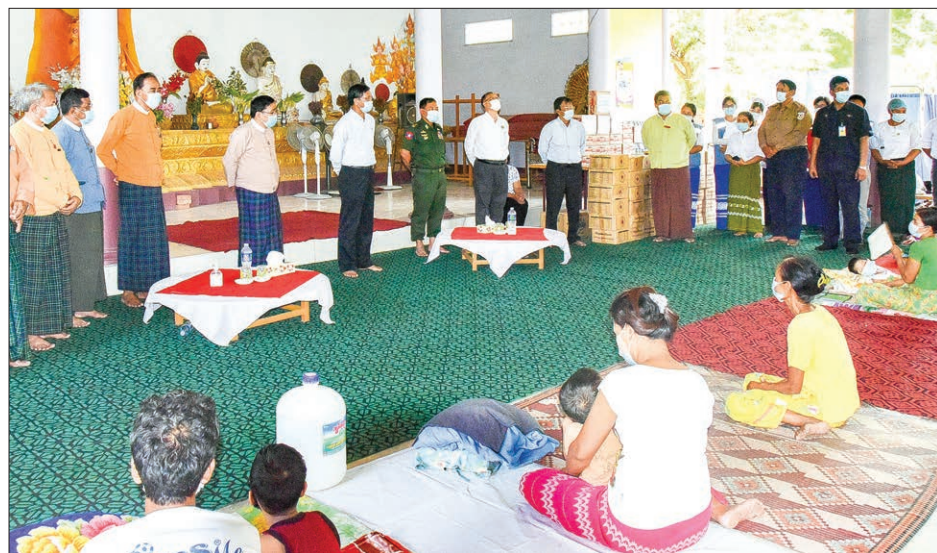
Vice President U Henry Van Thio and government officials comfort flood victims in Amarapura Township on 20 July.