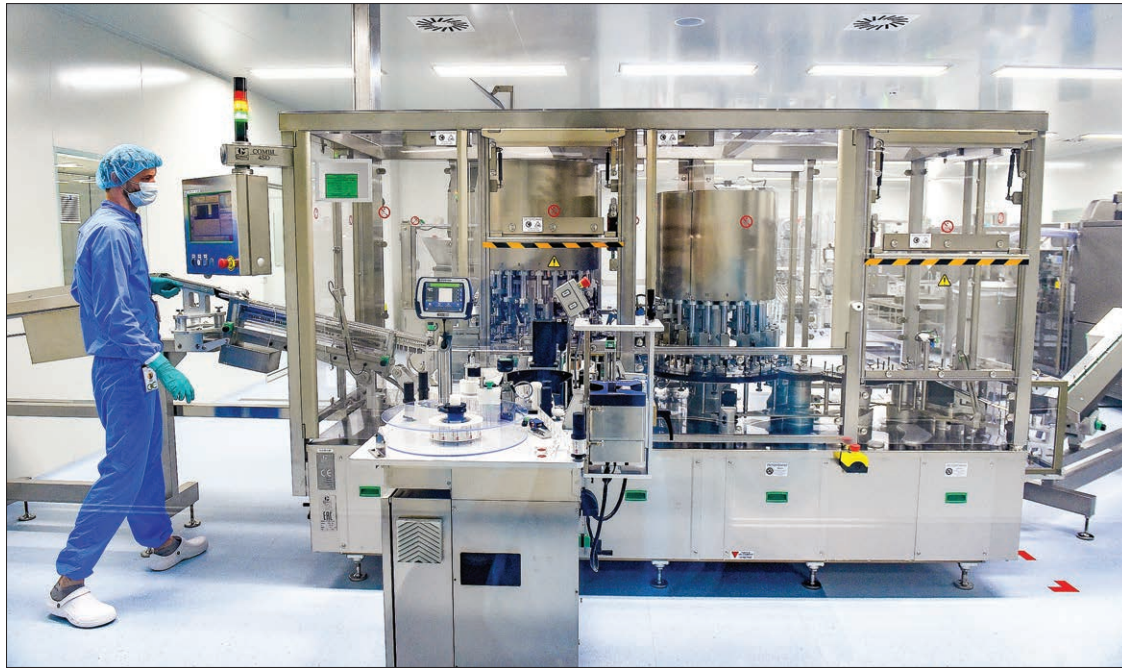
An employee wearing protective equipment works at the production line of Russia's biotech company BIOCAD, which is developing its own vaccine against the new coronavirus and working on another one in cooperation with the country's virus research centre in Siberia, Vektor, in Strelina on 20 May 2020.