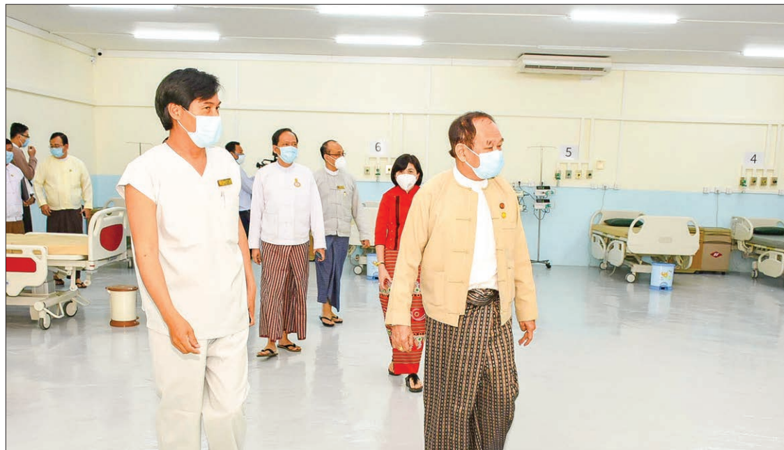
Union Minister Dr Myint Htwe visits the COVID-19 treatment centre (Phaunggyi) in Hlegu Township, Yangon Region on 20 July 2020.

tient at intensive care units until now, and the high skills of medical workers can also be realized, however, the country needs to monitor adhering to rules and disciplines at the border crossings and quarantined centres in prevention of second wave of this pandemic.