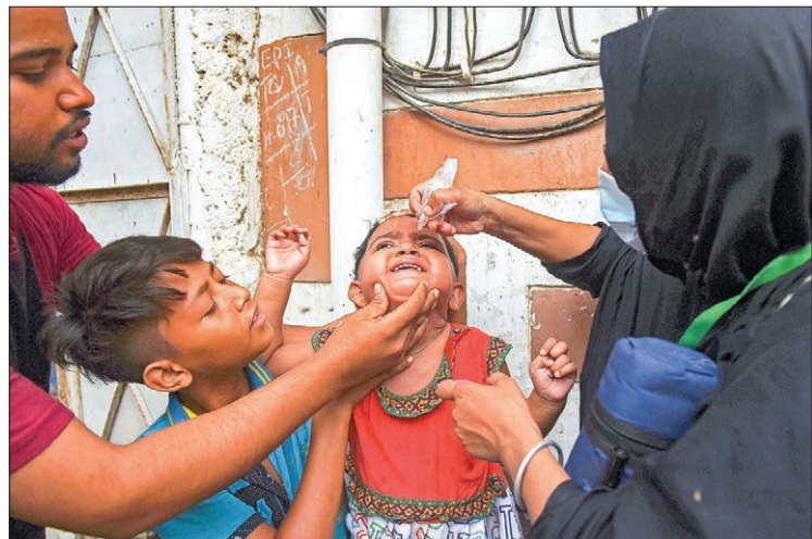
A health worker administers polio vaccine drops to a child during a polio vaccination door-to-door campaign in the Pakistan’s port city of Karachi on 20 July 2020.

“It is a matter of our son’s future, and today we are finally feeling relieved after four months of fear and impatience,” he said.—AFP ■