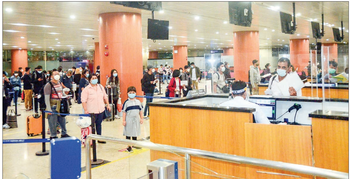
Myanmar nationals returned from Australia and Indonesia queue for immigration process at the Yangon International Airport on 20 July 2020.

Similarly, after cooperation between Myanmar authorities, the Myanmar Seafarers Em-