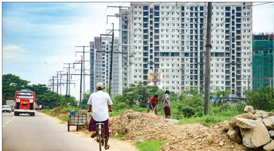
Myanmar citizens' investments in the country has surpassed K1,400 billion in the first ten months of current financial year.