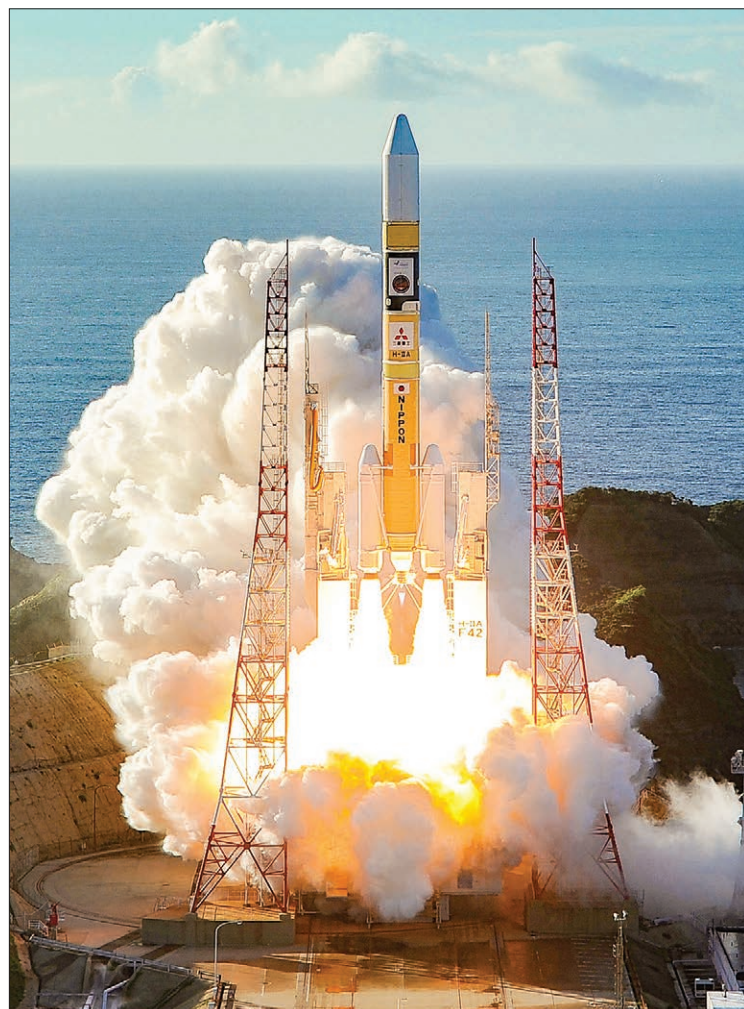
In this handout photograph taken and released on July 20, 2020 by Mitsubishi Heavy Industries, an H-2A rocket carrying the Hope Probe known as “Al-Amal” in Arabic, developed by the Mohammed Bin Rashid Space Centre (MBRSC) in the United Arab Emirates (UAE) to explore Mars, blasts off from Tanegashima Space Centre in southwestern Japan.

The drive to explore Mars flagged until the confirmation