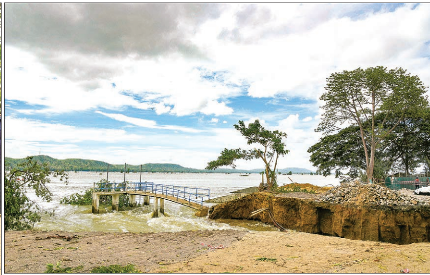
Vice President U Henry Van Thio and party inspect the damaged embankments near Amarapura Township on 20 July.