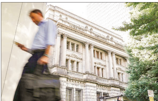
A man walks past the Bank of Japan's head office in Tokyo on 2 July 2018.

Last year, the G-7 nations involving Britain, Canada, France, Germany, Italy, Japan and the United States plus the European Union, called for ensuring “the highest standards of financial regulation” over Facebook Inc.'s proposed digital currency Libra to prevent potential money laundering, terrorist financing and other unlawful activity.—Kyodo News ■