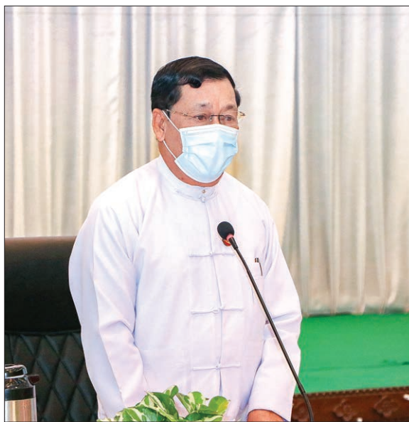
Union Minister U Thein Swe delivers speech at coordination meeting on making the voters list in Yangon Region.

He stressed that Myanmar nationals staying in foreign nations must not lose their rights to vote, so the ministry is collab-