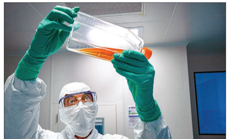
A lab technician in Personal Protective Equipment (PPE) looks at a reagent bottle before performing vaccine tests at a French pharmaceutical company Sanofi's laboratory in Val de Reuil on 10 July 2020.

"If our vaccine is effective, it is a promising option as these types of vaccine can be manufactured at large scale."—AFP ■