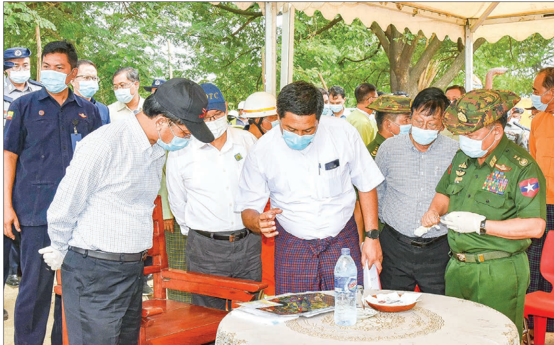
Vice President U Henry Van Thio views the photo of damaged areas of embankments near Amarapura Township on 20 July.

Thio gave necessary instructions on providing assistance for renovation works.