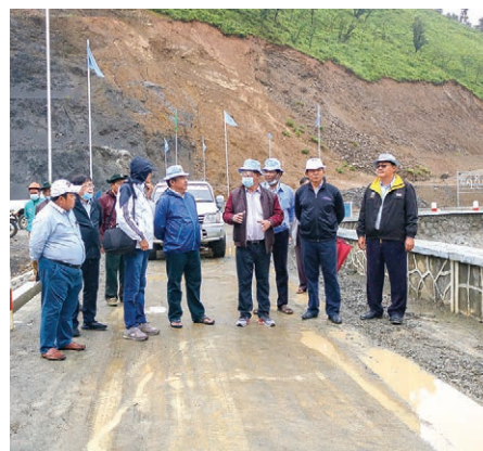
Chin State Minister for Agriculture, Livestock Breeding, Forestry and Mines U Mang Hen and party inspect the construction works at Lower Laivar Dam in Chin State on 19 July 2020.

is the Upper Laivar Dam, the second one is Thiki Dam and the third one is the Lower Laivar Dam. The main objective of the Lower Laivar Dam is to store