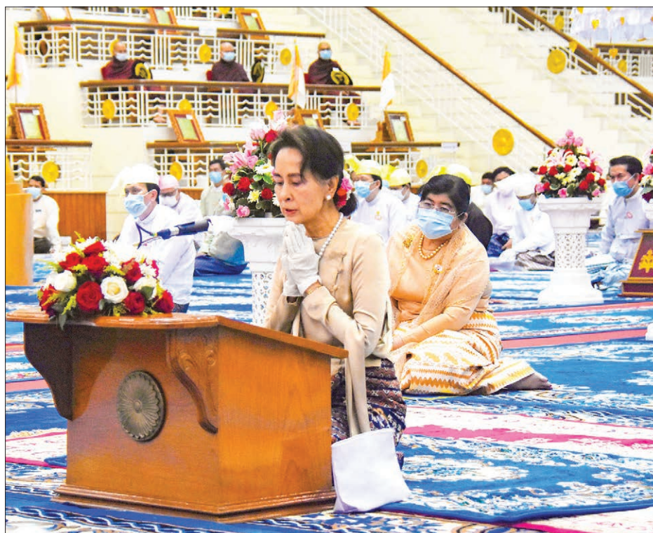
The State Counsellor presents her supplication with respect to religious matters on 20 July.

The treatises of Pitaka were recorded on palm-leaves at the 4 th Buddhist Council during the reign of King Wattagamani in Sri Lanka in Sasana Era 450 (BC 93), on the stone inscription at the Fifth Buddhist