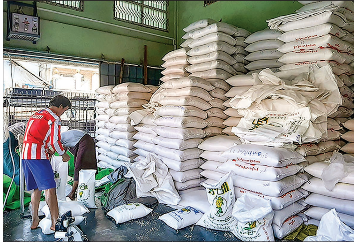
Workers bagging rice at a warehouse in Ayeyawady Region on 3 February 2020.

Moreover, there is a separate plan to sell the rice at the labour-intensive factories for the workers. MRF stated that the respective Consumer Affairs Department of the regions and states will monitor the sales to ensure systematic management.