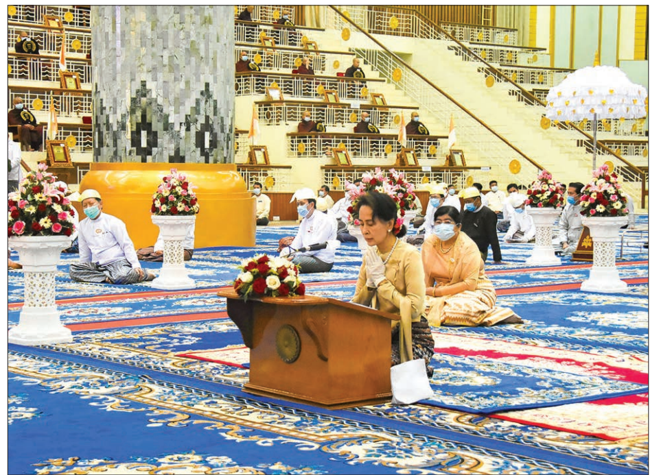
Congratulatory ceremony for title-winners of the 72 nd Tipitakadhara Tipitaka Kovida Selection Exam is held at the Mahapasana Cave of Thiri Mingala Kaba Aye Hill in Yangon on 20 July.

SENIOR Buddhist monks who won the highly advanced levels of religious exams received certificates and titles in Yangon yesterday.