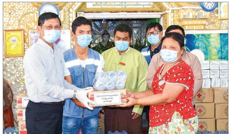
Vice President U Henry Van Thio gives relief aid to a flood victim in Amarapura on 20 July.