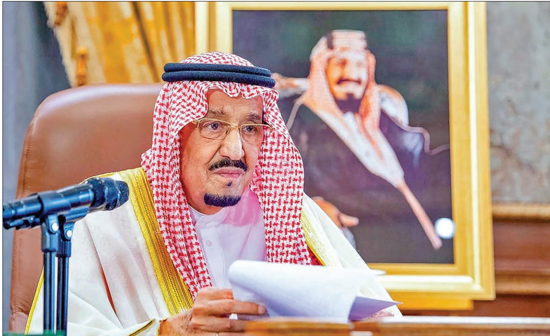
This file handout photo provided by the Saudi Royal Palace on 19 March 2020 shows King Salman bin Abdulaziz addressing the nation in a televised speech regarding the COVID-19 pandemic, in the capital Riyadh.

The statement released by the official Saudi Press Agency around 4:30 am (0130 GMT) did