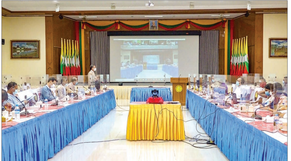
Union Minister Dr Myo Thein Gyi (left top) speaks during the meeting for reopening schemes of high schools.