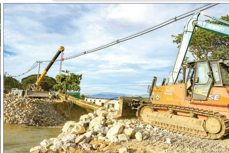
Vice President U Henry Van Thio inspects renovation of breakwater near Amarapura on 20 July.