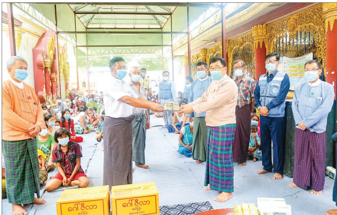
Union Minister Dr Win Myat Aye presents cash assistance for flood victims to a local representative in Amarapura Township, Mandalay Region on 20 July 2020.

The Deputy Minister U Soe Aung, the Security and Border Af-