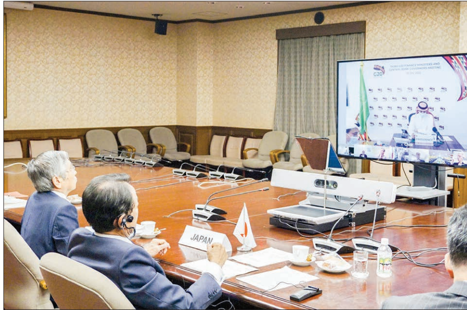
Supplied photo taken in Tokyo on July 18, 2020, shows Japanese Finance Minister Taro Aso and Bank of Japan Governor Haruhiko Kuroda attend a videoconference of finance chiefs from the Group of 20 major economies.

TOKYO — Finance chiefs from the Group of 20 major economies said Sunday that the global economy is expected to “contract sharply” this year due to the new coronavirus pandemic and pledged to do whatever they can to minimize downside risks.