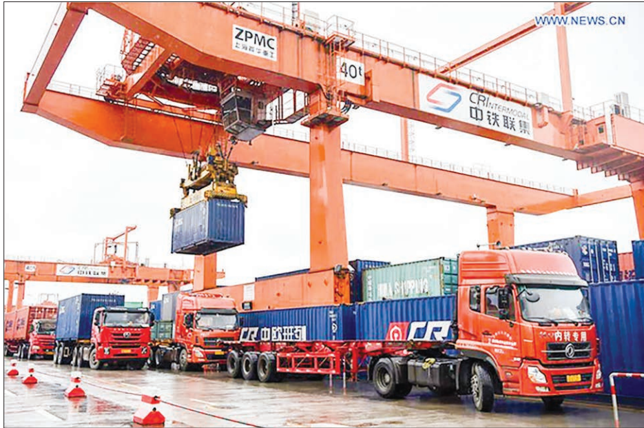
The subindex for cargo transport jumped 5 percent year on year to 185.2 points last month, with the growth faster when compared with the 0.8-percent rise in May and keeping almost the same level as that of last year.

BEIJING — China's cargo transport industry reported faster growth in June with business activities recovering to nor-