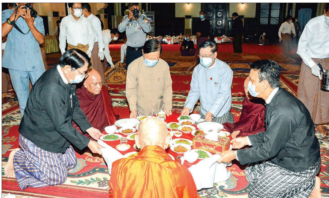
Union Ministers and Yangon Region Chief Minister offer 'soon' to the Members of Sangha at the City Hall of Yangon on 19 July 2020.

ALMS food were donated to senior Buddhist monks as a commemoration service to the martyrs of national independence at the meeting room of the city hall of Yangon City Development