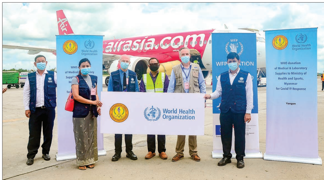
WHO's medical experts and Myanmar's officials pose for a group photo at the Yangon International Airport on 19 July 2020.

“Today we are here at the Yangon International Airport and we receive the 11 th WFP special flight bringing humanitarian car-