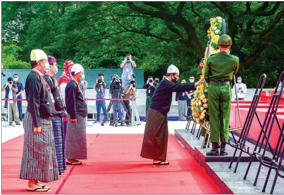
President U Win Myint pays tribute to Bogyoke Aung San and martyrs at the Martyrs' Mausoleum in Yangon yesterday.