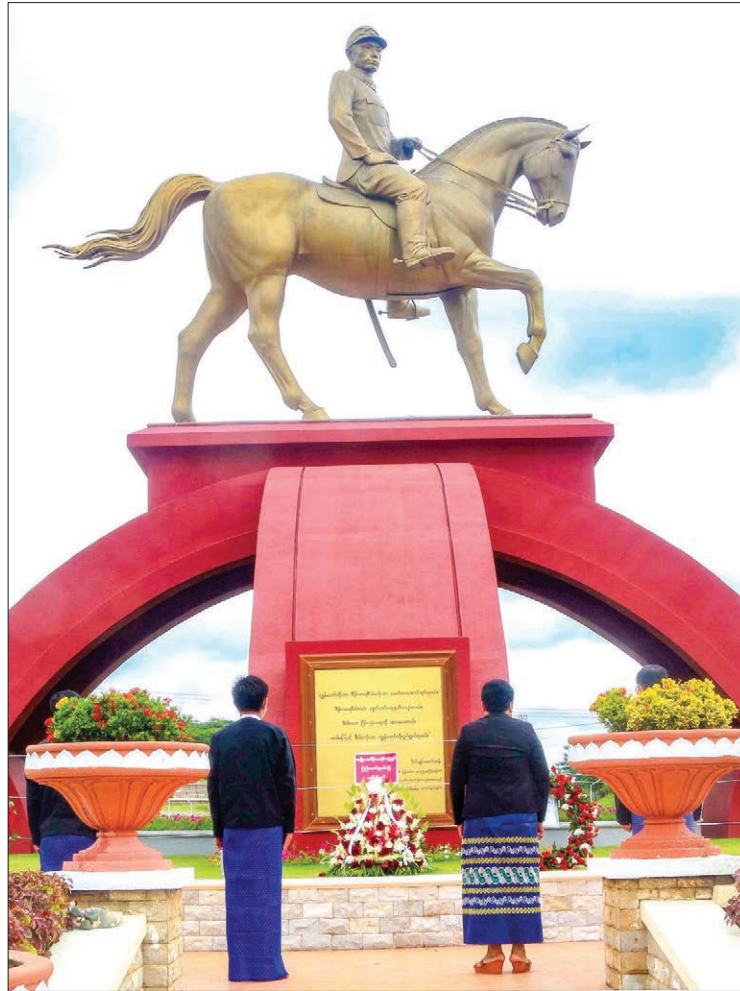
The 73 rd Anniversary of Martyrs' Day is commemorated at the Bogyoke Aung San Bronze Statue in Nay Pyi Taw on 19 July 2020.