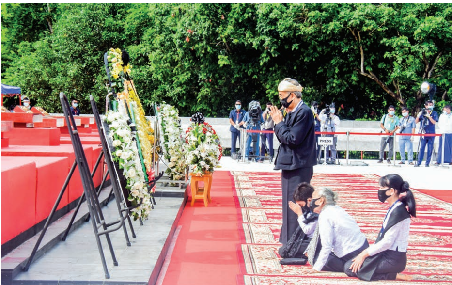
Family members of Mongpon Sawbwa Sao San Tun pay tribute to Mongpon Sawbwa Sao San Tun and martyrs at the Martyrs' Mausoleum in Yangon on 19 July 2020.