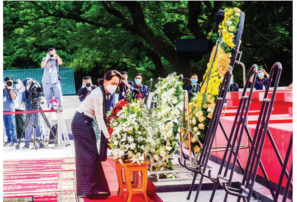
State Counsellor Daw Aung San Suu Kyi, daughter of Bogyoke Aung San, lays the wreaths paying tribute to Bogyoke Aung San and martyrs at the Martyrs' Mausoleum in Yangon on 19 July 2020.