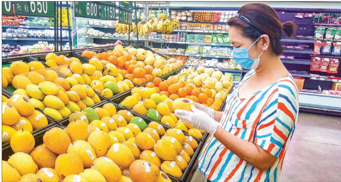
A woman chooses mangoes at a supermarket in Yangon on 16 May 2020.

China has been stepping up border control measures to contain the spread of the coronavirus pandemic. Therefore, Chinese buyers do not come to Myanmar land borders in light of the pandemic fears, forcing Myanmar truck drivers to have left for Wanding area to sell the