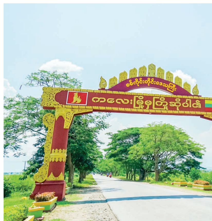
Archway at entrance to Kalay.