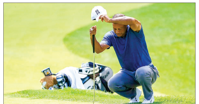
Tiger Woods wipes his forehead on the fourth green during the second round of The Memorial Tournament at Muirfield Village Golf Club in Dublin, Ohio.

Woods, level with Sam Snead on a record 82 US PGA titles, said the back that bothered him in shooting 76 on Friday was "a lot better" Saturday.—AFP ■