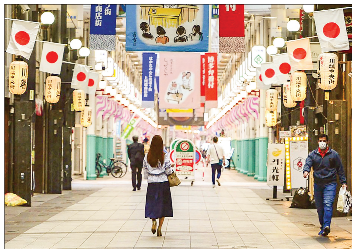
A shopping street in Fukuoka, southwestern Japan, is deserted as most stores are closed on May 4, 2020.

During the Fuji TV program, he said a program to compensate businesses that comply with closure requests based on the law