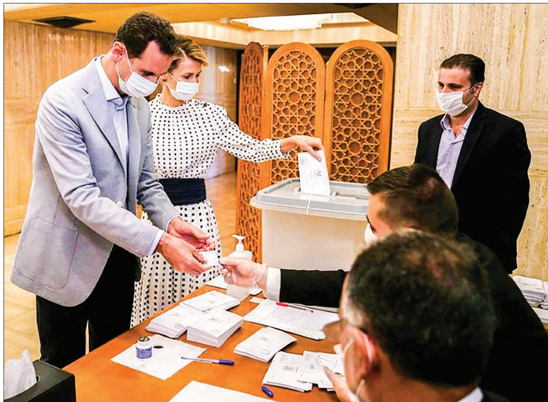
The election is taking place as President Bashar al-Assad, seen here casting his vote alongside his wife Asma, marks a second decade in power this month.

polling stations holding flyers promoting their favourite candidates, and tried to woo passers-