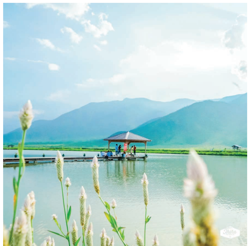
King Solomon Pond.