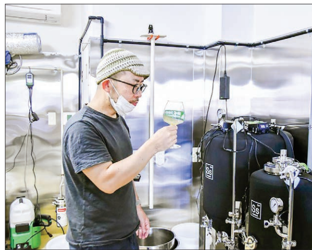
Beer is usually made with malt, but Oryzae Brewing & ferment works has replaced it with koji.

ing from university, then at a miso warehouse in Kumamoto Prefecture and a sake brewery in Fukuoka Prefecture, both in southwestern Japan. —Kyodo ■