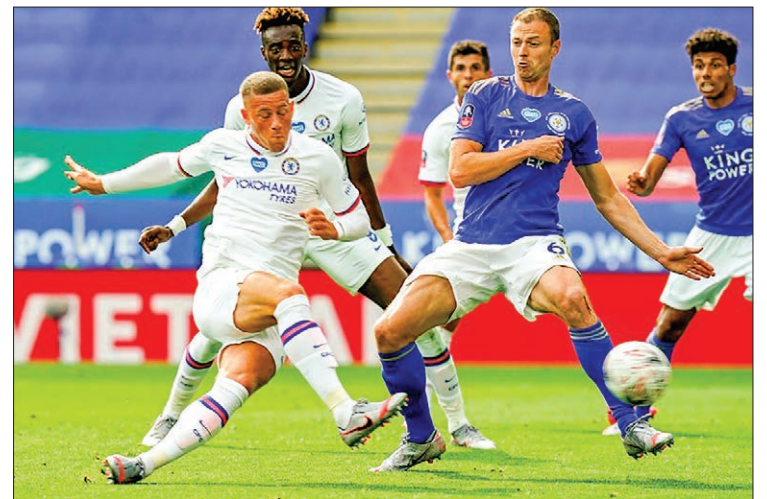
Chelsea and Leicester hope to hold onto their top four places.

The teams who finish fifth and sixth will qualify for next season's Europa League, unless