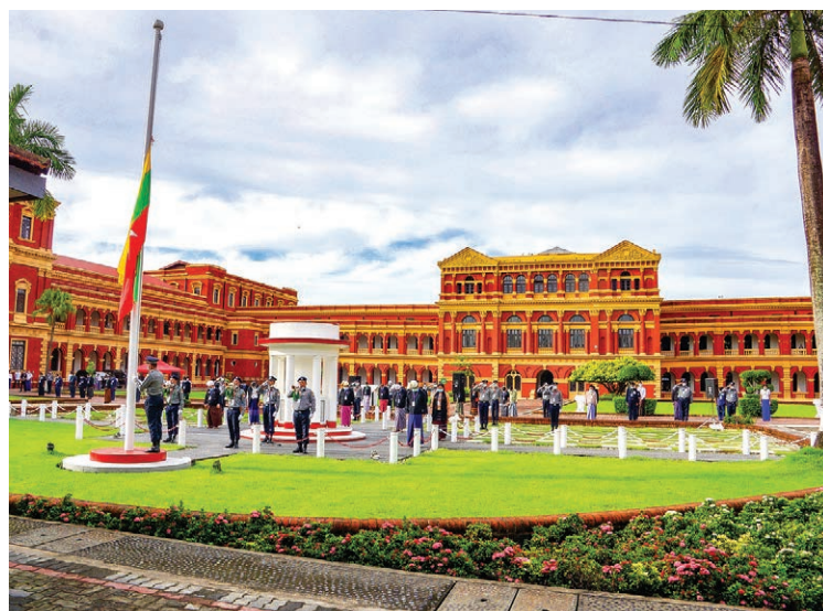
A flag-raising ceremony to mark 73 rd Martyrs' Day is in progress at the Secretariat in Yangon on 19 July 2020.