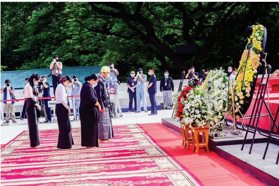
Family members of Thakhin Mya pay tribute to Thakhin Mya and martyrs at the Martyrs' Mausoleum in Yangon on 19 July 2020.