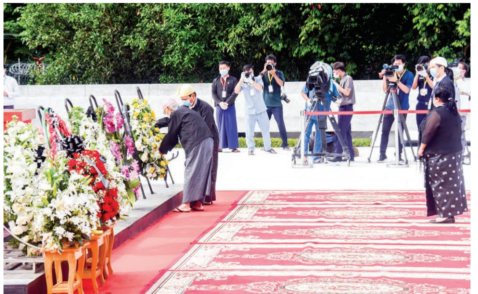
Family members of U Razak lay the wreaths paying tribute to U Razak and martyrs at the Martyrs' Mausoleum in Yangon on 19 July 2020.