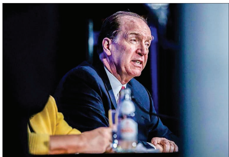
World Bank President David Malpass is calling on rich countries to hold off on debt repayments from poor countries. /FILE

WASHINGTON — World Bank Group President David Malpass on Saturday urged the Group of 20 (G20) countries to extend the time frame of the Debt Service Suspension Initiative through the end of 2021, calling it one of the key factors in strengthening global recovery.