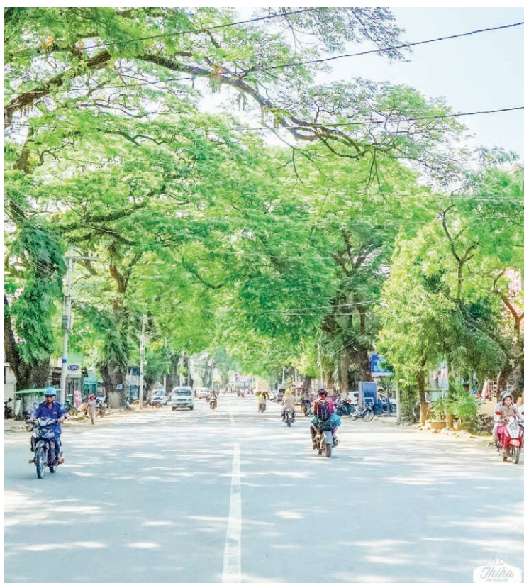
Rain trees on both sides of road, planted in British era, become significant beauties in Kalay.