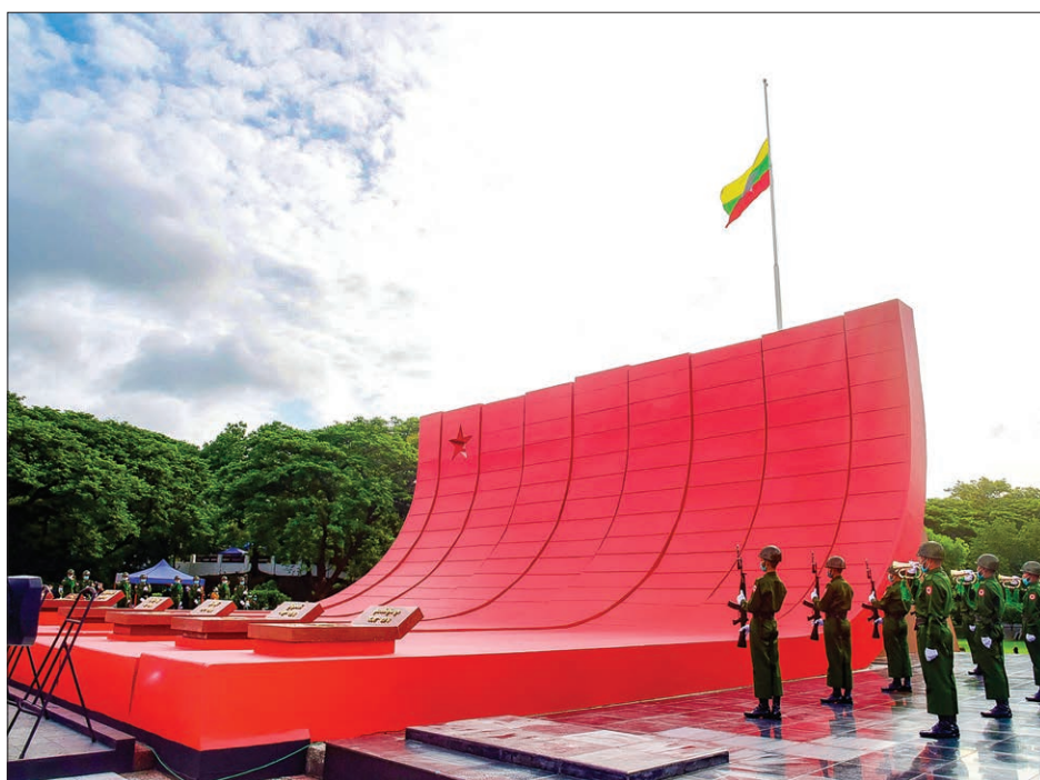
President U Win Myint and party pay tribute to Bogyoke Aung San and martyrs at the Martyrs' Mausoleum in Yangon on 19 July 2020.