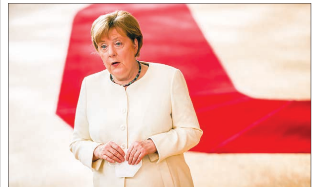
Germany’s Chancellor Angela Merkel said the 27 leaders had ‘many positions’ on the size of the fund, on rules for accessing it and on tying it to respect for the rule of law.

Michel had proposed a 750-billion-euro package of EU loans and grants to help member states recover from an historic coronavirus recession, but Austria sees the package as too big and the Netherlands wants member states to be able to veto national spending plans. The rest of the 27 EU leaders were due to meet again in the full summit format from noon (1000 GMT) and talks could yet go late into the night.—AFP ■