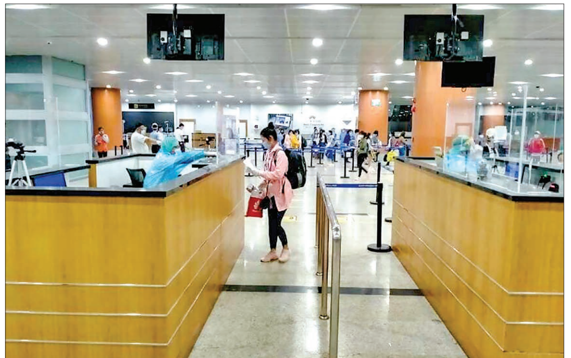
A Myanmar woman returned from Jordan is seen at the Yangon International Airport on 19 July 2020.