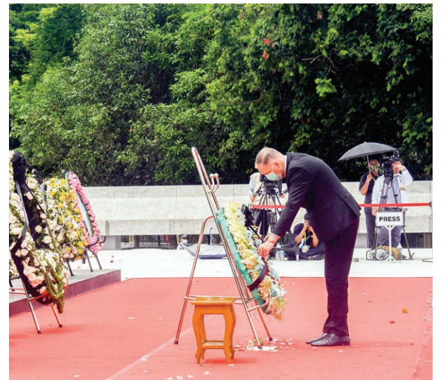
Diplomats lay the wreaths paying tribute to fallen leaders at the Martyrs' Mausoleum in Yangon on 19 July 2020.