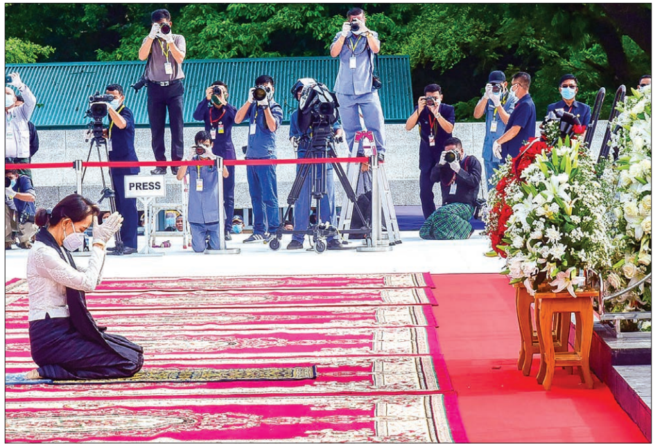
State Counsellor Daw Aung San Suu Kyi, daughter of Bogyoke Aung San, pays tribute to Bogyoke Aung San and martyrs at the Martyrs' Mausoleum yesterday.

AT the 73 rd Martyrs' Day ceremony held yesterday at the Martyrs' Mausoleum in Yangon, President U Win Myint and State Counsellor Daw Aung San Suu Kyi laid the wreaths at the monument of Bogyoke Aung San.