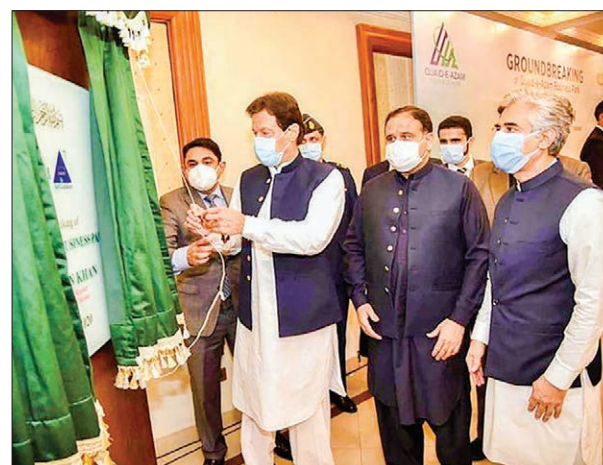
Pakistan Prime Minister Imran Khan accompanied by Punjab Chief Minister Usman Buzdar performed the ground-breaking ceremony of Quaid-e-Azam Business Park on July 18.

and prospects for the Chinese companies,” said the prime minister, vowing to make Pakistan a business-friendly country with maximum ease of doing business.—Xinhua ■