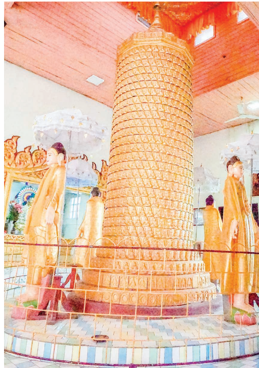
First Yayhsankyun Pagoda.

Climatic conditions are severe as the town is located in the large pit. Even in monsoon, temperature is high. But, December and January are very cold for all.