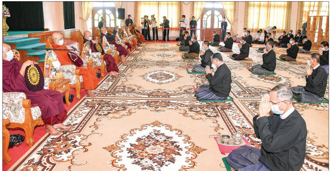
Senior government officers pay homage to the Members of Sangha at the 'soon' offering ceremony in Nay Pyi Taw on 19 July 2020 to commemorate 73 rd Anniversary of Martyrs' Day.

Alms food for day-meal were offered to Buddhist monks as a commemoration service to the martyrs of national independence at the Zabuthiri Hall of Nay Pyi Taw Council Office at 10 am yesterday.