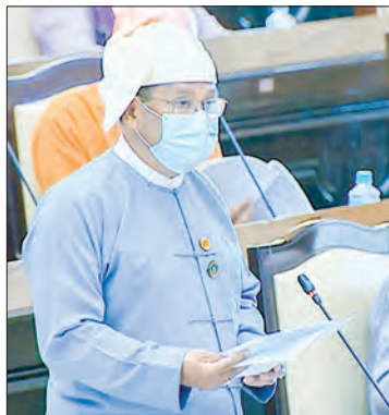
Deputy Minister for Social Welfare, Relief and Resettlement U Soe Aung.

Deputy Minister for Social Welfare, Relief and Resettlement U Soe Aung replied that the Disaster Management Department has provided bars of soap, surgical masks and cloth masks, thermal sensors, hand gel, hand speakers, memory sticks, wash basins, limestone powder and vinyls with