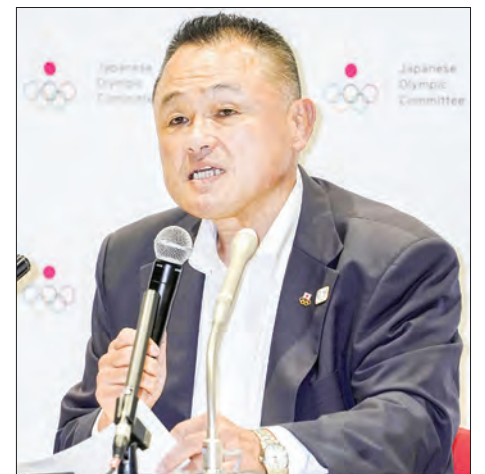
Japanese Olympic Committee President Yasuhiro Yamashita speaks at a press conference in Tokyo on July 14, 2020.

Yamashita took the reins as JOC chairman in June last year following the resignation of predecessor Tsunekazu Takeda, who is under investigation by French prosecutors for alleged bribery related to Tokyo's successful bid for the 2020 Games.—Kyodo ■