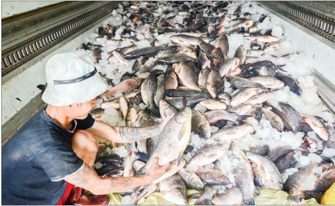
Myanmar Investment Commission issues permits to 208 foreign enterprises in this financial year.

By Nyein Nyein MYANMAR is expected to meet its foreign direct investment