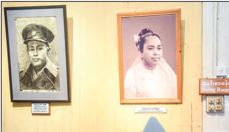
Document photos in dining room of Bogyoke Aung San

cated statue of General Aung San can be seen. Before Myanmar gained Independence, on his way to London to sign Aung San - Attlee Agreement, General Aung San also visited India to discuss politics with Indian Leader Jawaharlal Nehru, and on 5-1-1947,