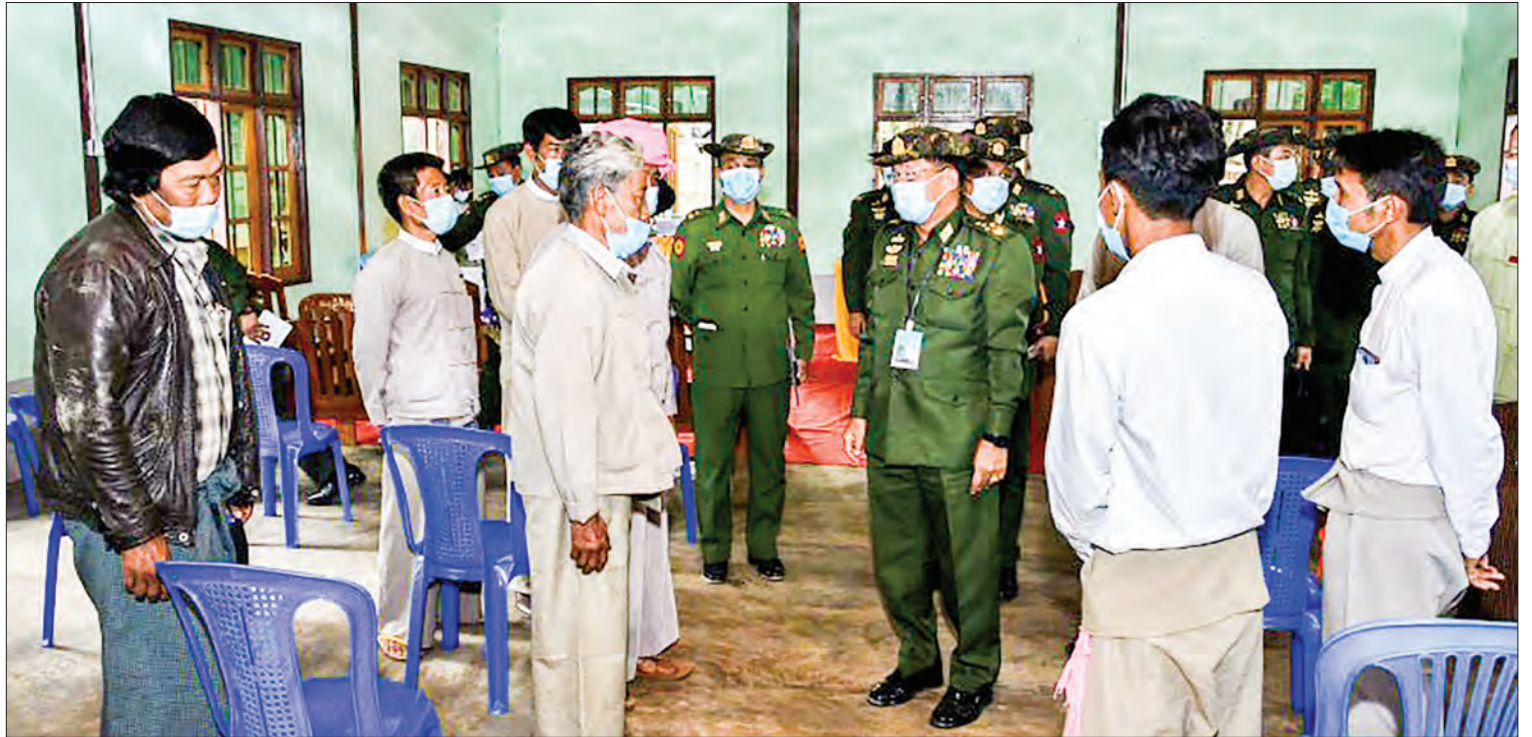
Senior General Min Aung Hlaing meets with locals in Sinnat Chaung Village of Ywangan Township in Danu Self-Administered Zone on 14 July.

The Senior General also presented educational books and