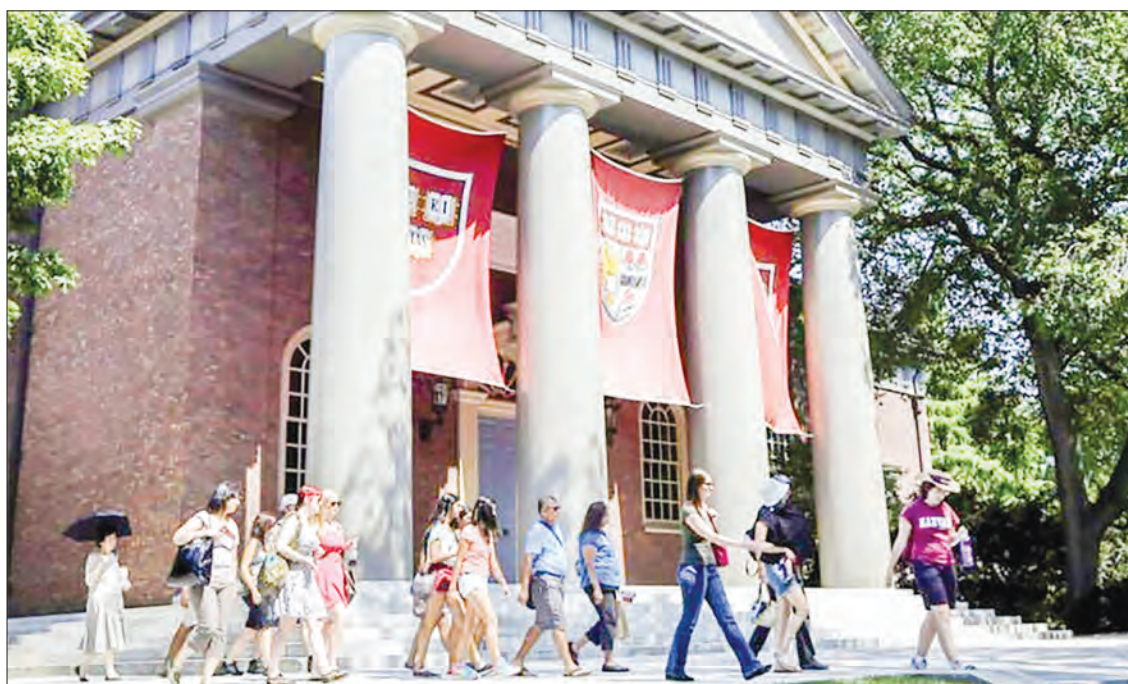
The universities of Harvard and MIT -- with the support of a number of other institutions, teachers’ unions and at least 18 US states -- had taken legal action against the move that US Immigration and Customs Enforcement (ICE) announced on July 6. Harvard University.

“Our international students are a vital part of the USC community, and they deserve the right to continue their education without risk of deportation.”—AFP ■