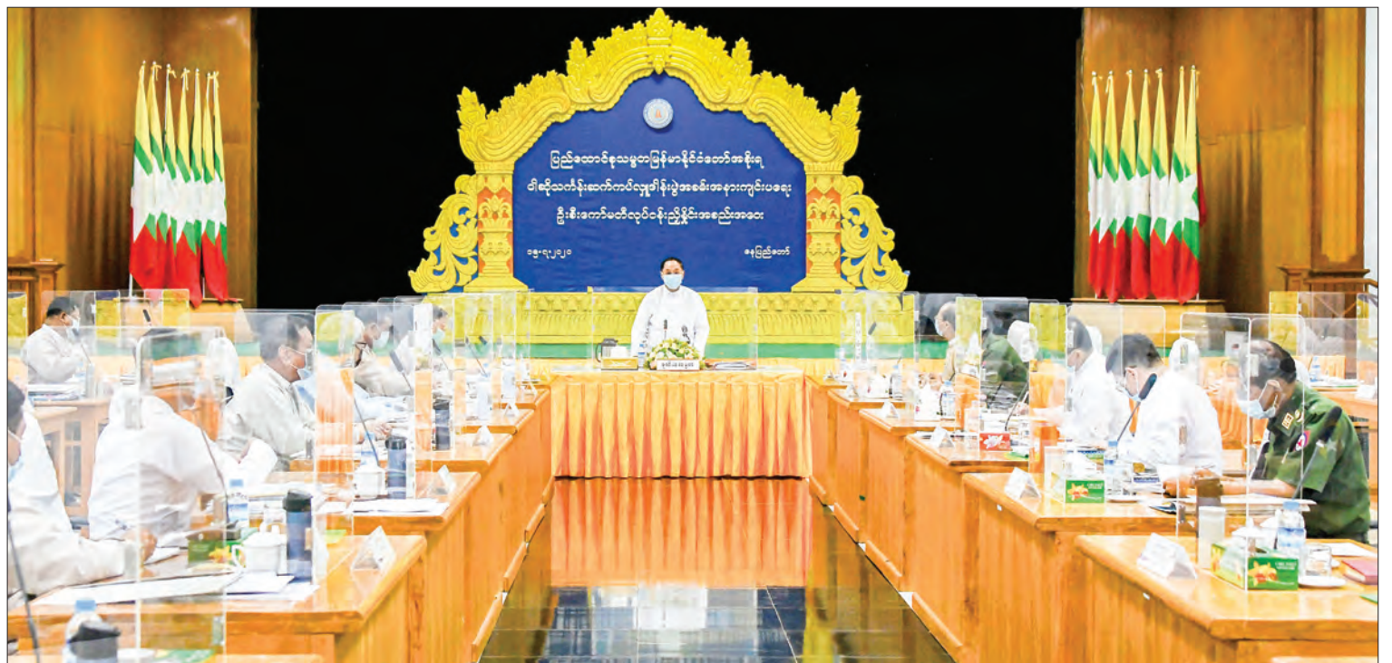
Vice President U Myint Swe presides over meeting on 15 July to prepare for Waso-robe offering ceremony of the government.

The Vice President delivered his opening remarks at the meeting, with a wide range of advice on preventive measures against COVID-19 in accordance with the guidelines, public announcements, orders and directives of