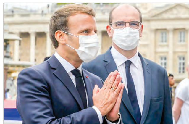
French President Emmanuel Macron said: "I would like to make masks mandatory in all enclosed public spaces".

F RENCH President Emmanuel Macron said Tuesday that face masks will soon be required in public indoor spaces to curtail the coronavirus outbreak, acknowledging that infections were again on the rise.