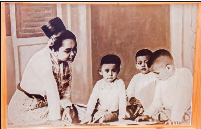
A document photo in dining room of Bogyoke Aung San

At the back of the museum, there is a piece of land on which General Aung San grew plants.