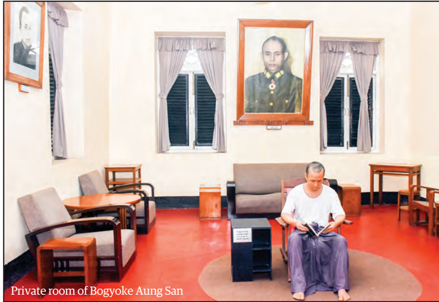
Private room of Bogyoke Aung San

The building is surrounded by green lawn, and a car used by Bogyoke Aung San until his last day before his assassination and garage can be seen at the side of museum. At the ground floor of the museum, a sophisti-