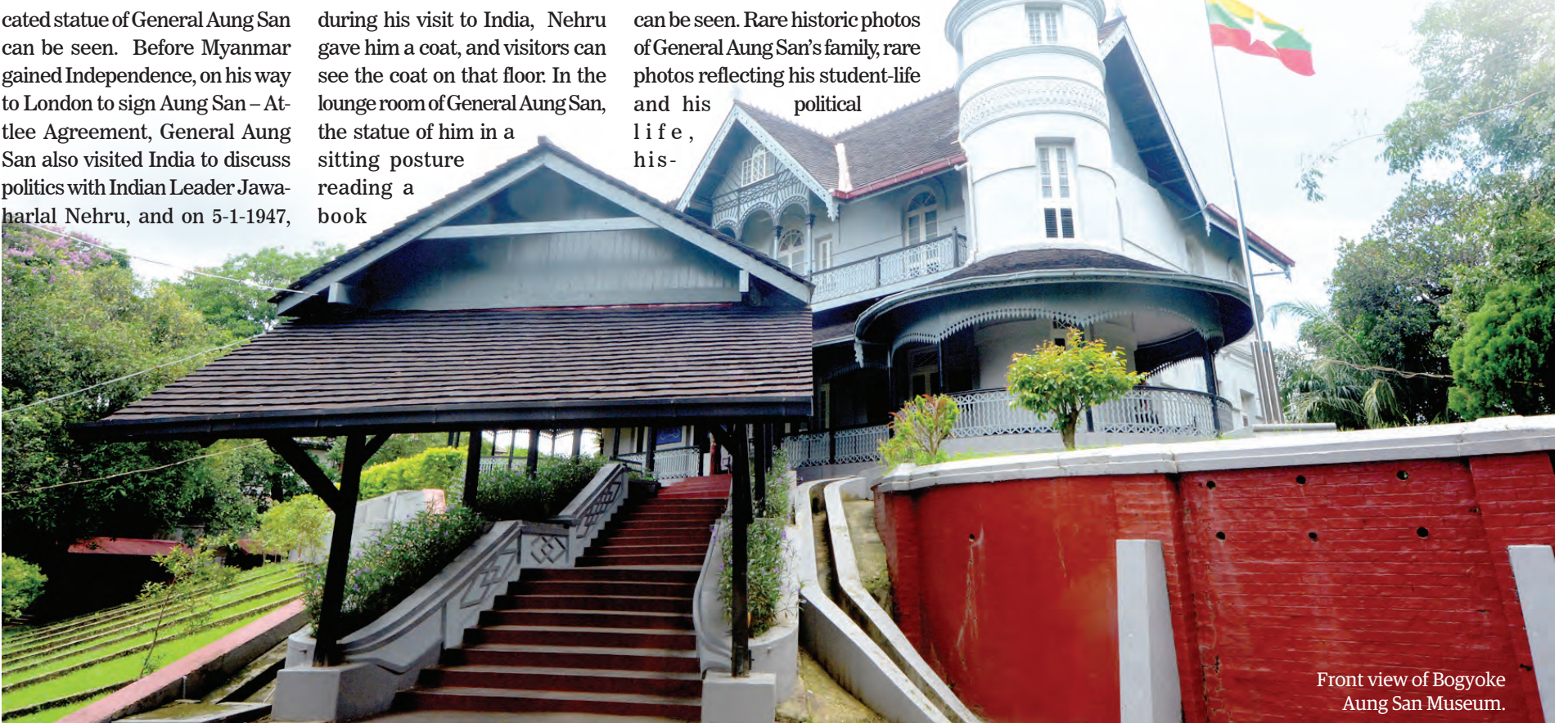
Front view of Bogyoke Aung San Museum.

can be seen. Rare historic photos of General Aung San's family, rare photos reflecting his student-life and his political life, his-