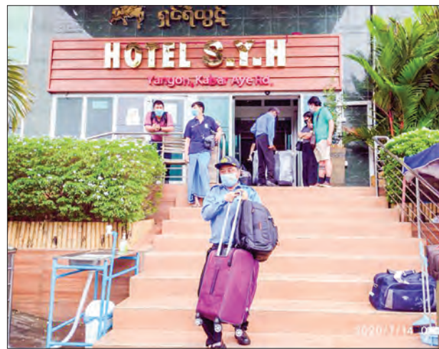
50 Myanmar returnees from ROK come back home after they were tested negative.

FIFTY Myanmar nationals who returned from the Republic of Korea on 23 June and were quarantined at the Hotel S.Y.H (Gaba Aye) in Mayangon Township in Yangon tested negative for COVID-19, and returned to their homes 14 July morning.