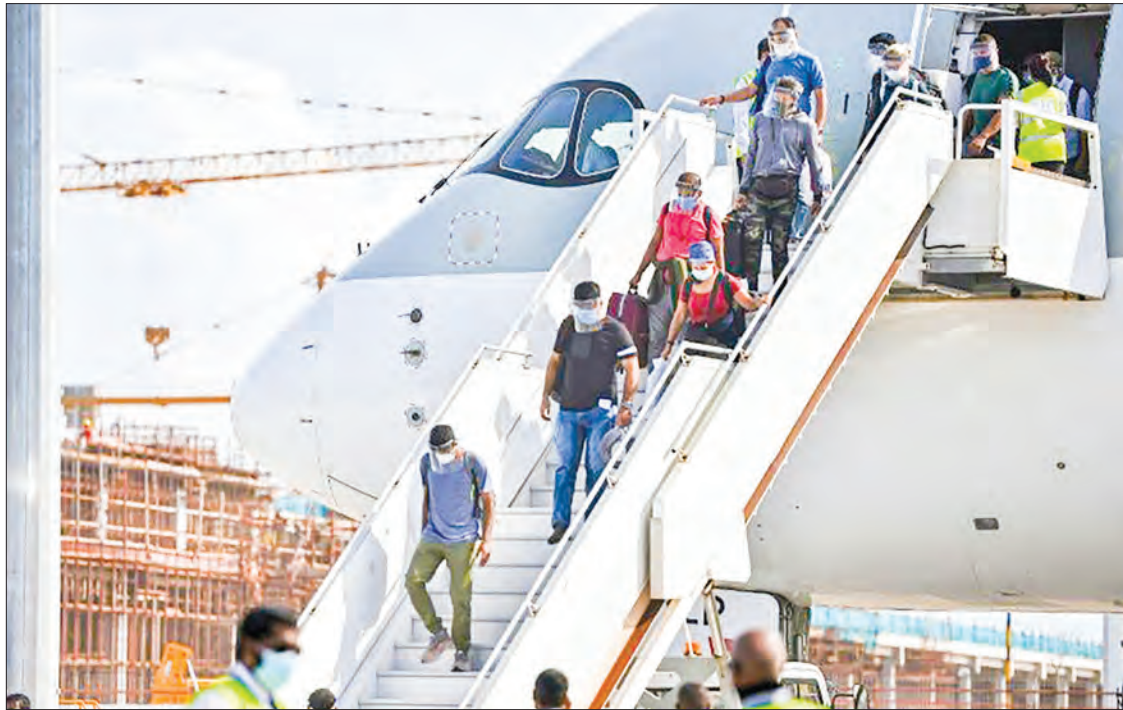
The reopening of the Maldives to tourists comes as the number of coronavirus cases continues to rise.

Talking to journalists after the welcoming ceremony, Fayyaz, also the acting head of the Tourism Ministry said that the Maldives had put up a strong fight against the COVID-19 and now the country had good testing facilities and backup facilities, local media report-