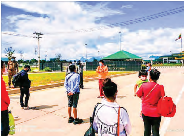
Myanmar migrant workers from Thailand queuing at Myawady Friendship Bridge (2) on 15 July.

The latest group of returnees included 179 males and 127 females from different regions and states.—Htein Lin Aung (IPRD)