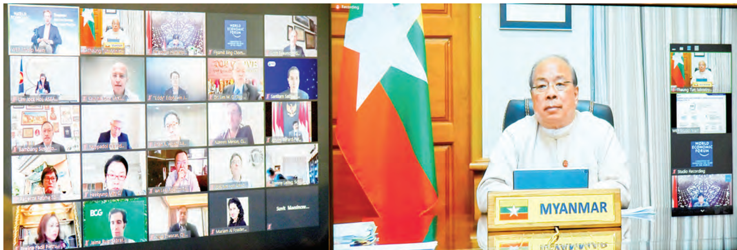
Union Minister U Thaung Tun participates in the World Economic Forum facilitated virtual dialogue on strengthening ASEAN's digital economy in support of a more inclusive and sustainable post-COVID-19 recovery.

Connecting on this year's ASEAN Youth Survey, the Union Minister concurred with the