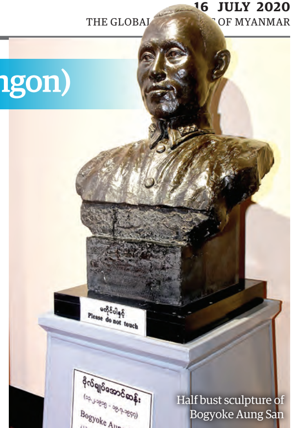
Half bust sculpture of Bogyoke Aung San