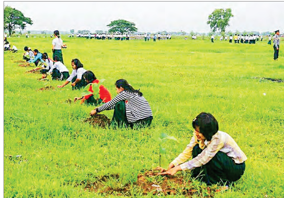
A collective tree-planting ceremony was held in the compound of No.1, Basic Education High School in Kangyidaunt Township, Ayeyawady Region on 19 June.2019.

As for the communities that are "displaced" and "resettled" in some other place due to, say for example a "Mega Project" with a potential to more or less "change" the entire Environment, the lives of the inhabitants will be affected to a greater or lesser extent. The Environmental Impact Study of the Project probably looked more at the changes on the physical environment which could result, and had to be conserved; but they probably did not fully take into account the long term impact to the disruption to life, community and society which the human habitants would suffer. Due care needs to be exercised to tackle the "human" aspect of environmental change made by "humans". What is most regrettable is the suffering of the people who were inhabitants of the place and who earned their living from the natural environment before the "behemoths"