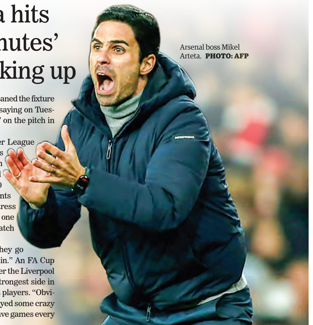
Arsenal boss Mikel Arteta.

"But look at the boys, they keep going, they go full-gas, it doesn't matter and we will do it again." An FA Cup semi-final against City is next up for Arsenal after the Liverpool clash, with Arteta keen to be able to field his strongest side in both games, despite the demands placed on his players. "Obviously they've been hit and a lot of them have played some crazy minutes up until now and again we're going to have games every two-and-a-half days.—AFP ■