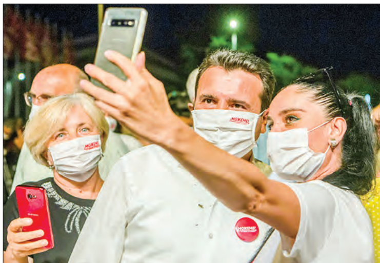
Zoran Zaev has been trying to sell his success in moving the country closer to the West.

But critics are still bitter about conceding a part of their national identity to appease Greece, which claims exclusive rights to the name Macedonia for its own neighbouring region.