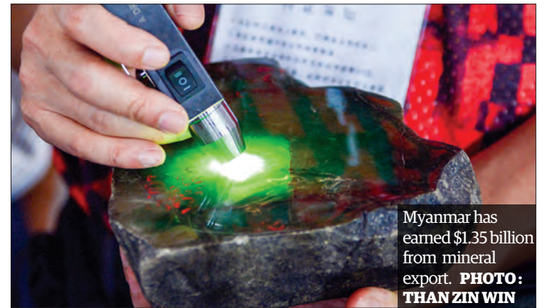
Myanmar has earned $1.35 billion from mineral export.