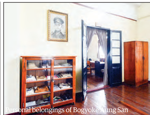
Personal belongings of Bogyoke Aung San

torical documents, and the dining room of his family are also exhibited in the museum.