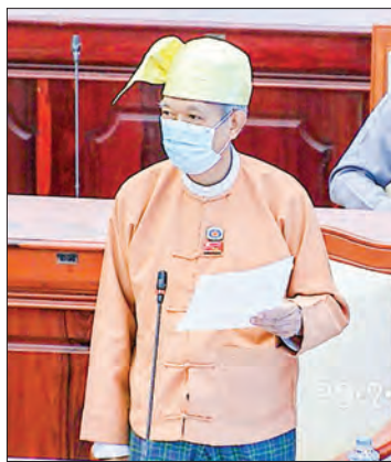
MP U Sein Bo.

the 5 th day meeting of 16 th regular session of second Pyidaungsu Hluttaw on 27 May 2020. The ministry will open to audits for this revenue expenditure from the department and the Office of Auditor-General of the Union.