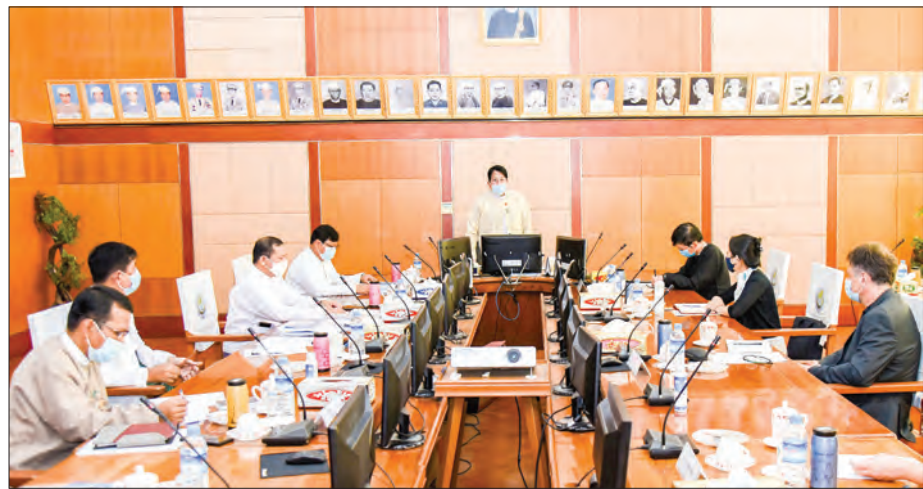
Union Information Minister Dr Pe Myint discusses with media partner organizations for the holding of 8 th Myanmar Media Development Conference.

UNION MINISTER for Information Dr Pe Myint held a meeting with the representatives from media partner organizations at his office in Nay Pyi Taw yesterday to discuss the organizing the 8 th Myanmar Media Development Conference.