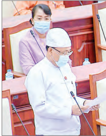
Union Minister for International Cooperation U Kyaw Tin.

MP Dr Maung Thin from Meiktila constituency asked about the detailed explanations for the proposed budget of K680 million in supplementary grant of 2019-2020 financial year from the Political