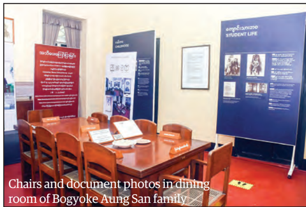
Chairs and document photos in dining room of Bogyoke Aung San family