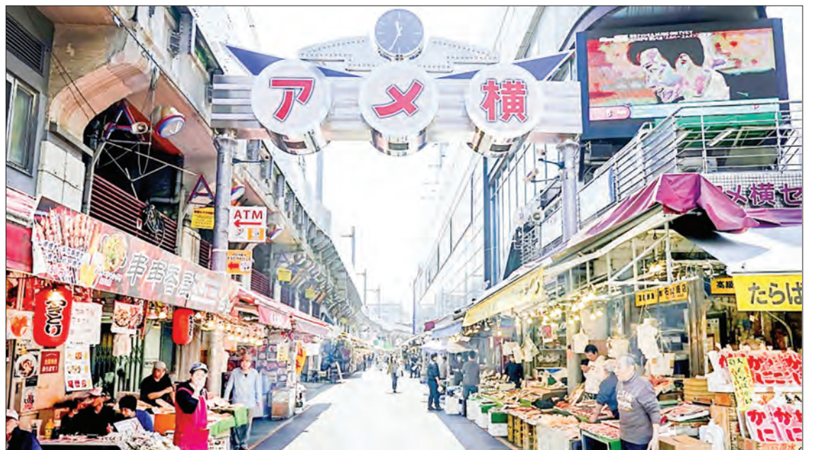
Even during a national state of emergency in April, there was no "lockdown" in Japan of the type seen in Europe.

Authorities say many of the new cases come from night-life entertainment districts in the capital and those infected appear to be people in their 20s and 30s, who are less likely to become seriously ill with the coronavirus.—AFP ■