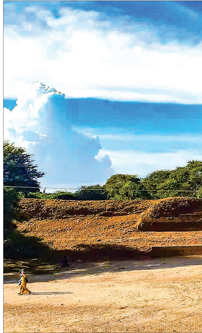
Thatbyinnyu Phayar.

An inspection team led by the Department of Public Health made a trip to check out as to whether the hotels and guesthouse meet the criteria set by the Ministry of Health