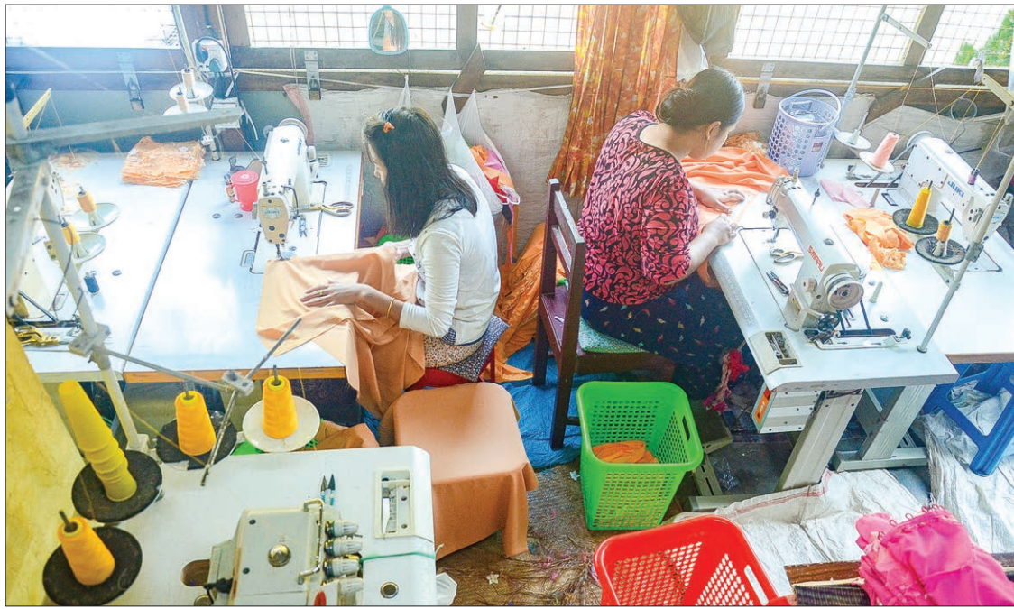
Women making clothes at a cottage industry in South Dagon Township, Yangon.

The first K100 billion from COVID Fund has been granted to the SMEs stricken by the coronavirus impacts. More than 3,393 entrepreneurs engaged in CMP businesses, hotels and tourism sector and SMEs have been approved to receive K101.298 billion