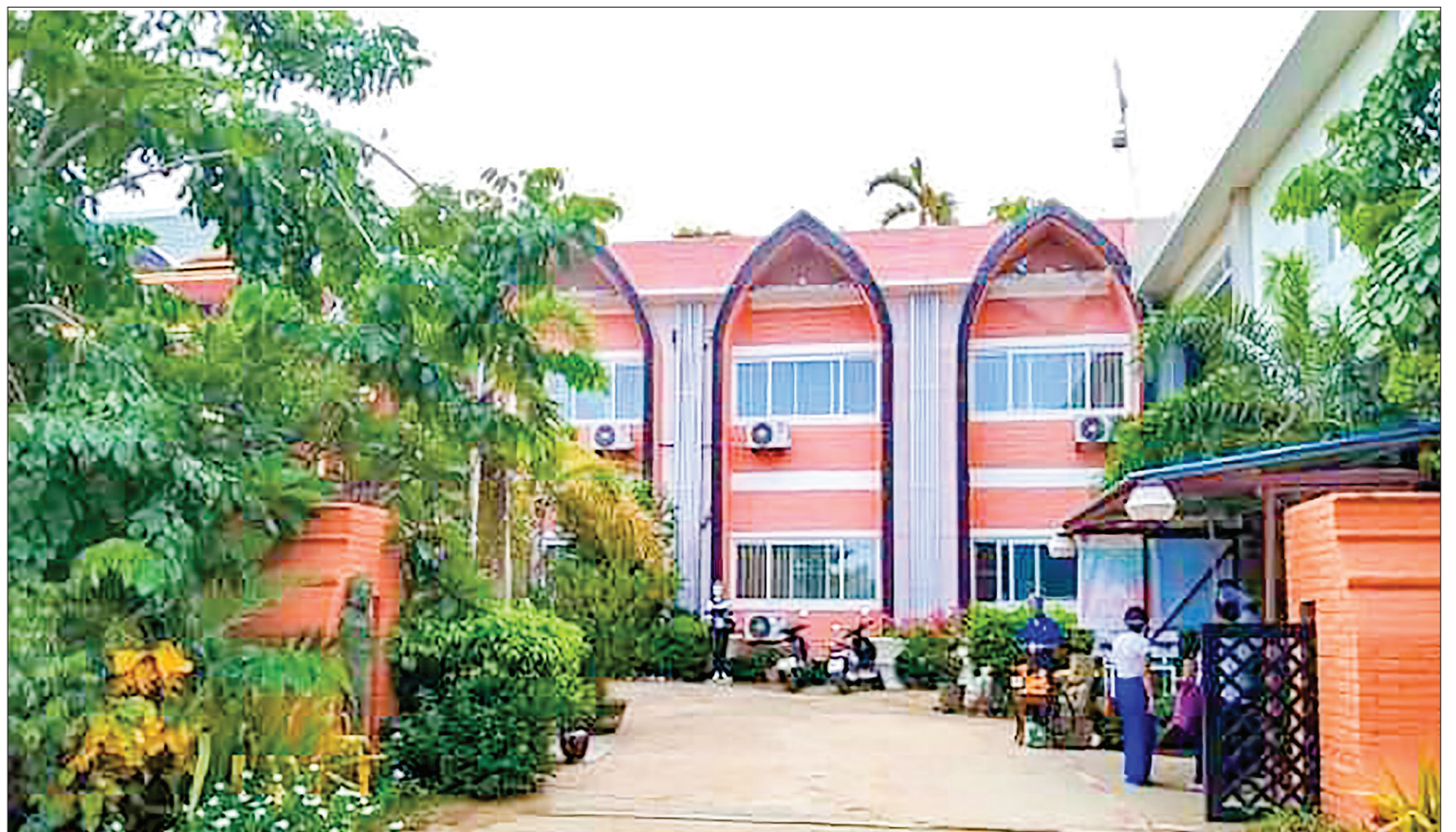
Hotels and guesthouses in Bagan ancient cultural zone are ready to welcome visitors.