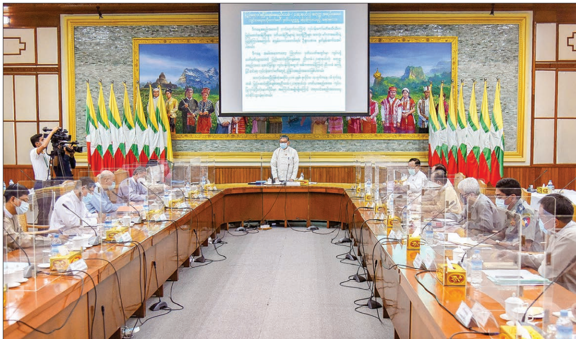
Union Minister U Kyaw Tint Swe (centre) speaks during the meeting of Central Committee on Organizing the 4 th session of the Union Peace Conference at the Ministry of the State Counsellor Office in Nay Pyi Taw on 14 July 2020.

The 8 th Joint Implementation Coordination Meeting (JICM) on Nationwide Cease-fire Agreement held at the National Reconciliation and