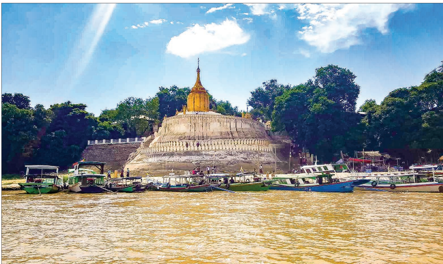
Buu Phayar.