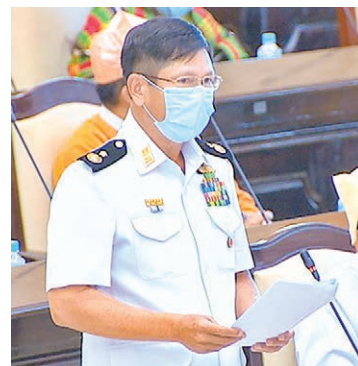
Deputy Minister for Defence Real-Admiral Myint Nwe.

Deputy Minister for Health and Sports Dr Mya Lay Sein replied that the Myanmar Olympic Committee has assigned the Director-General of Sports and Physical Education Department for the duties of Acting President of Myanmar Swimming Federation, and the filling of the positions