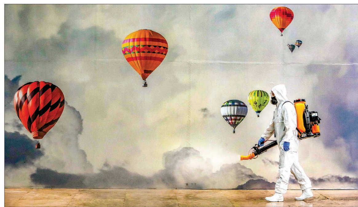
An employee wearing protective gear disinfects a shopping mall in Caxias do Sul, Brazil on May 13, 2020.

Since the start of July, nearly 2.5 million new infections have been detected across the globe,