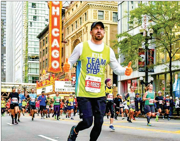
The Chicago Marathon has become the latest major marathon race to be cancelled due to the coronavirus pandemic.

LOS ANGELES — The Chicago Marathon became the latest major marathon to fall victim to the coronavirus on Monday (Jul 13) as organizers confirmed cancellation of the