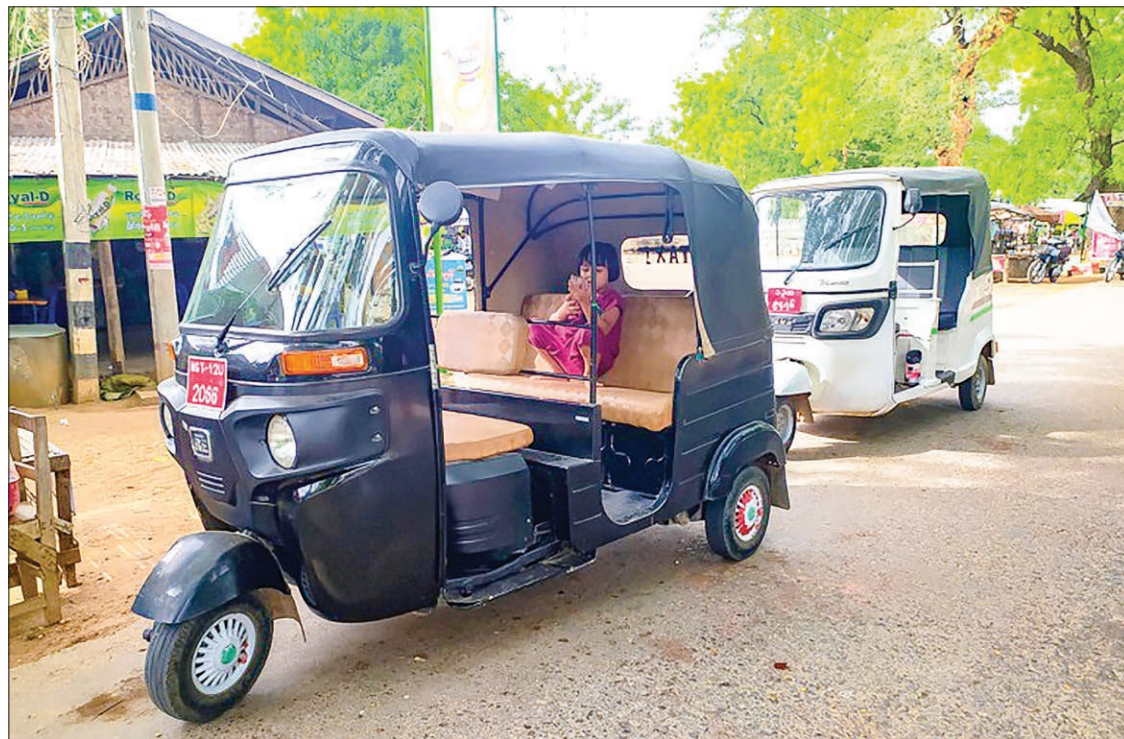
Mini Oway three-wheelers running in Bagan-NyaungU are facing difficulties following the outbreak of COVID-19 in Myanmar.

Now, there are no passengers and we have to park our tuktoks in front of the