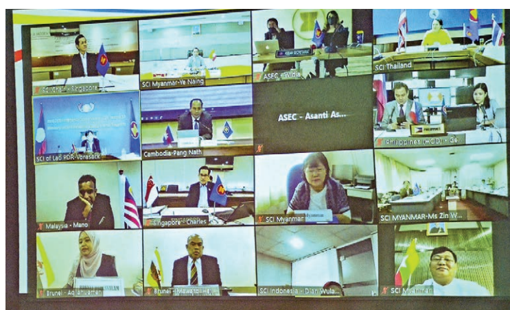
Senior officials of Ministry of Information join virtual 21 st ASEAN Sub-Committee Meeting on Information on 14 July.