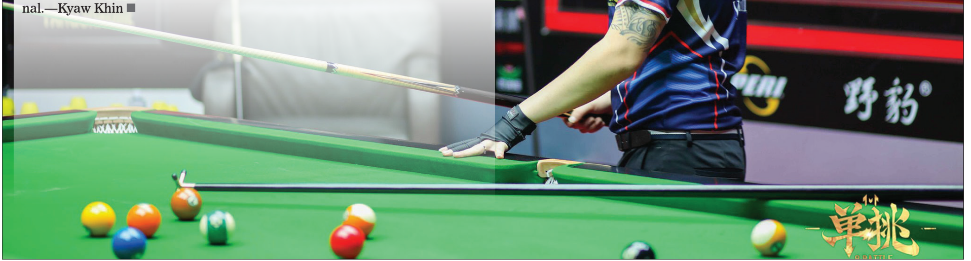
Myanmar pool star Phone Myint Kyaw is seen during a match in Chinese 8 Ball Game in 2020.

Out of the three days each, those who win two days will advance to final.—Kyaw Khin ■