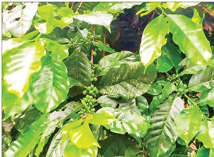
Coffee plants are seen in Ngaphe Township in Magway Region.

“Previously, Nat Yaykan Taung region grows only Konjac, a common name of the East and Southeast Asian plant, banana, orange, pineapple and lemon. Now, the local residents grow the coffee on a manageable scale. The coffee planting is successful thanks to the favourable weather condition, said U