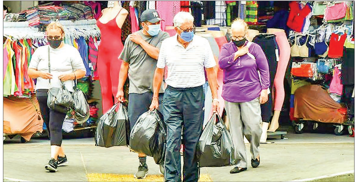
People wear facemasks while shopping in Los Angeles in early July 2020 -- California Governor Gavin Newsom has now ordered shopping malls, indoor restaurants, bars and movie theaters to close again statewide as virus cases surge.

"We're moving back into a modification mode of our original 'stay-at-home' order," said Newsom, whose state is by far the largest by population and richest in America. The move came as the Golden State reported 8,358 new coronavirus cases on Sunday, bringing its total to nearly 330,000 including more than 7,000 deaths. Like the governors of Texas, Arizona, and Florida -- which were also hit hard in the virus' second spike -- California delegated the reopening process to local