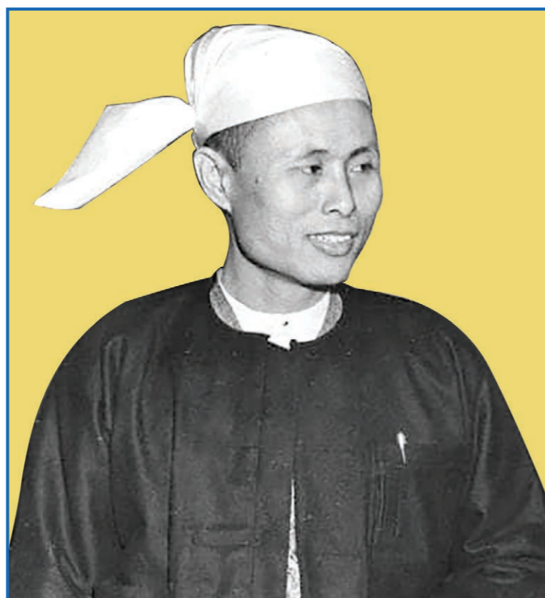
Bogyoke (General) Aung San

T HE late Bogyoke (General) Aung San has been accepted as a national leader, as architect of Myanmar independ-