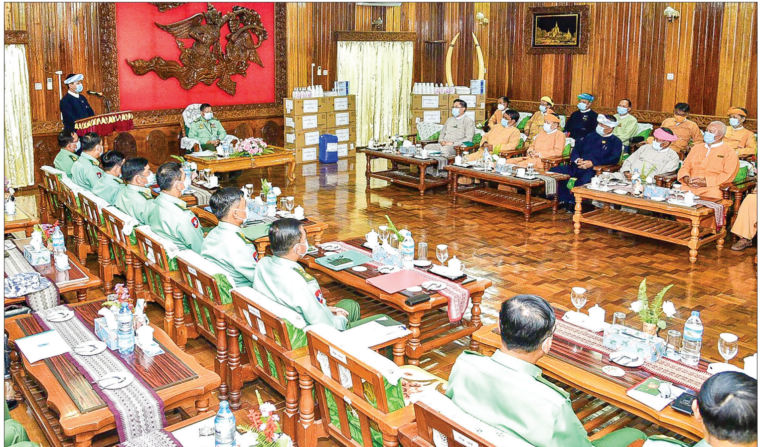
Senior General Min Aung Hlaing holds discussions with ethnic representatives at the donation ceremony of COVID-19 medical supplies and food items in Taunggyi on 14 July.