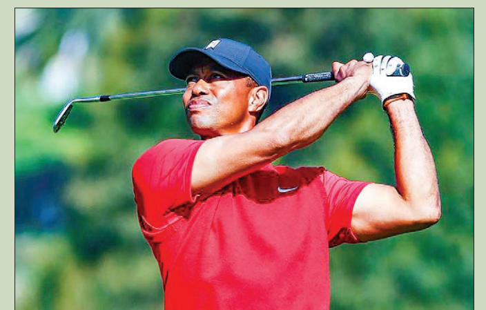
Tiger Woods will tee off alongside Brooks Koepka and Rory McIlroy at the upcoming Memorial Tournament.