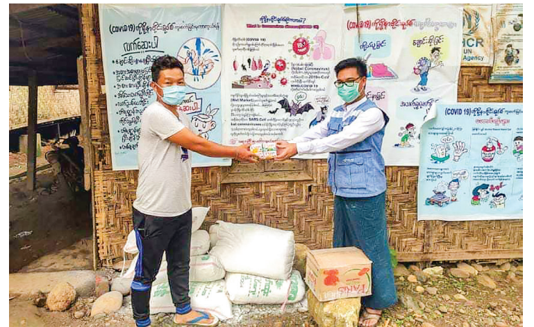
An official gives COVID-19 relief supply to an internally displaced person in Kachin State.