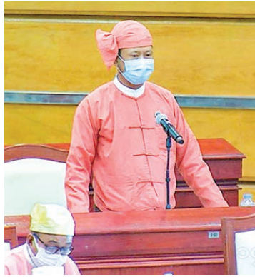
MP U Win Win.