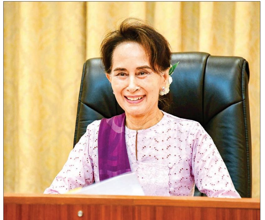
State Counsellor Daw Aung San Suu Kyi holds talks on a videoconference about experiences in repatriation programmes for Myanmar nationals from foreign countries.

STATE Counsellor Daw Aung San Suu Kyi in her capacity as Chairperson of the National-Level Central Committee for Prevention, Control