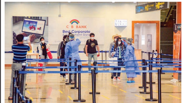
Myanmar returnees are measured for body temperatures as they arrived at Yangon International Airport on 14 July.

A relief flight of Myanmar Airways International (MAI) landed at the Yangon International Airport in the evening of 14 July, bringing back a total of 112 Myanmar citizens who were stranded in foreign countries.