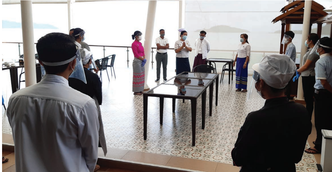
Local authorities inspecting a hotel in Kawthoung to ensure adhering to COVID-19 guidelines.

A combined team of local authorities inspected hotels in Kawthoung Township, Kawthoung District in Taninthayi Region which were temporarily shut down to control COVID-19 pandemic on 13 July morning.