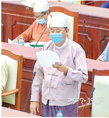
Deputy Minister for Education U Win Maw Tun.