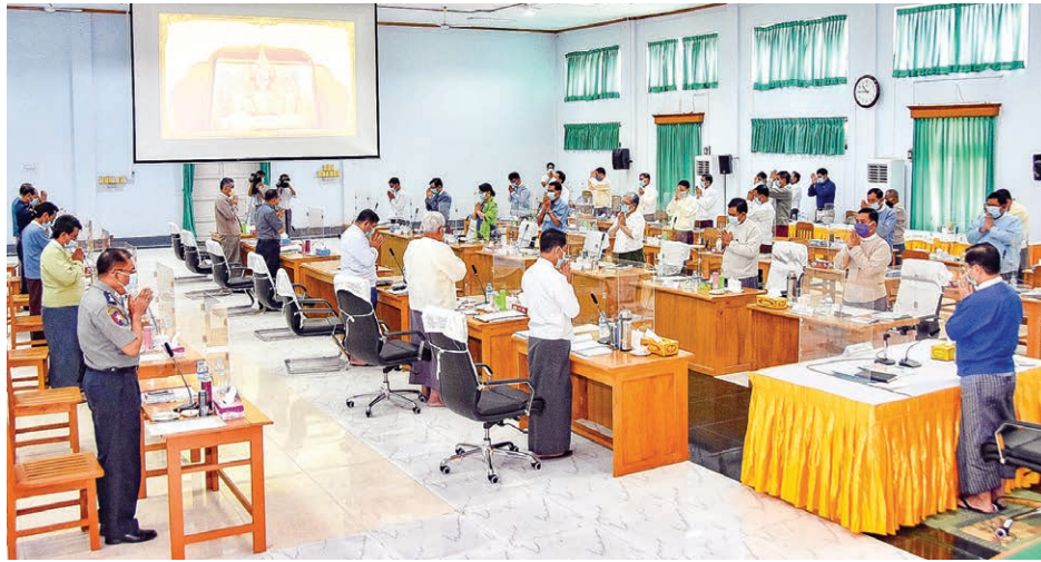
Union Minister Thura U Aung Ko presides over a coordination meeting on 13 July to hold government's annual Waso-robe offering ceremony.

Government will hold an annual Waso-robe offering ceremony in Nay Pyi Taw on 29 July.