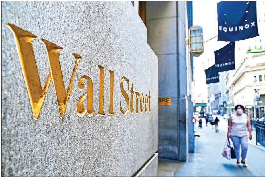
(Files) People walk near the The New York Stock Exchange (NYSE) on Wall Street on 29 June 2020 in New York City.

LONDON (United Kingdom) — World stock markets advanced Monday, helped by investor confidence in upcoming US third-quarter earnings and