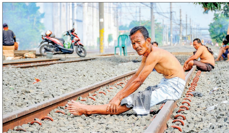
In this picture taken on 4 April 2020 shows Indonesians sunbathe in Bekasi, West Java, with the belief that the sun can boost their body immunity amid concern to the COVID-19 coronavirus outbreak.

But Monday’s research suggests immunity cannot be taken for granted and may not last more than a few months, as is true with other viruses such as influenza. — AFP ■