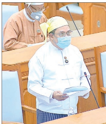
Deputy Minister for Planning, Finance and Industry U Set Aung.