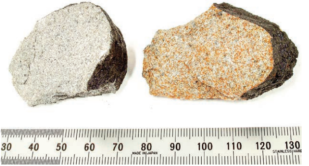
Supplied photo shows fragments of a meteorite, which landed on a condominium in Narashino, Chiba Prefecture.

The shooting star was observed on July 2 moving from south-