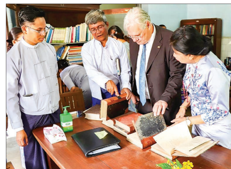
The France-Myanmar cooperation in the health sector, with the National Health Laboratory (NHL).

The joint fight against the Covid-19 pandemic and its effects mobilizes all our bilateral cooperation instruments. It has also generated a real surge of sol-