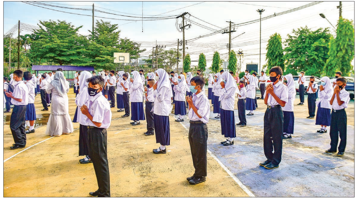
Students wearing facemasks observe social distancing as they pray in a yard in their school in the southern Thai province of Narathiwat on 1 July 2020, as schools reopened after being temporarily closed due to the threat of the COVID-19 novel coronavirus.