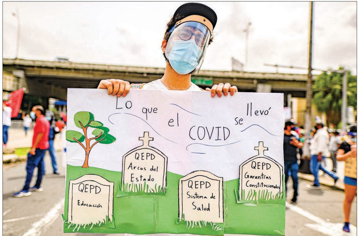
A University student wearing a face mask and shield holds a sign reading “Gone with COVID, RIP Education, RIP State Coffers, RIP Healthcare System, RIP Constitutional Guarantees” during a protest against alleged corruption and hunger amid the new coronavirus pandemic outside the National Assembly in Panama City, on 1 July 2020.

moderate and severe food insecurity in 2019, the number balloons from 690 million to 2 billion people without “regular access to safe, nutritious and