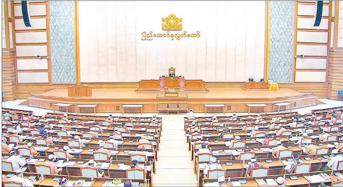
Pyidaungsu Hluttaw convenes its first-day meeting of 17 th regular session on 13 July.