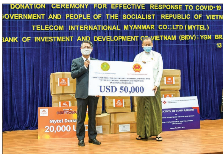
Vietnamese donations for COVID-19 measures are received at Department of Medical Research in Yangon on 13 July.

THE government of the Socialist Republic of Viet Nam, the Telecom International Myanmar Co., Ltd (Mytel) and the Bank of Investment and Development of Vietnam (BIDV) donated cash funds and face masks to the National-Level Central Committee on Prevention, Control and Treatment of Coronavirus Disease 2019 (COVID-19) and the Department of Medical Research of the Ministry of Health and Sports at the meeting hall of the head office of the department on Ziwaka Road, Dagon