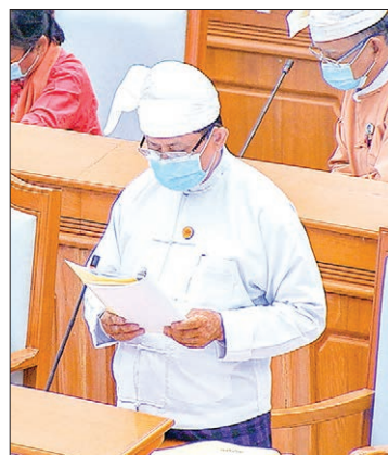
Deputy Minister for Planning, Finance and Industry U Maung Maung Win.