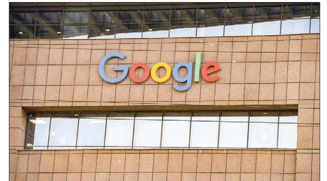
In this file photo taken on 23 March 2018, the Google logo is pictured on the side of the Google India office building in Hyderabad.

Earlier this month the Indian government banned 59 Chinese cellphone apps including the hugely popular TikTok over concerns