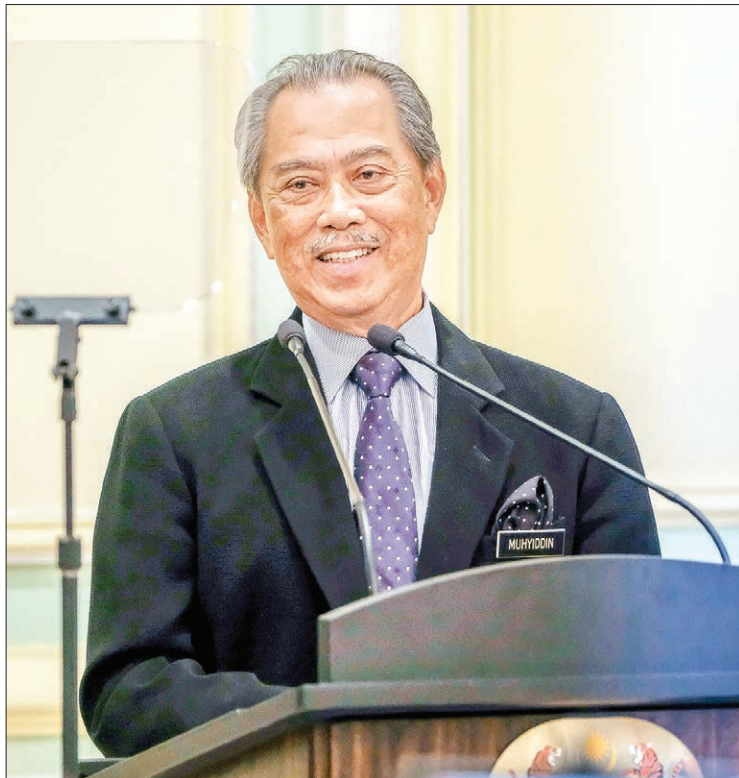
File photo shows Malaysian Prime Minister Muhyiddin Yassin.

a campaign to unseat Muhyiddin and his “illegitimate” government, has submitted a motion of no-confidence against his successor but the motion is listed nearly at the bottom of the agenda and may not see the light of day as