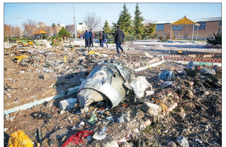
In this file photo taken on 8 January 2020, rescue teams work amidst debris after a Ukrainian plane carrying 176 passengers crashed near Imam Khomeini airport in the Iranian capital Tehran early in the morning, killing everyone on board.

The majority of the passengers on the Boeing 737 were Iranians, with Canadians, Ukrainians, Afghans, Britons and Swedes also aboard.—AFP ■