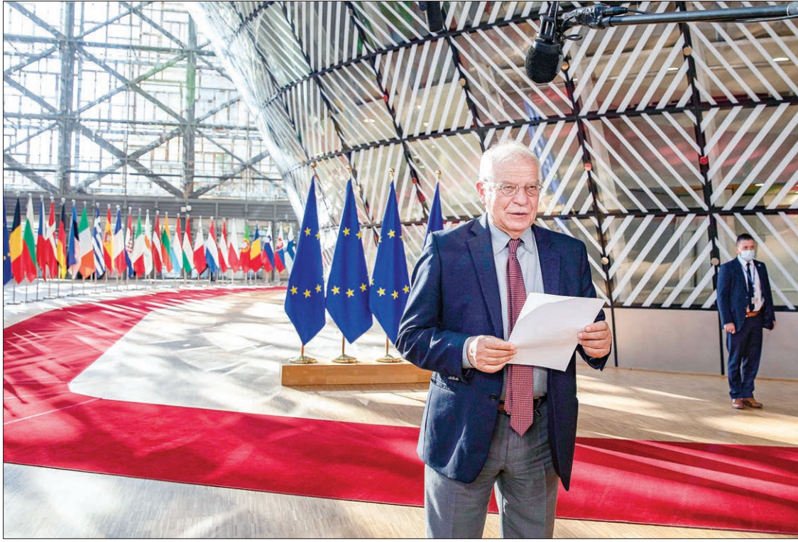
European Union foreign policy chief Josep Borrell reads a statement as he arrives for a meeting of EU foreign ministers at the European Council building in Brussels, on 13 July 2020.

BRUSSELS (Belgium) — EU foreign ministers met on Monday to seek a way to calm tensions with Turkey, particularly over claims of illegal oil drilling in the Mediterranean and Ankara's human rights record.