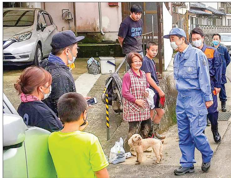
Japan's Prime Minister Shinzo Abe (R) speaks with residents as he visits a flood-hit area in the village of Kuma in Kumamoto prefecture on July 13, 2020, after last week's heavy rains and flooding that devastated the region.

In 2018, more than 200 people died in devastating floods in western Japan. — AFP ■