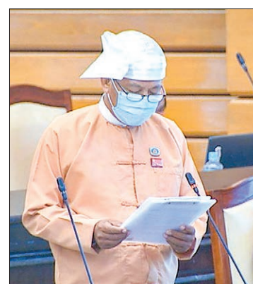
MP U Kyaw Toke.

Deputy Minister U Win Maw Tun answered that budgets will be allocated for construction of