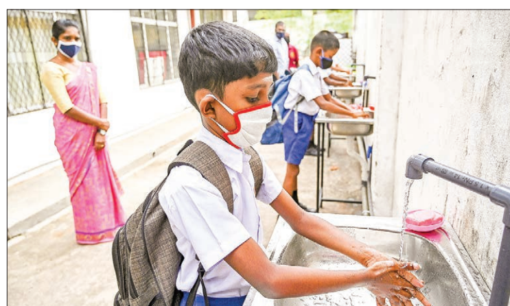
Students wearing facemasks wash their hands inside their school in Sri Lanka on 6 July 2020.

month’s parliamentary elections would be delayed in villages affected by the virus, the independent election commission said.