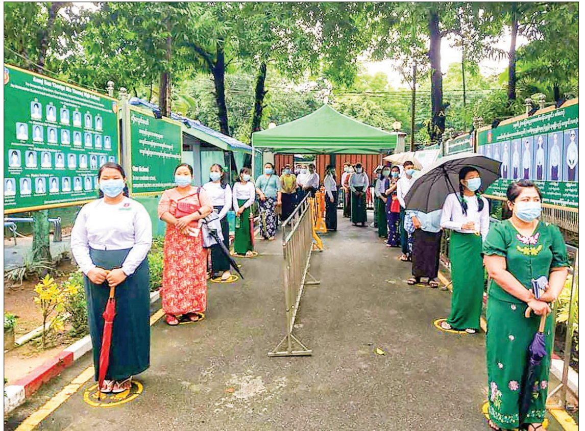
Students and parents queuing to enrol in Grade 10 and 11 classes of 2020-2021 academic year on 13 July.

The school enrolments are available between 8 am and 1 pm from 13 to 17 July. Additionally, enrollments for Grade 10 and 11 are on different days. "Some parents are worried about the reopening of the schools due to coronavirus concerns. Some