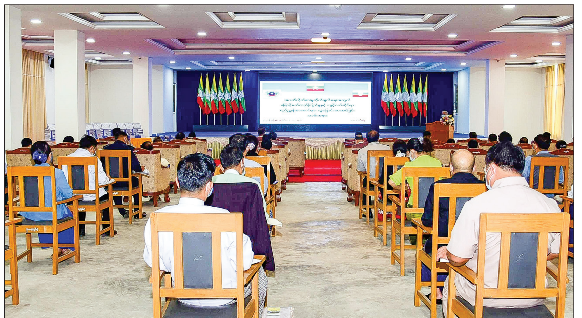
Anti-Corruption Commission hands over documents and publications on "integrity and ethics" in Shan State on 13 July.