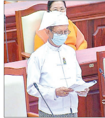
Deputy Minister for Transport and Communications U Thar Oo.

MP U Toe Thaung from Mongmit constituency asked about better connection of MPT mobile phone lines. Deputy Minister for Transport and Communications U Thar Oo replied that the existing Mogok-Mongmit microwave-network has the technically highest bandwidth capacity in the