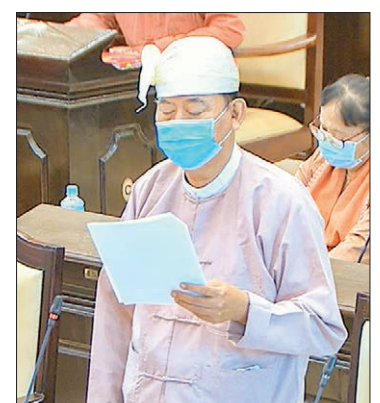
Deputy Minister U Win Maw Tun.

The Deputy Minister also answered to the question of MP U Kyaw Toke from Mandalay Region constituency 7 about appli-