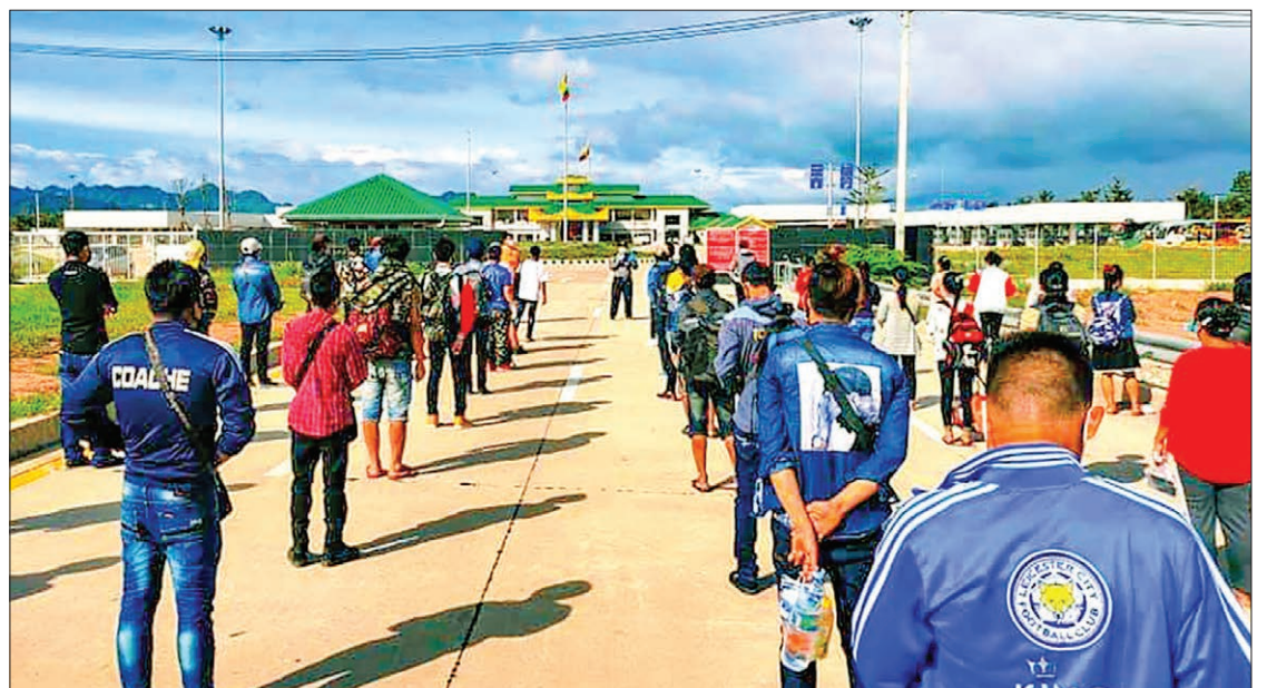
Myanmar nationals returned from Thailand queue for immigration process at the Myawady border checkpoint on 13 July 2020.