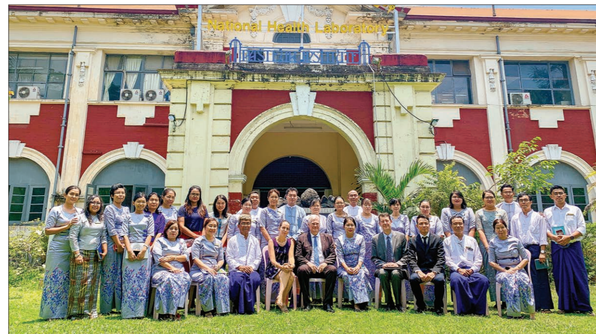
The France-Myanmar joint archaeological mission in Halin (Sagaing Division).

solidarity among the French people living in Myanmar. Businesses, French nationals and their families have stepped up local initiatives to support prevention and care efforts in Yangon and in the country side. These spontaneous gestures underscore the attachment of the French to Myanmar and its people. As we have just celebrated the 72nd anniversary of our diplomatic relations, we can say that we are preparing for the future together, together and in all sincerity: "Long live the France - Myanmar cooperation!"