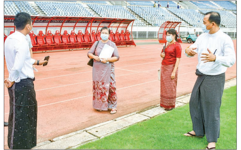
Officials from the Ministry of Health and Sports, accompanied by sports officials concerned, inspect the Thuwunna Stadium in Yangon on 13 July 2020.