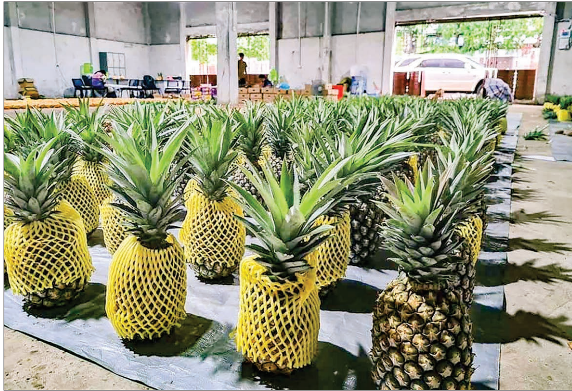
Myanmar is awaiting response of China to the results from Phytosanitary measures and inspection.

Earlier, 50 per cent of pineapple production is consumed locally, and the remaining goes to China.