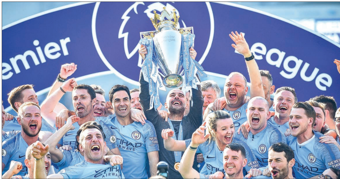
(FILES) In this file photo taken on May 12, 2019 Manchester City's Spanish manager Pep Guardiola (C) lifts the Premier League trophy with staff members after their 4-1 victory in the English Premier League football match between Brighton and Hove Albion and Manchester City at the American Express Community Stadium in Brighton, southern England on 12 May 2019.

LAUSANNE (Switzerland) — Manchester City are free to play Champions League football next season after the Court of Arbitration for Sport on Monday lifted a two-season ban from European competitions imposed by UEFA.