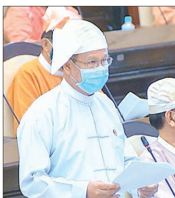
Deputy Minister for Commerce U Aung Htoo.

Htoo replied that the plan is being implemented in coordination with India. In the first stage, a border market will be opened at Pansaung Town of Sagaing Region and more border markets will be established after making agreements between the two countries. MP U San Myint from Ayeyawady Region constituency 3 asked about construction of a new school building to replace the old facility at the high school in Kwin Thone Sint village of Yekyi Township in his