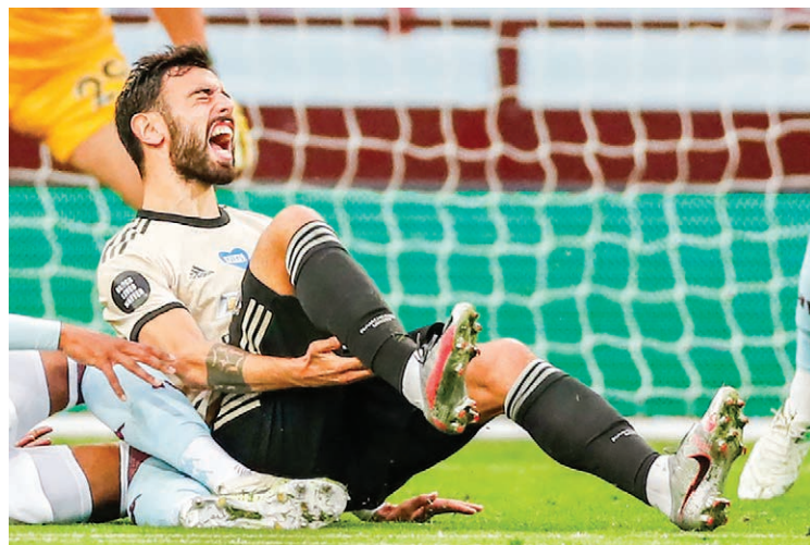
Manchester United midfielder Bruno Fernandes wins a penalty during the Premier League match against Aston Villa.