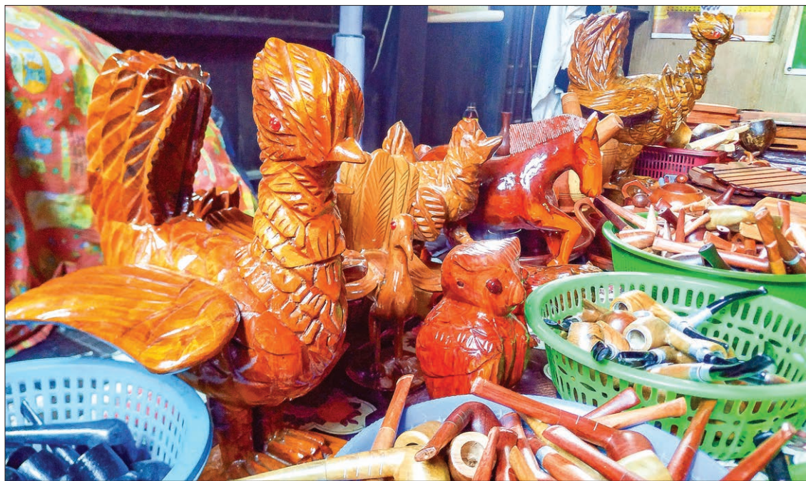
Myanmar handicraft market has declined due to fewer travellers amid COVID-19 restrictions.