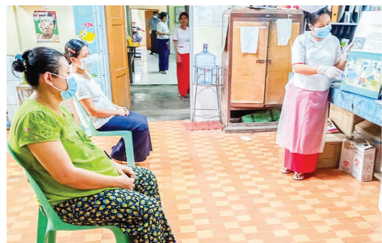
Maternal Health Knowledge Awareness Session provided by Midwife in Yangon.

A recent study commissioned by UNFPA, the United Nations sexual and reproductive health agency, highlighted that if mobility restrictions continue for at least 6 months with major disruptions to health services, 47 million women