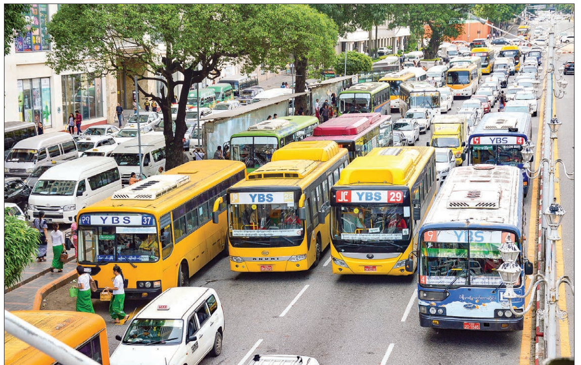
YRTA has extended exemption of management fee K4,000 per bus daily till the end of July.