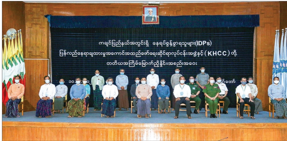
The attendees of the meeting on resettlement of IDPs in Kachin State pose for a group photo at the Ministry of Social Welfare, Relief and Resettlement in Nay Pyi Taw on 10 July 2020.

al Strategy on Resettlement of Internally Displaced Persons (IDPs) and Closure of IDP Camps" was already drawn up, and the works that are included in the strategy will be undertaken.