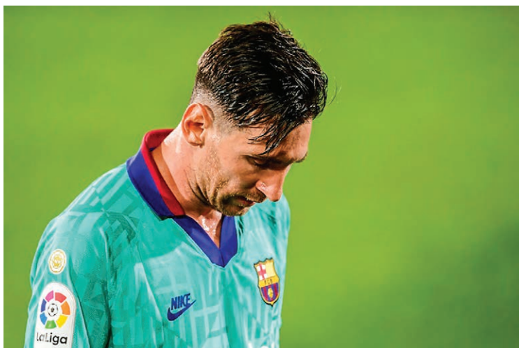
Speculation is swirling over the future of Barcelona's superstar forward Lionel Messi.

"He's one of the (few) players to stay his whole career at the same club. "I admire him as a person and a player and hopefully he will stay there. That's what I'd love to see."— AFP ■