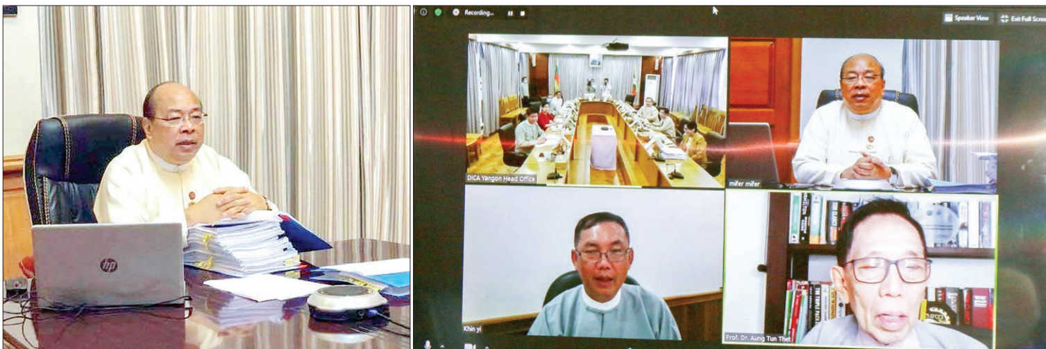
U Thaung Tun, Chairman of Myanmar Investment Commission and Union Minister for Investment and Foreign Economic Relations presides over the regular meeting of the commission via videoconferencing on 10 July 2020.

THE Myanmar Investment Commission (MIC) held a regular meeting on-line, this morning. The meeting was chaired by