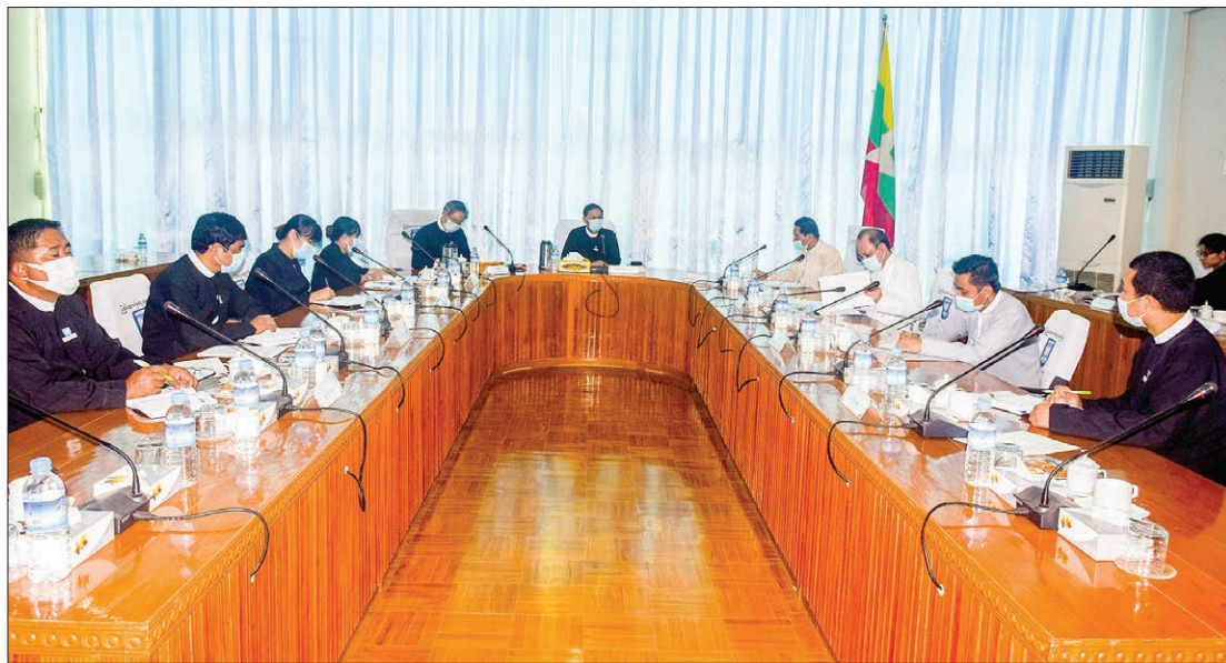
The meeting on the Universal Periodic Review (UPR) is in progress at the Union Attorney-General's Office in Nay Pyi Taw on 10 July 2020.

THE Union Attorney-General's Office held a meeting on the process of Universal Periodic Review yesterday.