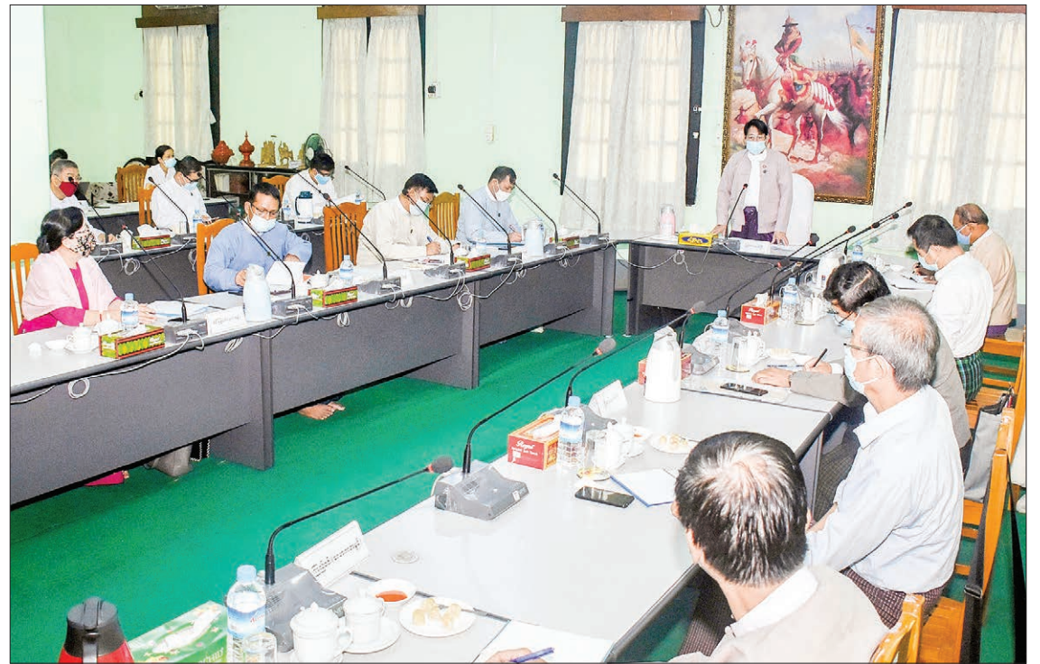
Union Minister Dr Pe Myint speaks during the meeting with literary consultant team of Sarpaybeikman at the office of Printing and Publishing Department in Yangon on 10 July 2020.

In the afternoon, Union Minister Dr Pe Myint met with