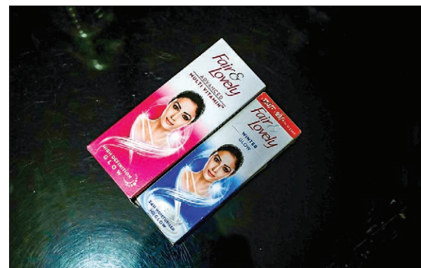
Unilever reportedly made $500 million from Fair & Lovely sales last year.

sales of whitening creams, facewash and even vaginal bleaching lotions, by advertising the message that beauty, success and love are only for pale-skinned people. Unilever made $500 million from Fair & Lovely sales in India last year, according to Bloomberg. —AFP ■