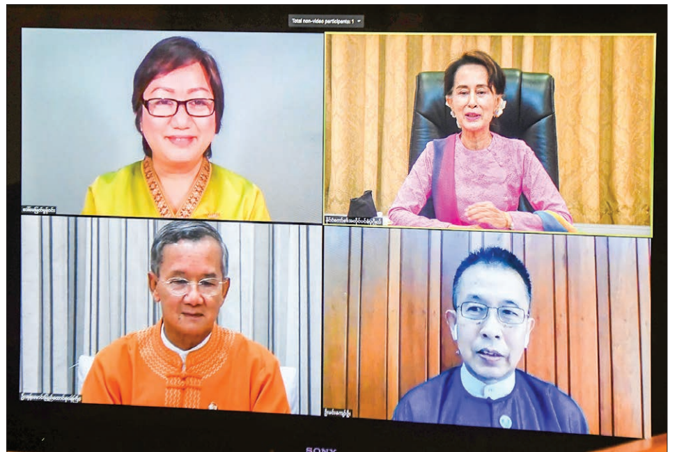
State Counsellor Daw Aung San Suu Kyi discusses impact of COVID-19 on hotels and tourism industry with officials concerned on 10 July 2020.

STATE Counsellor Daw Aung San Suu Kyi held a videoconference from the Presidential Palace in Nay Pyi Taw at 10 am yesterday to discuss the impact of COVID-19 on the hotels and tourism sector and the practical realities at the ground level with stakeholders.