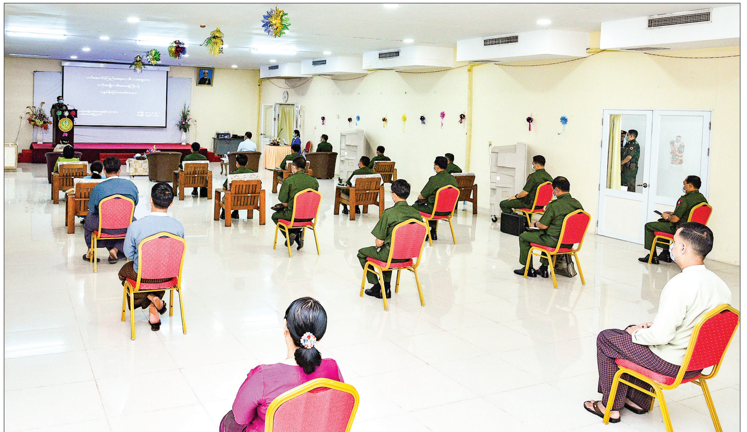
Senior General Min Aung Hlaing speaks at the ceremony to donate medical supplies to the Central Women’s Hospital in Yangon on 10 July 2020.