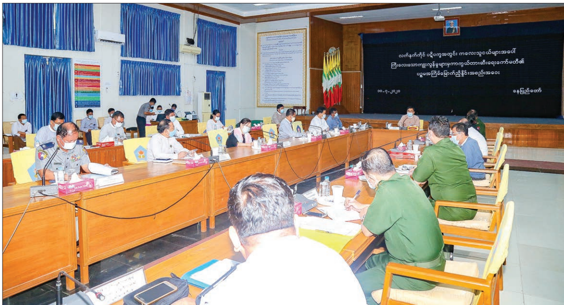
The fifth coordination meeting of Preventing Violence Against Children in Armed Conflicts Committee is in progress in Nay Pyi Taw on 10 July 2020.

THE fifth coordination meeting of Preventing Violence Against Children in Armed Conflicts Committee was held at the Ministry of Social Welfare, Relief and Resettlement yesterday afternoon.