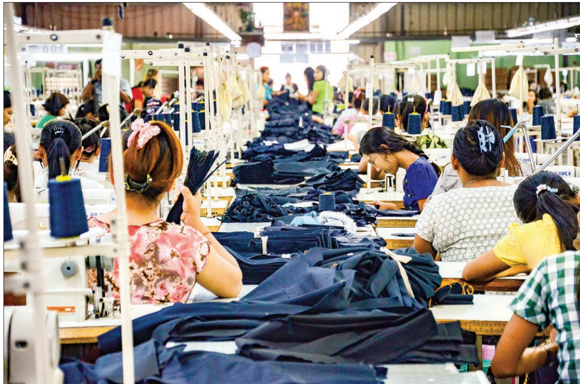
Manufacturing sector has attracted largest investment value into Myanmar. FILE PHOTO

The DICA indicated that Yangon Region absorbs 60 per cent of all investments in Myanmar, Mandalay attracts 30 per cent, while the other regions and states receive only a small share of investments. The Myanmar Investment Commission and the respective investment committees have granted permits and endorsements to 905 foreign enterprises between 2016-2017 Fiscal Year and as of May-end in