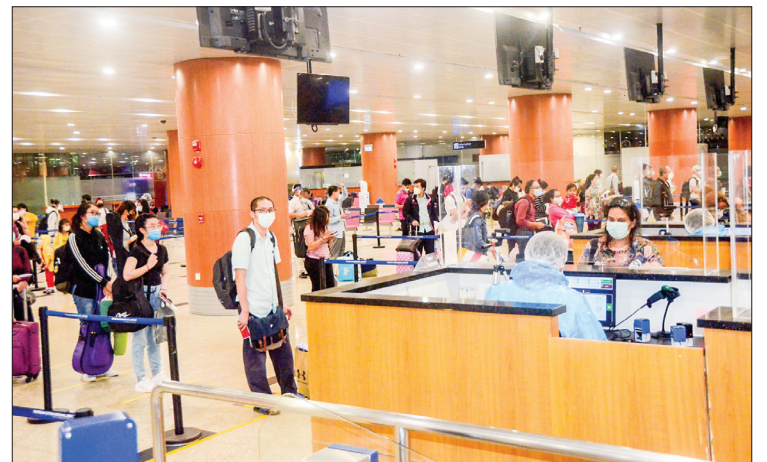
Myanmar nationals returned from foreign countries queue for immigration process at the Yangon International Airport on 10 July 2020.