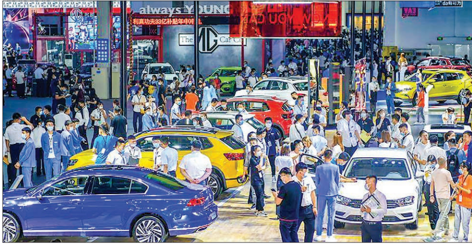
People visit the 17 th China Changchun International Automobile Expo in Changchun, northeast China's Jilin Province, July 10, 2020. The 10-day China Changchun International Automobile Expo kicked off at Changchun International Conference & Exhibition Centre on Friday. More than 1,400 vehicles of about 150 brands from home and abroad are exhibited during the expo this year.

CHANGCHUN — The 17 th China (Changchun) International Automobile Expo opened Friday in Changchun, capital of northeast China's Jilin Province, with a record number of over 1,400 vehicles on display.