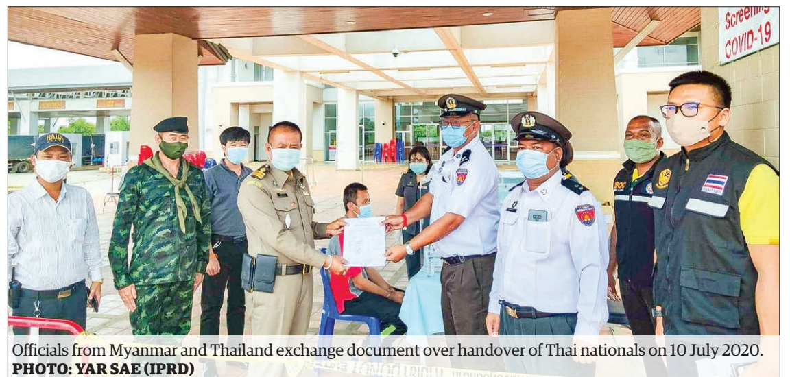
Officials from Myanmar and Thailand exchange document over handover of Thai nationals on 10 July 2020.