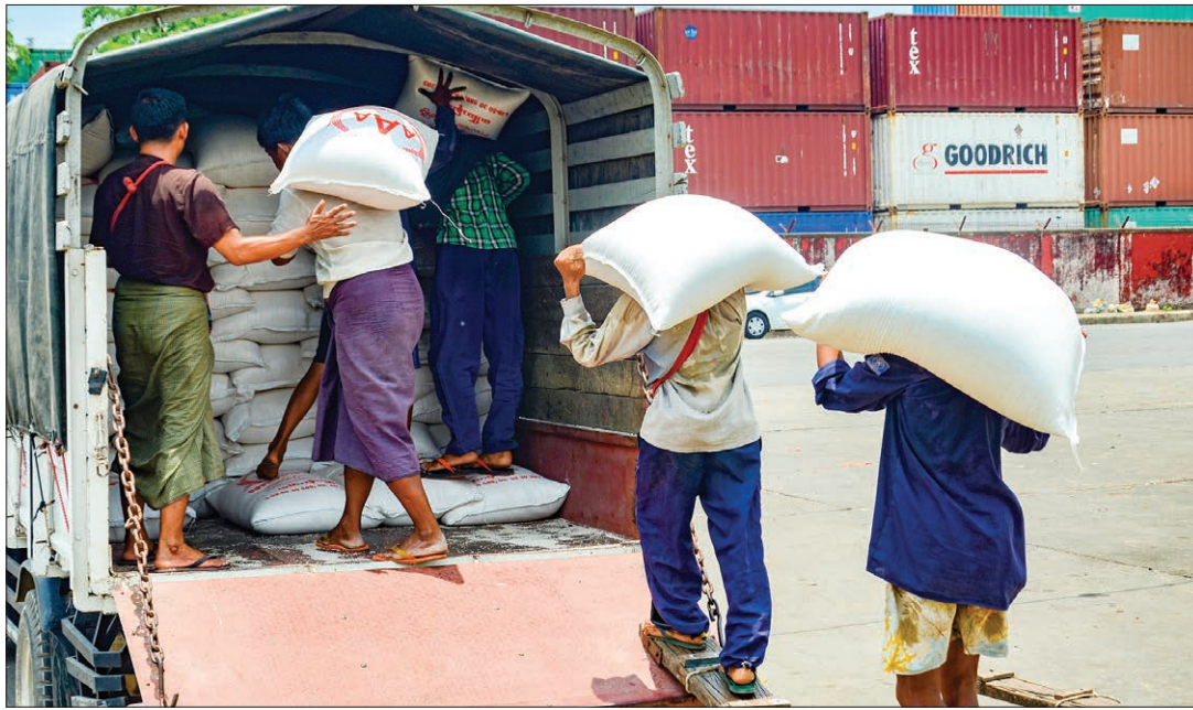
EU and African countries are the major markets for Myanmar rice.

to EU and African markets via maritime trade and to China through Muse border trade