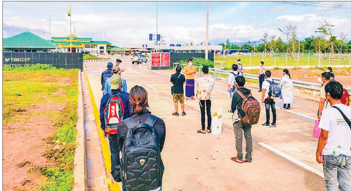
Myanmar nationals returned from Thailand queue for immigration process at the Myawady border on 10 July 2020.

A total of 560 Myanmar nationals returned home from Thailand through No.2 border bridge in Myawady Town, Kayin State, on 10 July.