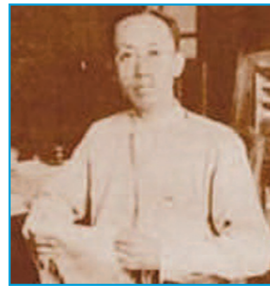
Thakhin Mya (7 October 1897 - 19 July 1947)