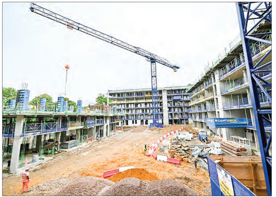
The lockdown to slow the spread of the novel coronavirus forced many construction sites to halt work.

Start times and breaks were staggered, a fingerprint entry scanner removed and employees had to declare themselves healthy every day.— AFP ■