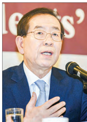
Seoul Mayor Park Won Soon speaks at a press conference in Seoul on Jan. 30, 2018, ahead of the Pyeongchang Winter Olympics opening on Feb. 9.

Since the coronavirus epidemic erupted late last year in the central city of Wuhan, China has charged hundreds of people with offences related to the crisis.—AFP ■