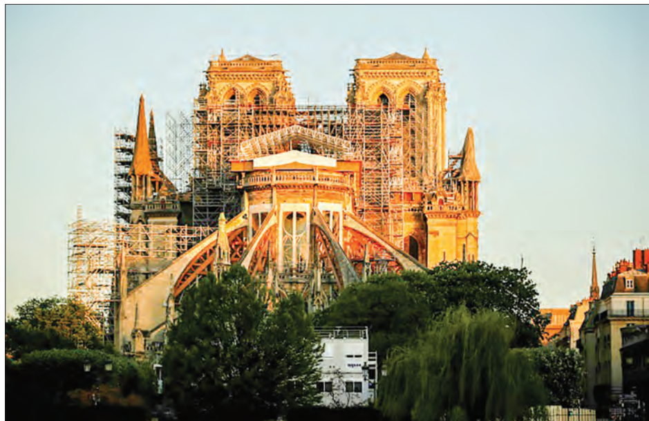
Notre-Dame was partly destroyed by fire in April last year.

PARIS — There is a "large consensus" that the spire of the fire-damaged Notre-Dame cathedral in Paris should be rebuilt as it was, France's