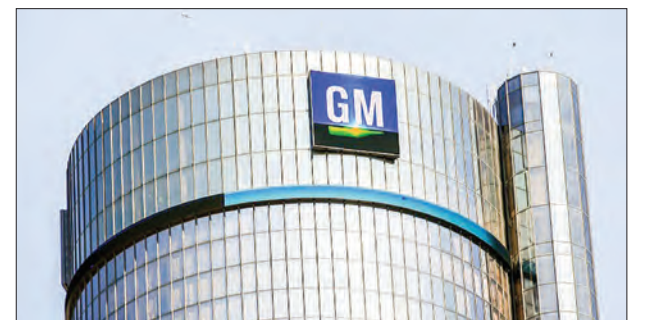
General Motors lost its complaint against Fiat Chrysler after a federal judge issued a stinging ruling.

"There is more than enough evidence from the guilty pleas of former FCA executives to conclude that the company engaged in racketeering and our complaint showed in detail how their multi-million dollar bribes caused direct harm to GM."—AFP ■