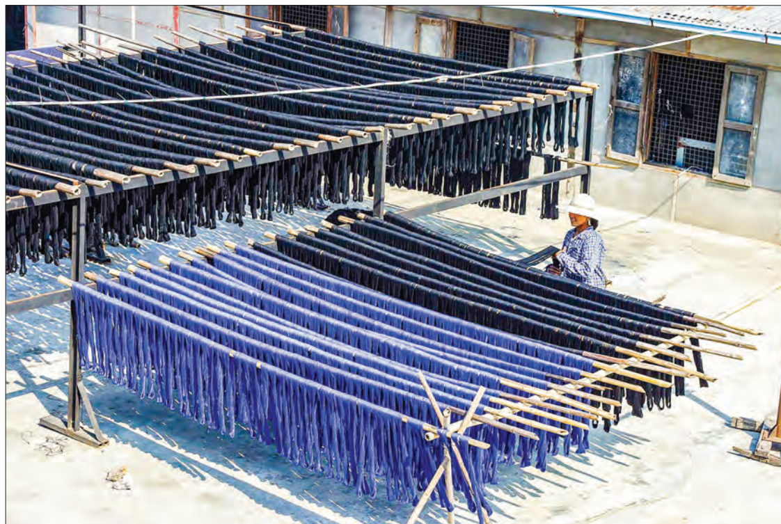
Government has put K100 billion into COVID-19 fund to remedy local businesses hit by the pandemic.

The applicants approved by the committee will be screened