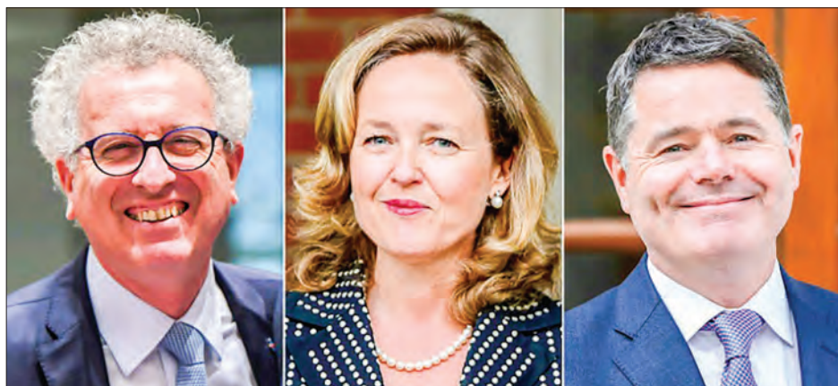
Eurozone finance ministers, known as the Eurogroup, will elect their new president on Thursday, filling a key job just as the continent is facing the worst recession in EU history.