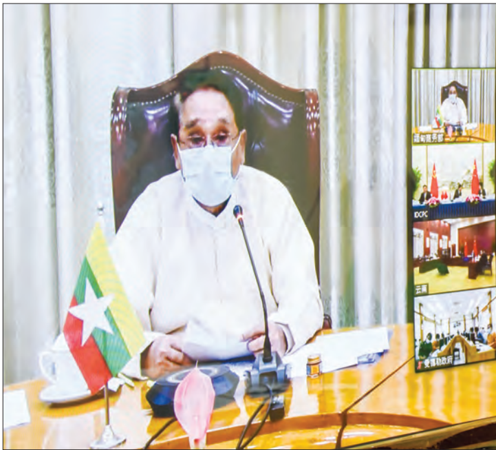
Union Minister for Commerce Dr Than Myint is seen at digital cooperation meeting between Myanmar and China on 9 July.

AN online meeting was held between the International Liaison Department of the Central Committee of the Communist Party of China (IDCPC), government of Yunnan Province, and Mandalay Region government at 1:30 pm yesterday.