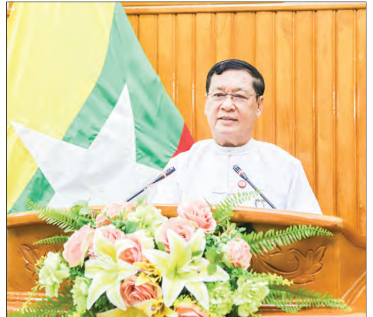
Union Minister U Thein Swe makes a pre-recorded video speech at the ILO Virtual Global Summit 9 July.

The Union Minister concluded his speech by saying that COVID-19 has killed many people and adversely affected