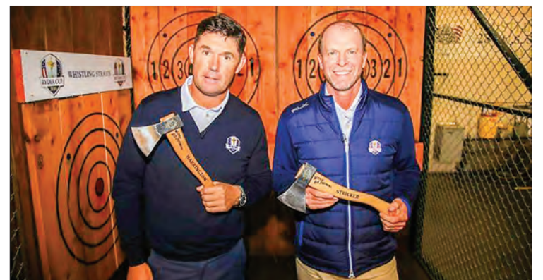
Europe Ryder Cup captain Padraig Harrington of Ireland, left, and US captain Steve Stricker will have to wait until next year for their golf squads to meet at Whistling Straits after organizers postponed the event until 2021 on Wednesday.