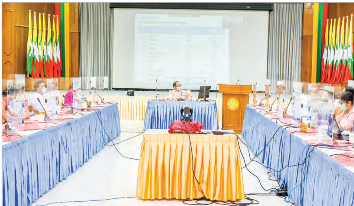
Union Minister Dr Myint Htwe discusses with local officials online on 9 July about challenges in the fight against COVID-19.