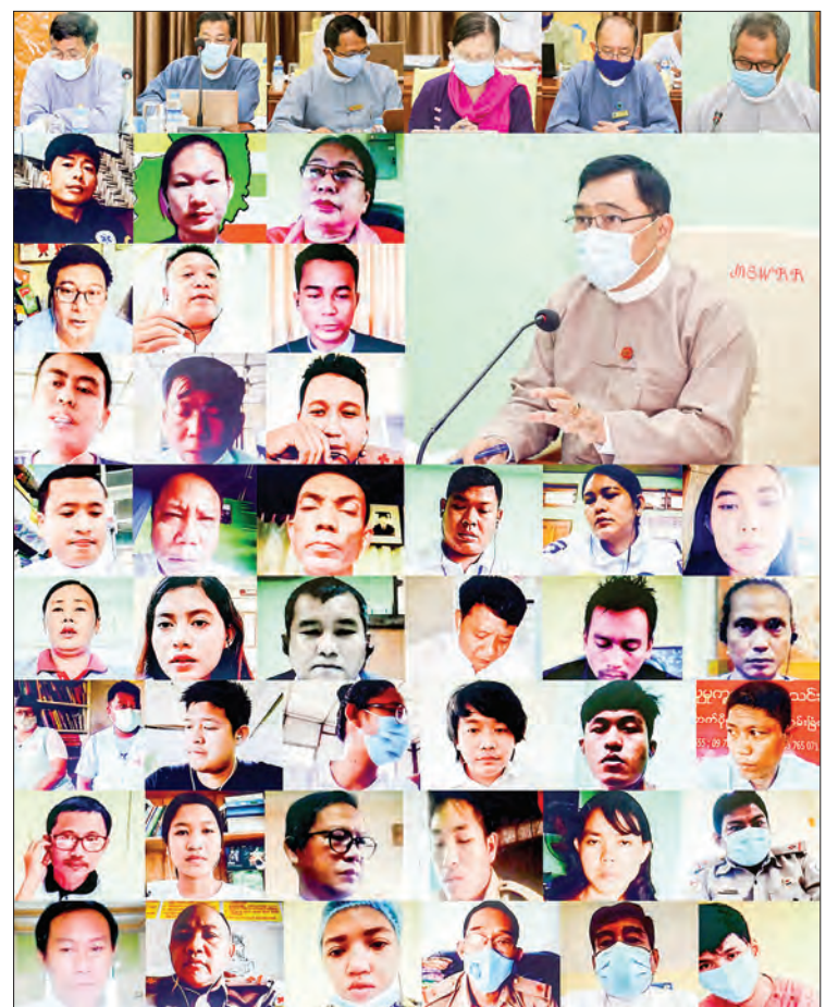
Union Minister Dr Win Myat Aye holds online meeting with Red Cross Society members and volunteers on 9 July.

The Union Minister said that they would support which could