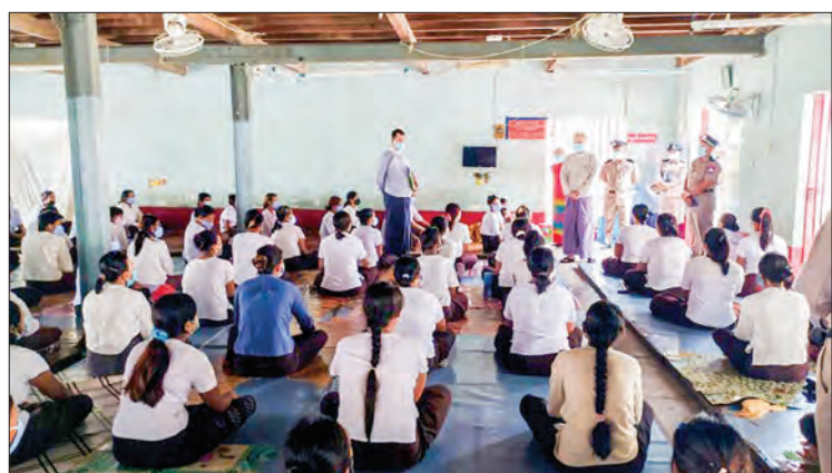
MNHRC officials discuss human rights situation in Insein prison on 9 July.