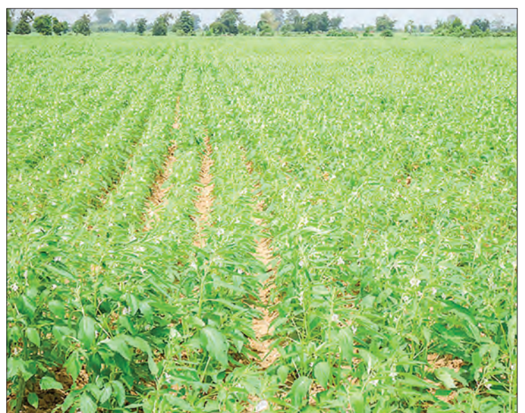
Magway Region mainly grow sesame. FILE PHOTO