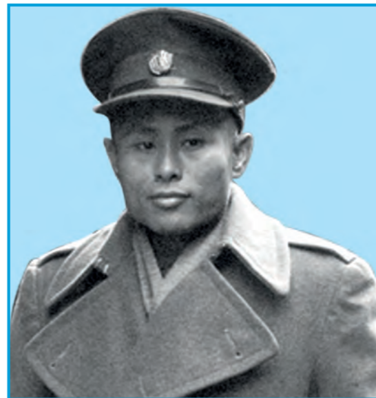
General Aung San (13 Feb 1915 -19 July 1947)

13 January 1947 -- He went to London to reclaim Independence.