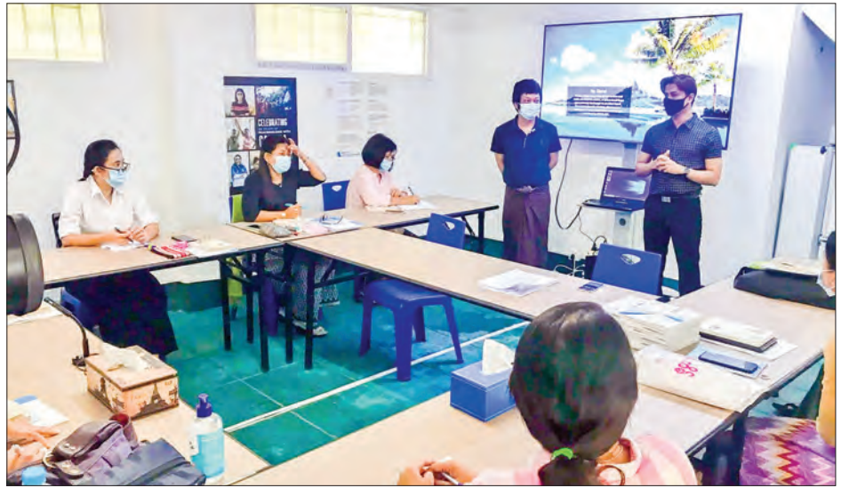
An advanced script writing course is in progress in Yangon on 9 July.