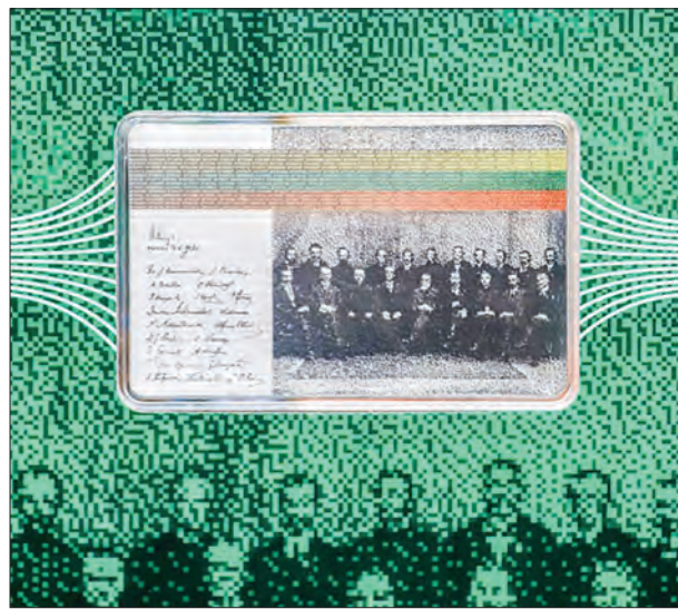
Lithuania's digital collector coin LBCOIN is not round but rectangular and made of silver.

Faced with mounting global criticism, the government is taking a fresh look at its heavy dependence on coal-fired power generation, which is used to meet about a third of energy needs in Japan where most nuclear power plants remain offline after the 2011 crisis at the Fukushima Daiichi complex.— Kyodo ■