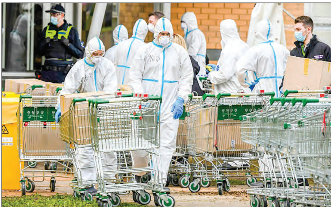
With no vaccine or effective treatment available, experts have warned that social distancing is necessary to contain the virus.

Shoppers in Victoria state -- of which Melbourne is the capital -- stripped shelves bare on Wednesday before the lockdown began, and the country's largest supermarket chain said it had reimposed buying limits on items including pasta, vegetables and sugar.—AFP ■