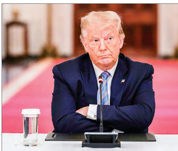
The US Supreme Court is set to rule on two cases involving the disclosure of President Donald Trump's finances.

Attorneys for Trump claim the president enjoys total immunity during his time in office, and that this is necessary so he can con-