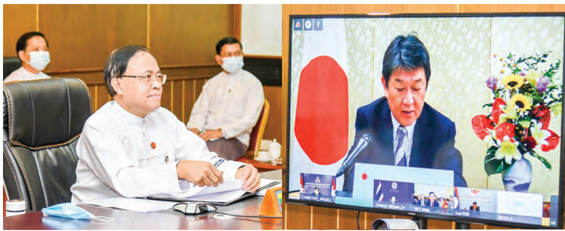
Union Minister U Kyaw Tin joins the 13 th Mekong-Japan Foreign Ministers' Meeting on 9 July.

UNION Minister for International Cooperation U Kyaw Tin participated in the Video Conference of the 13th Mekong-Japan Foreign Ministers' Meeting at 1:00 pm yesterday from the Ministry of Foreign Affairs, Nay Pyi Taw.