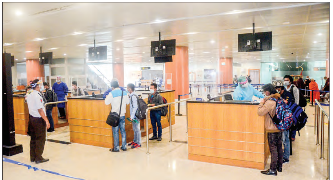
Myanmar nationals returned from Taiwan (China-Taipei) queue for immigration process at the Yangon International Airport on 9 July 2020.