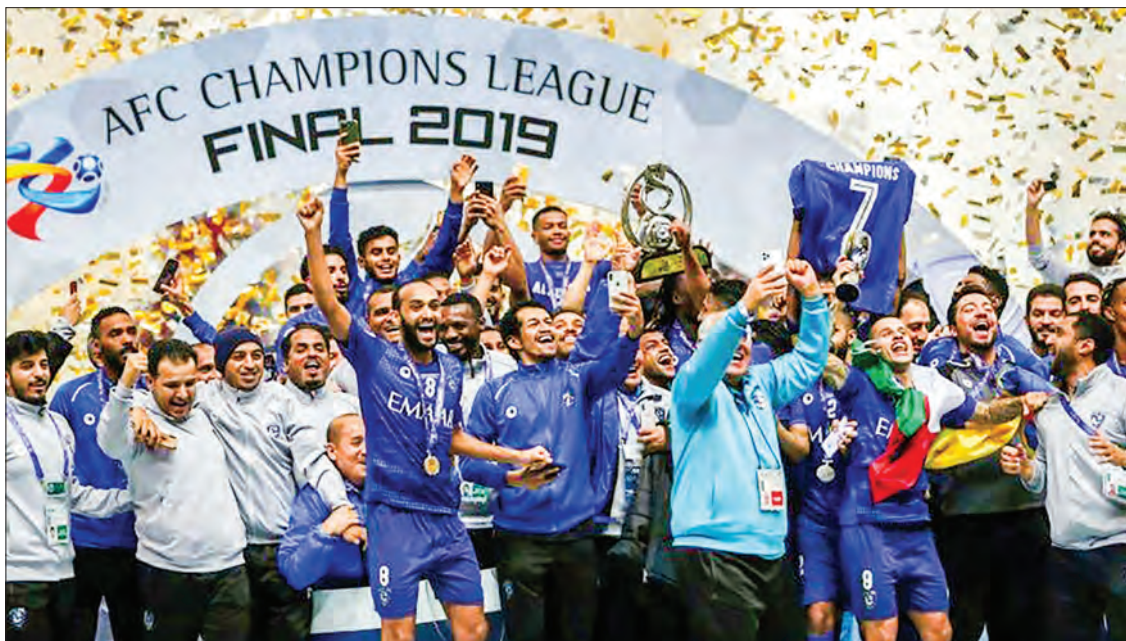
Al Hilal of Saudi Arabia celebrate victory in last year's AFC Champions League final against Japan's Urawa Red Diamonds.

KUALA LUMPUR — Asia's Champions League will resume in September with remaining group games played at centralized venues and a single-leg final in December, officials said Thursday following a six-month coronavirus hiatus.