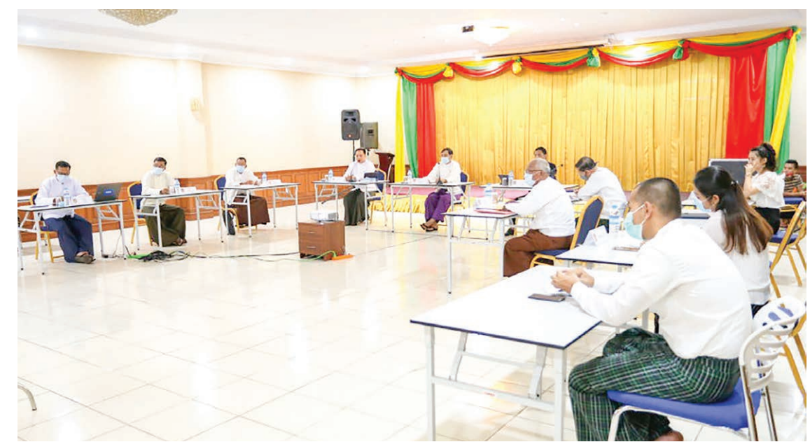
The meeting of the Myanmar Football Federation (MFF)'s Referee Committee is in progress at the MFF's meeting hall in Yangon on 7 July 2020.

They also detailed conducting of referee courses for skills development of the referees in regions and states, training U-14 youth referees,