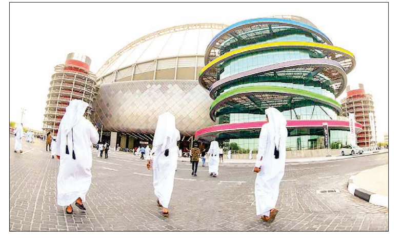
The organizers of the 2022 World Cup will lay off an undisclosed number of staff as gas-rich Qatar cuts costs amid the coronavirus economic downturn.

DOHA—The organizers of the 2022 World Cup will lay off an undisclosed number of staff as gasrich Qatar cuts costs amid the coronavirus economic downturn, several sources have told AFP.