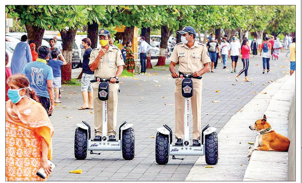
The National capital is in the third in position after Maharashtra and Tamil Nadu. Mumbai Police personnel patrolling on Hoverboards at Marine Drive in Mumbai on Sunday.

Despite signs of progress in parts of Europe -- where the Louvre museum in Paris reopened