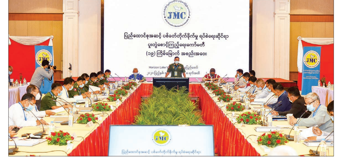
Chairman of the Union Joint Monitoring Committee (JMC-U) Lt-Gen Yar Pyae speaks at the 19<sup>th</sup> JMC-U meeting at the Horizon Lake View Hotel in Nay Pyi Taw on 7 July 2020.

It has been 4 years that JMCs was formed and because of this, the disputes among the organizations which signed the Nationwide Ceasefire Agreement have been reduced; that it can be seen that this can reduce the burden put on the people, and manage systematically the exploitation of the natural resources of those regions with the guidance; in the NCA signatory regions, the conflicts have been eliminated by solving the problems through negotiation and discussion between the two sides and that can be said the result of the signing the NCA. Before being able to hold JMC meetings, we could prevent conflict as civilian representatives by reaching to the respective areas; by the time we could not hold the official meetings, we sometimes go and meet in