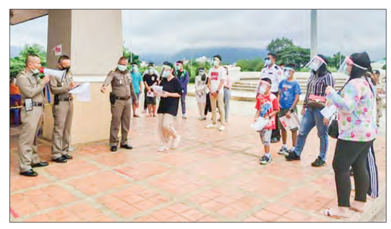
Myanmar authorities hand over 35 Thai nationals to their officials at Tachilek border crossing on 1 July.