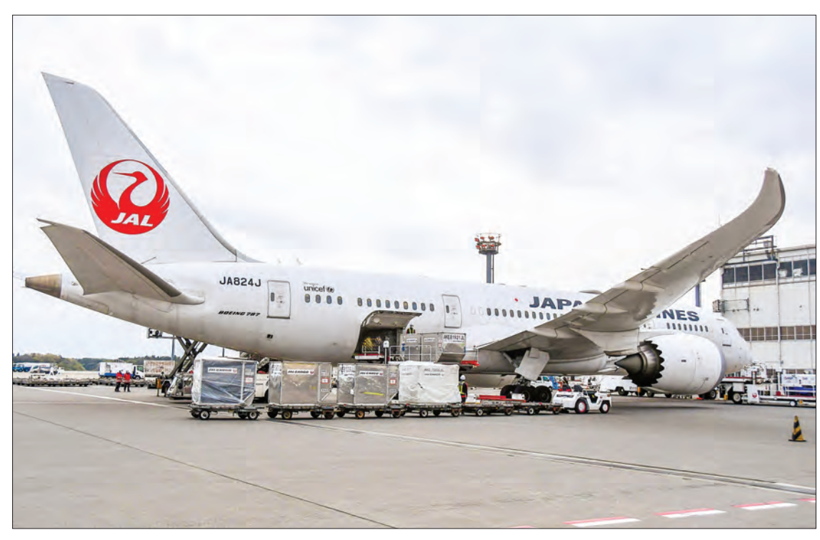
A Japan Airlines plane unloads cargo at Narita airport near Tokyo on April 17, 2020, after flying from Shanghai without carrying passengers. JAL has used many of its passenger planes for cargo transportation as many flights were cancelled due to the coronavirus pandemic.

However with infection rates rebounding in recent weeks in Tokyo and other large cities, Honda said, "We would like to increase the number of flights or use larger aircraft so that we can avoid fully-booked flights as much as possible."—Kyodo