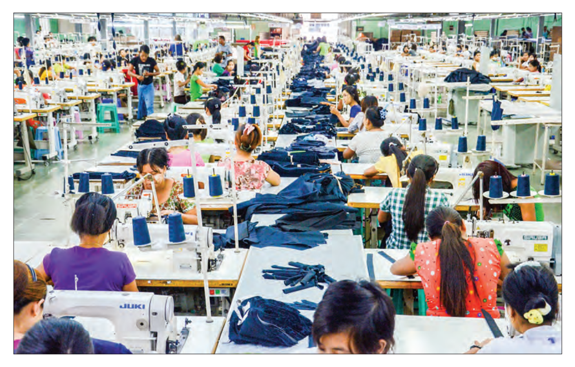
A file photo shows workers seen on a production line at a garment factory in Hlinethaya.

The manufacturing sector has attracted the most foreign investments in Yangon Region, with enterprises engaging in the