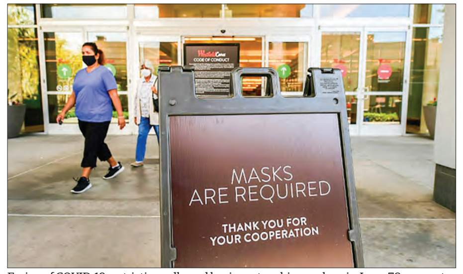
Easing of COVID-19 restrictions allowed business to rehire workers in June, 70 per cent of which were at small firms.

WASHINGTON —Industries hit hard by the coronavirus pandemic showed signs of life in June, hiring 2.4 million workers, payroll services firm ADP said Wednesday. The three million hires in May means that more than five million people are back at work of the 20 million who lost their jobs in March and April.