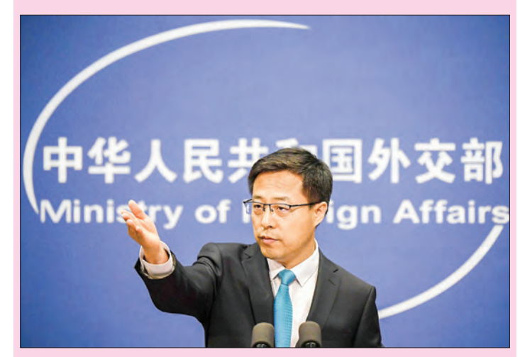
Chinese Foreign Ministry spokesman Zhao Lijian.

The U.S. approach is "based on Cold War thinking and ideological prejudice, which seriously damages the reputation and image of the Chinese media," Zhao told reporters, adding Beijing urges Washington to immediately "correct mistakes and stop political suppression".