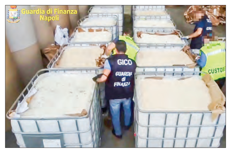
The amount of drugs seized were sufficient to satisfy the entire European market, police said. PHOTO: AFP

Cutting open the paper rolls and metal gearwheels with chainsaws, police found them filled with tablets imprinted with two semi-circles, the symbol of Captagon. Video images taken by police showed pills spilling out of the rolls and wheels as they were forced opened. "This is the largest seizure of amphetamines in the world," police said—AFP