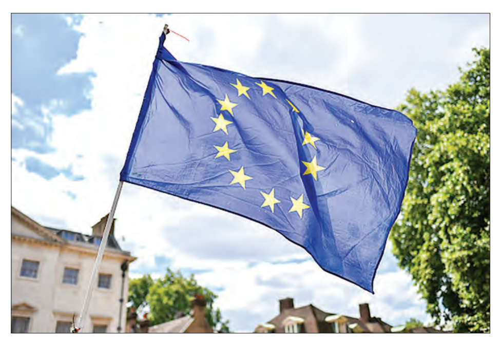
European Union flag (File photo).

Individual EU member nations can still impose their own measures on visitors from the 14 countries, including requesting them to quarantine. The other 12 on the list are Algeria, Australia, Canada, Georgia, Montenegro, Morocco, New Zealand, Rwanda,