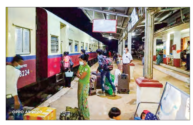
Myanmar returnees from China take a train from Lashio railway station on their way back home 1 July. PHOTO: NANG THANDAR 00