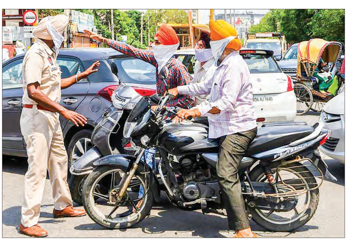
A police officer stops communters at a checkpoint during a nationwide lockdown as a preventive measure against the COVID-19 coronavirus, in Amritsar, India on May 4, 2020.

But since lockdown restrictions were lifted in June, cases have gone up, making India the