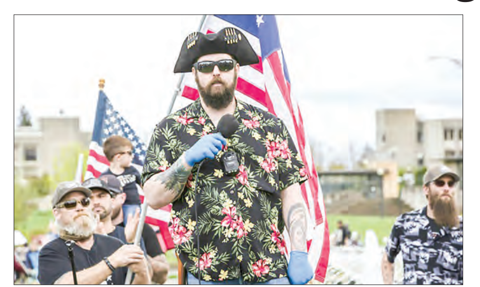
The "Boogaloo" movement (supporters pictured April 2020 in Olympia, Washington), which has adopted Hawaiian shirts as a uniform, promotes "a coming civil war and/or collapse of society".

ACEBOOK disrupted a "violent in a blog post. US-based anti-government netnews priority as it remained un-