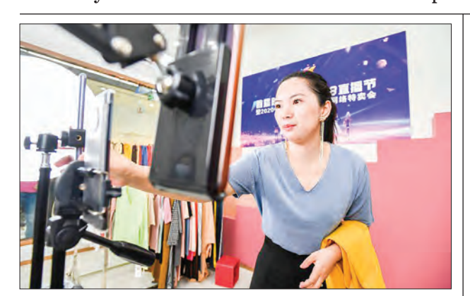
A young woman sells clothes in front of phone cameras via livestreaming on an e-commerce platform in Shaxi Town in Zhongshan City, south China's Guangdong Province, March 28, 2020.

Airbus warned that "compulsory actions cannot be ruled out at this stage", in an indication that some employees could be made redundant.— AFP