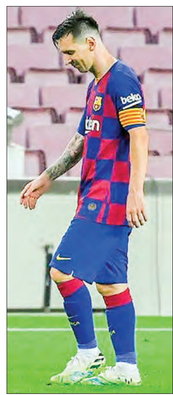
Lionel Messi's 700<sup>th</sup> career goal was not enough for Barca as they drew with Atletico. PHOTO: AFP

With a superior head-to-head, it would take a dramatic capitulation for Real Madrid not to lift the trophy from here but there is no guarantee Barcelona can finish strongly enough even to create pressure. This was their third draw in four matches and with suggestions of disharmony between the players and coaching staff, the future of coach Quique Setien looks bleak too.—AFP