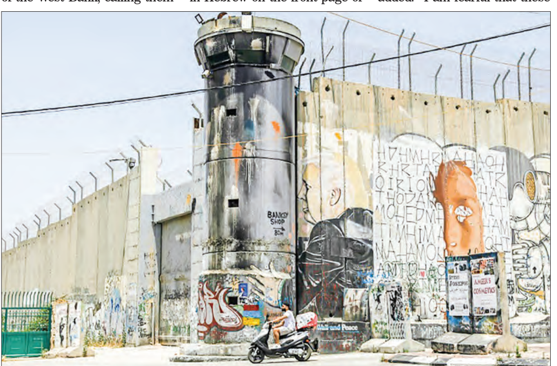
A mural painting of US President Donald Trump on Israel's controversial separation barrier in the West Bank city of Bethlehem.

Israel's top-selling daily, Yediot Aharonot. "So it is with sadness that I have followed the proposals to annex Palestinian territory," he added. "I am fearful that these