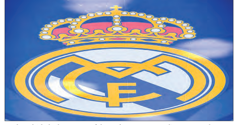
Real Madrid, the best team of the 20^{\rm th} century according to FIFA, has so far been one of the only elite clubs to resist the creation of a female team.

By taking over Tacon, the women's club based in Madrid and created in 2014, 'Real Madrid Femenino' will become a