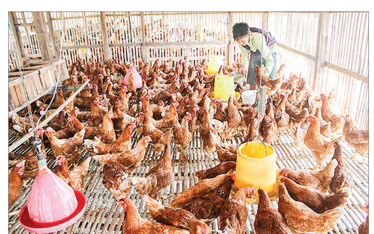
The Myanmar Livestock Federation engages in regular online meetings with livestock breeders to ensure the continued production of chicken eggs and meat, the staple protein sources of Myanmar, and keep the market prices stable.

"Livestock products such as meat, eggs and milk are easily perishable so when the travel restrictions were enforced, they could not be sent to the market