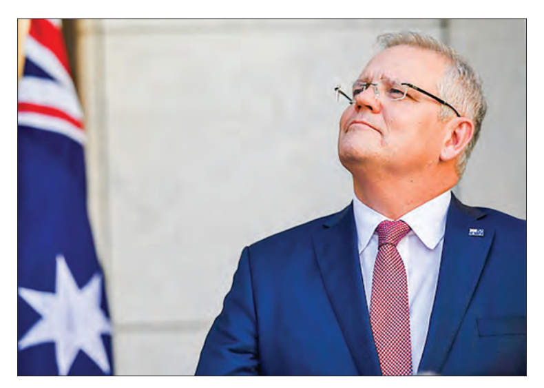
Australian Prime Minister Scott Morrison reacts during a press conference on March 20, 2020, in Canberra, Australia.

Australia will also add 800 personnel to its forces, the ma-