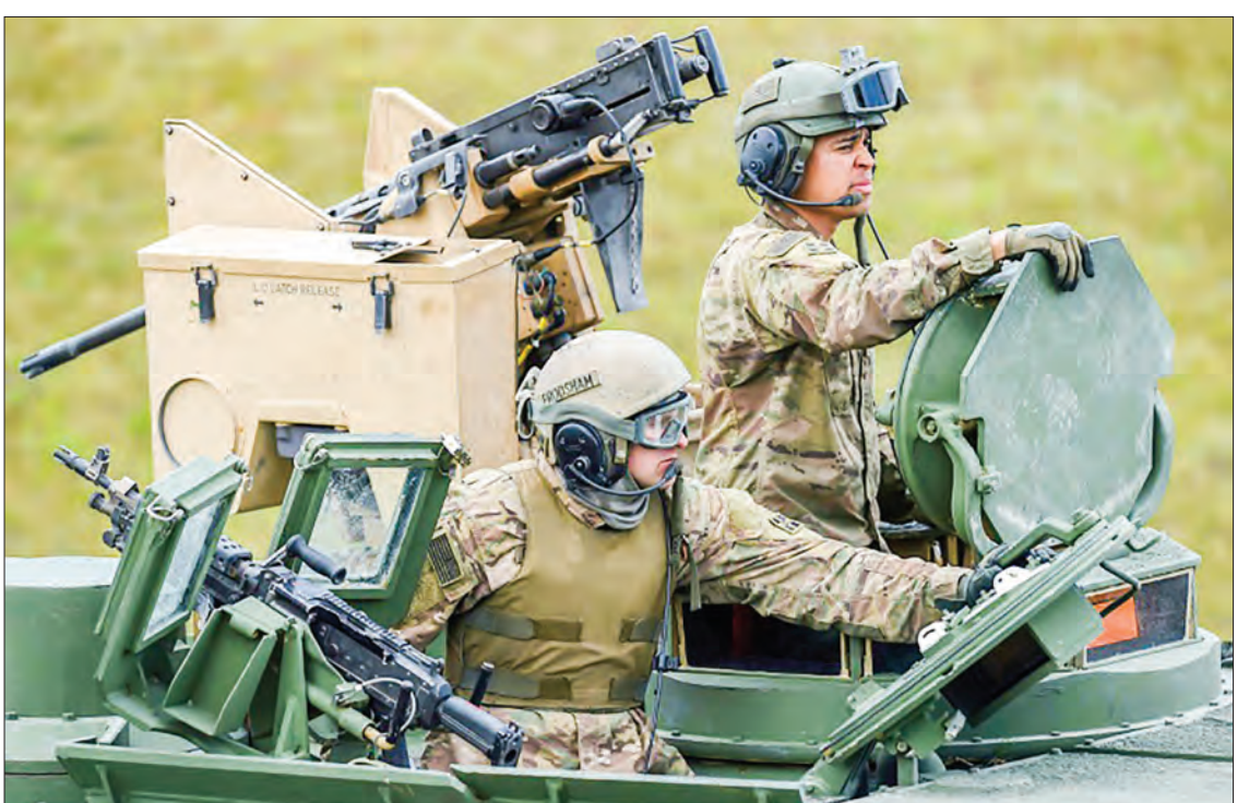
The move will cut the current US troop level in Germany from about 34,500 to 25,000, President Donald Trump's stated goal (US troops pictured near Grafenwoehr, Germany in 2017).

On June 15, two weeks after Chancellor Angela Merkel said she would not attend a Trump-planned G7 summit because of the coronavirus pandemic, Trump complained Berlin is not spending enough on its own defense and treats the United States "badly" on trade.—AFP ■