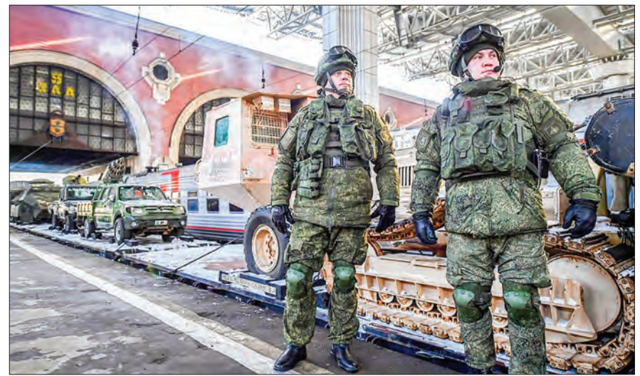
Russian troops stand next to a train with "Syrian turning point" exhibition items organized by the Russian Defence Ministry, as it waits to depart from Kazansky railway station in Moscow on Feb. 23, 2019.

THE COVID-19 pandemic is not significantly impacting Russia's armed forces, Defence Minister Sergei Shoigu said during a conference call on Tuesday.