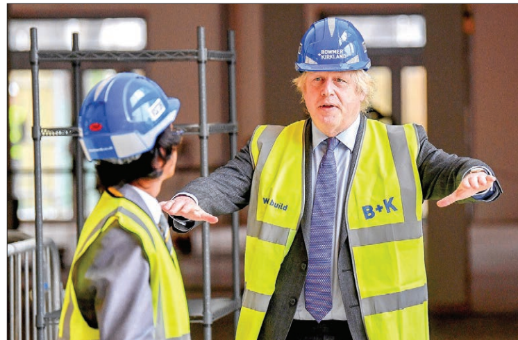
Britain's Prime Minister Boris Johnson talks with year-ten pupil Vedant Jitesh as he visits the construction site at Ealing Fields High School in west London on 29 June 2020.