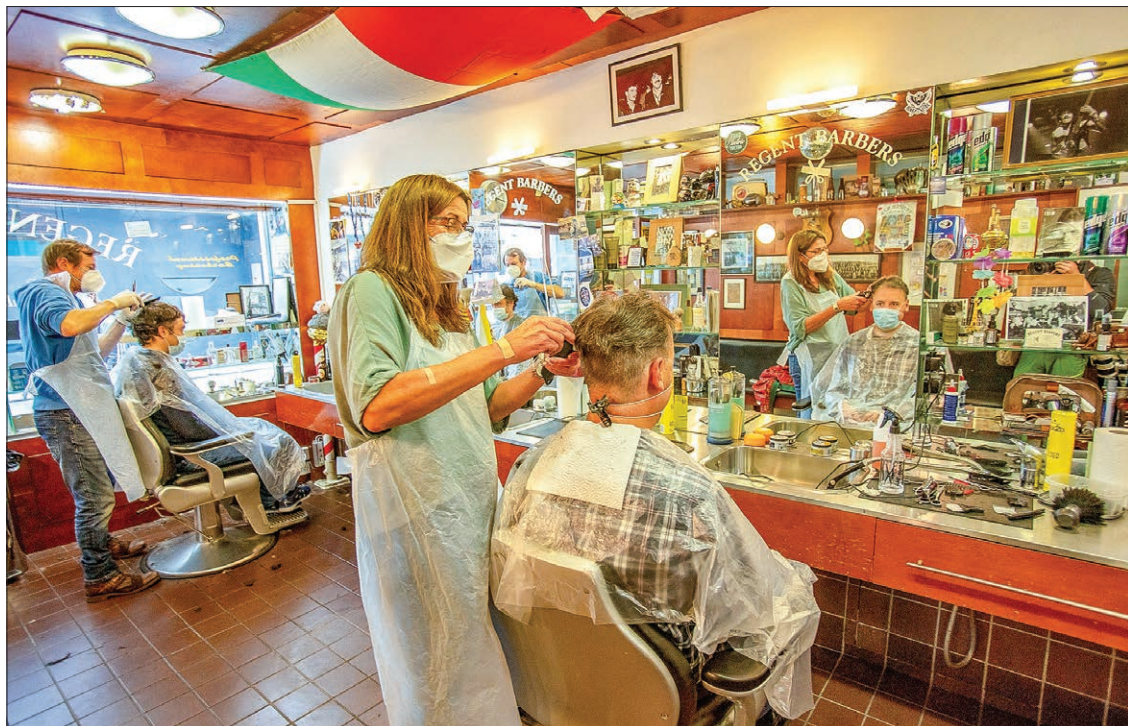
A hairdresser, wearing PPE (personal protective equipment), of a face mask or covering as a precautionary measure against spreading COVID-19, is reflected in a mirror as she cuts the hair of a customer, also wearing a face covering, in Dublin on 29 June 2020.

PARIS (France) — Here are the latest developments in the coronavirus crisis: