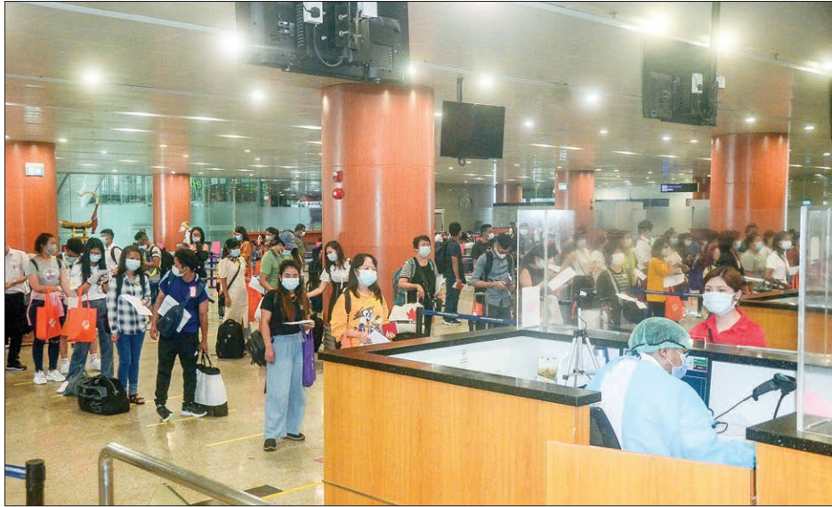
Myanmar returnees from Hong Kong and Macau are seen at Yangon International Airport on 29 June.