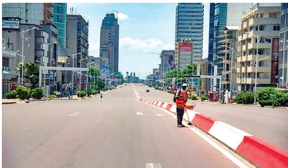
Gombe during lockdown. The district is an island of prosperity in a city rife with poverty and dysfunction.

An AFP journalist said barricades that had been erected to keep non-residents and key workers had been lifted on Monday. Kin-