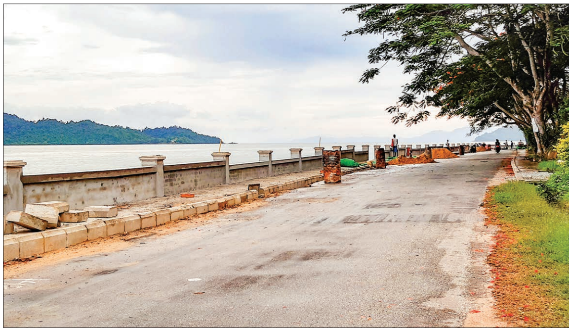
Circular road in Kawthoung, Taninthayi Region, is under renovation with railings and new pavement.