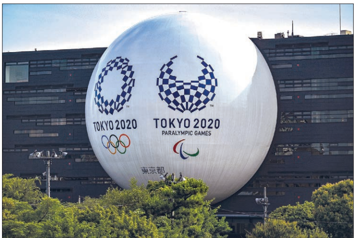
The Tokyo 2020 Olympic and Paralympic logos are displayed on the Hinomaru driving school building in Tokyo on June 29, 2020.