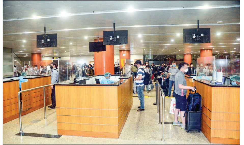
Myanmar nationals returned from Republic of Korea queuing for immigration process at Yangon International Airport on 29 June.

THE Myanmar National Airlines landed at Yangon International Airport at 3:20 pm with 121 nationals who were stranded in Hong Kong and Macau due to suspensions of flights to Myanmar amid the outbreak of COVID-19.