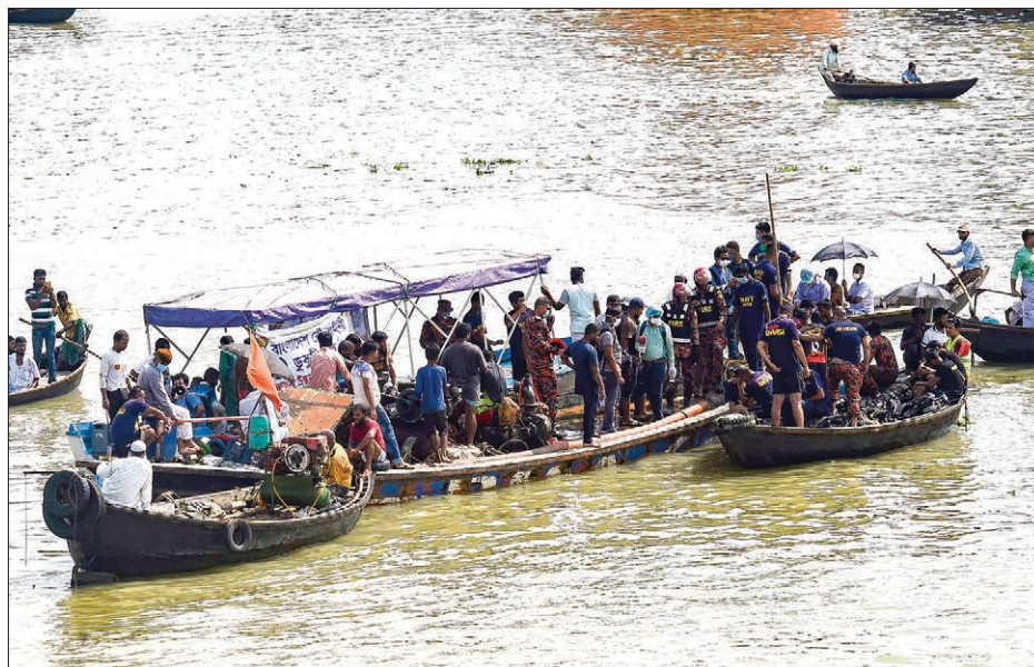
Rescue workers search for victims after a ferry capsized at the Sadarghat ferry terminal in Dhaka on June 29, 2020. At least 30 people died and a dozen are missing after a ferry capsized and sank on June 29 in the Bangladeshi capital Dhaka following a collision with another vessel, rescue officials said.

people died when an overcrowded ship collided with a cargo boat in a central Bangladesh river.—AFP ■