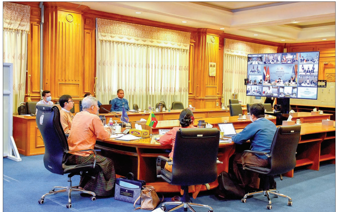
The 3 rd AIPACODD Meeting discusses narcotic controlled measures during COVID-19 pandemic and impacts on 29 June.

The meeting also approved the draft document of ‘Turning Words into Actions towards a Drug-free ASEAN Community’ which suggests building capacity and technical assistance for effective handling illegal drug problems locally, internationally and globally amid COVID-19, detailed measures in this issue, cooperation in fighting against cross-border actions, collaboration in sharing knowledge and enhancement of cooperation in the region and with other