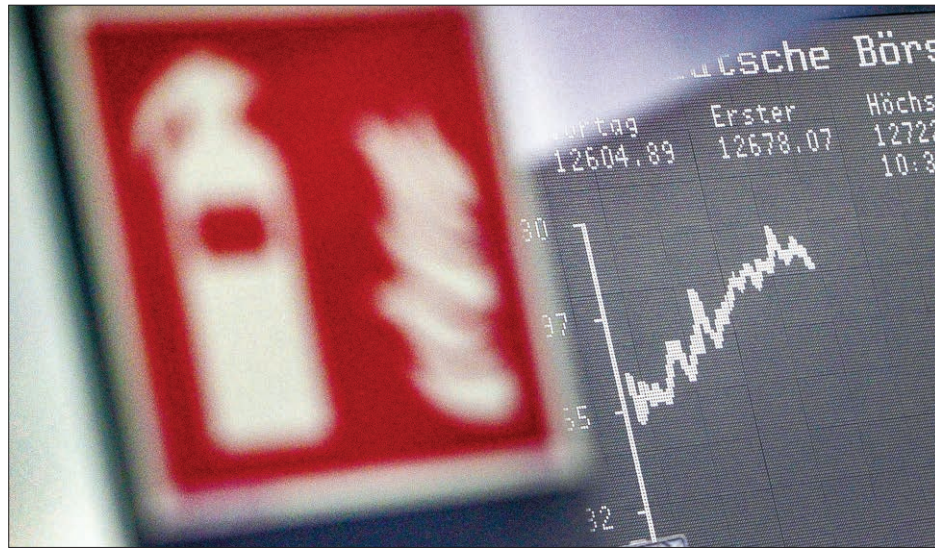
File photo shows A board displaying the chart of Germany's share index DAX is seen behind a sign indicating the location of a fire extinguisher on 1 June 2018 at the stock exchange in Frankfurt am Main, western Germany.

LONDON (United Kingdom) — Europe's stock markets edged higher on Monday as investors balanced easing global lockdowns against news of surging coronavirus infections in several countries including the United States.