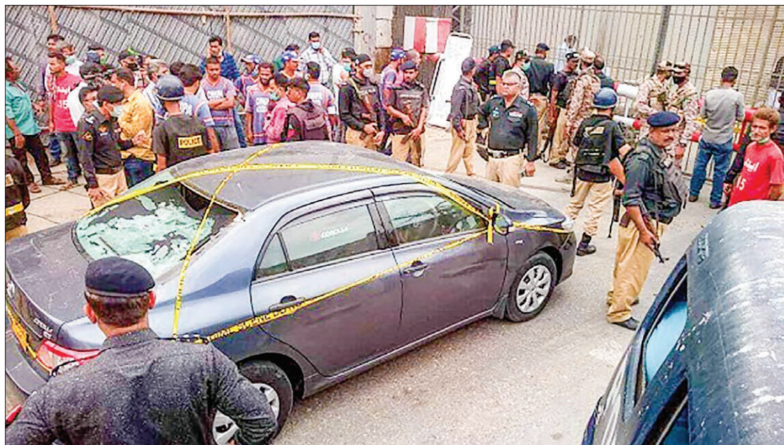
Police officers inspect the site after gunmen attacked the Pakistani stock exchange building in Karachi, Pakistan on 29 June.

KARACHI (Pakistan) — Baloch separatists opened fire and hurled a grenade at the Pakistan Stock Exchange in Karachi Monday, authorities said, killing six people including a policeman.