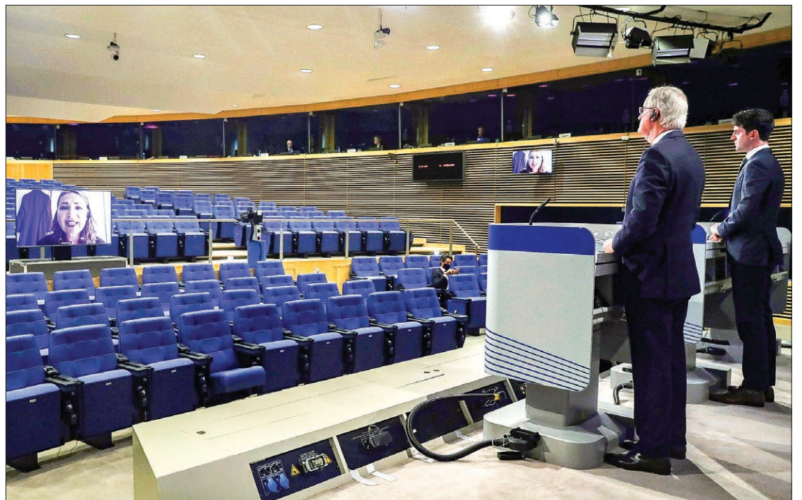
EU's Brexit negotiator Michel Barnier gives a press conference after a Brexit negotiations meeting, at the EU Commission, in Brussels on 5 June 2020.

German Chancellor Angela Merkel -- whose government takes over the presidency of the EU next week -- has also sharpened her public stance, questioning whether London actually