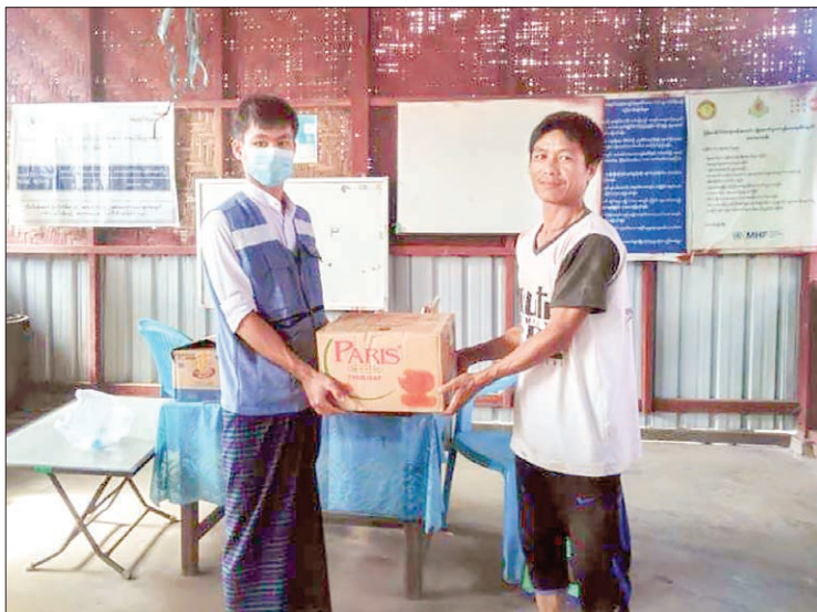
An official is providing relief aid of COVID-19 at an IDP camp on 29 June.

MINISTRY of Social Welfare, Relief and Resettlement is carrying out COVID-19 prevention,