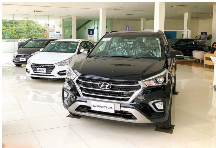
Hyundai Motor Myanmar promotes four kinds of its vehicles with special sales from 9 June to end of July.

HYUNDAI Motor Myanmar has recently introduced a sales promotion for Myanmar customers. ‘Hyundai Gold Promotion’, they named it, includes four kinds of vehicle models — Tucson, Creta, Accent, and Grandi10, according to the company.