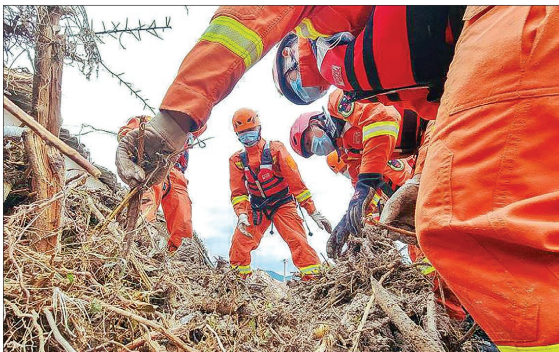
Rescuers work in Yihai Town of Mianning County, southwest China's Sichuan Province, June 28, 2020.

Rescue and relief efforts are underway.—Xinhua ■