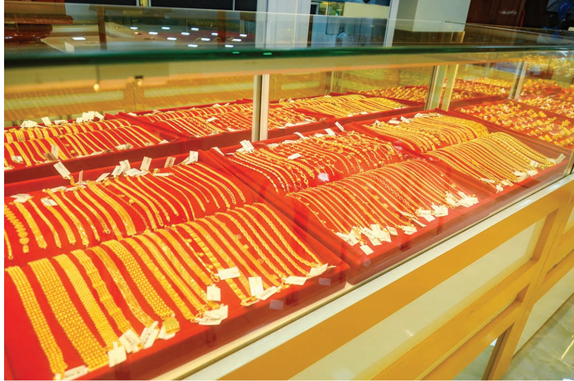
Gold jewellery on display at a shop in Yangon.

“The domestic gold price should have reached K1.3 million along with a rise in the global gold market. Myanmar people like to wear gold accessories. It is a kind of investment for local people. Some cash out gold during an emergency. When some purchased gold at K1.2 or 1.3 million,