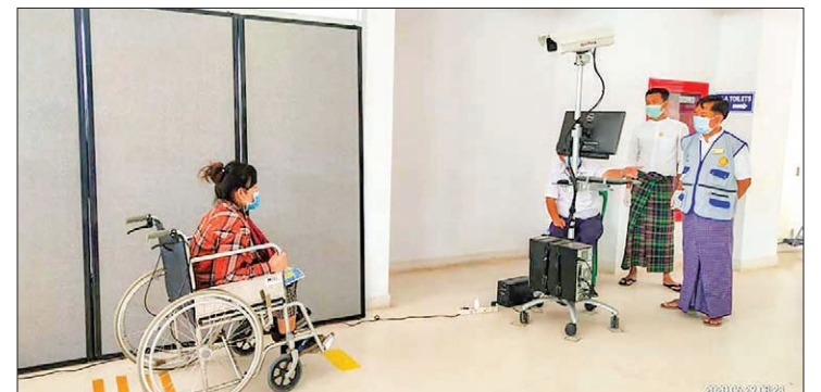
Health workers are conducting medical tests to a returnee from Thailand at Myawady border Town on 29 June.

A total of 608 Myanmar nationals returned home from Thailand through No. 2 border bridge in Myawady Town, Kayin State, on 29 June.