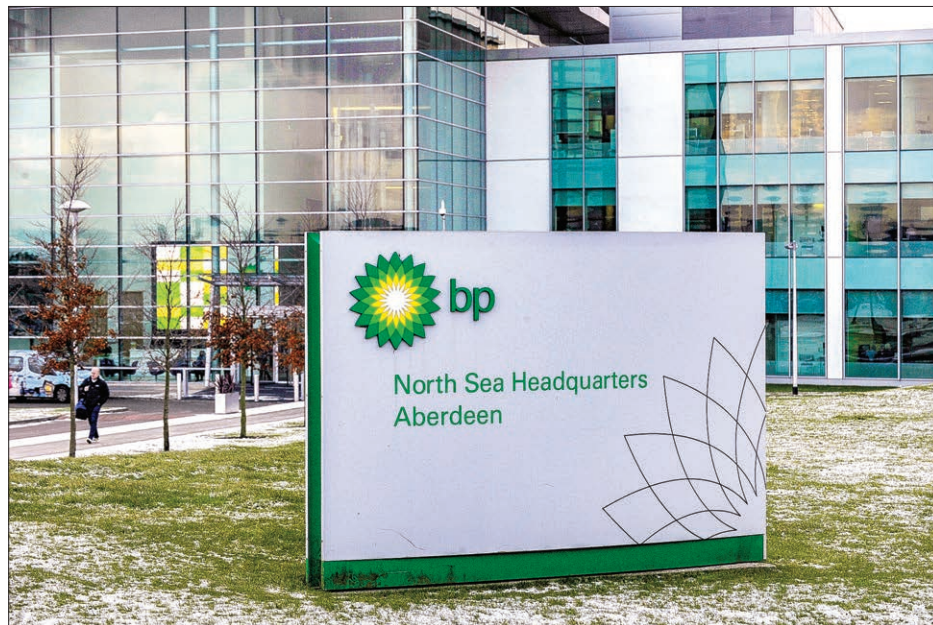
File photo shows the headquarters of BP (British Petroleum) are seen, in Aberdeen, Scotland on 21 January 2015.

Prices have however rebounded sharply in recent weeks as govern-