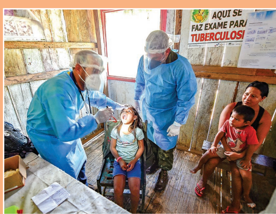
Doctors of the Brazilian Armed Forces check an indigenous child of the Mayoruna ethnic group, in the Cruzeiroinho village, near Palmeiras do Javari, Amazonas state, northern Brazil, on June 18, 2020, amid the COVID-19 pandemic.

And despite emergency measures which ban gatherings of more than 10 people, thousands thronged trendy districts of Paris late Sunday to mark the annual midsummer Festival of Music, which usually brings millions of people out onto the streets. — AFP ■