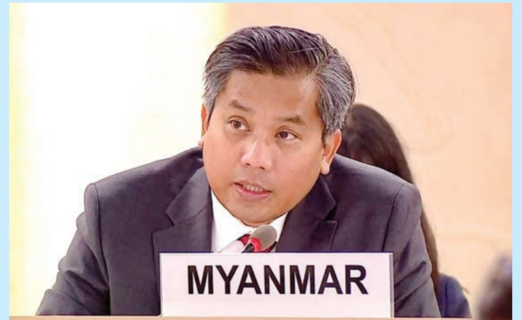
Permanent Representative of Myanmar U Kyaw Moe Htun.

difficult democratic transition and is facing many challenges in its endeavours to promote sustainable peace, national reconciliation, and development throughout the country. Despite these challenges, achievements have been made in many sectors. Finally, the international community should extend helping hands to Myanmar, instead of imposing impediments on Myanmar. Particularly at present, Myanmar, like others, is addressing the unexpected challenges posed by Covid-19 pandemic. Myanmar’s response to the pandemic is based on the principle of “leaving no one behind”. The State Counsellor points out that people are the key by stressing, “we place value on the people and derive our strength from the people. We are striving to overcome the dangers of this disease by building up the spirit of all for one and