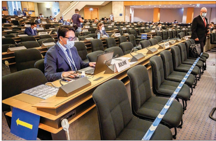
Delegates wearing a protective face mask attend the resuming of a UN Human Rights Council session after its interruption in March over the coronavirus pandemic on 15 June 2020 in Geneva.

GENEVA (Switzerland) — The UN Human Rights Council on Monday adopted a resolution ordering a “fact-finding mission”