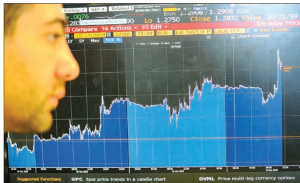
A journalist poses while looking at a computer screen with the Bloomberg display showing a three-day view showing the rise and fall in the value of the pound sterling against the US dollar in London on October 17, 2019 with a spike (R) at the moment of the announcement of a draft Brexit deal.

LONDON (United Kingdom) — Stock markets mostly dropped Monday and the dollar fell as investors kept a nervous eye on a spike in coronavirus infections around the world, while Europe pressed ahead with the easing of lockdown measures.