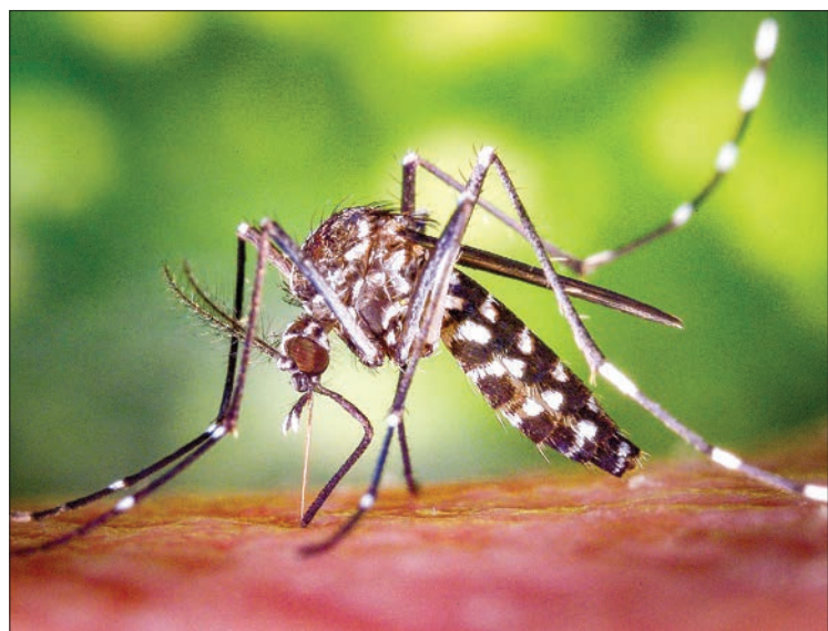
Supplied photo shows an Asian tiger mosquito.

JAKARTA — The number of dengue fever cases is spiking in Indonesia, health officials said Monday, as the country battles to stem the spread of the new coronavirus.