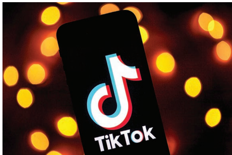
This photo taken on 21 November 2019, shows the logo of the social media video sharing app Tiktok displayed on a tablet screen in Paris.

BRUSSELS (Belgium) — The social media phenomenon TikTok joined the EU's code of conduct on Monday as tech giants seek to persuade Europe to back away from setting laws against hate speech and disinformation.