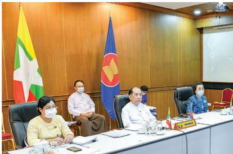
Director-General of the ASEAN Affairs Department of the Ministry of Foreign Affairs U Hau Khan Sum participates in the 2 nd Meeting of ACCWG on PHE and the Joint Consultative Meeting via videoconference on 22 June 2020.

U Soe Han, Permanent Secretary of the Ministry of Foreign Affairs participated in the ASEAN Senior Officials’ Preparatory Meeting (Prep-SOM). The Meeting discussed and exchanged views on ASEAN Community Building efforts, applications of non-regional countries to accede to the Treaty of Amity and Cooperation, follow up to the Special ASEAN and ASEAN Plus Three Summits on COVID-19, preparations made for the Informal Meeting of ASEAN