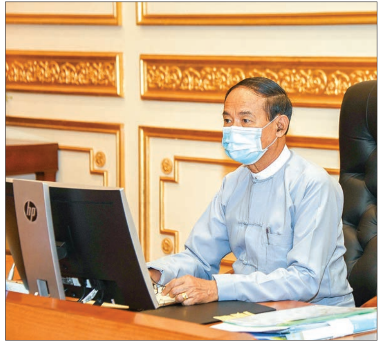
President U Win Myint chairs the Finance Commission's second edition meeting for 2020 at the Presidential Palace in Nay Pyi Taw on 22 June 2020.

P RESIDENT U Win Myint, in his capacity as the Chairman of the Finance Commission, made an address at the second meeting of the commission for this year at the Presidential Palace in Nay Pyi Taw yesterday.