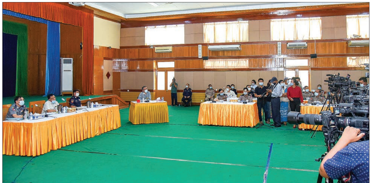
Senior officials from the Ministry of Home Affairs give press briefing on their fourth-year performances in Nay Pyi Taw on 22 June 2020.