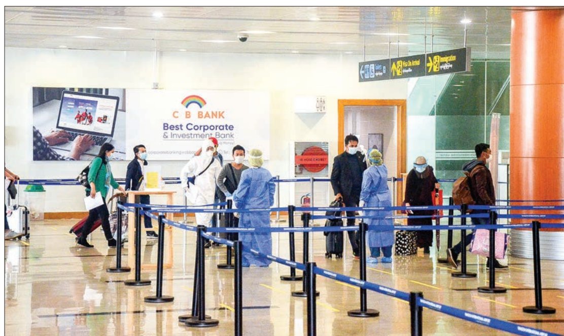
Myanmar nationals returned from Britain and other European countries queue for immigration processes at the Yangon International Airport on 22 June 2020.