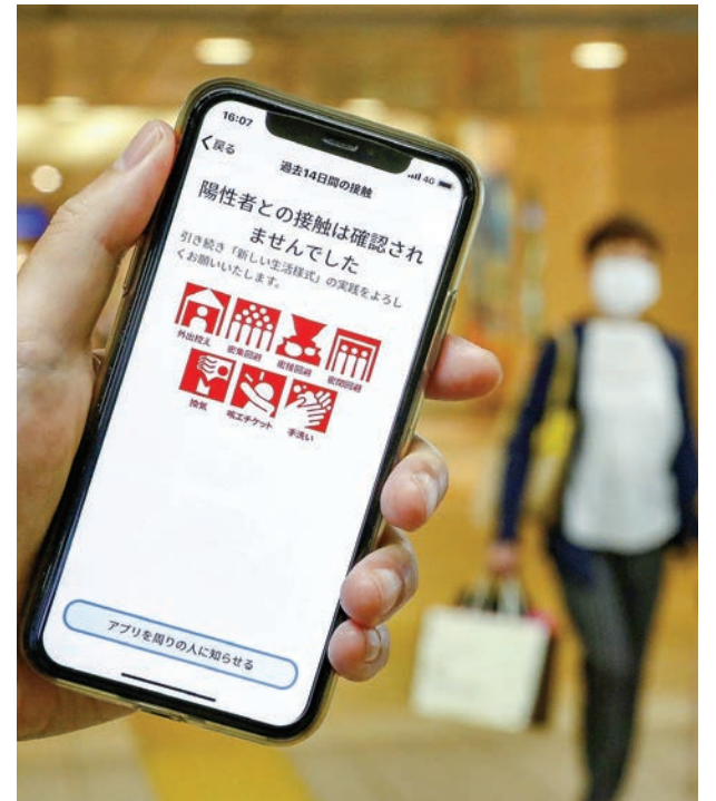
Photo taken on 19 June 2020, in Tokyo shows a free smartphone application launched by the Japanese government, which alerts users that they may have been in close proximity to someone infected with the novel coronavirus.

The government has not given a target per cent for the app's usage, but overseas research shows that at least 60 per cent of people in a country should use such a system to make it practical. —Kyodo News ■