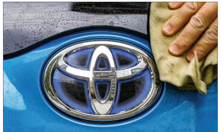
A Toyota Motor Corp. logo on a Prius PHV is polished on 9 May 2018, at a Toyopet dealership for the automaker’s vehicles in Tokyo’s Shibaura area.

The carmaker has said it expects the sales drop due to the coronavirus to have bottomed out in April and that sales will gradually recover to levels seen a year earlier toward the end of this year.—Kyodo News ■