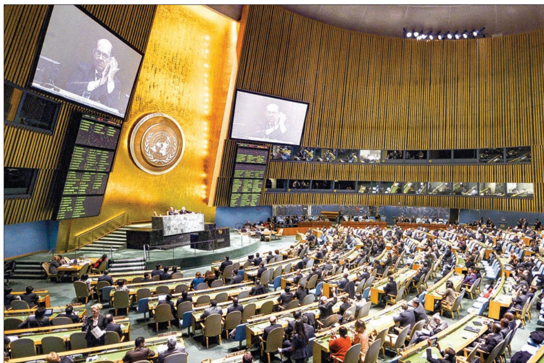
File photo shows delegates to the United Nations General Assembly on 2 April 2013 applaud the passage of the first UN treaty regulating the international arms trade.

products to sovereign countries and not to non-state actors, Zhao said at a regular briefing.