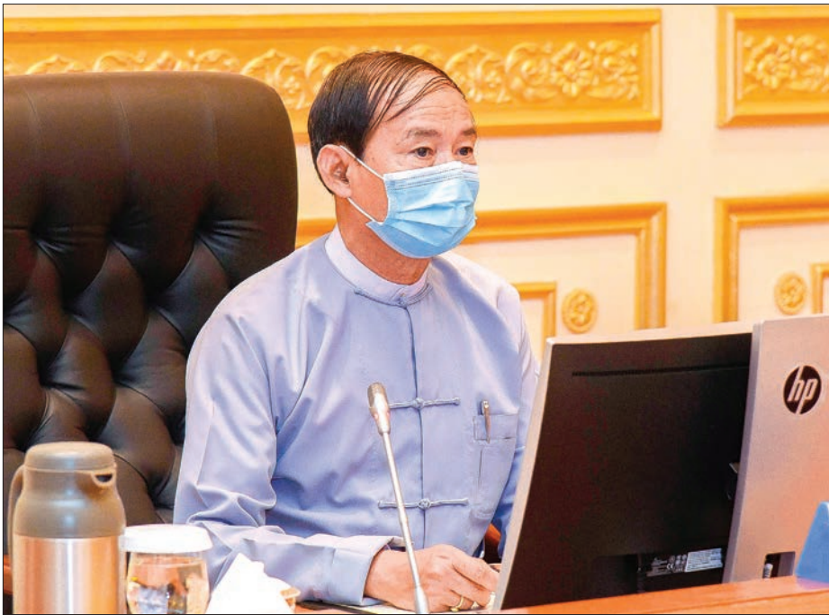
President U Win Myint seen addressing National Planning Commission meeting in Nay Pyi Taw yesterday.

P RESIDENT U Win Myint, in his capacity as the Chairman of the National Planning Commission, attended the commission's first meeting for the year held at the Presidential Palace in Nay Pyi Taw yesterday morning.