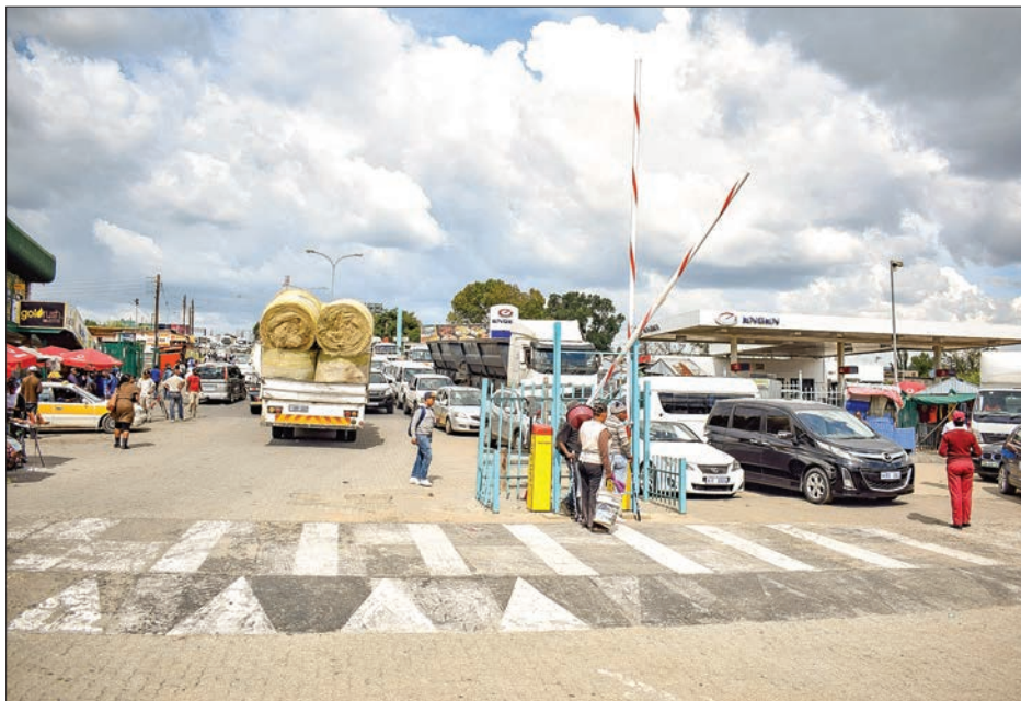
A queue of cars are seen at the Maseru Bridge border post between Lesotho and South Africa on 24 March 2020, as residents and retailers of Lesotho head to South Africa to stock up on groceries and other essential goods after South African President Cyril Ramaphosa announced a 21-day national lockdown for South Africa to start later this week to contain the spread of the COVID-19 coronavirus.

Mboweni on Wednesday is due to present a revised budget after government announced an unscheduled 500-billion-rand ($29.7-billion, 26-billion-euro) economic stimulus and social relief package, including 100 billion rand for job protection. —AFP ■