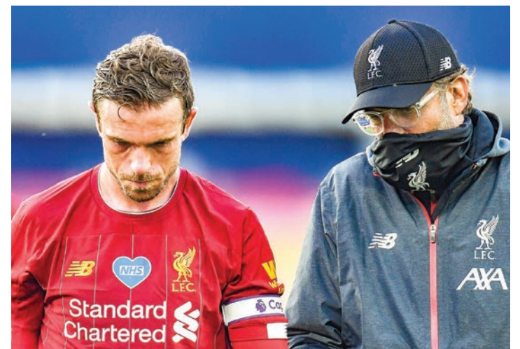
Liverpool's English midfielder Jordan Henderson (L) and Liverpool's German manager Jurgen Klopp (R) talk as they leave the pitch at the end of the English Premier League football match between Everton and Liverpool at Goodison Park in Liverpool, north west England on 21 June 2020.

"It was just a difficult game. Physically, we were ready, which was important.— AFP ■