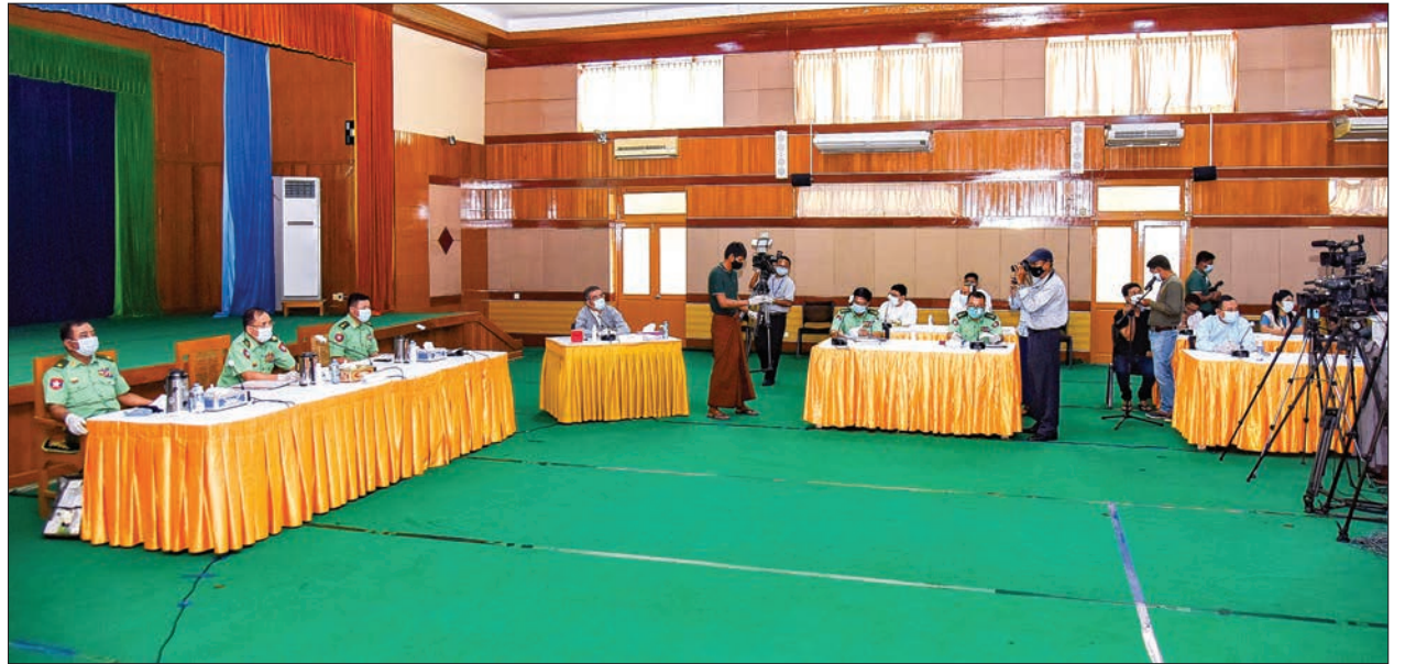
Ministry of Defence makes a press briefing on their 4th-year performances in Nay Pyi [Taw on 22 June 2020.

The Permanent Secretary and officials answered to the media questions about the businesses and