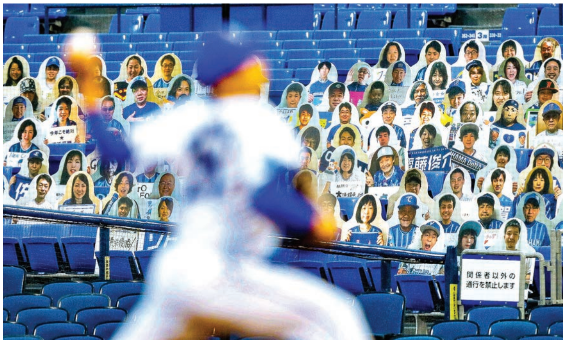
Boards with fans' faces are in the stands at Yokohama Stadium on 19 June 2020.