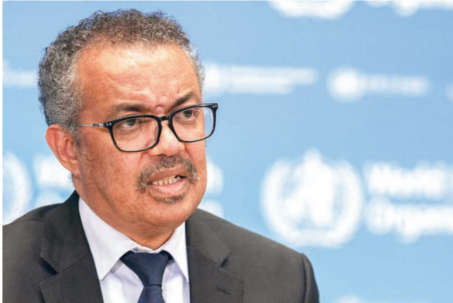
This handout image provided by the World Health Organization (WHO) on 27 May 2020 in Geneva shows WHO Director-General Tedros Adhanom Ghebreyesus during the launch of a new foundation for private donations, amid the COVID-19 pandemic, caused by the novel coronavirus.

DUBAI (United Arab Emirates) — The novel coronavirus pandemic is still accelerating and its effects will be felt for decades, the World Health Organization's director-general told an online conference on Monday.