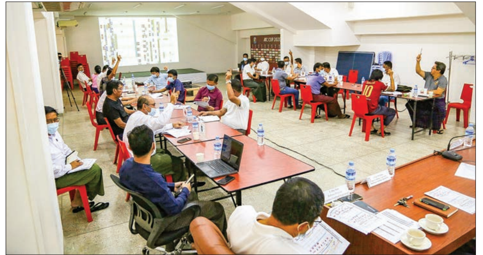
The meeting between officials from the Myanmar National League (MNL) and MNL clubs is in progress at the Thuwunna Stadium's meeting hall in Yangon on 22 June 2020.