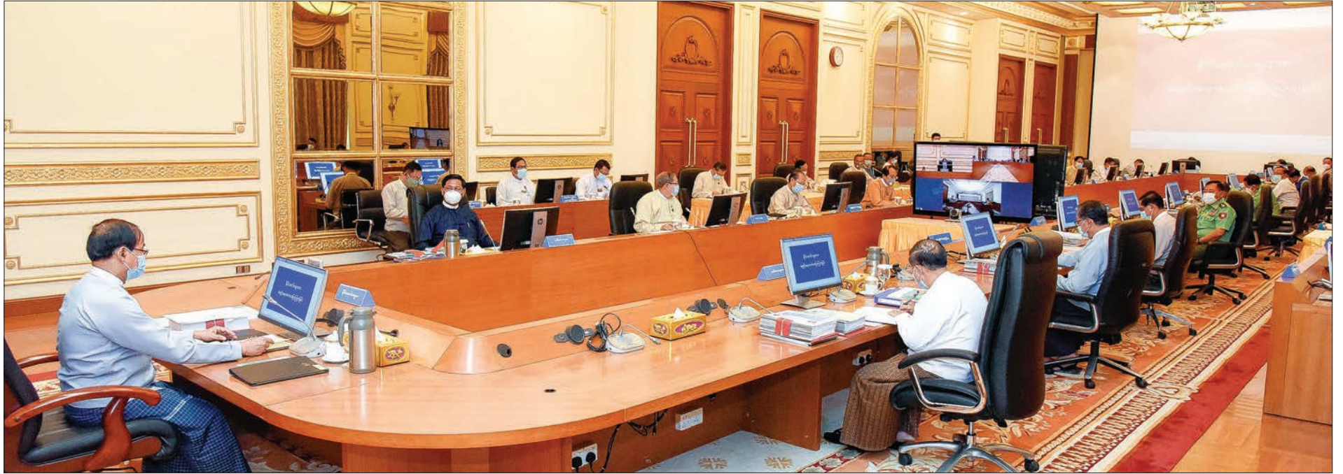
President U Win Myint, in his capacity as the Chairman of National Planning Commission, participates in the commission's first edition meeting for 2020 at the Presidential Palace in Nay Pyi Taw on 22 June 2020.