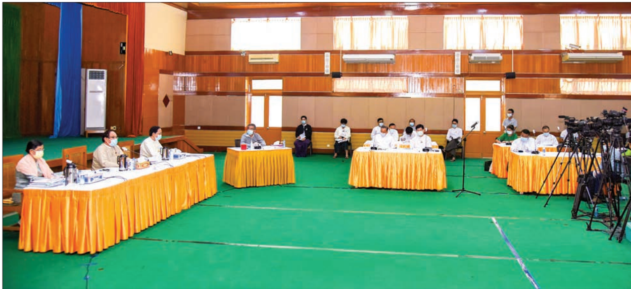
Ministry of Health and Sports holds press conference on their fourth-year performances in Nay Pyi Taw on 22 June 2020.

T HE Ministry of Health and Sports, the Ministry of Home Affairs, and the Ministry of Defence held press briefings on their 4 th -year performances in Nay Pyi Taw yesterday.