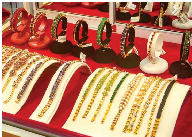
Gold jewellery on display at a shop in Yangon.

domestic market cannot raise the price owing to the restriction on international commer-