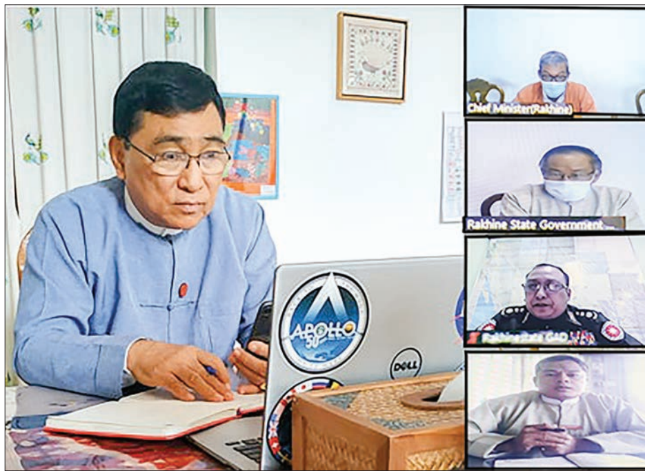
Union Minister Dr Win Myat Aye holding the virtual meeting to discuss closure of Kyauktalone Internally Displaced Persons Camp in Kyaukpuy, Rakhine State.

UNION Minister for Social Welfare, Relief and Resettlement Dr Win Myat Aye held an online meeting with Rakhine State Chief Minister U Nyi Pu and state cabinet members regarding the closure of Kyauktalone IDP camp in Kyaukpuy Township yesterday.