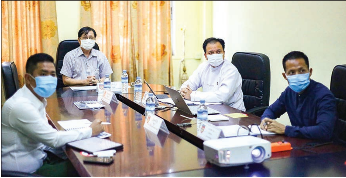
Myanmar Football Federation officials seen in the coordination meeting to discuss holding of the youth football tournaments.

MYANMAR Football Federation held a coordination meeting at the headquarters of the MFF in Yangon yesterday afternoon to hold youth version football tournaments across the country in near future, according to the statement with the football federation.