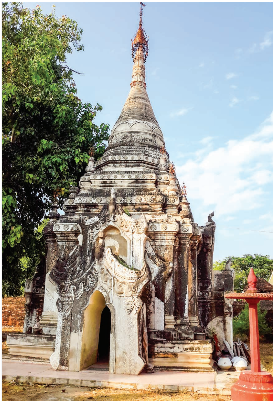
Ancient Buddha Stupa at Mekkhaya old city.

lines. Among them, first six lines bore the land plot and slaves for services of the pagoda donated by King Uzzana and nine more lines mentioned the record of toddy palm plants donated to the pagoda in 716 ME.