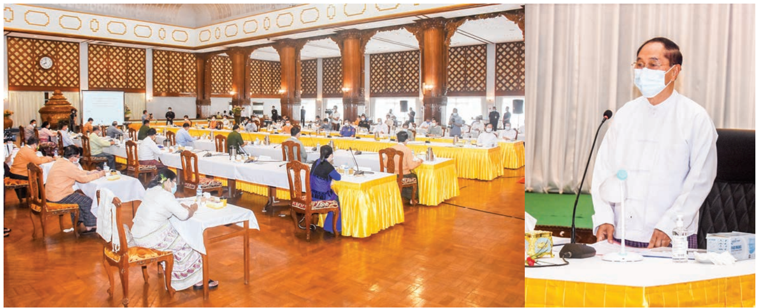
Vice President U Myint Swe discusses organizing of 73 rd Anniversary of Martyr's Day on 19 June 2020.

V ICE President U Myint Swe, in his capacity as the patron of the central committee for organizing the 73rd Anniversary Martyrs' Day, chaired its second coordination meeting at the Yangon Region government yesterday.