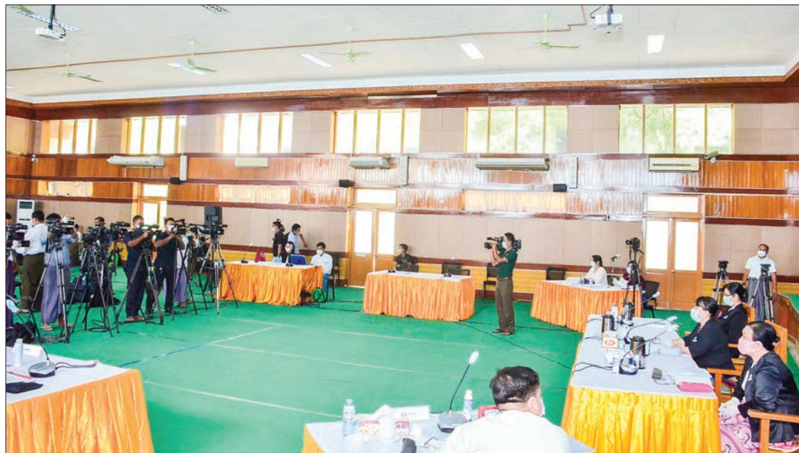
The Union Attorney-General Office holds press briefing on 4th-year performances 19 June.