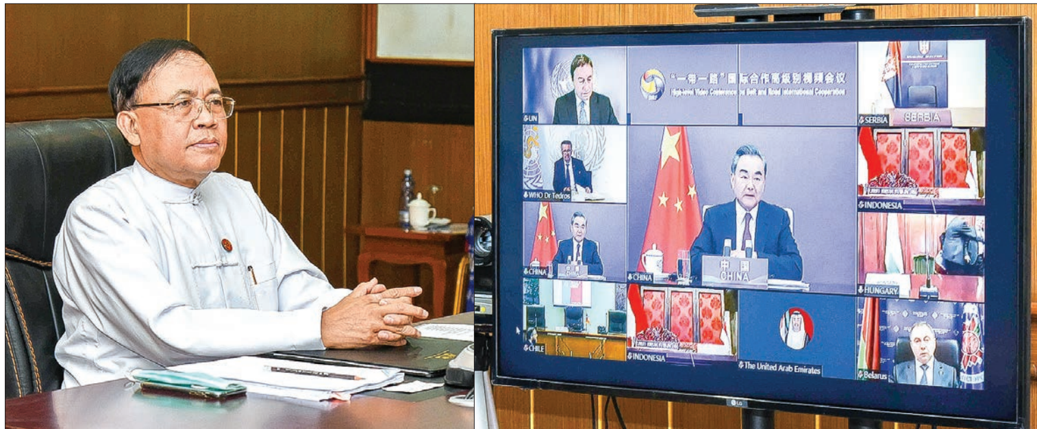
Union Minister U Kyaw Tin attends the High-Level Videoconference on Belt and Road International Cooperation on Combatting COVID-19.