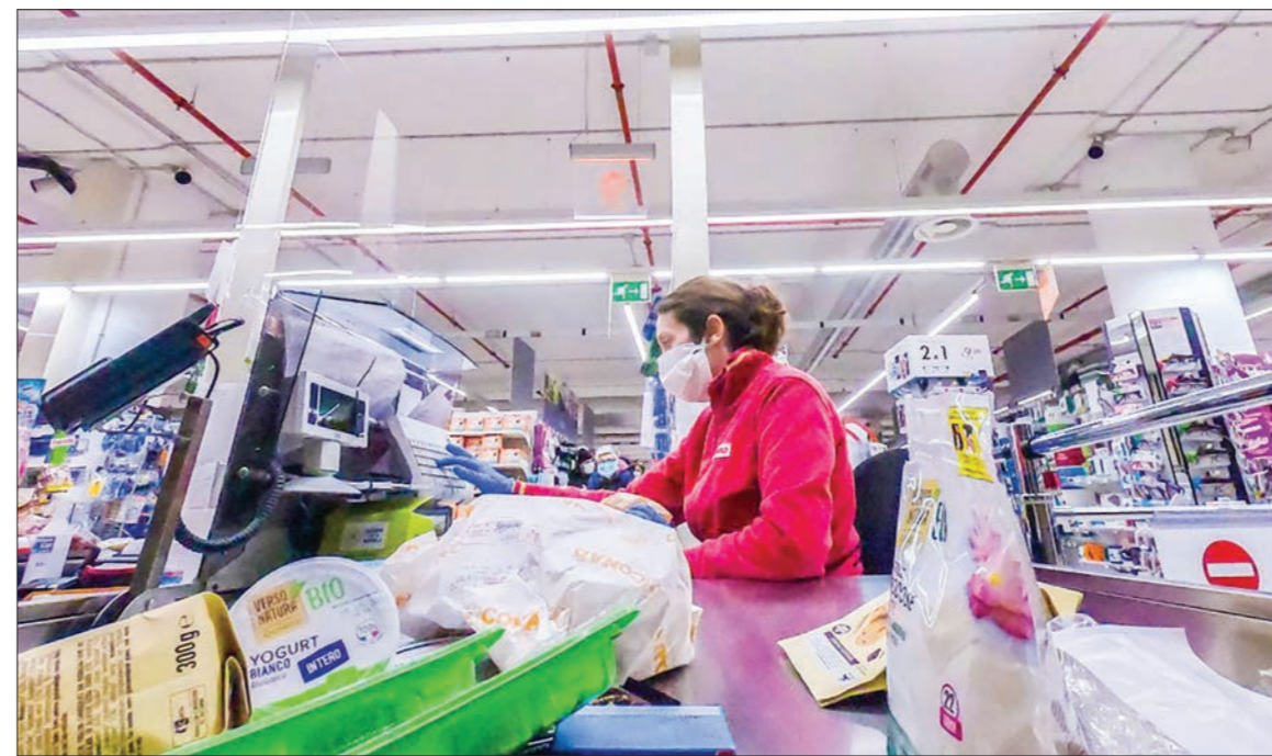
Consumers are more frequently shopping online rather than in-store as a result of the novel coronavirus (COVID-19) outbreak.

It is also learnt that large schools of mackerel and tuna fish are said to be spotted in the Gulf of Thailand. Before the pandemic these fishes were very scarce in that area due to overfishing by local fishing boats as well as by poachers from other countries. Also, the wildlife in the Khao Yai National Park in Central Thailand too are roaming freely during daylight hours, which they never did in the past. Large herds