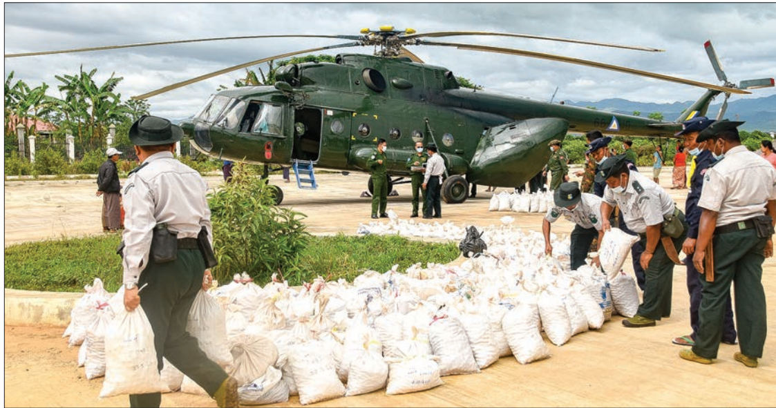
Forest Department's officials and military personnel carry seed balls bags onto the helicopter for scattering.

Some 100,000 seed balls were broadcast by a helicopter in nine deforested areas by mining in Homalin Township, Khandi District in Sagaing Region.