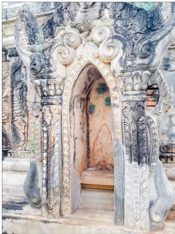
Myanmar ancient architecture works.