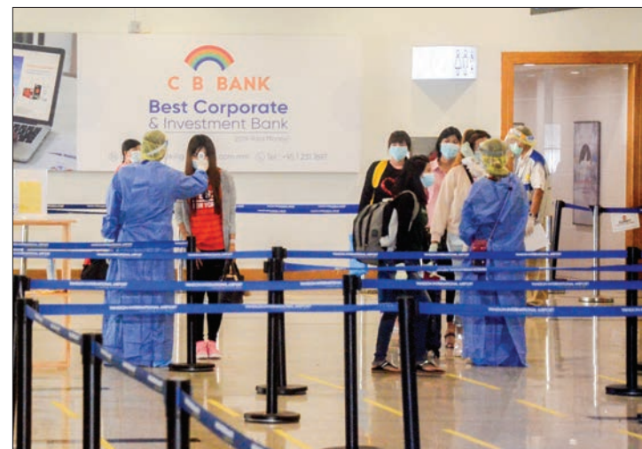
Myanmar nationals arrive at Yangon International Airport by a relief flight on 19 June.