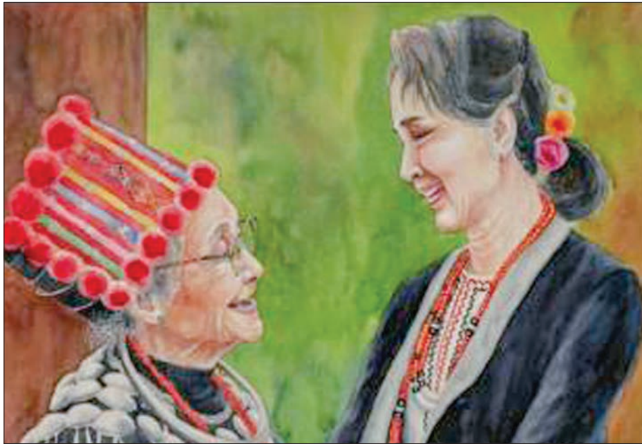
The painting showing State Counsellor Daw Aung San Suu Kyi greeting with a Kachin ethnic woman.

"Artists U LunGywe and U Hla Tin Tun gave commands that this is a