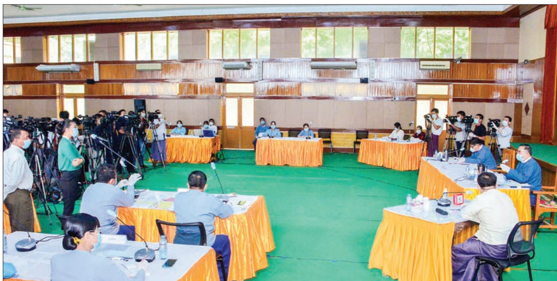
The Union Civil Service Board holds a press briefing on 4th-year performances 19 June.