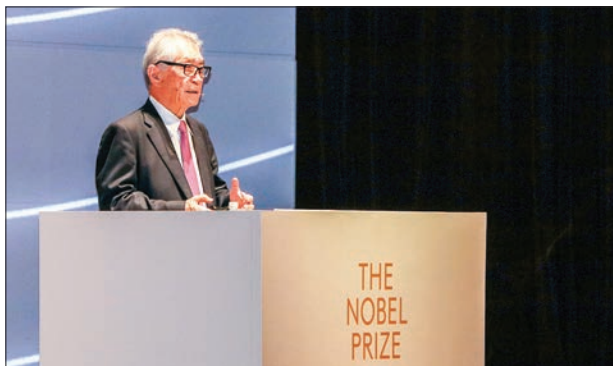
Nobel laureate Tasuku Honjo, deputy director general and distinguished professor at Kyoto University Institute for Advanced Study, gives a lecture at the Nobel Prize Dialogue Tokyo 2019 on March 17, 2019, in Yokohama.

The discovery of the protein PD-1 by Honjo and his team in 1992 later led to the development of Opdivo, a drug that triggers the immune system to attack cancer cells.—Kyodo ■