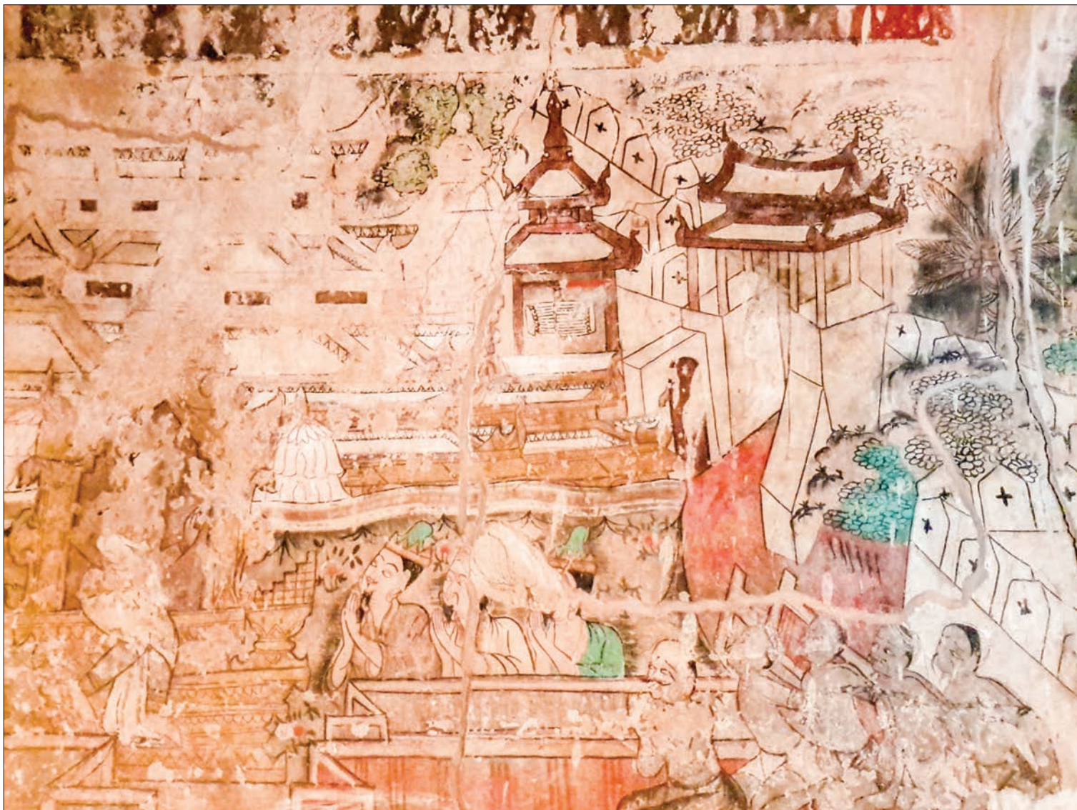
Painting on the wall of the pagoda.

The stone inscription of Sikhon monastery carved by King Uzzana in 687 ME comprised 20