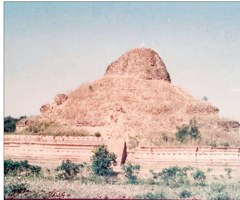
Mekkhaya Shwezigon pagoda.

Royal Palace built together with Mekkhaya City not longer existed there. More than 50 ancient pagodas have been renovated in the city. Travellers can observe mural paintings at some stupas and temples.