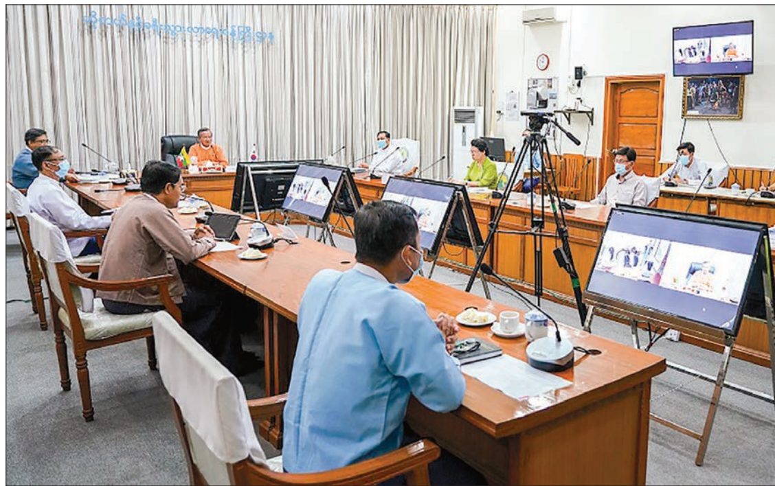
Union Minister for Hotels and Tourism discusses with ROK Ambassador about impacts of COVID-19 on tourism sector and relief plans on 19 June.

UNION Minister for Hotels and Tourism U Ohn Maung held a videoconference with Ambassador of the Republic of Korea to Myanmar from his office in Nay Pyi Taw yesterday, discussing the impacts of COVID-19 on tourism sector and relief plans.