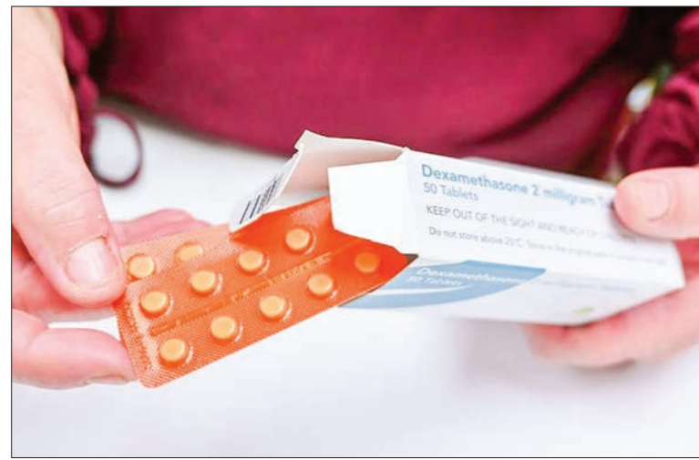
Dexamethasone, a commonly-used steroid, can help critically-ill COVID-19 patients, according to a new study

T HE World Health Organization (WHO) welcomed the positive results of dexamethasone in treating the novel coronavirus, while warning that the drug should not be used on mild cases or for prevention purposes.