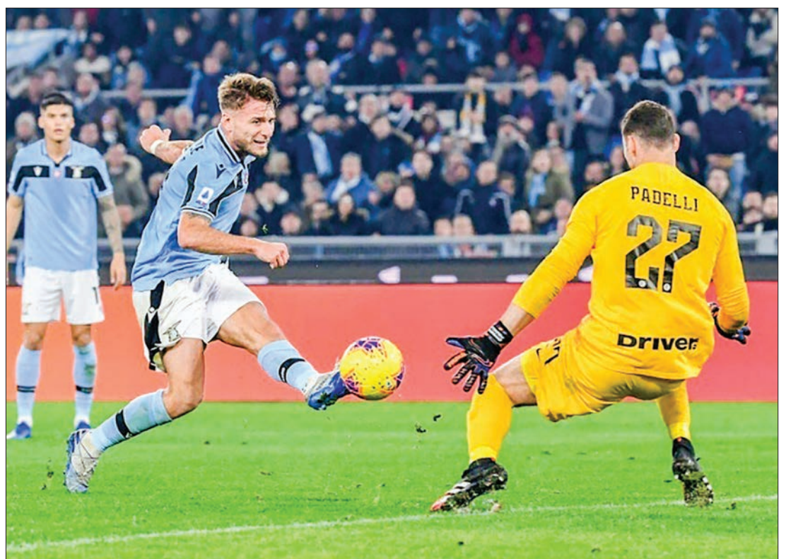
Lazio, powered by Serie A top scorer Ciro Immobile, are on a 21-match unbeaten run.

Sarri's woes have been compounded with Brazilian defender Alex Sandro tearing a knee ligament against Napoli and Sami Khedira picking up a potentially serious tendon problem.—AFP ■