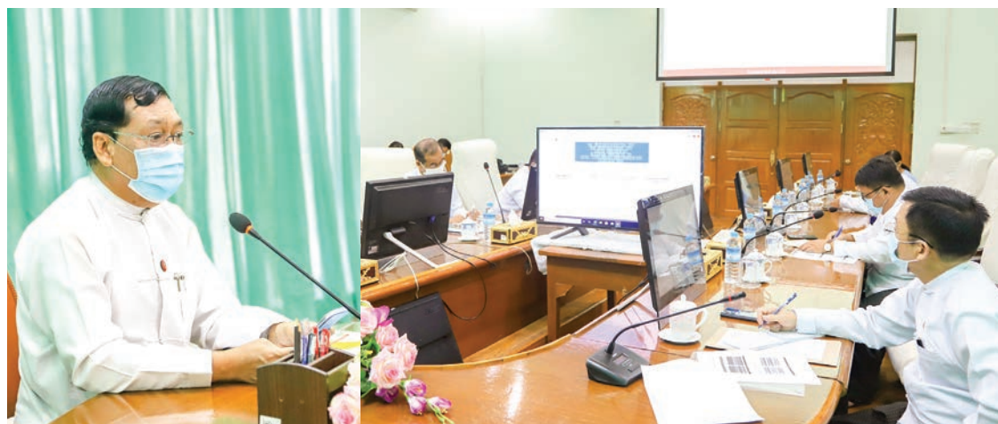
Ministry of Labour, Immigration and Population launches web portal of the National Skill Standard Authority on 19 June.