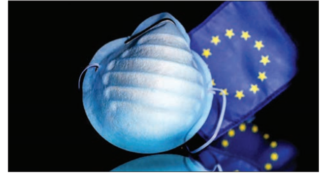
The coronavirus crisis is pushing the EU to grapple with an old institutional problem -- the lack of joint borrowing to fund major projects for the bloc.

plan is inspired by a German and French proposal in which EU money is raised on the financial markets to spend Europe-wide in the biggest slice of joint borrowing ever undertaken by the union.—AFP ■