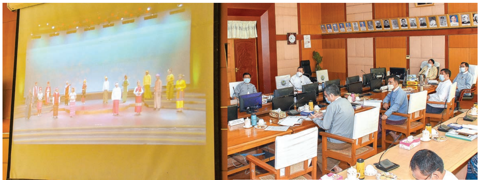
Union Information Minister Dr Pe Myint looks at presentation of the 2020 General Election voter awareness programme on 19 June.

Permanent Secretary U Myo Myint Maung briefed on