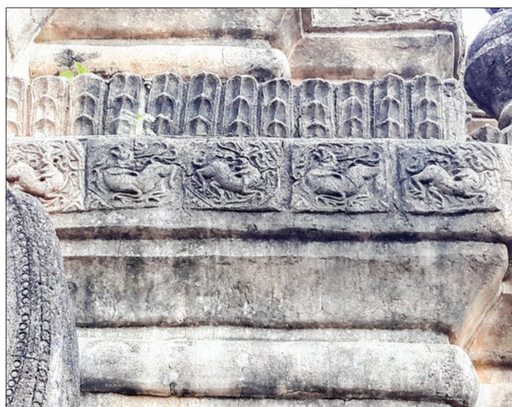
Myanmar ancient architecture works.

present, the bell is hung at the stand in the ancient city.