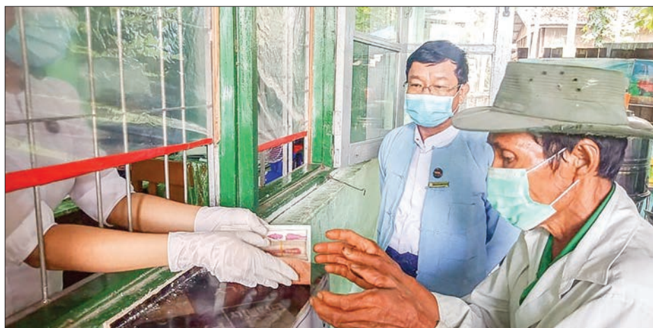
A staff member of Myanmar Agricultural Development Bank giving out loan to a farmer.