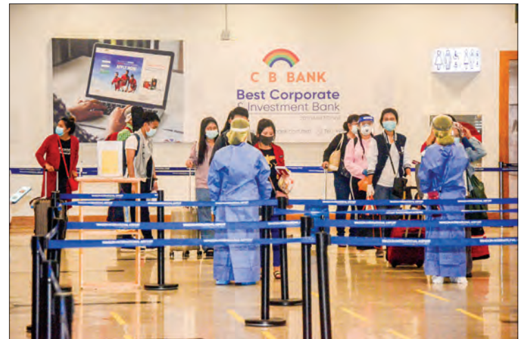
Myanmar nationals queuing for medical tests at Yangon International Airport yesterday.