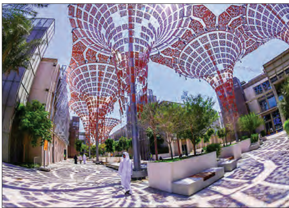
Many of the fair's main structures have been completed at the site rising from the deserts of Dubai. PHOTO: AFP

But “work continues and some of the pavilions have actually reached a very final stage. 2020 is the year of delivery,” he told AFP during a rare visit to the site, which will be mothballed once the major work is done.—AFP ■