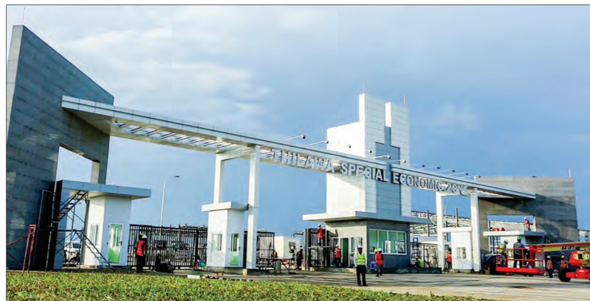
Standing in the centerfold, Yangon is the host for (29) industrial zones and Thilawa Special Economic Zone with (6,000) plants deploying (600,000) workers, enjoying with the reputation as industrial business center. Thilawa Special Economic Zone.