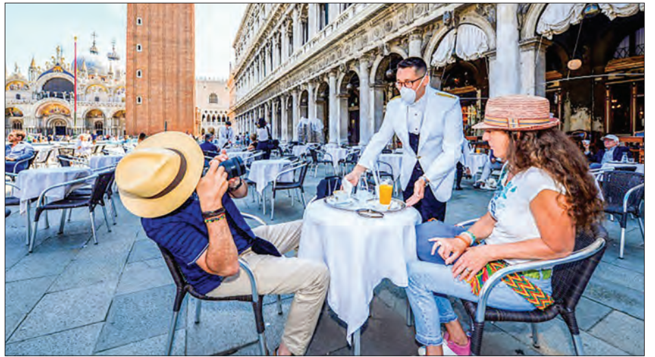
Many Italians will get paid for holidaying at home.

Tourism accounts for around 13 per cent of Italy's gross domestic product and the sector has been brought to its knees by the coronavirus pandemic, with industry experts projecting a shortfall in revenues of as much as 3.2 billion euros this summer.—AFP ■