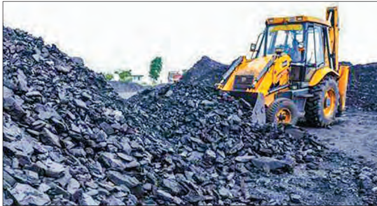
The auction is taking place at a time when economic activities are returning to normal with relaxation of COVID-19 restrictions.

He highlighted the country's irony that along with being world's fourth largest coal reserve and second largest producer, India is also the second largest coal importer. This situation had lasted for decades and the coal sector was kept entangled in the mesh of captive