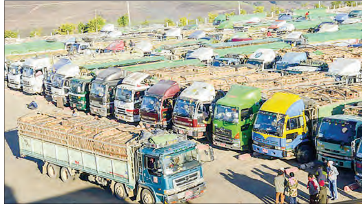
Trucks from Myanmar carrying agro-products, fishery products and animal products wait Chinese buyers at Kyalgaung border near Muse. FILE PHOTO

Earlier, about 250 trucks daily entered Kyalgaung border through Muse. Now, only 150 trucks are seen due to traffic congestion.