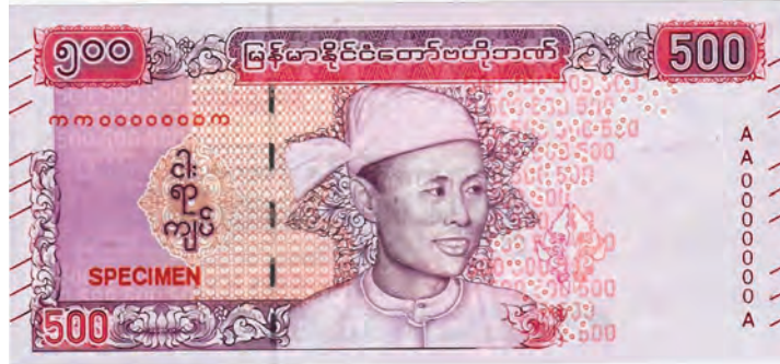
The front side of the banknote.