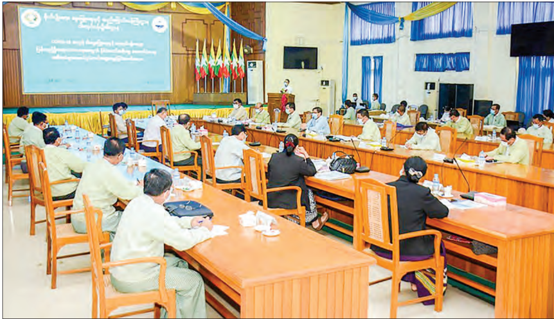
Union Minister Dr Aung Thu presides over meeting for recovery plan of fishing industry in post-COVID on 18 June 2020.

The MoALI will allocate K600 million for distribution of fish seeds and fingerlings and K60