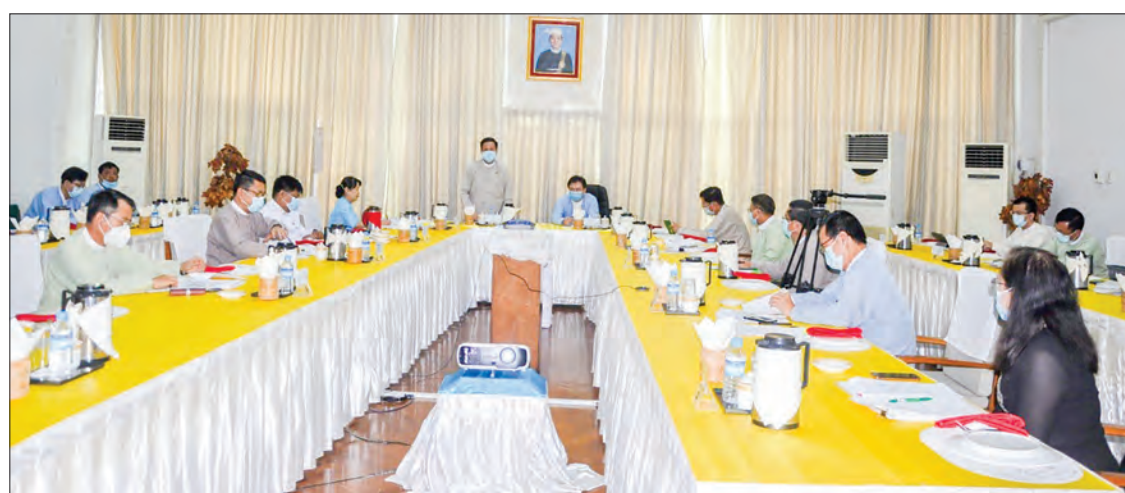
Ministry of Planning, Finance and Industry hosts a meeting of Micro, Small and Medium Enterprise Development Agency on 18 June 2020.

they require technology, market penetration, and skilled workers to fully develop and the temporary closure of MSMEs during COVID has caused losses. He said if the skilled workers returning to Myanmar during the pandemic were to cooperate with MSMEs then it will increase national production. He said they must support MSMEs to sustain themselves during COVID.