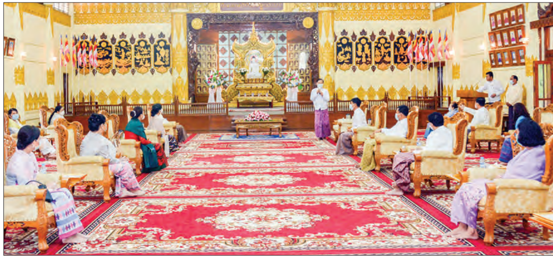
Union Minister Thura U Aung Ko attends the cash donation ceremony for religious purposes at the Wizaya Mingalar Dhamma Thabin of Kaba Aye Hill in Yangon yesterday.