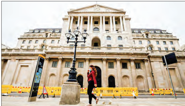
Throwing more money at the problem.

After UK GDP contracted by around 20 per cent in April, "evidence from more timely indicators suggests that GDP started to recover thereafter", said minutes of the BoE meeting.—AFP ■