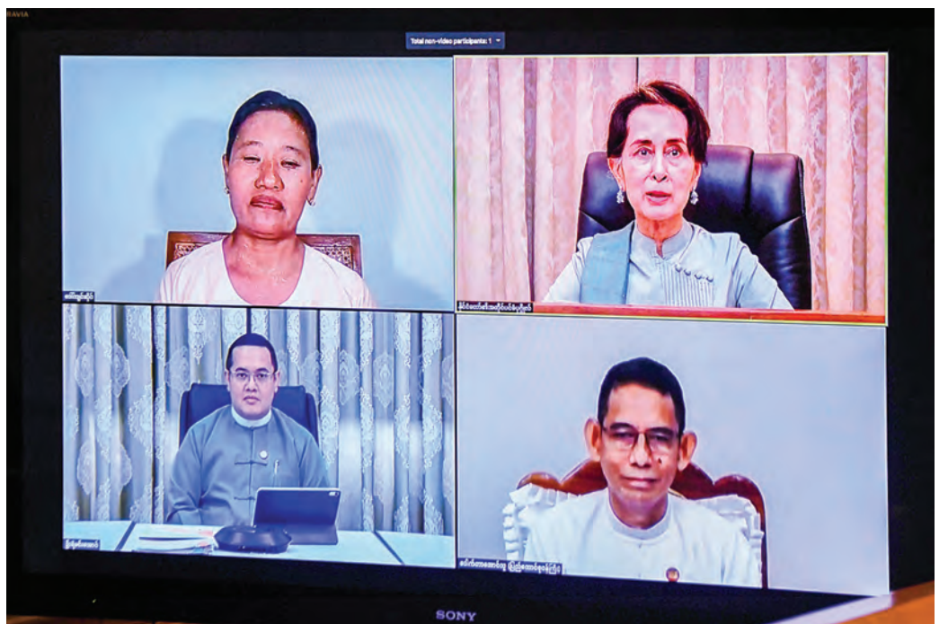
State Counsellor Daw Aung San Suu Kyi holds discussions with stakeholders in agricultural sector on videoconference 18 June 2020.

S TATE Counsellor Daw Aung San Suu Kyi held a videoconference to discuss the impact of COVID-19 on the Myanmar agricultural sector yesterday from the Presidential palace in Nay Pyi Taw.