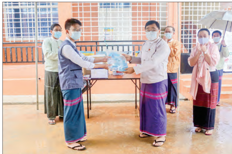
Union Minister Dr Win Myat Aye providing the medical products for the volunteers and quarantined persons in Kayin State.