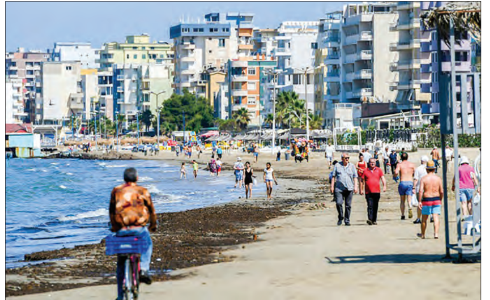
In Albania, whose economy draws up to 15 per cent from tourism, operators are staring at a potentially ruinous year with the suspension of mainly Polish and Scandinavian bookings.

“Let's see what can be salvaged from this disastrous year,” Laspas tells AFP from his office, where he has a large television