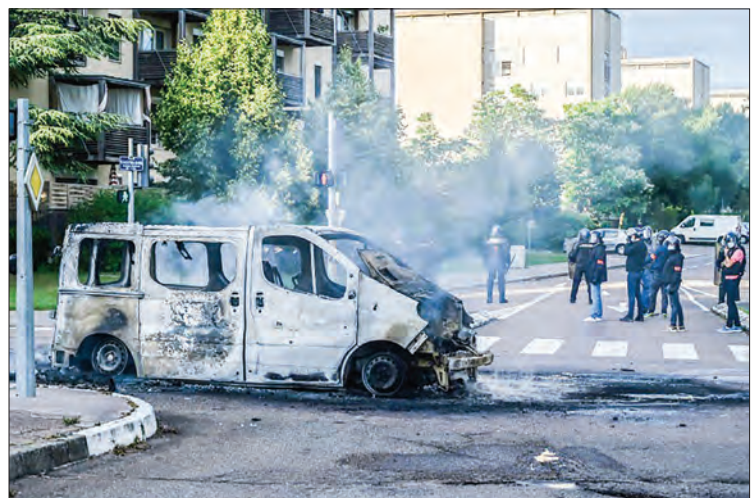
A burned-out van in the Gresilles neighbourhood of Dijon, eastern France, on Monday after a night of clashes.

Dijon was rocked by clashes and vehicle burnings after an assault this month on a 16-year-old Chechen boy that prompted other members of the community to stage reprisal raids.