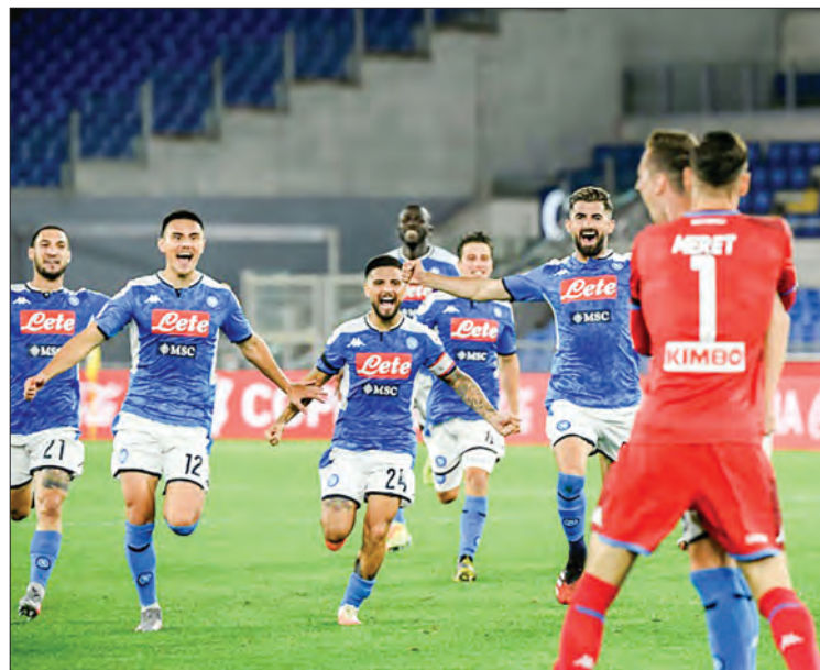
Napoli beat Juventus behind closed doors in the Italian Cup final as football returned to the country on Wednesday.

European, IPCC Intercontinental, and the ISKA World Championship. —Lynn Thit (Tgi)