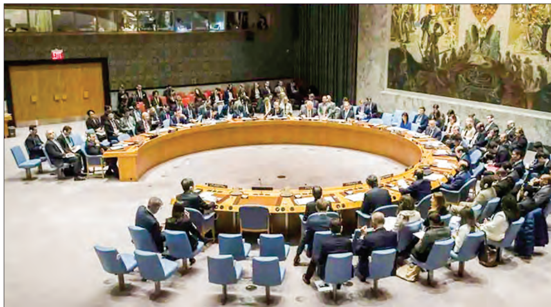
United Nations Security Council. (FILE PHOTO)

In the Asia-Pacific region, India — which has been trying unsuccessfully to win a permanent seat in an expanded Security Council — ran unopposed to win 184 votes out of the 192 countries