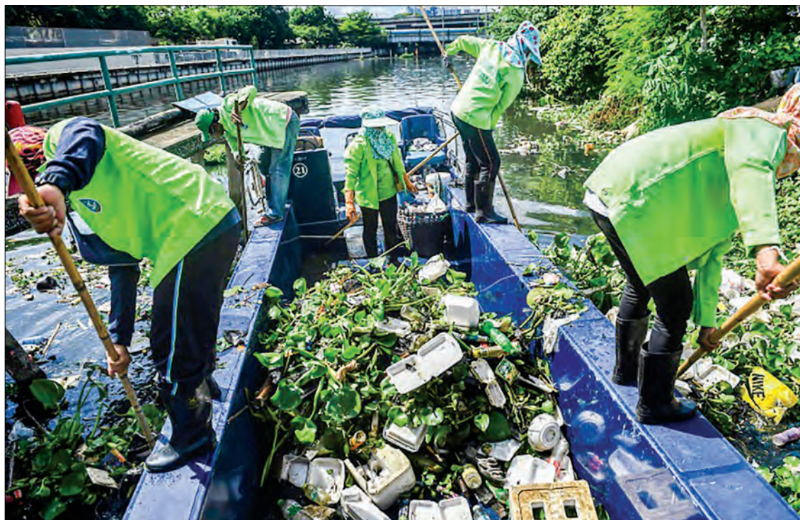
In Bangkok alone, rubbish leapt by 62 per cent in April. PHOTO: