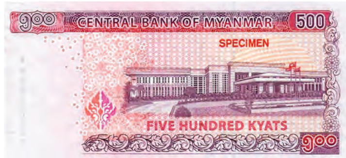
The reverse side of the banknote.

THE Central Bank of Myanmar has announced circulation of 500-kyat banknote on 19 July.