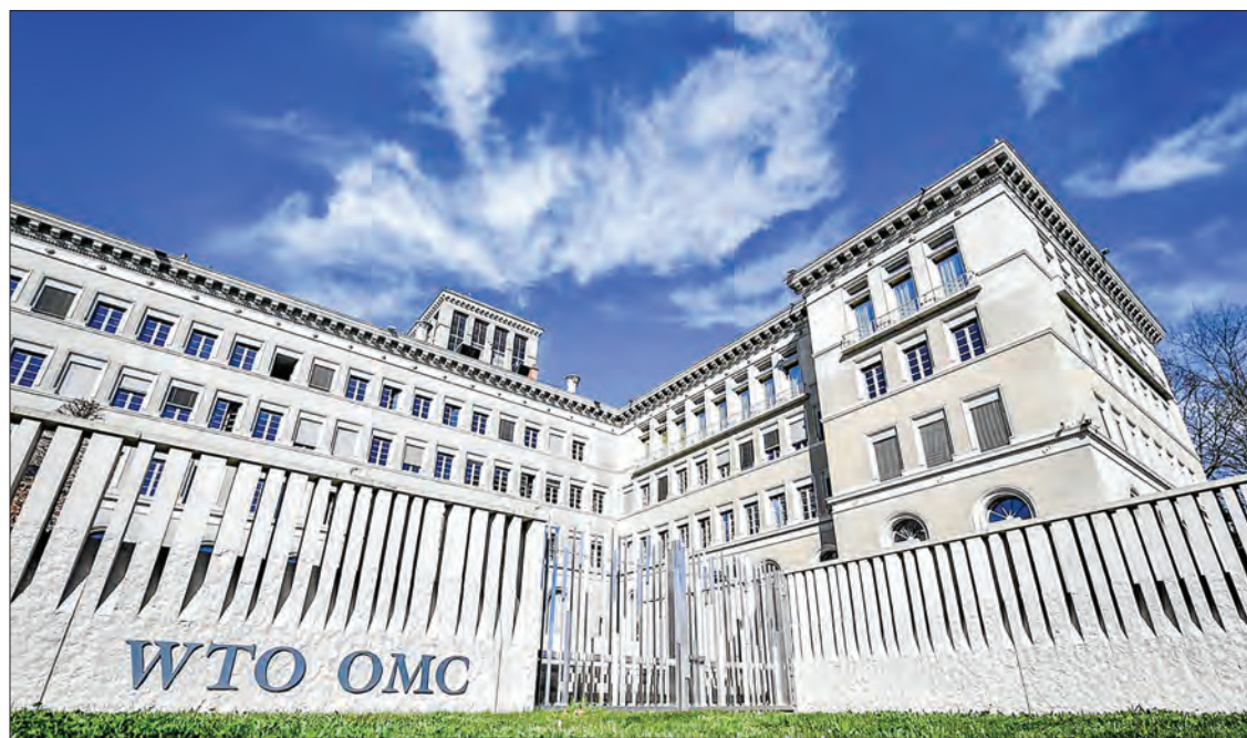
The World Trade Organization headquarters in Geneva.

Seoul has recently accused Japan of not holding up its end of the deal by easing its export controls despite the South Korean side having addressed Tokyo's concerns.—Kyodo ■