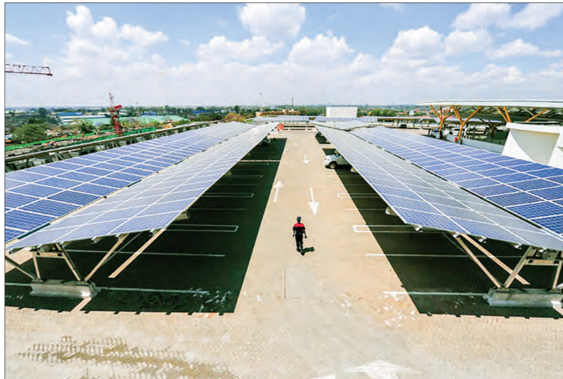
World leaders have a "once-in-a-lifetime opportunity" to reboot their economies and tackle global warming at the same time, the IEA has said.

related areas such as vehicles, buildings and industry have also been lost or are at risk.