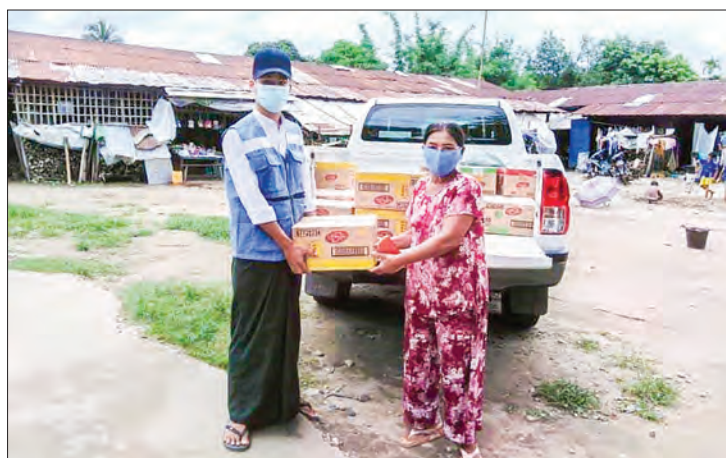
An official providing necessary assistance to the internally displaced person in Kachin State.