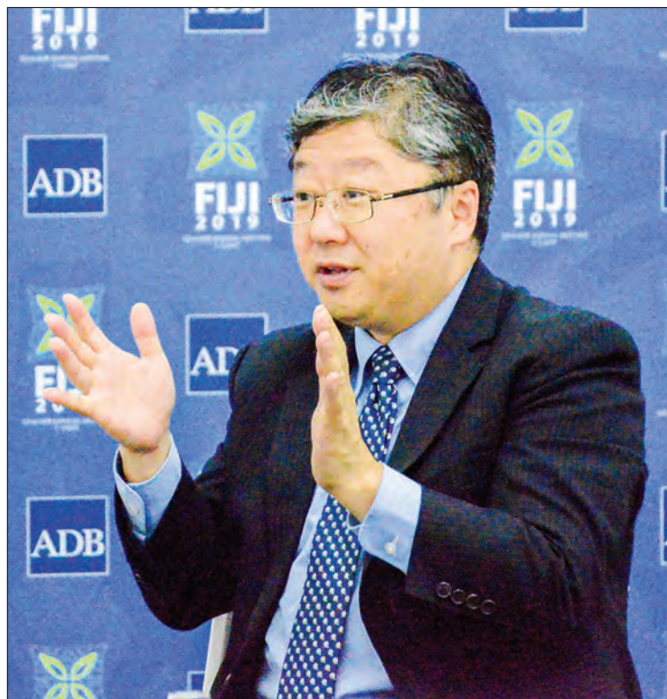
File photo shows Yasuyuki Sawada, chief economist of the ADB.