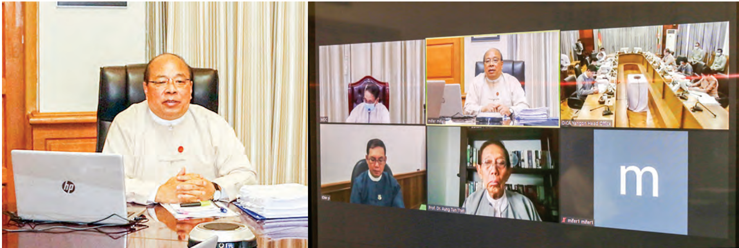
Union Minister U Thaung Tun attends the virtual meeting to discuss investment sectors in Myanmar.

MYANMAR Investment Commission (MIC) held its regular meeting via videoconferencing system,