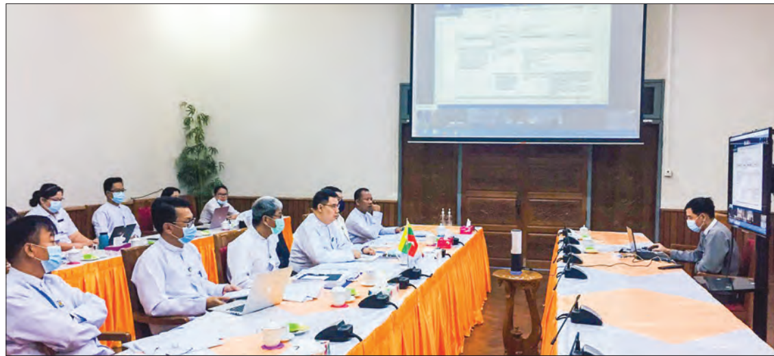
The 49th ASEAN Senior Transport Officials Meeting and ASEAN-China Senior Transport Officials Meeting being held via videoconferencing.