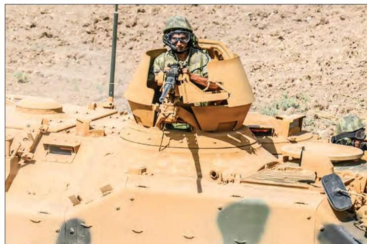
The Turkish military regularly carries out operations against the Kurdistan Workers' Party (PKK) in southeast Turkey and its rear bases across the border.