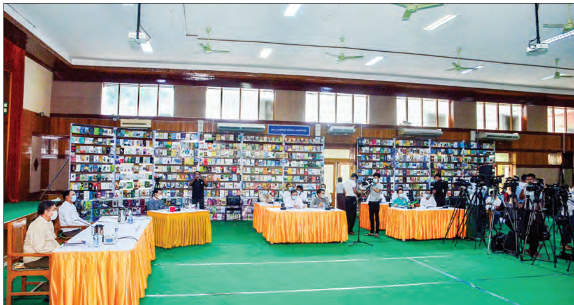
Ministry of Hotels and Tourism holds press briefing on 4 th -year performances on 17 June 2020.