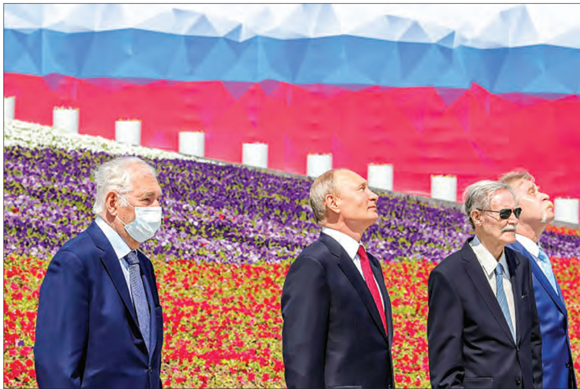
Putin (C) made a public appearance without a mask at an outdoor event on the June 12 Russia Day holiday.

MOSCOW — Visitors meeting Russian President Vladimir Putin at his country residence must first pass through a walk-through device that sprays them with disinfectant to protect him from the coronavirus, officials said.