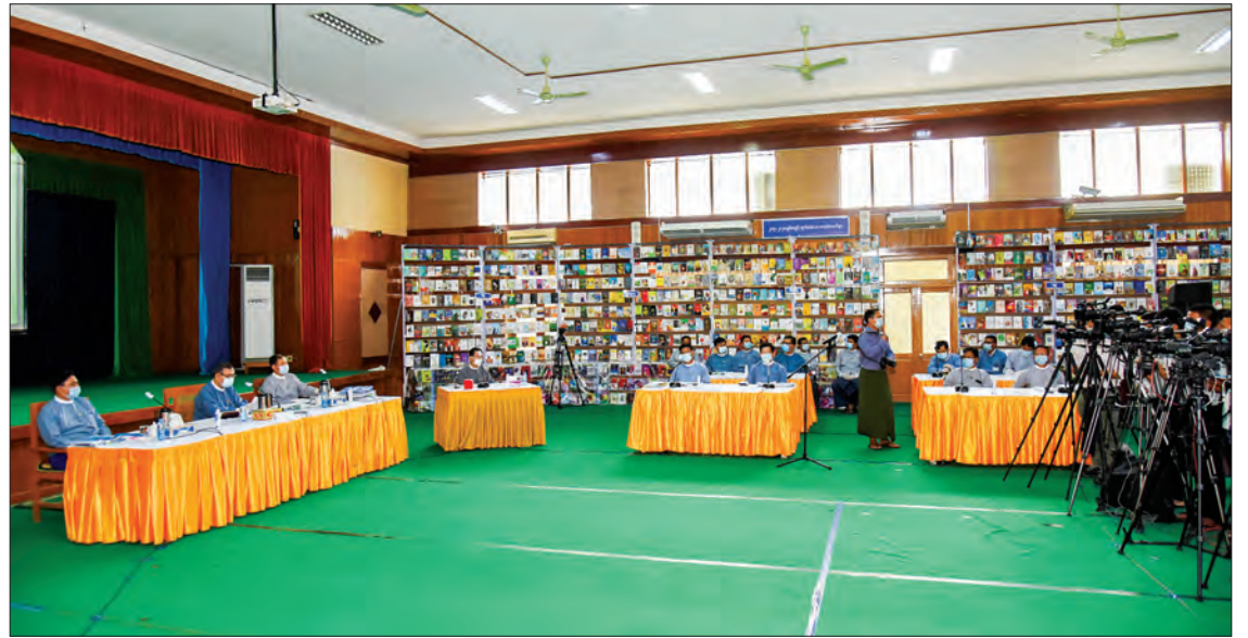
Ministry of Natural Resources and Environmental Conservation holds press briefing on 17 June 2020.

At that time, the 17 vehicles of the mobile library, computer sets and other related items, worth over K1,000 million, were handed over to the MoI. Some works were being done between the ministry and the foundation when the MoU was signed. Computer trainers and skilled staff members of e-library services