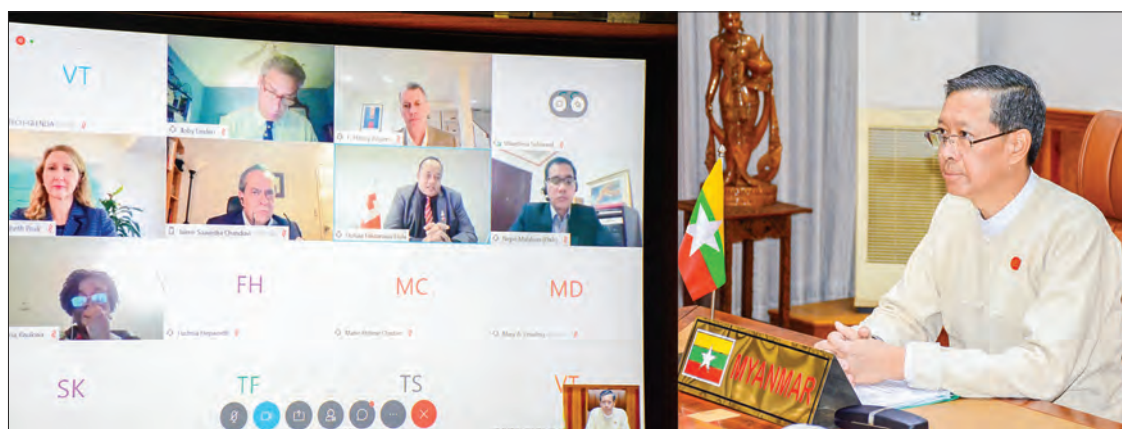
Union Minister Dr Myo Thien Gyi participates in the panel discussion on The COVID-19 Pandemic: Shocks to Education and Policy Responses on YouTube Live on 17 June 2020.