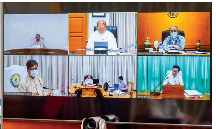
Union Minister U Thaug Tun (left photo) participates in the sixth meeting of the Working Committee to address the impact of COVID-19 on the country’s economy via a videoconference on 17 June 2020.

meeting also took a decision to extend the loan scheme to additional sectors. It is learnt that to-date the committee has approved loans totalling K86.7419 billion to be disbursed to 3,094 business enterprises.—MNA