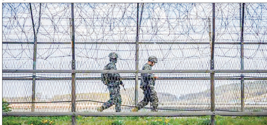
FILE PHOTO: South Korean soldiers patrol along a barbed wire fence Demilitarized Zone (DMZ) separating North and South Korea, on the South Korean island of Ganghwa on April 23.

BEIJING/SEOUL—North Korean troops are redeploying to two areas that had been demilitarized under agreements with the South, official media said Wednesday following Pyongyang's demolition of a joint liaison office, in a sign that their recent efforts at reconciliation have gone up in smoke.