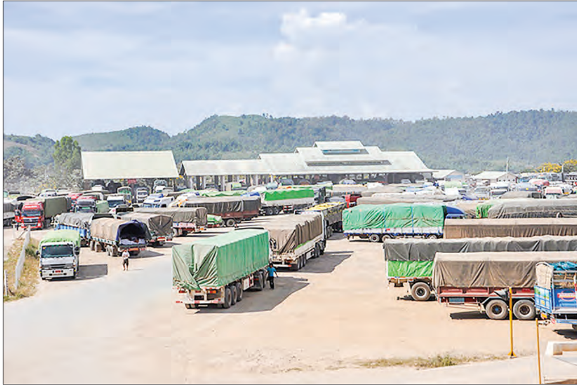
Trucks are seen at 105-mile trade zone Muse, northern Shan State.

At present, China has been stepping up border control meas-