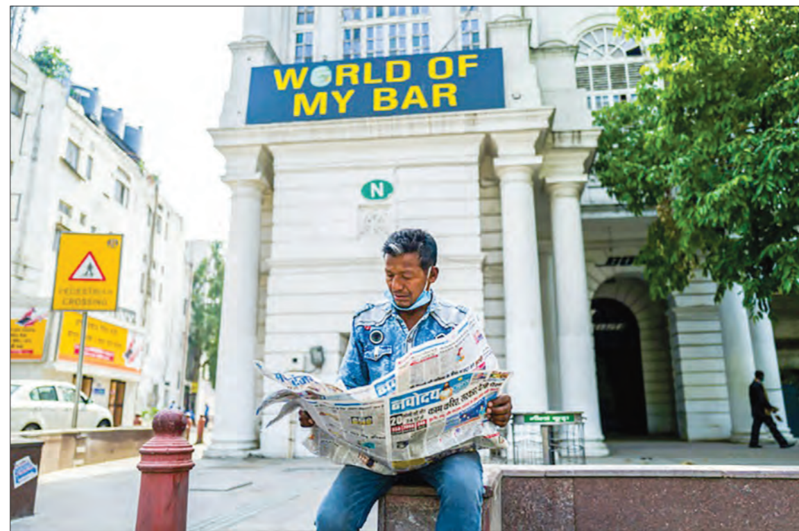
Indian newspapers, which just a few months ago had defied the global trend by gaining circulation, are now buckling under the weight of coronavirus losses.

"India resisted the digital onslaught for a