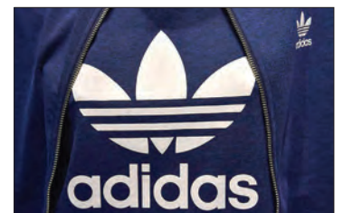
Adidas denies claims that it is not doing enough to combat racism.

And it vowed to spend $20 million over four years on programmes to support black communities in the US.—AFP ■