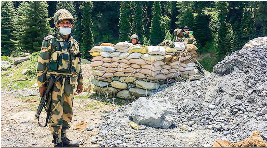
Indian Border Security Force soldiers guard a highway leading towards Leh, bordering China, in Gagangir.