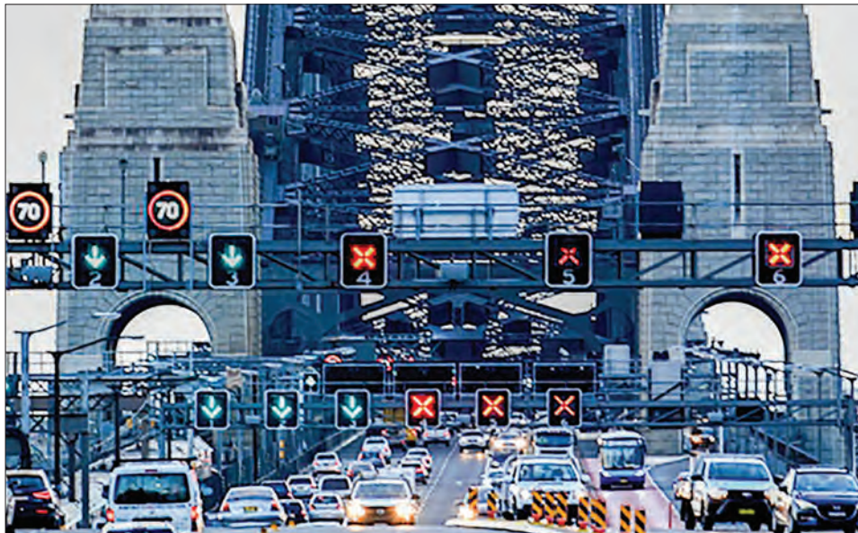
Early morning traffic on the Harbour Bridge in Sydney on Friday. The New South Wales state relaxed COVID-19 restrictions around public gatherings and businesses.

SYDNEY—Australia's economy is on track for a gradual recovery from COVID-19, but faces the threat of a second wave of infections along with the rest of the world, according to minutes from a central bank meeting released on Tuesday. At the meeting held earlier this month, Reserve Bank of Australia (RBA) officials pointed to the chance of a second wave of infections as a potential global stumbling block.