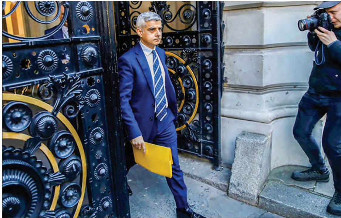
Khan warned he could make cuts to police, fire and transport services without additional funding from the government.

LONDON—London's mayor announced Wednesday he will take a 10 per cent pay cut due to a