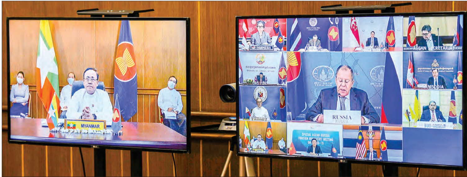
Union Minister U Kyaw Tin (left photo) attends the Special ASEAN-Russia Foreign Ministers' Meeting on COVID-19 via a videoconference on 17 June 2020.

UNION Minister for International Cooperation U Kyaw Tin participated in the Videoconference of the Special ASEAN-Russia Foreign Ministers' Meeting on COVID-19 at 1:30 pm yesterday from the Ministry of Foreign Affairs, Nay Pyi Taw. The Meeting was co-chaired by Mrs Retno Marsudi, Foreign Minister of Republic of Indonesia as Country Coordinator of the ASEAN-Russia Dialogue Relations and Mr. Sergey Lavrov, Foreign Minister of the