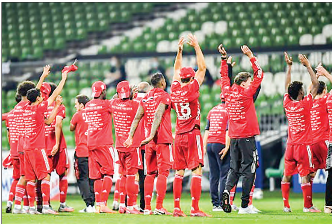
Bayern's players celebrate after the German first division Bundesliga football match SV Werder Bremen v FC Bayern Munich on June 16, 2020 in Bremen, northern Germany. Bayern Munich were crowned German Bundesliga champions for the eighth year in a row on June 16, 2020 after their away win against Bremen.

BERLIN — Robert Lewandowski said Bayern Munich had proved they are the best club in Germany after securing their eighth straight Bundesliga title on Tuesday as the Poland striker's first-half volley saw them claim a 1-0 win at Werder Bremen.