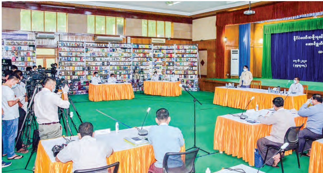
Union Minister Dr Pe Myint explains the 4 th -year performances of Ministry of Information on 17 June 2020.

The MRTV also switched from SD (standard definition) to HD (high definition) for better quality in its broadcasting. The trial tests were run in late last year, and the new system is a good function at present. Three