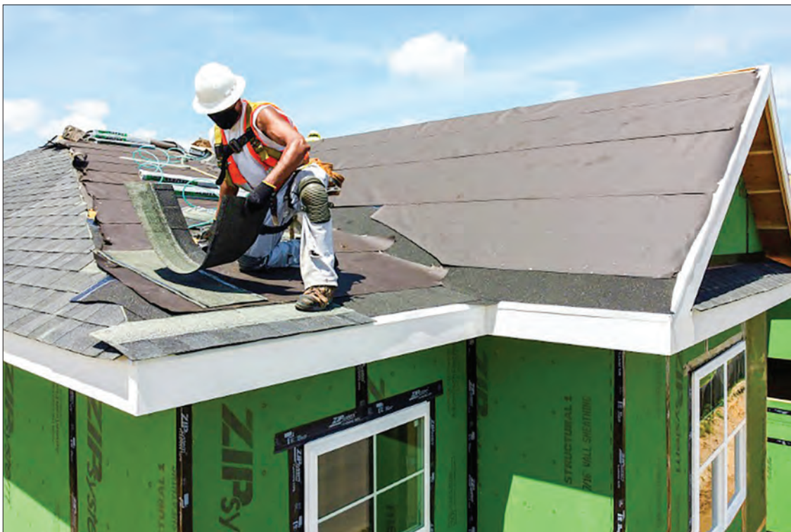
The pace of homebuilding rose in May but remained 23.2 per cent below the same month in 2019.

Low interest rates are expected to continue to drive demand, and a separate report from the Mortgage Bankers Association (MBA) showed home loan applications jumped eight per cent in the latest week, while purchase activity was the highest in 11 years.—AFP ■