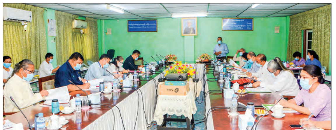
Subcommittee for organizing competitions of Myanmar film industry's centenary celebrations hold fourth coordination meeting in Bahan, Yangon, on 17 June 2020.