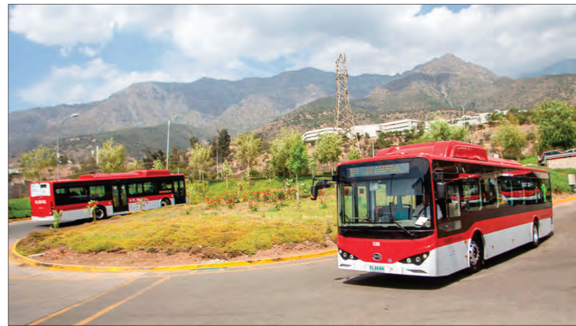
Battery-electric buses have noticeable environmental benefits over diesel and natural gas buses in the form of fewer greenhouse gas emissions. Chinese-made electric buses in Santiago, Chile.

Bailouts to the auto industry can be directed to investments in e-vehicle and battery production, and efficiency technology. Where bailouts should not happen is in the fossil fuel sector. Developing Asian countries account for nearly one-third of global fossil fuel subsidies. The COVID-19 recovery period is the right time to end