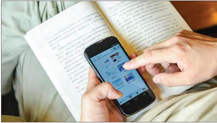
In this July 21, 2014, a man browses the Internet on his smartphone, in Hangzhou, east China's Zhejiang province.

BEIJING — Chinese authorities launched a nationwide campaign to crack down on online copyright infringement and piracy.