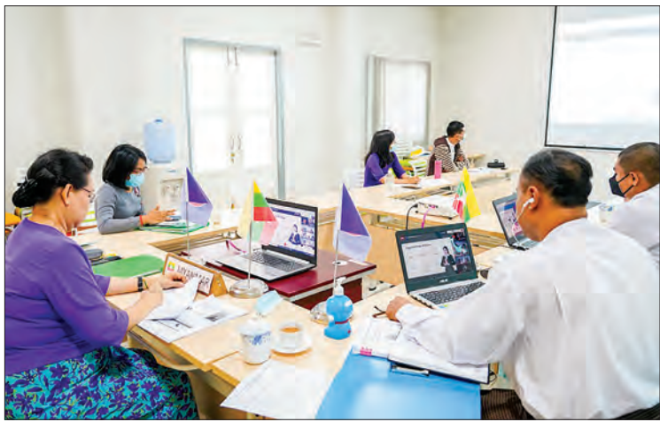
ASEAN Tourism Professional Monitoring Committee holds 23rd meeting via a videoconference on 16 June 2020.

ASEAN Tourism Professional Monitoring Committee held their 23rd meeting via a videoconference on 16 June.