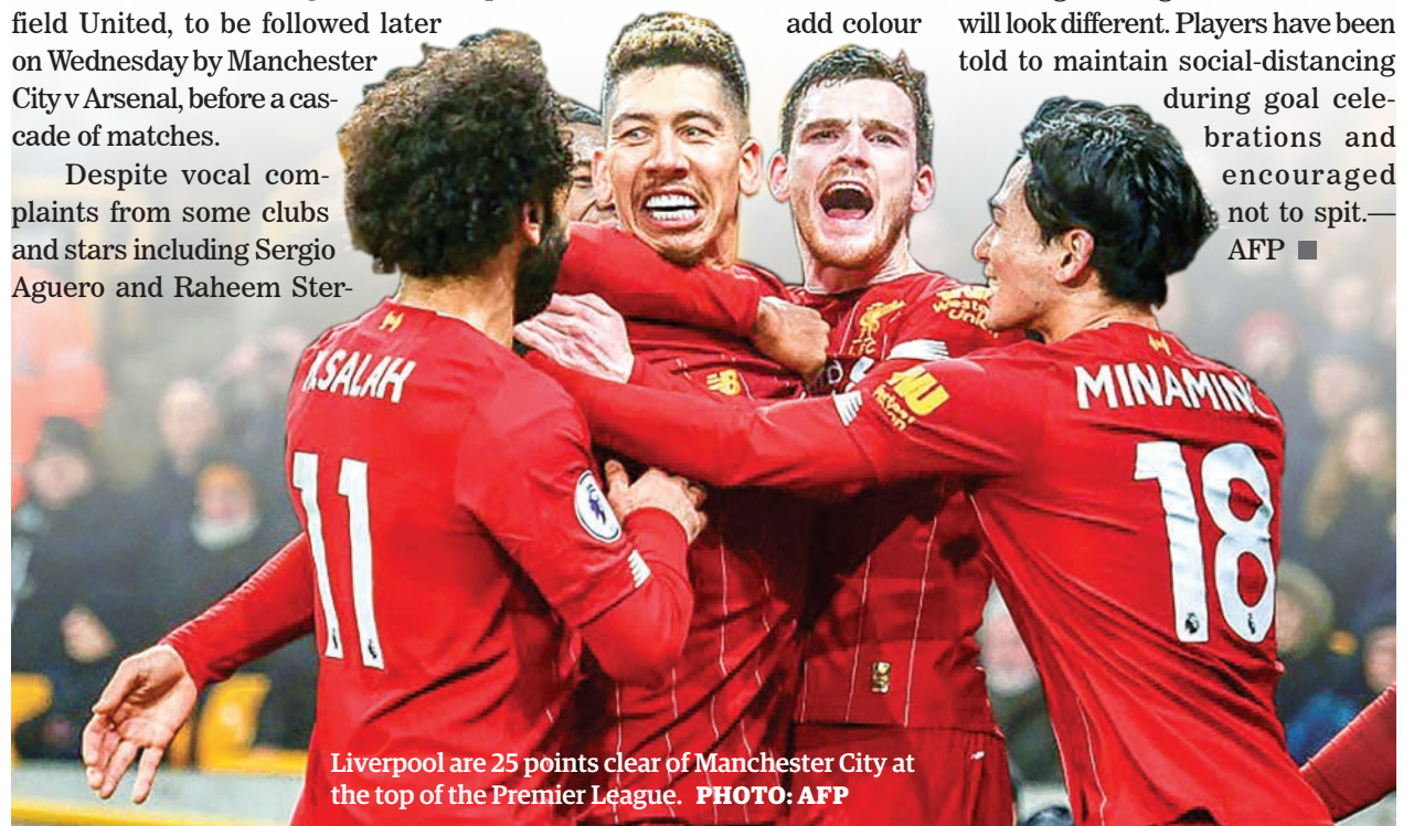
Liverpool are 25 points clear of Manchester City at the top of the Premier League. PHOTO: AFP

during goal celebrations and encouraged not to spit.—AFP ■