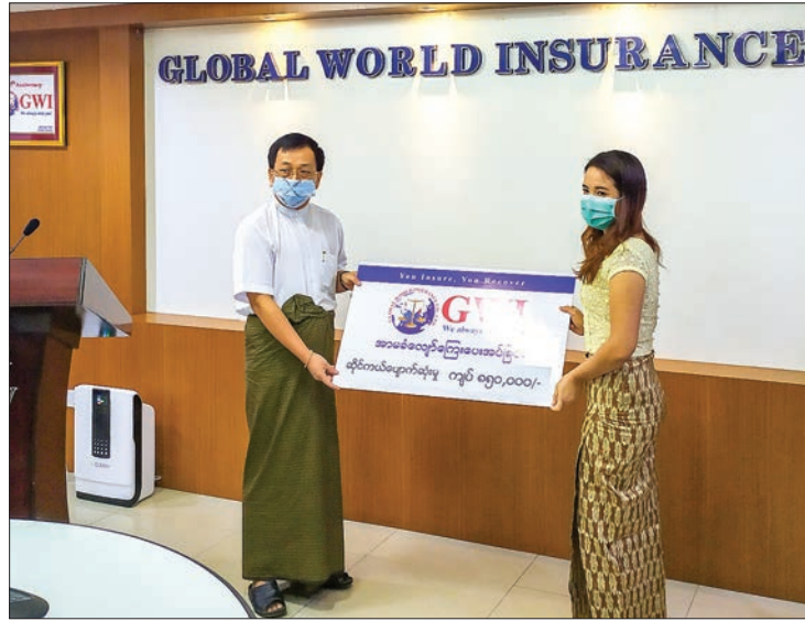
An official from the Global World Insurance provides compensation to an insured at their office in Yangon on 16 June.

"There are a lot of motorbike users across the country.