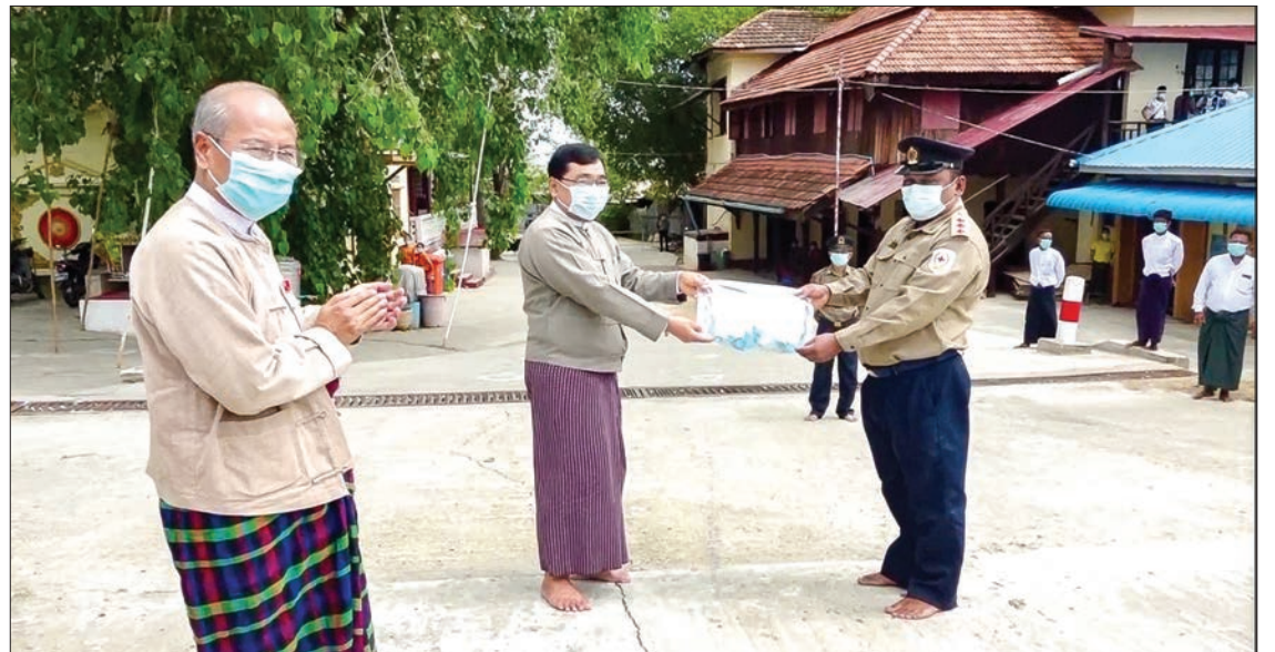
Union Minister Dr Win Myat Aye (centre) presents badges and face masks to a volunteer (right) at the Setkatae Monastery's quarantine centre in Minbu, Magway Region, on 16 June.

Officials from the Magway Region government's general administration department and related volunteers steering committees will give the national-level central committee's certificates of honour to 7,580 volunteers and