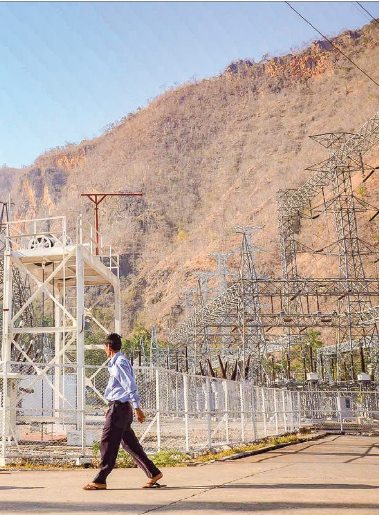
Electricity generation tops Myanmar's FDI sector line-up in the present fiscal year, with investment of US$ 1.02 billion.

The foreign investment projects approved by the MIC have created nearly 145,000 job opportunities for Myanmar citizens in seven months of the current fiscal year. With steady FDI inflow in the present financial year, Myanmar is likely to meet its FDI target of US$5.8 billion, set under the Myanmar Investment Promotion Plan (MIPP), he said. The increase of foreign direct investment into Myanmar attributes to the government's steps to ease regulations in an attempt to lure more foreign direct investment into the country. Singapore topped the list of foreign investors in Myanmar during the period from October last year to date, and was followed by China and Thailand. Singapore became the largest foreign investor in Myanmar, injecting over US$ 22 billion into 312 projects of the Asia's last frontier market.