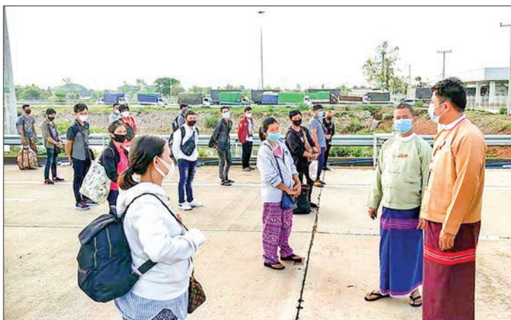
Myanmar migrant workers seen at Myawady border as they return home from Thailand on 16 June.