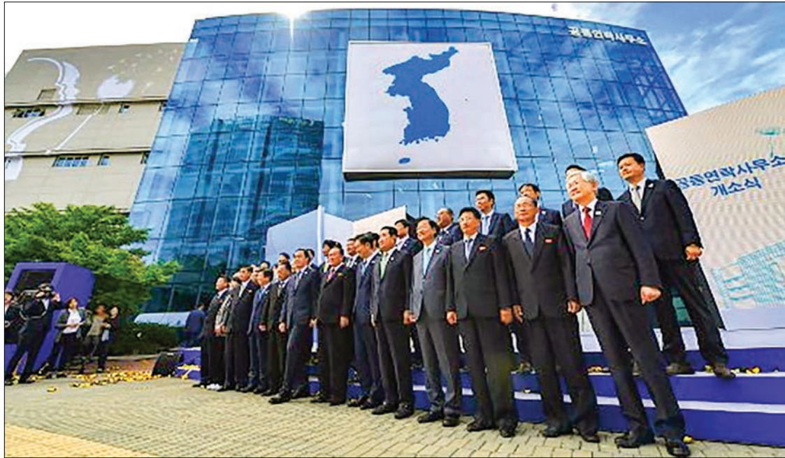
In this file photo taken on September 14, 2018, South and North Korean officials attend an opening ceremony of a joint liaison office in Kaesong. - North Korea blew up an inter-Korean liaison office on its side of the border on June 16, 2020, the South's Unification ministry said, after days of increasingly virulent rhetoric from Pyongyang.

The demolition came in the wake of "corresponding to the mindset of the enraged people to surely force human scum and those, who have sheltered the scum, to pay dearly for their