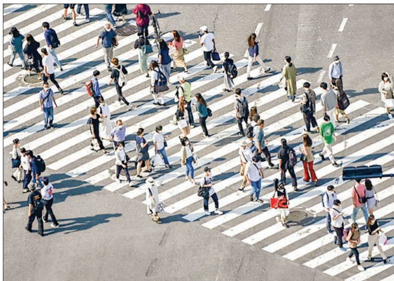
Japan is suffering its first recession since 2015.

The Bank of Japan (BoJ) expanded its zero-interest loan programme to firms to 90 trillion yen ($837 billion) from 55 trillion yen. Its total war-chest for companies amounts to 110 trillion yen when corporate bond purchases are taken into account. "Japan's economy is likely to remain in a severe situation for the time being due to the impact of COVID-19 at home and abroad, although economic activity is expected to resume gradually," the bank said following a two-day policy meeting.—AFP ■