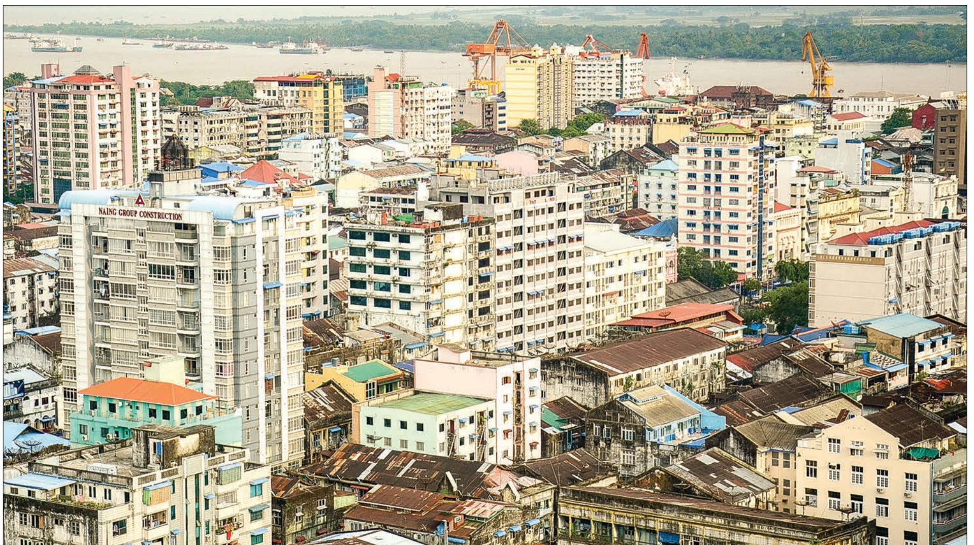
The real estate sector stands second in Myanmar's foreign investment with US$ 895 million of total FDI in the current fiscal year.

financial year, he added. The Southeast Asian country received an average of US$ 500 million per month in foreign direct investment in the current fiscal year, he once told the media. He continued that the foreign investment volume was higher than domestic investments by Myanmar citizens.