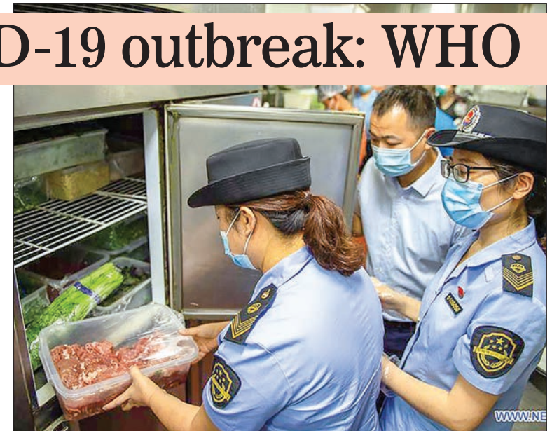
Staff from the market supervision administration of Fengtai District inspect a restaurant's kitchen in Beijing, capital of China, June 16, 2020.

Nearly 75 per cent of recent cases come from 10 countries, he