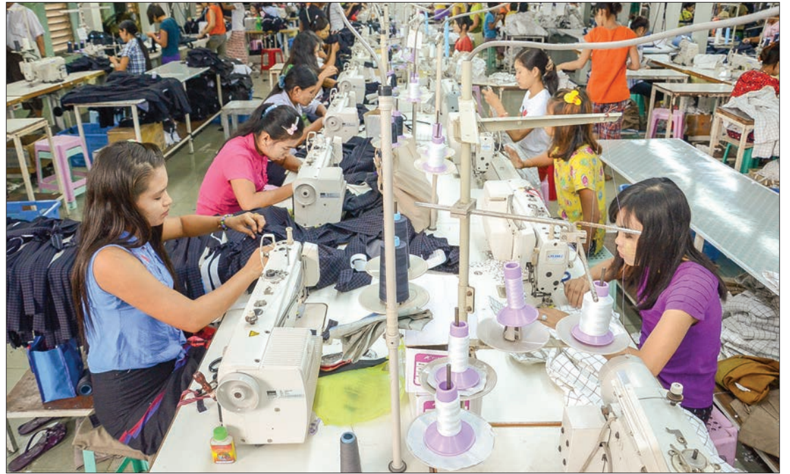
File photo shows textile workers sewing on production line at a garment factory in Hlinethaya Industrial Zone in Yangon.

The CMP garment sector which contributes to 30 per cent of Myanmar's export sector is currently struggling because of the cancellation of the order from the European countries