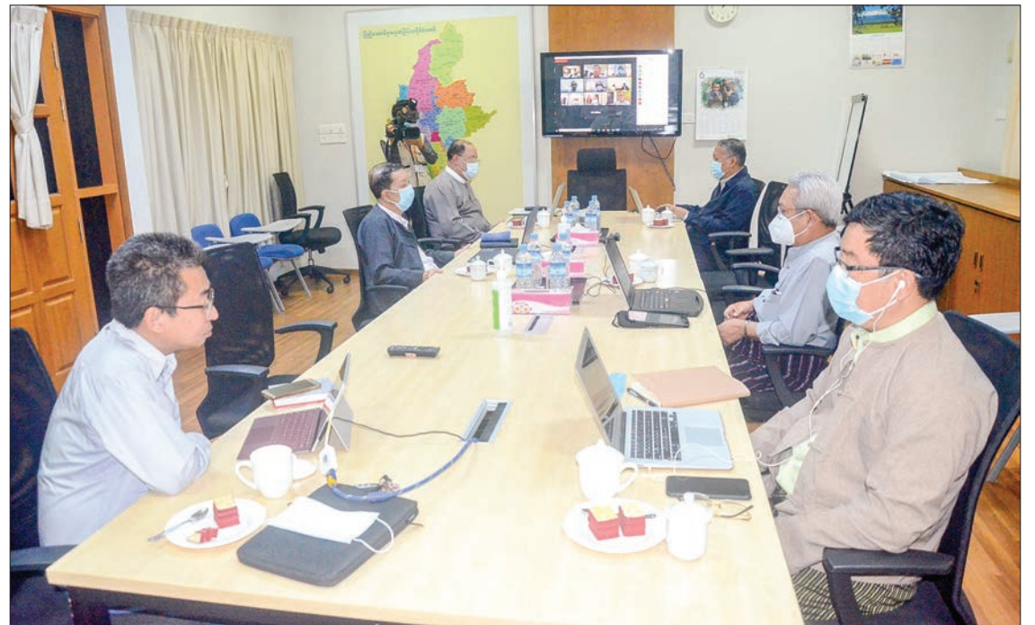
Representatives of Committee on Coordinating with Ethnic Armed Organizations on Prevention, Control and Treatment of COVID-19 hold videoconference with RCSS members.