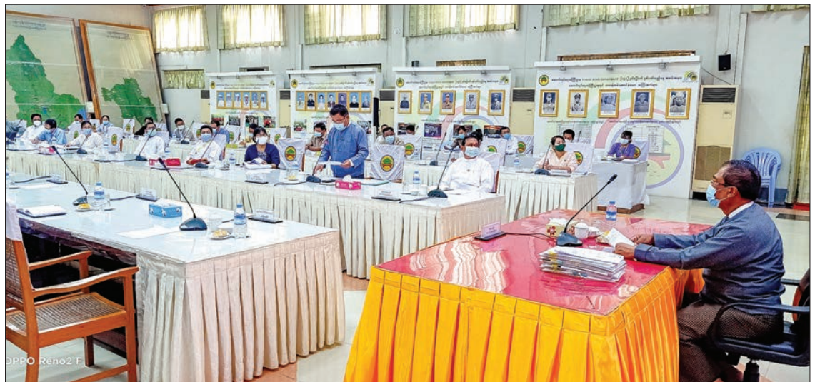
Committee for Housing Unit Allocation under the Ministry of Construction organizes a ceremony to draw lots on housing units for retired civil service staff in Nay Pyi Taw on 16 June 2020.

21 ministries representing 300 retired civil servants, and invited journalists.