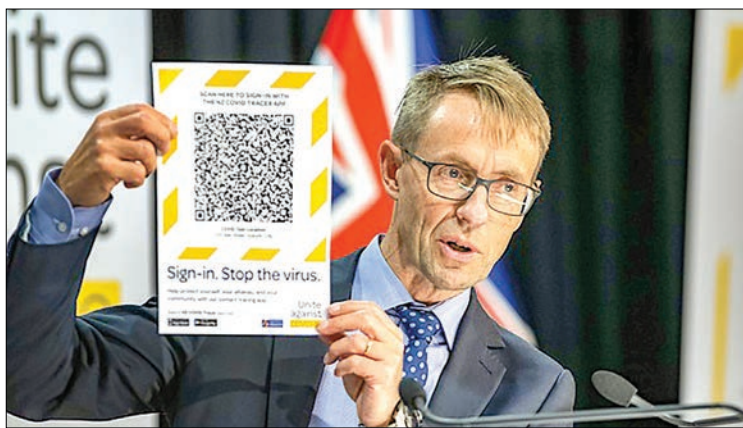
Director-General of Health Ashley Bloomfield shows an example of a scan for the NZ COVID Tracer app at a press conference in Wellington, New Zealand, on May 20, 2020.

SYDNEY—New Zealand confirmed on Tuesday two new coronavirus cases in women who recently arrived from Britain, ending a 24-day streak of no new infections.