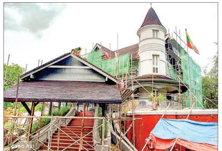
Renovation of Bogyoke Aung San Museum (Yangon) is underway.

The 99-year-old museum, built in 1921, is located in Bogyoke Museum Lane, Bo Cho (1) Ward in Bahan Township, Yangon Region. —Maung Sein Lwin (Myanma Alinn) (Translated by Kyaw Zin Tun)