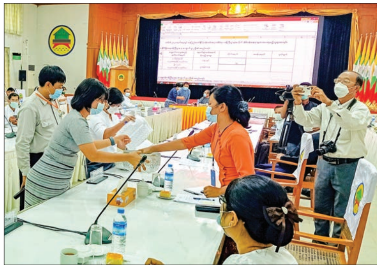
A woman draws a lot for housing unit in Nay Pyi Taw on 16 June 2020.

Present at the ceremony were Permanent Secretary U Shwe Lay, directors-general, deputy directors-general, department heads, officials from