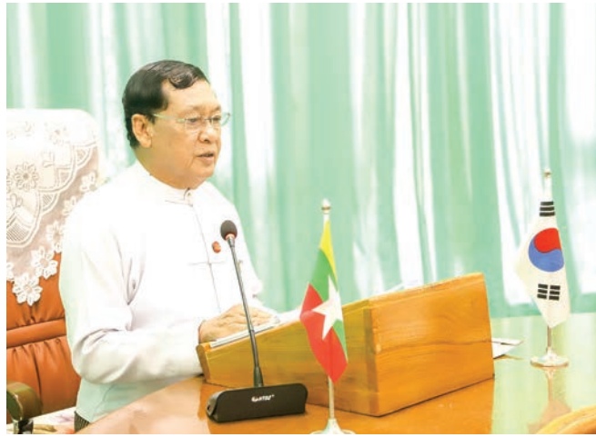
Union Minister U Thein Swe (left photo) speaks during the videoconference on labour affairs with the delegation led by Ambassador of the Republic of Korea Mr Lee Sang-hwa, (left photo) on 16 June 2020.

They discussed extending the time for repatriating Myanmar workers in South Korea, arranging relief flights for Myanmar workers in ROK who wish to return to Myanmar, increasing the number of EPS admitted Myanmar migrant workers from 1,000 to 7,000, recalling experienced and skilled Myanmar workers back to South Korea as a priority when possible, cooperating for preliminary examinations for EPS during COVID-19 period, coordinating flights for transporting EPS skilled workers, and discovering technological solutions to resolve issues between employers and employees in the garment industry caused by the current