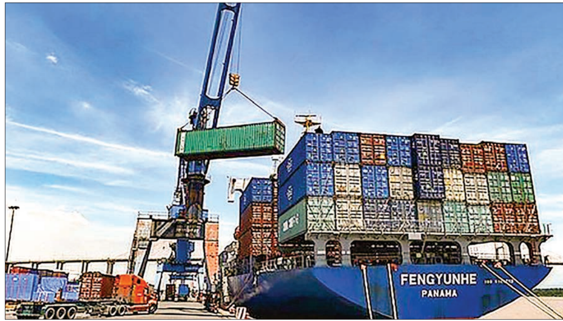
Viet Nam will emerge from the pandemic the least affected of all countries in Southeast Asia. Containers are transferred from a truck to a cargo ship at the international cargo terminal of a port in Hai Phong, Viet Nam.

The report, Coronavirus global outlook: After the outbreak by Oxford Economics, predicts that an enduring COVID-19 outbreak will see world GDP shrink by 4.7 per cent in 2020, more than double the impact of the global financial crisis in 2008 and the biggest global recession in post-war history. Similarly, most South-East Asian (SEA) economies will fall into recession in the first half of 2020 (H1), before recording a 1.9 per cent contraction in 2020. Measures to lock down countries and cities in the region to varying degrees have substantially cut domestic demand, with many countries bringing in restrictions on exports of food produce to safeguard domestic food supplies, further dampening export growth. Thailand is forecast to be one of the worst hit amongst SEA economies, because tourism and travel, which have par-