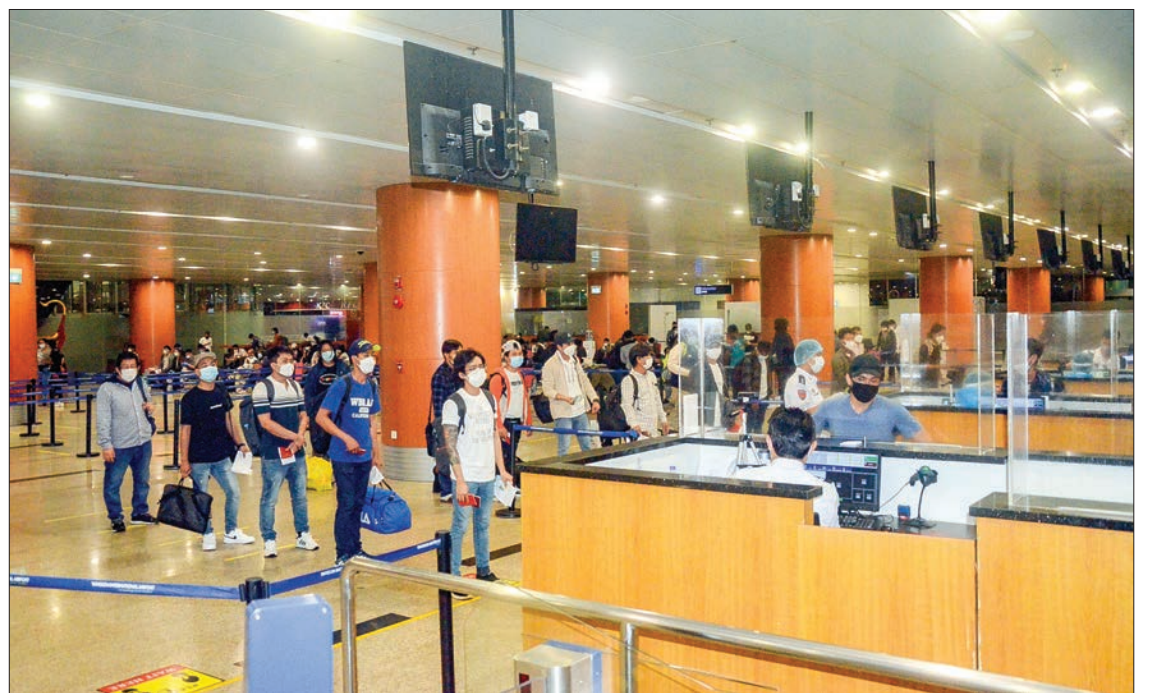
Myanmar nationals returned from foreign countries queue for immigration processes at the Yangon International Airport on 16 June 2020.

A relief flight of Myanmar Airways International (MAI) carrying a total of 132 Myanmar nationals stranded in South Korea and other seven countries landed at the Yangon International Airport yesterday.