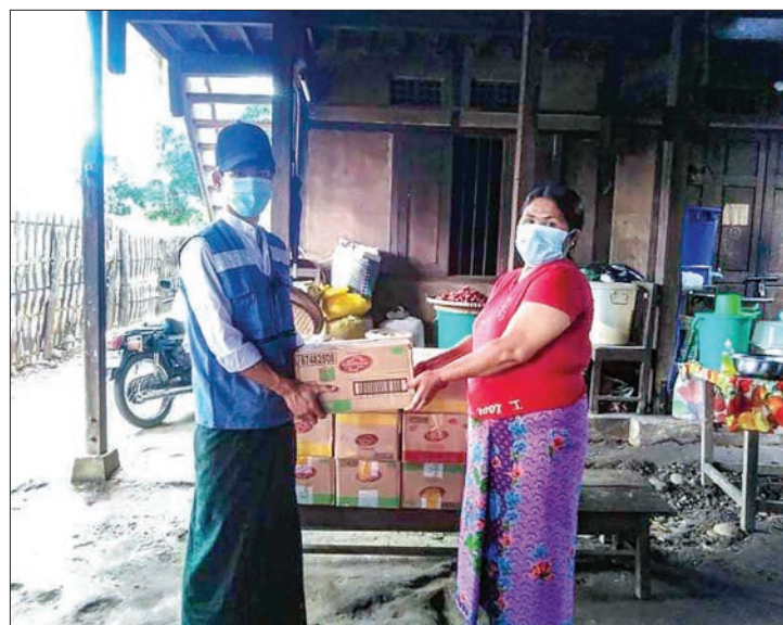
An official (left) provides soap cakes to a local woman on 16 June.