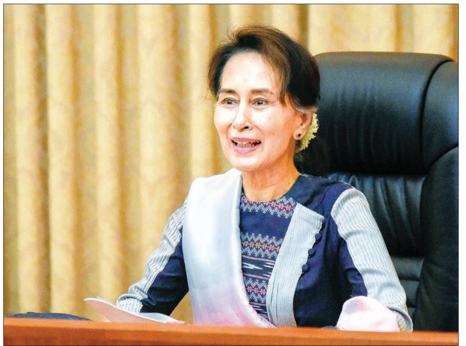
State Counsellor Daw Aung San Suu Kyi discusses relief plan of COVID-19 impacts with ministers, UMFCCI president on 16 June 2020.

S TATE Counsellor Daw Aung San Suu Kyi, Chairperson of the National-Level Central Committee on Prevention, Control and Treatment of Coronavirus Disease 2019 (COVID-19), held a videoconference from the Presidential Palace in Nay Pyi Taw yesterday with Union Minister U Thaung Tun, Chairman of the COVID-19 Eco-