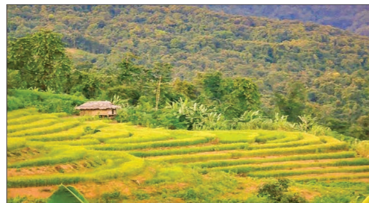
A terrace farming in Naga self-administered zone.