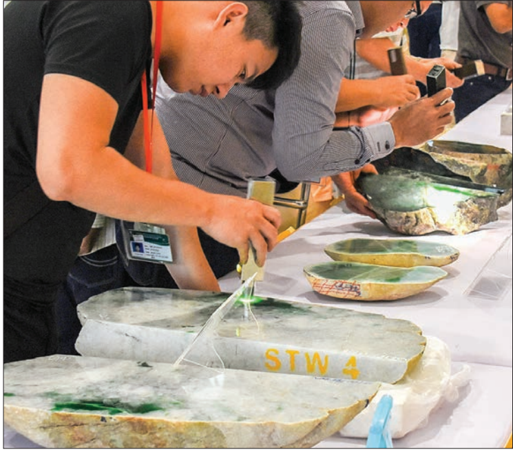
Merchants evaluate the quality of jade stones at the 55 th Myanmar Gems Emporium in Nay Pyi Taw.