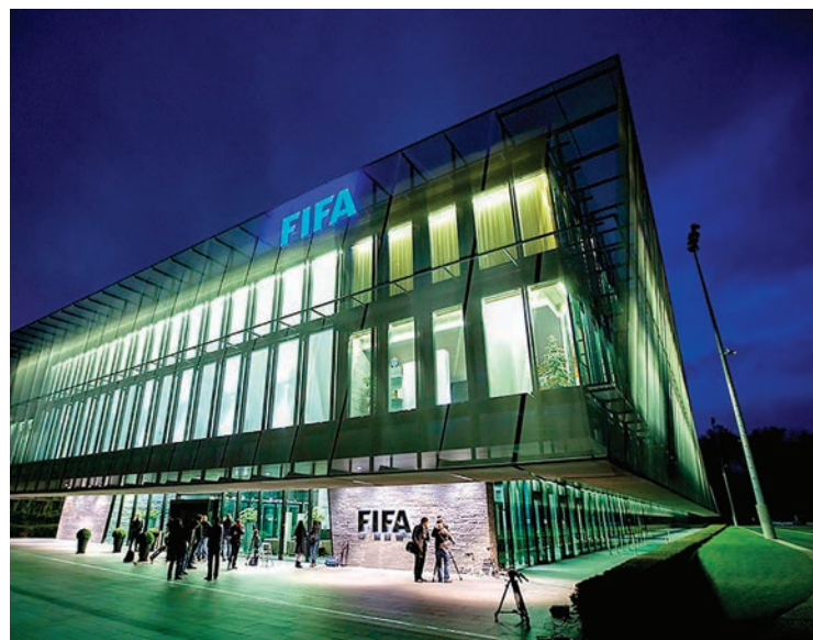
FIFA headquarters in Zurich.

In France, where the season was declared over in late April at the height of the pandemic, the domestic transfer window opened on Monday.—AFP ■