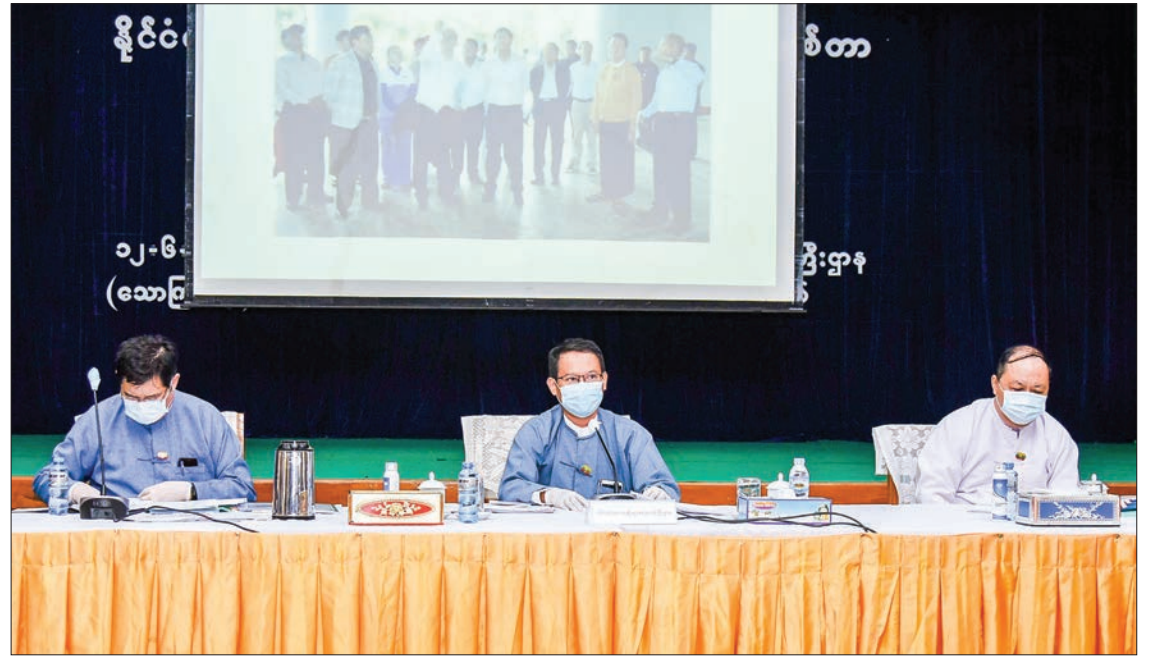
Director-General U Min Aye Ko and officials of Ministry of Ethnic Affairs hold press briefing yesterday.

Bylaws for ethnic rights protection were enacted on 23 August 2019 to support the Ethnic