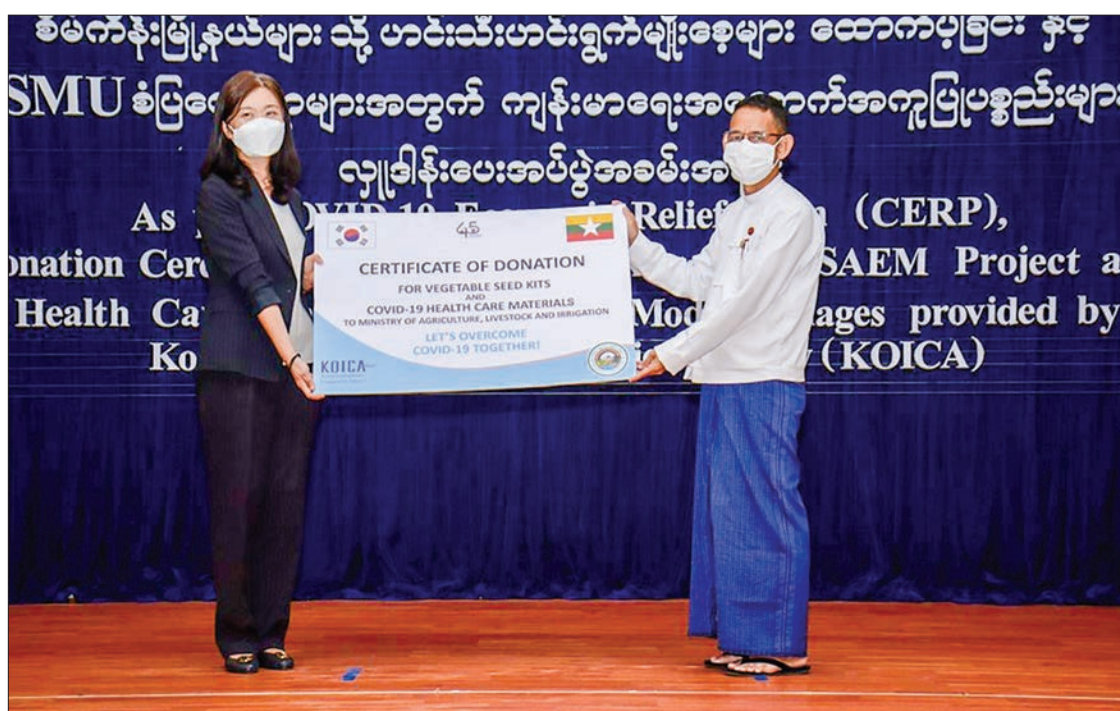
Union Minister Dr Aung Thu presents the certificate of donation to an official of KOICA for donating 210,000 USD worth of vegetable seed kits and COVID-19 healthcare materials to Myanmar.