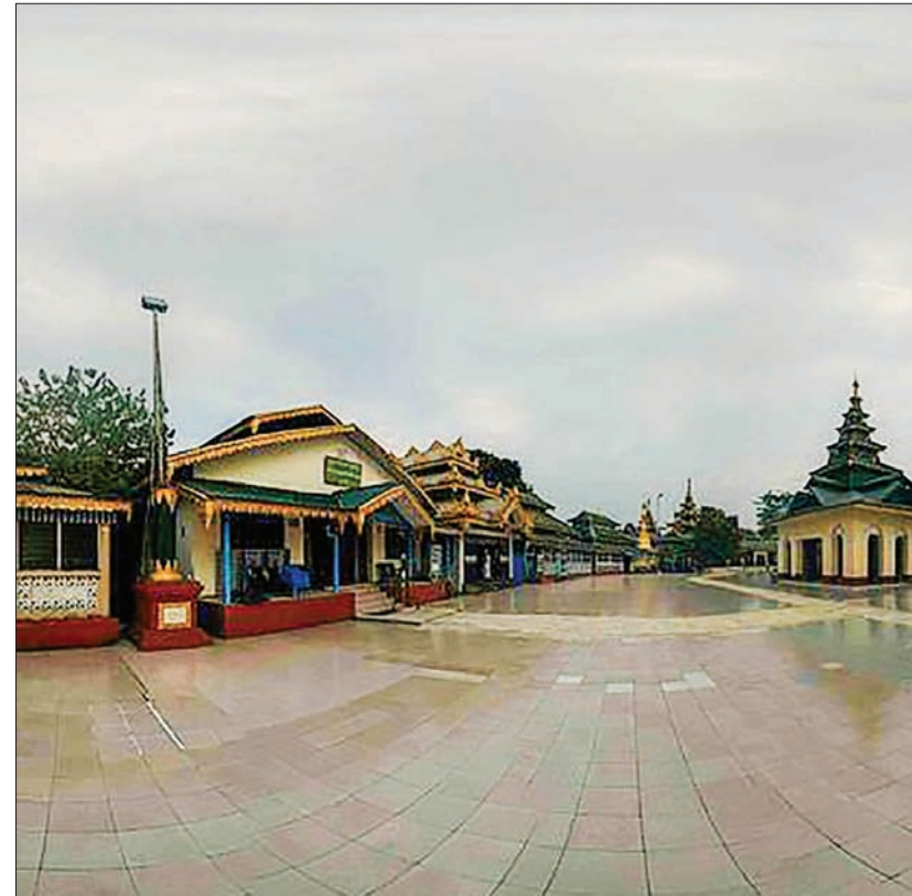
The photo shows Shwesandaw Pagoda, a pride for Twantay residents.

“Most of the terracotta-ware unearthed from the ancient terracotta kilns has a lot of markings, but some don’t