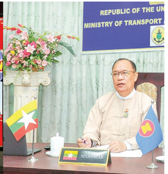
Union Minister U Thant Sin Maung participates in virtual opening ceremony of ASEAN - China Year of Digital Economy Cooperation yesterday.

Nguyen Xuan Phuc, the Chairperson of ASEAN Digital Ministers Meeting (ADGMIN) and Minister of Post and Telecommunications from Lao PDR Mr Thansamay Kommasith delivered an opening remark.