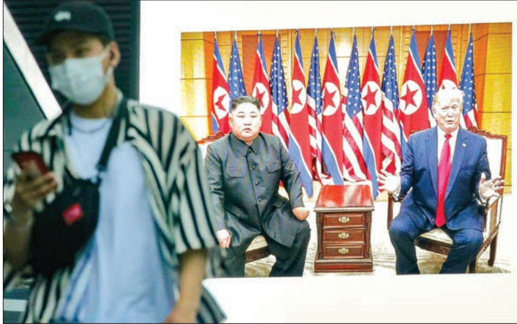
A man in Tokyo's Akihabara district walks past a screen reporting a meeting between U.S. President Donald Trump and North Korean leader Kim Jong Un in the inter-Korean truce village of Panmunjeom in the Demilitarized Zone on June 30, 2019. It was their third meeting.