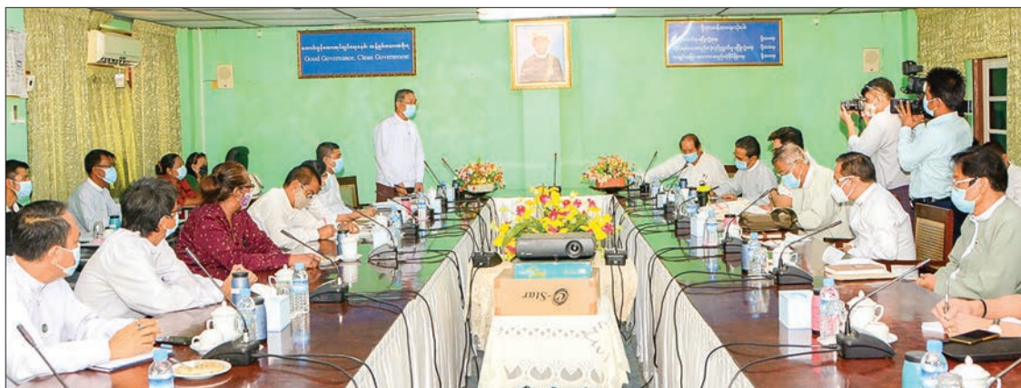
Entertainment sub-committee meets for holding centenary celebrations of Myanmar Film Industry.

Attendees of the meeting also discussed the songs for the motion picture industry, the channels that will broadcast the centenary celebration, and shooting 3D photos.—Ohmmar, Yi Yi (Translated by Kyaw Zin Tun)