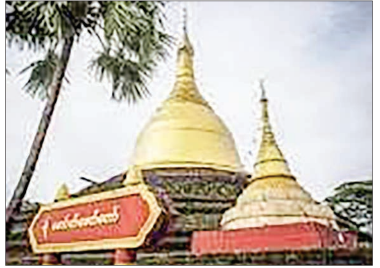
The photo shows ancient Maungte stupa built by King Anawratha and its precinct in San village, Twantay Township.