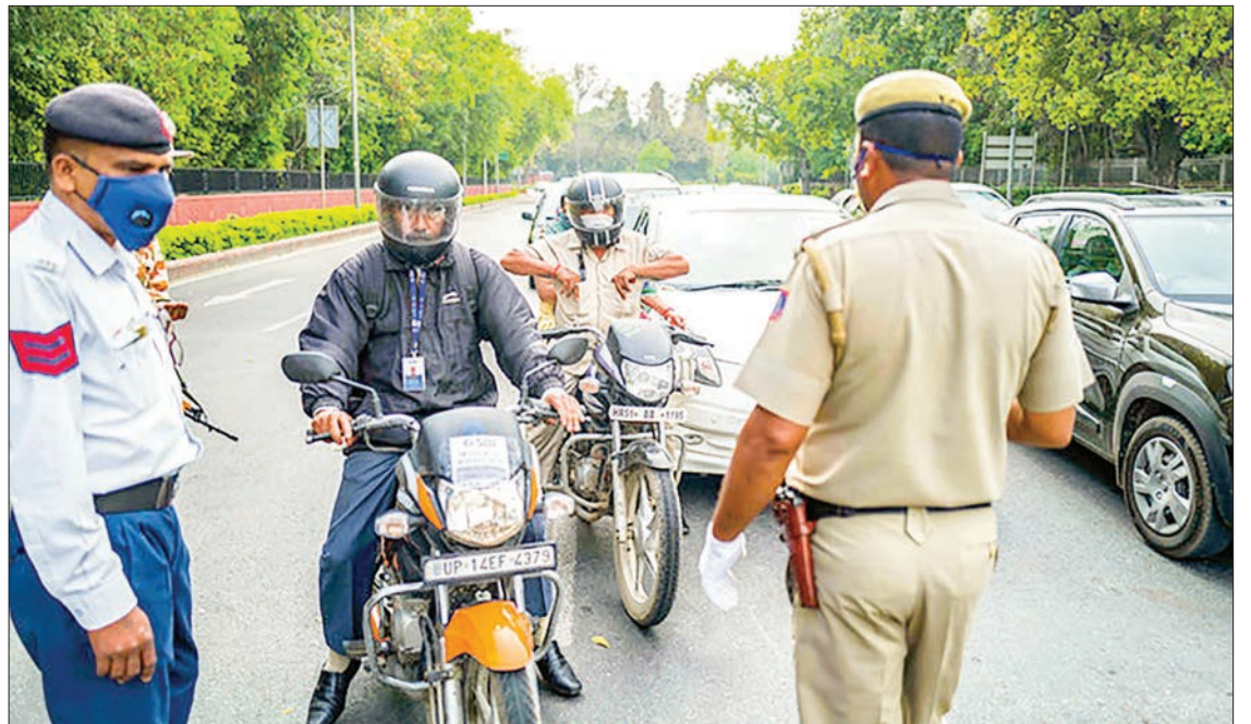
FILE: Police check motorists at a checkpoint during a government-imposed nationwide lockdown as a preventive measure against the COVID-19 coronavirus in New Delhi on March 26, 2020.

The State of Uttar Pradesh has been asked to furnish a response clarifying how the order passed by the DM was allowed while also directing the DM himself to review his order.—ANI ■