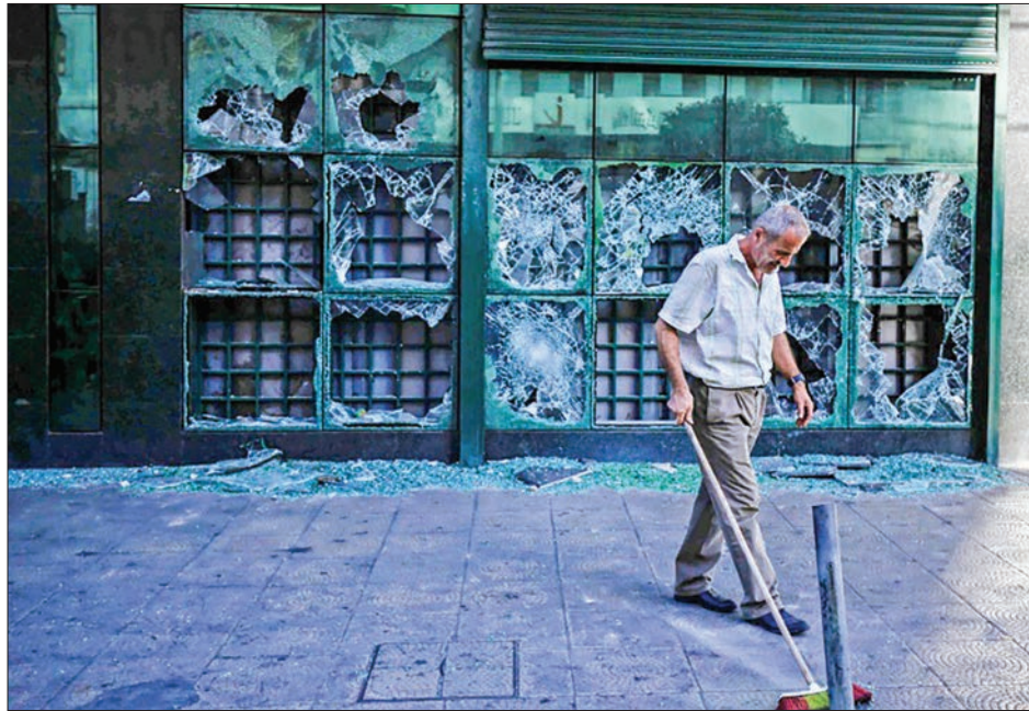
A man cleans up outside a bank that was vandalized by protesters in Lebanon's northern city of Tripoli.

BEIRUT — Lebanon's government held crisis talks Friday after the country's currency plumed record lows on the black market, triggering a night of angry protests over the worst recession in decades.