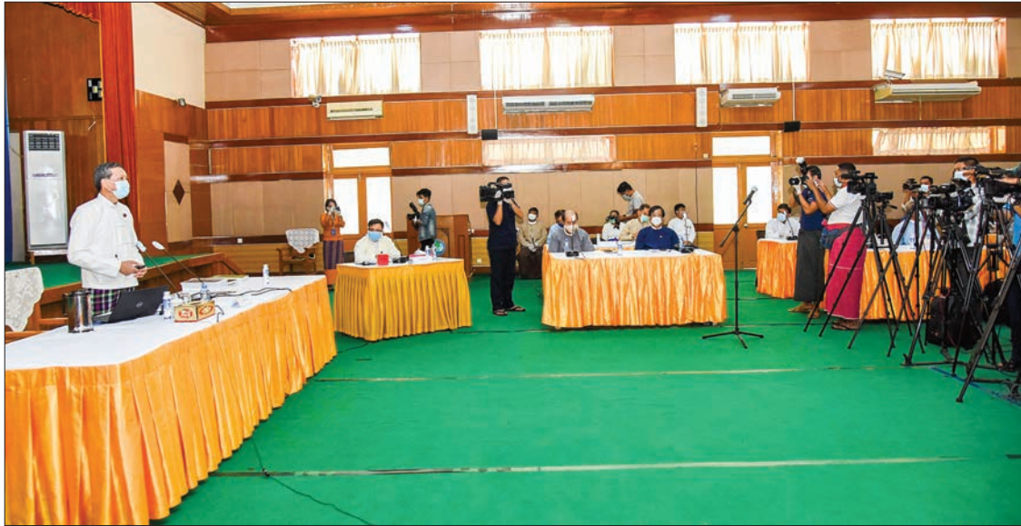
Union Minister for Education Dr Myo Thein Gyi explains the 4 th -year performances of the ministry at the press briefing yesterday.

THE Ministry of Education, the Ministry of Social Welfare, Relief and Resettlement, the Ministry of Ethnic Affairs and the Nay Pyi Taw Council held press briefings on their 4 th -year performances yesterday.