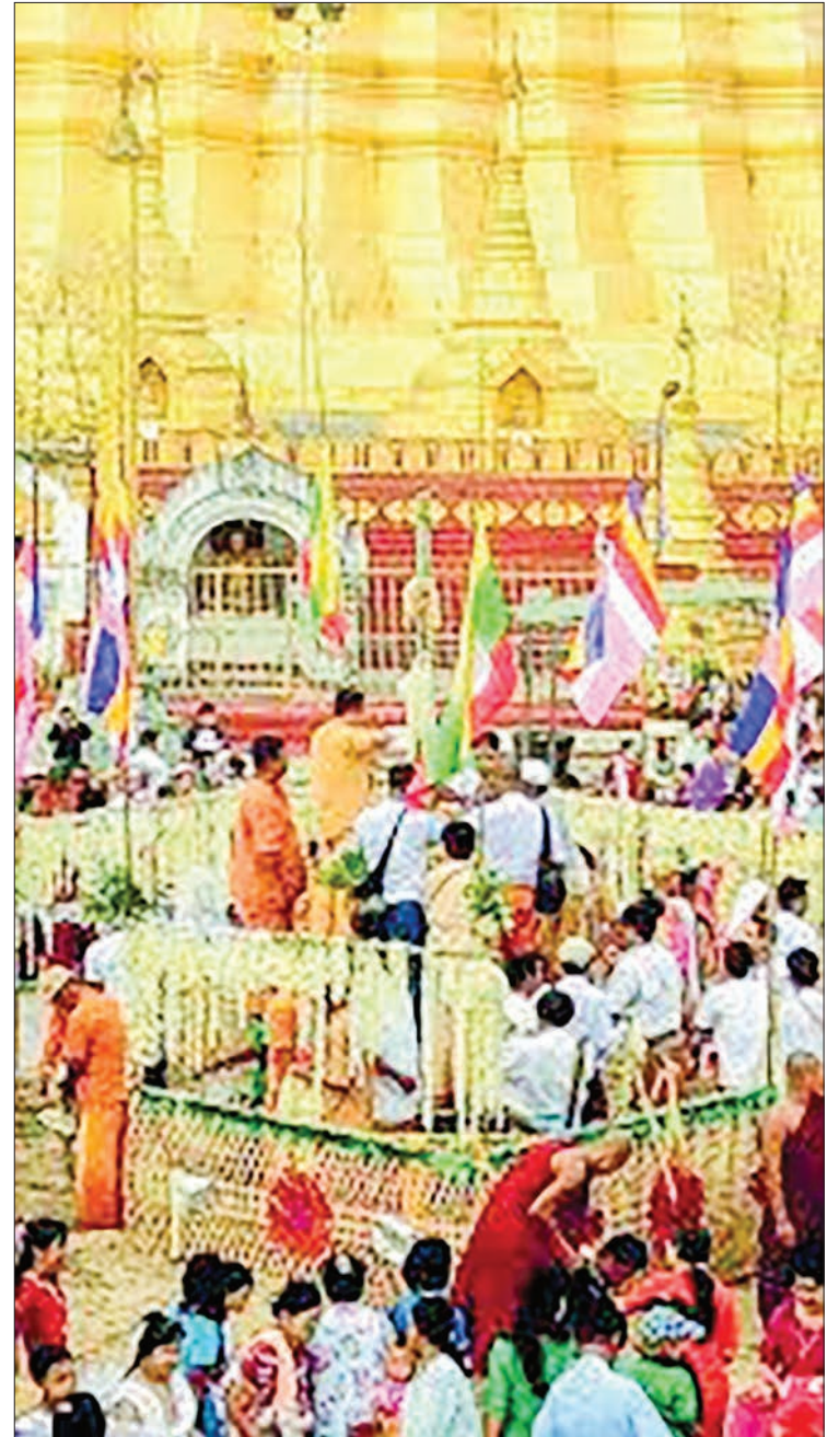
Shan traditional sand pagoda is held at the Sunday corner on the platform of Shwesandaw Pagoda on Myanmar New Year day.

The visitors can pay homage to Shwesandaw Pagoda, a pride for Twantay residents, Kyaikkaytha Pagoda in Pokayawady old town where is the native place of Taphutha and Balika, ancient Maungte Stupa built by King Anawratha in San