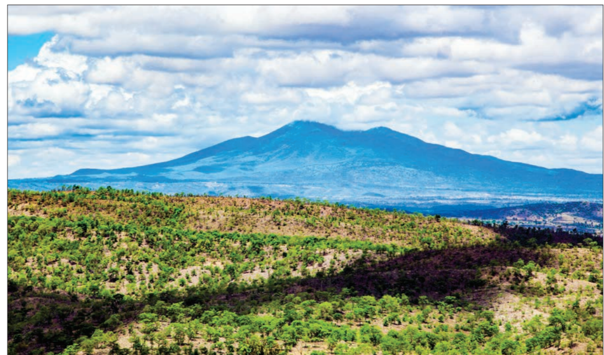
Mount Popa.