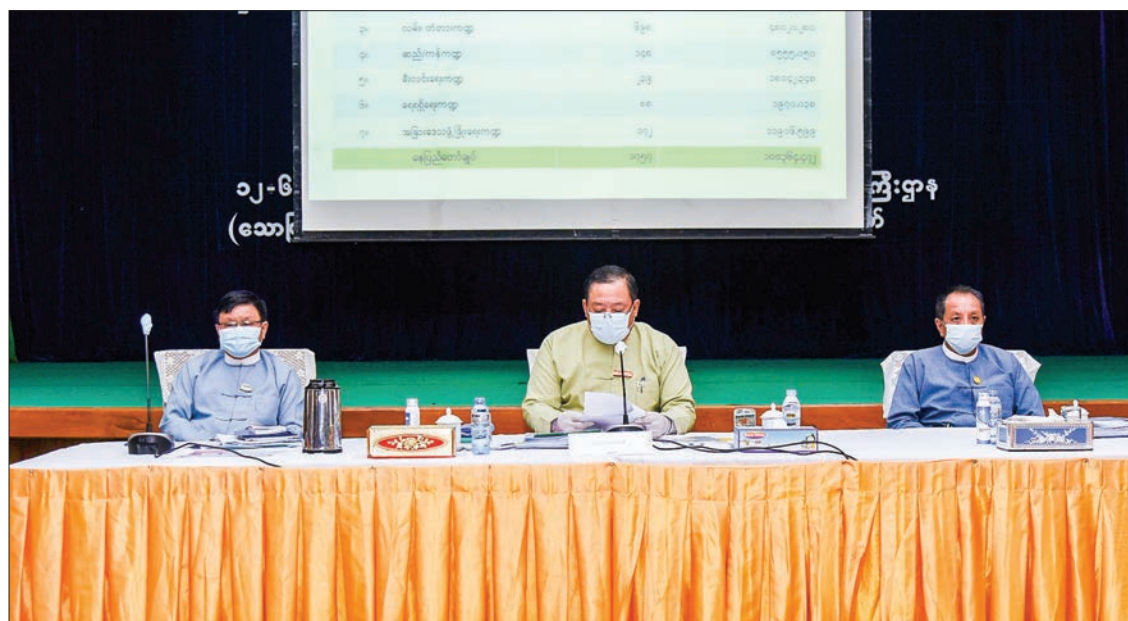
Secretary U Khin Maung Aye and officials hold press briefing on 4 th -year performances of Nay Pyi Taw Council.