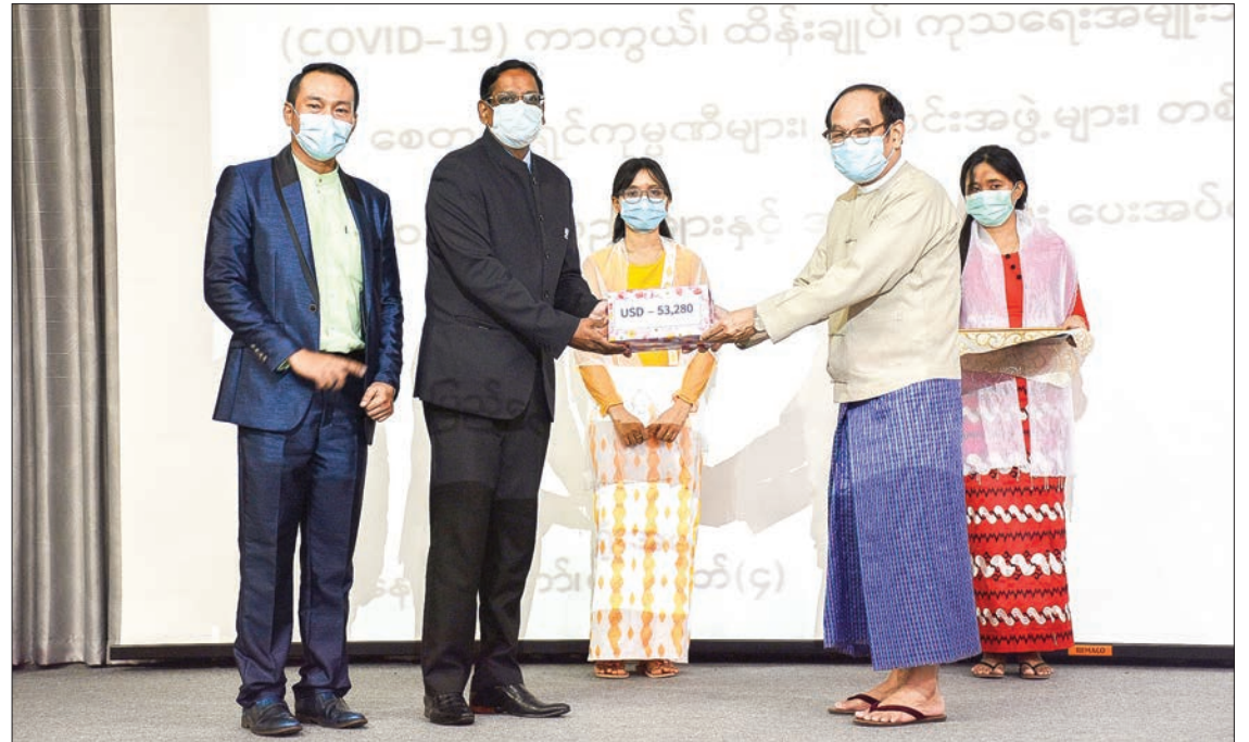
Union Minister for Health and Sports Dr Myint Htwe receives cash donation for COVID-19 central committee.

Novartis Pharma Services donated US$ 210,000 worth of 7,827 SARS-COV 2 test kits and 2,496 PPE sets, Unilever EAC Myanmar Co., Ltd $3,280 worth of 2,880 2019-nCov Nucleic acid Diagnostic kits, ASA microfinance (Myanmar) Limited (Mingaladon) K 7 million, People's Party 50 PPE sets and 5,000 masks, and Tharaphu Soe Myint Co., Ltd K 5 million worth of PPE, N95 masks, hand gel and