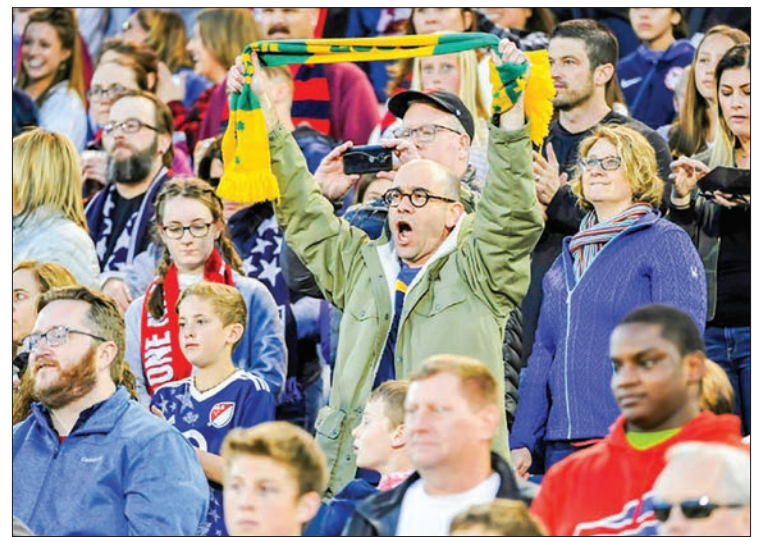
Crowds of up to 10,000 are to be allowed back into Australian sports stadiums from July.

barred from Australian sporting events since mid-March when competitions ground to a halt as the coronavirus pandemic took hold.