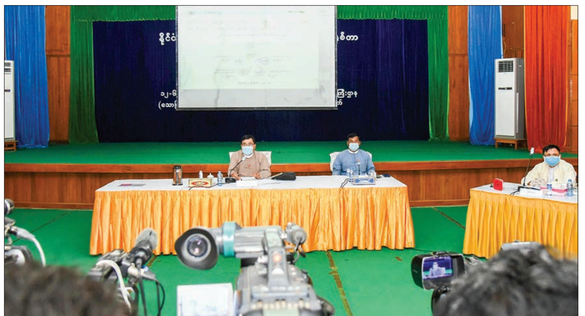
Union Minister for Social Welfare, Relief and Resettlement Dr Win Myat Aye gives press briefing on the 4 th -year performances of the ministry yesterday.