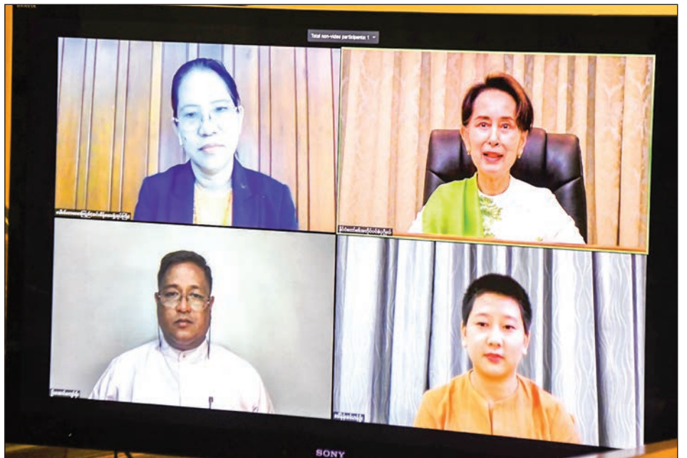
State Counsellor Daw Aung San Suu Kyi speaks to front-liners over measures against COVID-19 on videoconference yesterday.

S TATE Counsellor Daw Aung San Suu Kyi, Chairperson of the National-Level Central Committee on Prevention, Control and Treatment of Coronavirus Disease 2019 (COVID-19), held a videoconference from the Presidential Palace in Nay Pyi Taw yesterday, with pioneers combatting COVID-19.