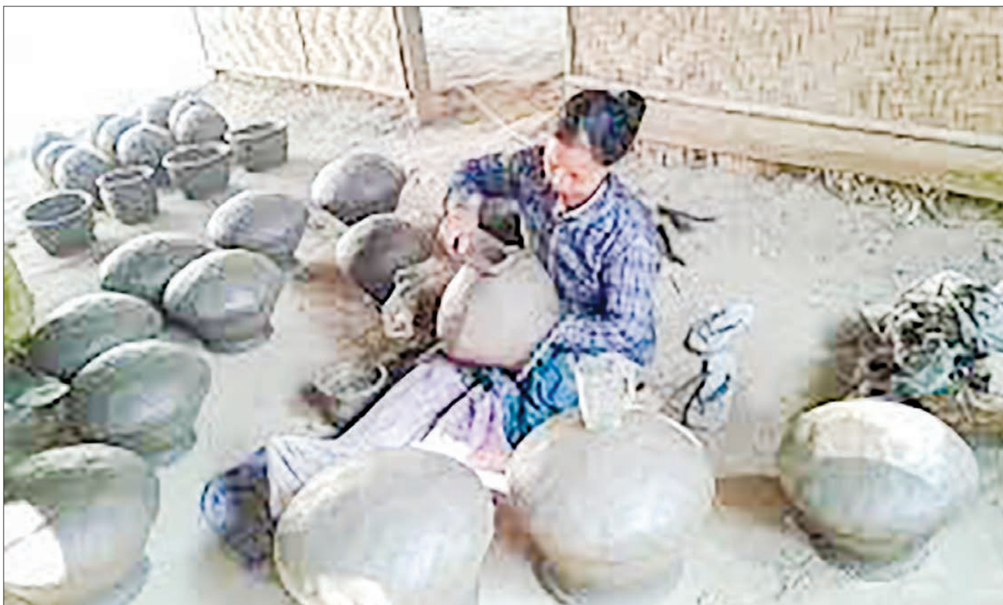
The photo shows a pottery site in Twantay.

Pottery business has been done in Twantay also known as the town of pots from time immemorial. The various reasons are driving the pottery to