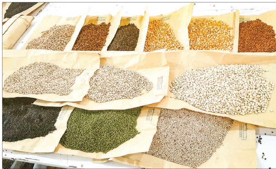
Pigeon peas are displayed at a commodity depot in Mandalay.