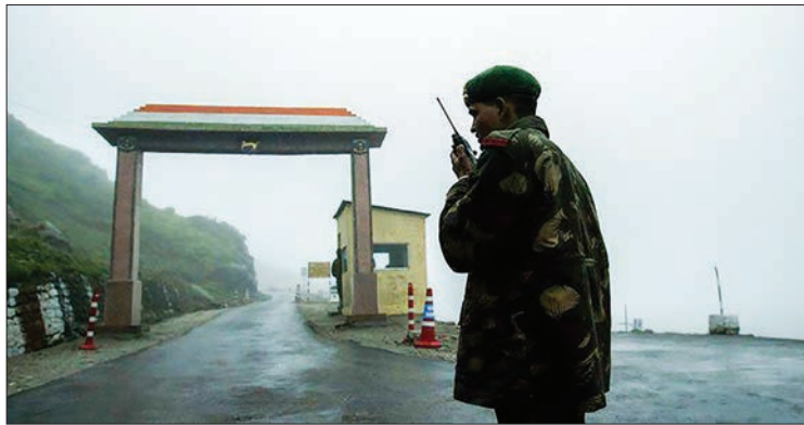
In this file photograph taken on July 4, 2006, an Indian soldier communicates with colleagues on a walkie talkie at Nathula Gate, leading to the Nathu La border crossing between India and China, some 50 kms (31 miles) east of Sikkim state capital Gangtok.

“Both sides agreed to peacefully resolve the situation in the border areas in accordance with various bilateral agreements,” the foreign ministry said in a