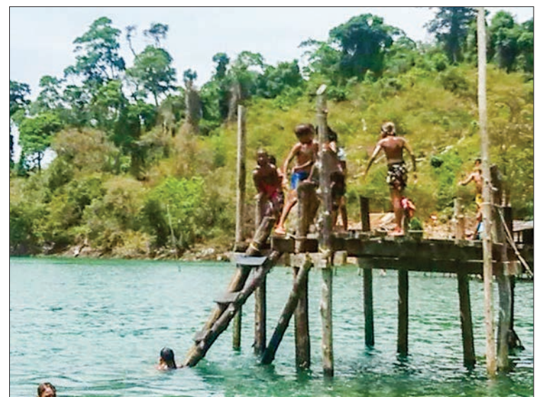
Salon children bathing in the water.