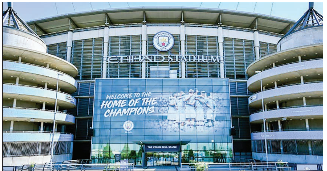
Manchester City's appeal against a two-season ban from European football begins on Monday.

LONDON — Manchester City's appeal against a two-year ban from European competition will be heard by the Court of Arbitration for Sport (CAS) from Monday in a case of wide-reaching repercussions.