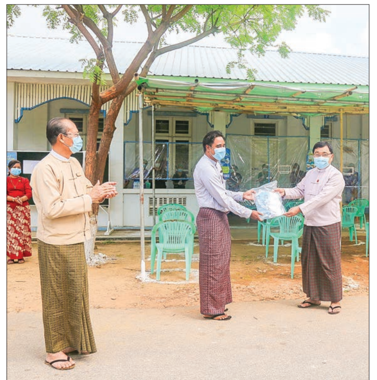
Union Minister Dr Win Myat Aye hands over the face masks to the volunteer at the quarantine centre in Nay Pyi Taw yesterday.

The National Volunteer Steering Committee will ensure the certificates arrive in the hands of the 334 volunteers and 34 philanthropic groups and will continue to identify, acknowledge and award certificates and brooches to volunteers and philanthropic groups across the states and regions. — MNA (Translated by Zaw Htet Oo) ■