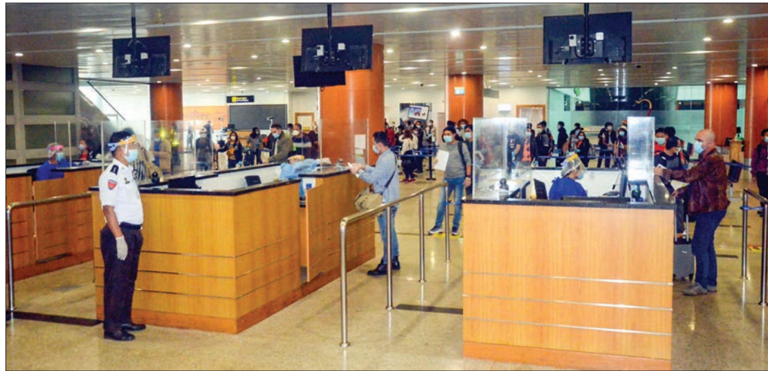
Myanmar citizens making their immigration processes at the Yangon International Airport yesterday.