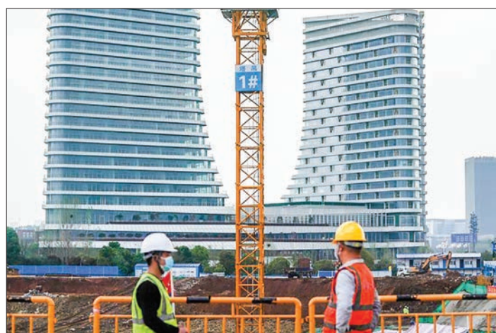
Workers observe the progress at a construction site of a project undertaken by the China Construction Third Engineering Bureau Co., Ltd in Wuhan, central China’s Hubei Province, March 26, 2020.

China currently has a total of 97 central SOEs. —Xinhua