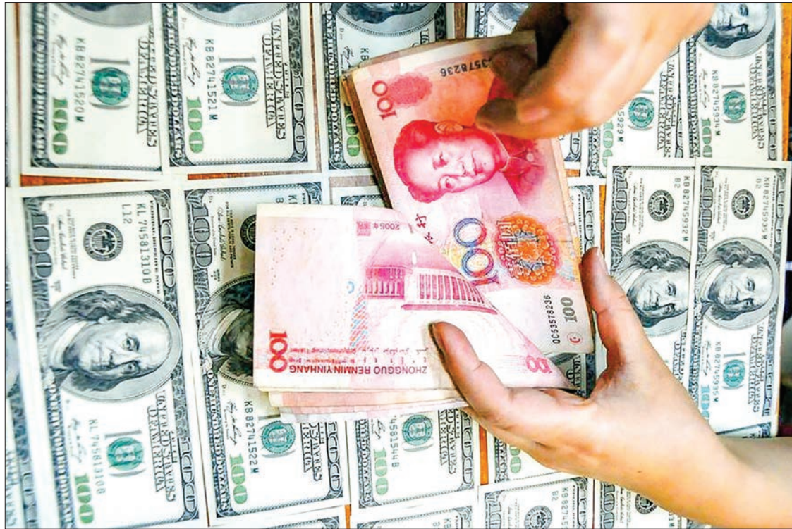
China's foreign exchange reserves expanded to 3.1017 trillion U.S. dollars at the end of May, from 3.0915 trillion dollars at the end of April.