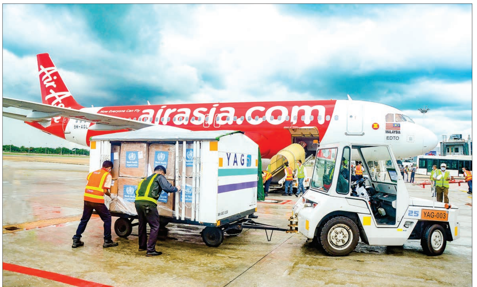
Workers unloading medical supplies donated by the WHO from the special relief flight at the Yangon International Airport.