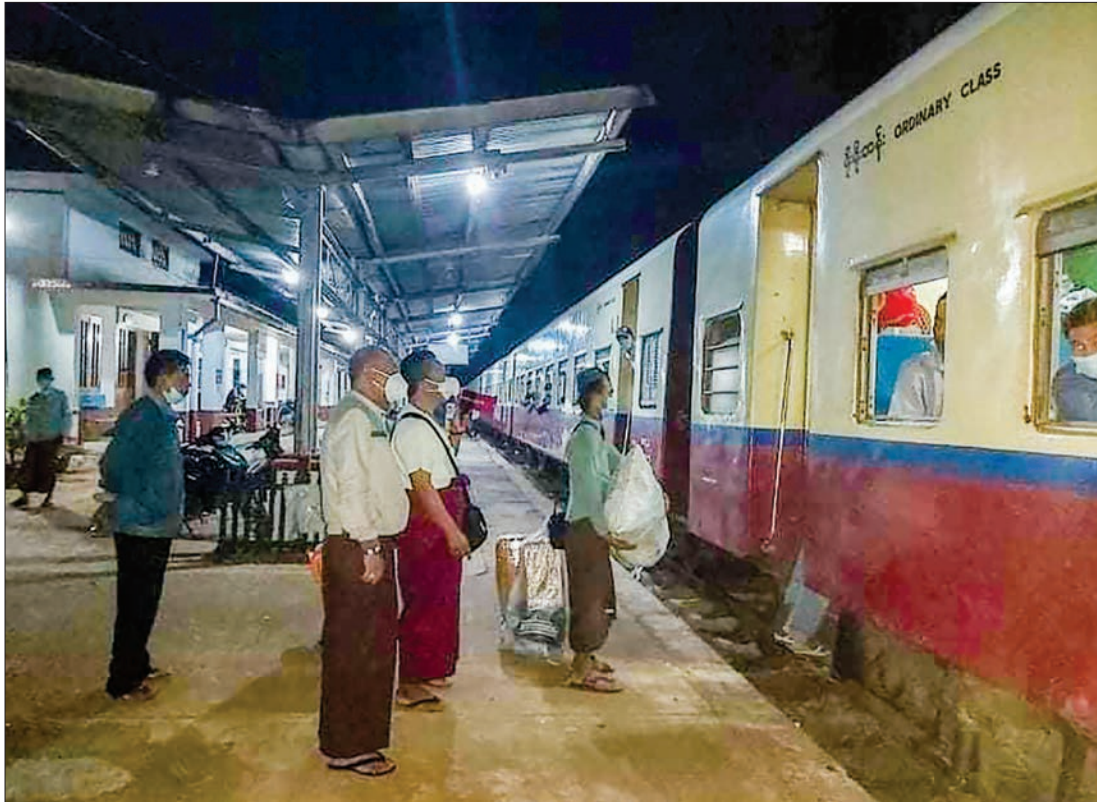
Myanmar citizens returning home from China seen at the Lashio Railways Station yesterday.

A total of 260 Myanmar nationals who returned from China were transported back to their native places via Lashio in northern Shan State by train yesterday.