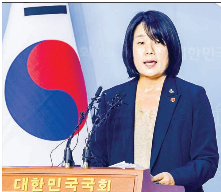
Yoon Mi Hyang, the former head of a South Korean group aimed at solving the issue of “comfort women”, who worked at Japanese wartime military brothels, speaks at a press conference in Seoul on May 29, 2020.

SEOUL — The head of a South Korean shelter for so-called comfort women run by an organization being investigated for alleged accounting irregularities has been found dead in an apparent suicide, Yonhap News Agency reported Sunday.