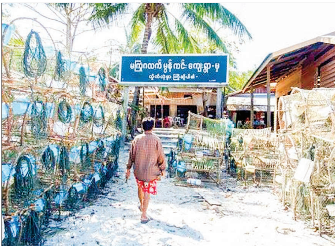
Entrance of Makyongalet village, Kawthoung, Taninthayi Region.

southeast to Bokpyin. The park, 12 miles to Taninthayi coast, is located between north latitude 10° 32' and 11° 02' and east longitude 97° 59' and 98° 23' in the sea. It is a single national marine park of the country formed with more than 200 islands including the main island and five small islands.