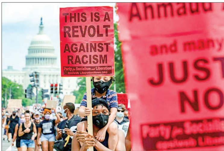
Thousands of people have been taking part in more than a week of protests nationwide against racism and police brutality after the death of George Floyd.

Other media have pointed out that financial markets tend to rebound after periods of social unrest, including Fortune magazine.—AFP ■