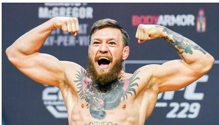
Irish UFC superstar Conor McGregor has announced he is retiring from mixed martial arts.

The controversial fighter, nicknamed "The Notorious", first announced his retirement from the sport in March last year after being battered into submission by arch-rival Khabib Nurmagomedov in October 2018.—AFP