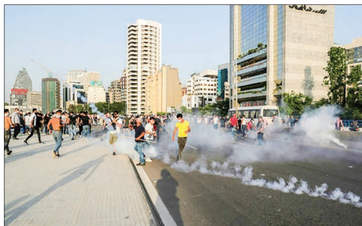
Lebanese protesters also clashed with riot police.

capital Saturday to decry the collapse of the economy, as clashes