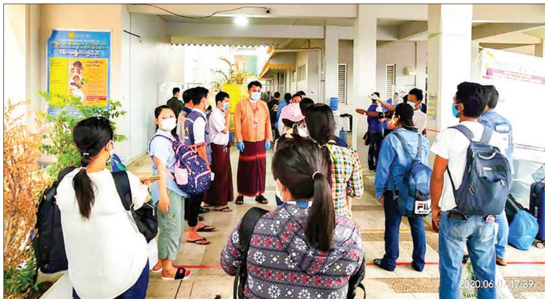
Officials helping the Myanmar returnees from Thailand at the Myawady Border Gate yesterday.