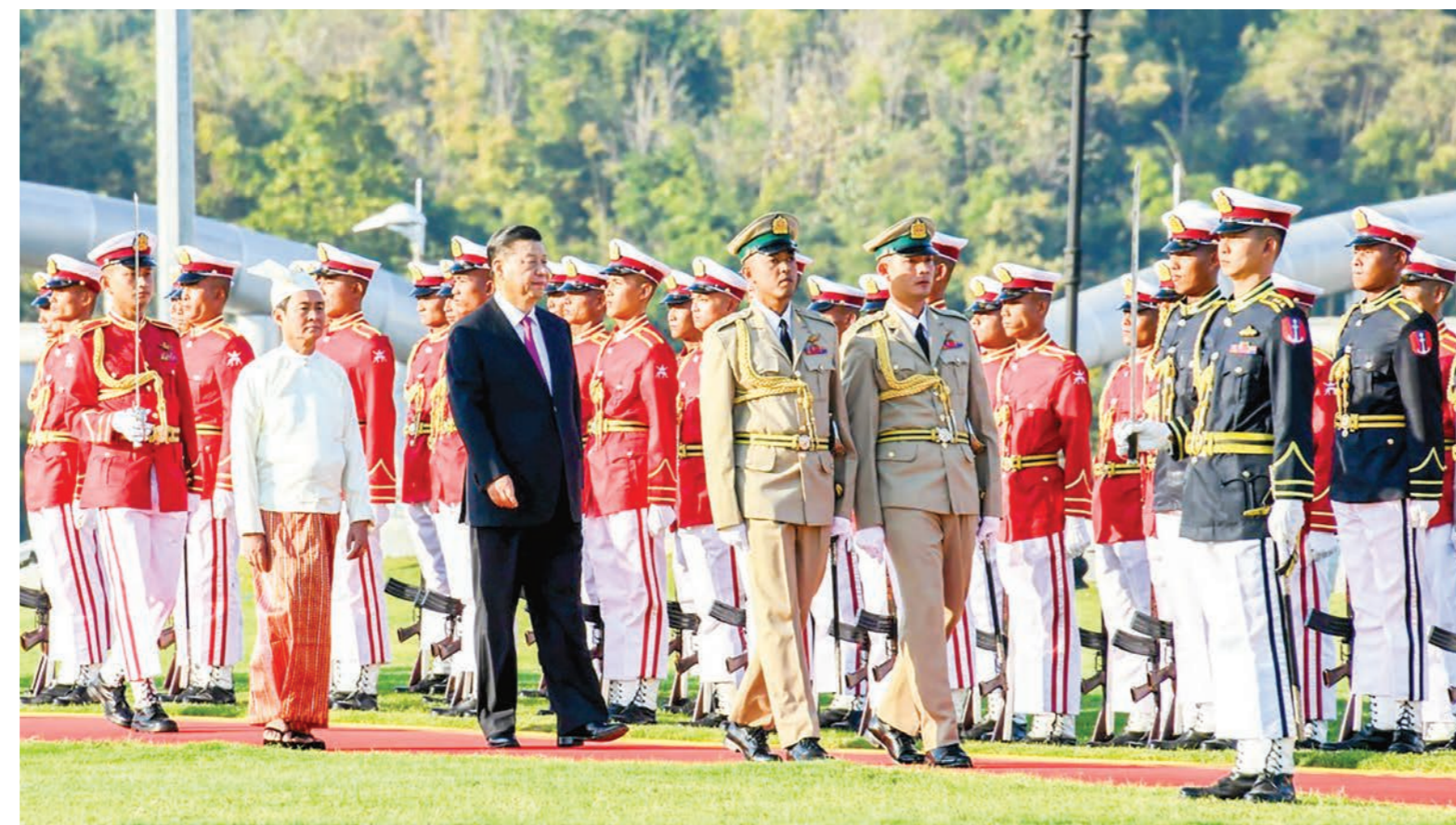
President U Win Myint and President of the People's Republic of China Mr Xi Jinping inspect the Guard of Honour at the Presidential Palace in Nay Pyi Taw on 17 January, 2020.

-----Stay forward-looking and promote closer people-to-people ties. Recently, China and Myanmar have been working together to fight the ongoing COVID-19 pandemic. Myanmar's government, military and social organizations have actively contributed to China's fight against the pandemic. China has also donated medical supplies to Myanmar and sent teams of medical experts to help improve Myanmar's capacity to combat the pandemic. These efforts are vivid examples of building a China-Myanmar community with a shared future. We are willing to strengthen