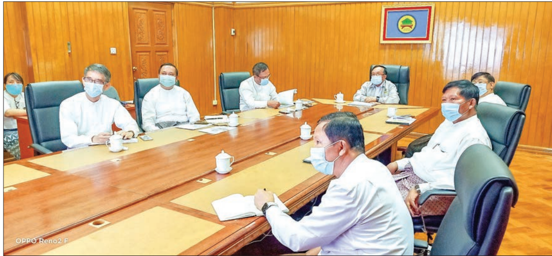
Union Minister U Han Zaw holds the videoconference discussing easing of toll collections on some motorways and development undertakings in Ayeyawady Region.

Directors (Civil) of Bridge Department's Construction Team (1) U Kyaw Swar Tun and Construction Team (2) U Aung Thiha also reported on their