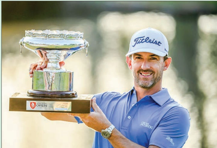
Australia's Wade Ormsby, seen here winning the Hong Kong Open in January, is the current Asian Tour Order of Merit leader.

HONG KONG — The Asian Tour announced on Sunday plans to restart its coronavirus-ravaged season in September after a six-month suspension, but players may have to travel alone despite restrictions beginning to ease across the world's most populous continent.