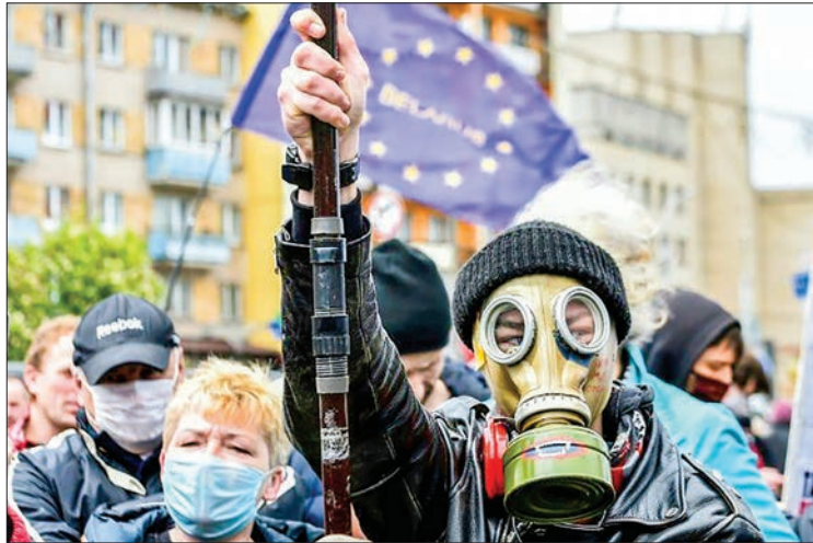
Elections are often a formality in Belarus.

MINSK — Just a year after the launch of his channel, Belarusian