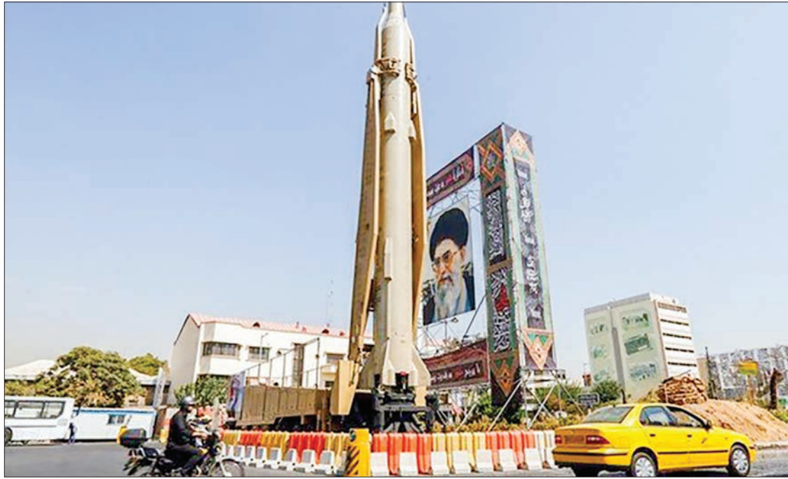
A UN ban on weapons sales to Tehran will come to an end in October 2020.

Under Resolution 2231, arms embargo on Iran will be lifted in October 2020. However,