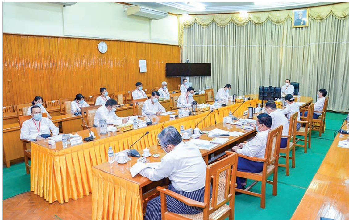
Union Minister U Win Khaing holds the coordination meeting on LNG to Power Project yesterday.

The Union Minister then responded that the LNG ship