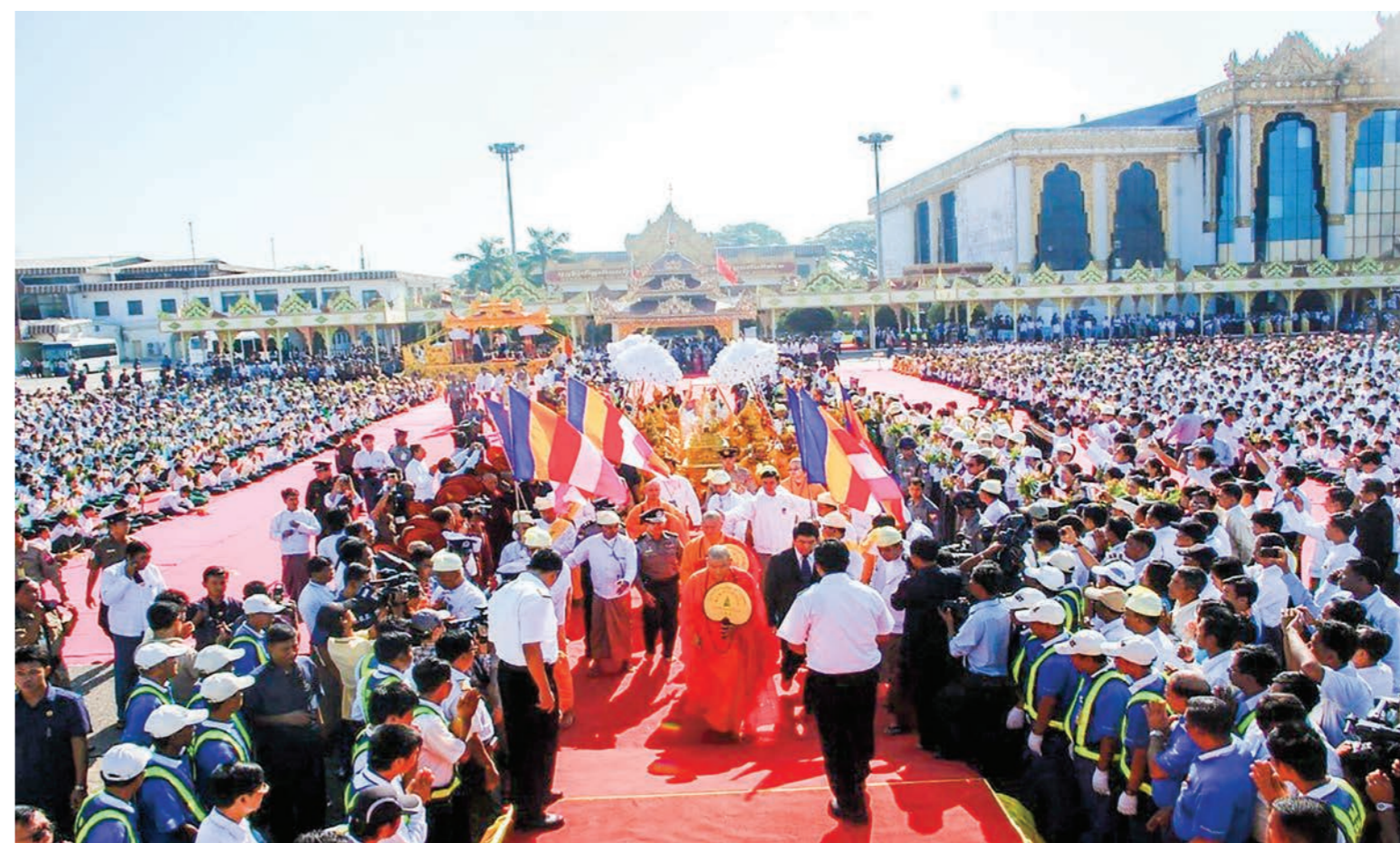
The fourth enshrinement visit of the Buddha's tooth relic to Myanmar in 2011.

Today, the international environment is changing fast and while China-Myanmar relations remain steadfast. Adhering to the Five Principles of Peaceful Coexistence, we wish to maintain, consolidate and develop political mutual trust with Myanmar, pass on the precious traditional friendship between the two countries so as to embed the sense of a Chi-