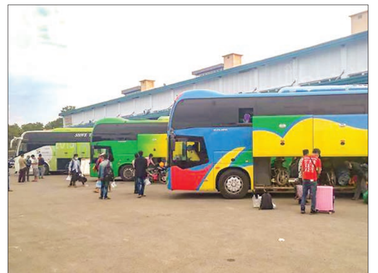
Myanmar migrant workers seen at the Taunggyi Business Centre Highway Bus Terminal.

Members of Taunggyi Township COVID-19 Control and Emergency Response Committee, well-wishers, traffic police, officials, Taunggyi Township's volunteers, Red Cross members, and members of aux-