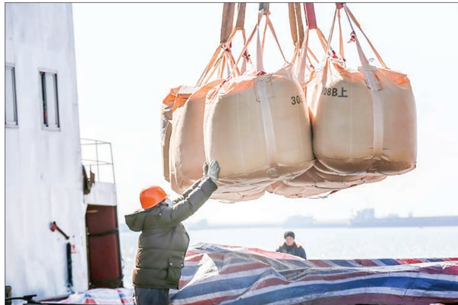
China has worked to restart its economy after bringing activity to a standstill to curb the coronavirus spread, but its key overseas markets are suffering downturns.

Exports from the manufacturing powerhouse fell 3.3 percent on-year last month, better than the 6.5 percent slide expected by a Bloomberg poll of analysts.