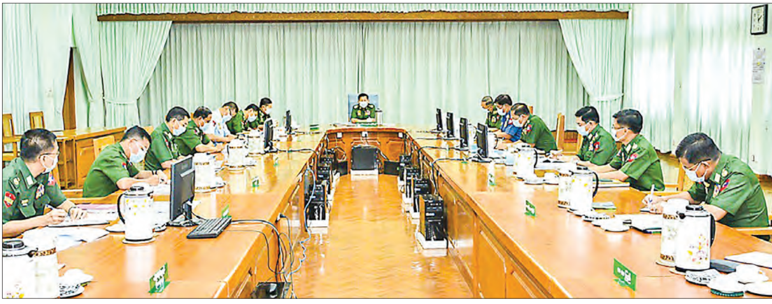
Commander-in-Chief of Denfence Services Senior General Min Aung Hlaing holds the 8<sup>th</sup> coordination meeting for fighting against COVID-19 pandemic at the Office of Commander-in-Chief (Army) on 3 June.

The senior Tatmadaw officers discussed the works of emergency response committees for COVID-19 measures in regions and states, 3,437 persons tested at military hospitals and battalions by rapid test kit, 803 by the Real-Time PCR Detection System, and 1,494 by Cobas 6800.