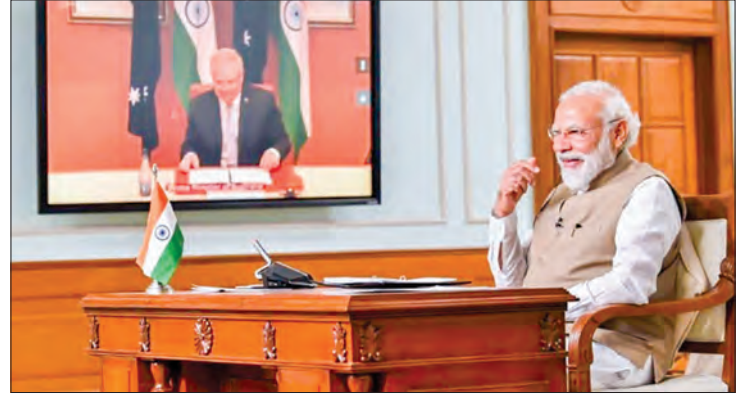
Prime Minister Narendra Modi with his Australian counterpart Scott Morrison during the virtual summit on Thursday.

Both countries also announced upgrading a key dialogue —till now held between the foreign secretaries and defence secretaries of the two countries — to the level of foreign and defence ministers. Speaking ahead of the start of delegation level talks at the virtual summit with his Australian counterpart Scott Morrison, Prime Minister Naren-