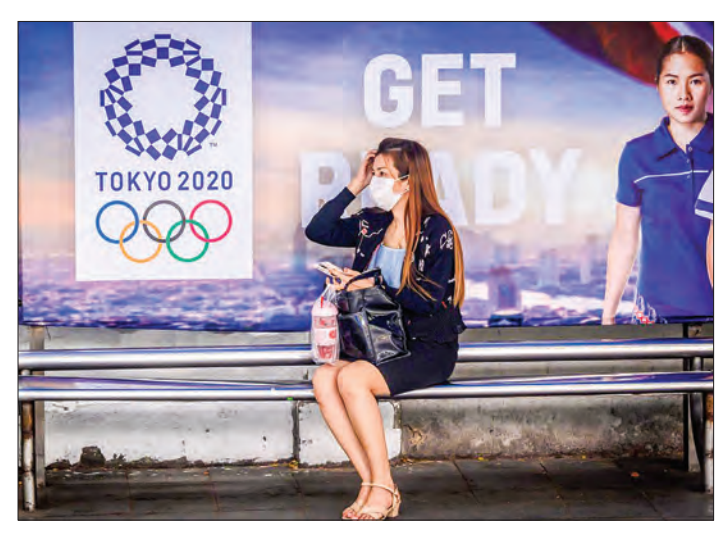
A woman wearing a facemask, amid concerns over the spread of the COVID-19 coronavirus, sits at a bus stop in front of a Tokyo 2020 Olympics advertisement.

TOKYO — Tokyo 2020 officials are looking at ways to scale back next year's postponed Olympics, the city's governor said Thursday, amid reports the opening ceremony could be streamlined and spectator numbers cut.Yuriko Koike told reporters that organizers were weighing up what could be "rationalized and simplified" as costs spiral for holding the first postponed Games in history. The International Olympic Committee announced in March the Games would be delayed due to the coronavirus pandemic that has killed hundreds of thousands and brought