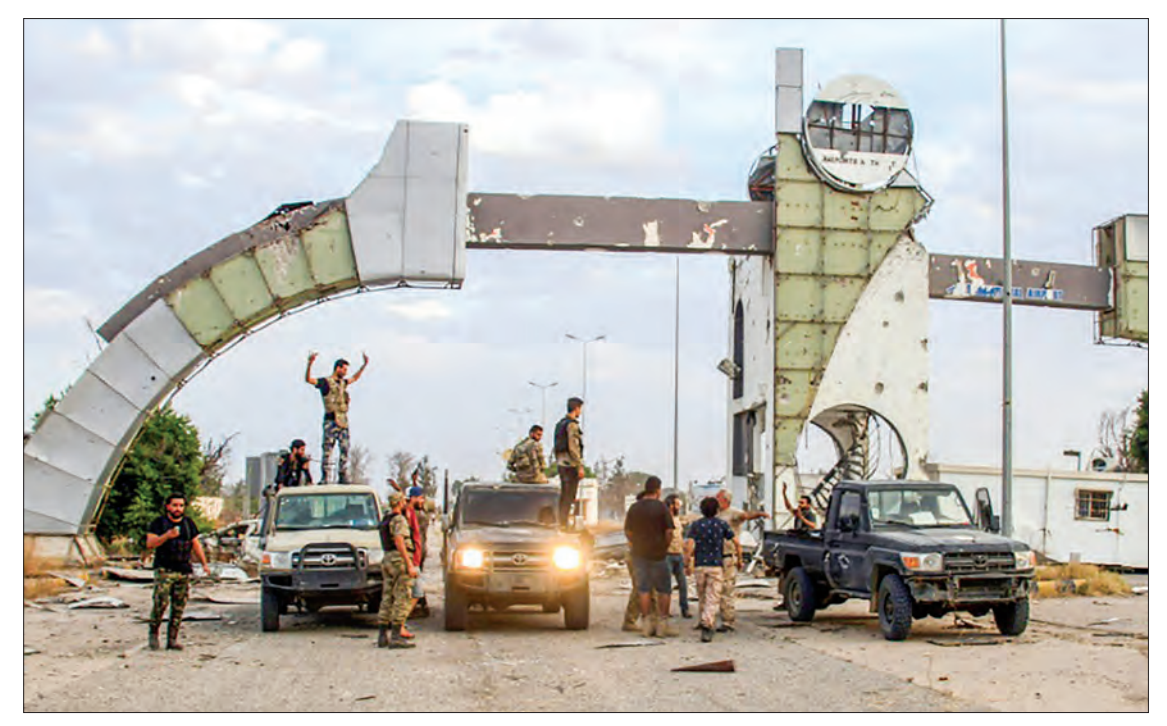
Fighters loyal to the UN-recognized Libyan Government of National Accord recapture Tripoli International Airport after clashes with strongman Khalifa Haftar.

German ambassador, said there needed to be a political rather than military solution.