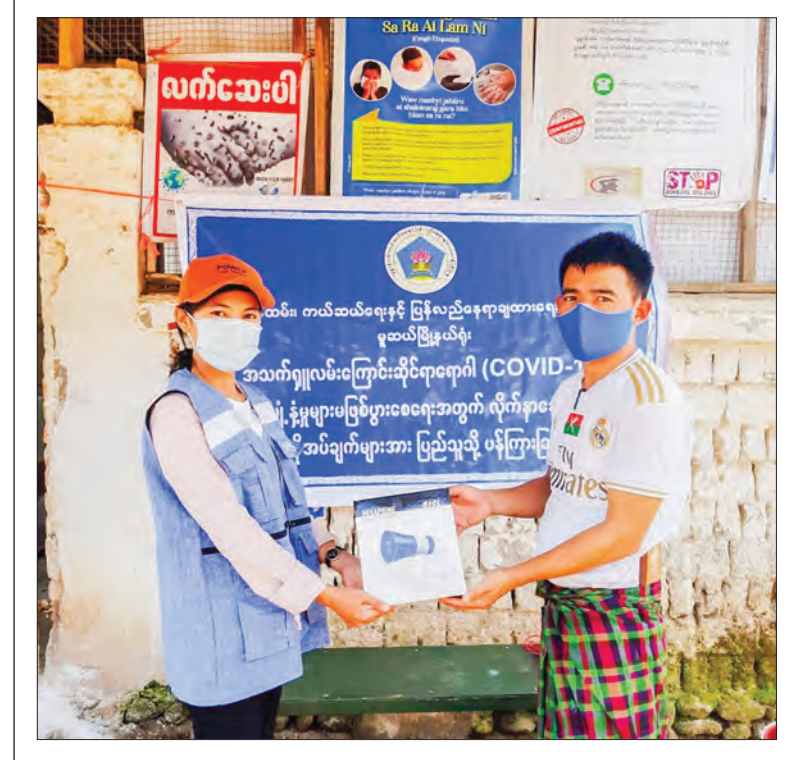
Staff from Ministry of Social Welfare, Relief and Resettlement handing over the COVID-19 medical equipment to an internally displaed person in Muse, Shan State.