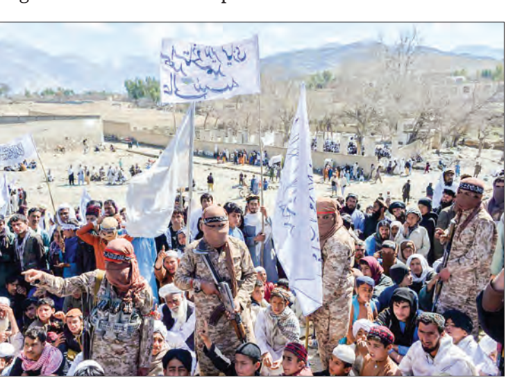
Afghan Taliban militants.