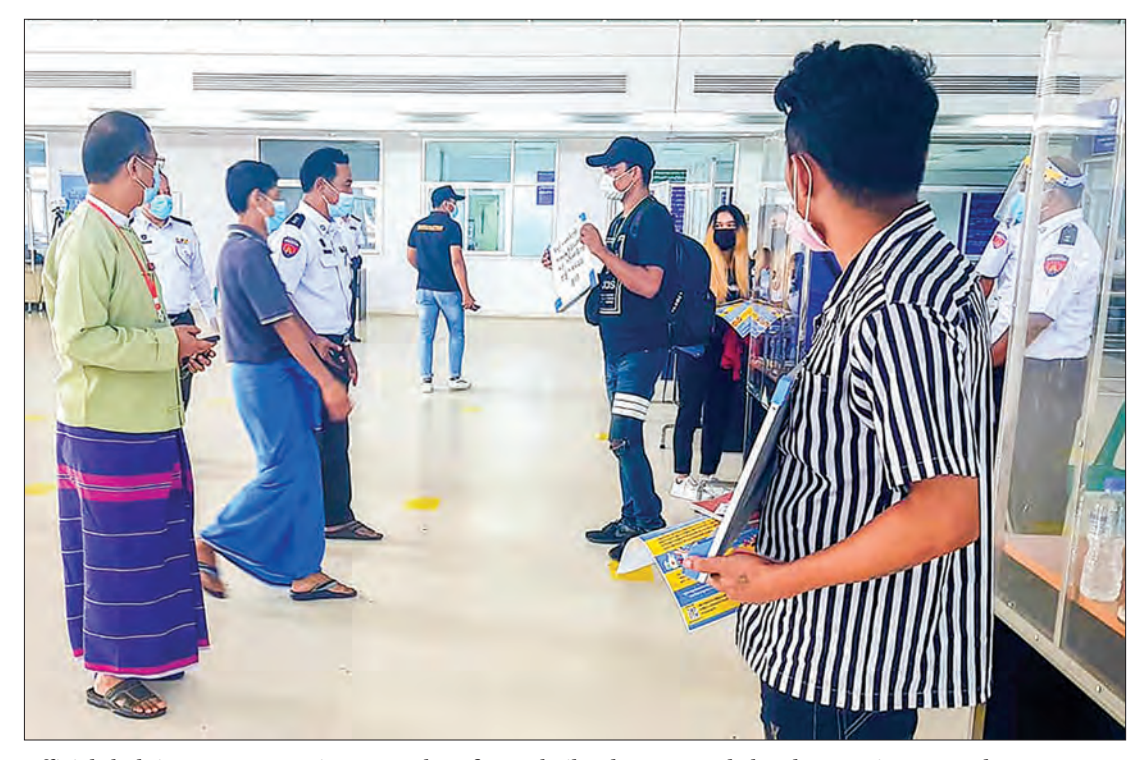
Officials helping Myanmar migrant workers from Thailand at Myawady border crossing yesterday.

MYANMAR has been making systematic arrangement for the return of migrant workers from Thailand since 1 May.