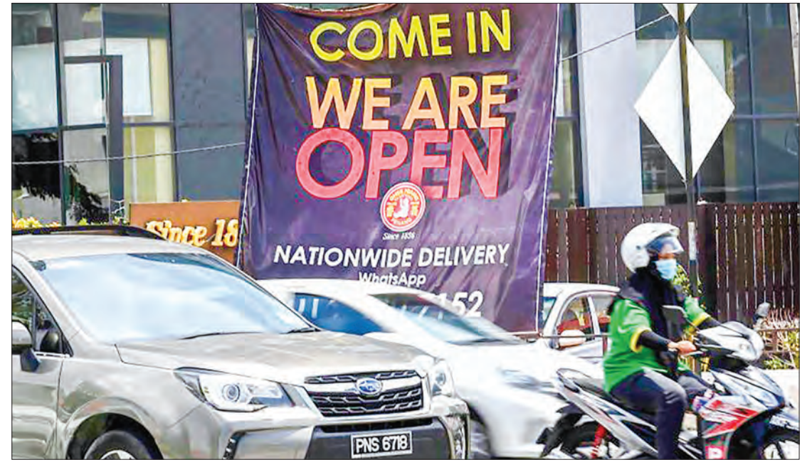
Motorists drive pass a shop during reopening of some business establishments in Penang on 10 May, 2020 as Malaysia relaxes partial lockdown measures to combat the spread of the Covid-19 coronavirus.

to 8,247 cases, the health ministry said on Thursday.