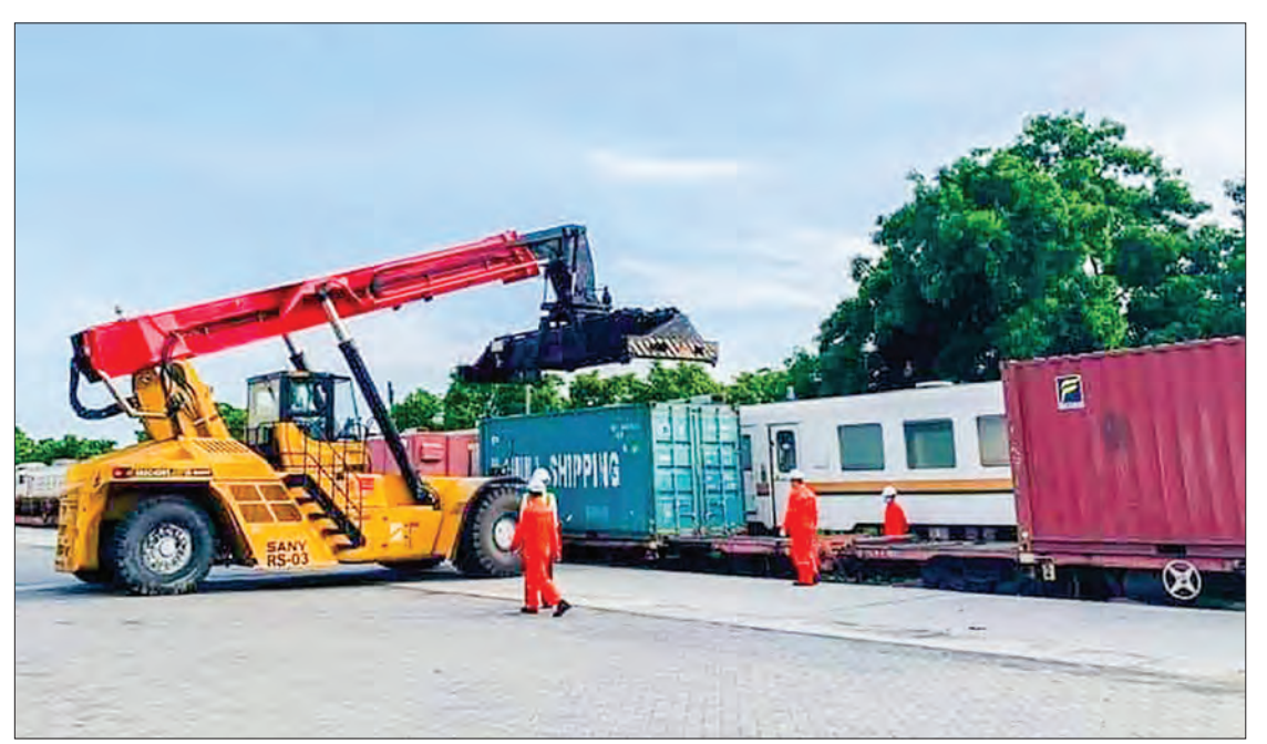
The RGL dry port directly connects with maritime ports by cars or trains.

and COSCO shipping line have cargo as the Myanmar's first 1 June.