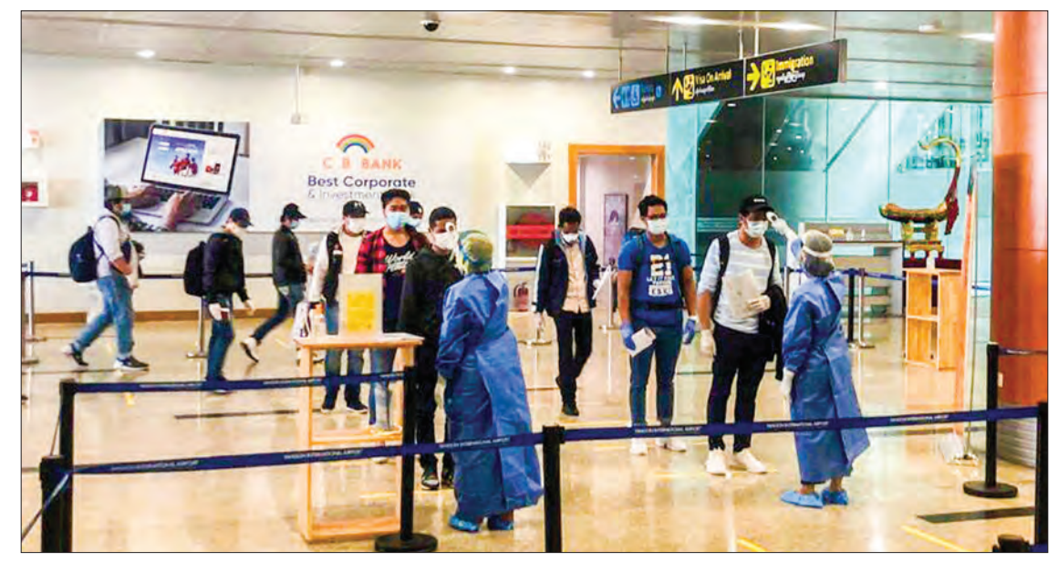
Staff testing body temperature of the Myanmar returnees from Germany at the Yangon International Airport yesterday.