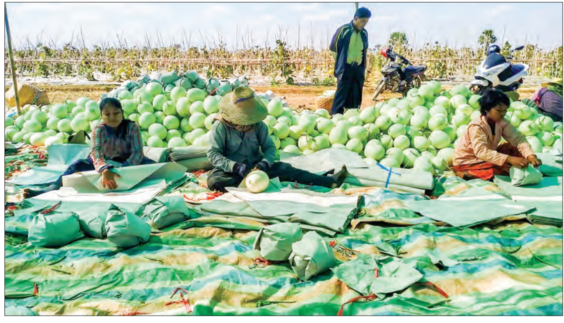
Farmers harvesting the muskmelons from their farms for sale in markets.

"So, some are selling their property such as cattle and plots of land to get back the capital for the next season. Now, there are no watermelon and muskmelon growers in Chaung U township. If there is no longer coronavirus spreading, we will prepare to grow watermelons