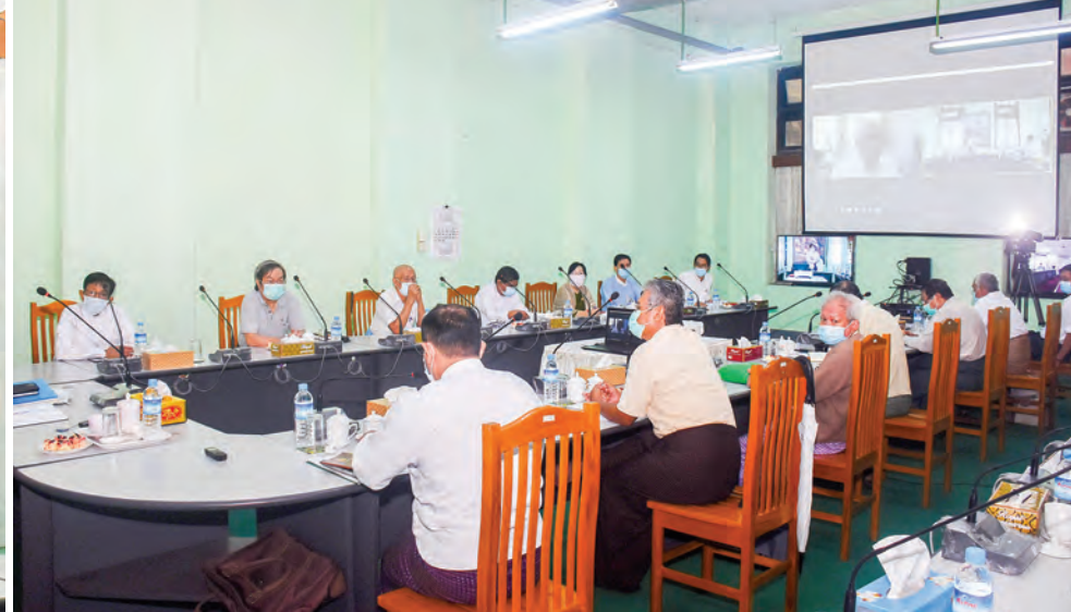
Union Minister Dr Pe Myint addresses the first online coordination meeting of the 2019 National Literary Award Selection Committee yesterday.

fairness of the selection committee, said the Union Minister.