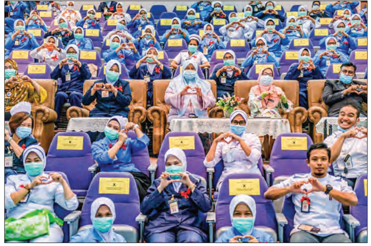
Nurses, wearing face masks as a preventive measure against the spread of the Covid-19 novel coronavirus, make the "love" gesture as they pose for a picture during a ceremony to commemorate International Nurses Day at the Selayang Hospital in Selayang, Malaysia, on May 12, 2020.

HONG KONG — South and COVID-19 cases Wednesday as India recorded its highest daily increase of 8,909 new cases,