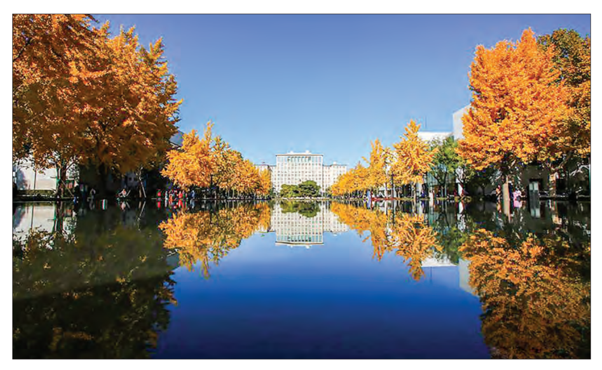
Photo taken on Nov. 7, 2019 shows the main building of Tsinghua University in Beijing, capital of China.

Fourteen Japanese universities were ranked in the survey, including Kyoto University in 12th place, Tohoku University in 30th, Nagoya University in 41st and the Tokyo Institute of Technology in 42nd place.—Kyodo ■