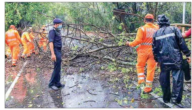
NDRF personnel clearing fallen trees from a road in Alibag town of Raigad district following cyclone Nisarga landfall in India's western coast.

The cyclone brought heavy rainfall — with winds of 100-110 kilometres per hour (60-70 miles per hour) and gusts of up to 120 kph. Mumbai experienced downpours throughout the afternoon, with strong winds toppling trees in some cases. City authorities said there were no reports of injuries or deaths, though the