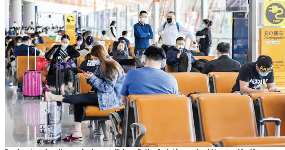
People wait at a boarding area for domestic flights at Beijing Capital International Airport on May 10, 2020.

In China, most companies have resumed operations with the number of infections decreasing, but many Japanese citizens working in the nation have been stranded in their home country as China has restricted the entry of foreigners for the past two