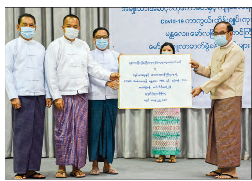
Union Minister Dr Myint Htwe receives donation of laboratory equipment by Mandalay Urban Development Funding Committee.