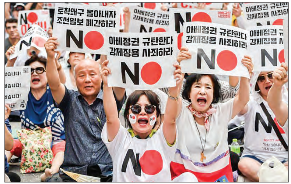
FILE PHOTO: Protesters in Seoul hold up placards saying 'No Japan' during a rally against Japan's decision to remove South Korea from a 'white list' of preferred export partners on August 3, 2019.

TOKYO—South Korea's decision to reopen a World Trade Organization complaint about Japan's tightening of export controls is "not helpful" to the process of resolving the nations' differences, Foreign Minister Toshimitsu Motegi told