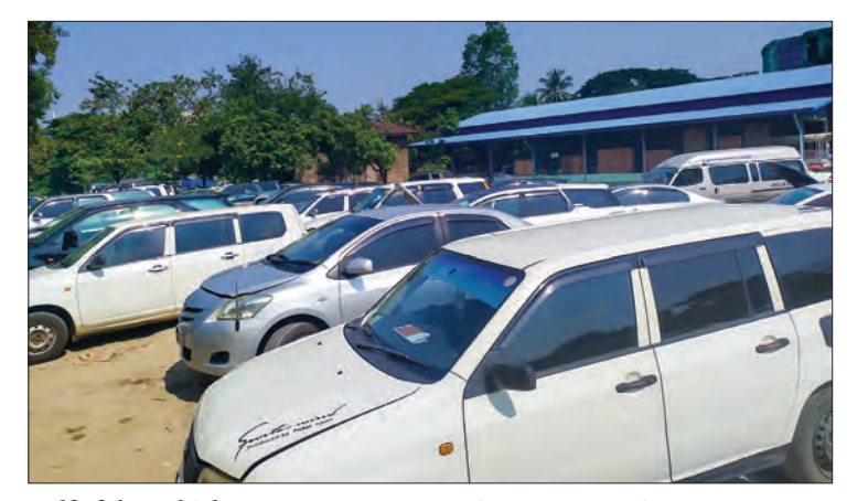
Half of the vehicles across Myanmar are in Yangon Region.