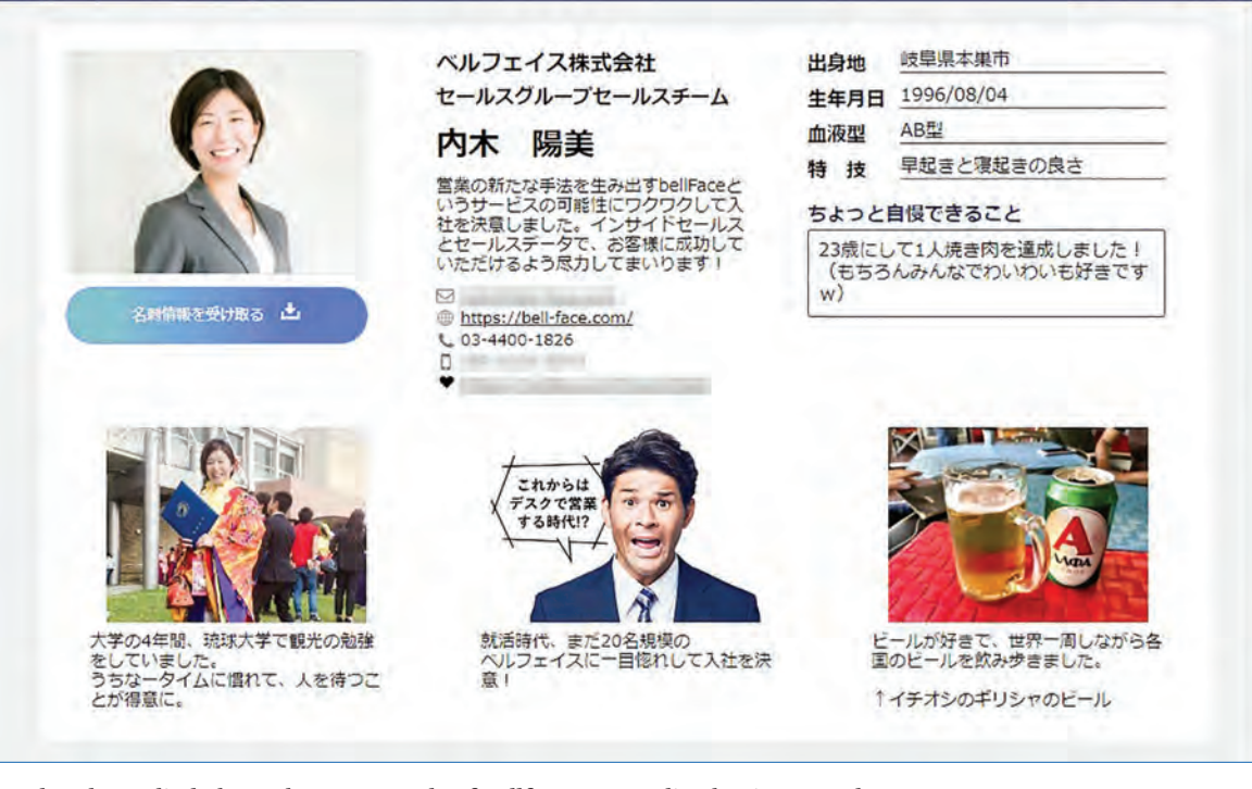
Undated supplied photo shows a sample of Bellface Inc.'s online business card.

She has frequent email and chat interactions online but says for her, "it is hard to have conversations that are about nothing online." Instead, she makes efforts to actively communicate with her coworkers on days when she goes into the office.