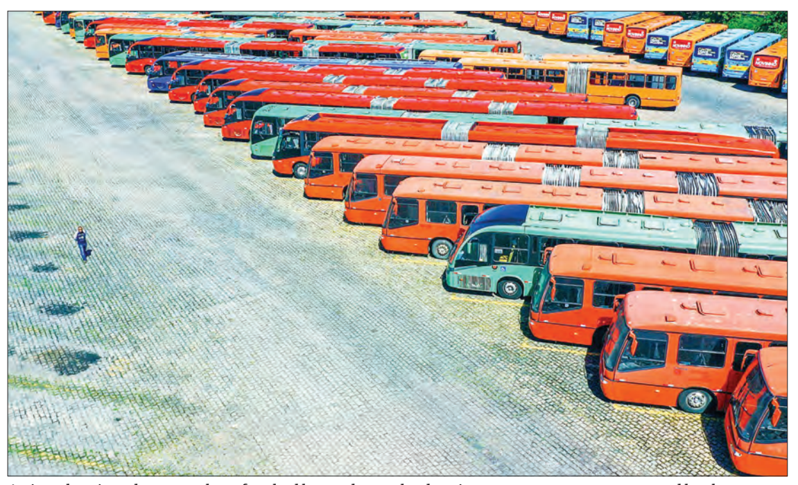
A view showing a large number of parked buses due to the drop in passenger movement caused by the coronavirus outbreak, at a depot in Curitiba, Brazil.

The WHO said that Central and South America have become "intense zones" of COVID-19 transmission, and solidarity and support are needed to help them overcome the pandemic.