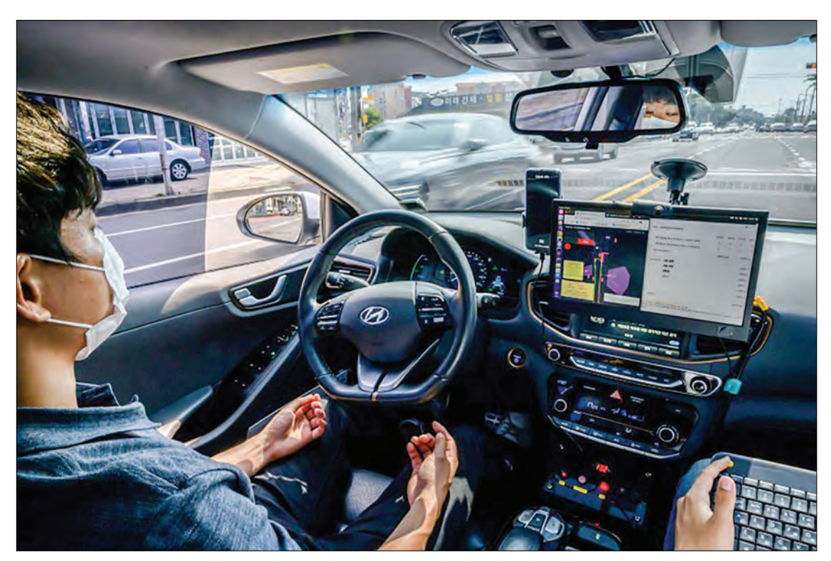
Under South Korean law a safety driver has to sit at the wheel to intervene if necessary.

The five-kilometre (three-mile) route includes a U-turn, 11