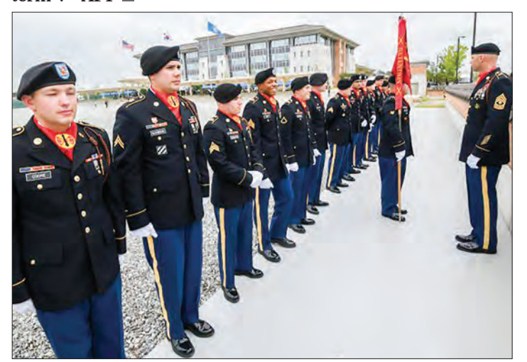
US soldiers stand ahead of a grand opening ceremony of the new headquarters building for the United Nations Command and US Forces Korea at Camp Humphreys in Pyeongtaek on June 29, 2018.

But it was only a "short term solution" for labour cost sharing, he acknowledged in a statement, adding it "highlights the need for an overall Special Measures Agreement for the long term".—AFP