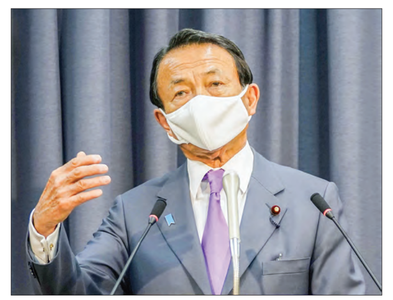
Japanese Finance Minister Taro Aso meets the press in Tokyo on May 27, 2020.

The IMF projected in a report released that month that the world economy will contract by 3.0 per cent in 2020 from a year earlier due to the pandemic, the worst setback since the Great Depression, which largely occurred in the 1930s.