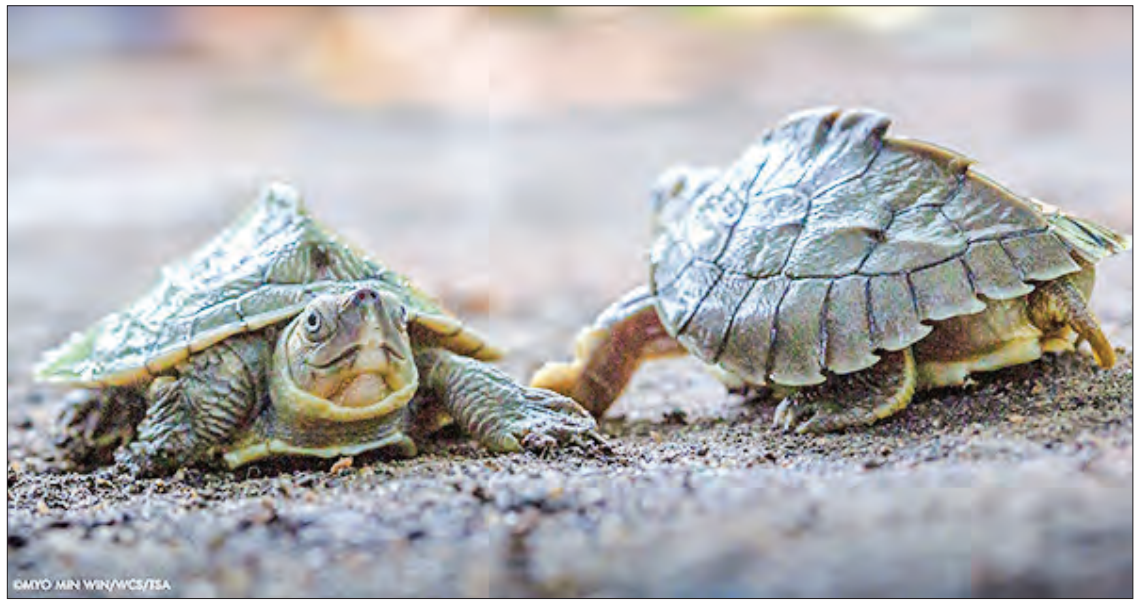
Female Burmese roofed turtles.

Conservationist attribute this change of fortune to a group of 20 captive-reared young males released into the river in late 2018. These offspring on the Chindwin River are of inestimable genetic worth. They will eventually be incorporated into our captive breeding programme to stave off the long-term genetic deterioration of the population through