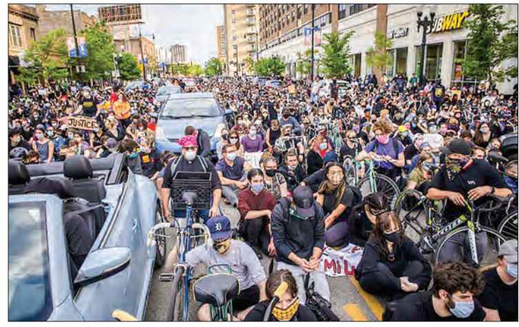
Demonstrators take part in a protest in Uptown neighbourhood of Chicago, the United States, June 1, 2020.

WASHINGTON—Protesters defied curfews across and is to be buried there next week. the United States as leaders scrambled to stem anger over police racism while President Donald Trump rejected criticism over his use of force to break up a peaceful rally.