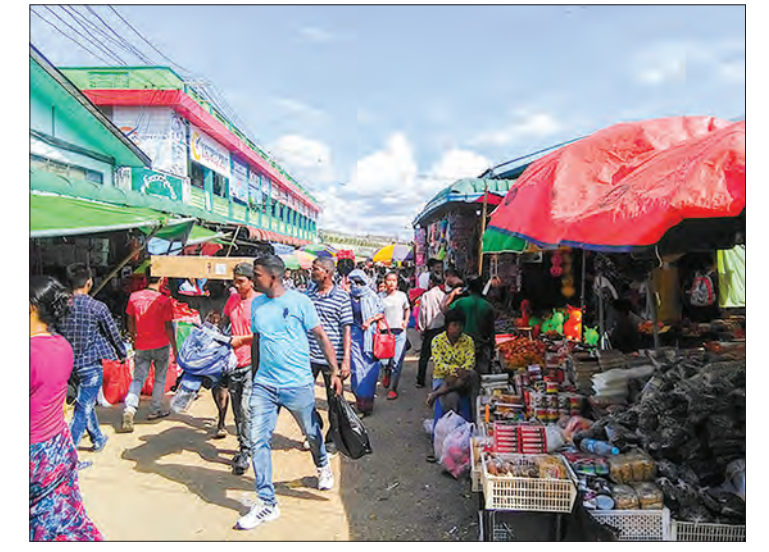
File photo shows: Namphalong Market in India-Myanmar border near Moreh in the Tengnoupal district of the Indian State of Manipur.

circulation@globalnewlightofmyanmar.com သတင်းစာမှာယူစတ်ရှလိုပါကဆက်သွယ်နိုင်ပါသည်။ HOTLINE Circulation order is in easier way. 09-974424114