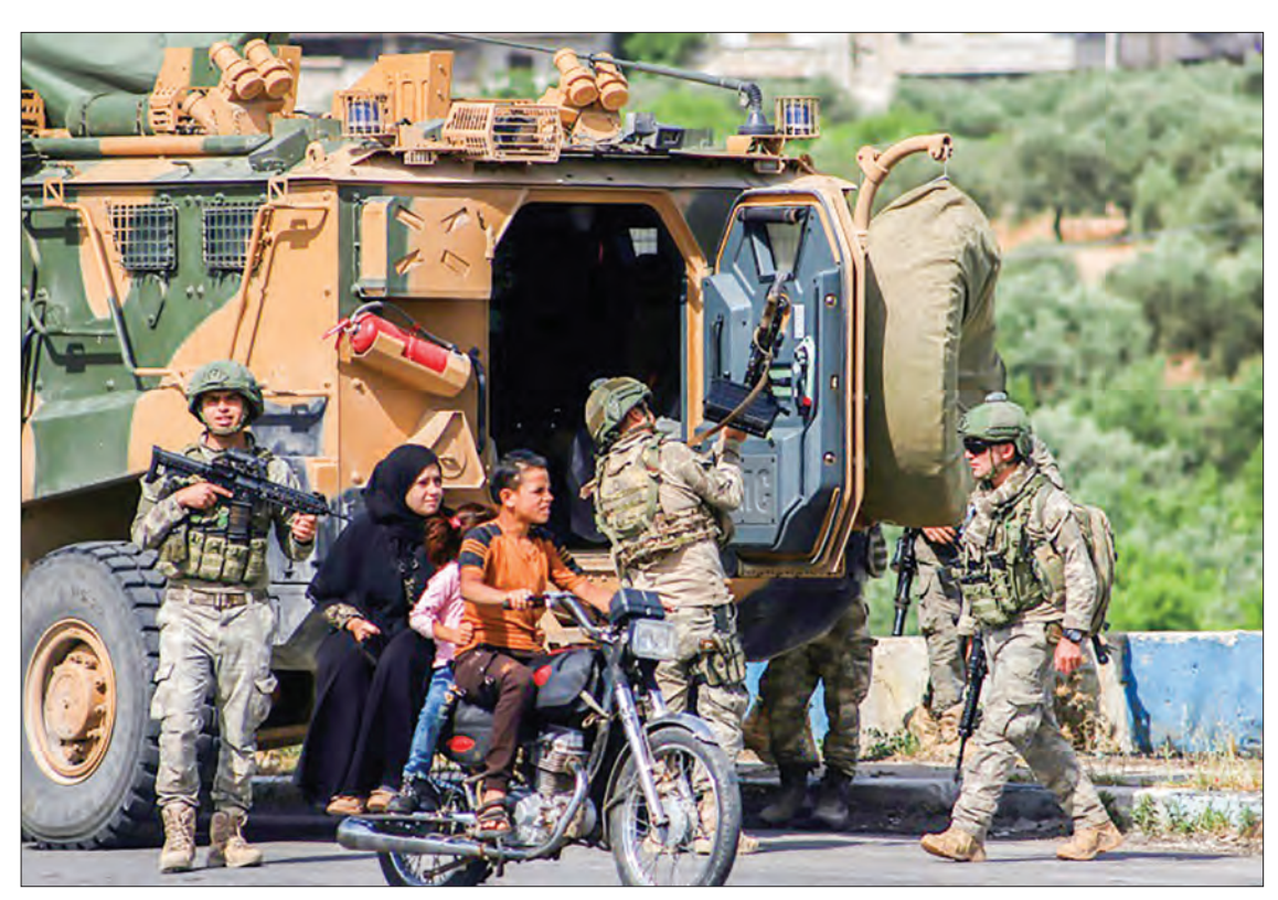
Since a ceasefire went into effect around Syria's last major rebel stronghold in March, Russia has been conducting joint patrols along the strategic M4 highway that cuts through the region and analysts say it is keen to keep jihadist forces away.

Some 840,000 of the nearly one million remain displaced, while some 120,000 have returned to their home communi-