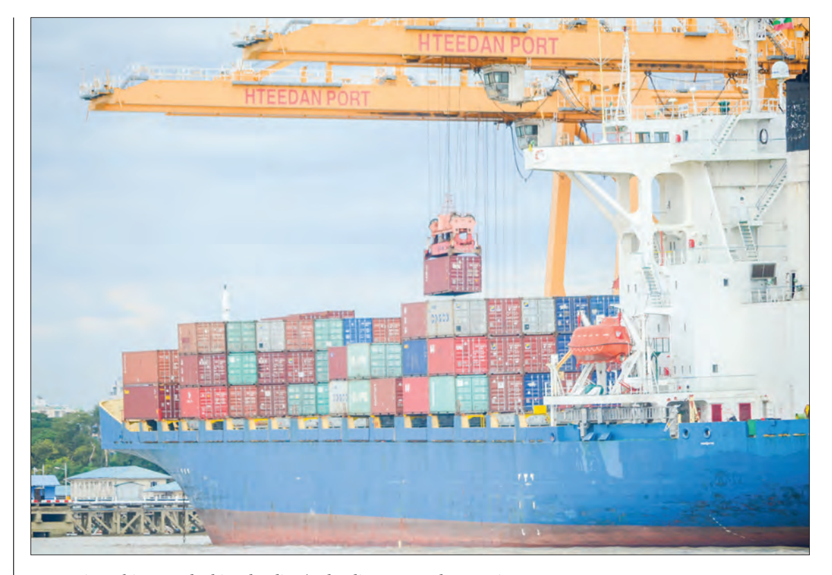
A container ship seen docking, loading/unloading at Hteedan Port in Yangon.