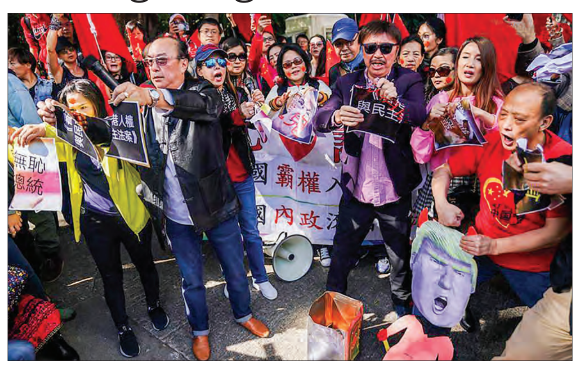
FILE PHOTO: People protest against the United States' intervention in Hong Kong affairs in front of the U.S. Consulate General, south China's Hong Kong, Dec. 3, 2019.

BEIJING—China warned Britain on Wednesday that interfering in Hong Kong will backfire, after the former colonial power vowed to give sanctuary to locals who may flee the city if a controversial security law is passed.