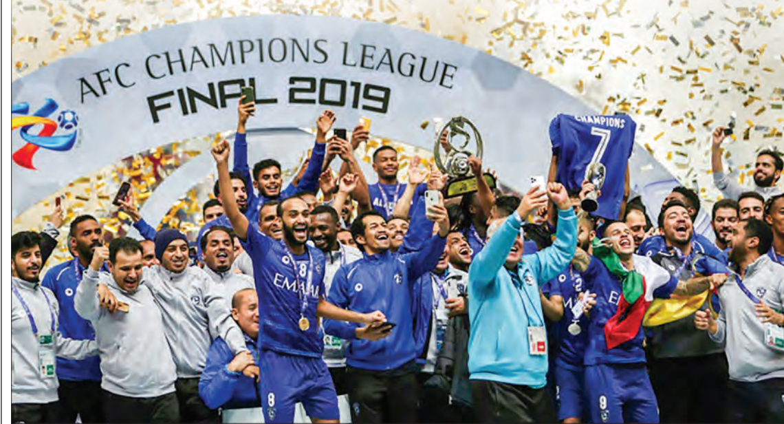
Saudi Arabia's Al Hilal won last year's AFC Champions League.