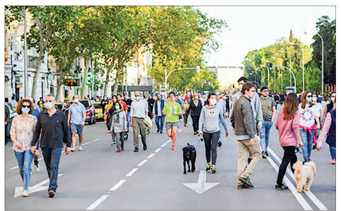
People take a stroll during the time allowed by the Spanish government for exercise on 17 May, 2020 in Madrid, Spain amid a national lockdown to prevent the spread of COVID-19.

tions imposed by the state of alarm, which is the first of three emergency levels a Spanish government can apply under exceptional circumstances.—Xinhua