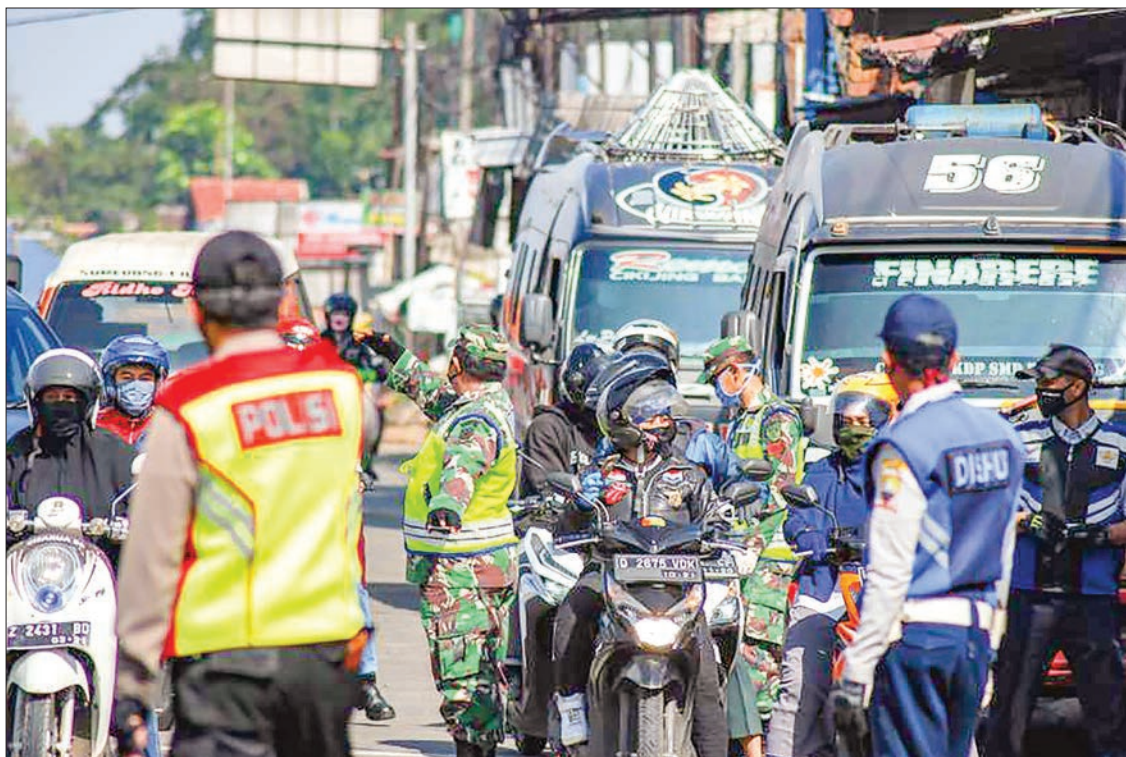
Indonesian officers from the military, police and transport ministry check motorists at a checkpoint to curb the spread of the COVID-19 coronavirus in Sumedang, West Java on 10 May, 2020.