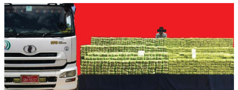
Zaw Min Htwe (a) Kyar Pauk seen with seized illegal drugs.