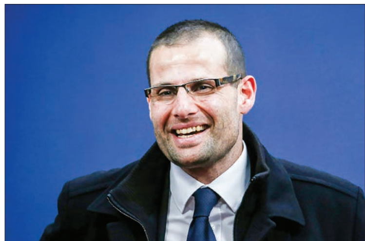
Malta's Prime Minister Robert Abela, seen here in February, has been cleared of homicide over the death of migrants at sea.

Malta has closed its ports to migrants, citing the threat of the novel coronavirus.—AFP ■