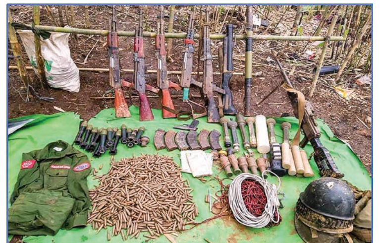
Arms and ammunition seized from AA terrorists.