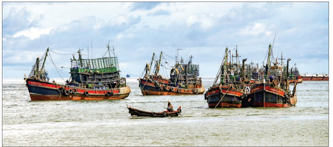
Fishing vessels are anchored in the offshore of Taninthayi coastline in Taninthayi Region.

Taninthayi coastline located in southern part of Myan-