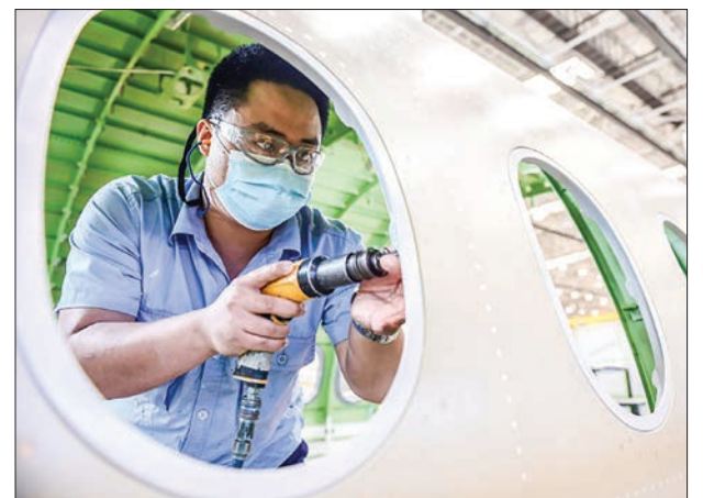
An employee works on an Airbus A220 aircraft at a factory in Shenyang in China's northeast.

Business activity in the cultural, sports and entertainment industry, however, remains low with many entertainment venues still closed amid fears of a second wave of COVID-19 infections.—AFP ■