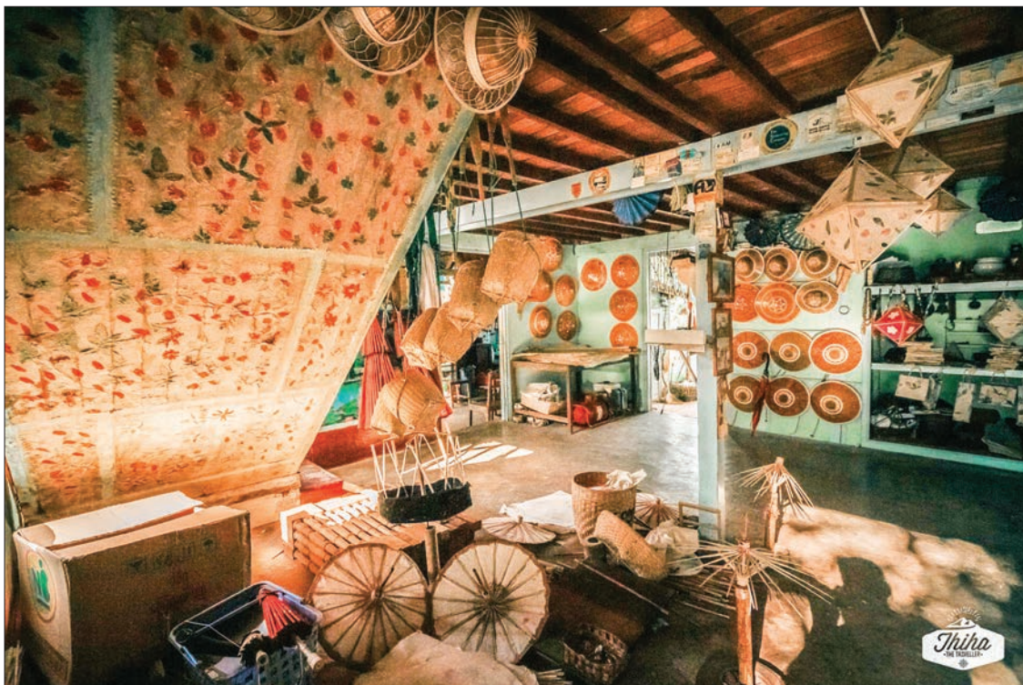
The photo shows U Kyaw Shwe's Danu Traditional Paper and Umbrella Industry.