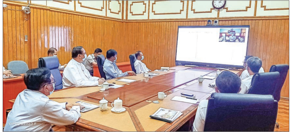
Union Minister U Han Zaw attends the virtual meeting to inspect the development projects in Mandalay Region and Kayah State.

The ministry is also trying to provide accommodations for