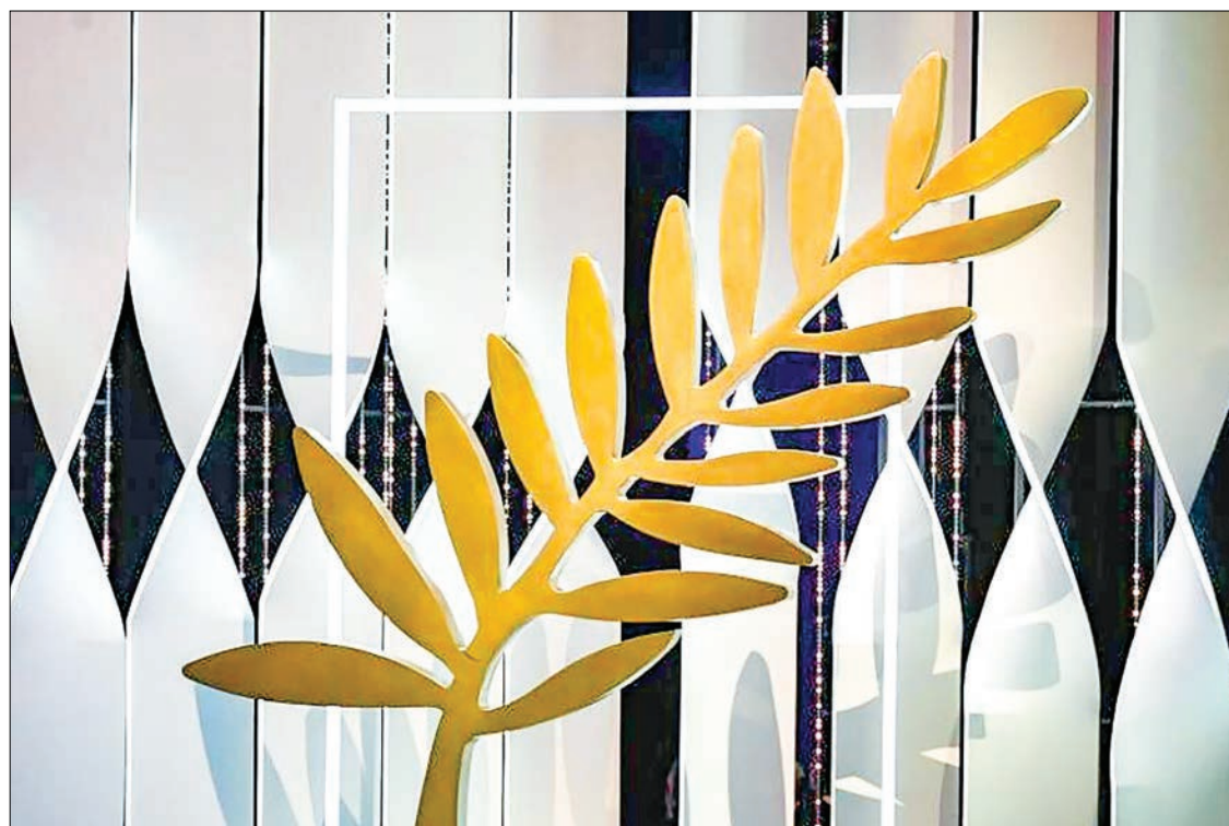
The 10-day “We Are One: As of Sunday, more than 200,000 people around the world have subscribed to the YouTube channel of We Are One, generating comments in English and other languages.

The Japan-based film festival’s chairman, Hiroyasu Ando, has described the online festival showcase, which will last until June 7, as “meaningful” and one