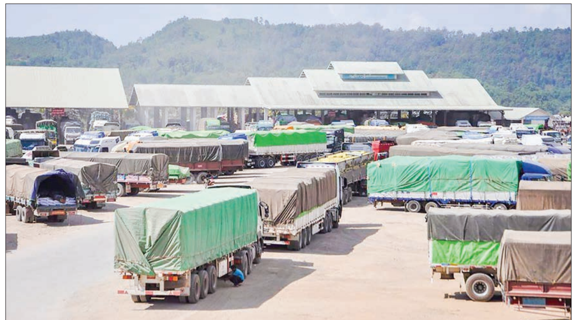
Trucks seen at the 105-mile trade zone Muse, northern Shan State.

MYANMAR can now export fruits to China through Lwejel and Kampaiti borders besides Muse, according to the Ministry of Commerce.