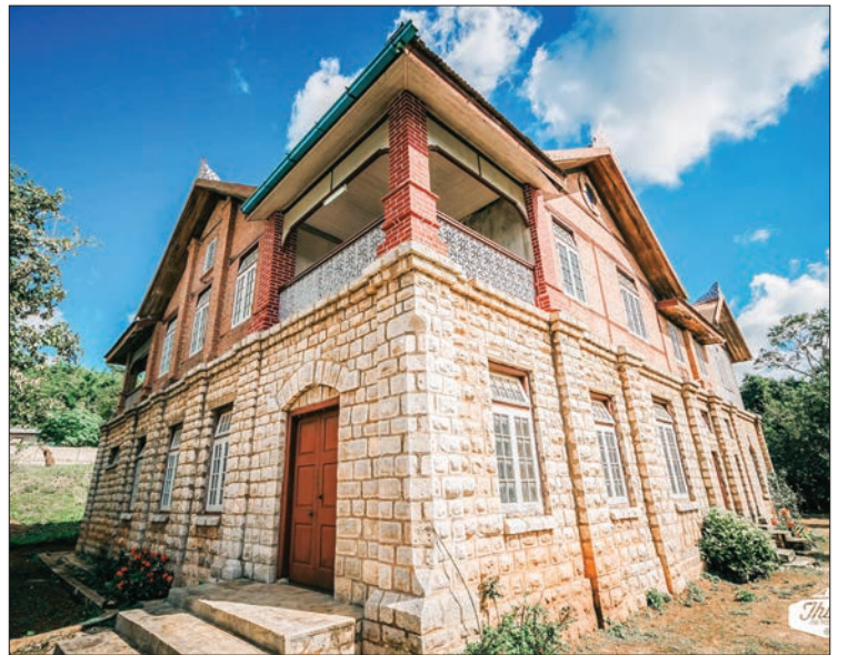
The photo shows the front area of Pwayhla Hawnan.