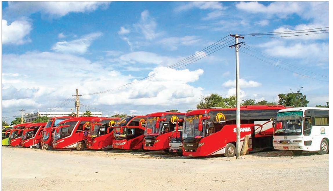
Mandalay-based highway buses will resume their services starting from 1 June, in line with health guidelines issued by the Ministry of Health and Sports.

The passengers must wear masks, wash hands and measure the temperature before boarding the bus. The seating plan ensures to maintain physical distancing and the buses are instructed to keep the windows open and disinfect the bus before and after boarding the passengers. The bus driver and the assistant must follow the rules