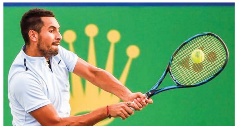
Australia's Nick Kyrgios will be playing next month in Berlin, which will host men's and women's events on grass and hard court behind closed doors.

There will be no live spectators, electric line-calling will be used instead of judges and the matches will be played over two sets with a possible third as