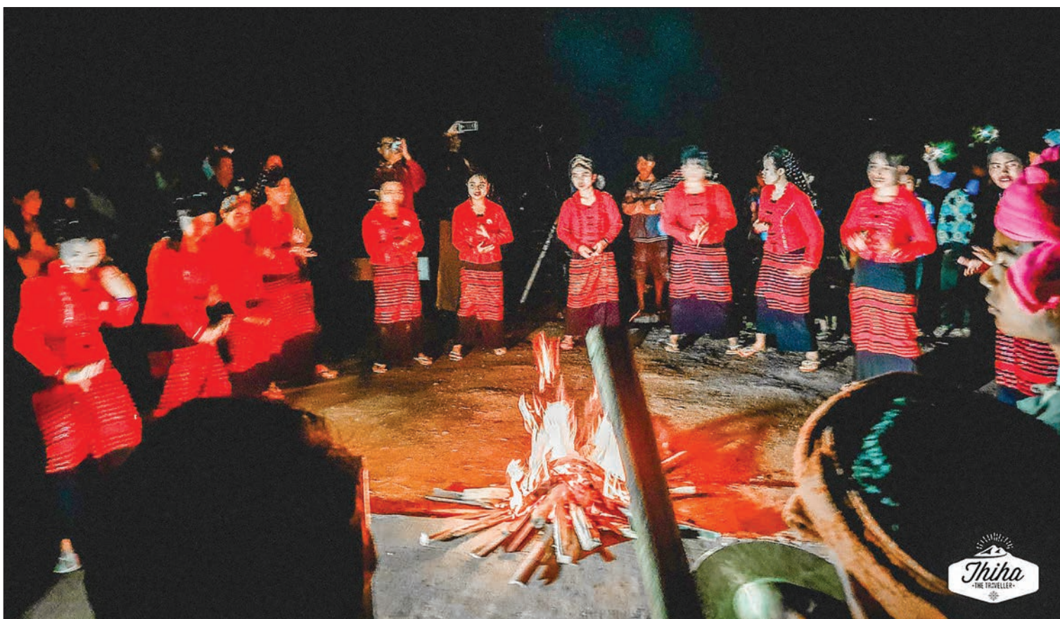
The photo shows the dance of Danu damsels from Hsekya-in village.