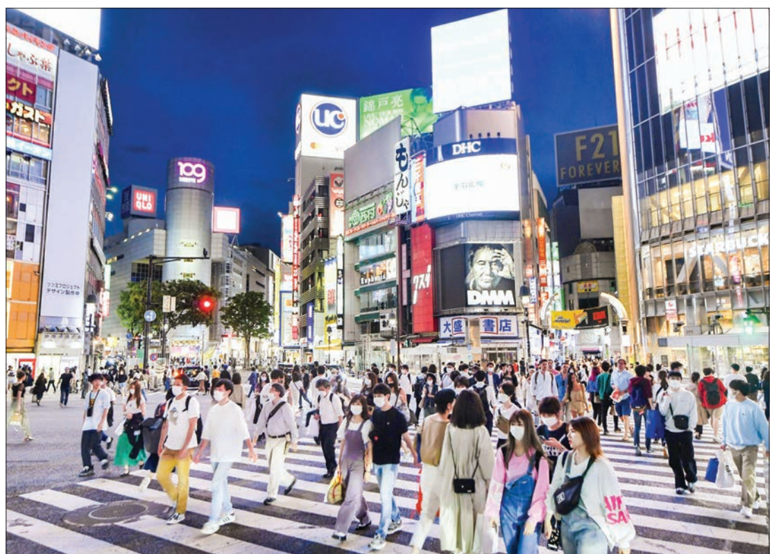
Tokyo's Shibuya area is crowded with people on May 30, 2020, on the first weekend after Japanese Prime Minister Shinzo Abe announced an end to the coronavirus state of emergency.

Aside from Bhutan, the Japan International Cooperation Agency has run the project with 17 other countries including Vietnam, Myanmar, Laos, the Philippines, Sri Lanka and Ghana.—Kyodo ■