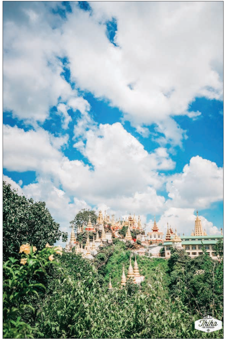
The photo shows the beauty of Setkyar Taung (Settaw Taung) Pagoda seen from a long distance.