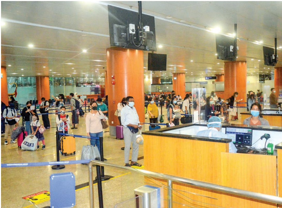
Myanmar returnees from Singapore queuing for their immigration process at the Yangon International Airport yesterday.

DURING the temporary suspension of international flights, a relief flight by Myanmar National Airlines (MNA) brought back 151 Myanmar citizens from Singapore as the sixth batch and landed in Yangon International Airport yesterday evening.