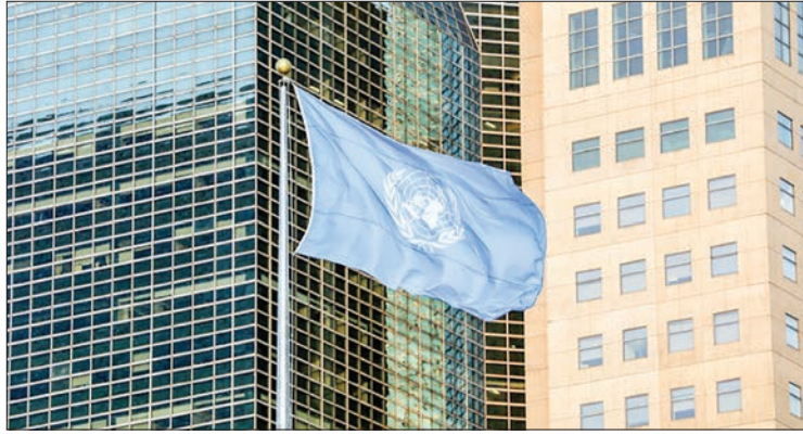
The flag of the UN outside the New York headquarters of the world body, seen in a photo taken on September 23, 2019.

Three years later, the COVID-19 pandemic has seen a ferocious competition erupt between the UN's two main contributors, prompting the organization's