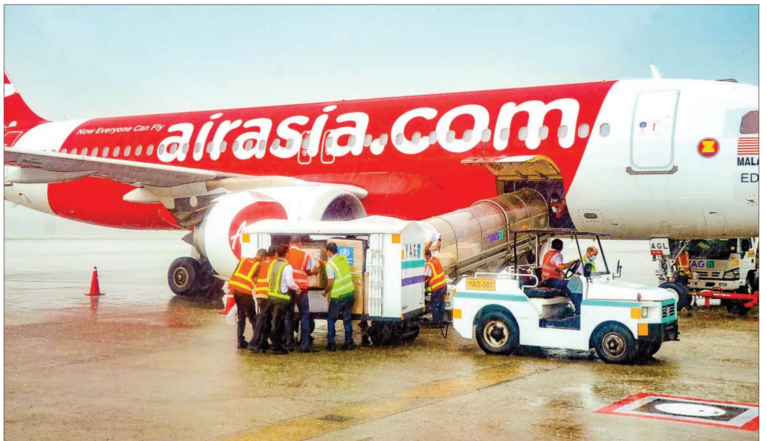
Workers unloading medical supplies from the special flight at the Yangon International Airport on 31 May 2020.

"The plan of WFP, now with the global plan is to continue to provide those flights on a weekly basis every Sunday. This arrangement will be in place until such time that the commercial sector stands up on its feet again