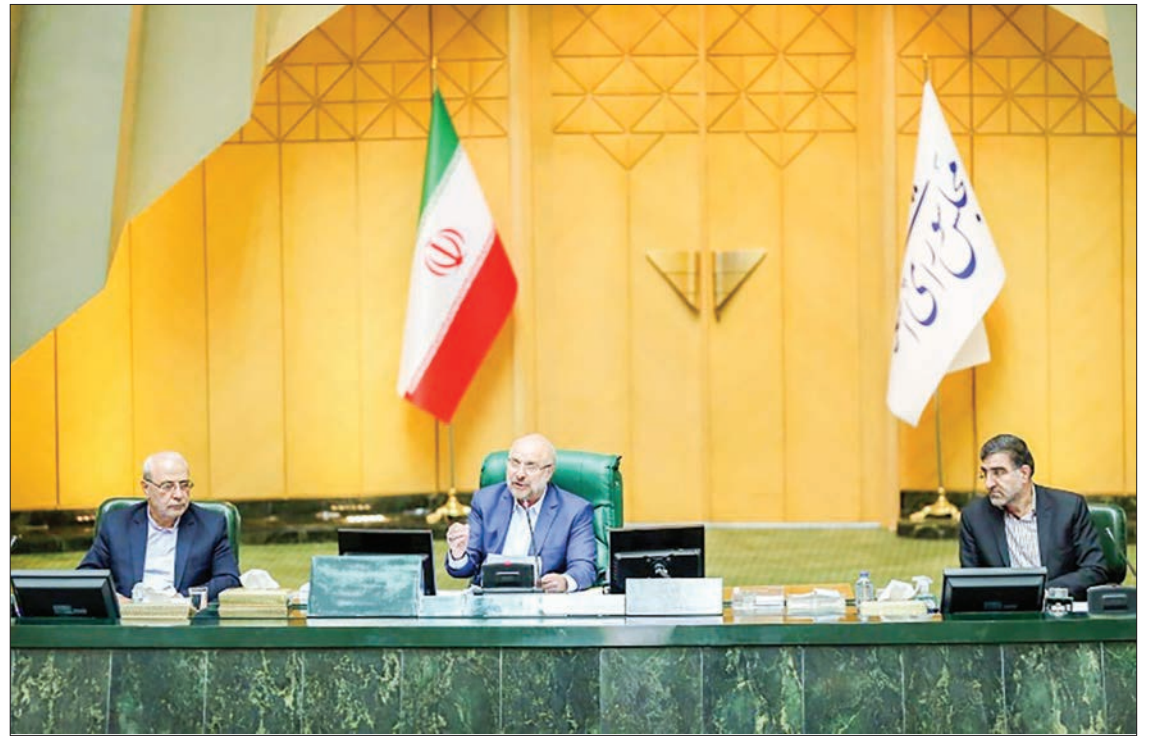
Iranian Parliament speaker Mohammad-Bagher Ghalibaf (C) chairing a parliament session in the capital Tehran.

Decades-old tensions between Tehran and Washington have soared in the past year, with the sworn arch enemies