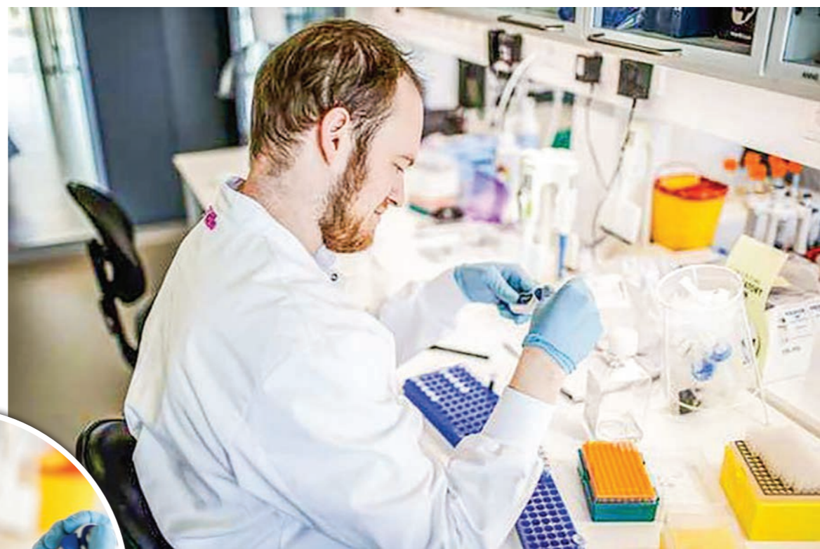
A researcher works on a Covid-19 vaccine.

Within weeks of Chinese researchers making the genome of the virus public, a team at the University of Texas at Austin was able to create a replica model of its spike protein, the part which