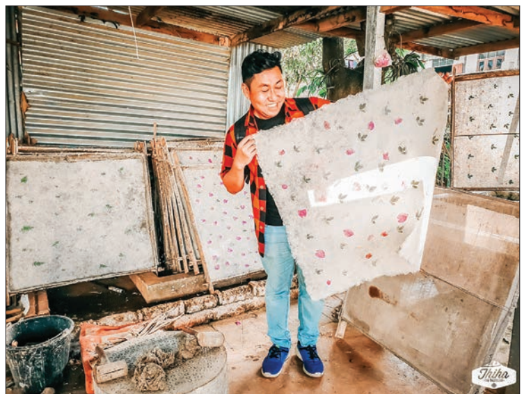
The photo shows Danu traditional paper sheet.