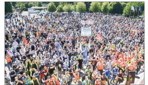
Unions said 8,000 people took part in the protest over the cuts designed to help Renault steer out of a cash crunch exacerbated by the coronavirus pandemic.

But "lower skilled workers... are taking on more risk without more pay."—AFP ■