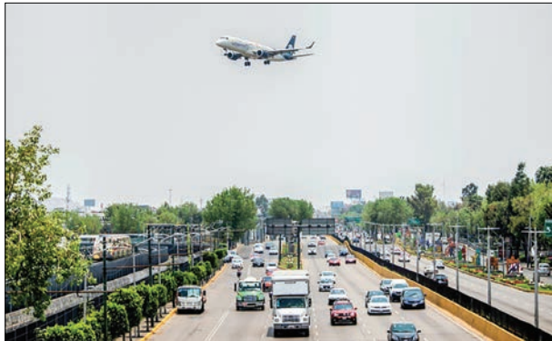
An Aeromexico airlines plane lands at Mexico City's Benito Juarez airport on May 20, 2020.

Evidence of the severity of the crisis came last week when the region's two largest airlines, Chilean-Brazilian LATAM and Colombia's Avianca, filed for bankruptcy in the United States.