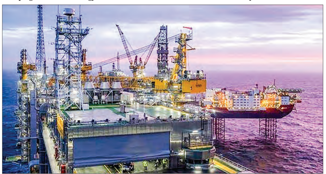
The field centre of the Johan Sverdrup oil field in the North Sea west of Stavanger, Norway. PHOTO: (AFP)

"Even though this 'clean' spending is set to dip in 2020, its share in total energy investment is set to rise," it noted. But it noted "these investment levels remain far short of what would be required to put the world on a more sustainable pathway," estimating that spending on renewable power would need to double by the late 2020s.—AFP