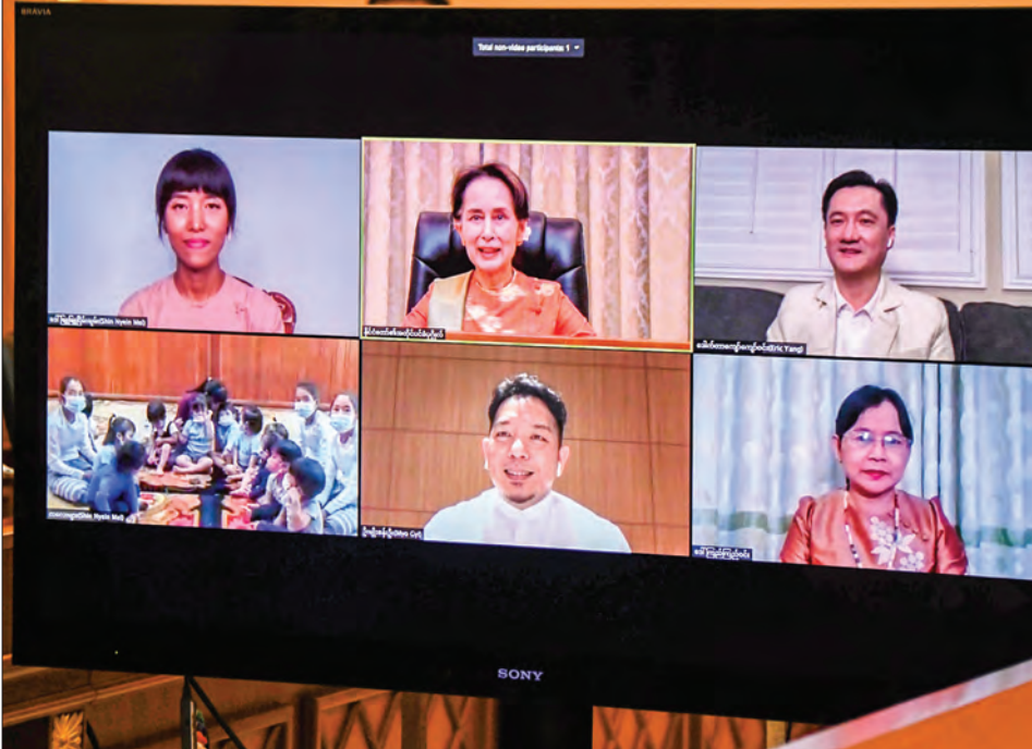
State Counsellor Daw Aung San Suu Kyi meets in video conferencing with first winners of homemade face mask competition yesterday.

Aung San Suu Kyi held a video conference with first prize winners of her homemade cotton mask competition yesterday from the meeting room of the Presidential Palace in Nay Pyi Taw.