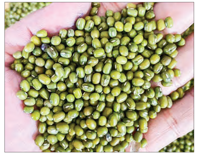
Myanmar's green grams are demanded by India and China.