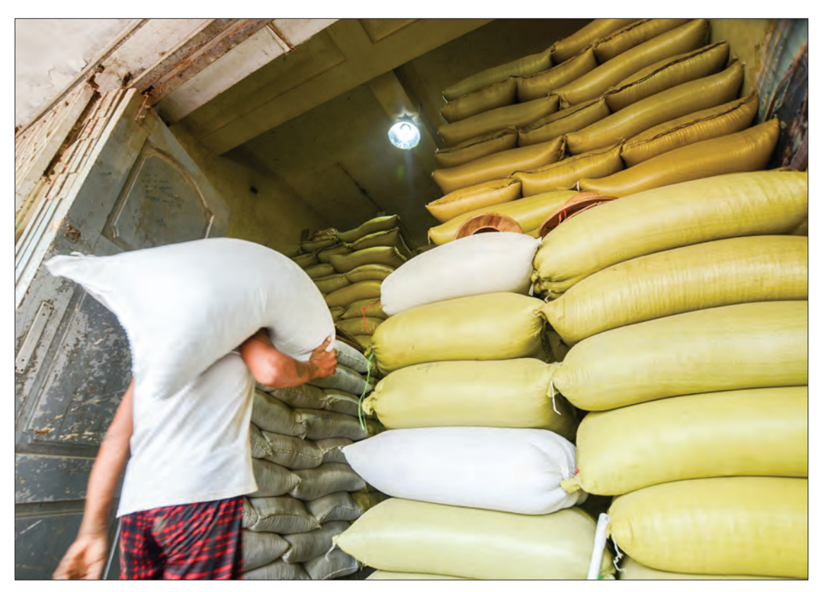
A worker carries the sack of black bean in a warehouse in Yangon.

The prevailing price of black bean stands at K960,000