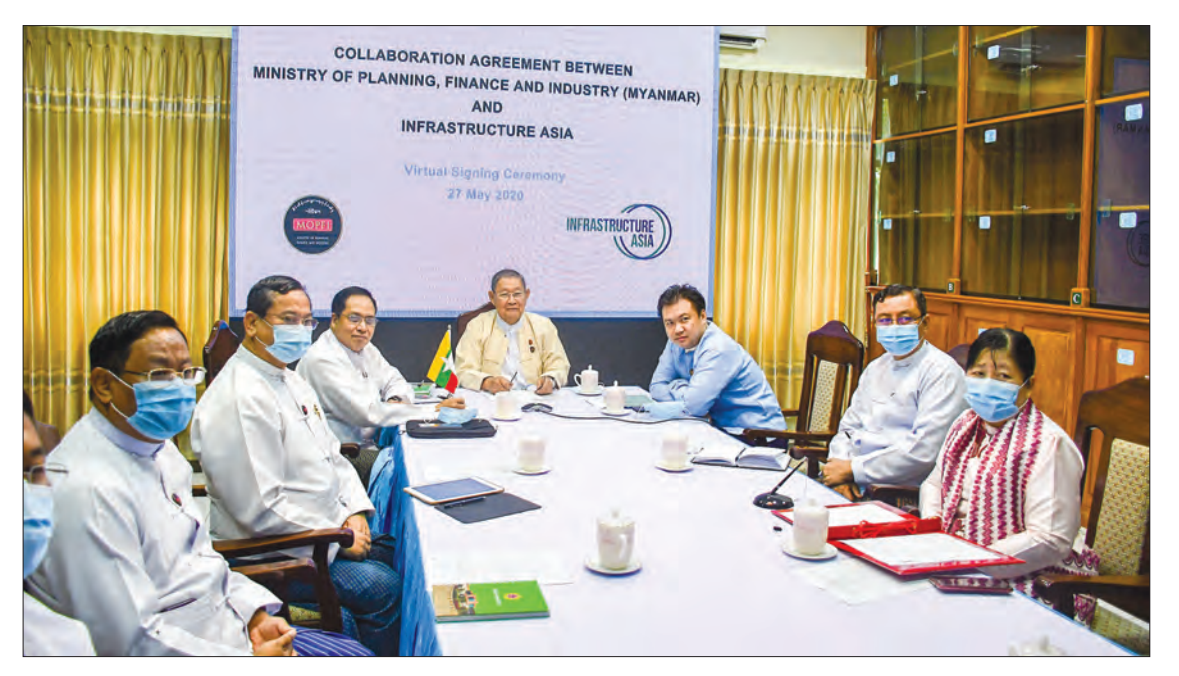
Union Minister U Soe Win (centre) joins the visual signing ceremony of collaboration agreement between MoPFI and Infrastructure Asia for development projects in Myanmar.

UNION Minister for Planning, Finance and Industry U Soe Win witnessed the virtual signing ceremony of the agreement between his office and the Infrastructure Asia yesterday for infrastructure development projects in Myanmar.