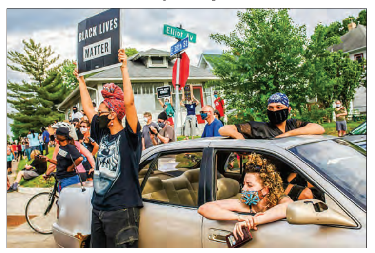
Protesters took to the streets of Minneapolis over the death in custody of a black man.

The Africa CDC said that the Northern African region is the most affected area across the continent both in terms of positive COVID-19 cases, as well as the number of deaths.—Xinhua