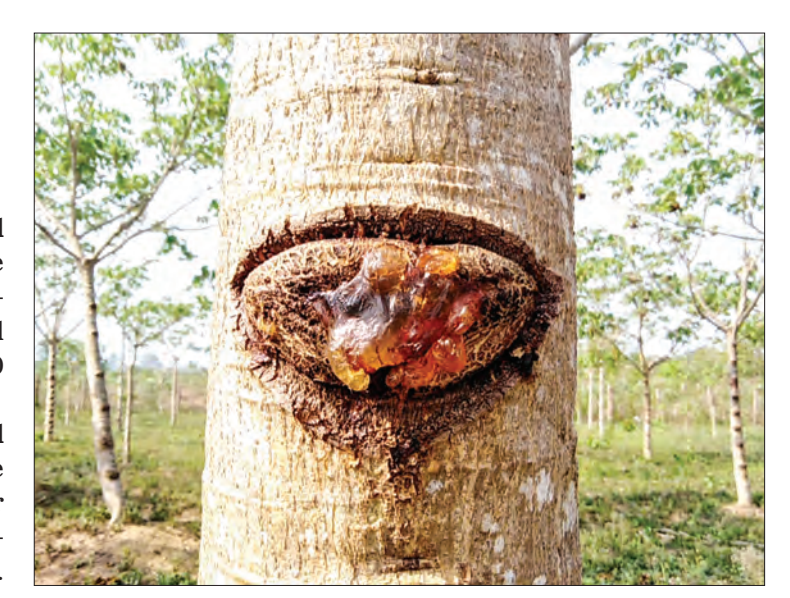
The sterculia gum seen on the wild almond tree.

of wild almond trees in Mohnyin township. The gum from the wild almond tree is usually