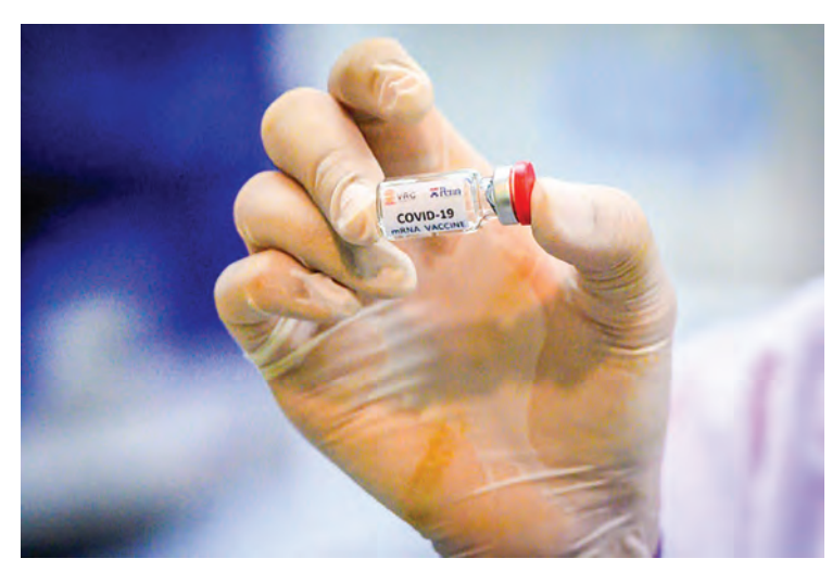
Doctors, academics and institutions have adapted their scientific messaging in hopes of countering what has been termed an infodemic about coronavirus.

The Pasteur Institute currently has a combined 16,000 new subscribers a month on its social media networks, he said, compared with 4,000 before the