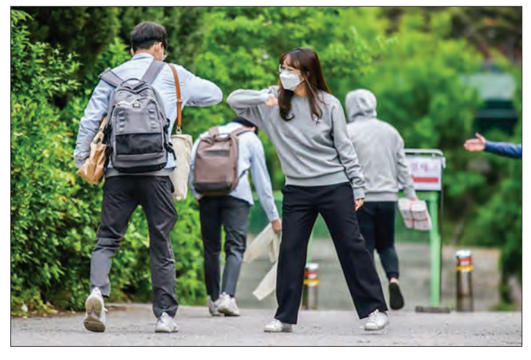
A staff member greeted students with an elbow bump as they returned to Kyungbock High School in Seoul after being closed for more than two-months because of coronavirus.

More than two million students returned to classes on Wednesday, as part of the phased reopening of schools.—AFP