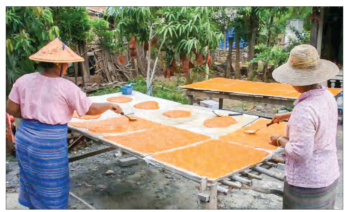
Women making the dried flakes of ripe mango pulps.

WITH the decline of mango demand from China because of difficulty in road transportation caused by coronavirus disease, the production of the dried flakes of mango pulp is rising, according to the dried sheet of mango pulp makers.