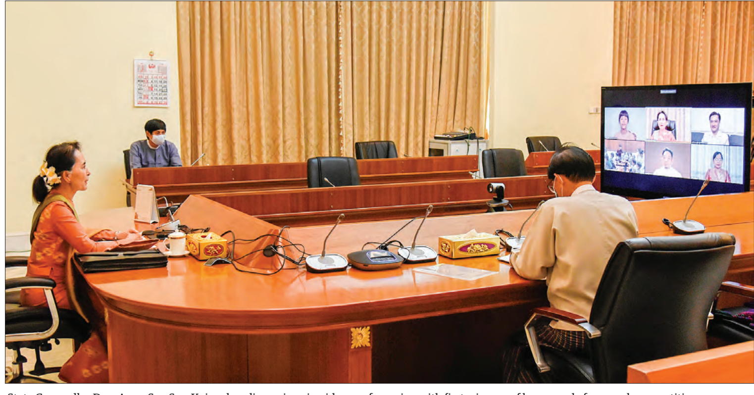
State Counsellor Daw Aung San Suu Kyi makes discussions in video conferencing with first winners of homemade face mask competition yesterday.

The State Counsellor added that it was earlier planned