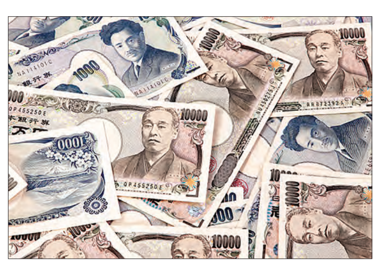
File photo shows Japanese banknotes.

Prime Minister Shinzo Abe told a meeting of government