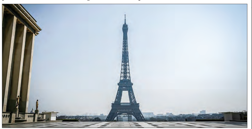
Lockdown measures stifled economic activity in France, in particular the important tourism industry.

The Government of the Republic of the Union of Myanmar Ministry of Agriculture, Livestock and Irrigation Department of Agriculture Climate-Friendly Agribusiness Value Chains Sector Project Invitation for Bids - Extension of Bid Submission date