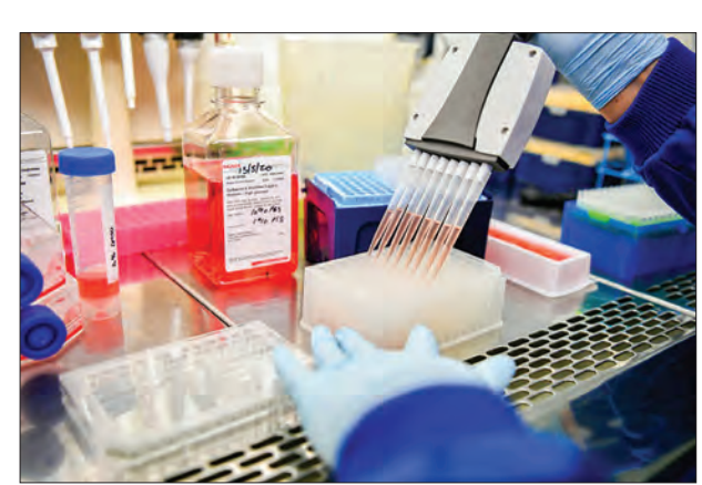
Some countries are calling for any vaccine against the novel coronavirus to be patent-free.

World Health Organization member states last