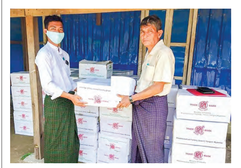
An official from Ministry of Social Welfare, Relief and Resettlement hands over the medical supplies to the local people.