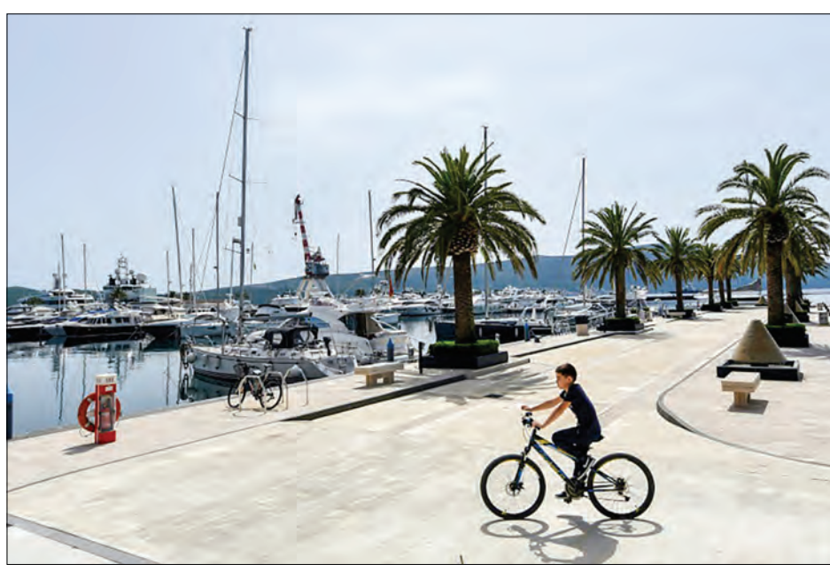
A solitary cyclist rides at the eerily quiet Porto Montenegro marina.

Tourism operators have already seized the opportunity to brand Montenegro as "Europe's First COVID-19 Free Country" in videos promoting its