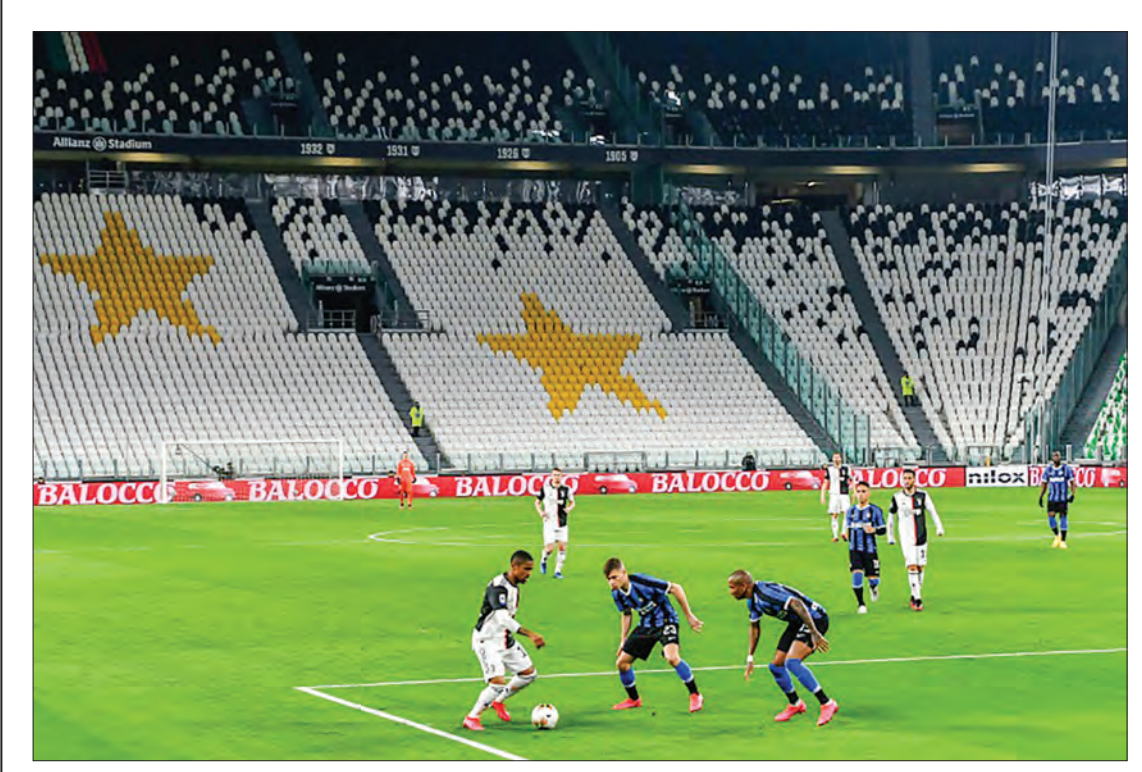
Serie A football has been suspended since March 9.

ROME — Serie A hopes of following Germany and Spain back onto the pitch will be decided on Thursday during a meeting with the Italian government which will determine the fate of the season in football-mad Italy.