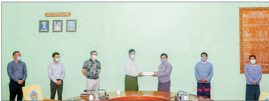
Union Minister Dr Win Myat Aye receives masks worth of K4 million donated by fourth batch alumni of University of Medicine, Magway.

THE Myanmar Women's Affairs Federation supplied 200 personal protective equipment (PPE) and 5,000 face masks to the National Volunteers Steering Committee at the Ministry of Social Welfare, Relief and Resettlement in Nay Pyi Taw yesterday.