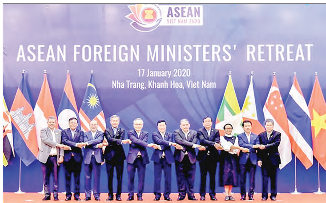
Union Minister U Kyaw Tin attends the ASEAN Foreign Ministers' Retreat in Viet Nam on 17 January 2020.

we held discussions with the EU for four times to address the issue of the Generalised Scheme of Preferences (GSP) and updated the Government's efforts in promotion and protection of human rights including the situation in Rakhine State.