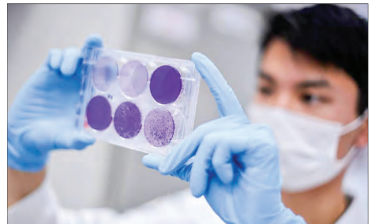
Governments and companies around the world are working to develop vaccines to contain the pandemic.

As of Wednesday, the virus had infected over 4.8 million people worldwide and claimed more than 320,000 lives, according to a tally by Johns Hopkins University. — Kyodo News ■