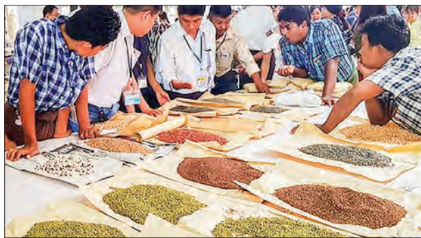
Merchants evaluate quality of various categories of beans at the Bayintnaung Commodity Wholesale Centre.

The butter bean growers in Pwintbyu Township, Magway Region have been suffering losses since the