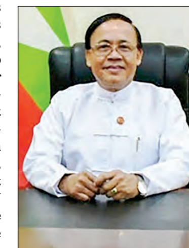
Union Minister for International Cooperation U Kyaw Tin

A: During the fourth year of the current administration, the President and First Lady of the Republic of Korea, the President of Nepal, the President of the People's Republic of China and the