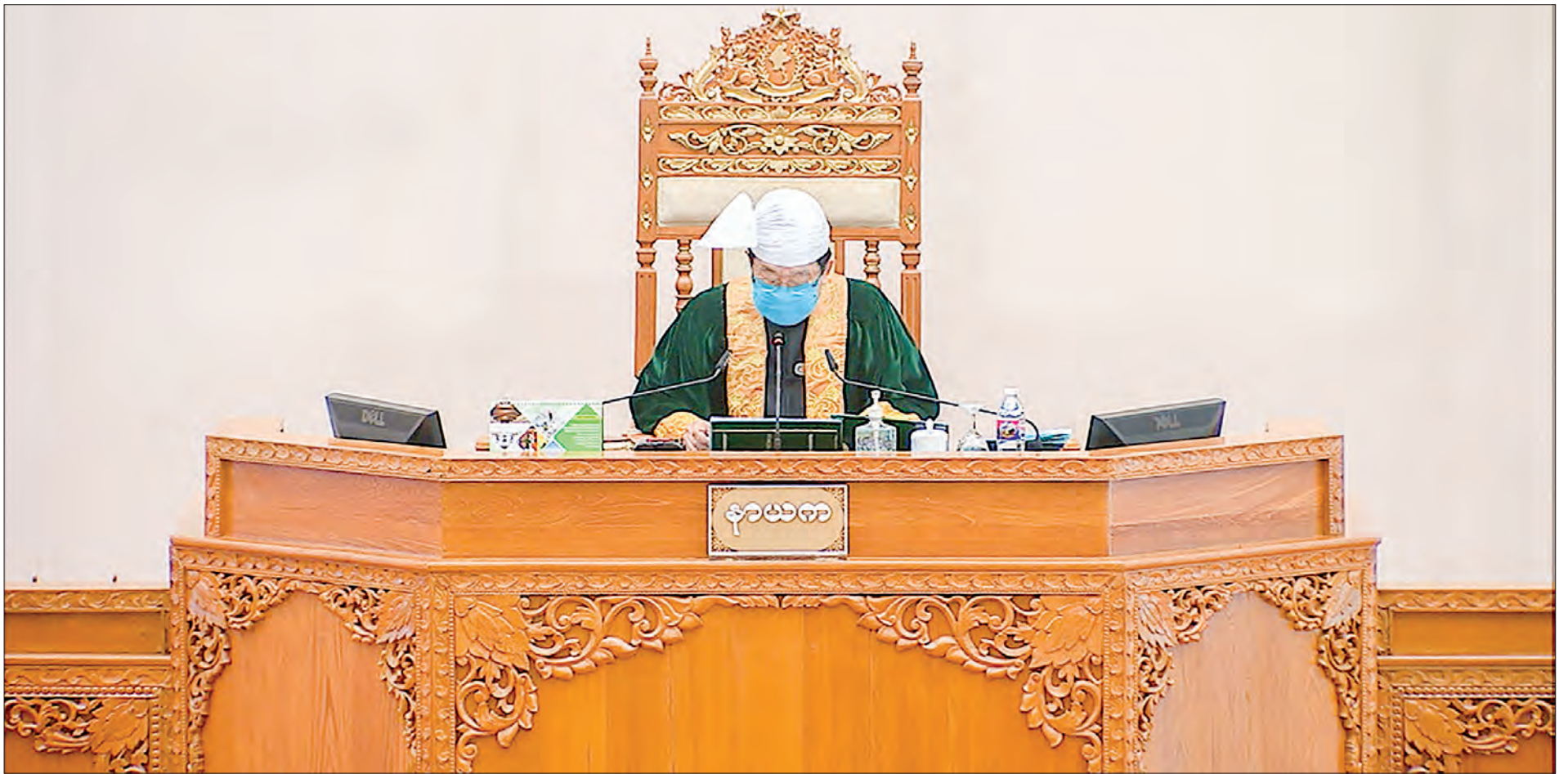
Pyidaungsu Hluttaw discusses charter amendments and loan programmes at second day meeting of 16 th regular session yesterday.

P YIDAUNGSU Hluttaw held its second day meeting of 16 th regular session yesterday, with discussions of Union-level organizational members on postponement of referendum to amend some provisions in the 2008 Constitution and the loan proposals sent by the President's Office.