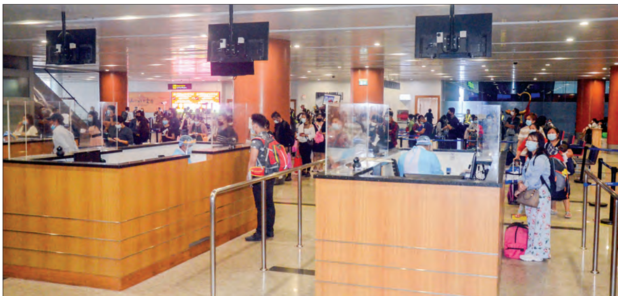
Relief flights from Singapore and Viet Nam landed with Myanmar citizens at Yangon International Airport yesterday.

A total of 145 citizens in the fifth group from Singapore by the Myanmar National Airlines and 9 nationals by Vietjet Air of Viet Nam arrived back to Myanmar yesterday afternoon.