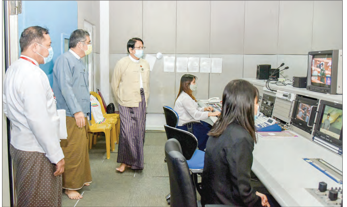
Union Minister for Information Dr Pe Myint and senior officials look into the works at MRTV yesterday.