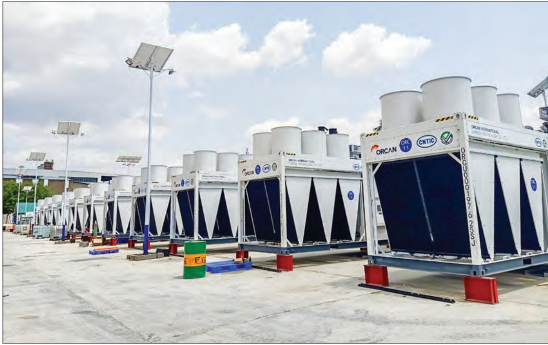
Two gas-fired power plants in Ahlon and Kyunchaung townships are part of the seven new projects with a total capacity of 1,166 MW for the national grid.