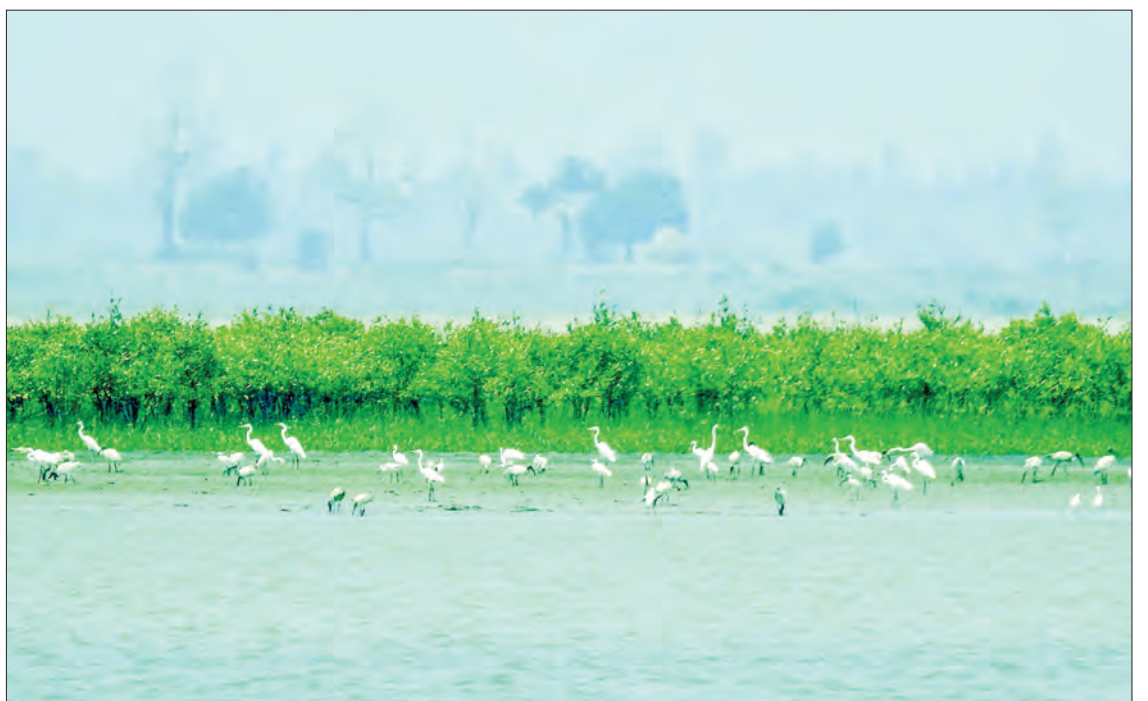
Myanmar's Nantha Island is a habitat of endangered species including sea turtles.