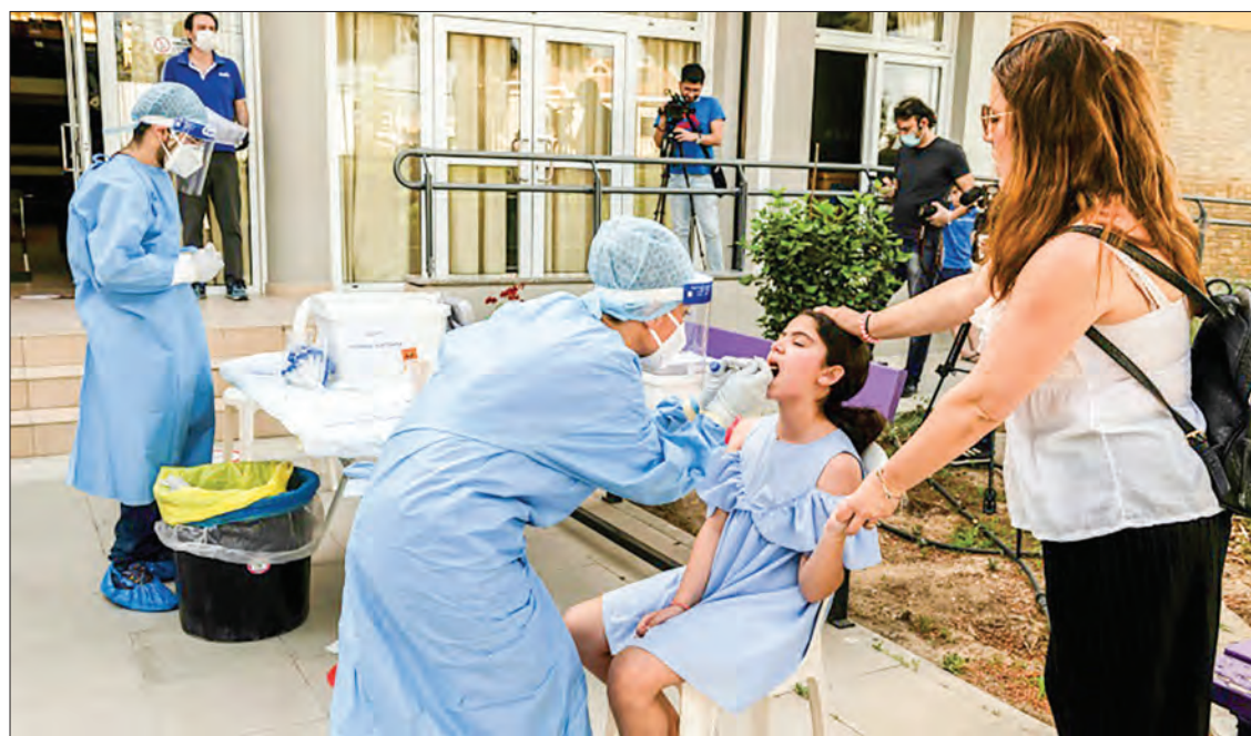
A Cypriot schoolgirl undergoes a swab test for the coronavirus on her first day back at school in the capital Nicosia after the lifting of a two-month lockdown.

Parks and public spaces have also reopened but not children’s playgrounds.—AFP ■