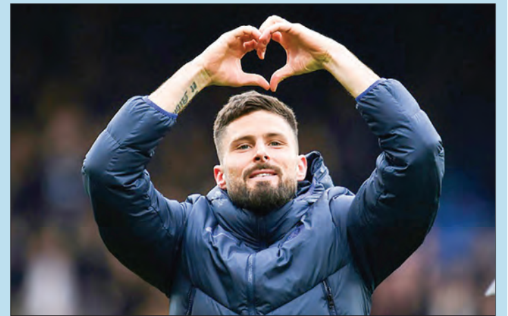
Chelsea have extended striker Olivier Giroud's contract till 2021.

The Olympics have never been cancelled outside of the world wars, but Japanese officials have been clear that they have no intention of postponing the Games again beyond next year.—AFP ■