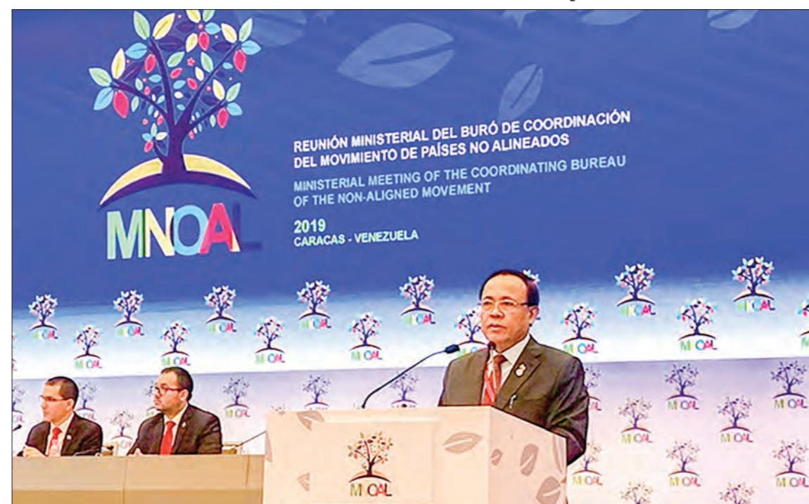
Union Minister U Kyaw Tin delivers the statement at the Ministerial Meeting of Coordination Bureau of NAM on 25 July, 2019.

Myanmar diplomats during the fourth year of the present administration.