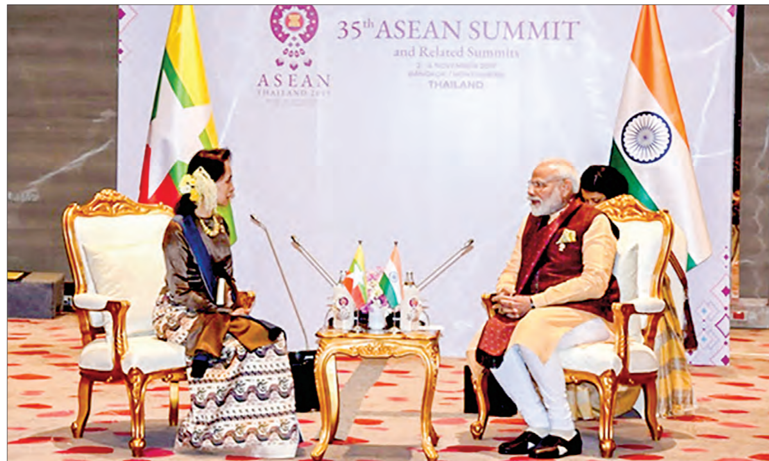
State Counsellor Daw Aung San Suu Kyi holds talk with Prime Minister of India Narendra Modi at 35 th ASEAN Summit in Thailand in November 2019.

In the early days of its regaining independence, Myanmar has been able to maintain cordial relations with all major powers. Likewise, the present government has been striving for fostering friendly relations with all countries around the world in a balanced manner. We are trying to consolidate our