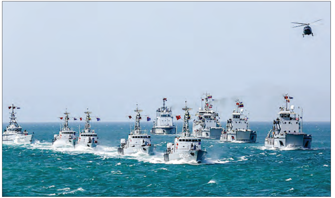
Venezuela said it would deploy naval vessels like these frigates - here on a 2019 exercise - to welcome Iranian tankers bringing much needed gasoline.

Neither Maduro nor Padrino said when the ships, which according to press reports number five and sailed from Iran in the past days, will arrive.—AFP ■