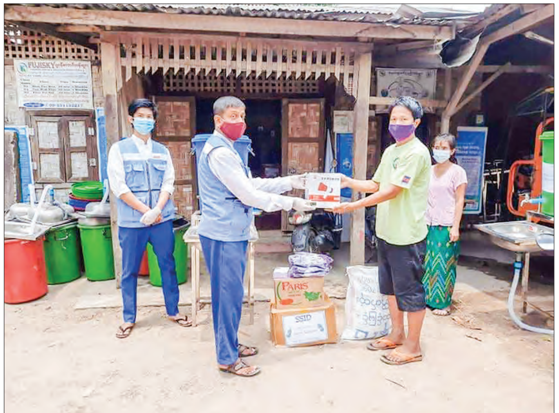
Social Welfare, Relief and Resettlement has provided healthcare items to internally displaced persons.