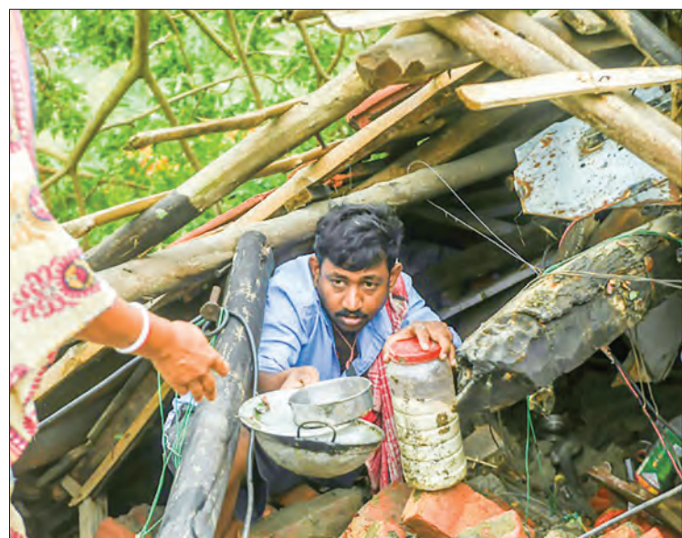
Villagers salvage items from their houses damaged by Cyclone Amphan in the Indian state of West Bengal.

“There were only howling winds and sounds of shattering window panes. All of it was very scary and we thought the end was nearing.” —AFP ■