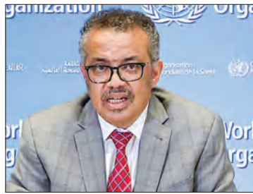
File: A TV grab taken from the World Health Organization website shows WHO Chief Tedros Adhanom Ghebreyesus via video link as he delivers a news briefing on COVID-19 (novel coronavirus) from the WHO headquarters in Geneva on 30 March, 2020.

“It is clear to see that the international community generally disagrees with the US