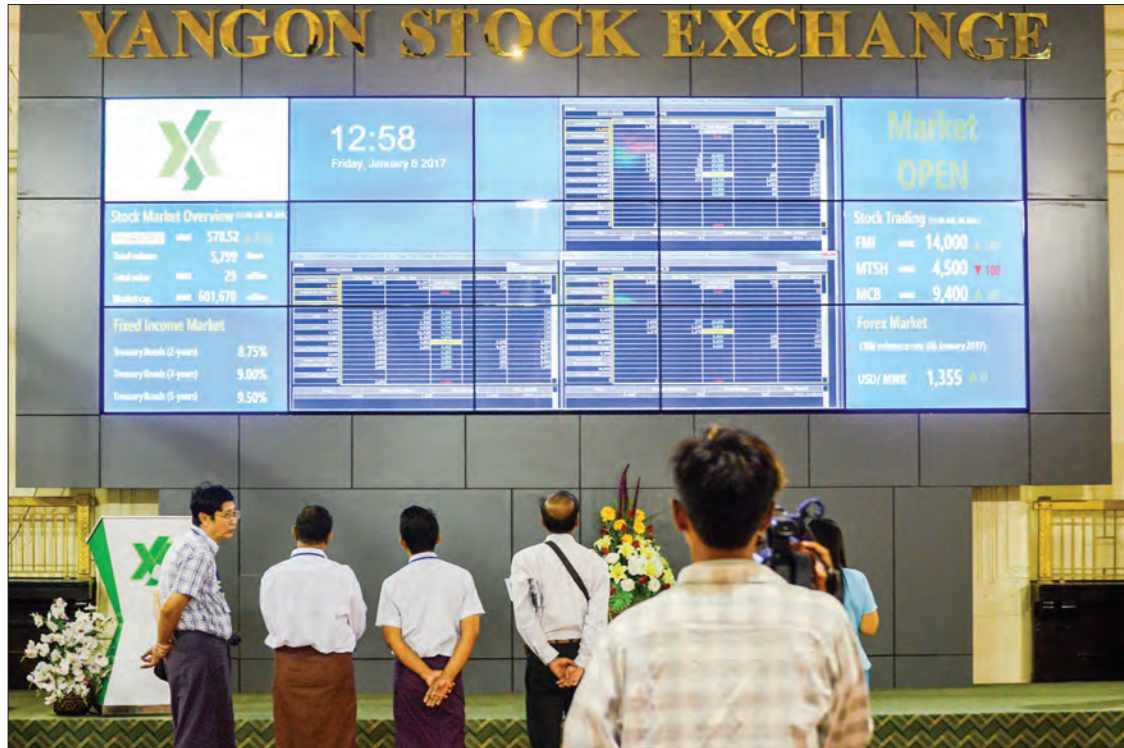
Visitors seen at Yangon Stock Exchange in downtown Yangon.

Shares of five listed companies — First Myanmar Investment (FMI), Myanmar Thilawa SEZ Holdings (MTSH), Myanmar Citizens Bank (MCB), First Private Bank (FPB), and TMH Telecom Public Co. Ltd — are being currently traded