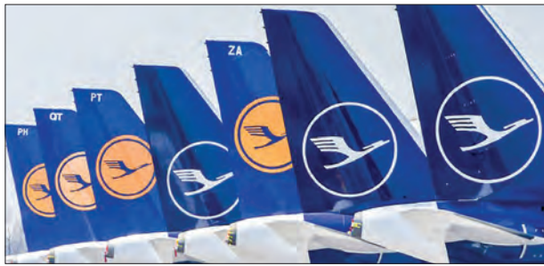
Like many other airlines, most of Lufthansa's fleet is grounded due to the coronavirus pandemic.

BERLIN — Lufthansa on Thursday confirmed it was in talks with the German government over a nine-billion-euro ($10 billion) rescue that will see Berlin take a massive stake in the coronavirus-stricken airline.