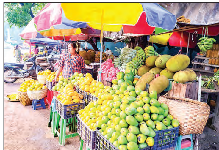
A fruit shop seen in Popa.