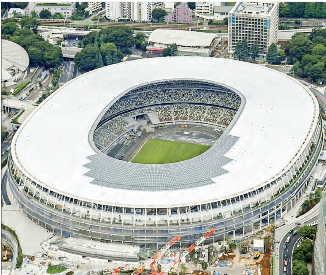
Japan's New National Stadium in Tokyo, the main venue for the 2020 Summer Olympics and Paralympics.

TOKYO—Olympics chief Thomas Bach said 2021 was the “last option” for holding the delayed Tokyo Games on Thursday, stressing that postponement cannot go on forever.