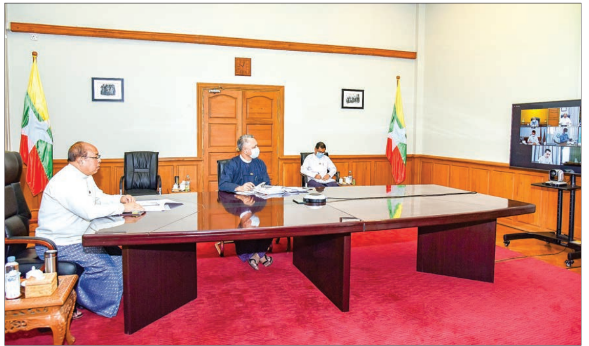
Union Minister U Thaung Tun discusses the video conference to address impact of COVID-19 on Myanmar’s economy.

The meeting decided to expedite loans to businesses adversely affected by the impact of COVID-19. The loans approved on this occasion include applications of businesses from States and Regions as well as Yangon based enterprises. —MNA