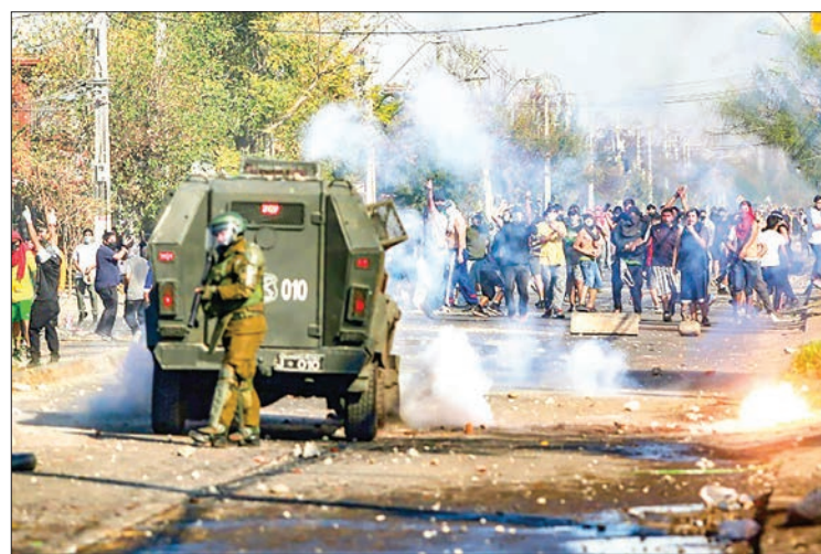
Chilean demonstrators clashed with riot police on May 18 during a protest against President Sebastian Pinera's government.