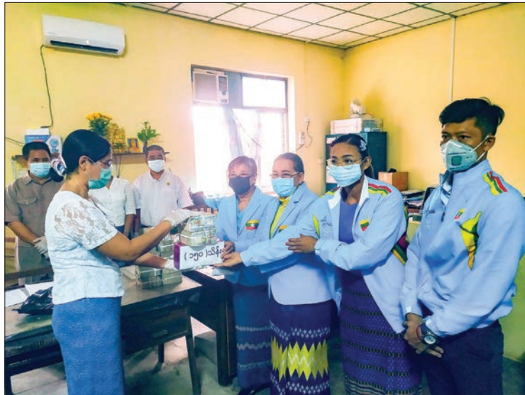
The 30 th SEA Games medalists receiving their prizes.

“We have never received a bonus of that much throughout the history of our sport. We are much thankful to the government for consideration of the value of our coaches as well. These honourable bonus awards will highly motivate both