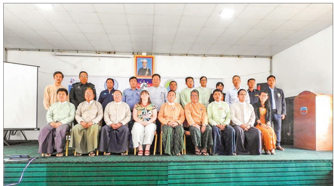
Chin State governmental officials and responsible persons pose for the group photo at the workshop for tourism development in Chin State.