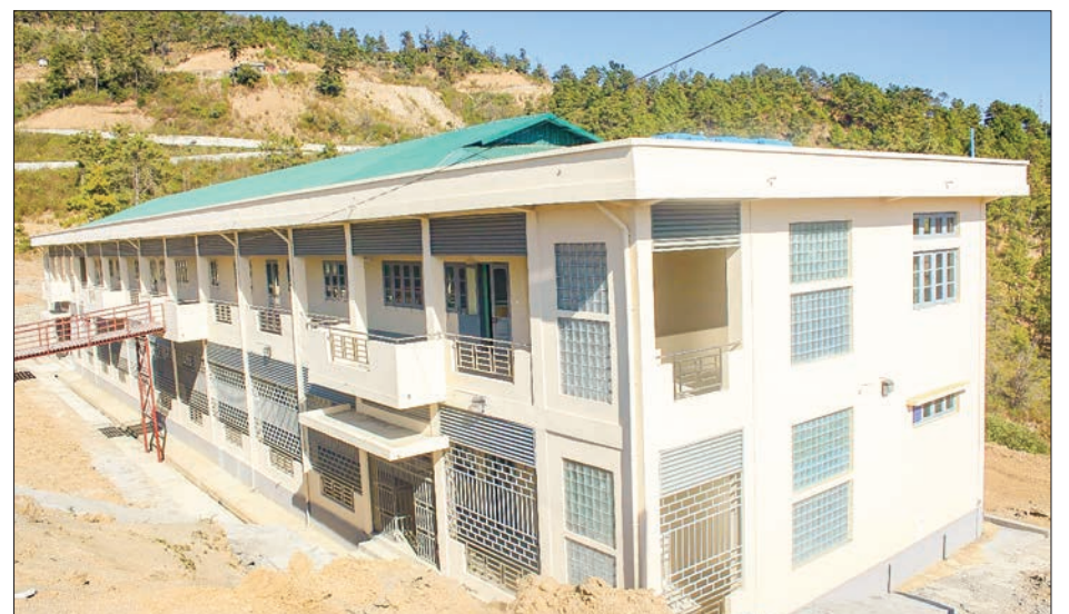
Two storey building of Hakha College.