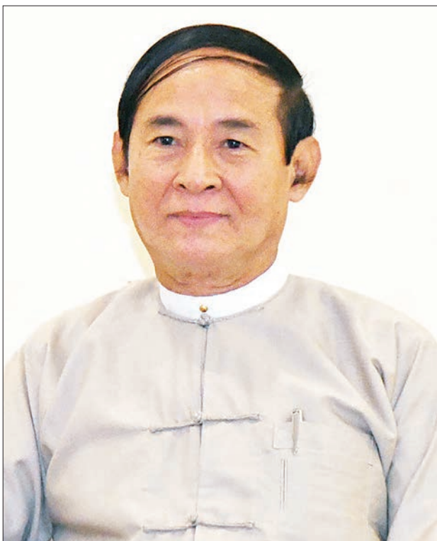
U Win Myint, President of Republic of the Union of Myanmar

“... further enhancement of the existing friendly relations and expansion of cooperation based on the spirit of the community of shared future, joint celebration of the 70th Anniversary of the establishment of the diplomatic relations between Myanmar and China ...”