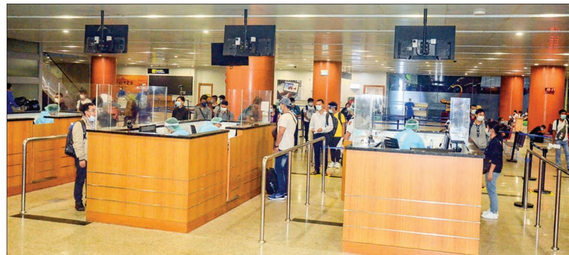
Myanmar returnees from Malaysia conducting their immigration process at the Yangon International Airport yesterday.

They will be checked for COVID-19 at the quarantine places as some returnees in the first group from Malaysia were tested positives.—MNA (Translated by Aung Khin)