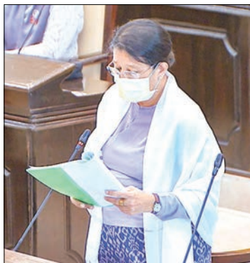
Deputy Minister Dr Mya Lay Sein.