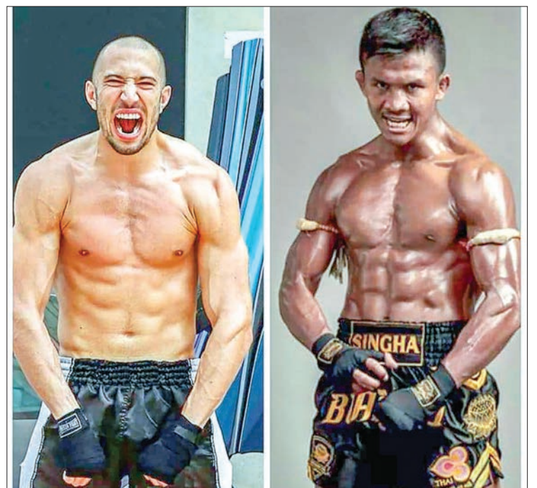
Myanma Lethwei star Dave Leduc (L) and Muay Thai Fighter Buakaw (R).

Officials from the Myanmar Lethwei and Muay Thai are currently arranging for a special fight of Lethwei star Dave Leduc and Muay Thai fighter Buakaw, according to the official statement with the Myanmar Lethwei Collection (MLC).