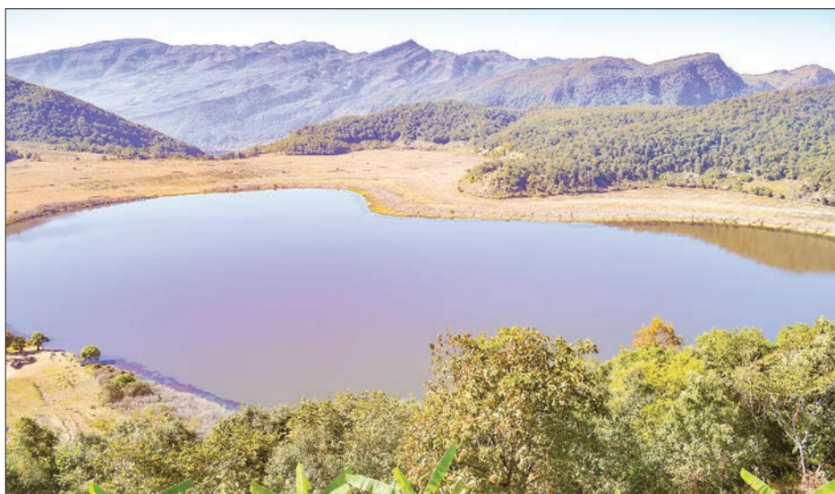
Heart shaped Rih Lake in Reedkhawda is an attractive place in Chin State.