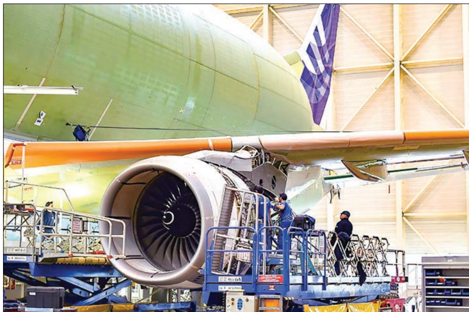
Rolls-Royce engines, like this Trent 700, power many of today's aircraft.

Unions said they expected most of the cuts to occur in the UK, while analysts said the knock-on effect for supply chains meant many more people working across the aerospace industry were set to lose their jobs.