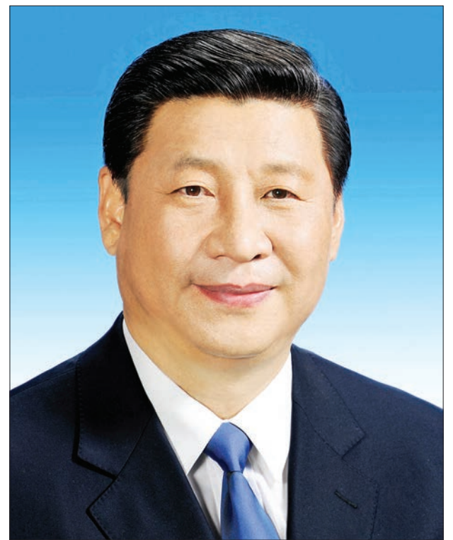
Mr Xi Jinping, President of the People's Republic of China.

“... further enhancement of the existing friendly relations and expansion of cooperation based on the spirit of the community of shared future, joint celebration of the 70th Anniversary of the establishment of the diplomatic relations between Myanmar and China ...”