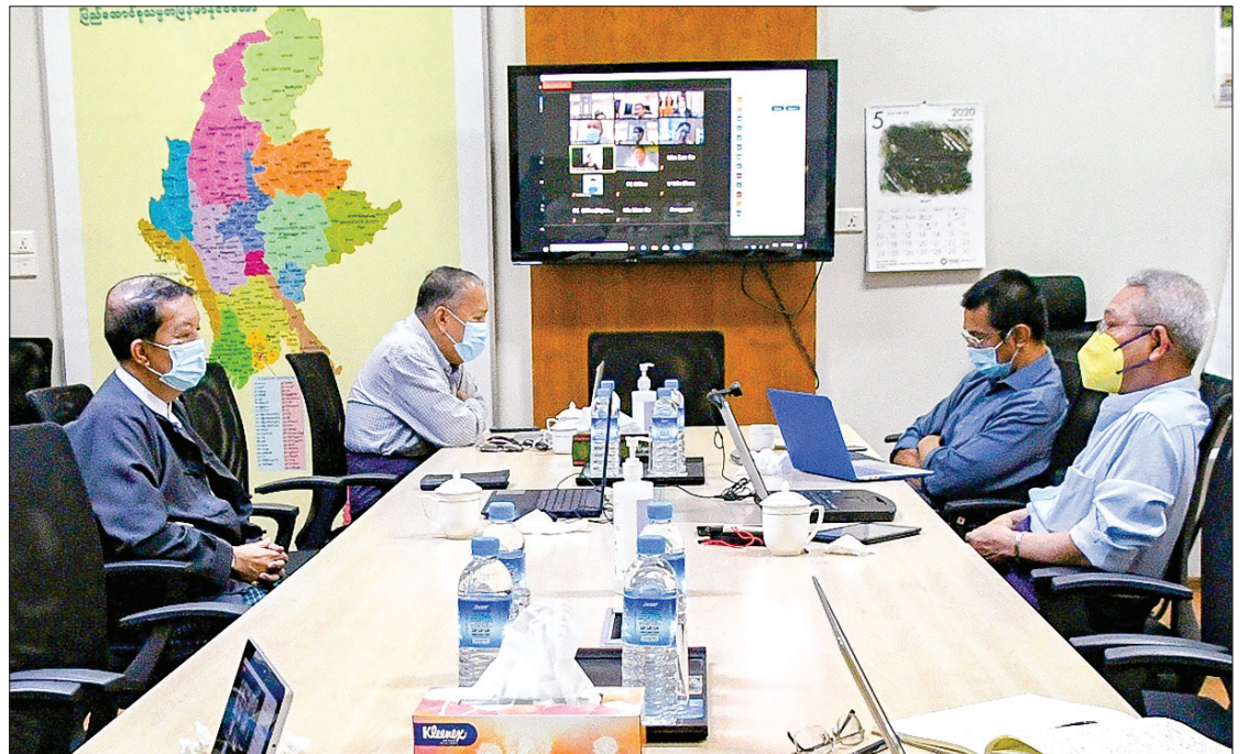
National coordination committee for negotiating COVID-19 measures with ethnic armed organizations hold online video conference with Arakan Liberation Party yesterday.