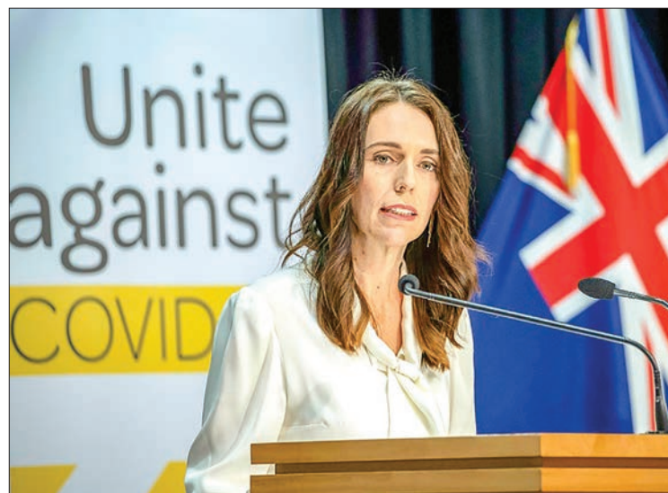
PM Jacinda Ardern has said New Zealanders should be ready to consider 'extraordinary ideas' to deal with the fallout of the coronavirus pandemic.

International borders remain closed but New Zealanders are now free to travel domestically, with tourism operators and airlines ramping up services to meet demand.—AFP ■