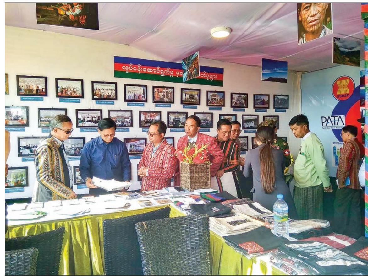
Vice President U Henry Van Thio observing the photo gallery showcasing activities and development in Chin State.

Local government's vision involves the task of reclaiming mountain farming areas for growing cash crops and raising livestock, improving the transport sector, developing the manageable, small and medium enterprises and improving the power supply. It also includes undertakings for rural development, human resources, health,