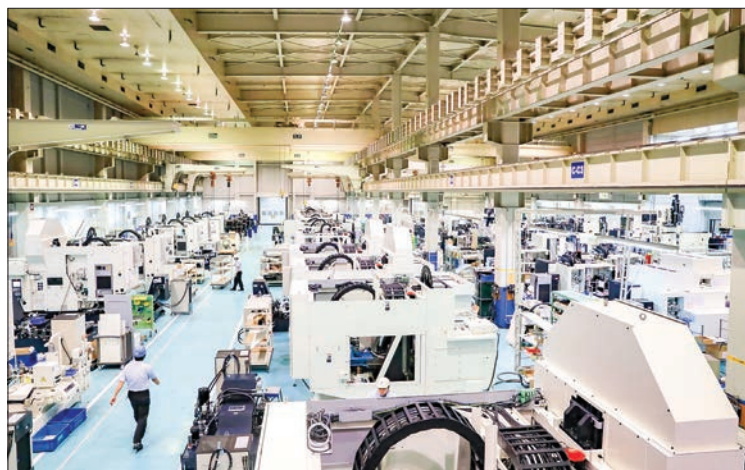
Demand for electrical machinery was particularly weak, dropping 24.4 per cent.

"The data are rather volatile to begin with, so we have to keep watch for several months to determine a trend. That said, we are seeing declining demand from some industries, so we can't be too optimistic about the outlook," a Cabinet Office official was quoted as telling a press briefing on the matter.—Xinhua ■