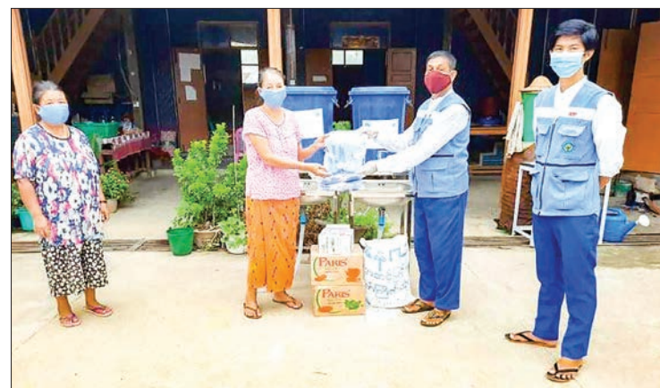
Officials from Ministry of Social Welfare, Relief and Resettlement providing necessary assistance to people in Kachin State.

THE Ministry of Social Welfare, Relief and Resettlement is cooperating with relevant departments and organizations to implement COVID-19 measures in IDP camps and temporary relief centres across the nation.