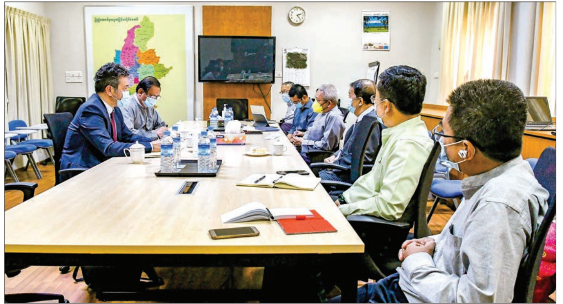
Government committee, Peace Commission and ICRC discuss coordination in COVID-19 measures.