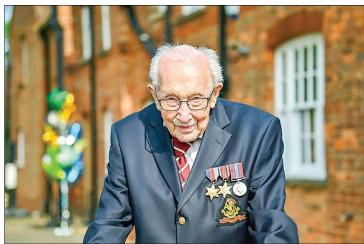
Besides his new knighthood, WWII veteran Captain Tom Moore also holds world records for raising money in a charity walk and as the oldest person to have a No. 1 in the UK singles charts.