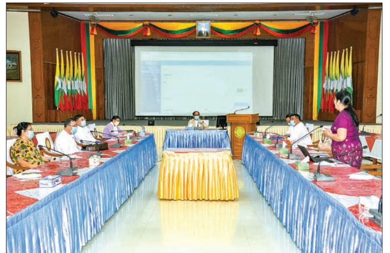
Union Minister Dr Myint Htwe chairs the meeting for upgrade of internet page and social networks of Ministry of Health and Sports.