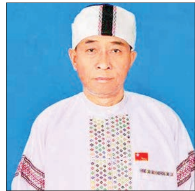
Chin State Chief Minister Pu Salai Lian Luai.

K ENNEDY Peak of Laytha mountain where pine forest thrives and cherries and rhododendron flowers bloom in Tiddim Township is a tourist attractive place of Chin State. The 8871-foot high Kennedy Peak is the best place to admire the natural wonders of Chin State formed with high mountain ranges, green forests and wild flowers. The local government