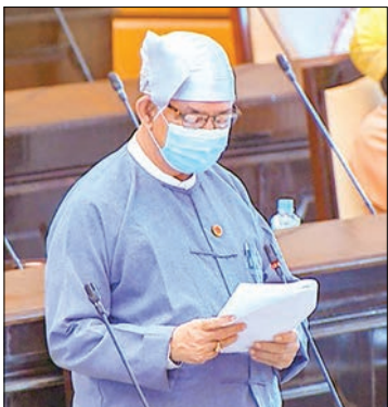
Deputy Minister Dr Ye Myint Swe.