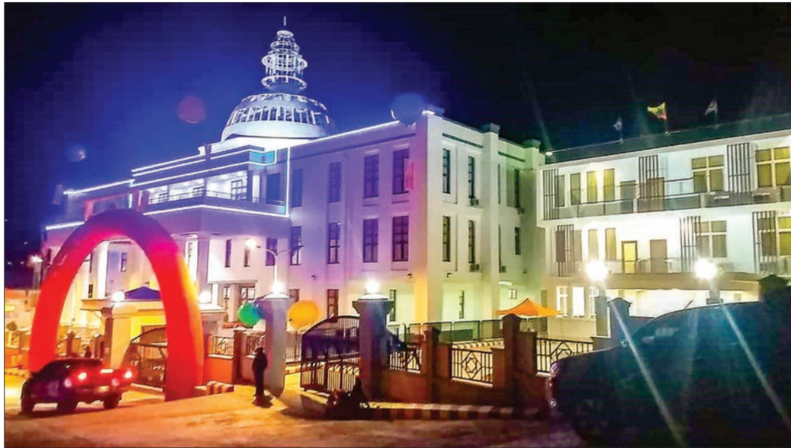
The Hluttaw building of Chin State.

schools, education staff houses, pre-primary schools, hostels, retaining walls and upgrading the schools and hospitals in Haka, Thantalan, Falam, Tiddim, Tunzan, Mindat, Matupi and Kanpetlet. It built nursing and midwifery training school at a cost of over Ks 149 million, and implemented staff housing, laboratory, station hospital, ward extension, operation theatre, and building projects in various townships of Chin State.