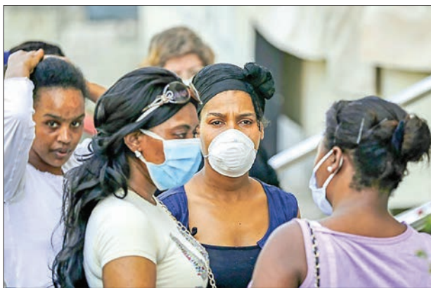
Ethiopian domestic workers queue to register for repatriation outside their country's consulate in Beirut.

"I want to go back to Ethiopia," said the mother of two girls, who has not seen them for almost three years. Lebanon is suffering its worst economic crisis in decades, as well as a coronavirus lockdown. Some Lebanese families have started paying their home help in the depreciating local currency, while others are now unable to pay them at all, with increasing reports of domestic workers being thrown into the street.— AFP ■