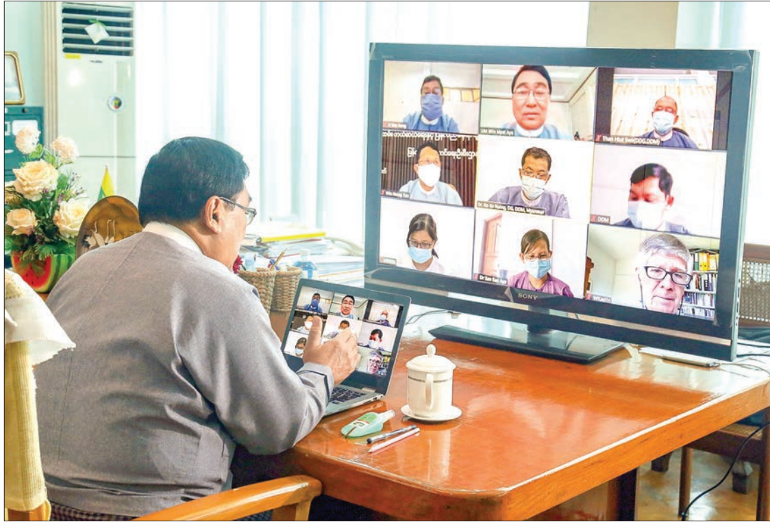
Union Minister Dr Win Myat Aye talks on video conference about implementation of national strategy for resettlement programmes and closure of IDP camps in Myanmar.

UNION Minister for Social Welfare, Relief and Resettlement Dr Win Myat Aye presided over the video conference meeting yesterday afternoon on implementation of national strategy for resettlement programmes and closure of IDP camps in the country.