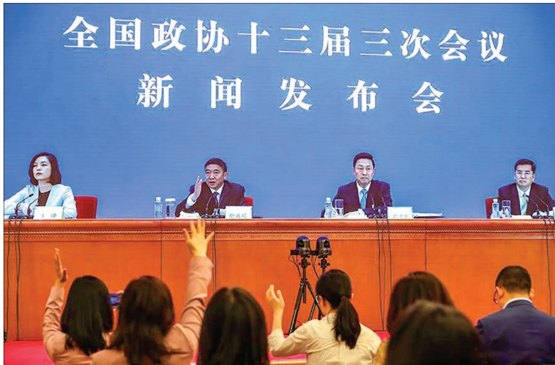
Journalists raise hands to ask questions in front of a screen during a press conference of the third session of the 13th National Committee of the Chinese People's Political Consultative Conference (CPPCC) through video link in Beijing, capital of China, May 20, 2020.

Foreign diplomatic envoys to China will be invited to observe the opening and closing meetings of the session, he added.