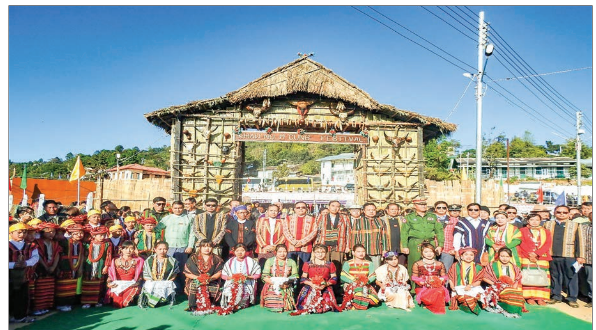
Officials and ethnic people pose for the group photo at the Khaw Nu M Cung Festival in Chin State.