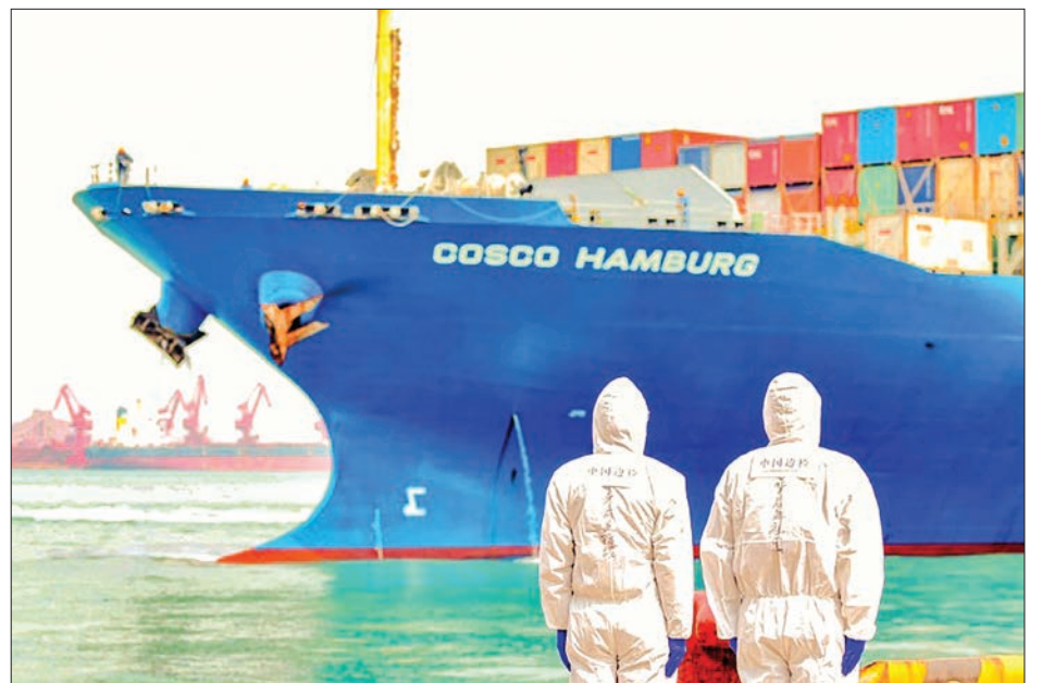
China saw a surprise increase in exports last month.

tact with our Canadian and Mexican counterparts and they also agree that extending these restrictions is prudent at this time. We appreciate our partnership with Mexico and Canada in ensuring that North America is working together to combat the ongoing global pandemic," he said.—AFP