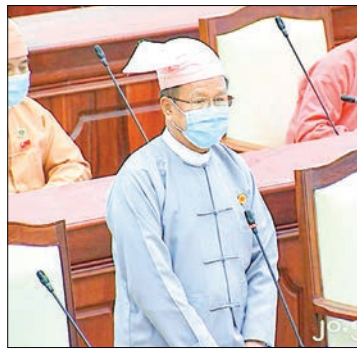
Deputy Minister U Aung Htoo.

Nay Pyi Taw Council Member U Nyi Tun answered that no one has submitted the tender