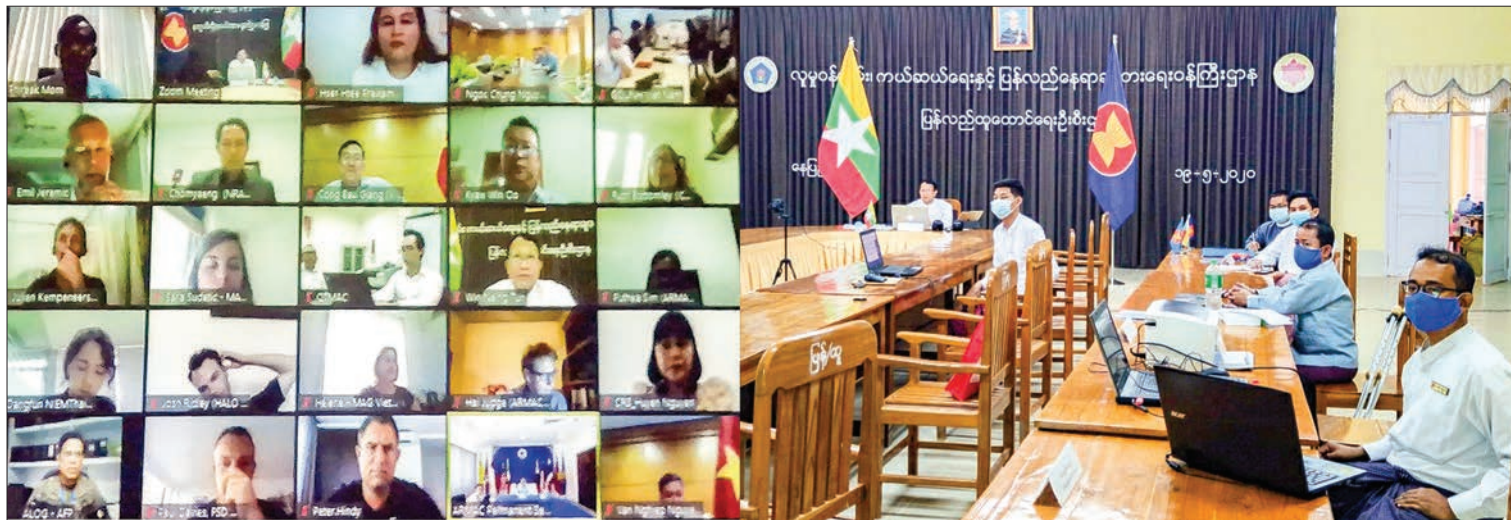
The ARMAC holds Regional Webinar on "Explosive Ordnance Risk Education in ASEAN in a Time of Pandemic" on 19 May afternoon.