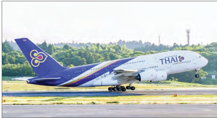
File photo taken in June 2017 shows an Airbus A380 plane operated by Thai Airways International at Narita airport near Tokyo.