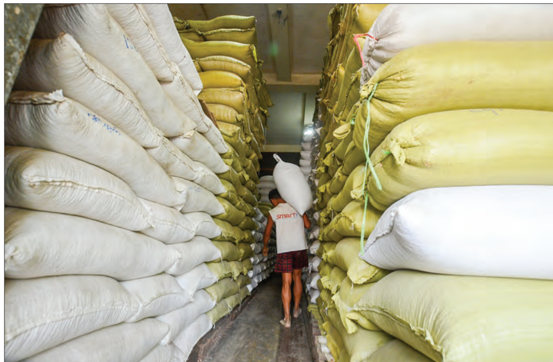
Rice exports through the border gates have generated an estimated US$44.47 million in the current financial year.