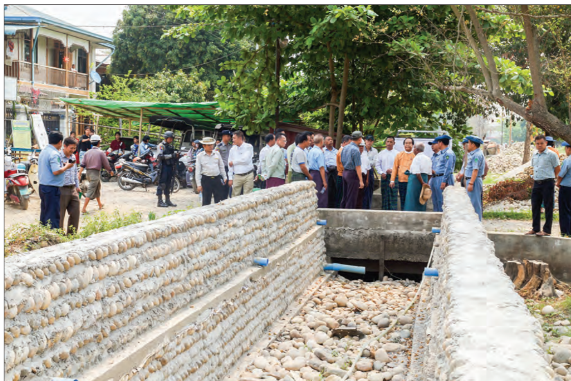
Kachin State Chief Minister Dr. Khet Aung inspects the upgraded drainage canal.