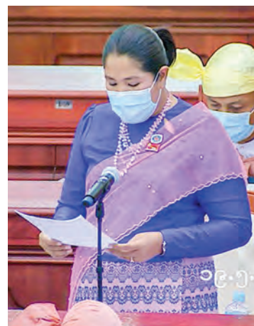
MP Daw Ni Ni May Myint.

directives. He also raised a question to review the three-year permit for this plant; MP U Khin Cho from Hlaingbwe constituency about renegotiating the contract for transfer period of a hydropower project being operated under BOT system to the government; MP U Nay Myo Htet from Kyaukta-da constituency raised a query about completion of LNG plant projects which are being implemented by tender system; MP U Nay Htet Win from Singbaungwe constituency asked for immediate solutions on the delay of electrification in villages under the National Electrification Programme.