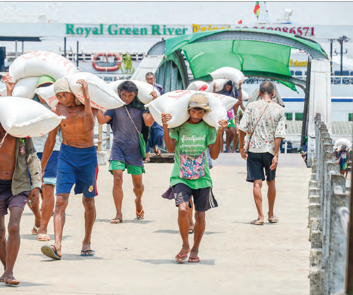
China is the main buyer of Myanmar rice, followed by Madagascar and the Philippines.