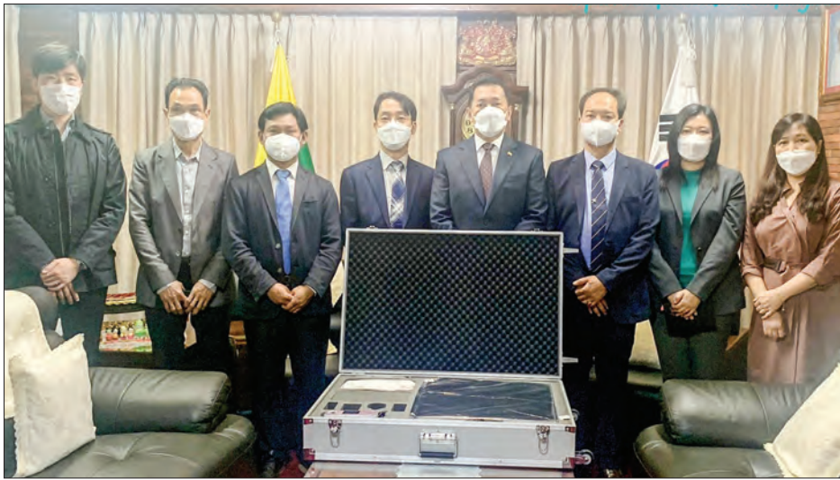
Donation of X-Ray machine and cash is made in coincidence with 45 th anniversary of Myanmar-ROK diplomatic relations.

MYANMAR nationals in the Republic of Korea including ambassador and officials from the Myanmar Embassy in Seoul donated a portable X-Ray machine and cash to Myanmar yesterday.