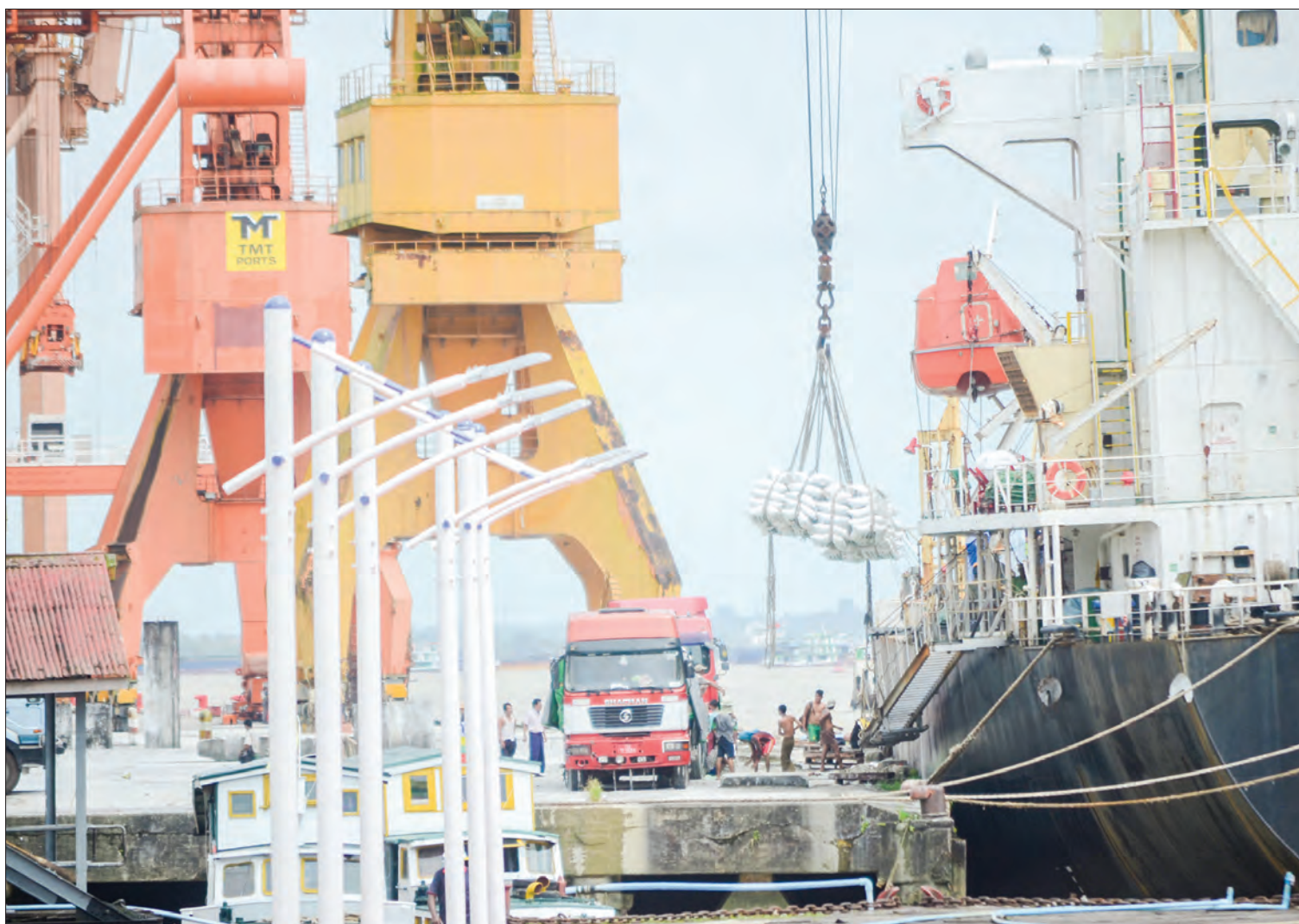
Myanmar freighted more than 1.09 million tonnes of rice and 551,641 tonnes of broken rice during the period from 1 October 2019 to early April this year.

The Southeast Asian country exported 1.7 million metric tonnes of rice and broken rice in 2016-2017, fetching US$ 405 million. Myanmar shipped about 3.6 million metric tonnes of rice and broken rice valued at US$ 1.356 billion in 2017-2018FY and exported over 2.35 million tonnes of rice and broken rice worth over 709.6 million US in the financial year 2018-2019.