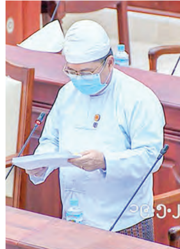
Deputy Minister U Khin Maung Win.

MP U Sai Tun Aye from Mongshu constituency asked about operation of coal-fired power plant in Tikyit area of Pinlaung Township in line with existing law, regulations and