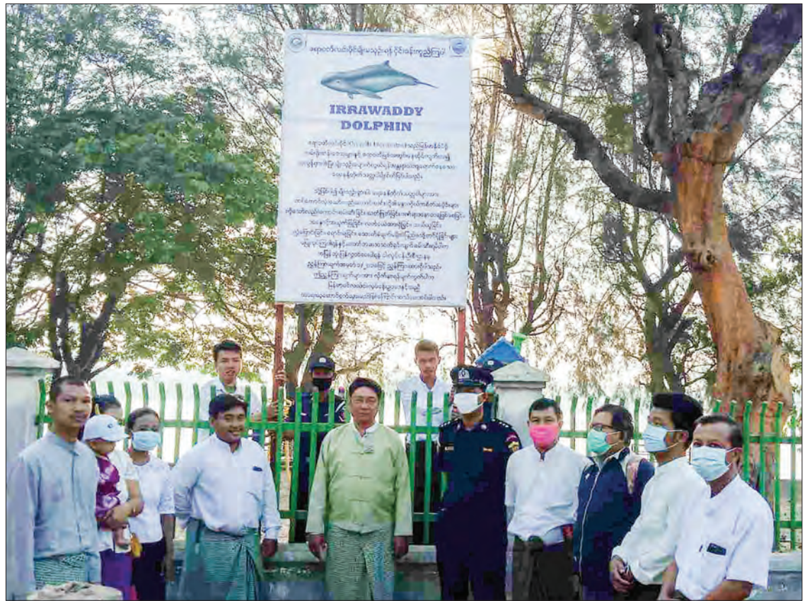
Officials from the Fisheries Department and delta locals pose for group photo after they erected a poster for conservation of Ayeyawady Dolphin.

So, the Fisheries Department prohibited that the rare and endangered mammal species are not allowed to catch, kill and hurt regardless of whether the whole bodies or parts of their bodies. Additionally, the endangered Ayeyawady dolphins are not allowed to export, hand over, transport and hand in without having any recommendations from the department concerned. If Ayeyawady dolphins are found alive coincidentally, they have to be released as soon as possible.