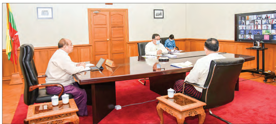
Union Minister for Investment and Foreign Economic Relations U Thaung Tun joins meeting on Regional Action Group for Asia-Pacific (APAC-RAG) - COVID-19 Action Platform.

Participants also exchanged views regarding COVID-19's impact, including speeding up the region's transition into the 4th Industrial Revolution. The Union Minister drew attention to innovations emerging from Myanmar, including seeing My-