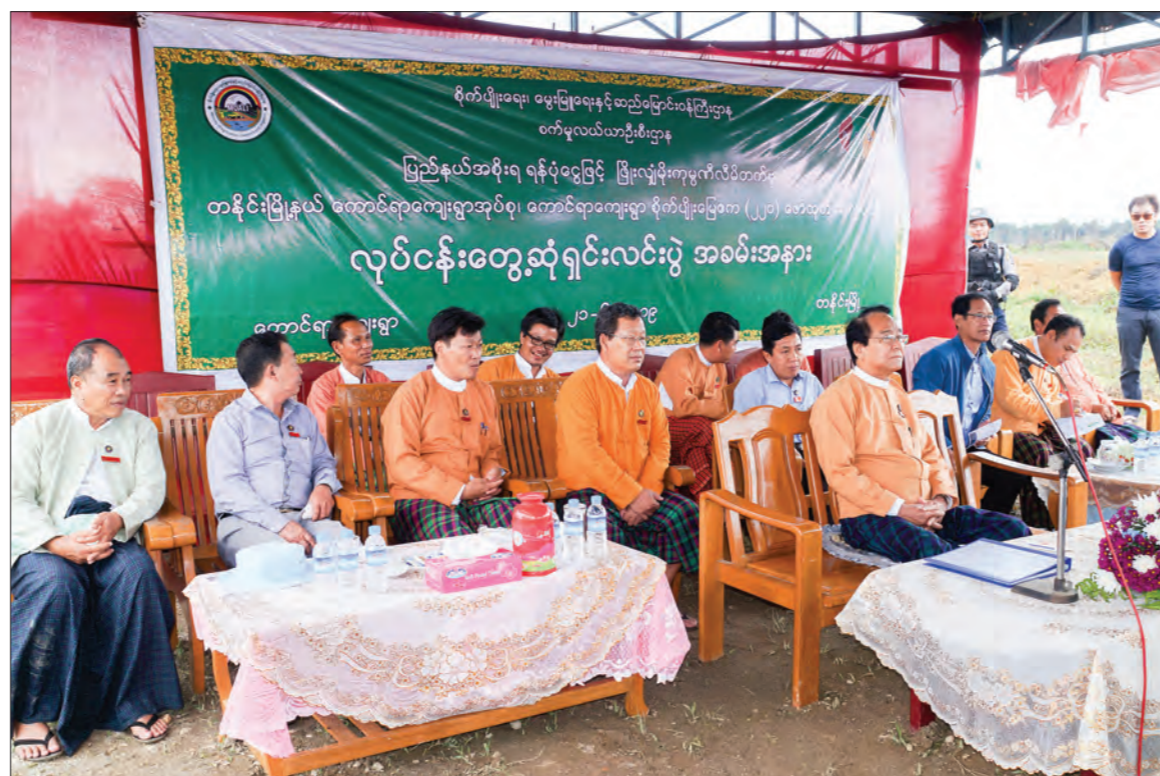
Kachin State Chief Minister Dr Khet Aung attends a meeting to brief about reclamation of 220 acres in Kaungyar Village in Tanai Township.

The state government envisions a future where the livelihoods of the public are developed, peace and stability are firmly entrenched between the ethnic groups, and illegal drugs are completely eradicated and