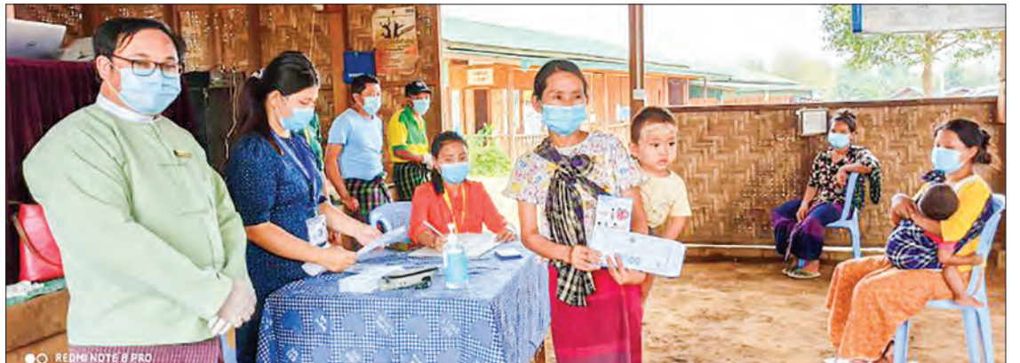
The Ministry of Social Welfare, Relief and Resettlement presents relief aid to IDPs in Kachin and Shan States.

Under the MCCT programme, the MoSWRR has been supporting vulnerable persons in Chin, Rakhine, Kayin and Kayah