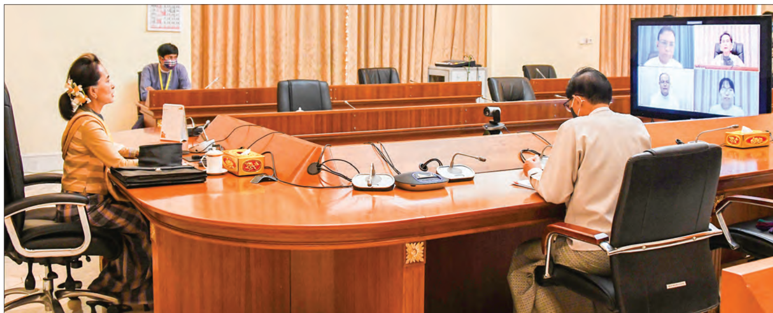
State Counsellor discusses school reopening plan with stakeholders in education sector on a video conference.

She further stated among the countries that they have studied, Vietnam was the most impressive country in addressing COVID-19 crisis as it could take effective measures and that Vietnam's experience has been studied; schools have also been reopened in Vietnam; both countries share the same situation, and that the situation in developed countries and the situation in Myanmar was very different; because of this difference, it would not be practical to calculate what would happen in Myanmar based on observations of what had happened in those countries. Since the situation in Vietnam and Myanmar was very similar, there was ample time to