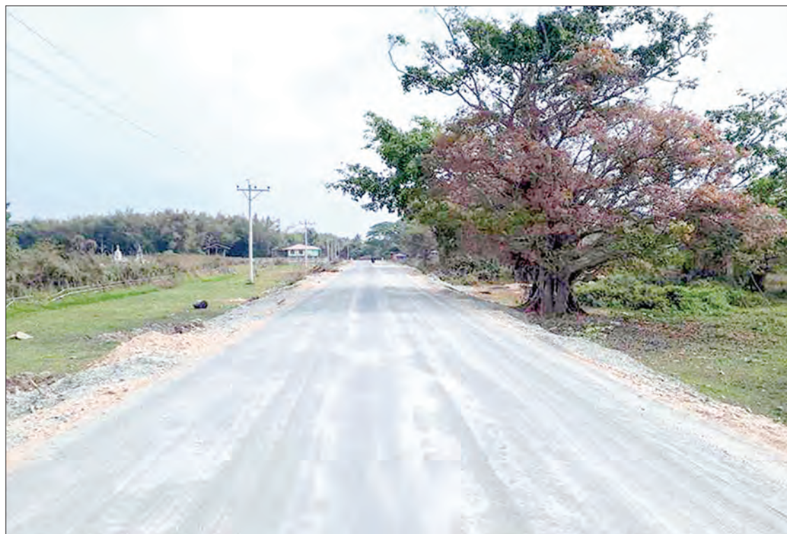
The Hopin-Nantmon-Nyaungpin-Waykhar Road was upgraded in the 2019-2020 Fiscal Year.