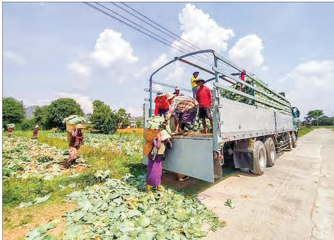
Cabbage growers in southern Shan State have suffered losses due to market decline and had to distribute their produce to people free of charge in some occasions.

On 18 May, under the guidance of MFVP, 12-wheel truck of cabbage were distributed free of