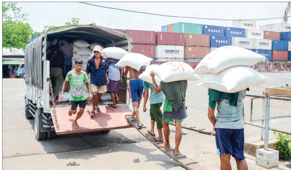
Broken rice has been placed in 52 foreign markets.