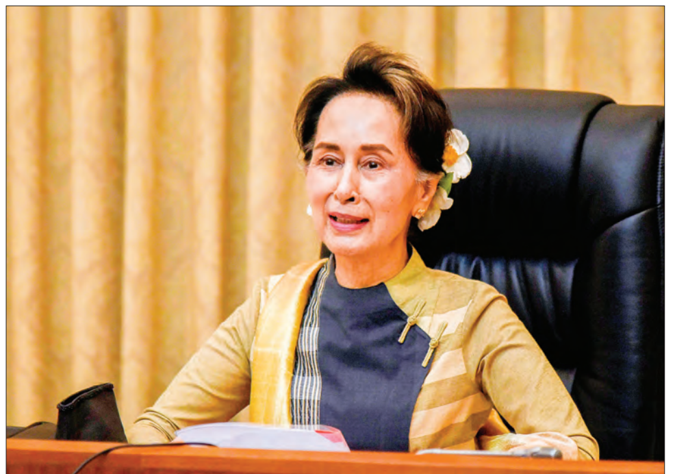
State Counsellor Daw Aung San Suu Kyi holds a video conference on reopening of schools with relevant persons in education sector.

S TATE Counsellor Daw Aung San Suu Kyi in her capacity as Chairperson of the National-Level Central Committee on Prevention, Control and Treatment of Coronavirus Disease 2019 (COVID-19) held a video conference about reopening of schools amid the COVID-19 pandemic with relevant persons in the education sector yesterday.