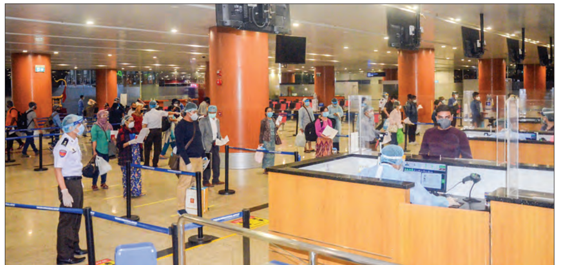
Myanmar returnees from India queuing for immigration process at Yangon International Airport.