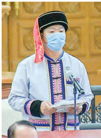
MP U Ar Moe Si.

MP U Stephen from Kengtung constituency asked about power supplies from national grid for Kengtung Township and Mongpyin Township. Deputy Minister for Electricity and Energy U Khin Maung Win replied that Mongpyin and its nearby 15 village and Kengtung and nearby 55 villages will have access to electricity from national grid after constructing Namhsan-Mongpyin-Kengtung power line.