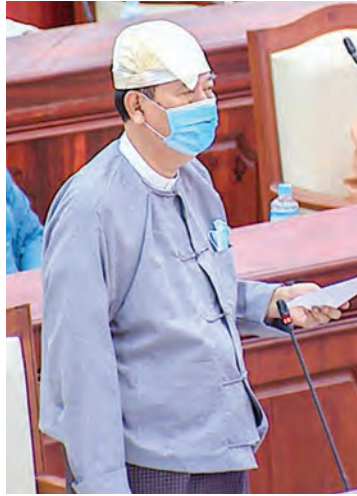
Deputy Minister for Education U Win Maw Tun.

MP Dr Aung Naing from Thabeikkyin constituency asked about opening a government technical high school. The deputy minister replied that the Department of Technical, Vocational Education and Training Department prioritizes new school plan at the district cities and it is not possible to set up such school in this constituency.