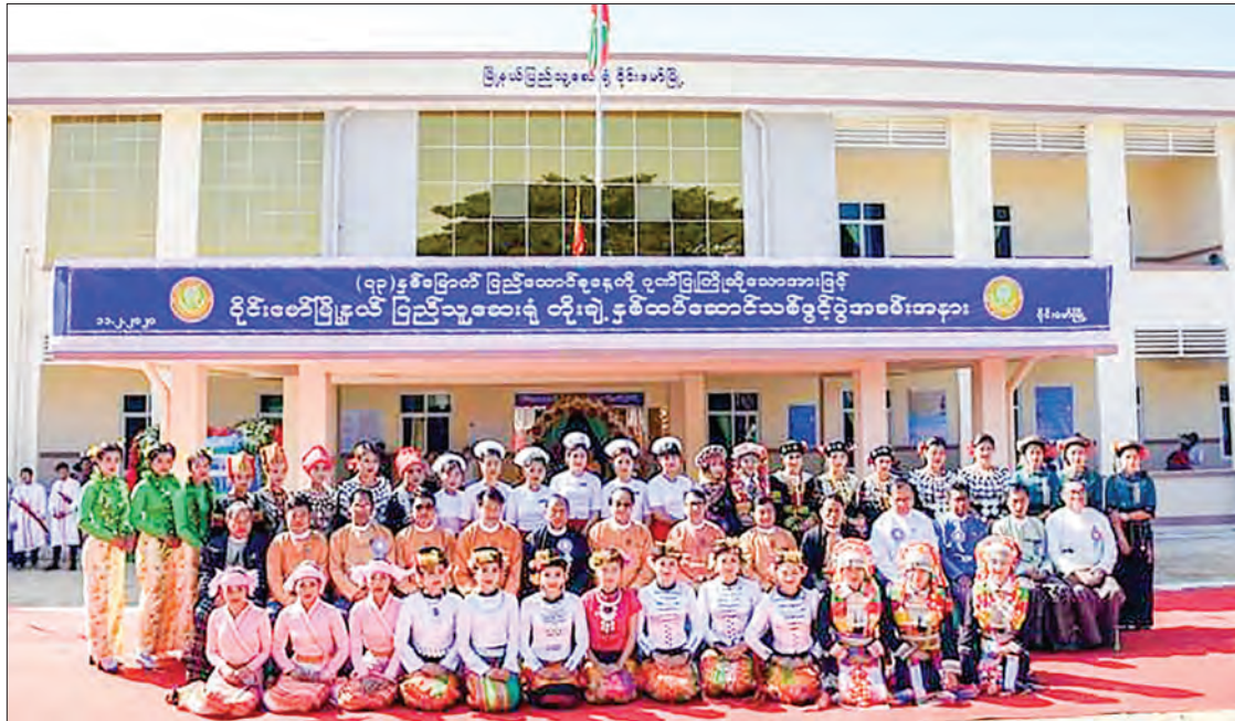
The two-storey building for Waingmaw Township People's Hospital is inaugurated on 11, February, 2020 in honour of the 73 rd Union Day.

The state government has been building staff residences for the civil servants of the Urban and Housing Development Department in Kachin State. In their fourth year of administration, the state government constructed 16 housing units with 256 rooms using K534 million from allotted funds for the UHD department staff.