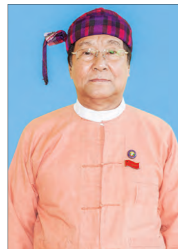
Kachin State Chief Minister Dr Khet Aung

The Border Region and Ethnic Development Department utilized K7.5 billion for 50 bridge, 3 drinking water distribution, and 3 staff residences.