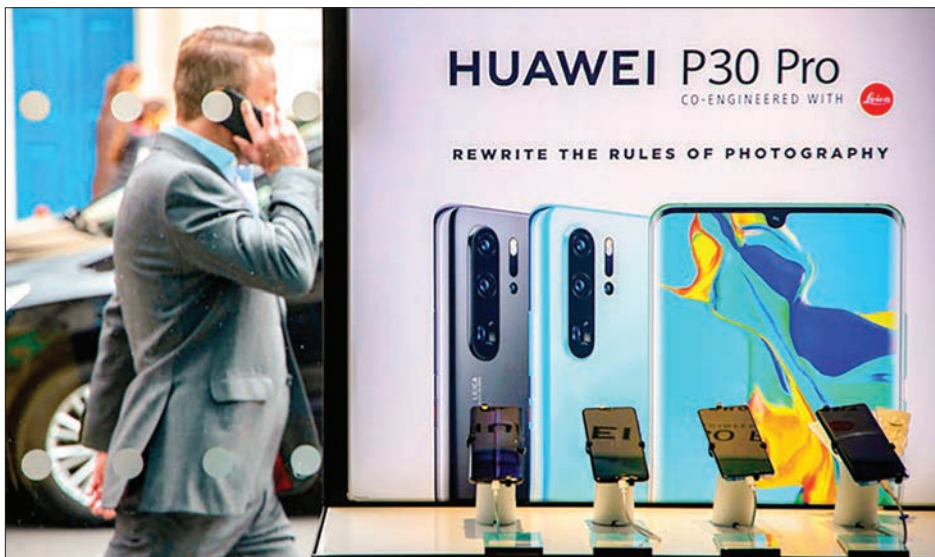
File: Under the new rules, foreign enterprises that use U.S. chip-making equipment will be required to gain a U.S. licence before supplying certain items to Huawei.

Last May, Huawei, a leader in next-generation 5G mobile communications networks, and its non-U.S. affiliates were placed on the department’s blacklist known as the “Entity List.” U.S. companies wishing to export items to the listed entities must obtain a licence. U.S. President Donald Trump, who has pursued protectionist policies as part of an “America First” agenda, has voiced wariness over China’s advances in leading-edge technologies, with Washington having targeted Chinese goods linked to them in a trade dispute. —Kyodo ■