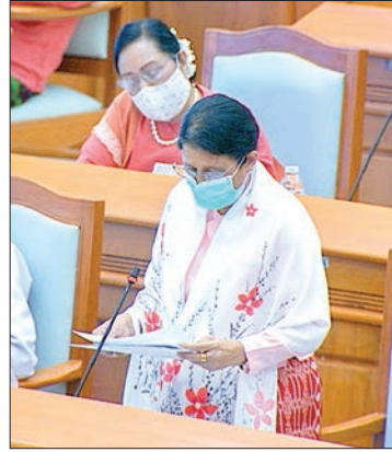
Deputy Minister for Health and Sports Dr Mya Lay Sein.