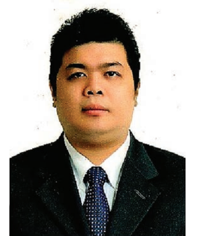
Ko Arker Nyut Wai

Telenor has established a global programme to strengthen our security to be able to detect, resist, and if required evict threat actors attacking our mission-critical networks. We also ensure the safety of users