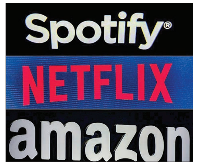
Internet giants such as Spotify, Netflix and Amazon could be subject to tax in Indonesia under a new levy proposed by the tax directorate.