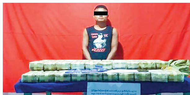
Officials arrest K975 million worth of WY psychotropic tablets in Maungtaw Township on 16 May.

The illegal drugs were stored in three gunny sacks and are estimated to have a value of K975 million. They have been transferred to Pyinphyu police station, according to the office of the Commander-in-Chief of Defence Services.—MNA (Translated by Zaw Htet Oo)