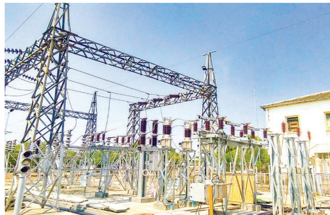
The 33KV Switchbay of Mandalay's Thazi Sub-power station.

Republic of the Union of Myanmar President's Office Order 14/2020