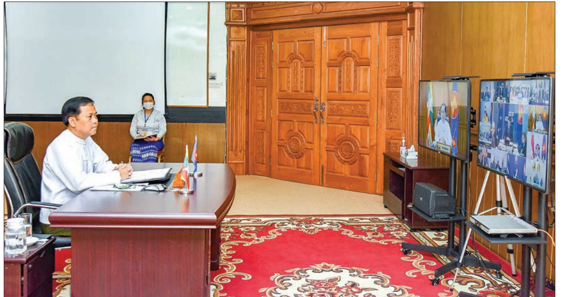
Permanent Secretary U Soe Han attends the Video Conference of the 32 nd ASEAN-Australia Forum yesterday in Nay Pyi Taw.

At the Forum, the Senior Officials shared their respective national efforts and best practices in the prevention, containment and treatment of COVID-19, and exchanged views on enhancing ASEAN-Australia cooperation on the COVID-19 response and recovery. Permanent Secretary U Soe Han apprised the Forum of national measures taken by the Govern-