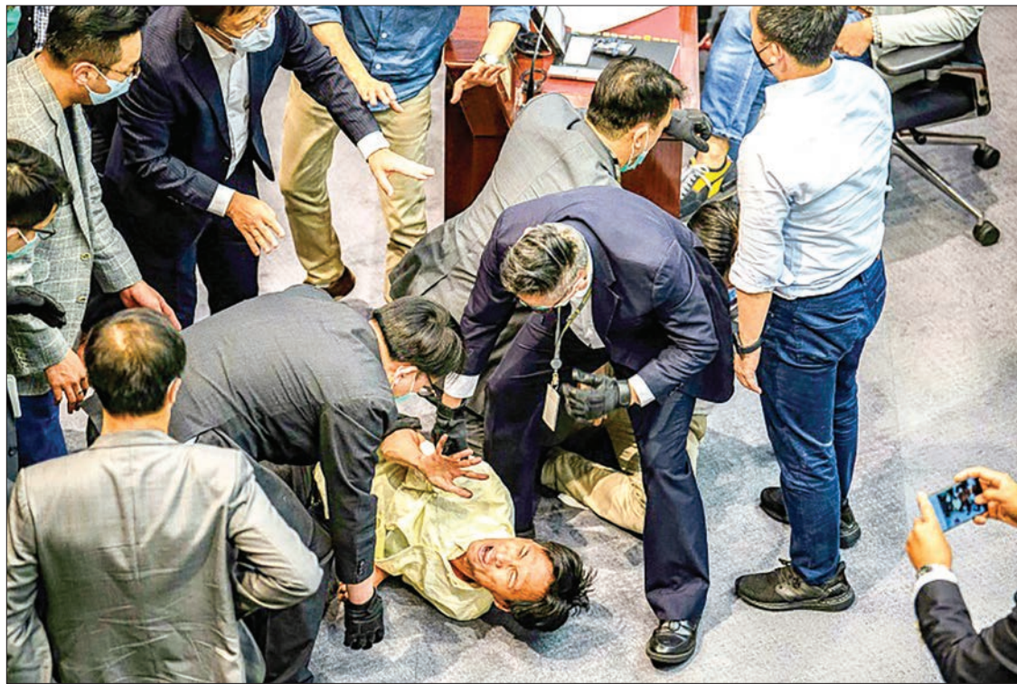
Clashes broke out once more in Hong Kong's legislature.