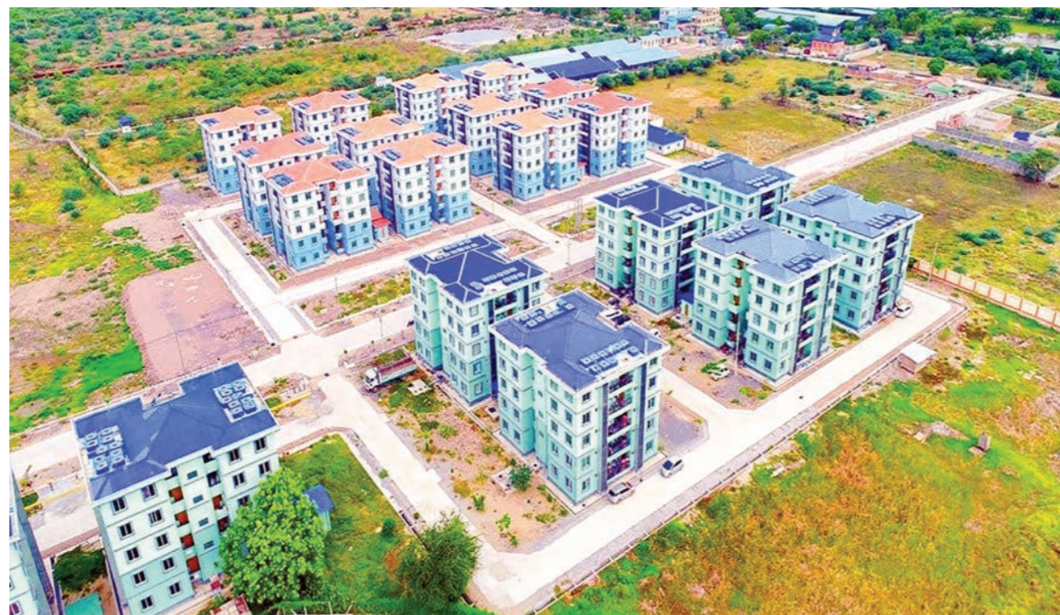
Aung Myay Mandalar Residence for civil servants in Mandalay.

In keeping the government departments and the organizations to be in line with the stipulations of the State Constitution, the proper management, the directive, the supervision, and the inspection are being carried out of the Mandalay Region Government.