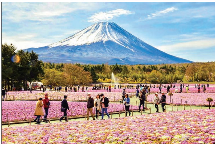
No climbing this year at Mount Fuji.

The mountain, a UNESCO world cultural heritage site, is located just 100 kilometres (60 miles) from Tokyo and is clearly visible from the Japanese capital.—AFP ■