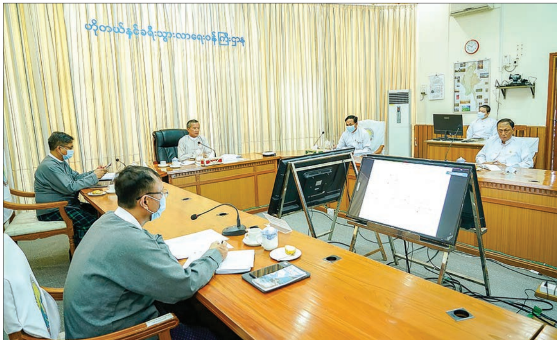
Union Minister U Ohn Maung holds a video conference with Chinese tour operators for future plan for tourism business.

The Union Minister said travel to Myanmar significantly increased when the restrictions for Visa on Arrival were lifted on 1 October 2018 with the number of visitors between the later part of 2018 to 2019 reaching 749,719.