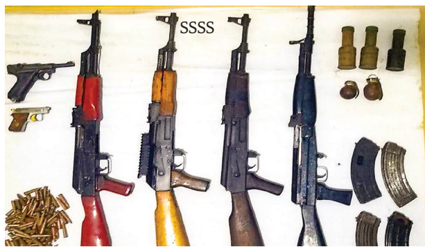
Firearms and ammunitions founded from a garbage dump in Muse on 16 May.

SECURITY forces in Muse Township, Shan State (North), discovered 4 rifles, bullets and cartridges hidden in a gunny sack and buried in a garbage dump at the edge of Muse at 7 pm on 16 May.