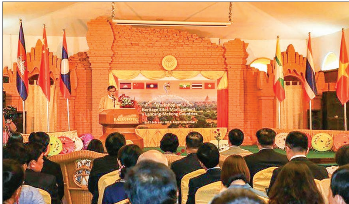
Workshop on Heritage Sites Management in Lanchang-Mekong Countries being held in Bagan, Mandalay Region.