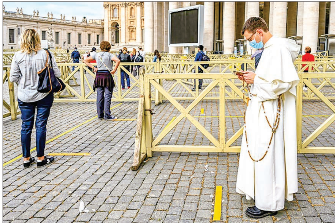
Visitors observed social distancing rules as they waited in line to enter.

"I've tried to do some hair care at home over the past