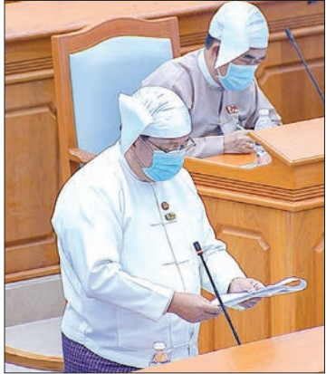
Union Minister U Thaug Tun.