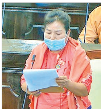
MP Daw Khin Swe Lwin of Chin State constituency 9.