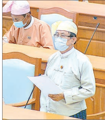
Deputy Minister U Maung Maung Win.