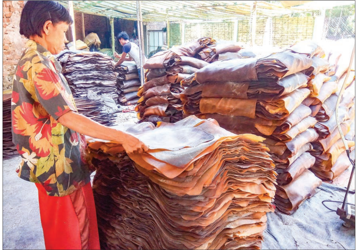
A woman is preparing to smoke raw rubber sheets in a warehouse in Thuwunna Waddi, Mon State.

About 300,000 tonnes of rubber are produced annually across the country. Seventy per cent of rubber produced in Myanmar goes to China. It is also shipped to