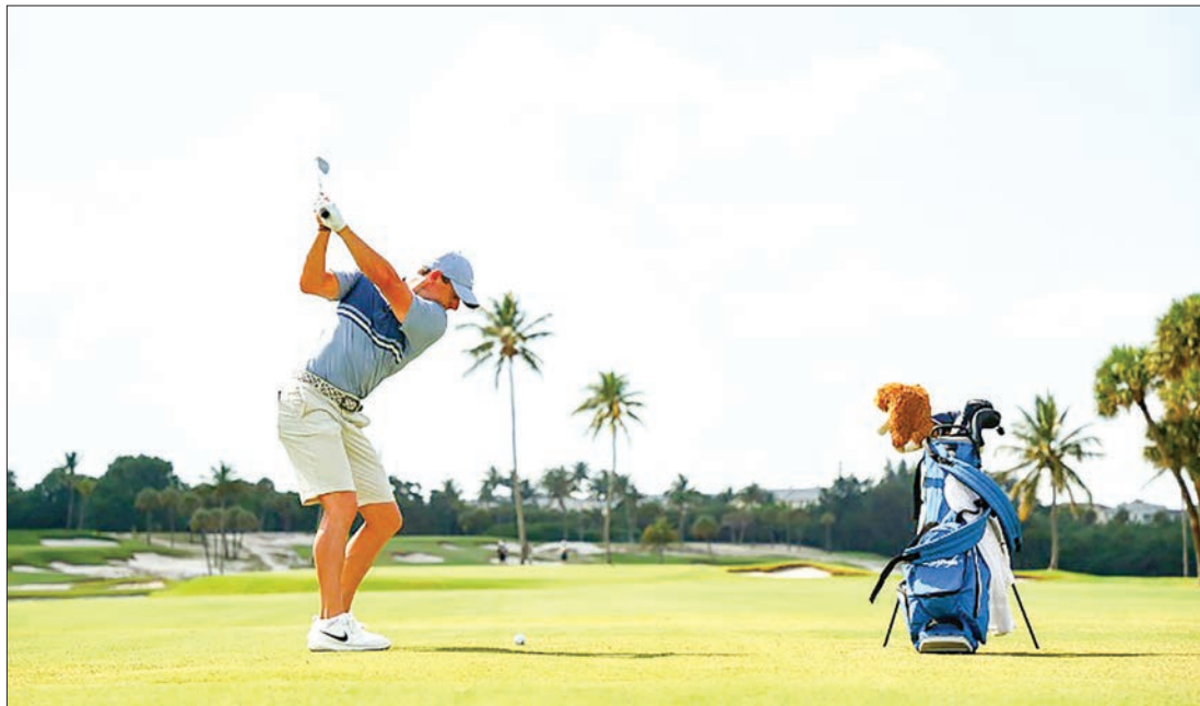
Northern Ireland's Rory McIlroy plays a shot on the tenth hole during a charity golf event in Florida on May 17, 2020.

LOS ANGELES — Donald Trump doesn't expect to be teeing it up anytime soon with Rory McIlroy, who called out the US president earlier in the week for his controversial leadership.