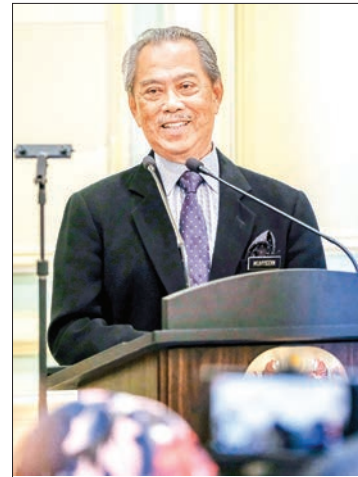
Malaysia's new prime minister Muhyiddin Yassin.

"Don't drag the country into another political uncertainty when the people are still facing various problems and a difficult