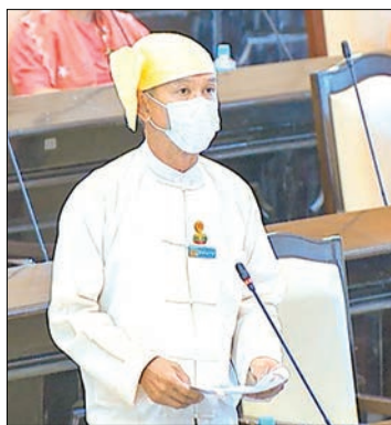
Deputy Minister for Ethnic Affairs U Hla Maw Oo.