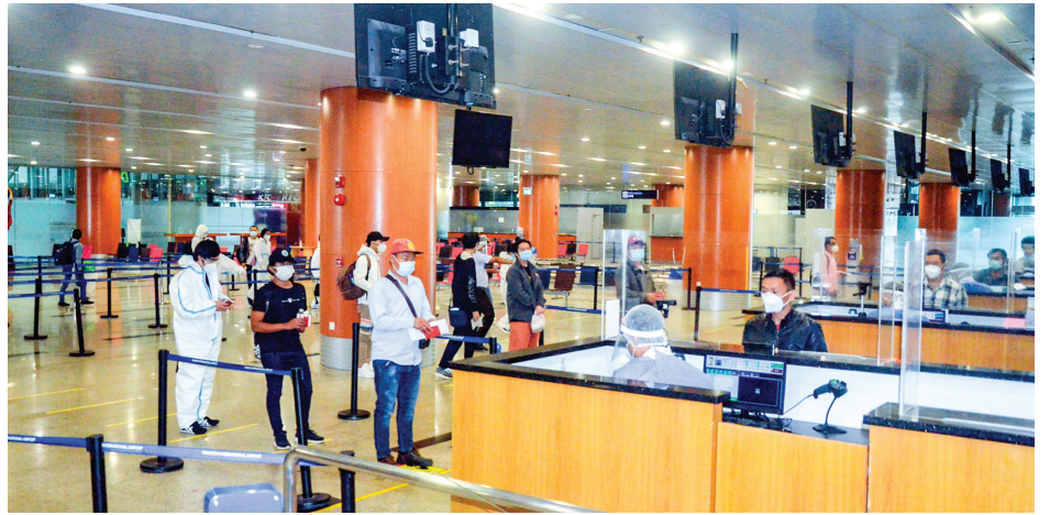
Myanmar returnees from the Philippines queue at immigration counters of Yangon International Airport yesterday.