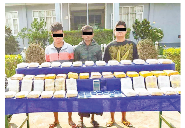
Three suspects are seen with confiscated items at Muse Township Police State.

SECURITY forces in Muse Township, Shan State (North), confiscated 120,000 WY psychotropic tablets from two men near Yahteik junction at 6:05 am on 17 May.