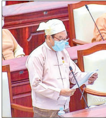
Union Minister Dr Myint Htwe.

Deputy Minister for Construction Dr Kyaw Linn explained the maintenance works on this road and upgrade plan of it during the post COVID-19