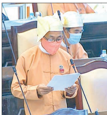
MP U Soe Win of Rakhine State constituency 12.