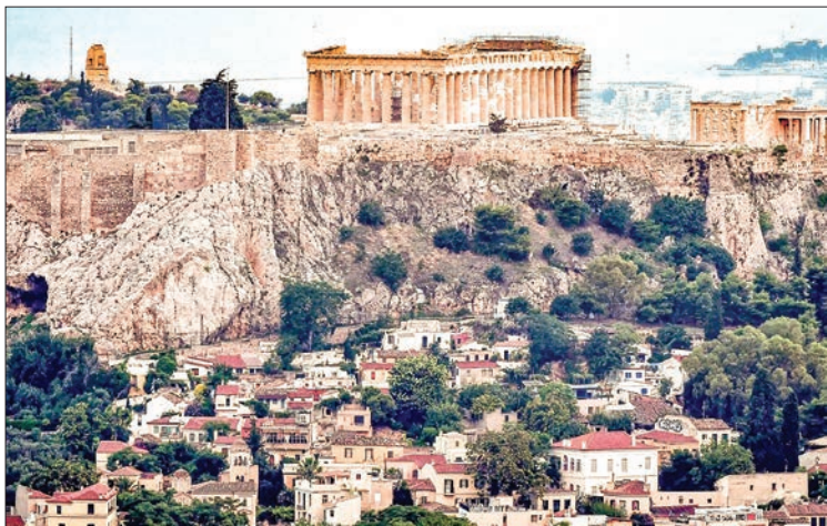
This picture shows a general view of the tiny Anafiotika district of Athens, under the Acropolis archaeological site.

"We didn't have time to visit before, so we came today, and it's free!" She said alongside two other Ukrainian students.—AFP ■