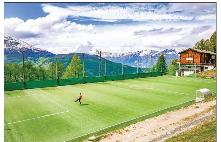
The European Mountain Village Championship is due to return its origins in the Swiss alpine village of Gspon, at an altitude of around 2,000 metres.

Originally planned for June, much like Euro 2020, the "Bergdorf Euro" was also forced to find new dates and pushed back until August 28-30.—AFP