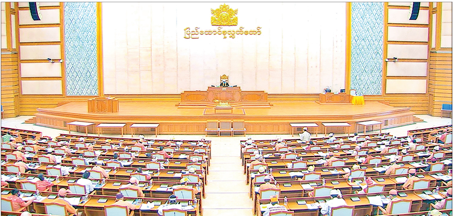
The second Pyidaungsu Hluttaw holds its first day meeting of its 16 th regular session in Nay Pyi Taw yesterday.

T HE second Pyidaungsu Hluttaw began its 16 th regular session yesterday, and members of the Joint Bill Committee and the Joint Public Accounts Committee presented legal and financial recommendations on the Union Supplementary Budget Allocation Bill presented by the Union Government.